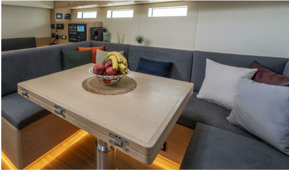
Saloon Table folded