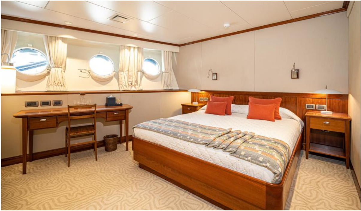
VIP Stateroom (Port)