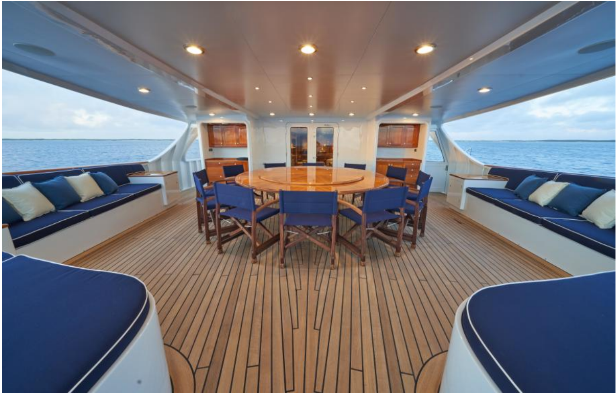
Upper Aft Deck