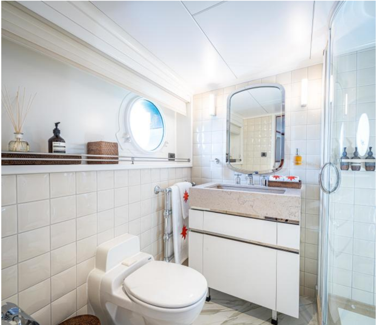
Guest Stateroom En Suite Head