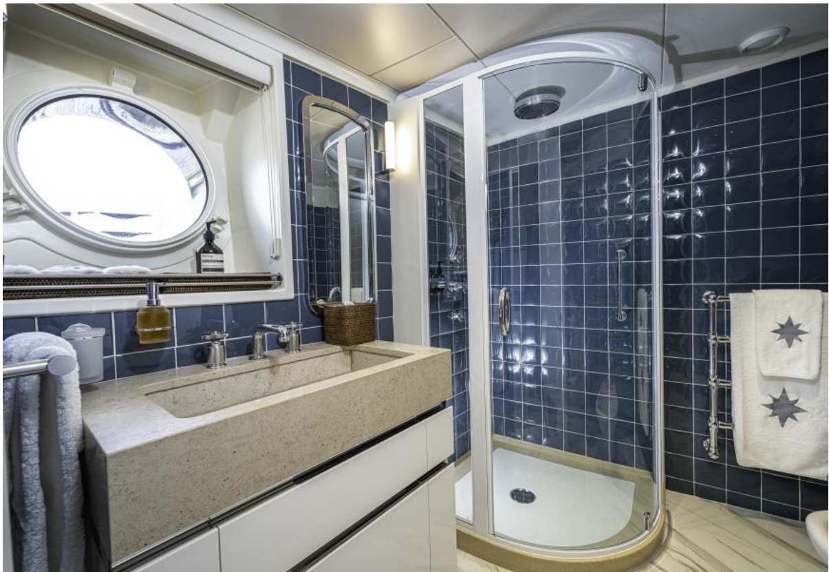
Twin Stateroom En Suite Head