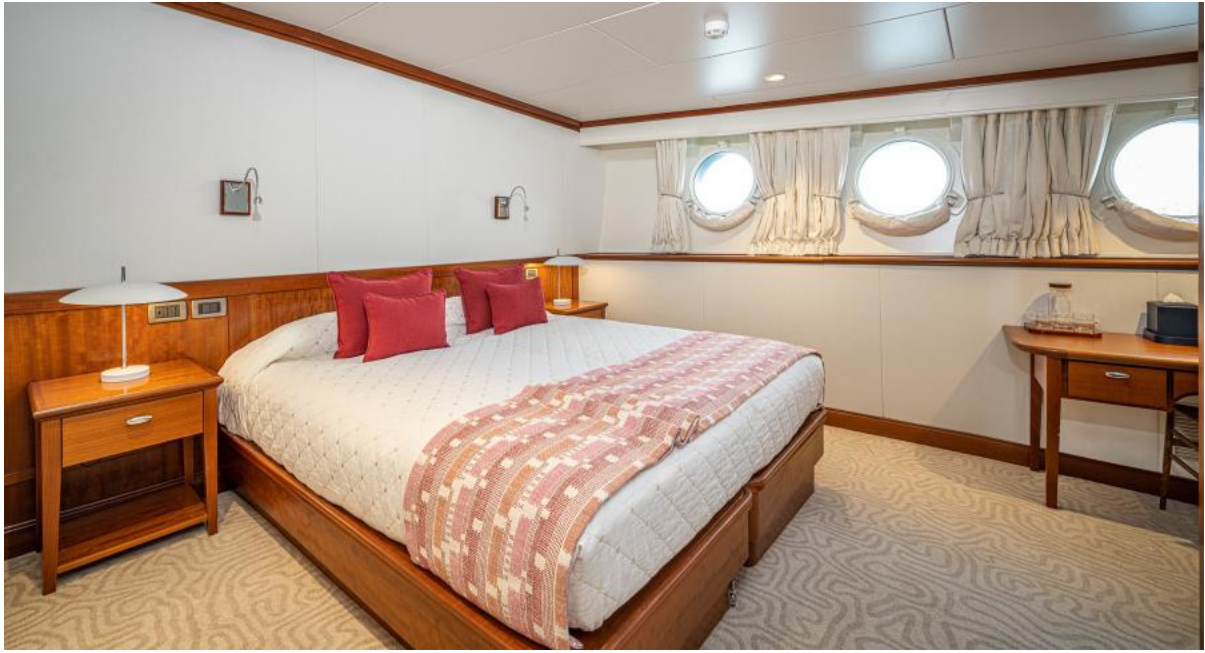
Guest Stateroom (Starboard)