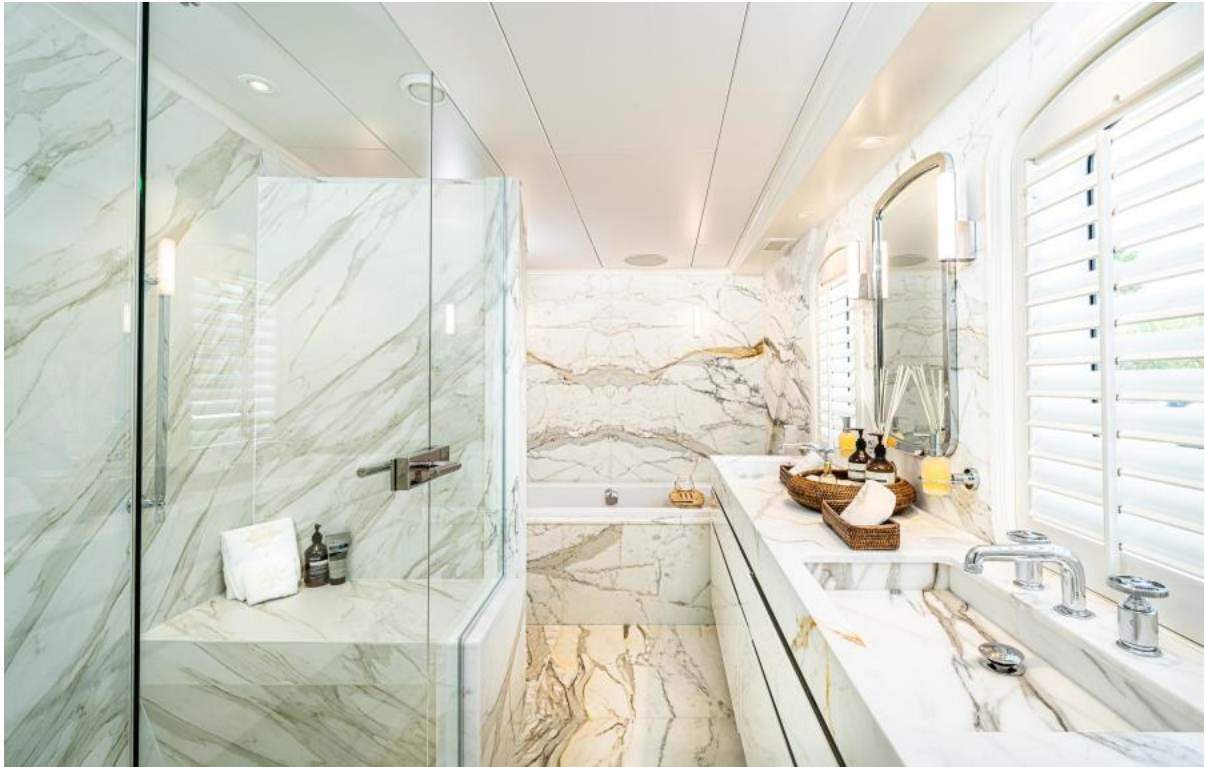
Owner En Suite Head