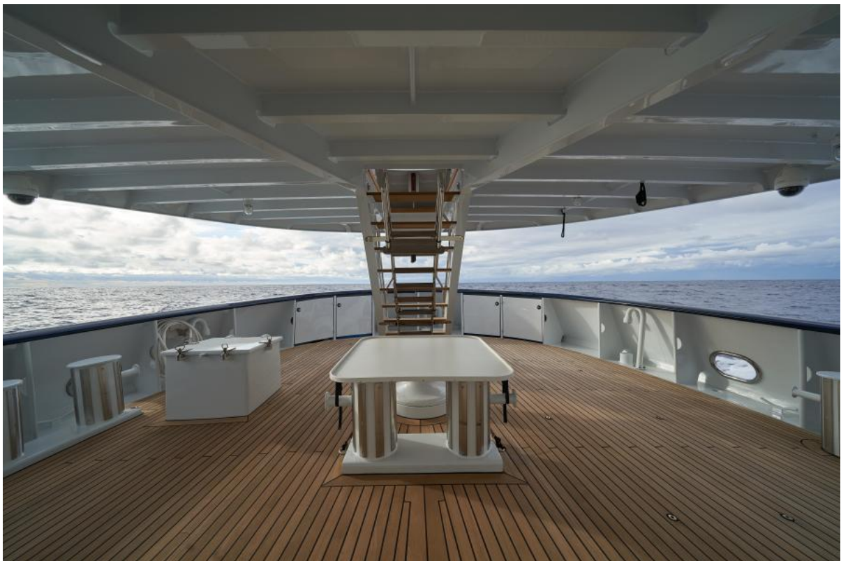
Lower Aft Deck