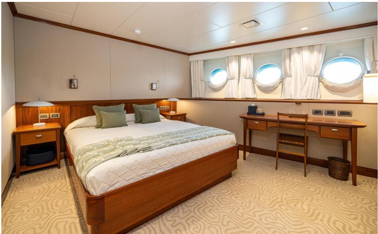
VIP Stateroom (Starboard)