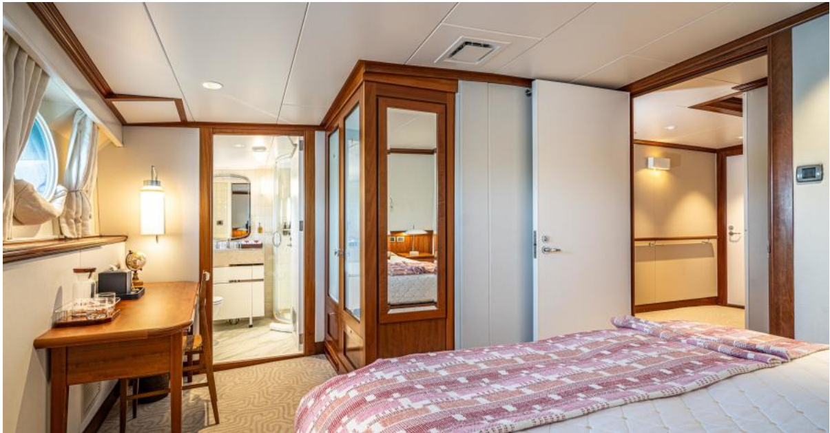
Guest Stateroom (Starboard)