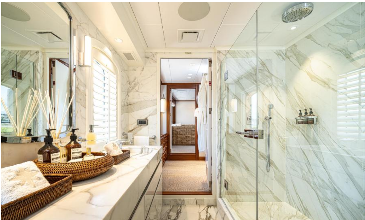
Owner En Suite Head