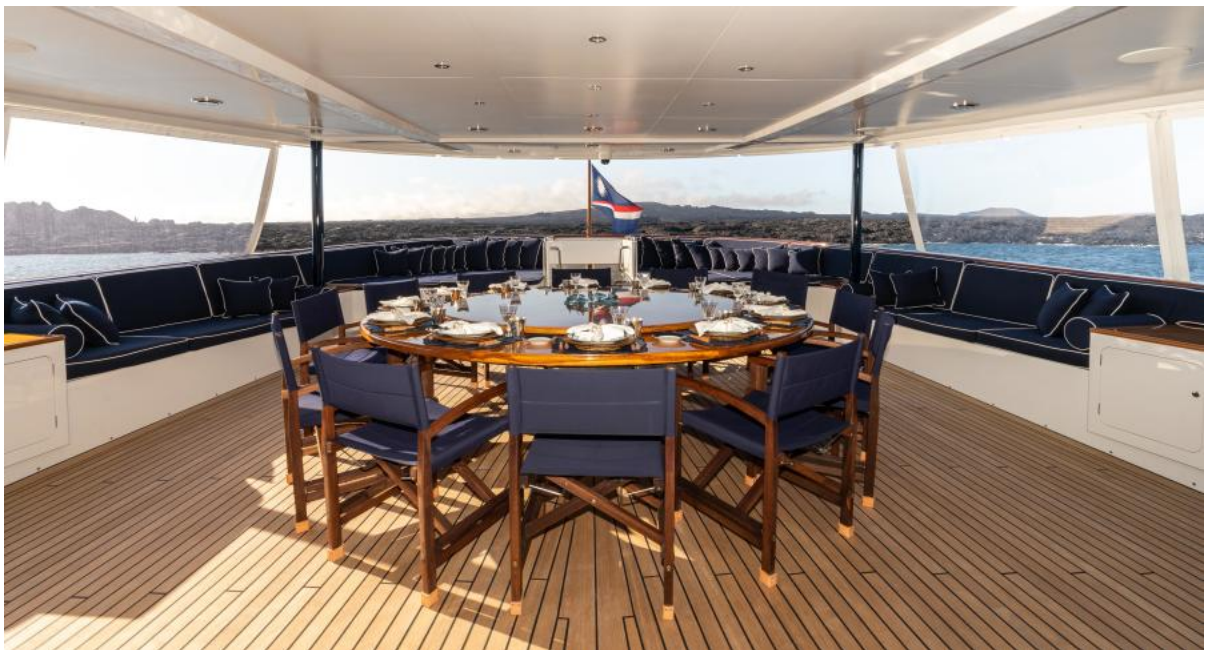
Upper Aft Deck