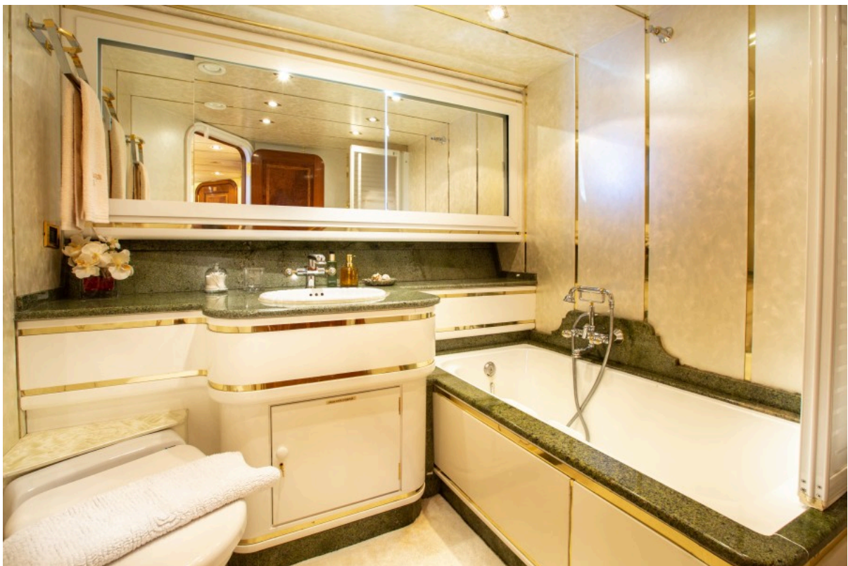
Guest Stateroom head