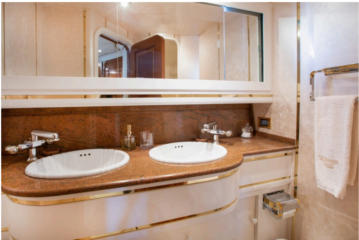
Twin Stateroom Head