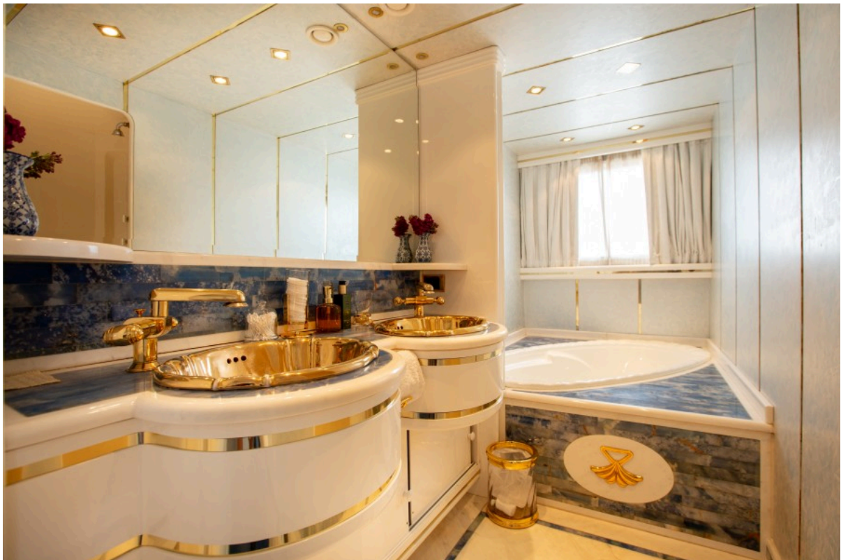
VIP Stateroom Head