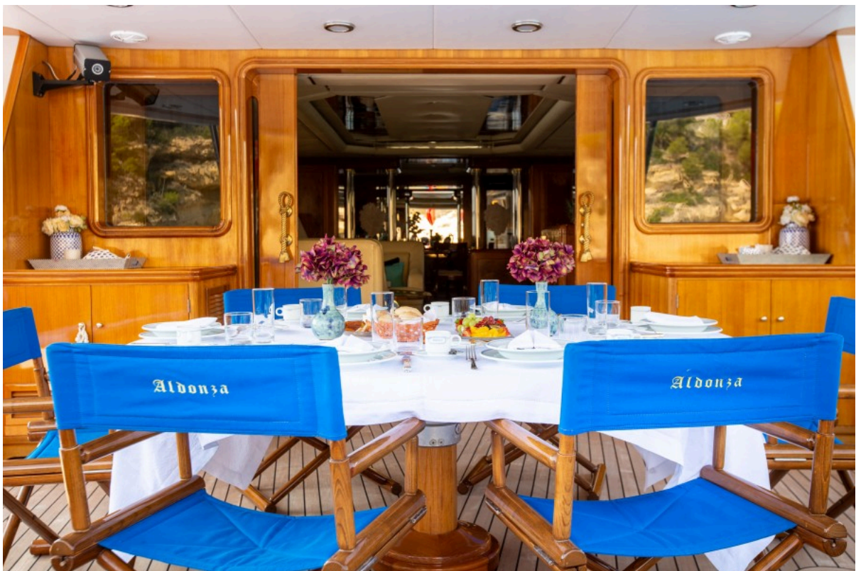
Main Deck Aft Dining