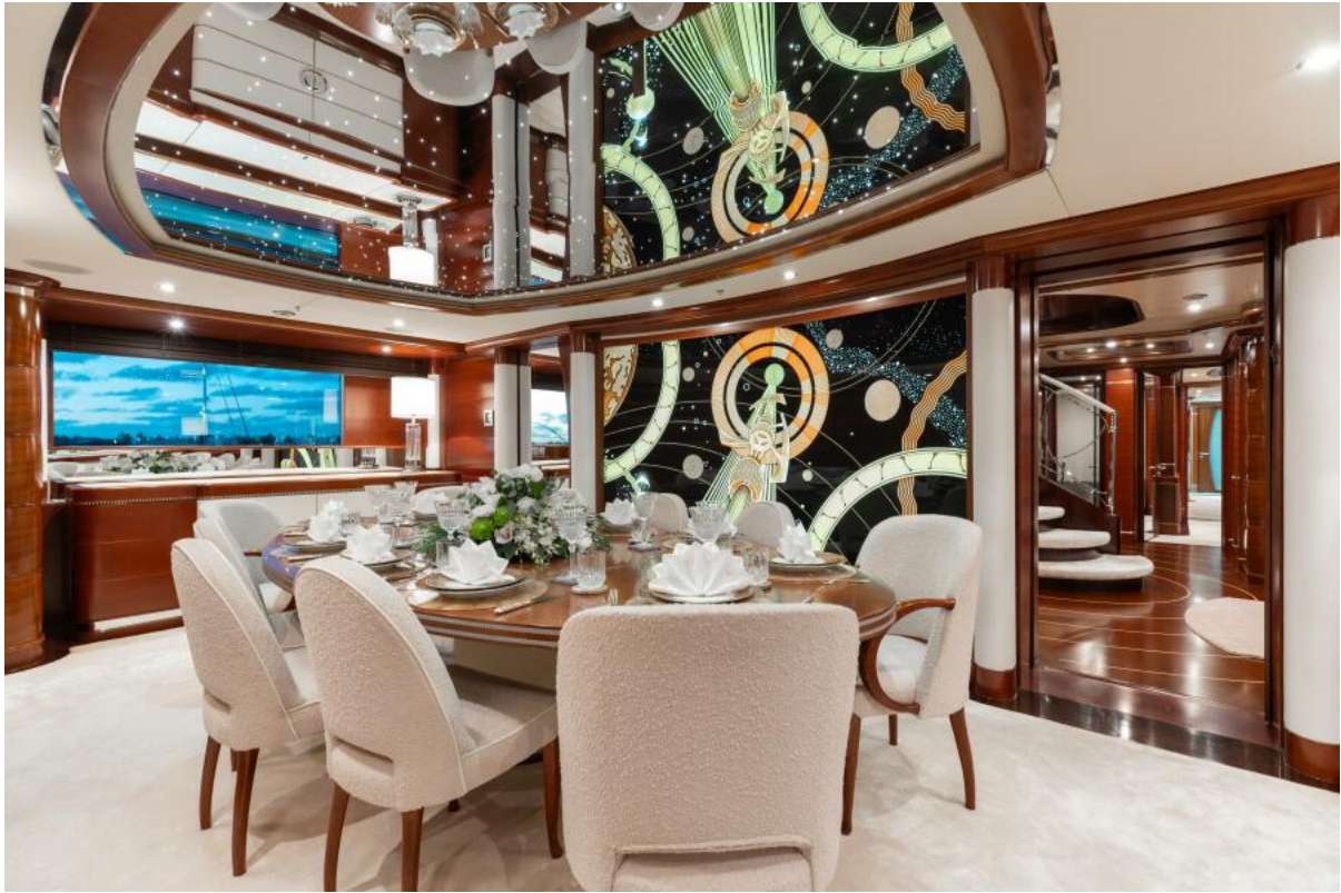
Main Salon Dining