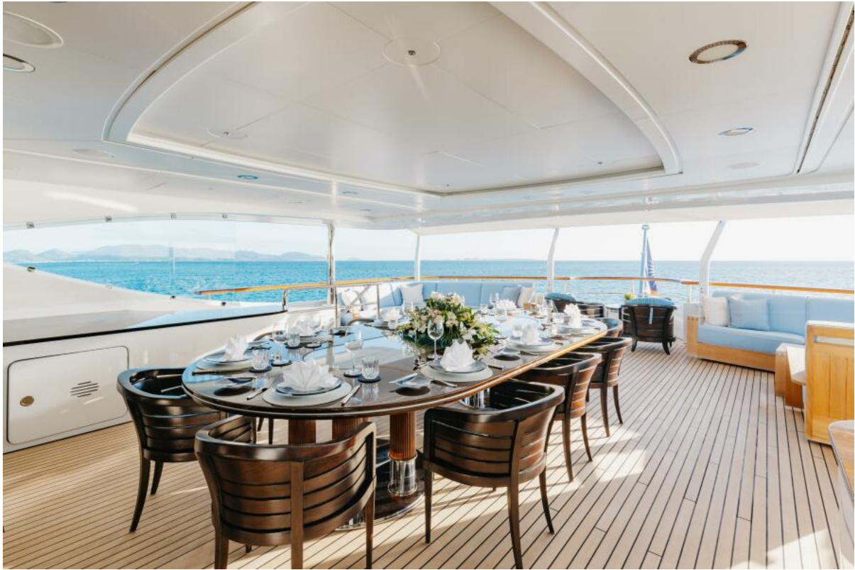
Bridge Aft Deck