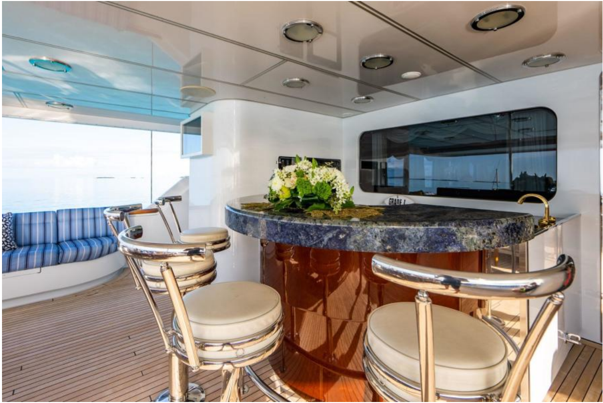
AFT DECK (18)