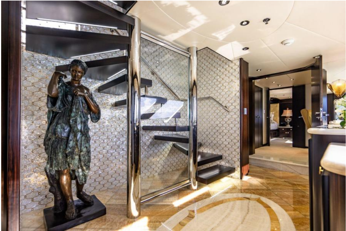
MAIN GUEST FOYER