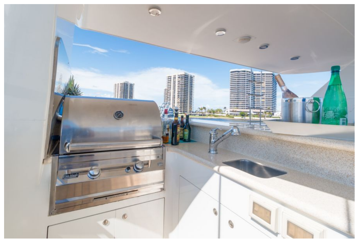
Flybridge Bar And Grill