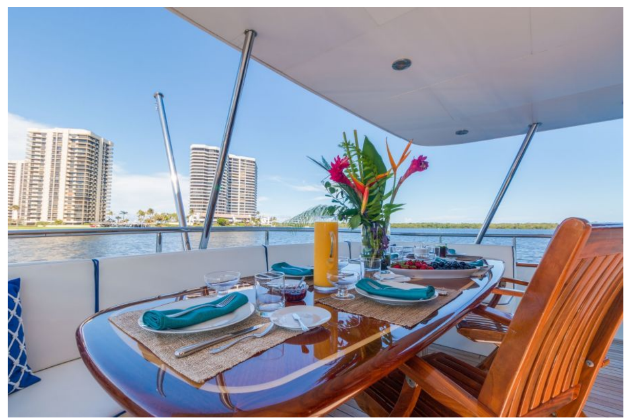
Aft Deck Dining