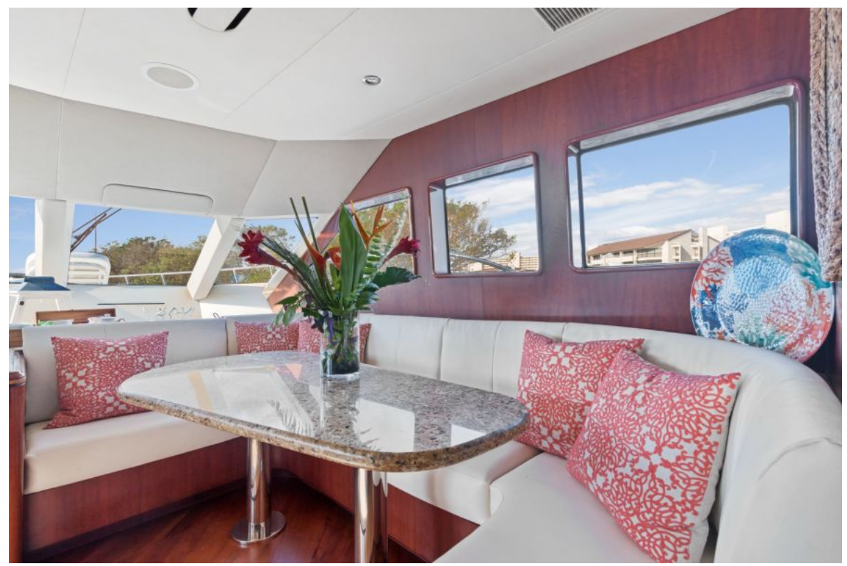
Country Kitchen Dinette