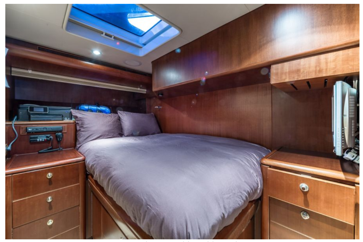
Captain Or Double Cabin Fwd