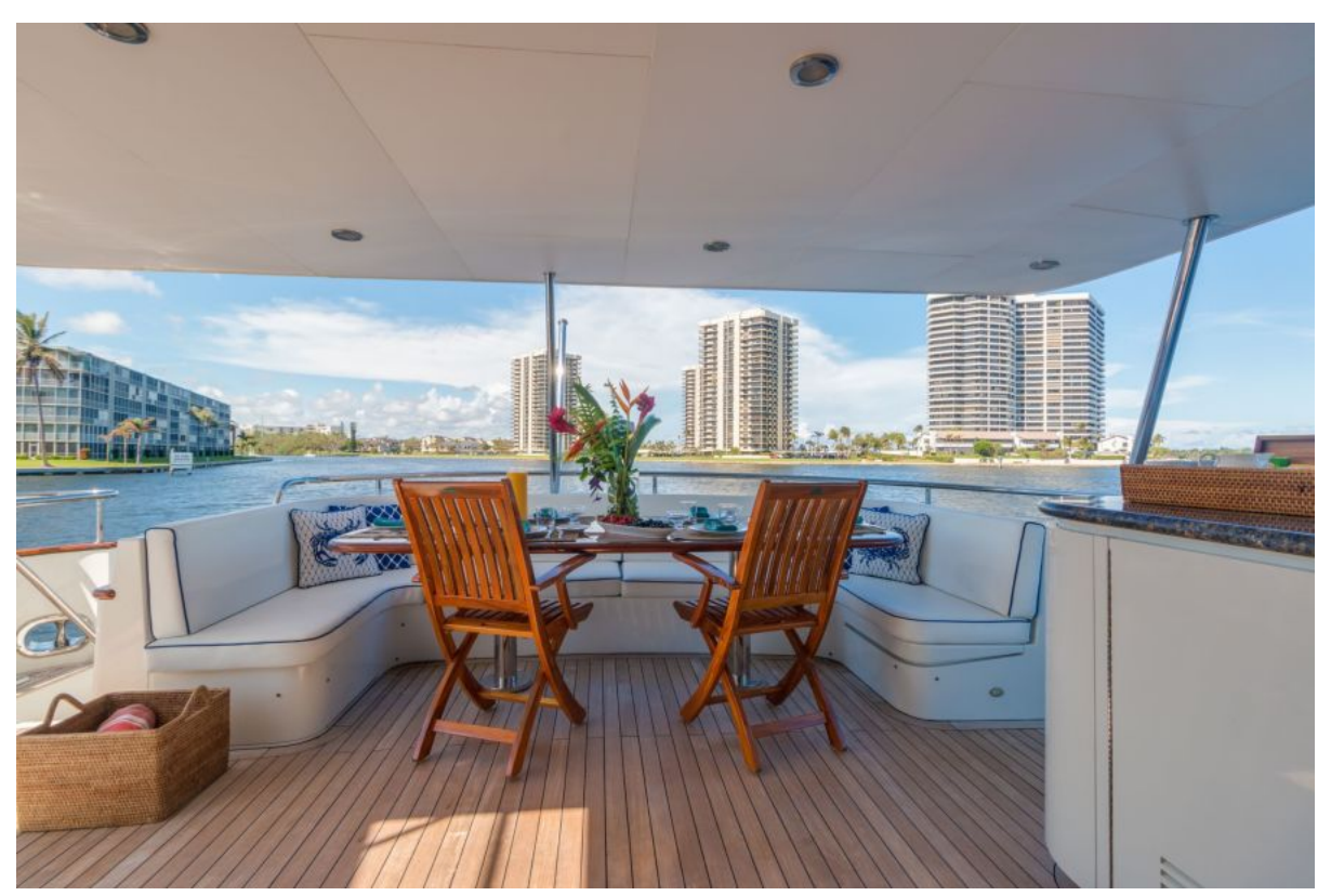
Aft Deck Looking Aft