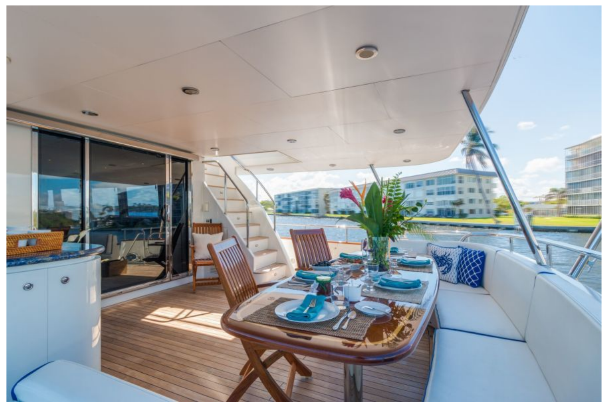
Aft Deck Looking Stbd