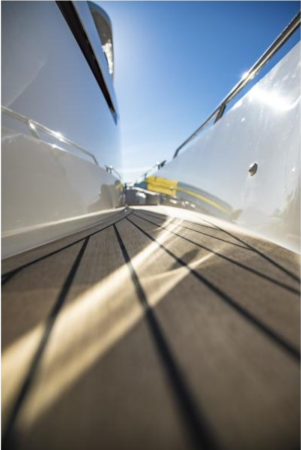
Nimbus Tender 11 Nimbus Tender 11