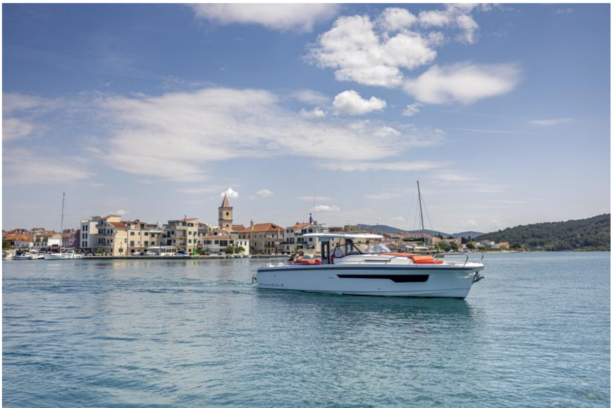
Nimbus Tender 11 Nimbus Tender 11