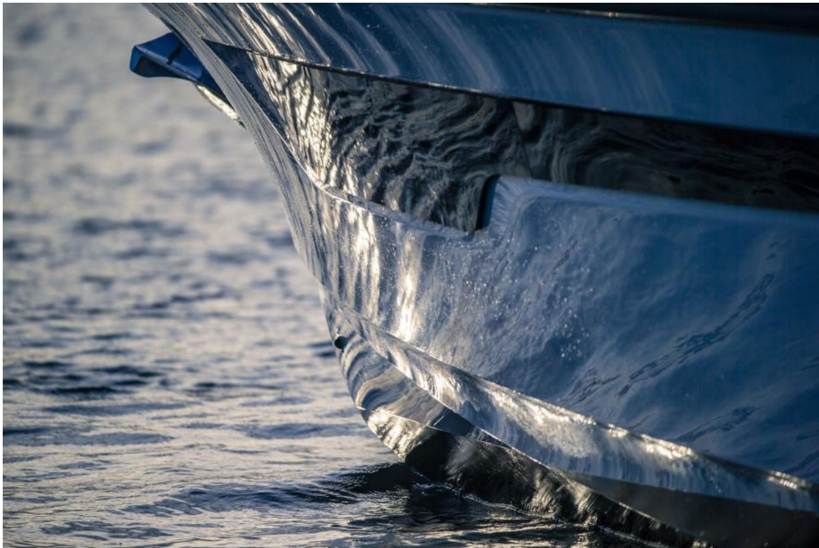
Nimbus Tender 11 Nimbus Tender 11