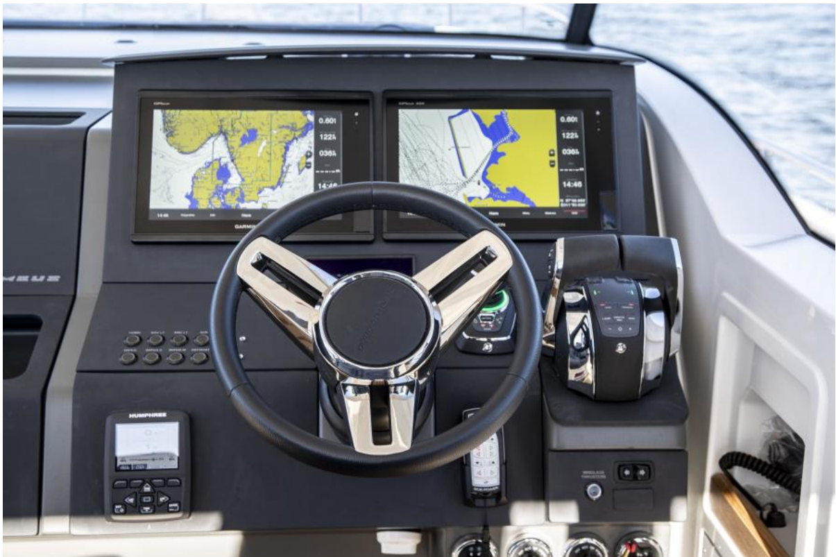
Nimbus Tender 11 Nimbus Tender 11