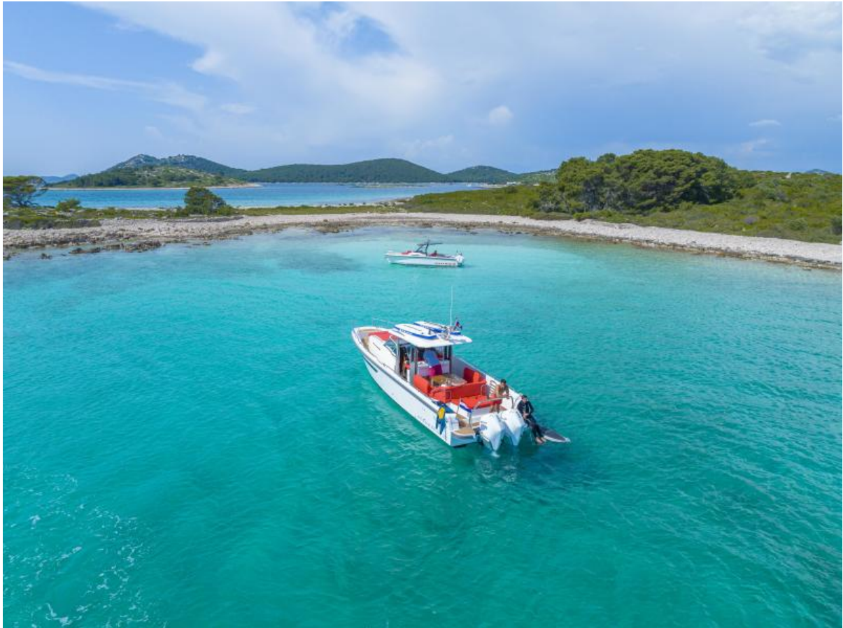
Nimbus Tender 11-Stern View Nimbus Tender 11