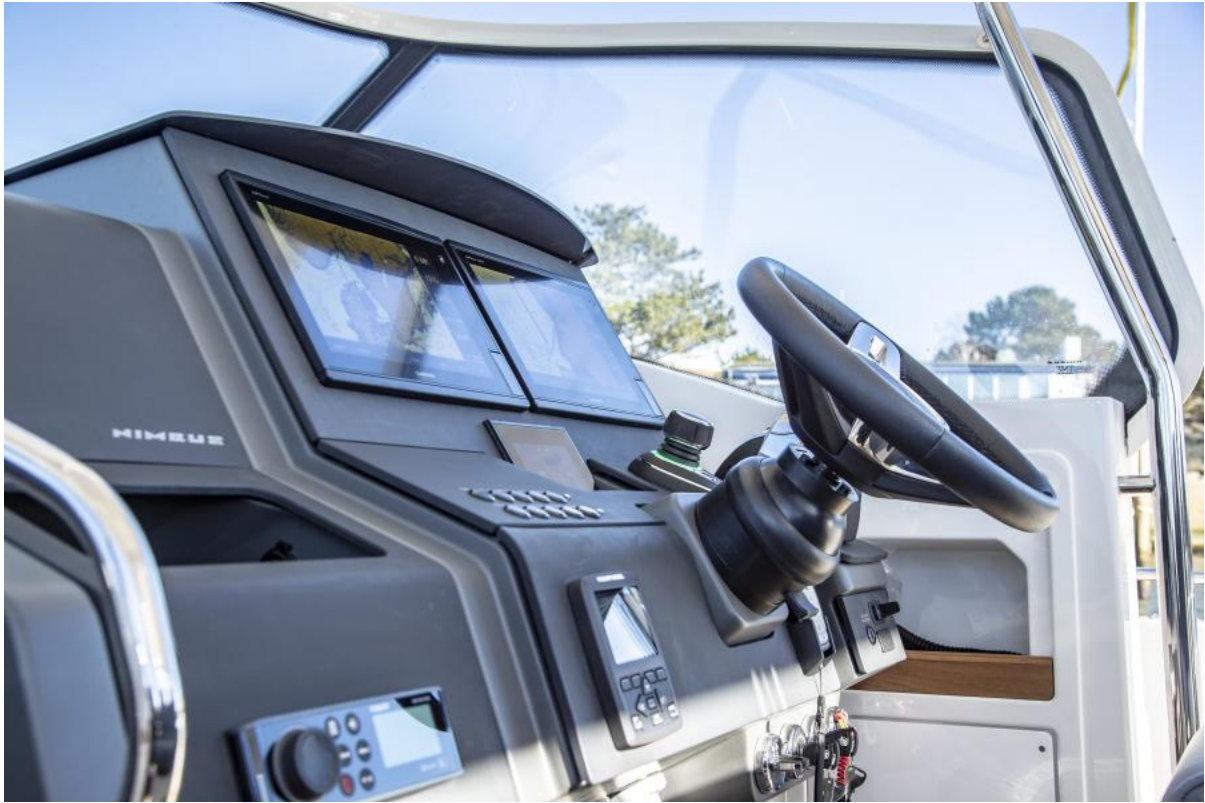
Nimbus Tender 11 Nimbus Tender 11