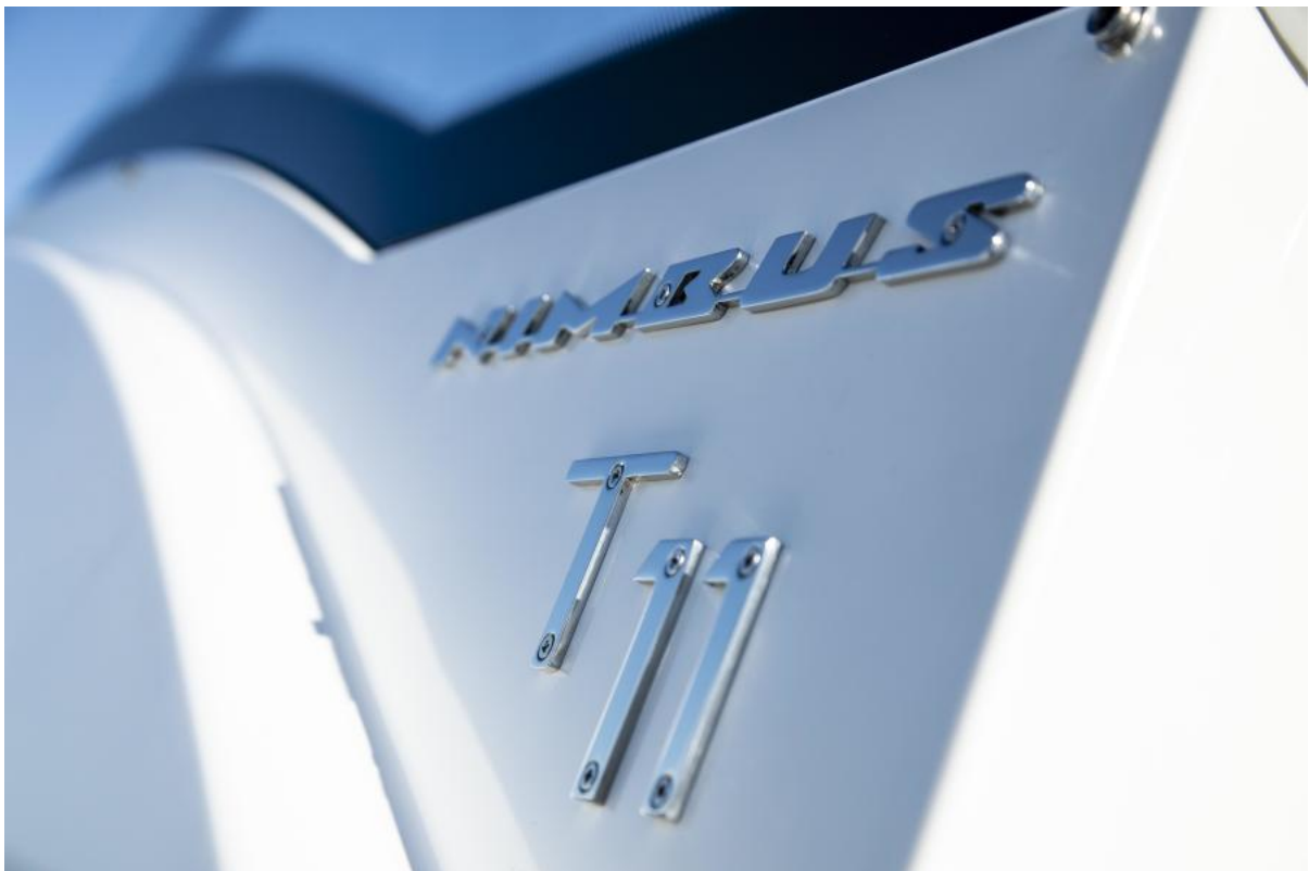
Nimbus Tender 11 Nimbus Tender 11