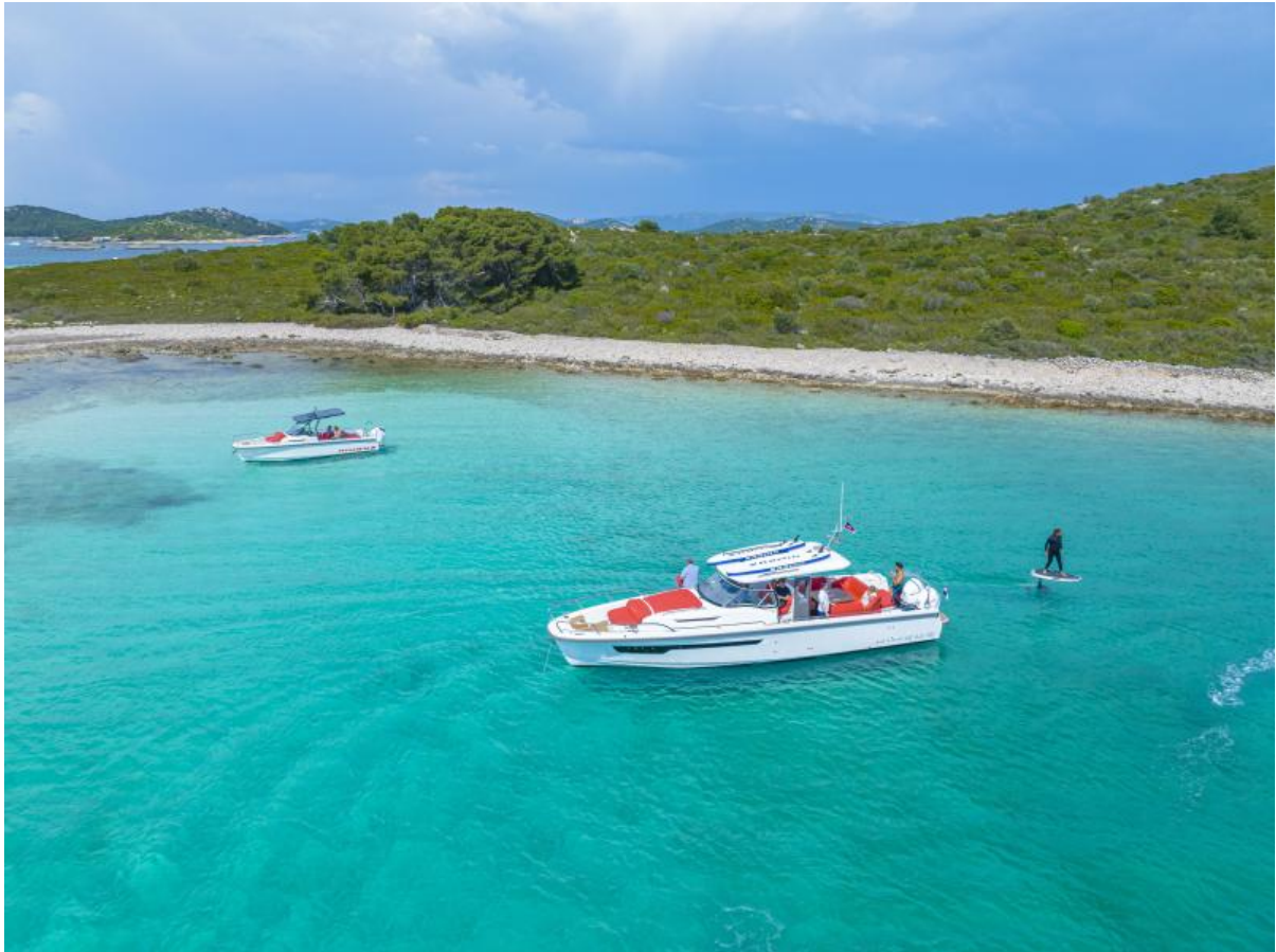
Nimbus Tender 11-Port Side on the water Nimbus Tender 11