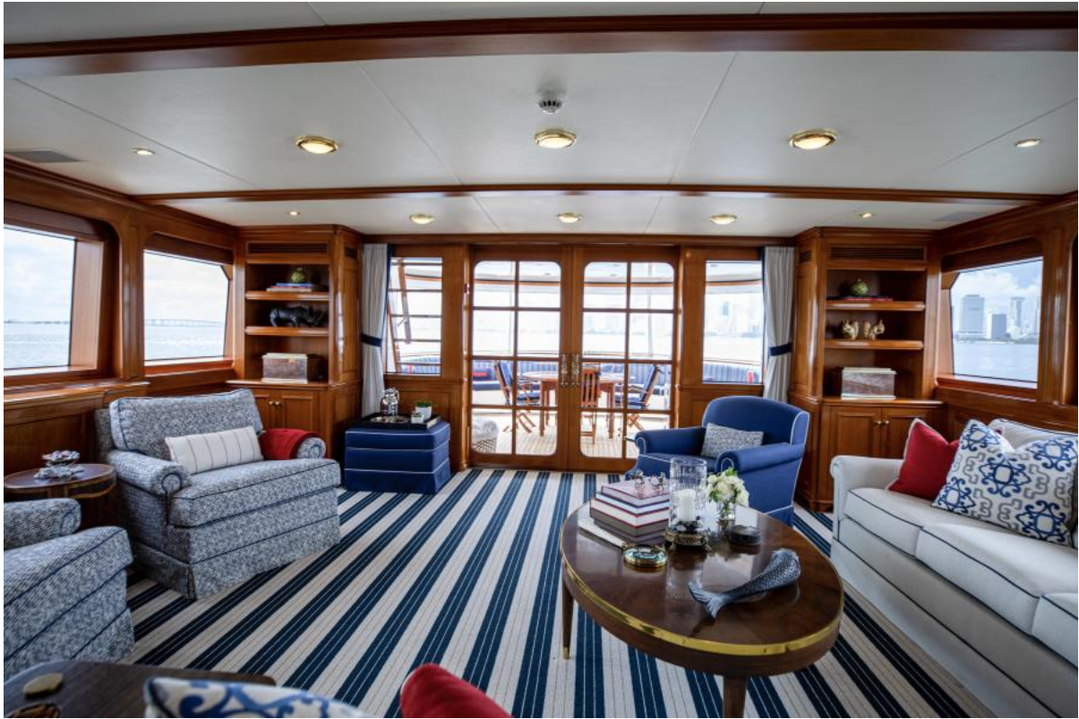
Main Salon Looking Aft