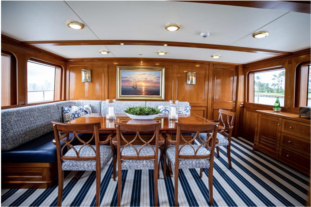
Dining Room Seating