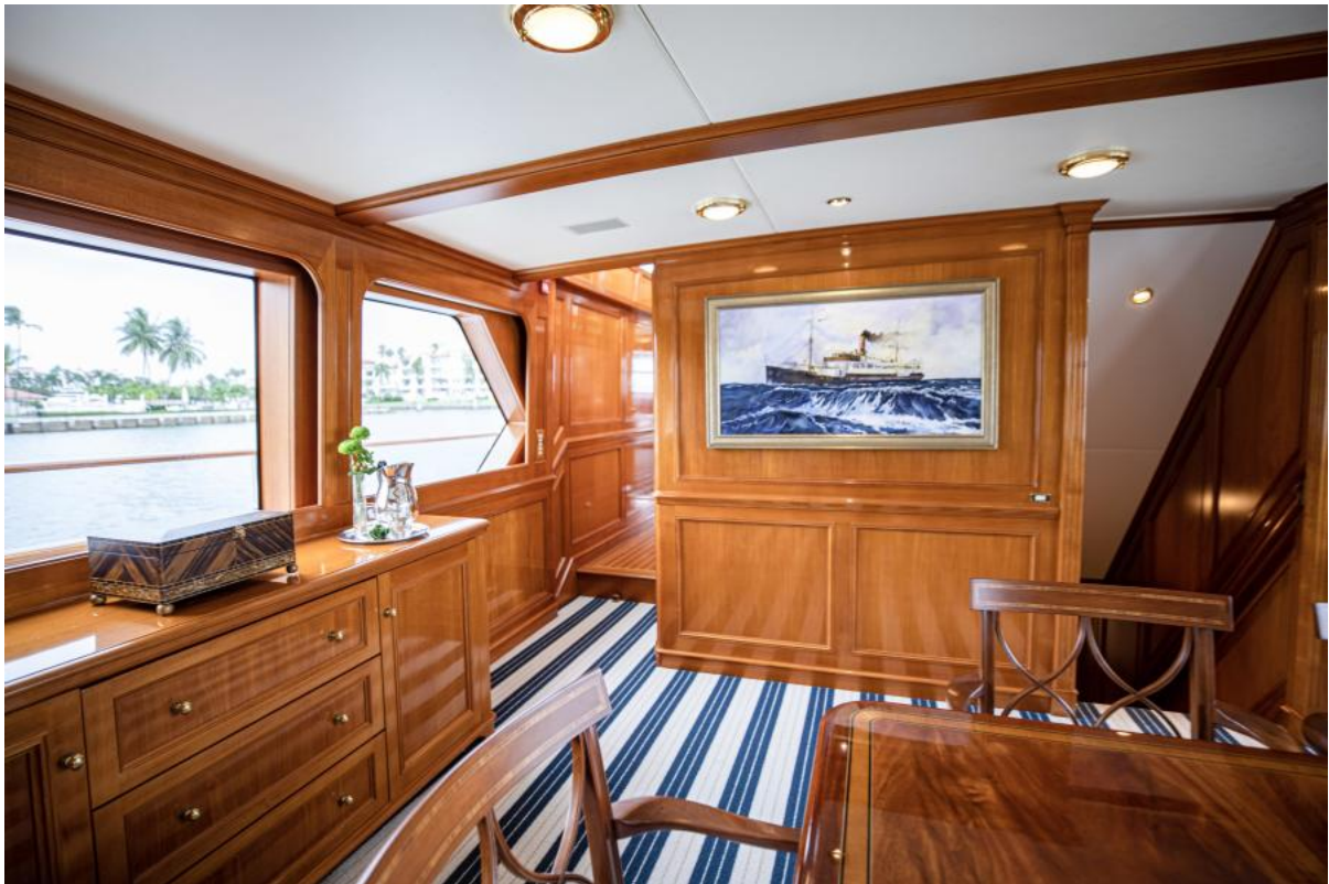
Dining Room Looking Aft