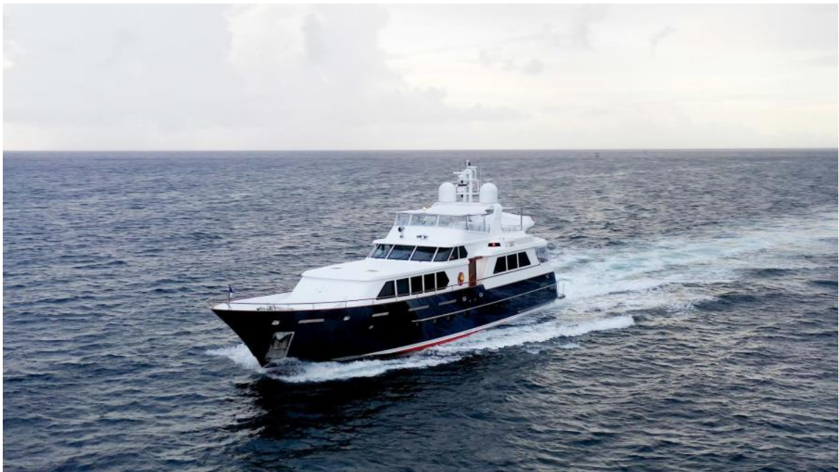
Port Bow Underway