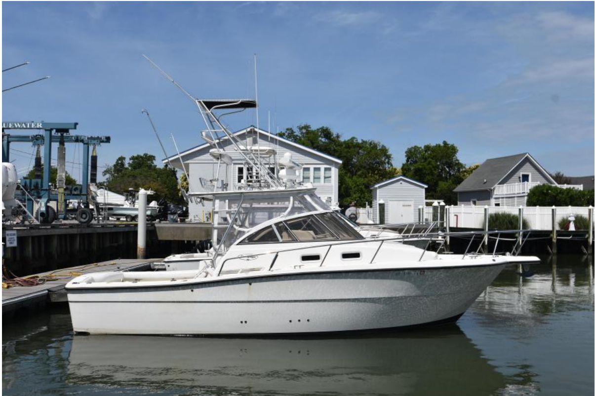
2005 Rampage (2)