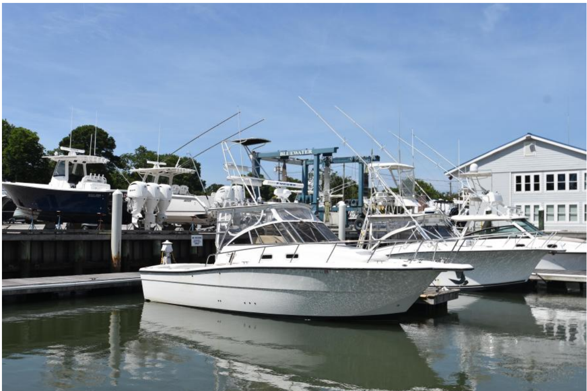
2005 Rampage (1)