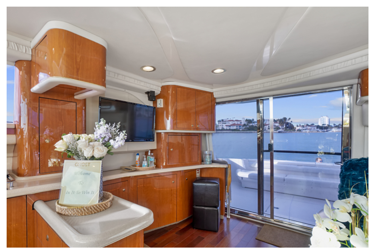
In it to Win it Main Salon