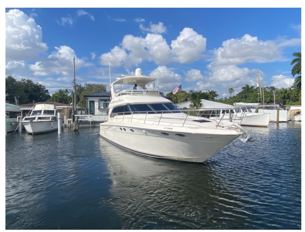
In it to Win it Exterior View