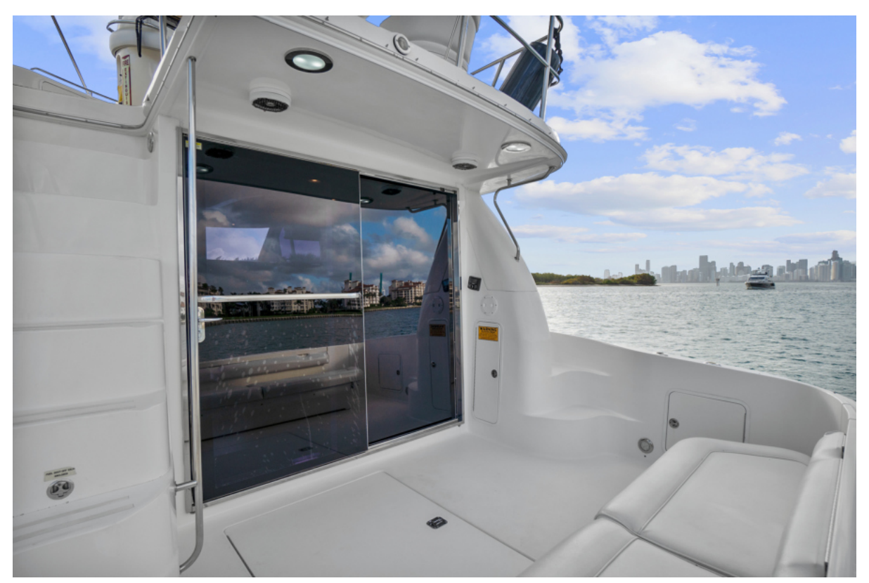
In it to Win it Aft Deck