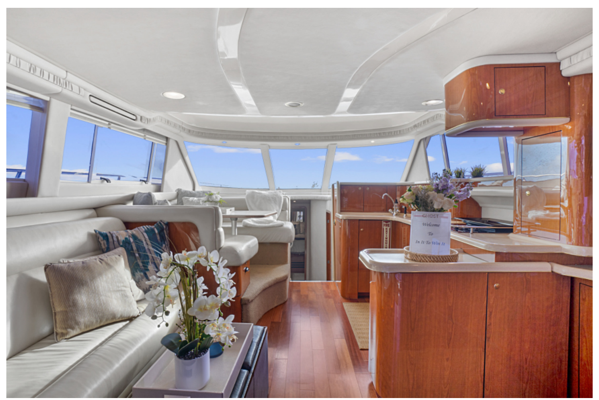
In it to Win it Main Salon