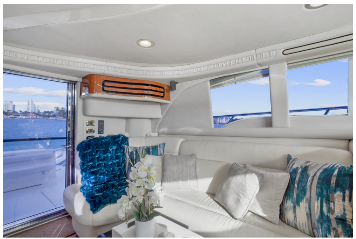
In it to Win it Main Salon