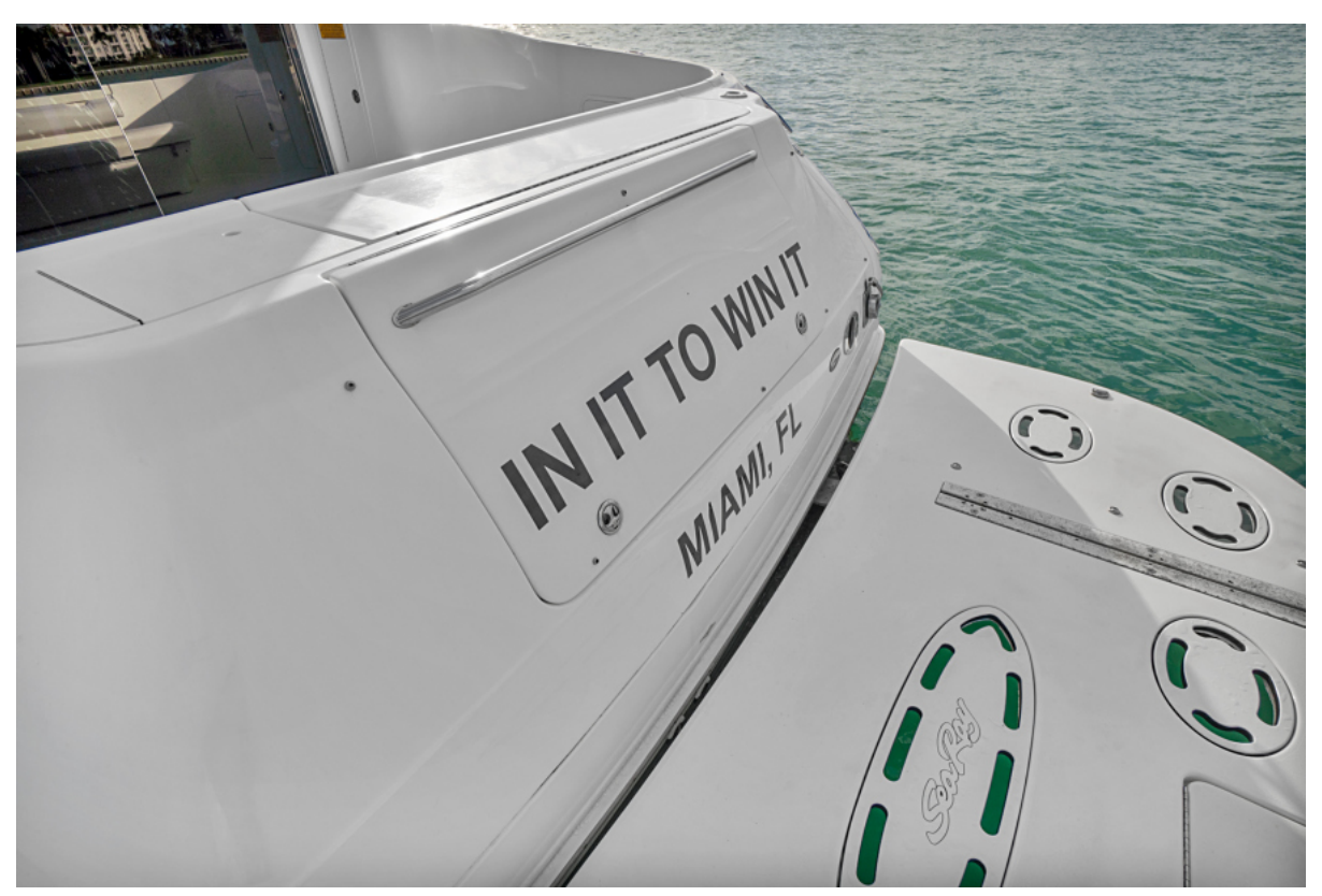
In it to Win it Stern Area