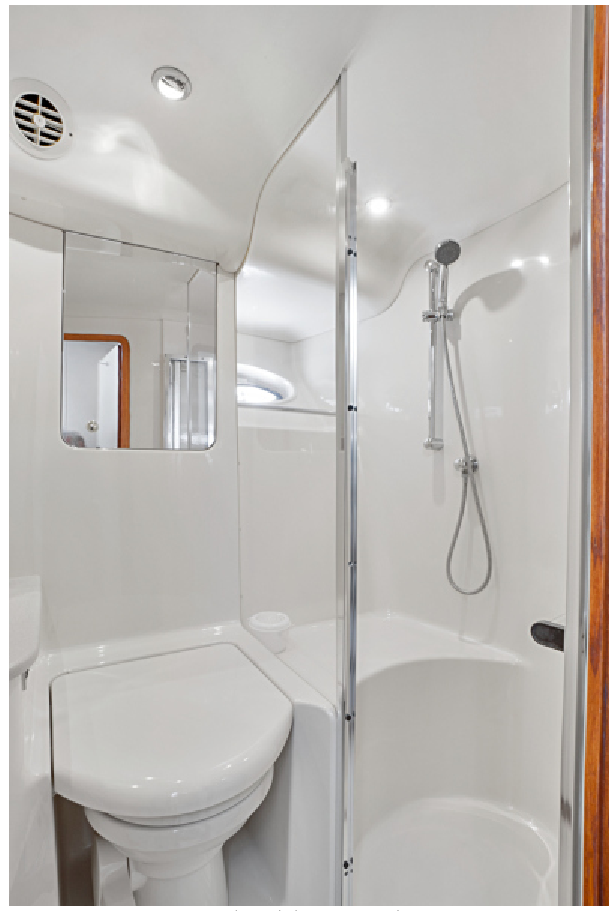
In it to Win it Master Head