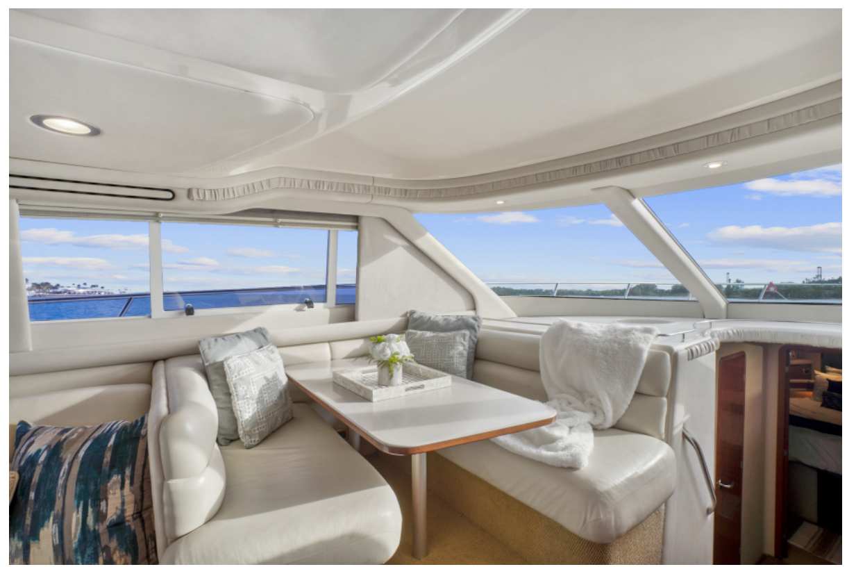
In it to Win it Dining Table