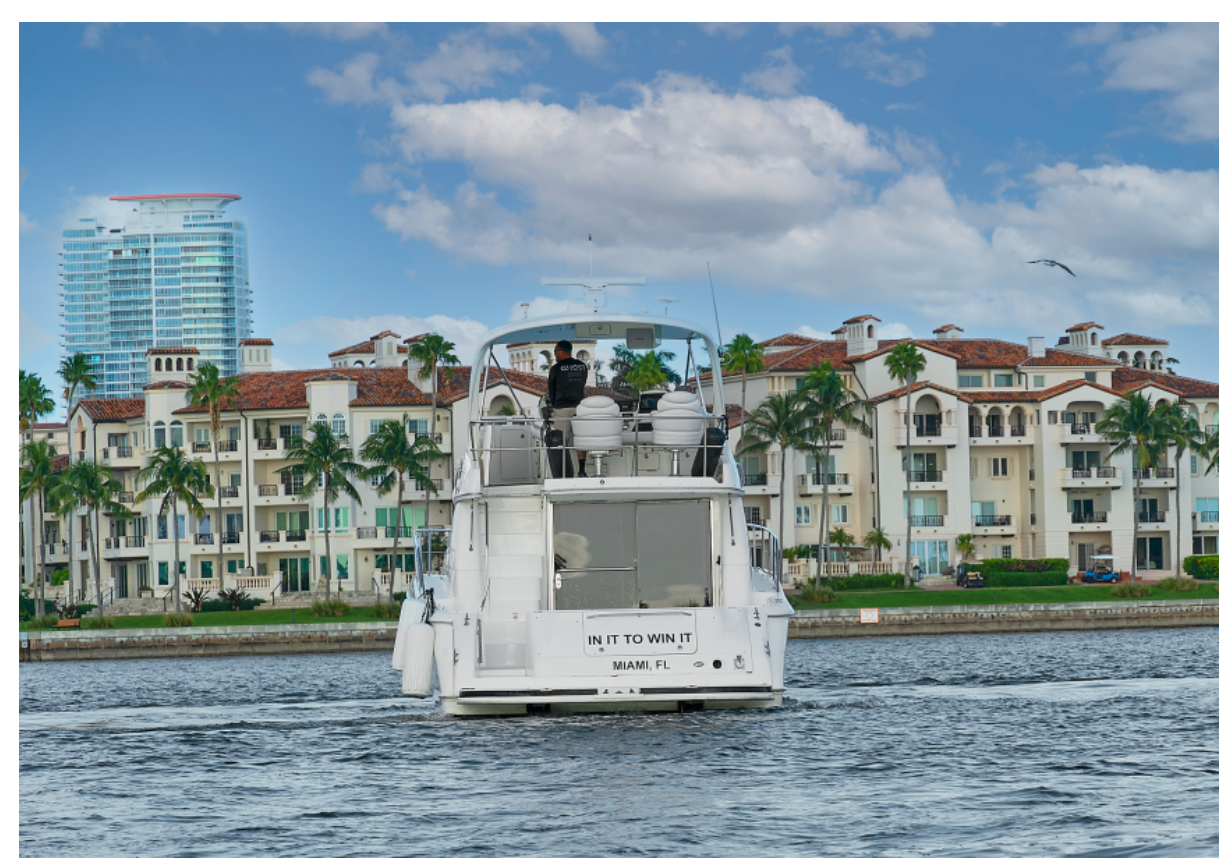
In it to Win it Exterior View