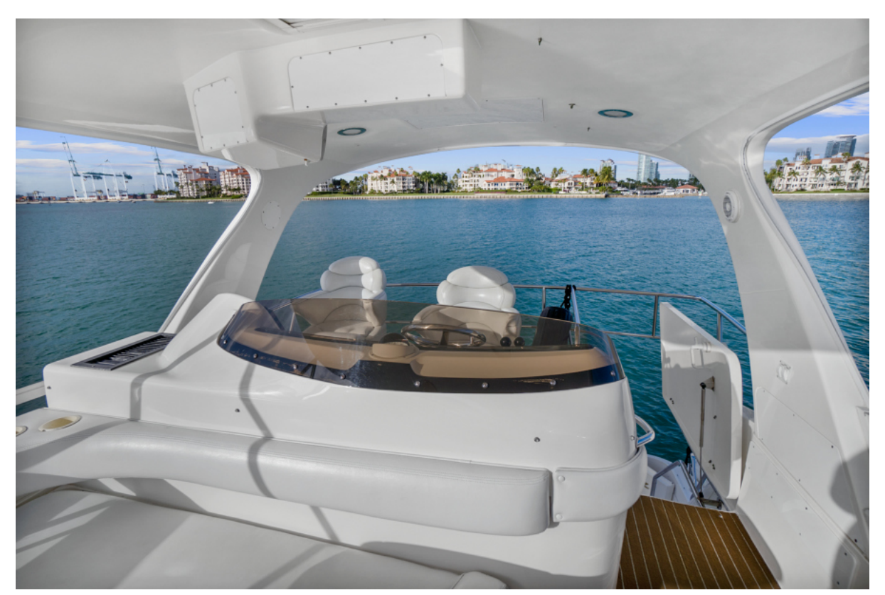
In it to Win it Flybridge