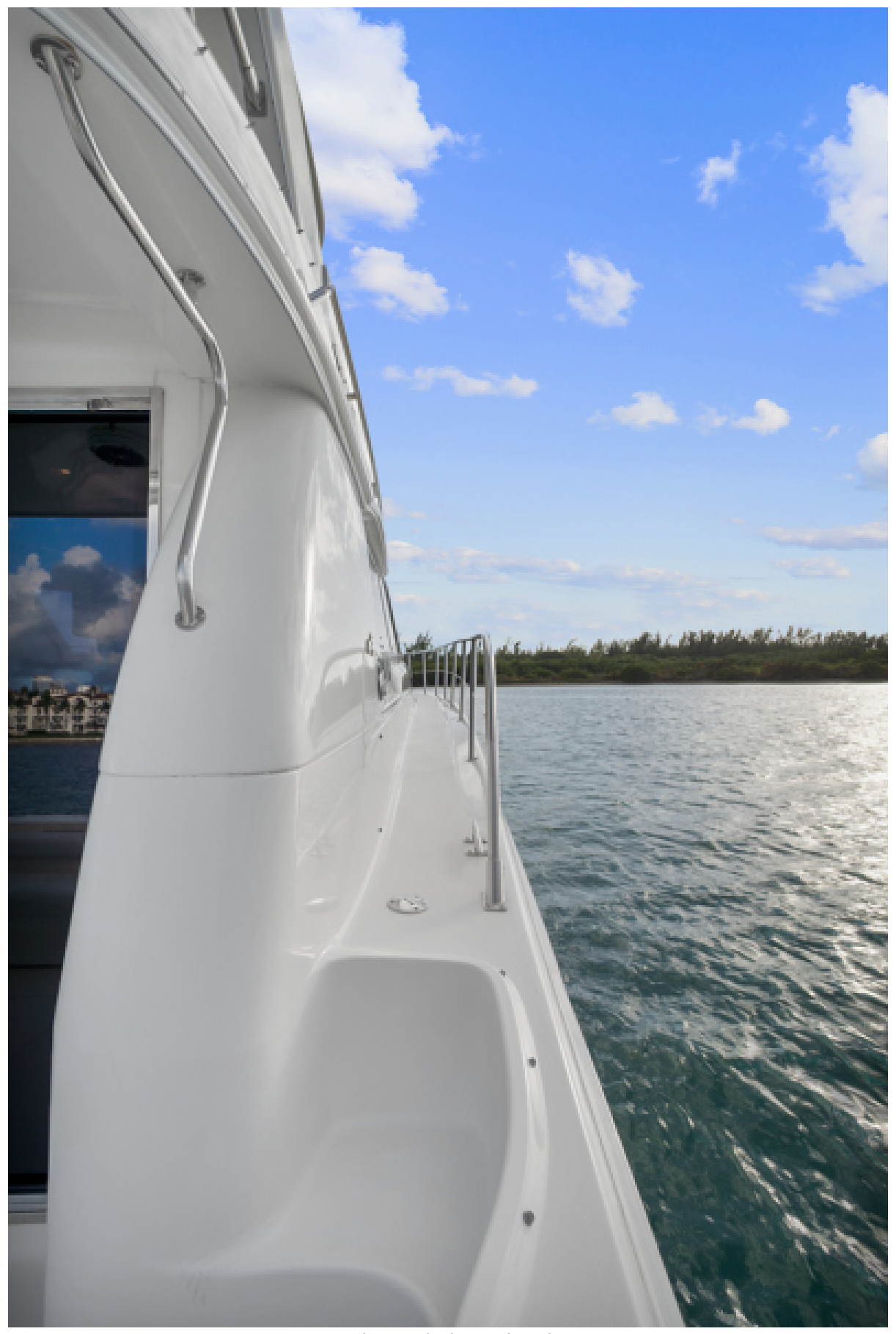
In it to Win it Bulwark