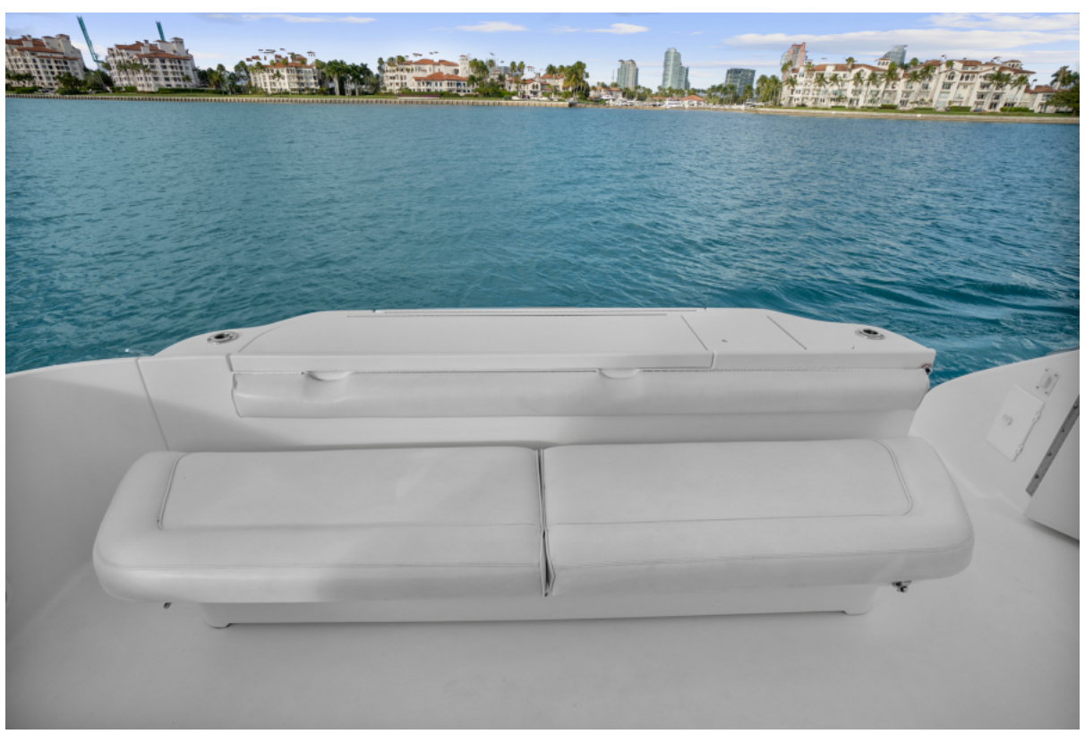
In it to Win it Aft Deck