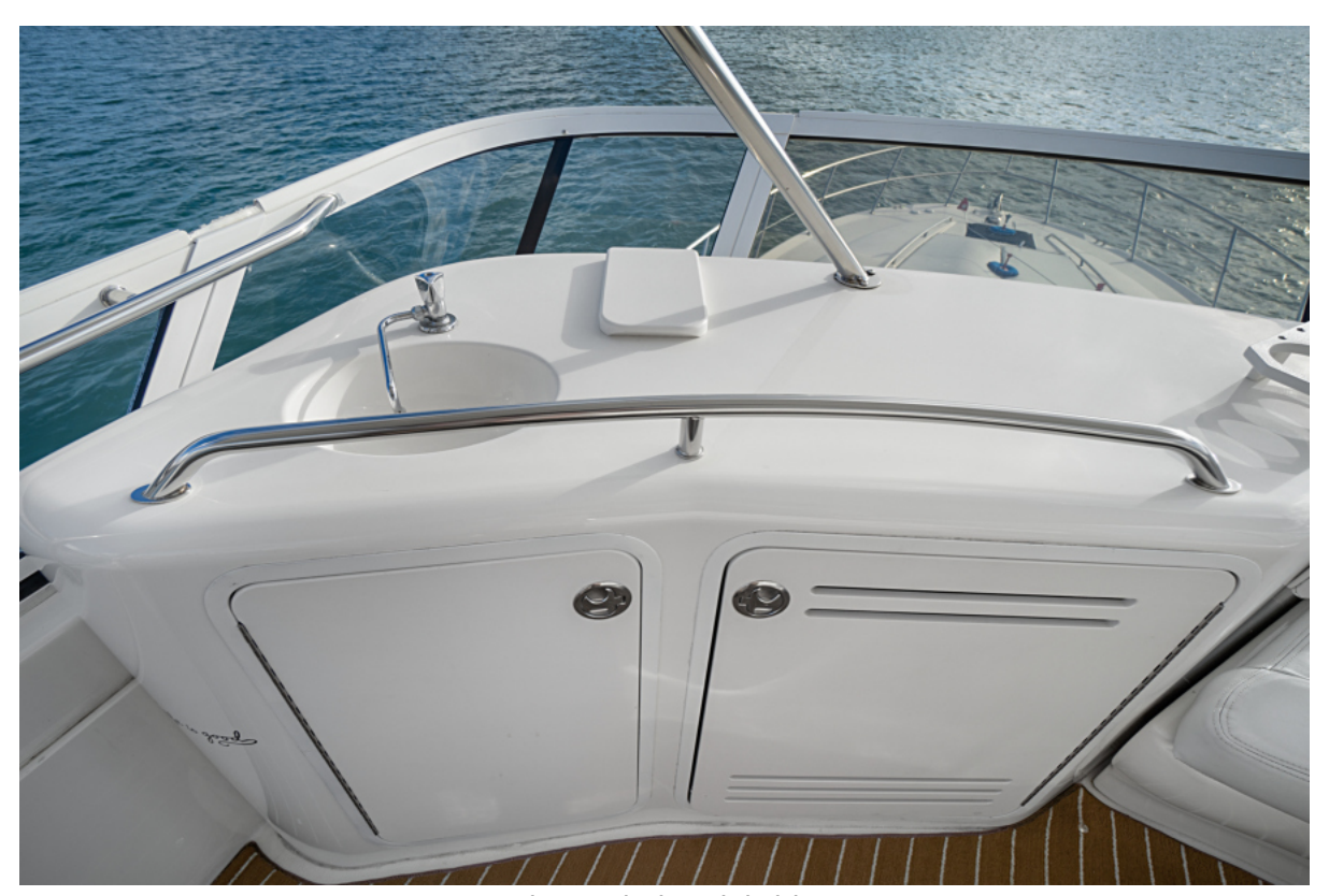
In it to Win it Flybridge