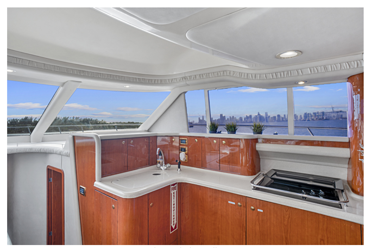
In it to Win it Galley