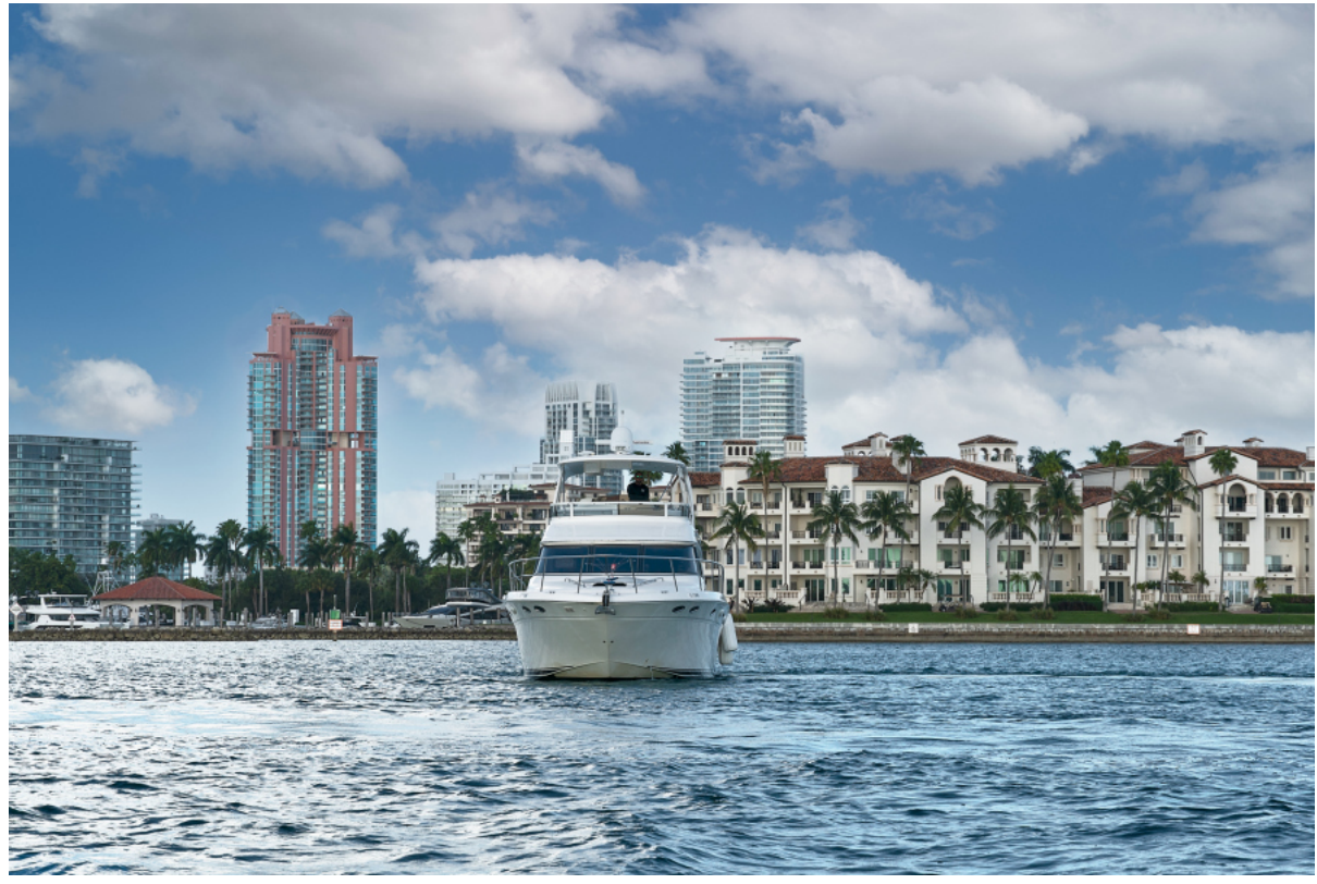
In it to Win it Exterior View