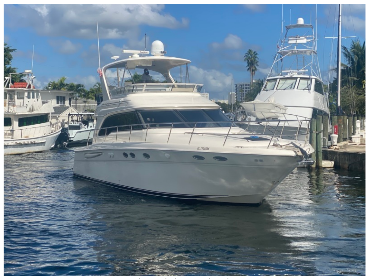
In it to Win it Exterior View