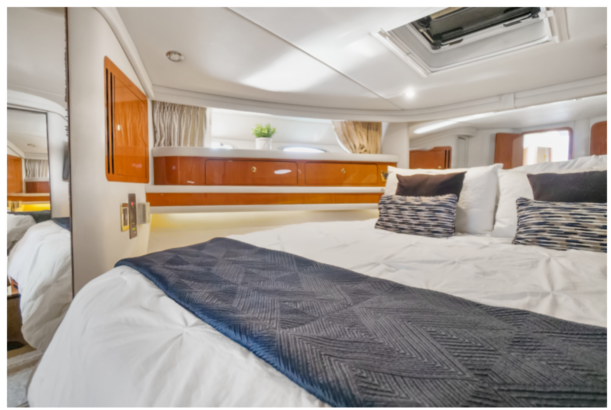
In it to Win it Master Stateroom