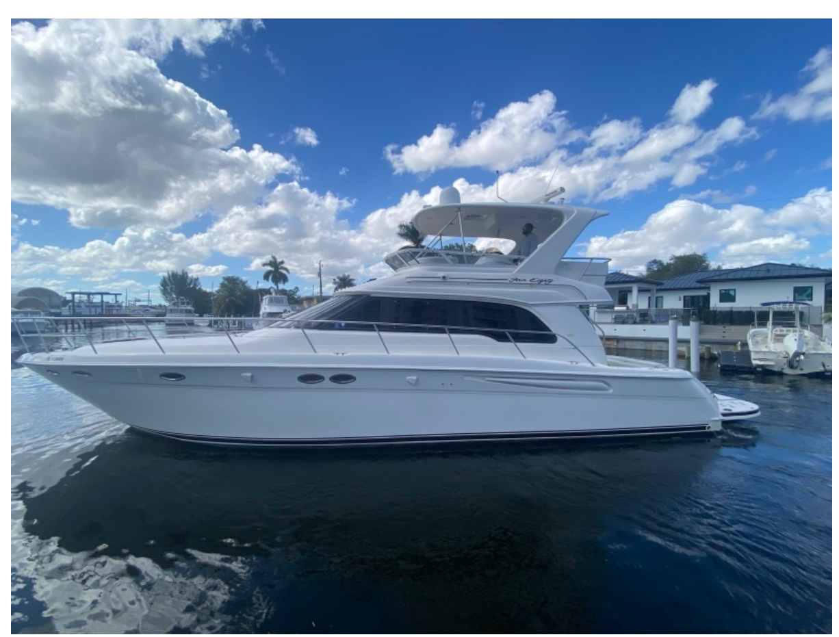
In it to Win it Exterior View