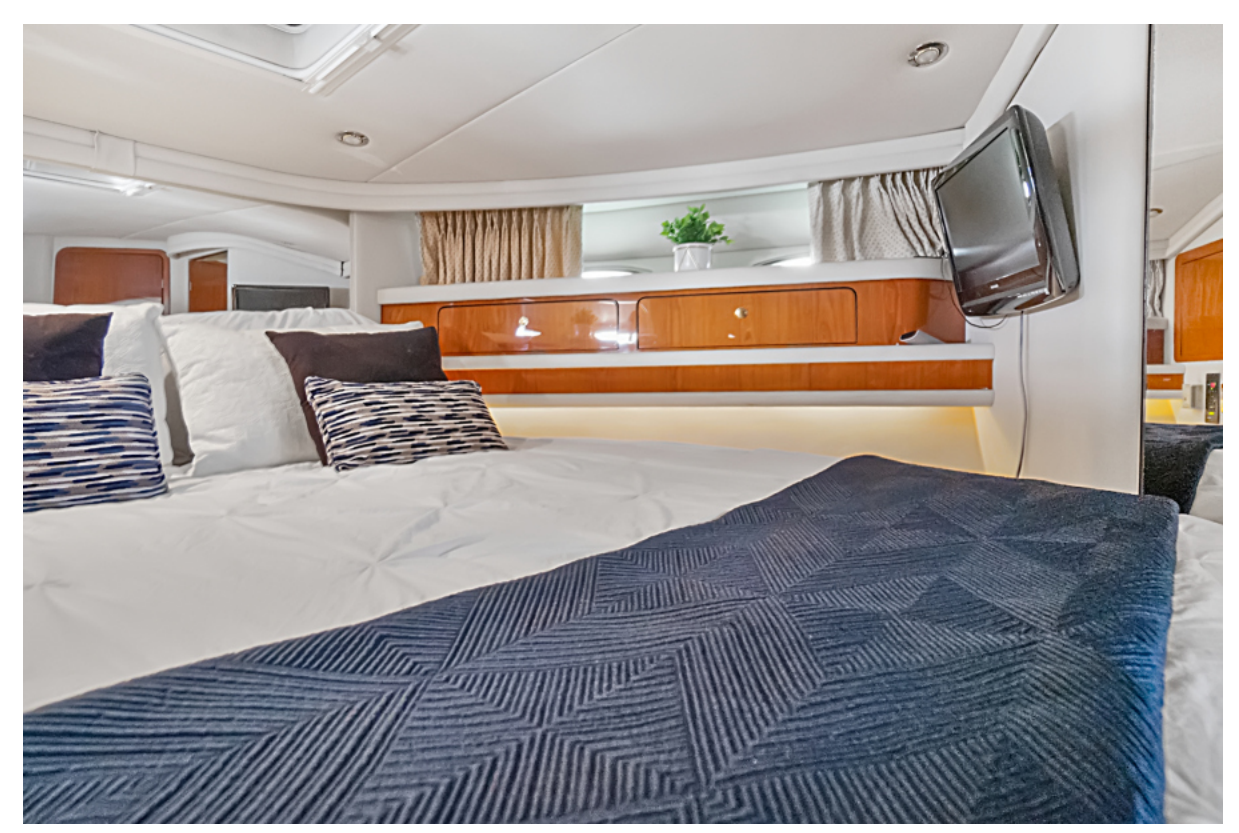
In it to Win it Master Stateroom