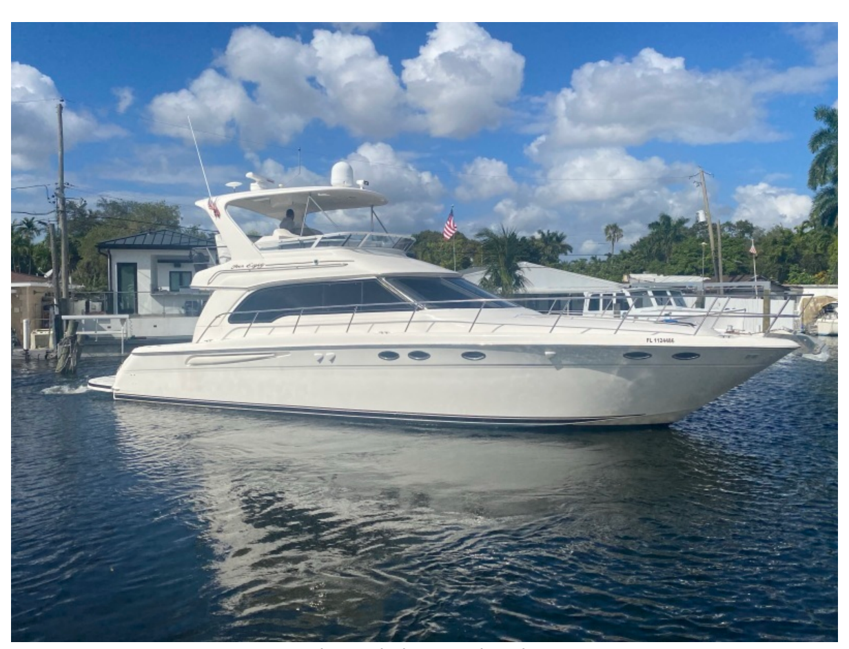
In it to Win it Exterior View