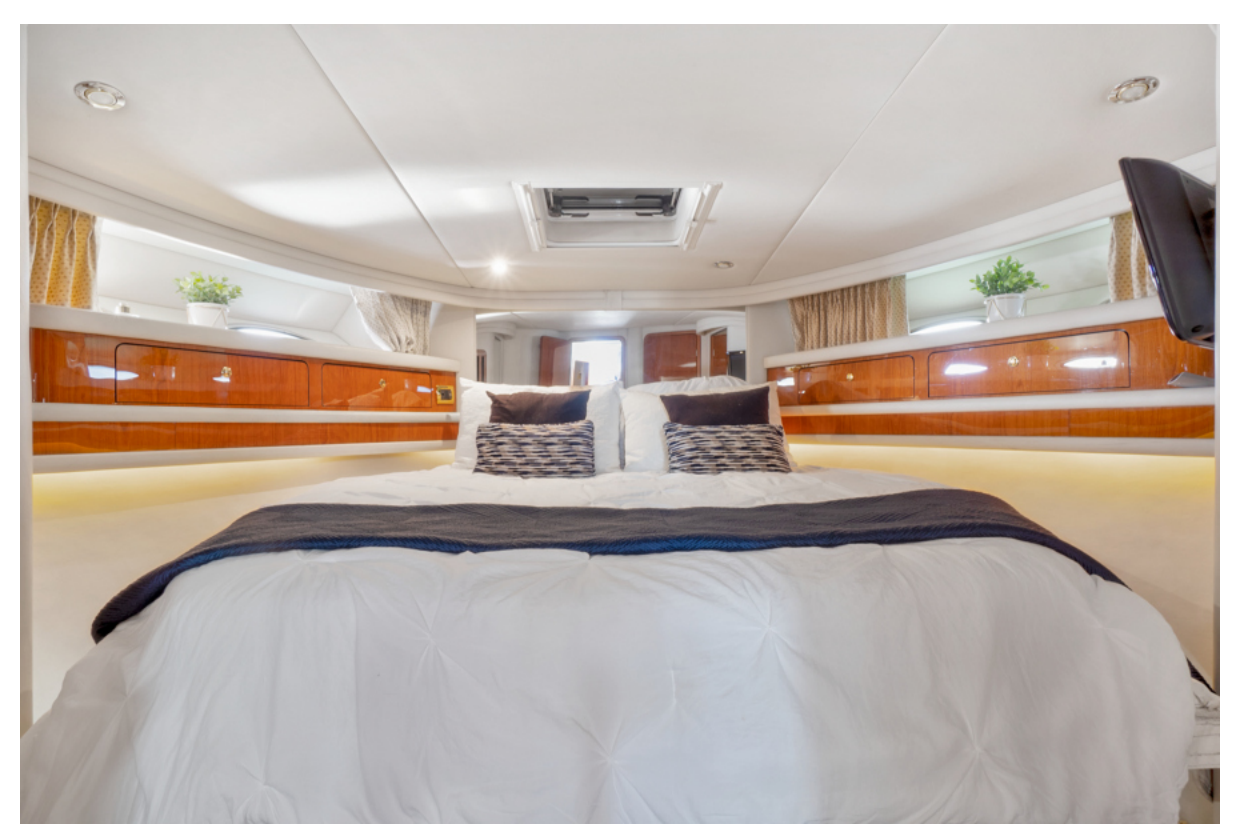
In it to Win it Master Stateroom