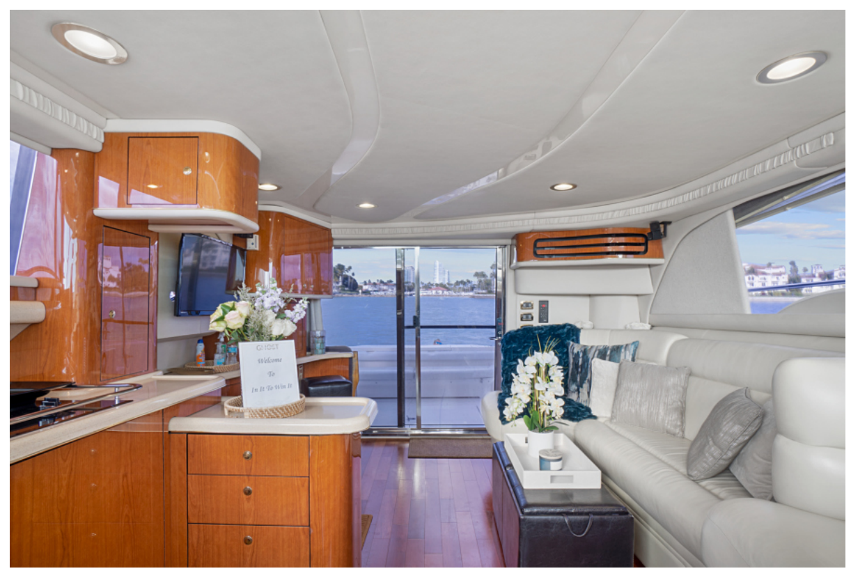
In it to Win it Main Salon and Galley