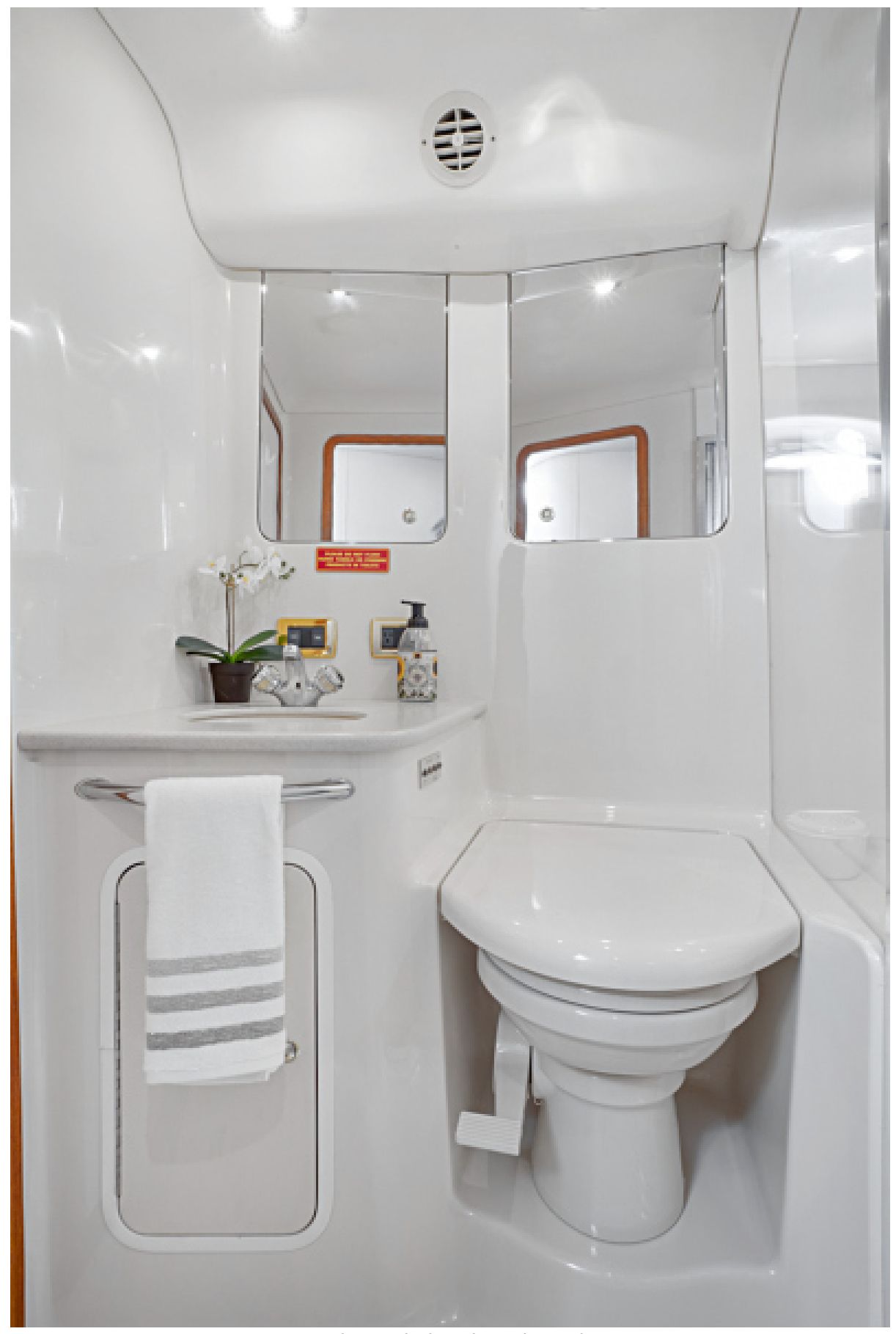
In it to Win it Shared Head