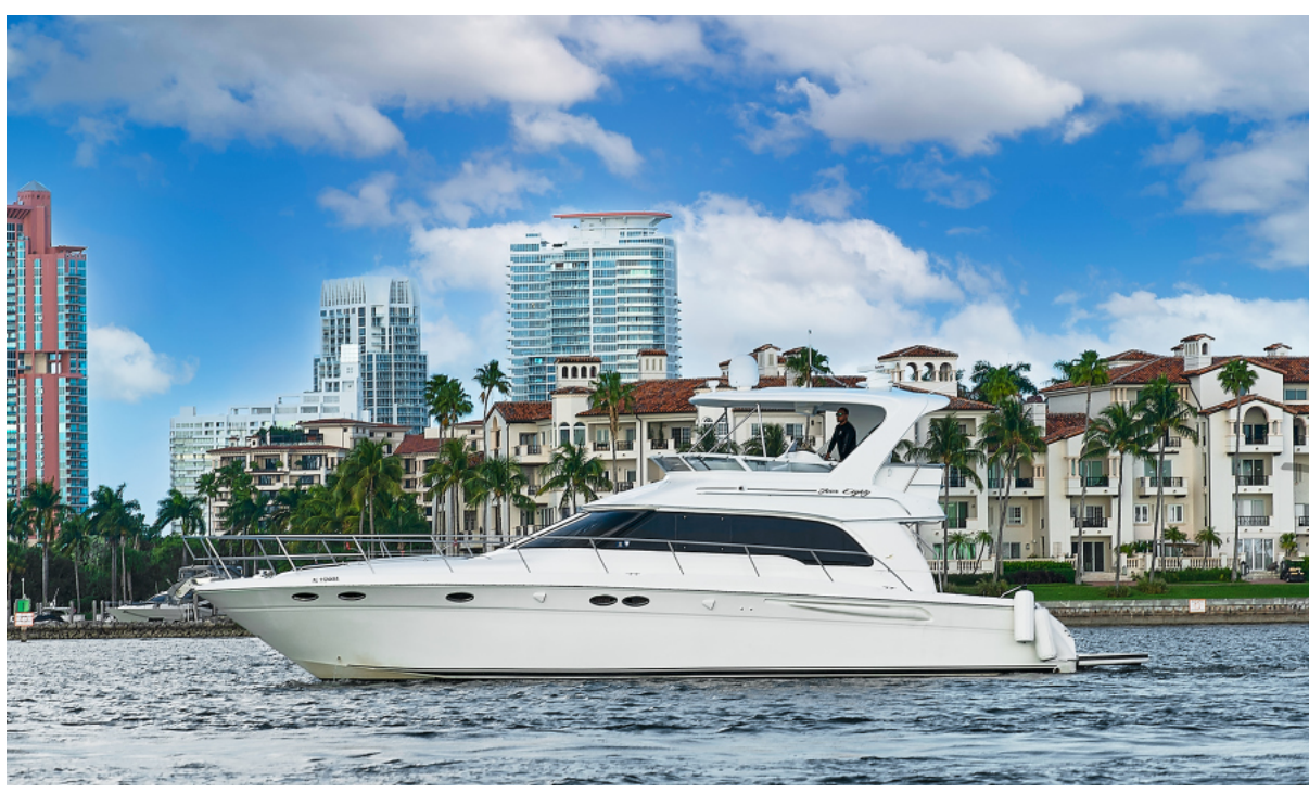
In it to Win it Exterior View