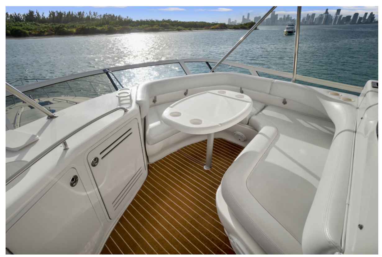
In it to Win it Flybridge