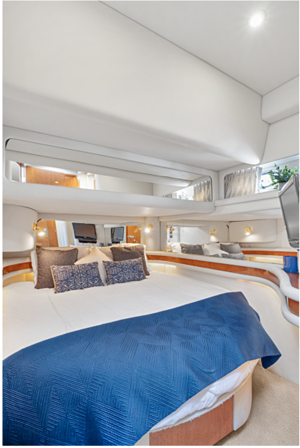
In it to Win it VIP Stateroom