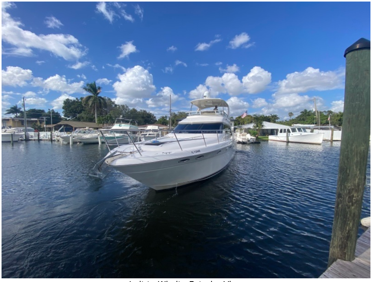
In it to Win it Exterior View