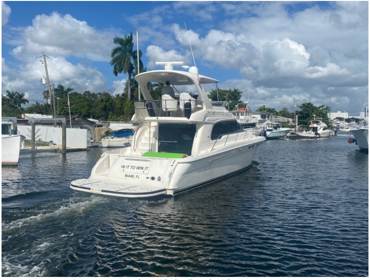
In it to Win it Exterior View