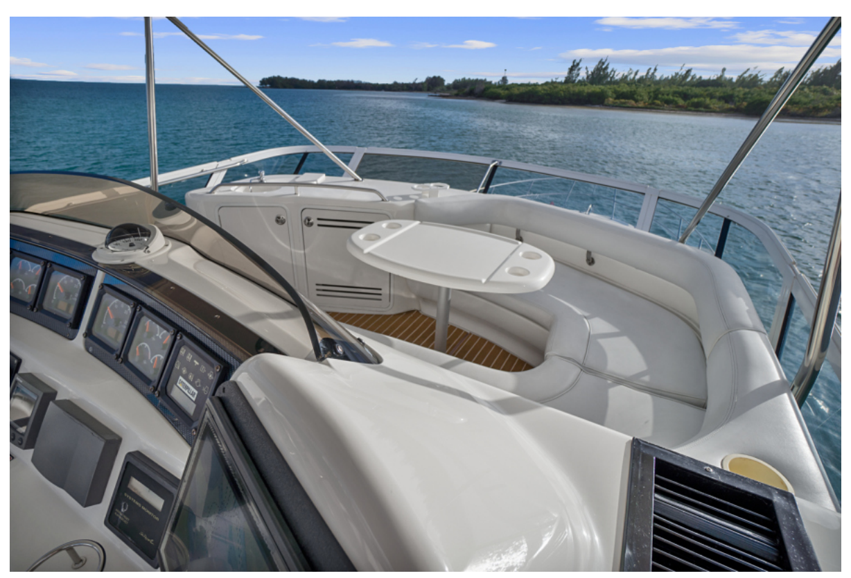
In it to Win it Flybridge