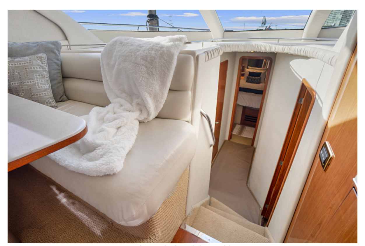
In it to Win it Dining Table