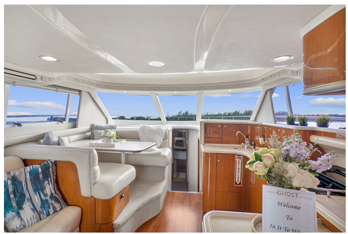
In it to Win it Dining Table