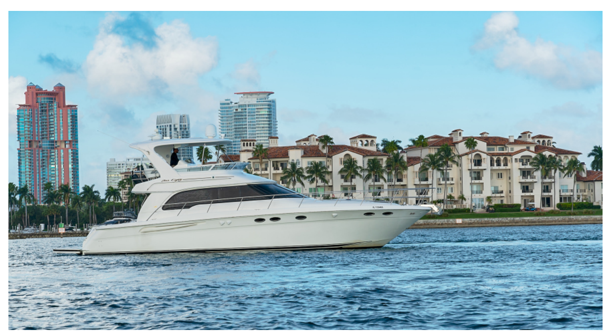
In it to Win it Exterior View