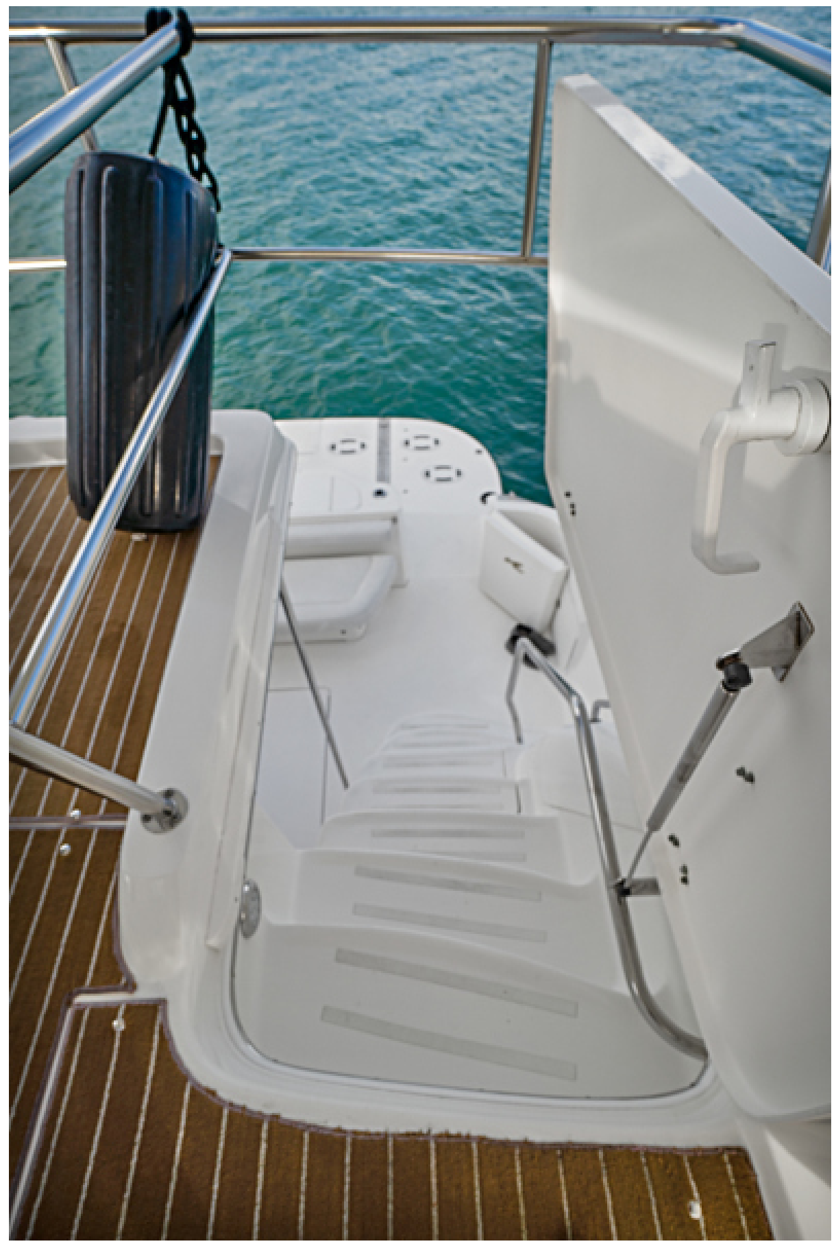
In it to Win it Stairs to Flybridge