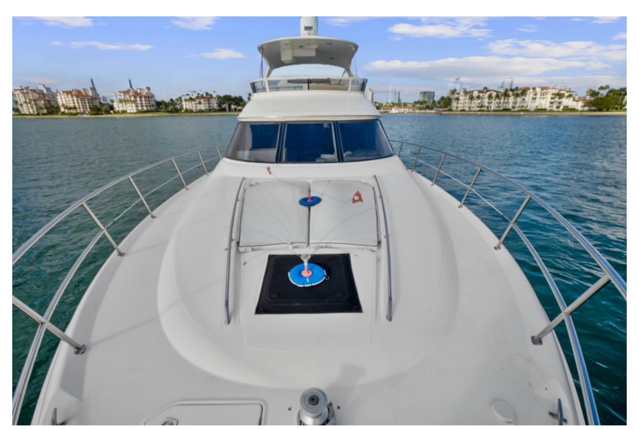
In it to Win it Bow Area