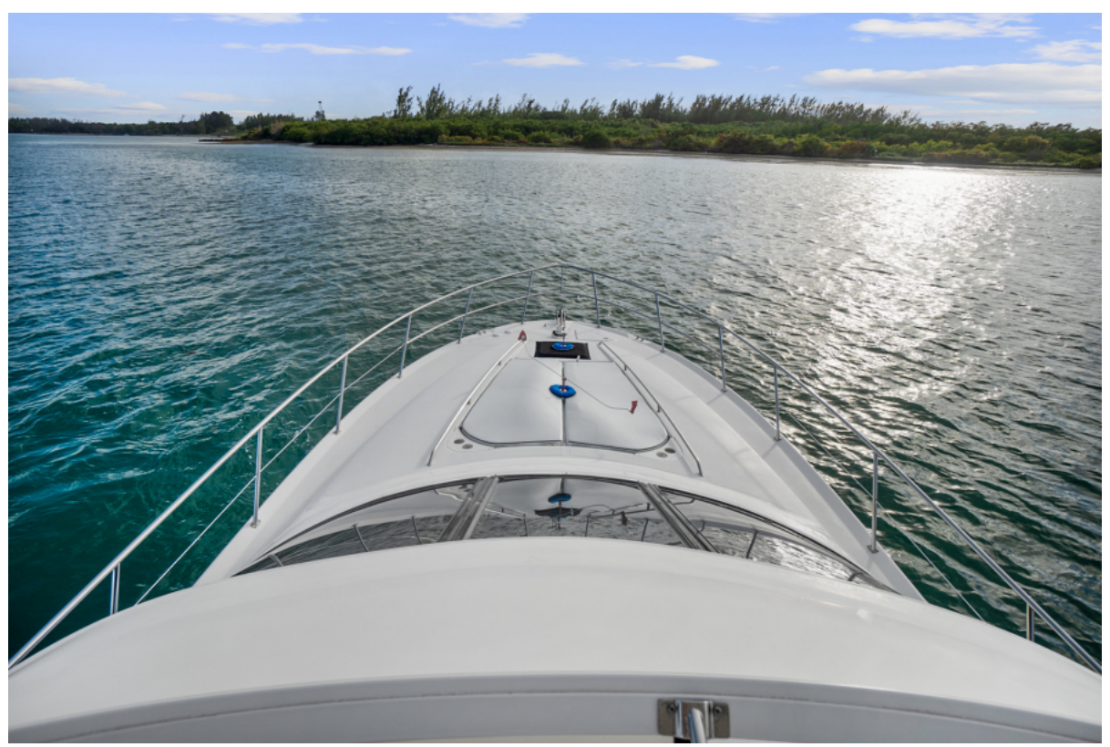
In it to Win it Bow Area