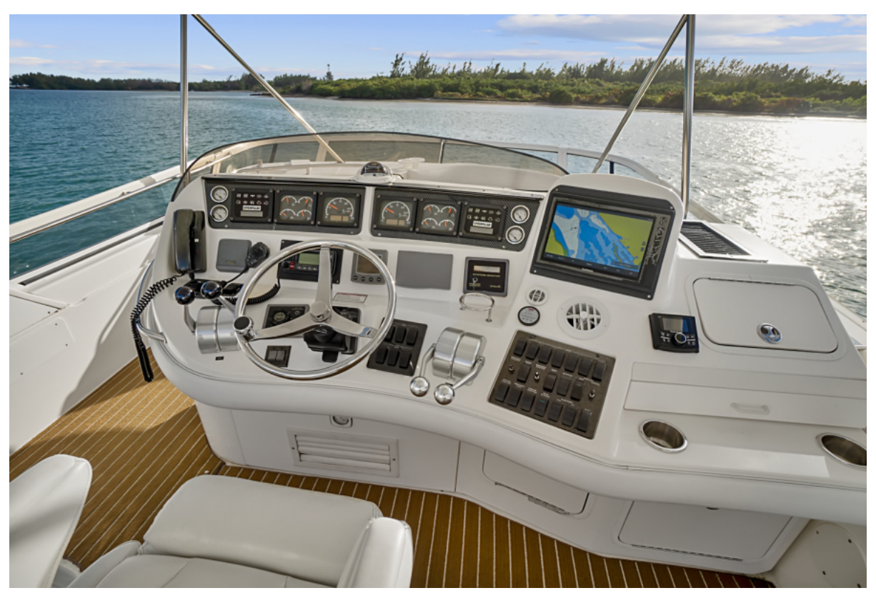
In it to Win it Flybridge Controls