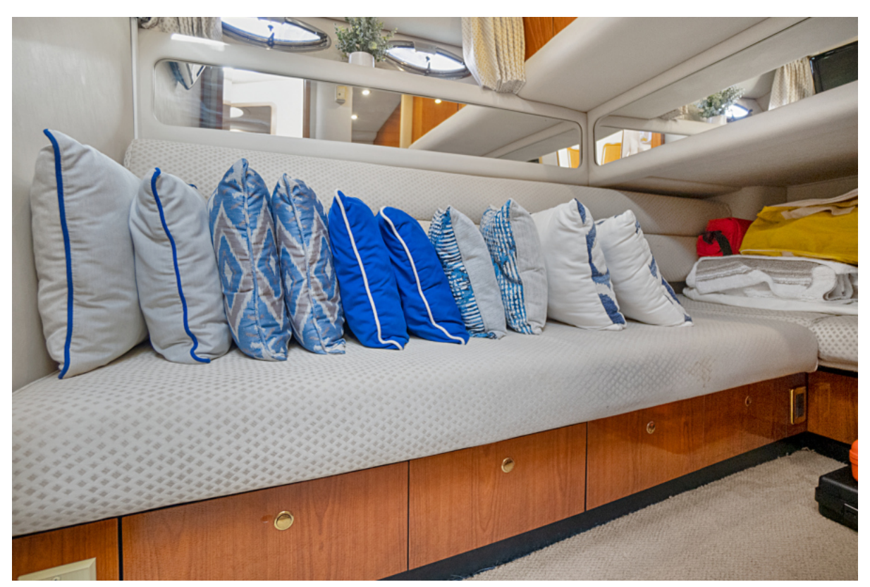
In it to Win it Twin Stateroom