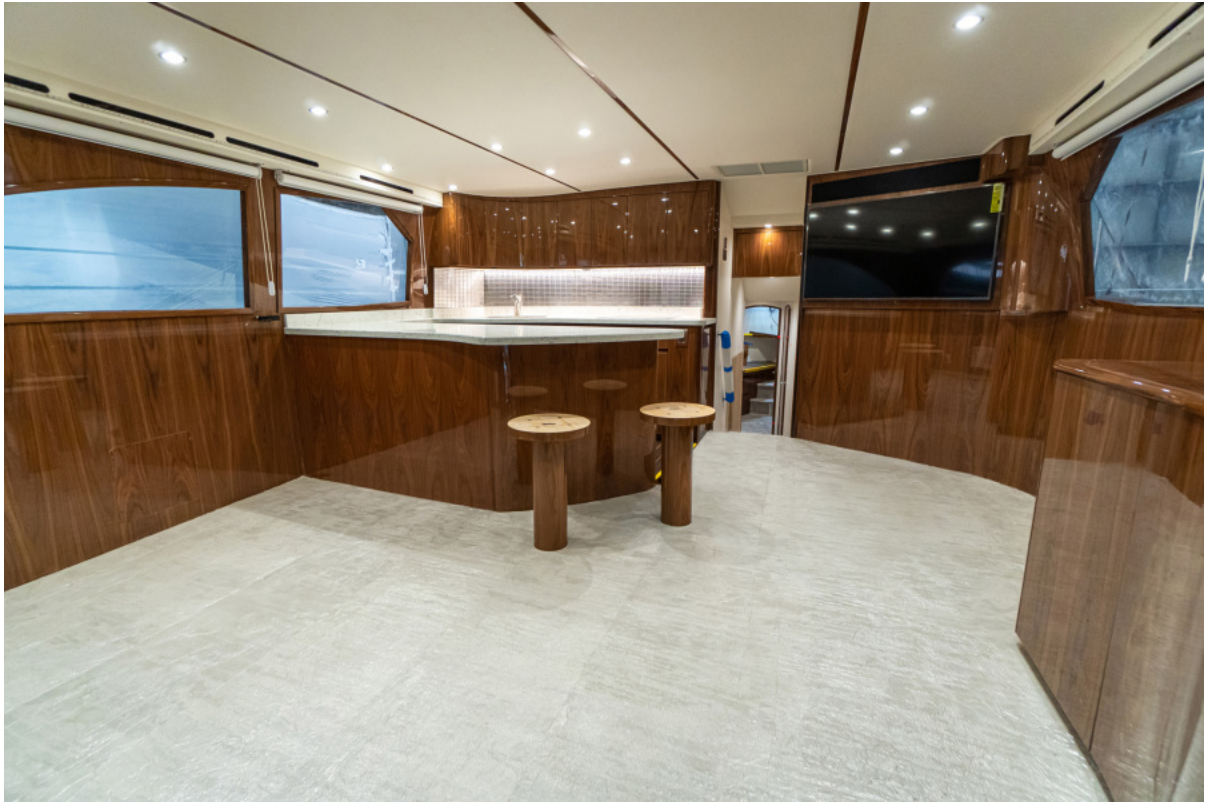
Viking 54 - Salon 2022 Viking 54 Convertible