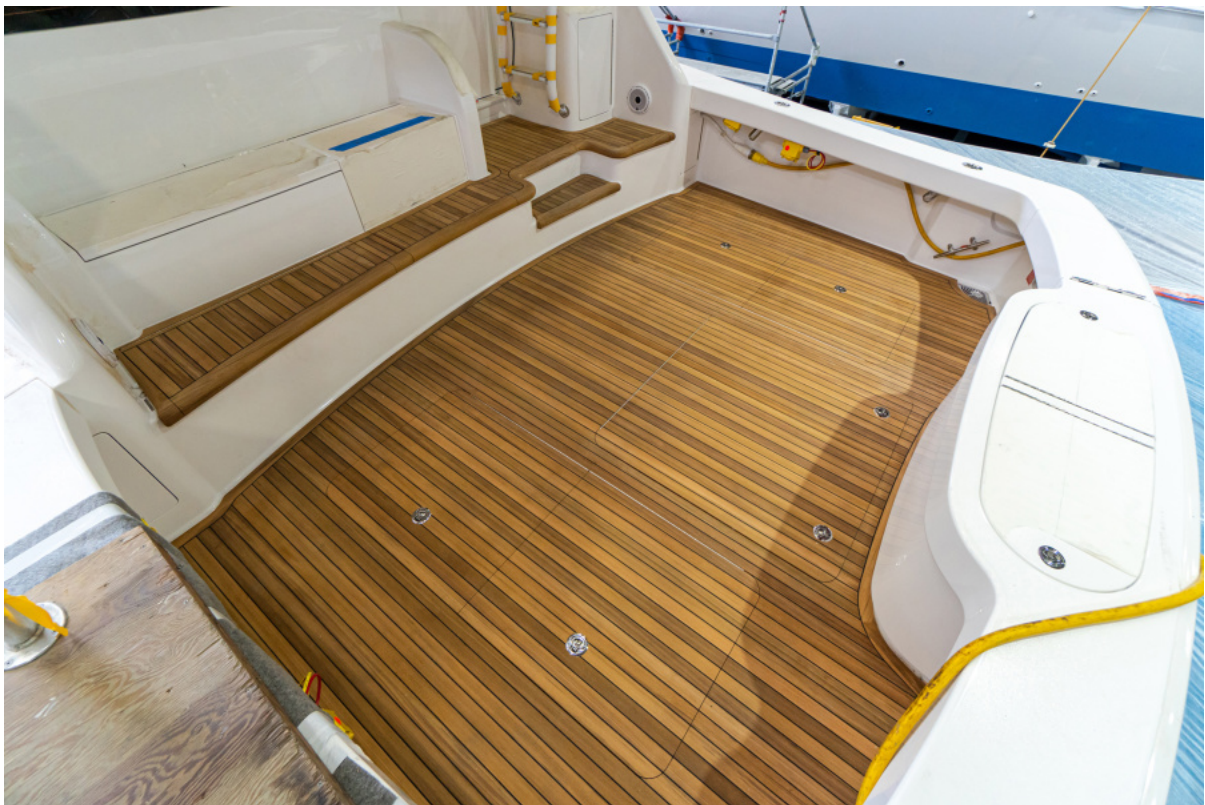
Viking 54 - Cockpit 2022 Viking 54 Convertible