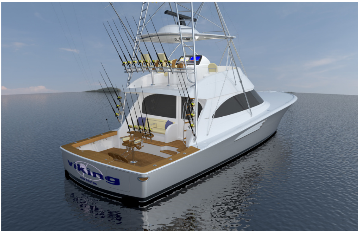
Viking 54 - Exterior Profile 2022 Viking 54 Convertible