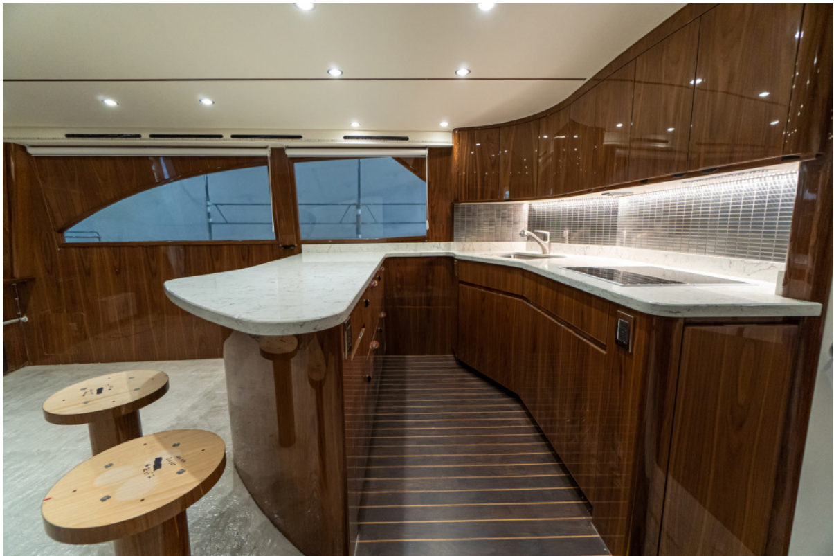
Viking 54 - Galley 2022 Viking 54 Convertible