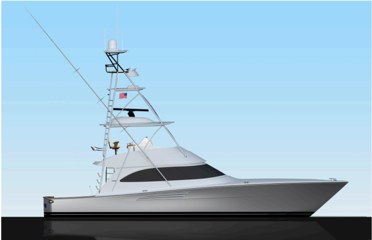
Viking 54 - Exterior Profile 2022 Viking 54 Convertible