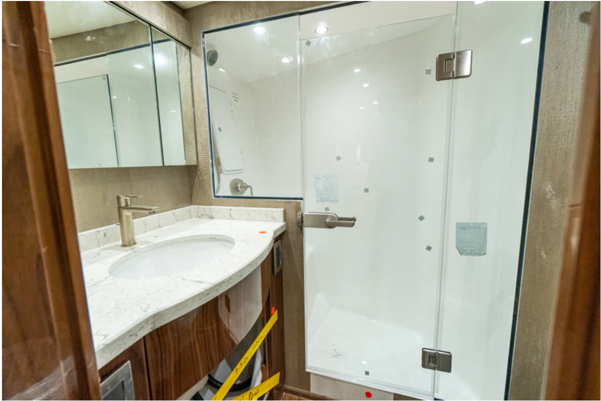
Viking 54 - Head 2022 Viking 54 Convertible