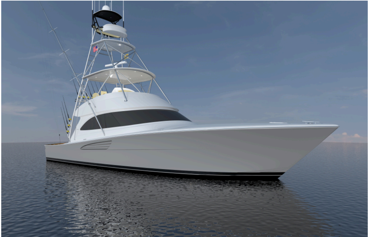
Viking 54 - Exterior Profile 2022 Viking 54 Convertible