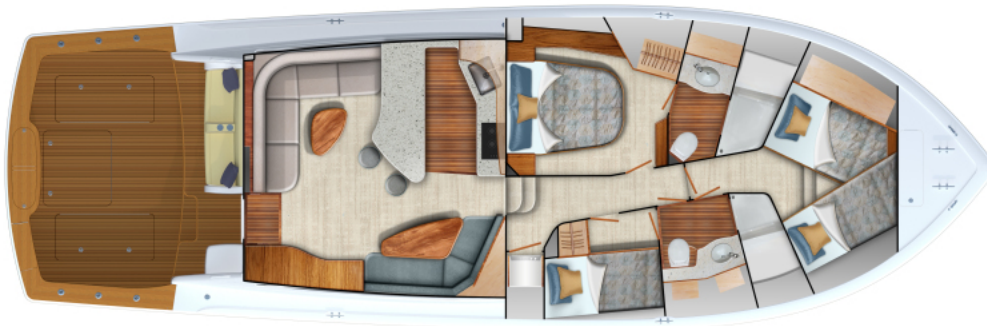
Viking 54 - Interior Layout 2022 Viking 54 Convertible