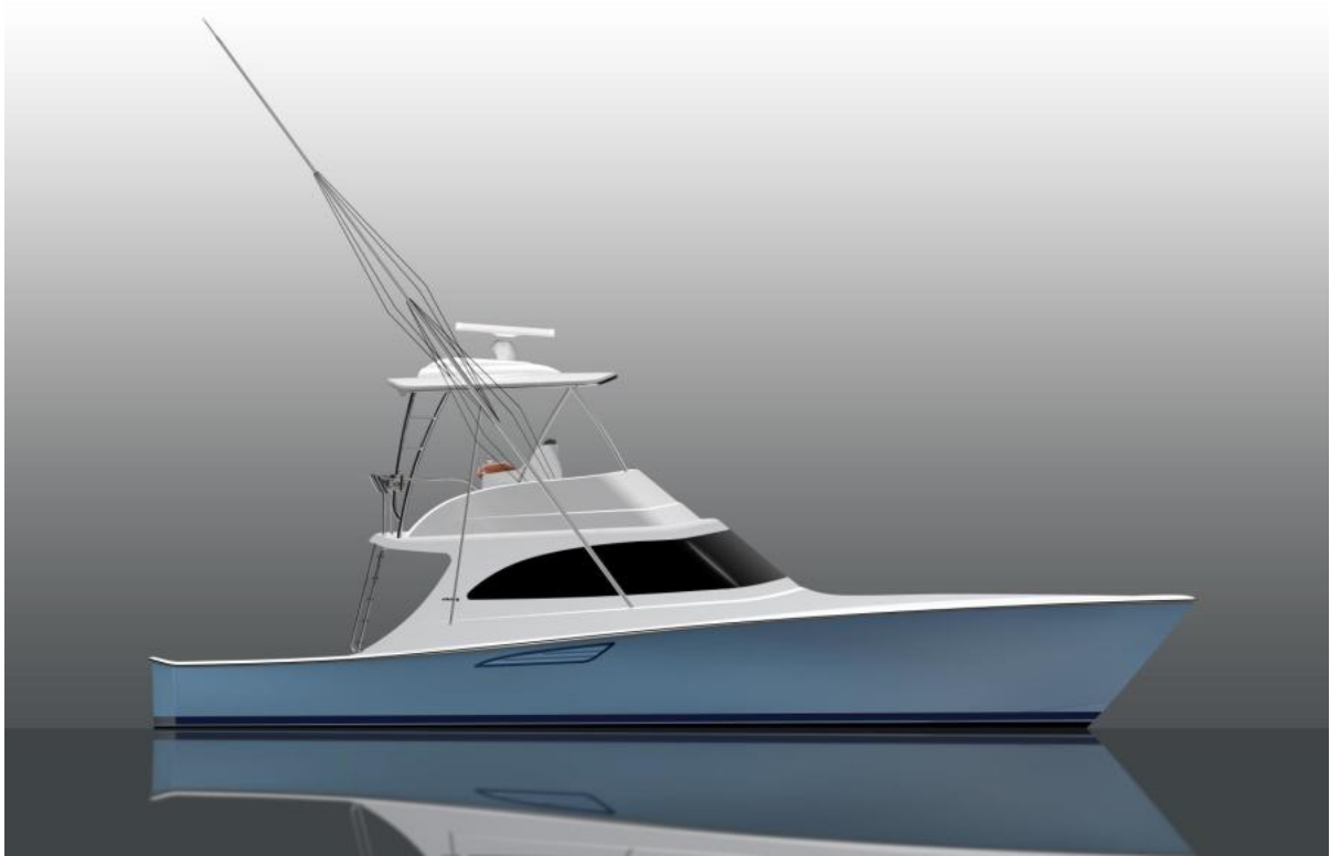
Viking 46- Exterior Profile 2022 Viking 46 Billfish