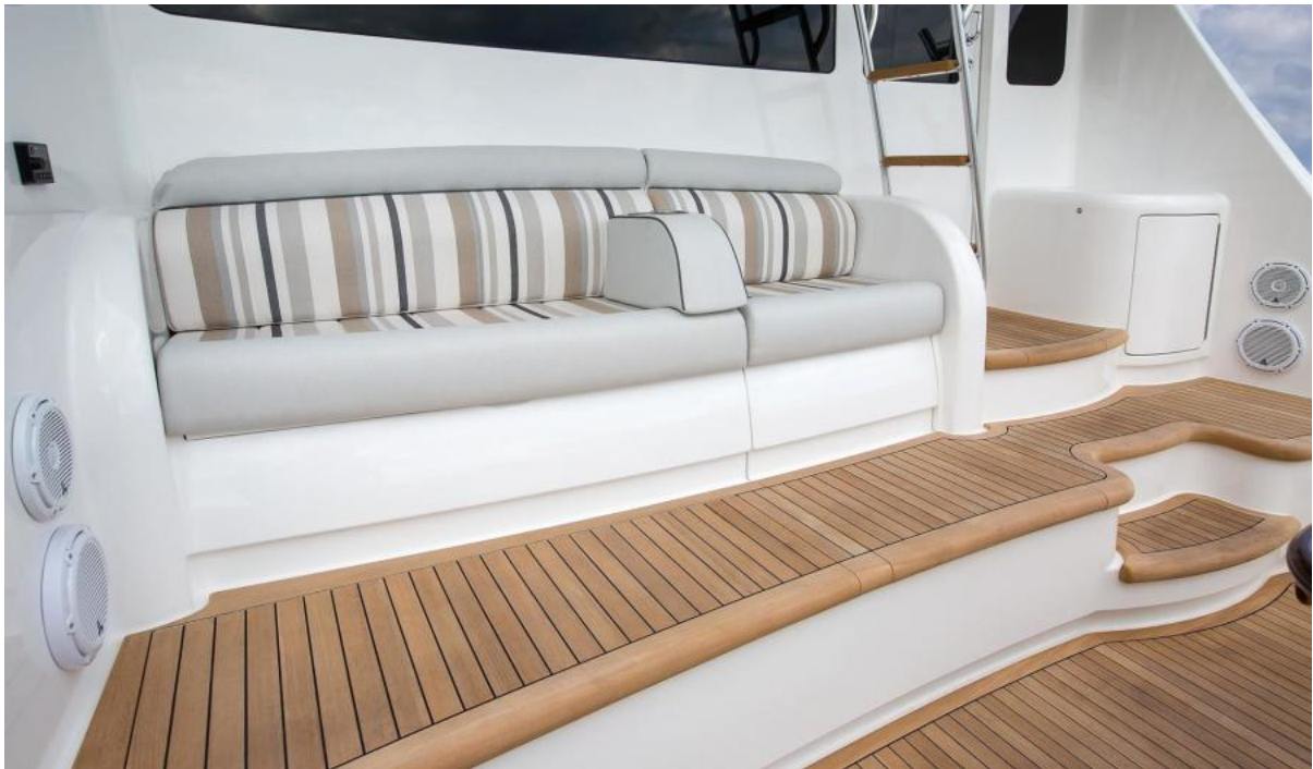
Viking 68 - Mezzanine Seating 2022 Viking 68 Convertible (sistership)