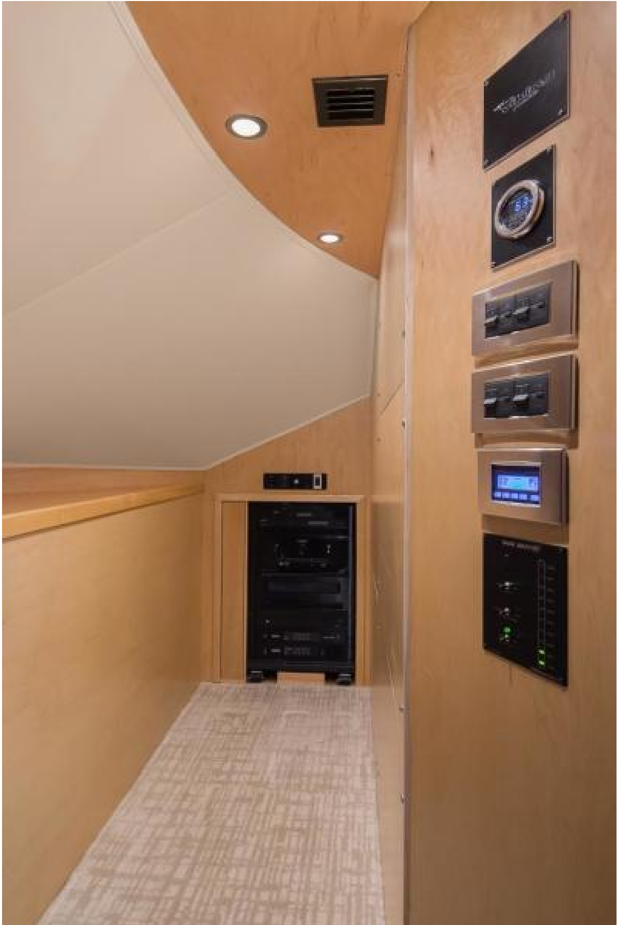
Viking 68 - Electrical Unit and Storage 2022 Viking 68 Convertible (sistership)