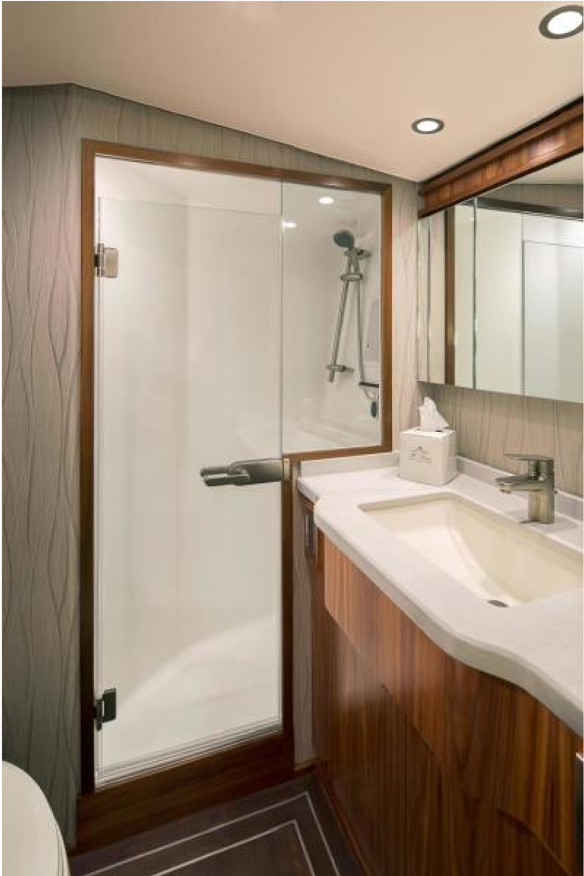
Viking 68 - VIP Head 2022 Viking 68 Convertible (sistership)