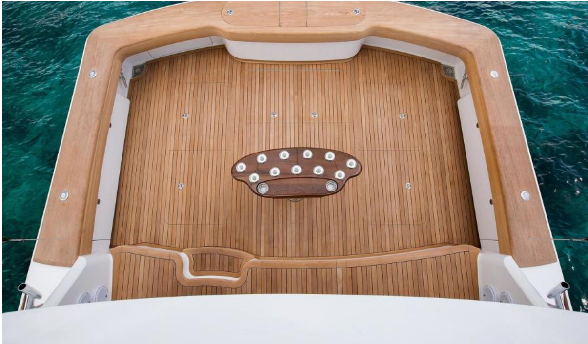
Viking 68 - Cockpit 2022 Viking 68 Convertible (sistership)