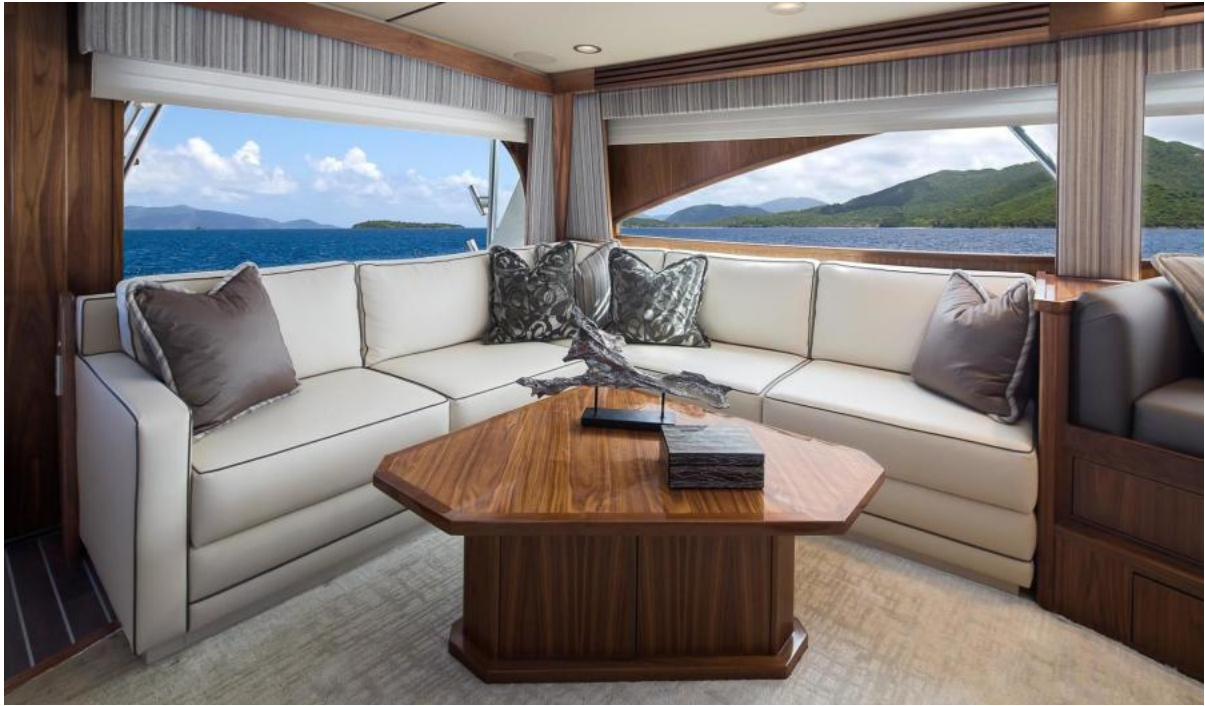
Viking 68 - Salon Seating 2022 Viking 68 Convertible (sistership)