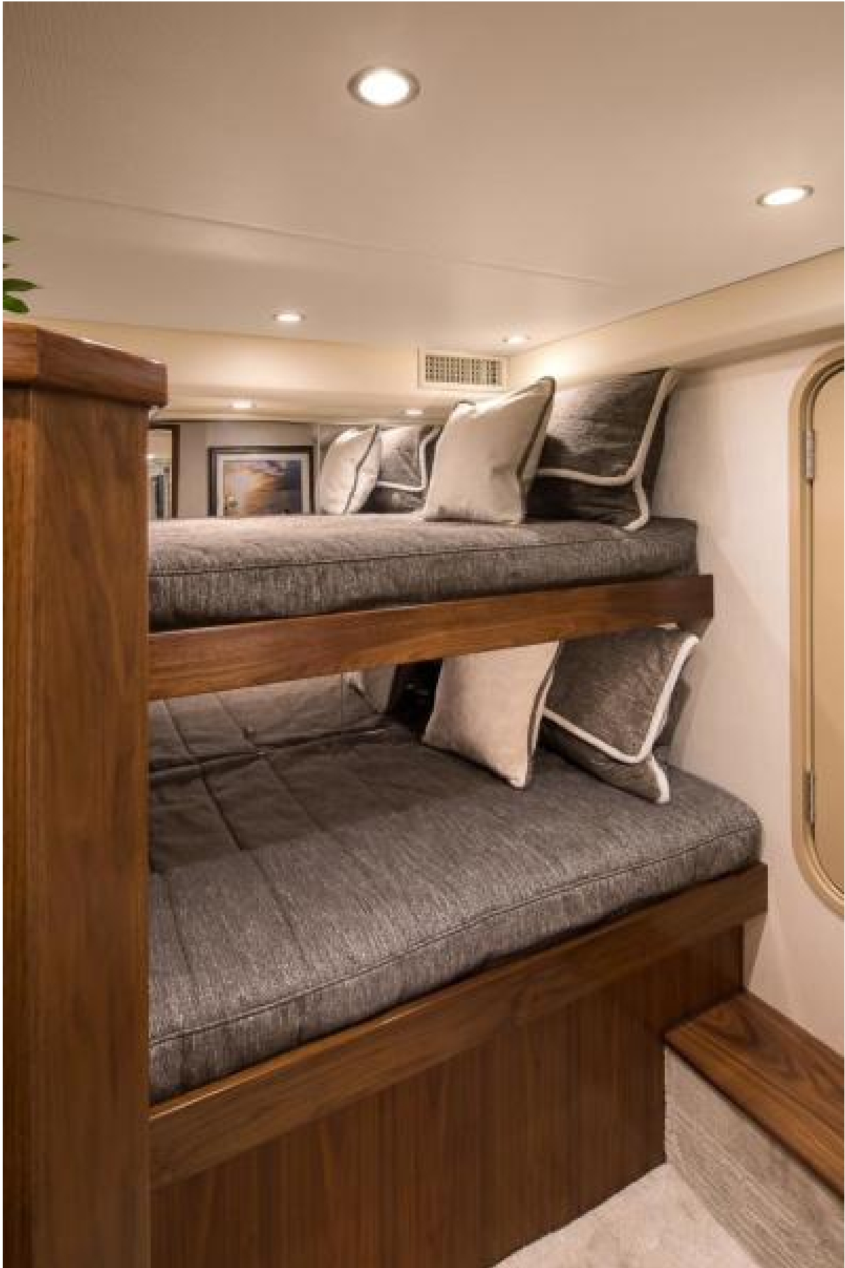
Viking 68 - Guest Stateroom #2 2022 Viking 68 Convertible (sistership)