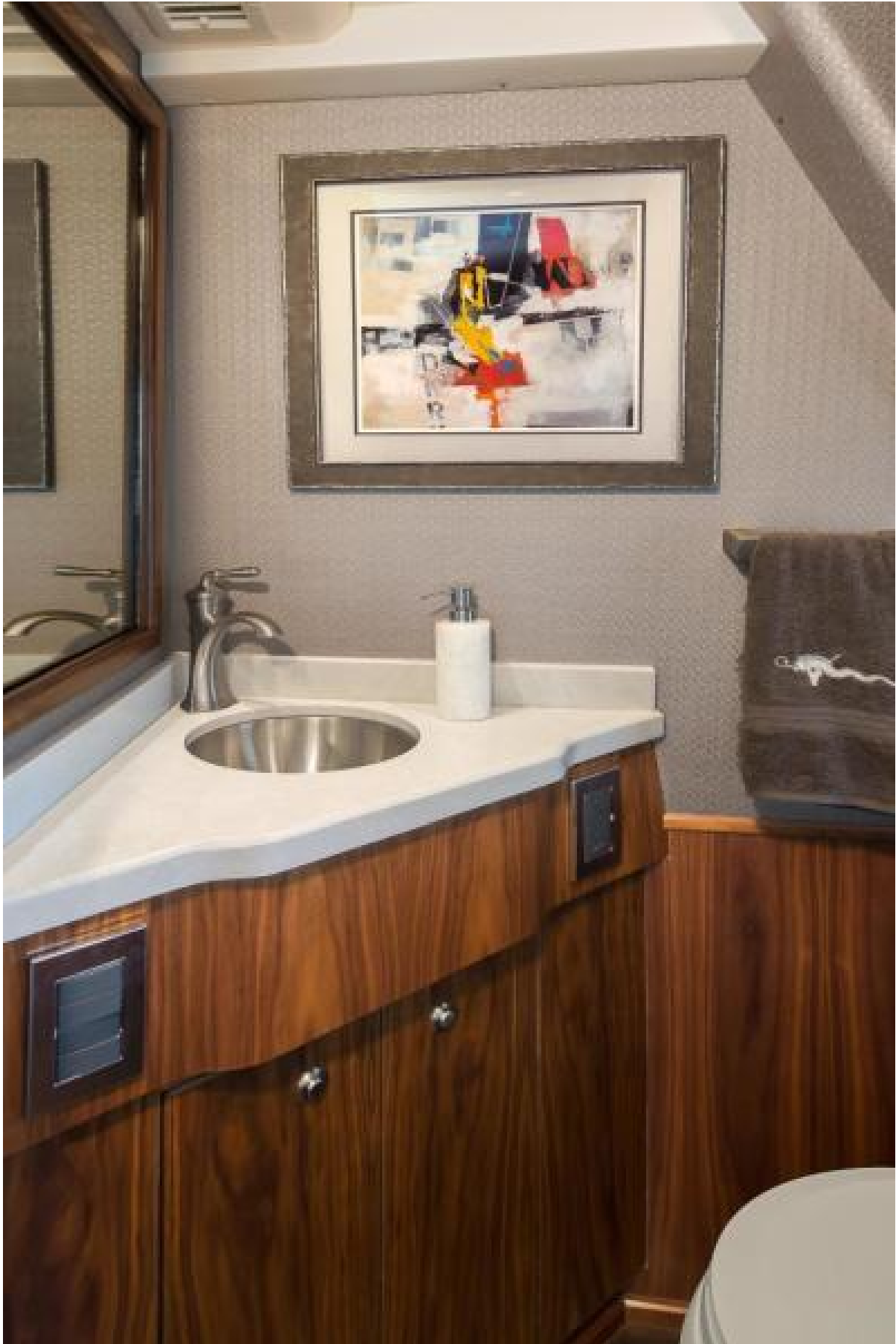
Viking 68 - Day Head 2022 Viking 68 Convertible (sistership)