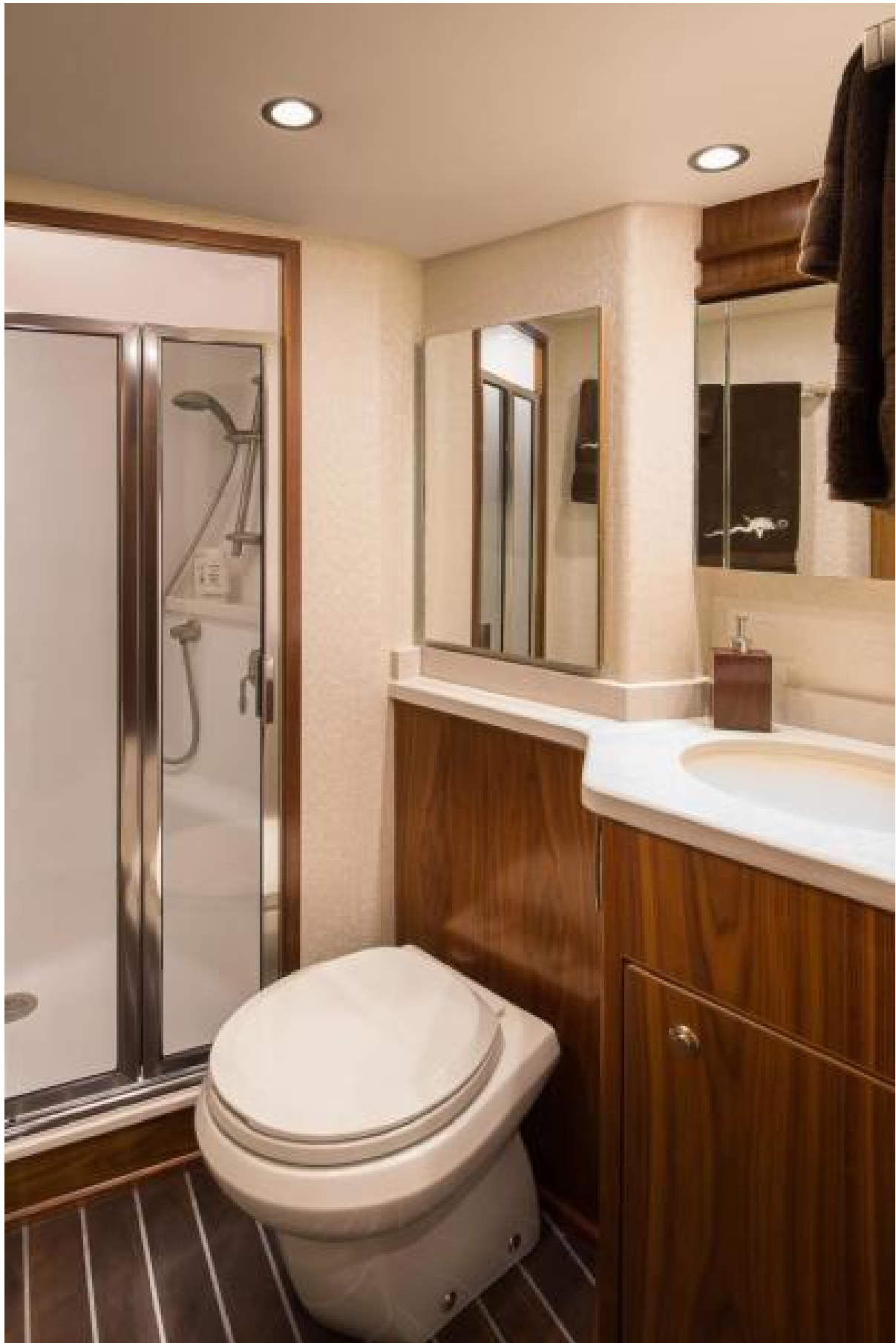
Viking 68 - Master Head 2022 Viking 68 Convertible (sistership)