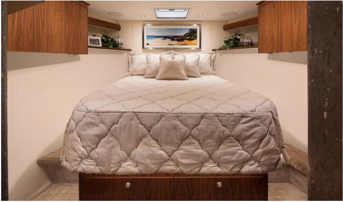
Viking 68 - Master Stateroom 2022 Viking 68 Convertible (sistership)