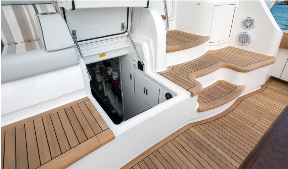
Viking 68 - Engine Room Access 2022 Viking 68 Convertible (sistership)