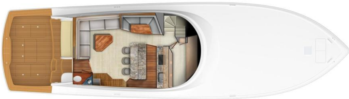
Viking 68 - Upper Interior Layout 2022 Viking 68 Convertible (sistership)