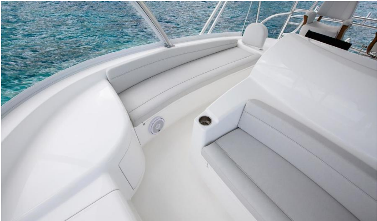
Viking 68 - Bridge Seating 2022 Viking 68 Convertible (sistership)