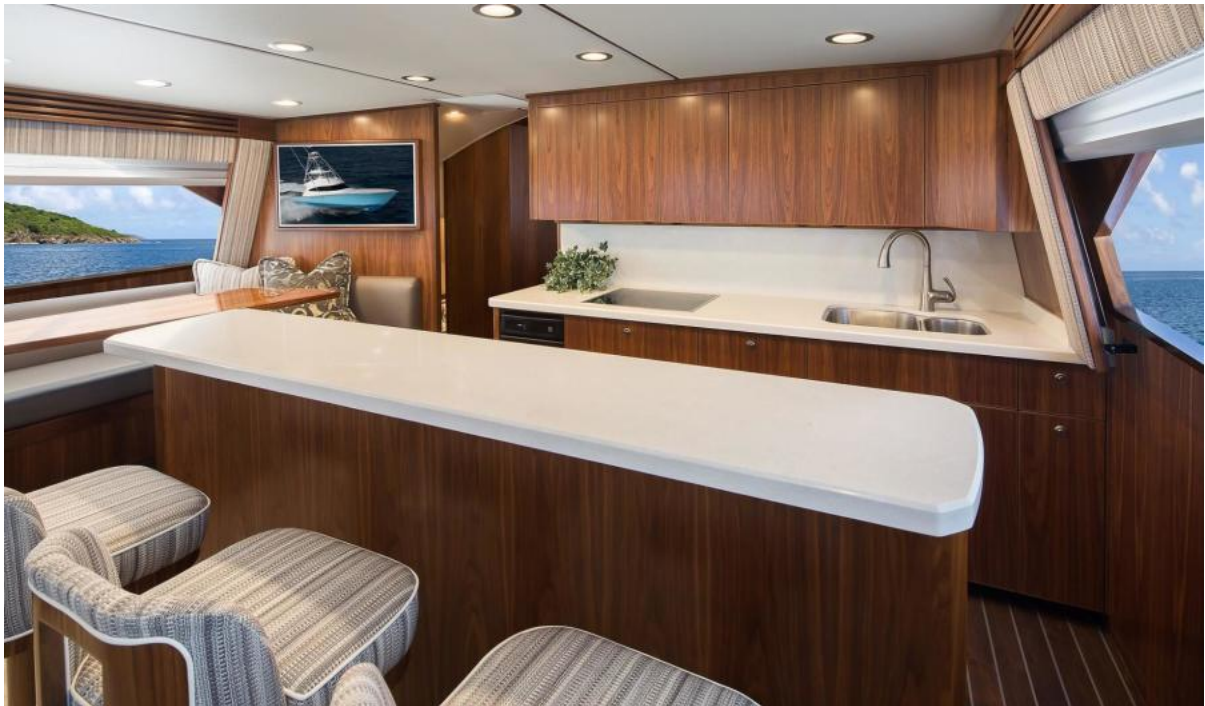
Viking 68 - Galley 2022 Viking 68 Convertible (sistership)