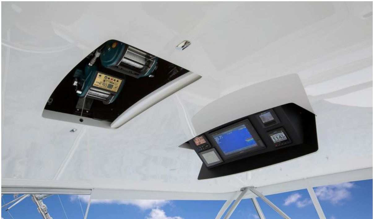
Viking 68 - Overhead Electronics 2022 Viking 68 Convertible (sistership)