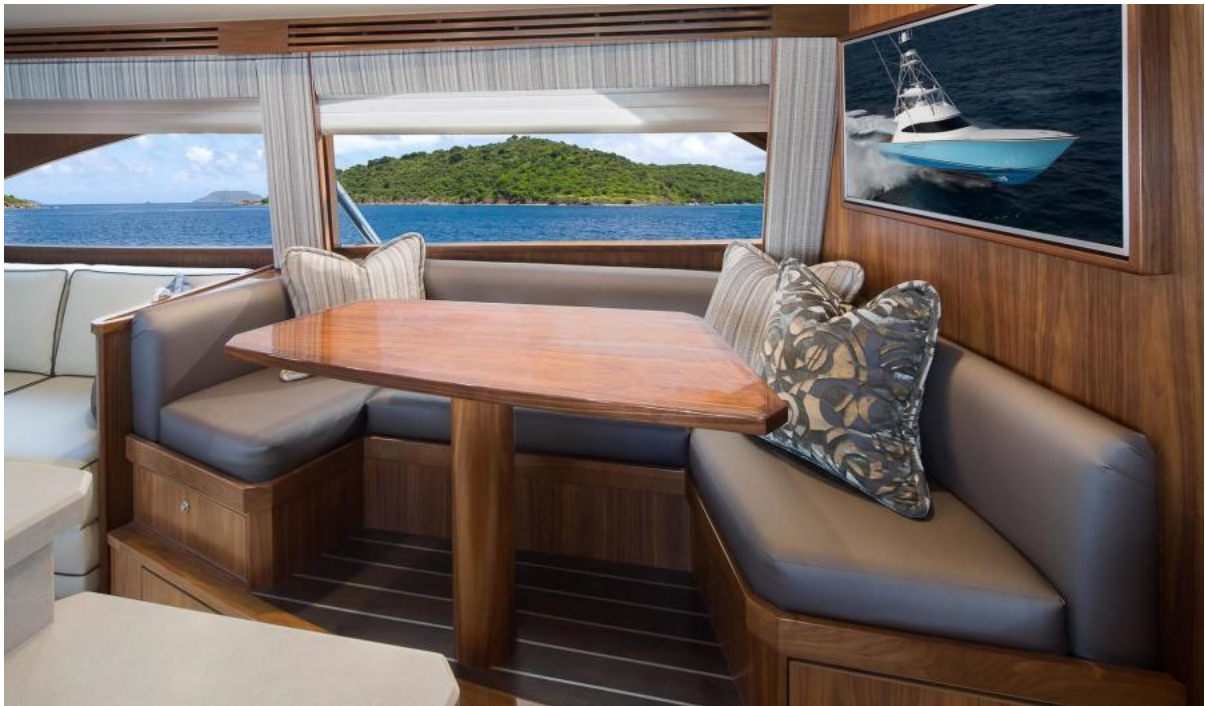
Viking 68 - Dinette 2022 Viking 68 Convertible (sistership)