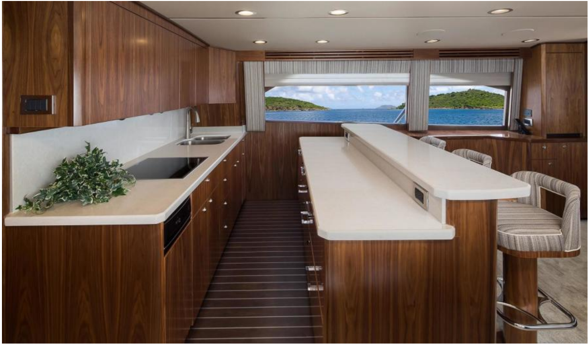
Viking 68 - Galley 2022 Viking 68 Convertible (sistership)