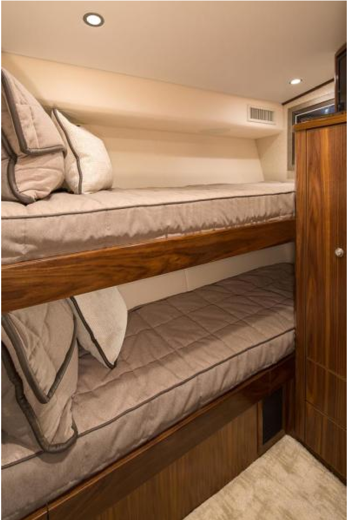
Viking 68 - Guest Stateroom 2022 Viking 68 Convertible (sistership)