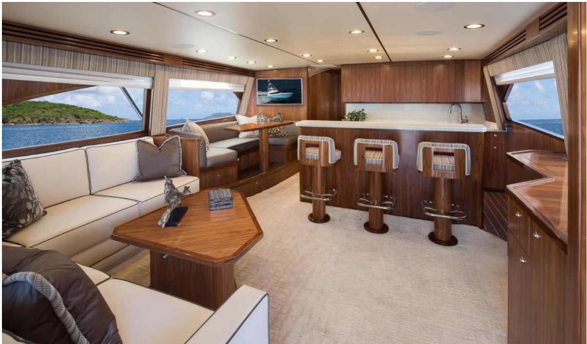
Viking 68 - Salon 2022 Viking 68 Convertible (sistership)