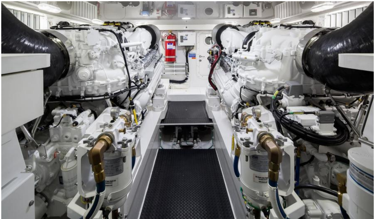
Viking 68 - Engine Room 2022 Viking 68 Convertible (sistership)