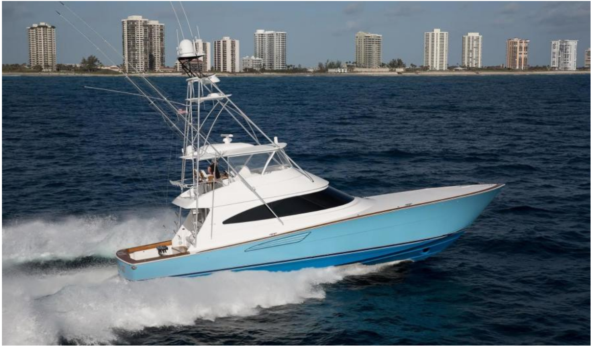
Viking 68 - Profile 2022 Viking 68 Convertible (sistership)