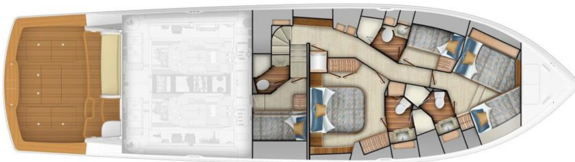
Viking 68 - Lower Interior Layout 2022 Viking 68 Convertible (sistership)