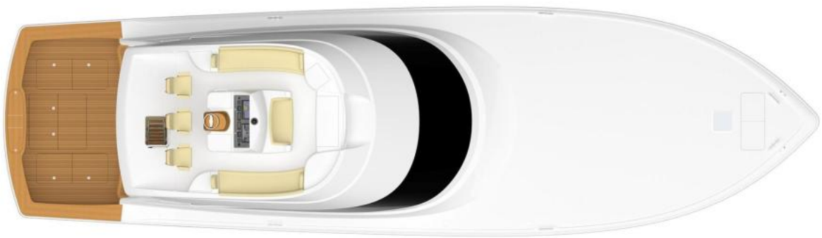
Viking 68 - Exterior Layout 2022 Viking 68 Convertible (sistership)