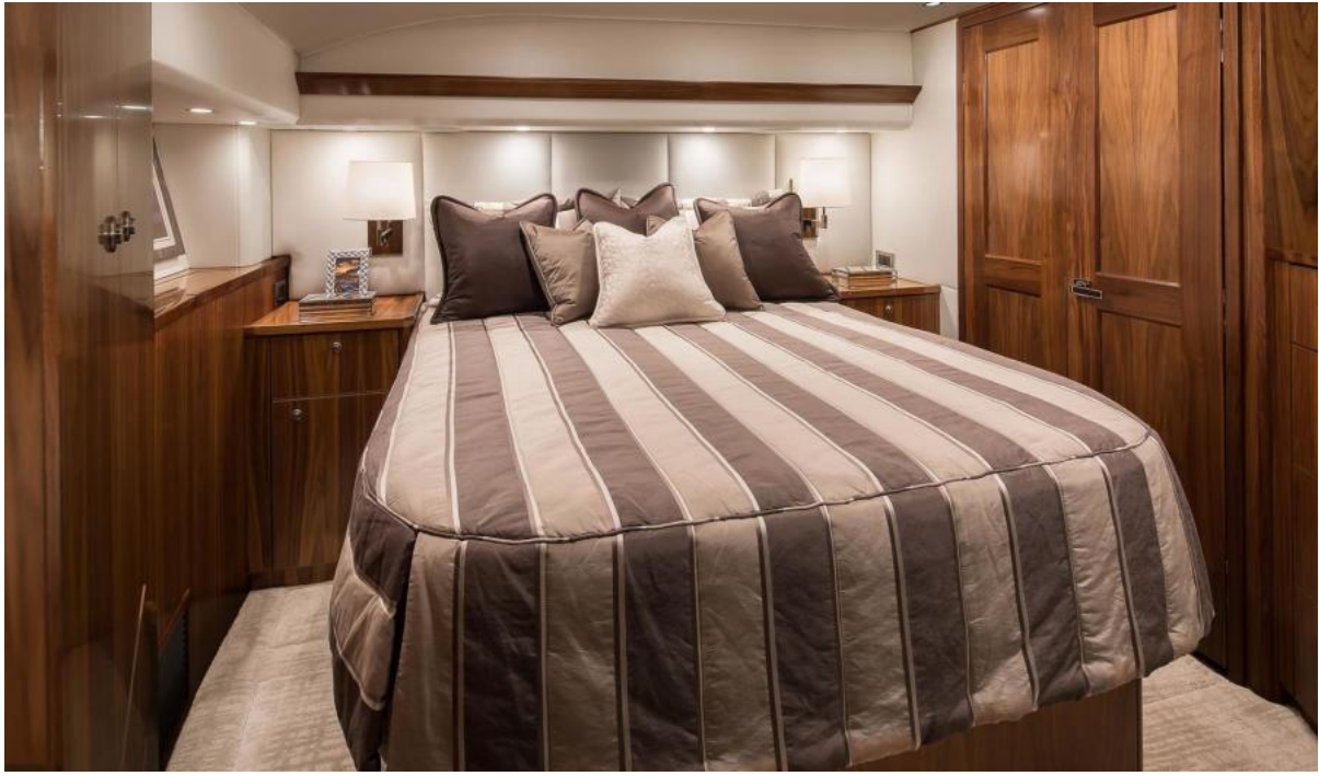
Viking 68 - VIP Stateroom 2022 Viking 68 Convertible (sistership)