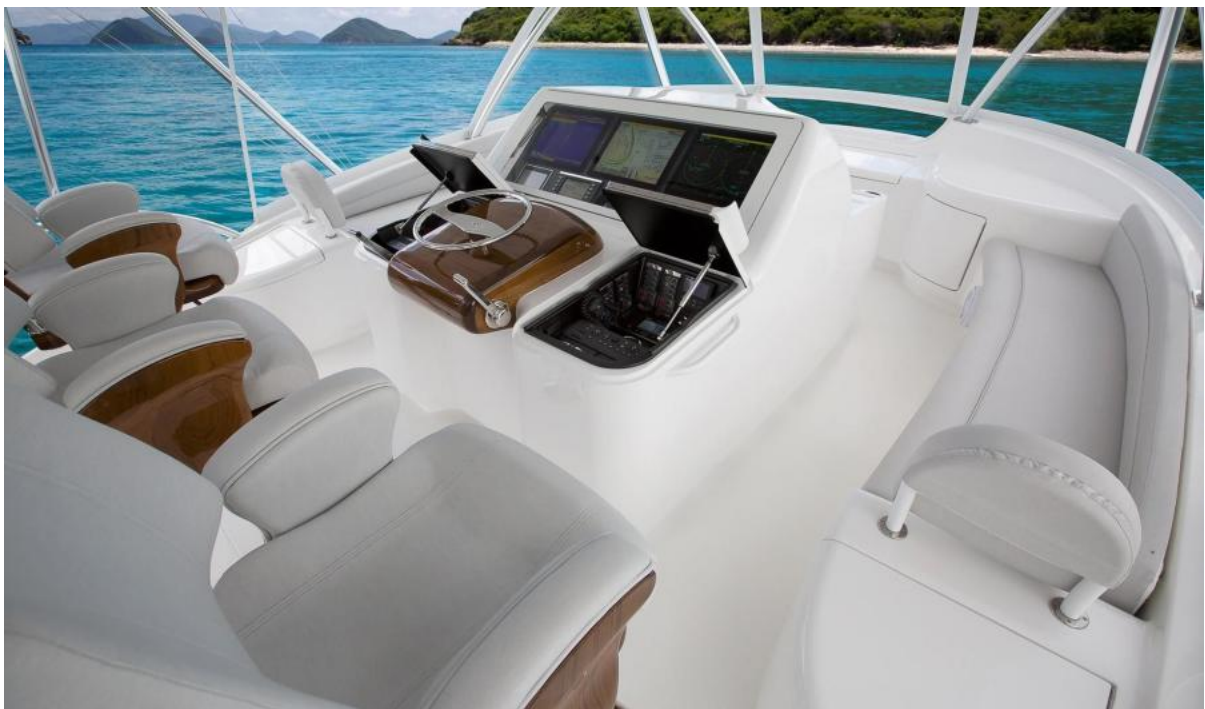
Viking 68 - Flybridge 2022 Viking 68 Convertible (sistership)