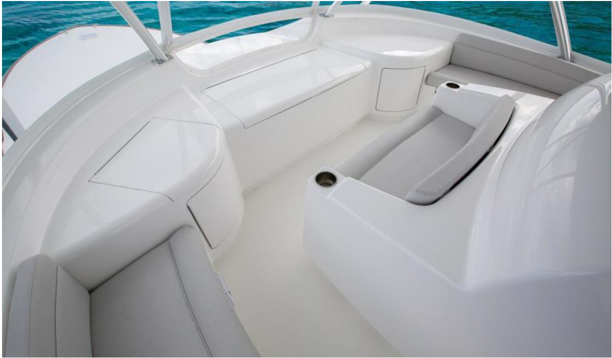
Viking 68 - Bridge Seating 2022 Viking 68 Convertible (sistership)