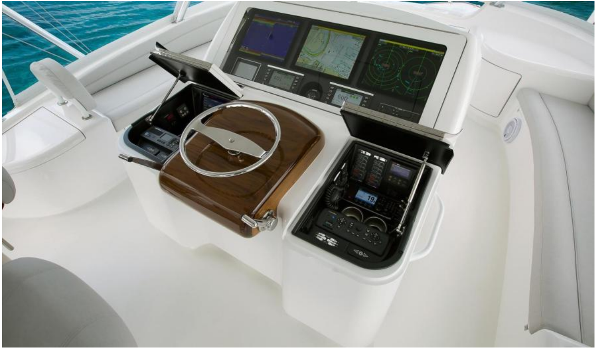
Viking 68 - Helm Station 2022 Viking 68 Convertible (sistership)