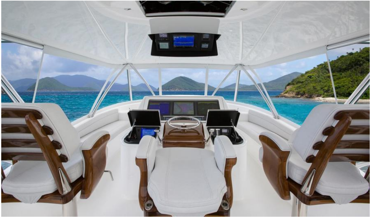
Viking 68 - Flybridge 2022 Viking 68 Convertible (sistership)