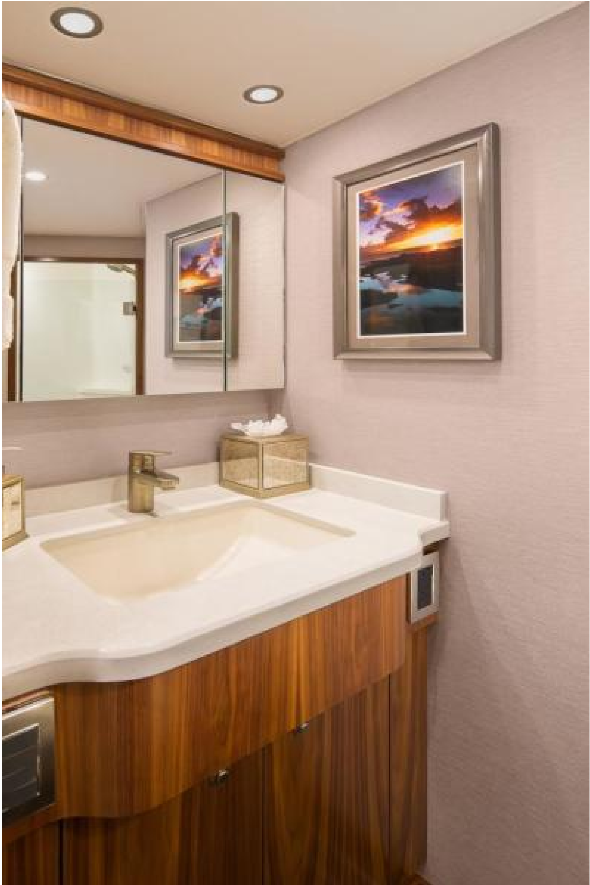
Viking 68 - Guest Stateroom 2022 Viking 68 Convertible (sistership)