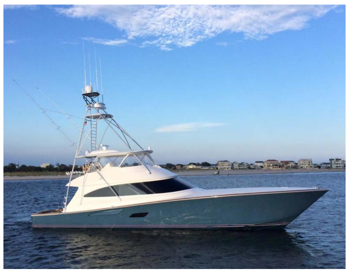
Viking 80 - Exterior Profile 2022 Viking 80 Convertible (sistership)