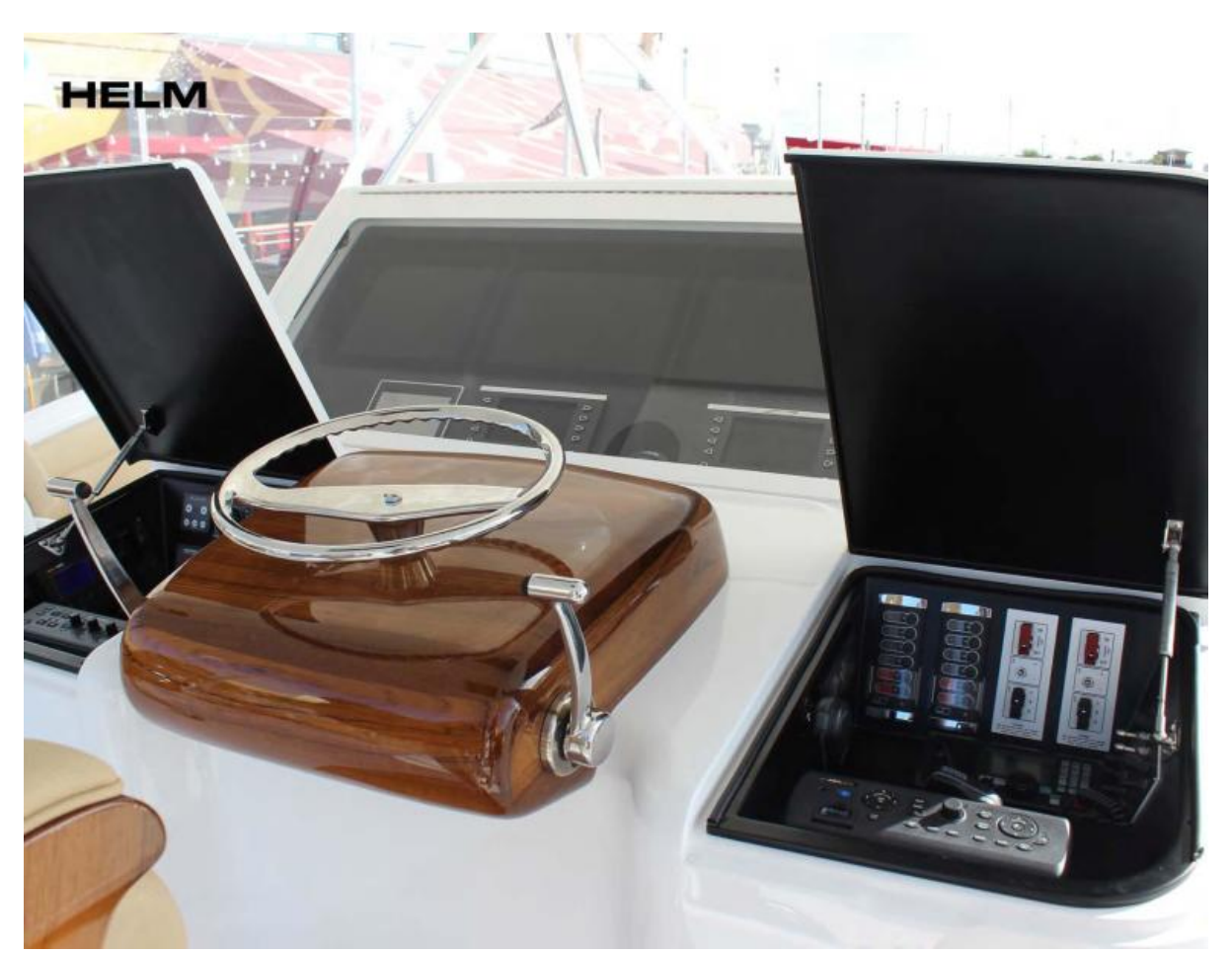
Viking 80 - Helm Station 2022 Viking 80 Convertible (sistership)