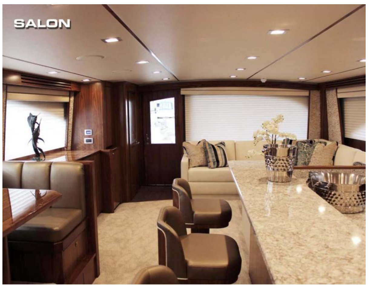
Viking 80 - Salon 2022 Viking 80 Convertible (sistership)