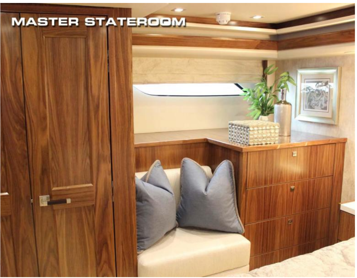
Viking 80 - Master Stateroom 2022 Viking 80 Convertible (sistership)