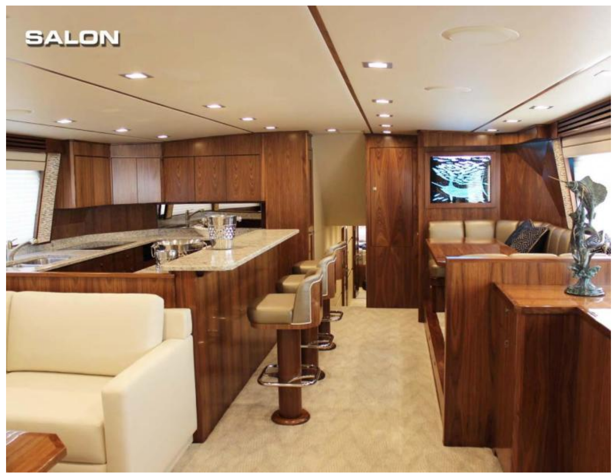
Viking 80 - Salon 2022 Viking 80 Convertible (sistership)