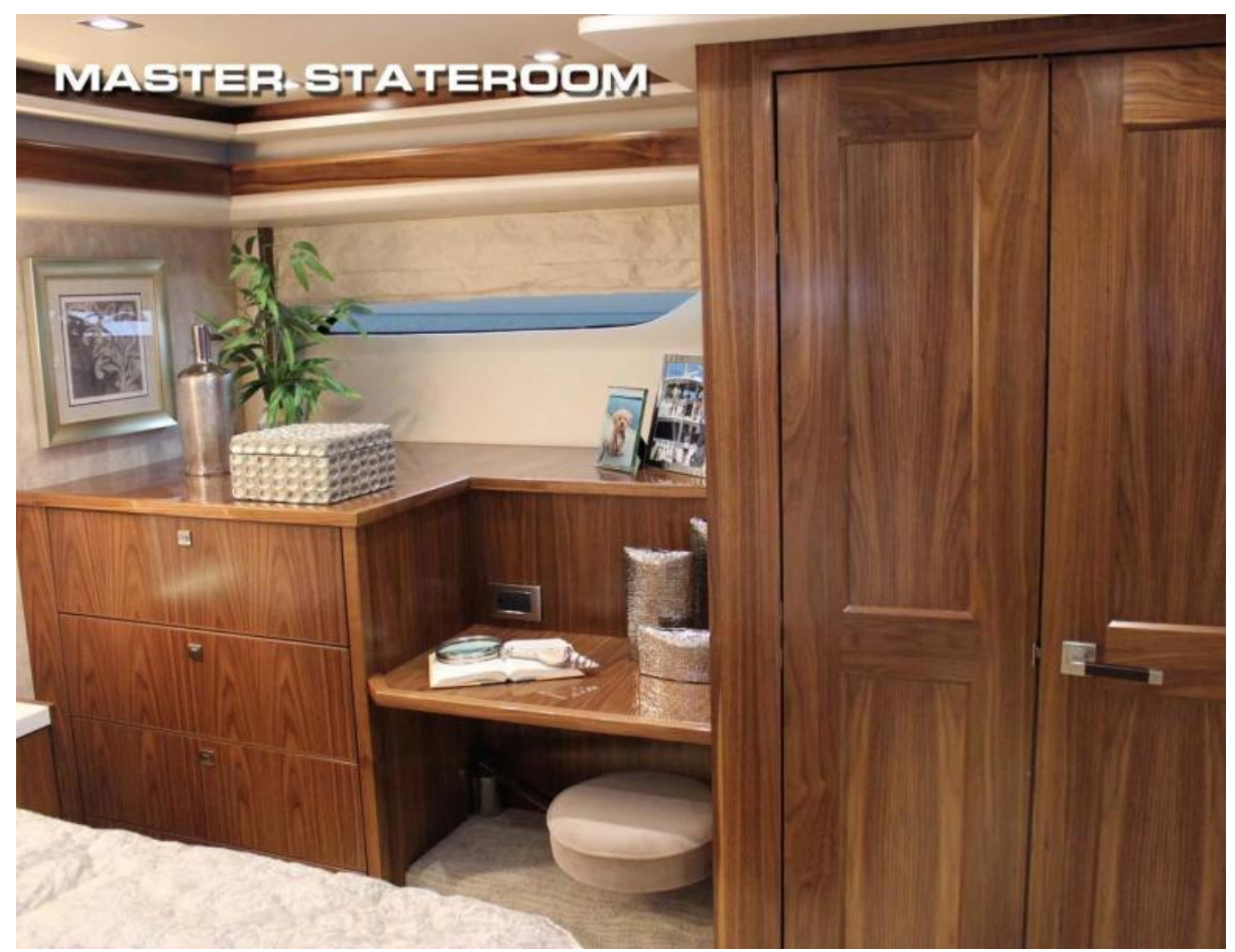
Viking 80 - Master Stateroom 2022 Viking 80 Convertible (sistership)