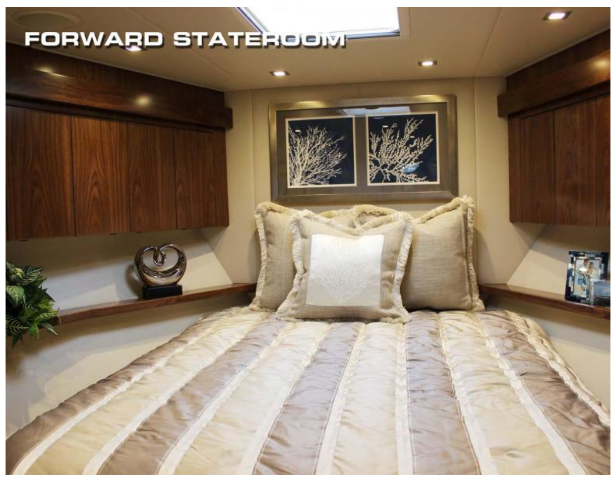
Viking 80 - Forward VIP Stateroom 2022 Viking 80 Convertible (sistership)