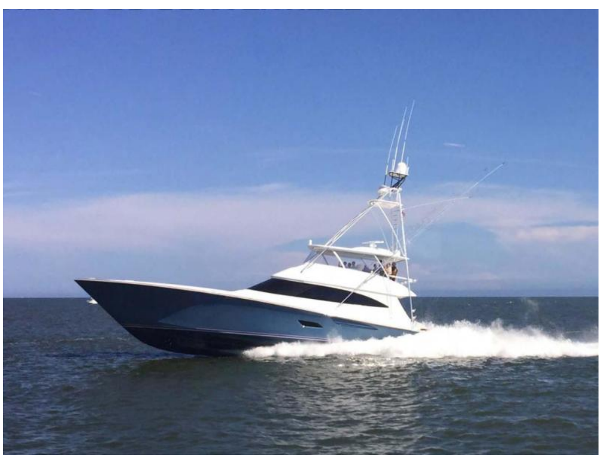
Viking 80 - Exterior Profile 2022 Viking 80 Convertible (sistership)