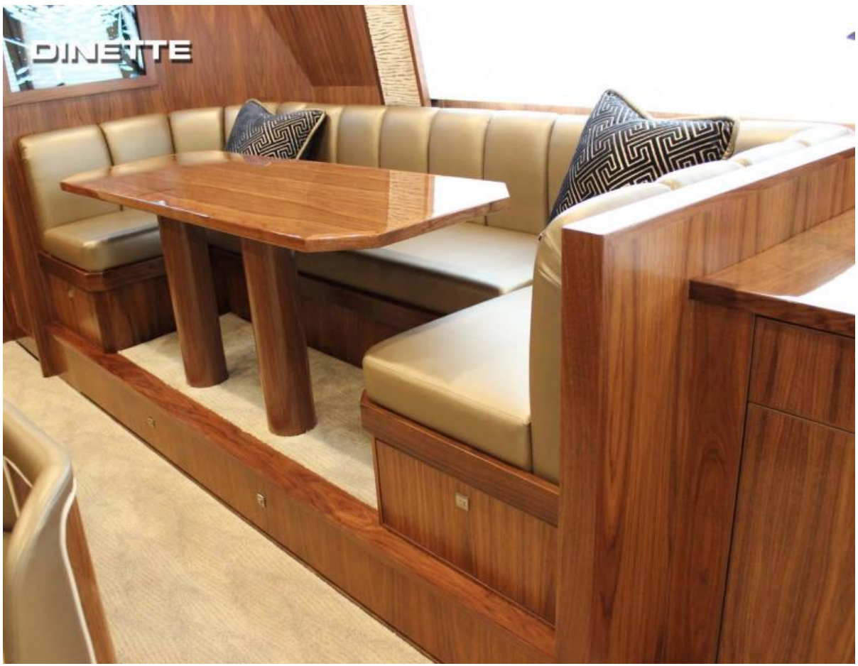
Viking 80 - Dinette 2022 Viking 80 Convertible (sistership)