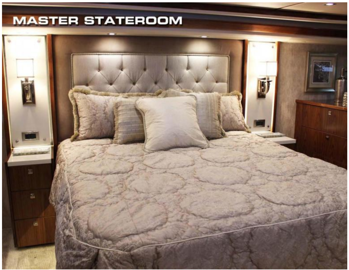
Viking 80 - Master Stateroom 2022 Viking 80 Convertible (sistership)