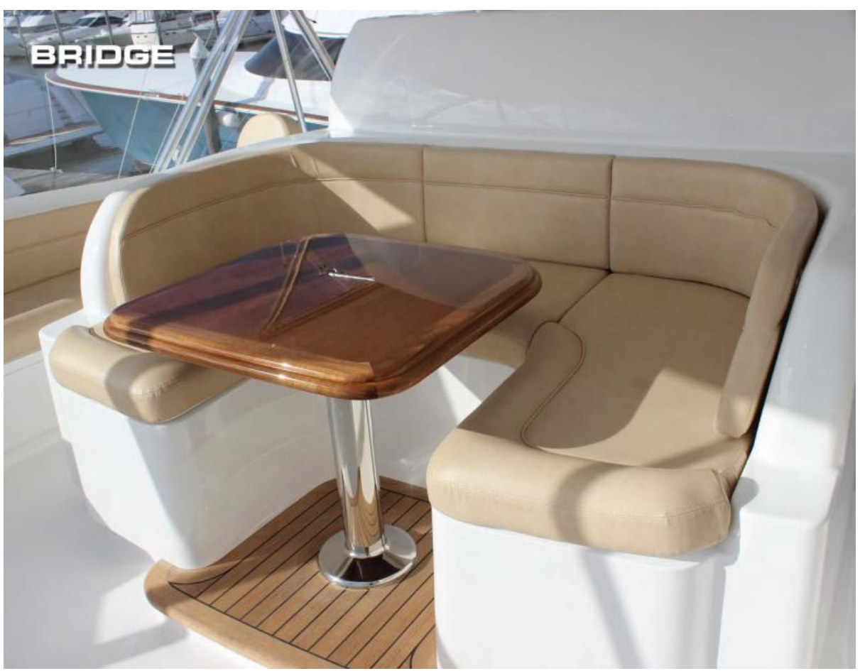
Viking 80 - Bridge 2022 Viking 80 Convertible (sistership)