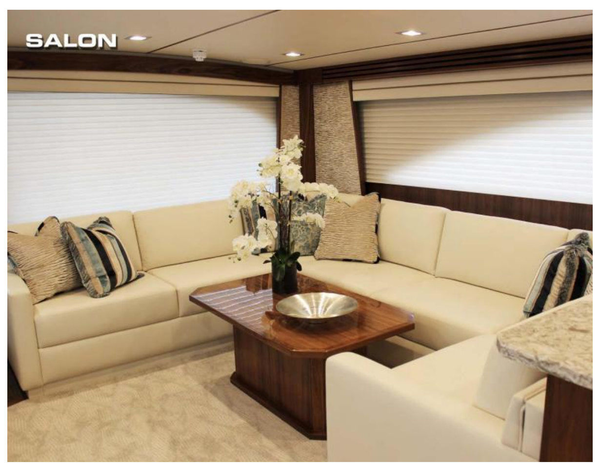
Viking 80 - Salon 2022 Viking 80 Convertible (sistership)