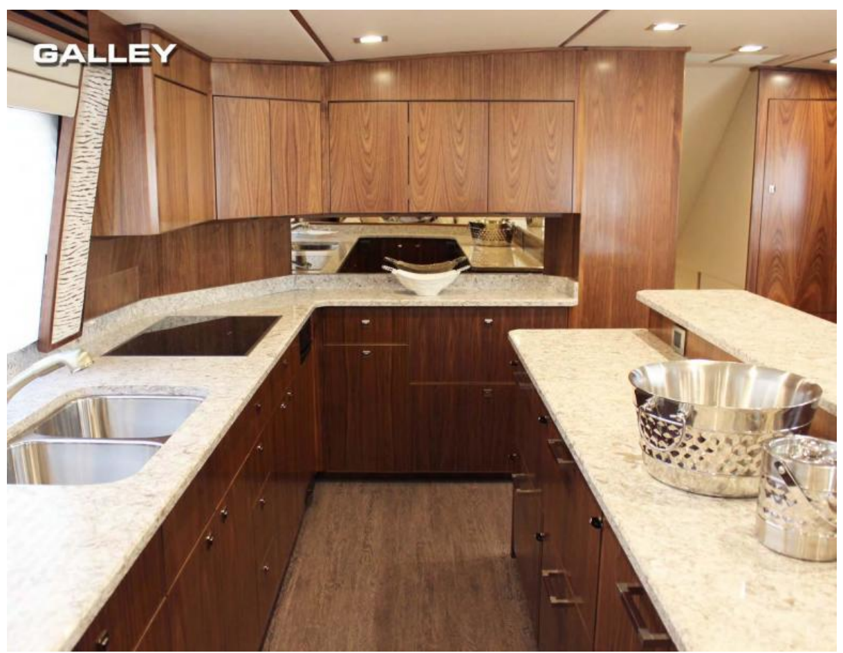
Viking 80 - Galley 2022 Viking 80 Convertible (sistership)