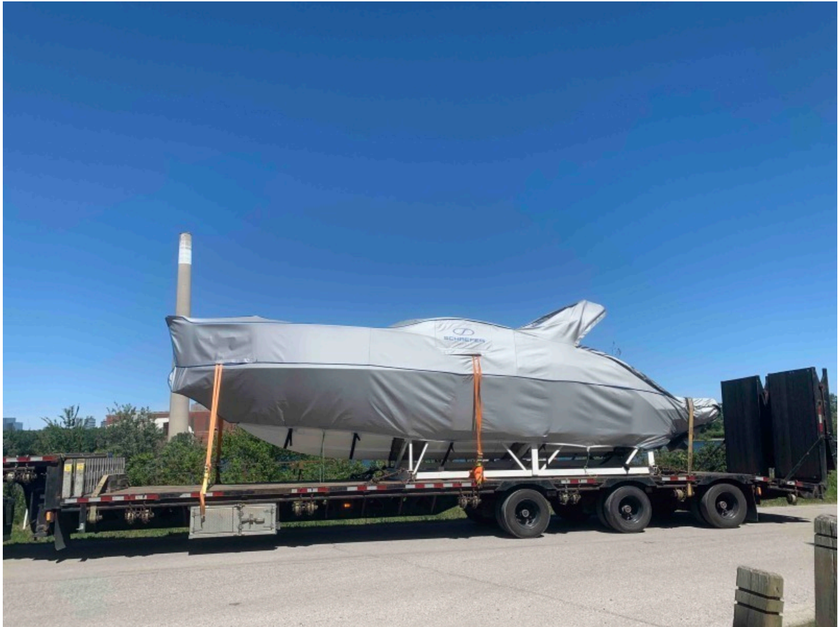
Winter Cover and Cradle