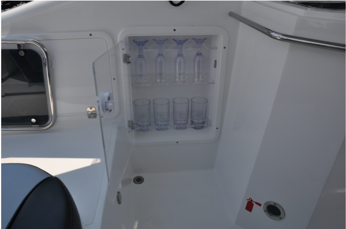
Schaefer 303 Custom Schaefer Yachts branded glasses for you and your guests.