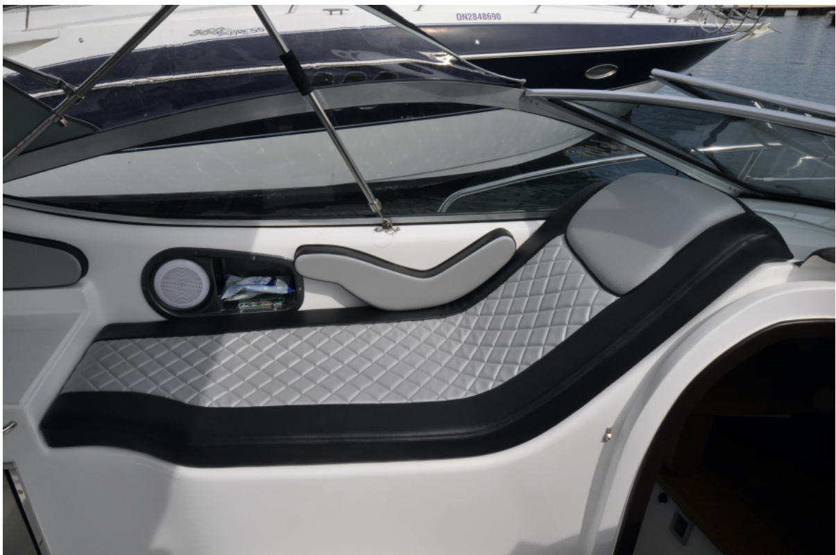
Schaefer 303 The "Cleopatra" seat perfect for lounging while cruising