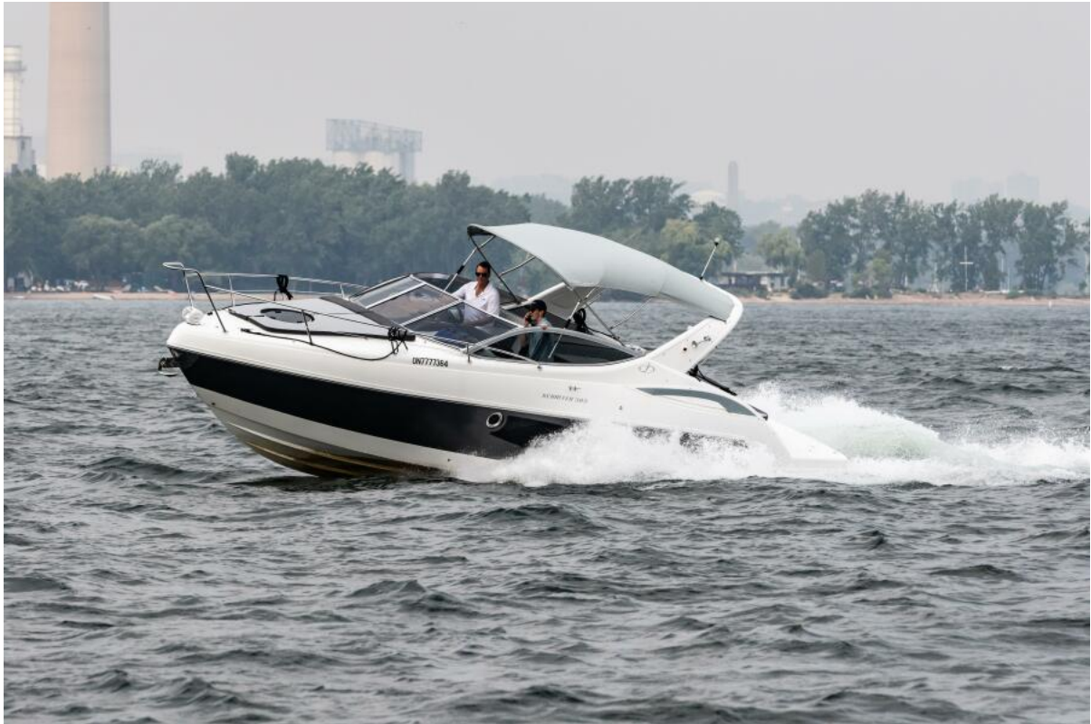
Schaefer 303 Cover from Power Boating Canada Magazine