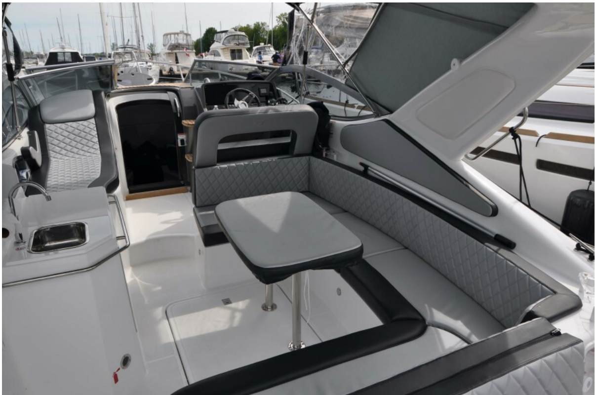
Schaefer 303 Perfect space to entertain and enjoy time with friends and family.