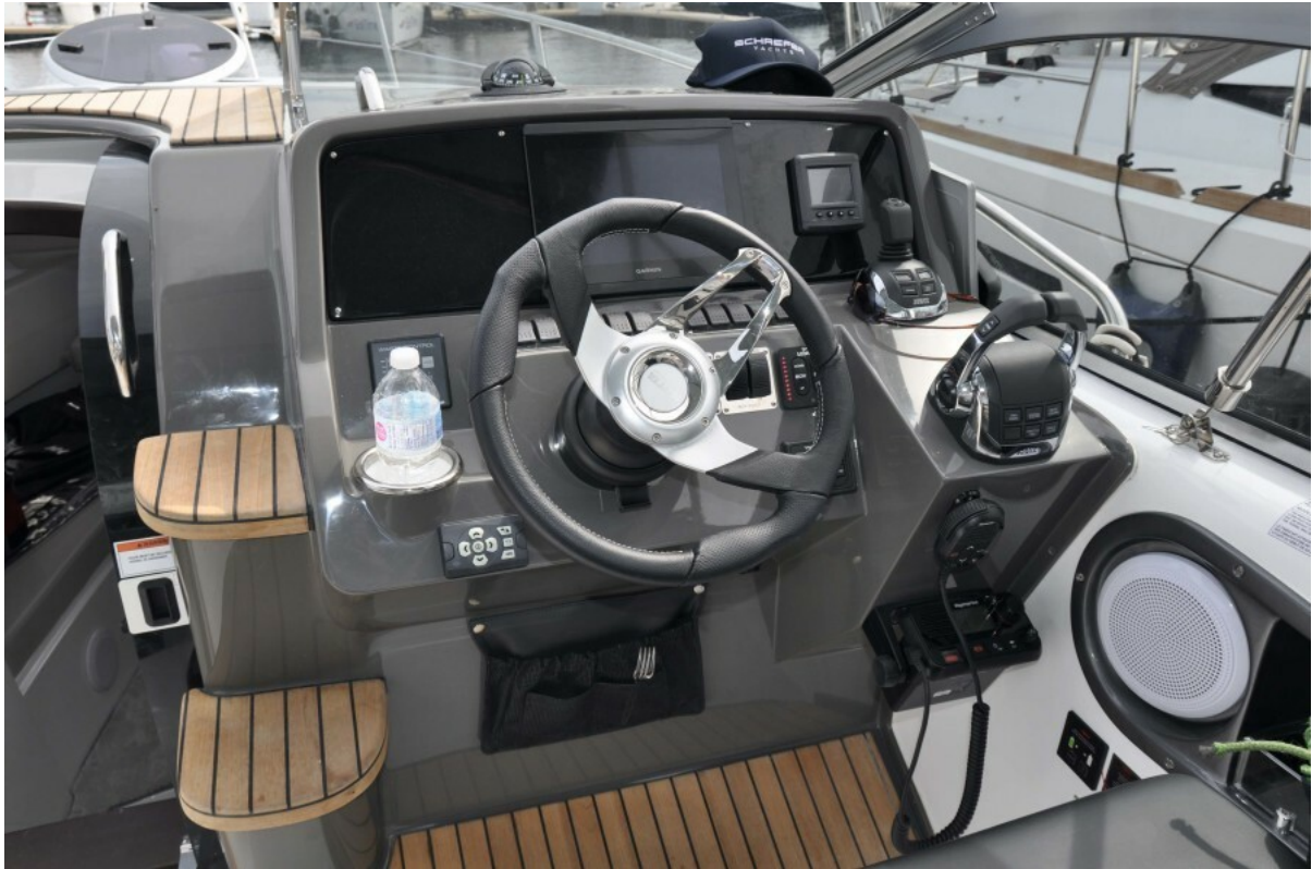
Schaefer 303 Helm Station equipped with Volvo Penta Glass Cockpit and Joystick Docking