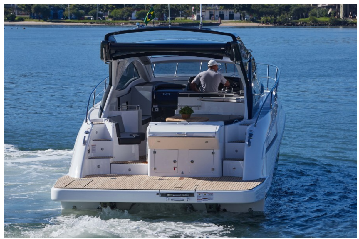
Schaefer Yacht 400 Stying Featuring a bold but elegant look with aesthetically modernistic lines