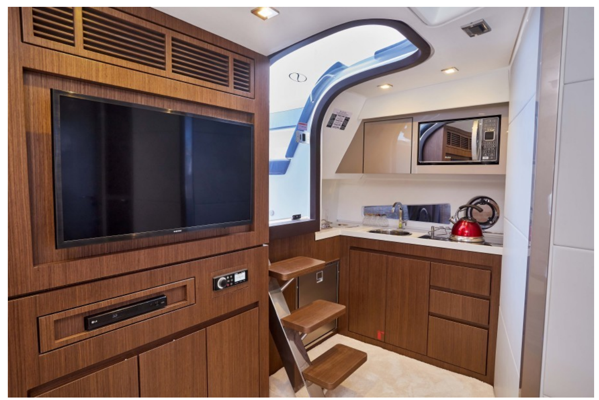
Full Galley Several finishes available as well as some custom selections are available