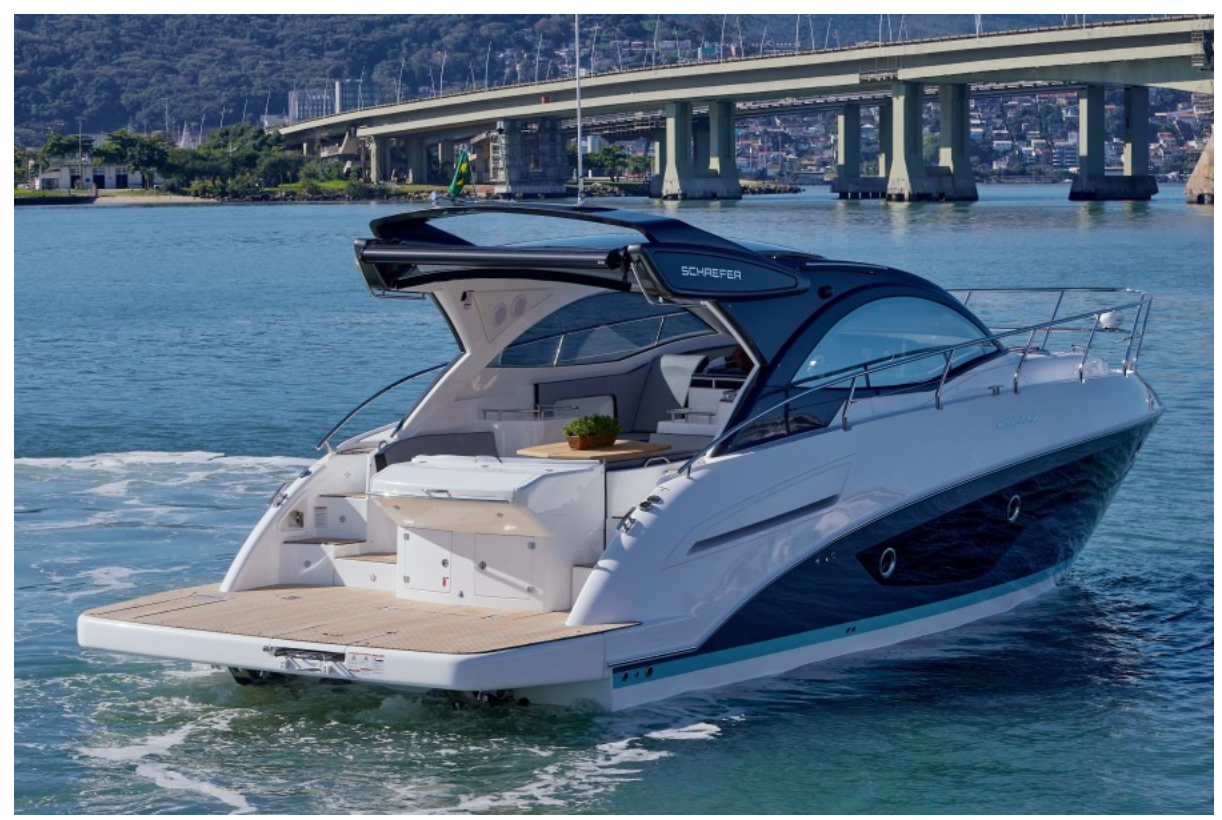
Schaefer 400 Sport Bold new hull design and Glass Cockpit