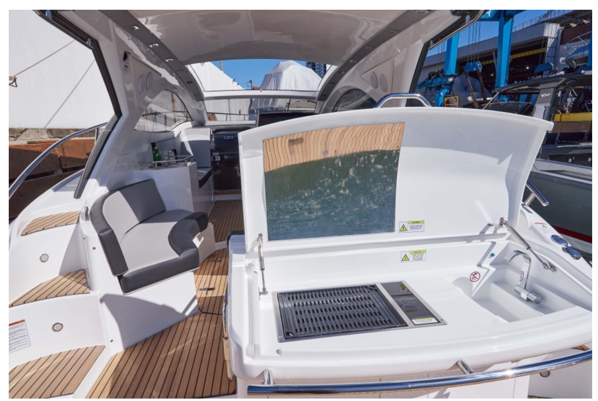
Great for entertainingr the aft BBQ and wet bar are easy access