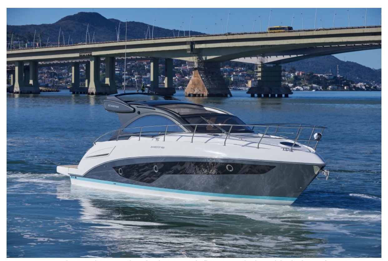
Many engine options Schaefer boats redefine superiority with their performance