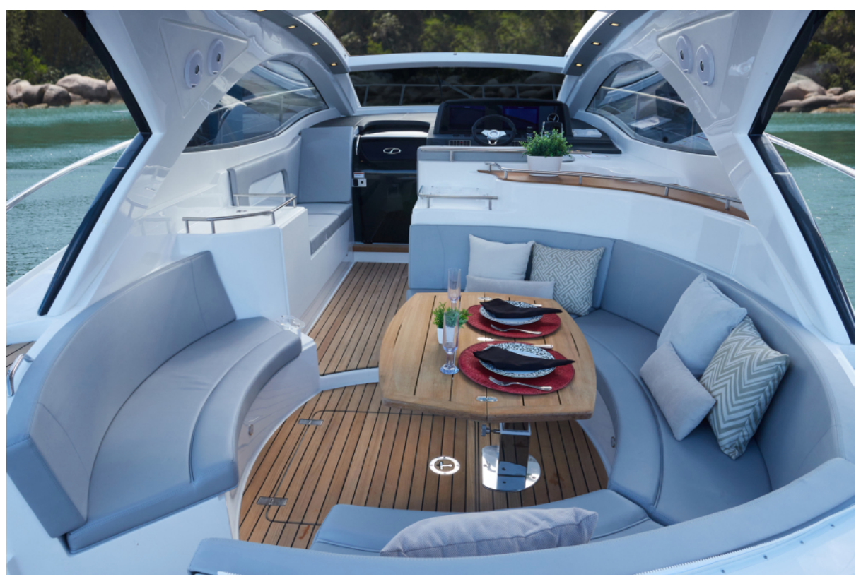
Luxurious Cockpit Fusion AV Entertainment system