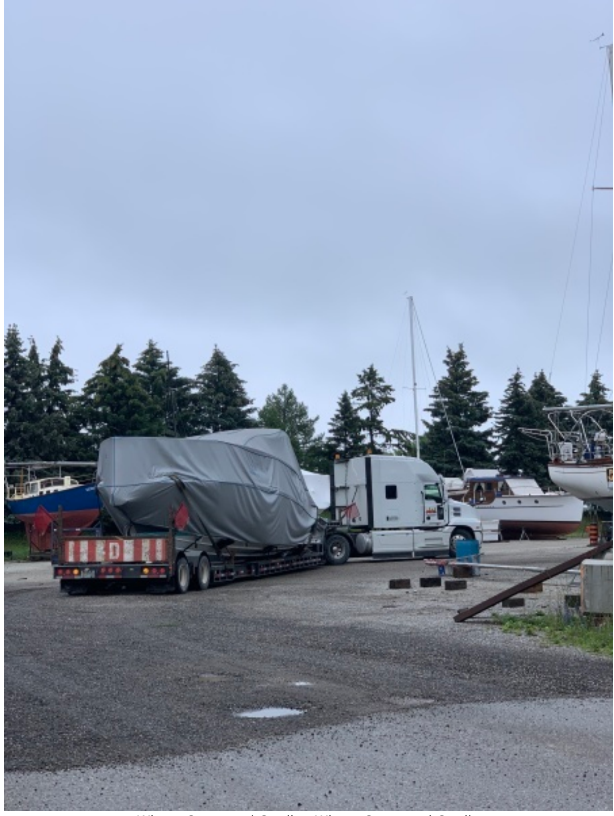
Winter Cover and Cradle Winter Cover and Cradle