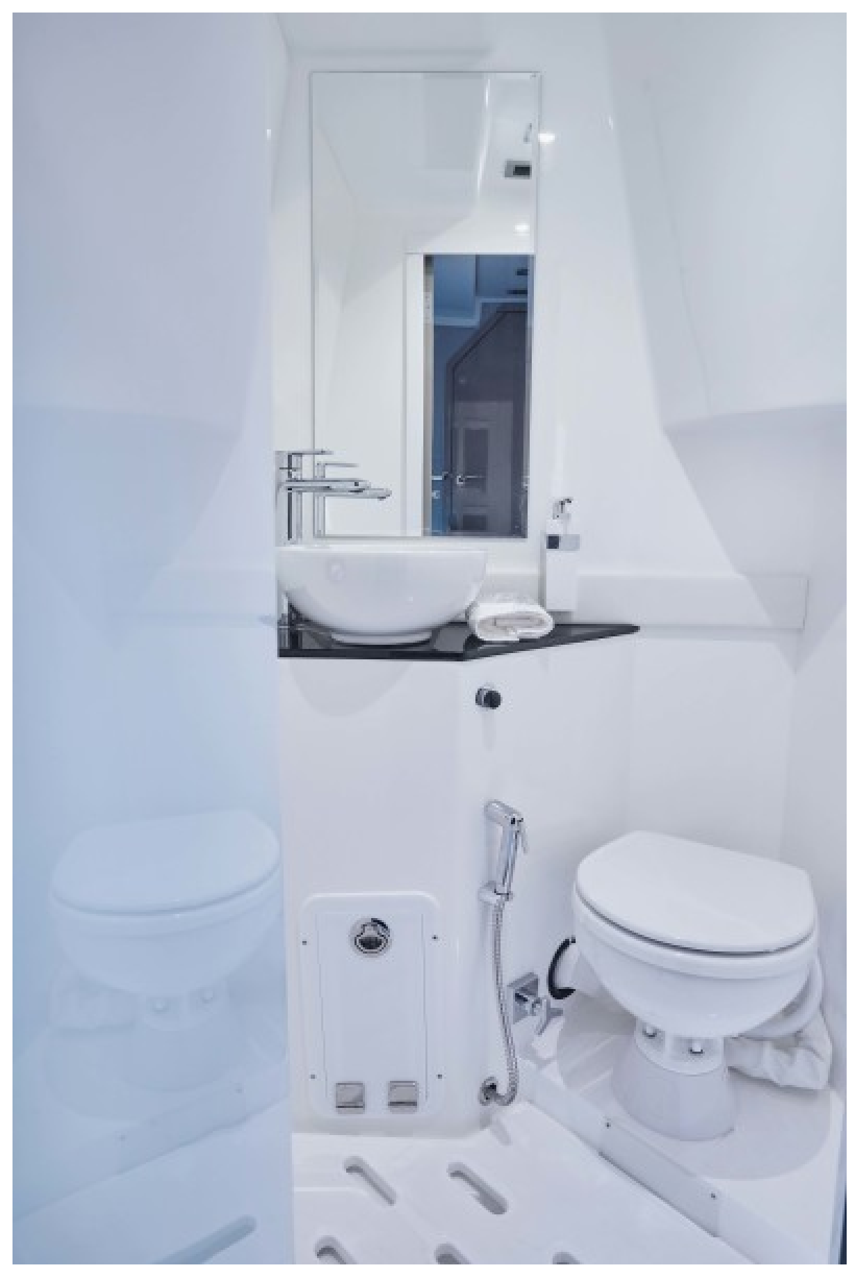
Ensuite bath Enclosed shower and quality fittings throughout