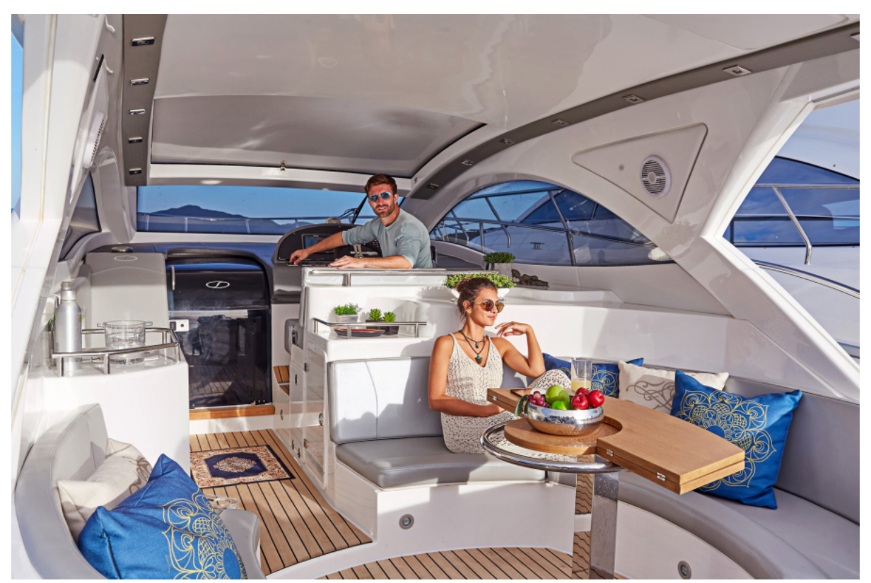
Luxurious Finishes Folding teak cockpit table is convertable.