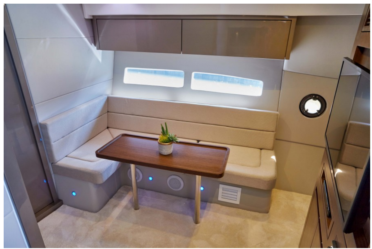
Salon seating More fabric, wall and floor finishes for 2021