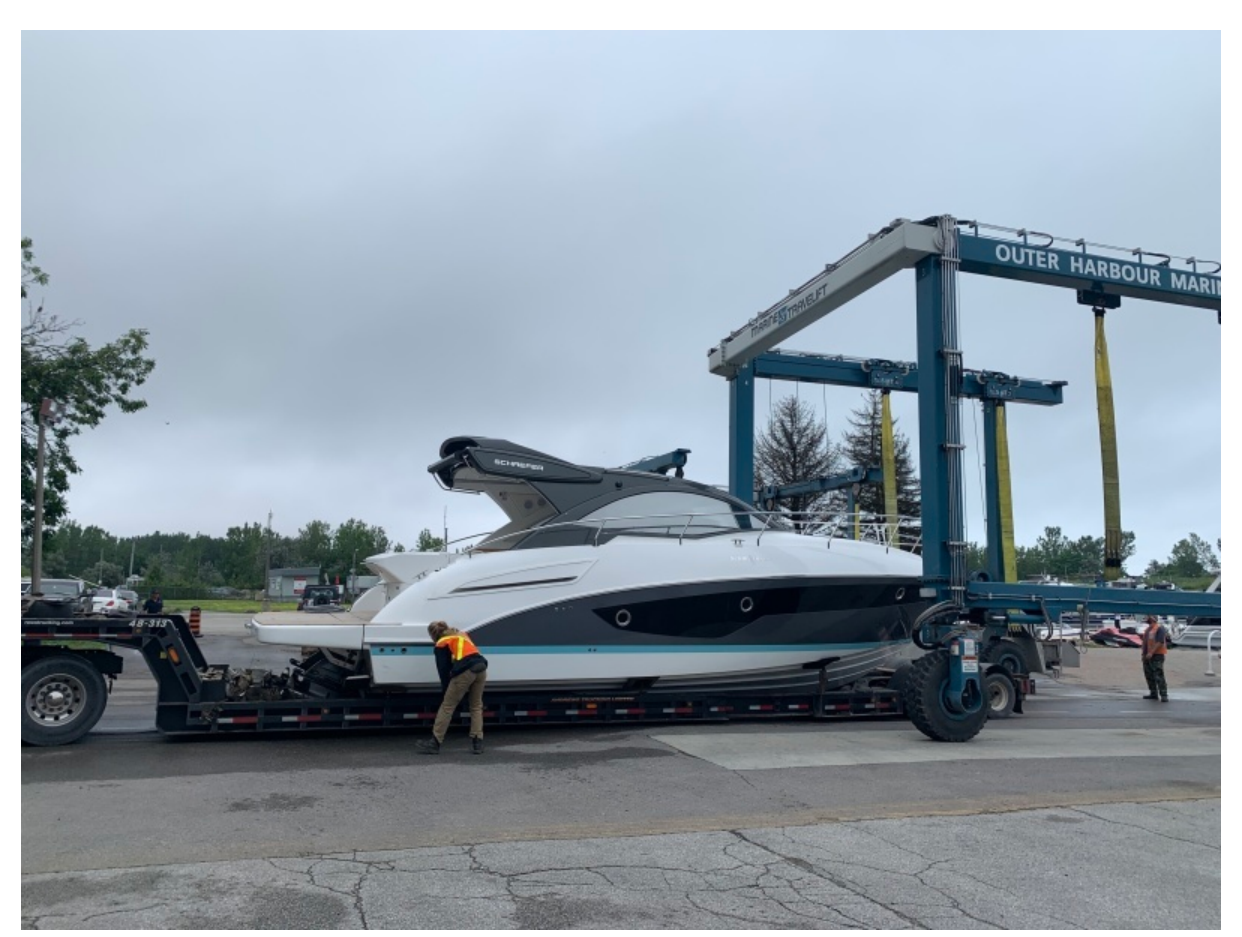
Ready for Launch