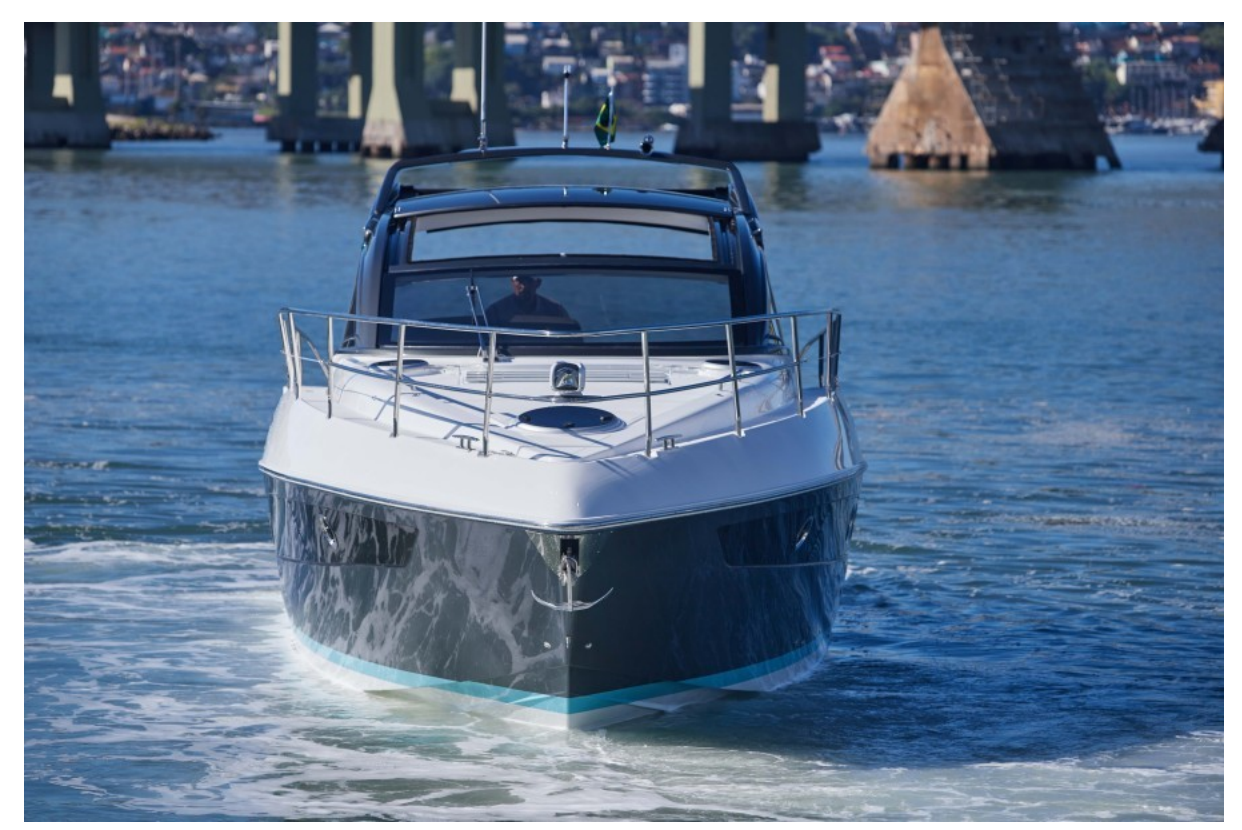
Retractable Power Sunroof Take in the sun from above with the incredible sunroof