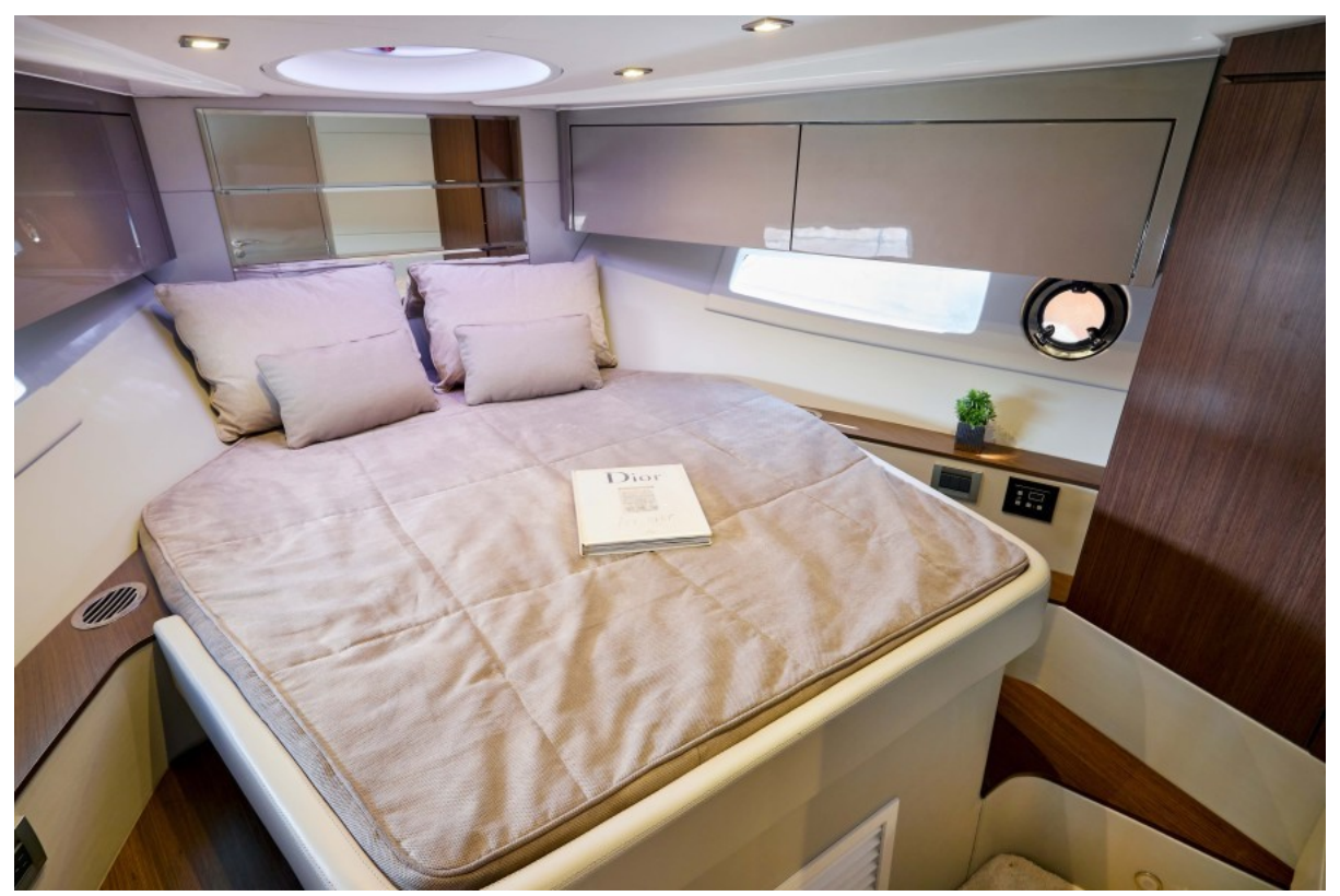
More fabric, wall and floor finishes for 2021 Full beam width with private ensuite toilet shower