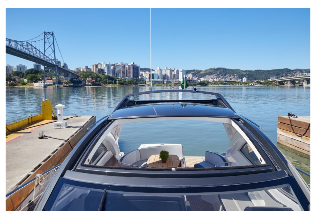
Retractable Power Sunroof Take in the sun from above with the incredible sunroof