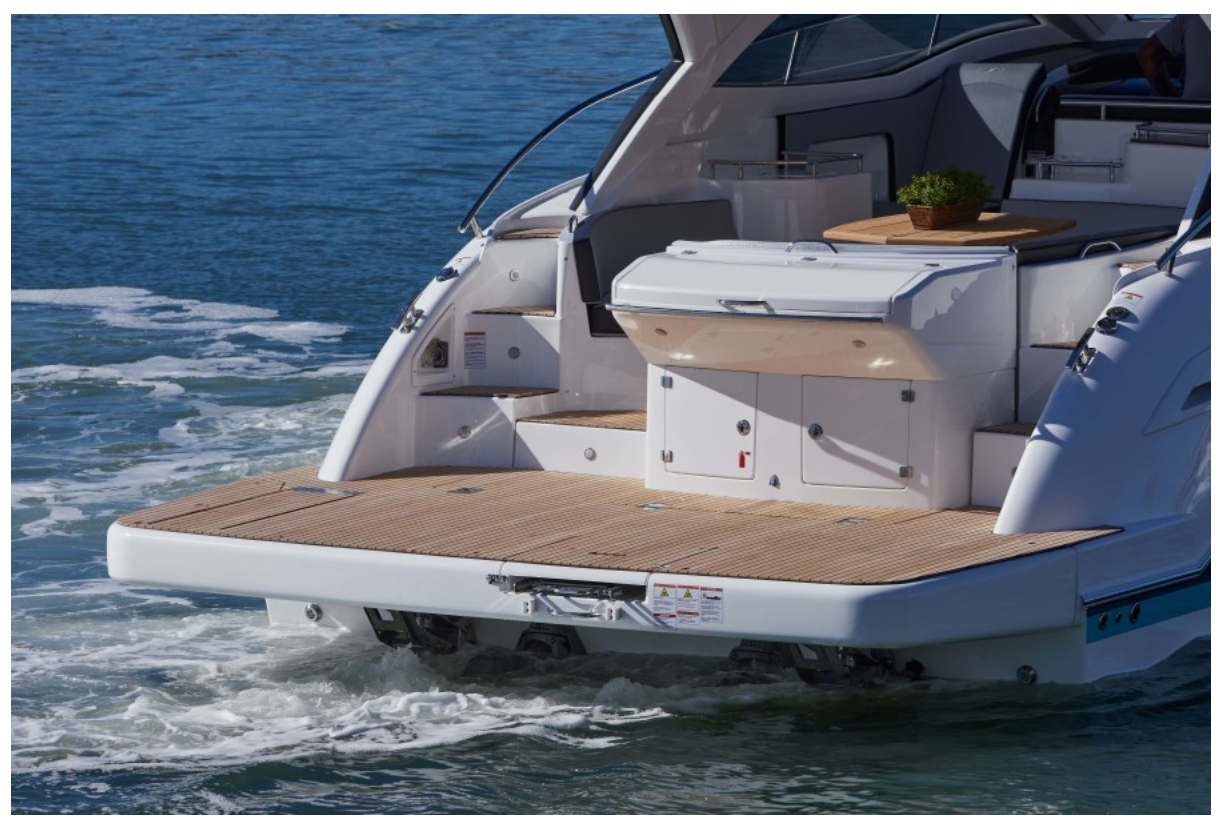
Swim Platform Large hydraulic swim platform is available with disappearing steps