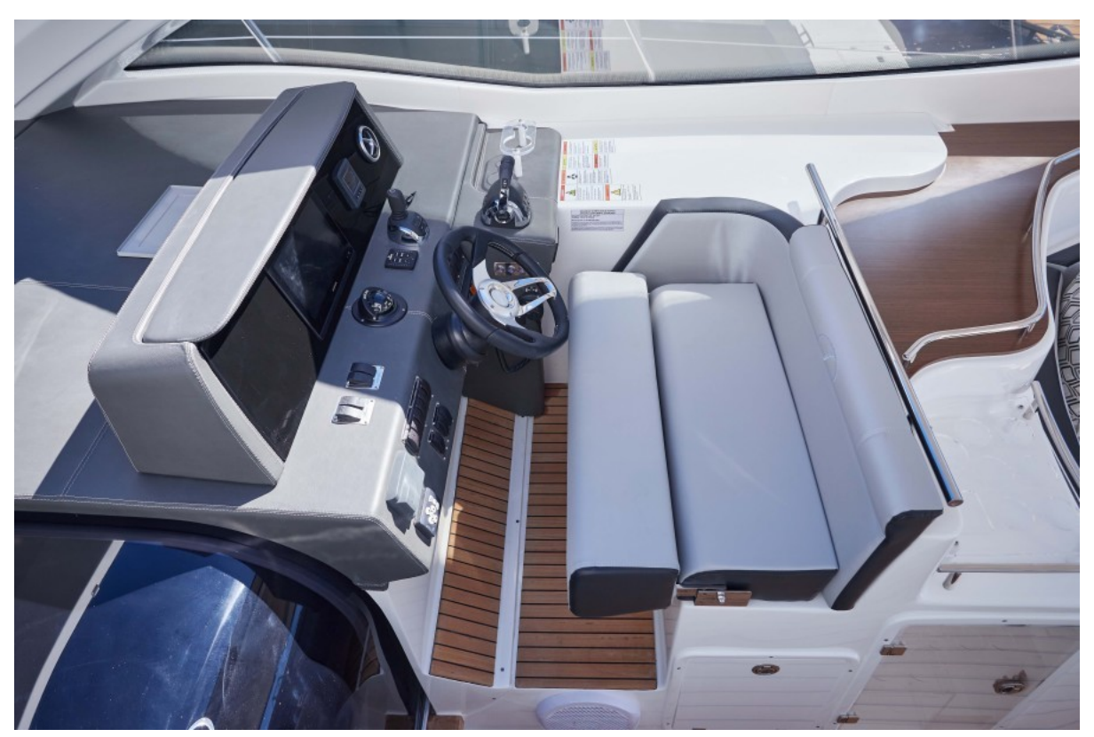
Schaefer 400 Helm Station Take in the sun from above with the incredible sunroof