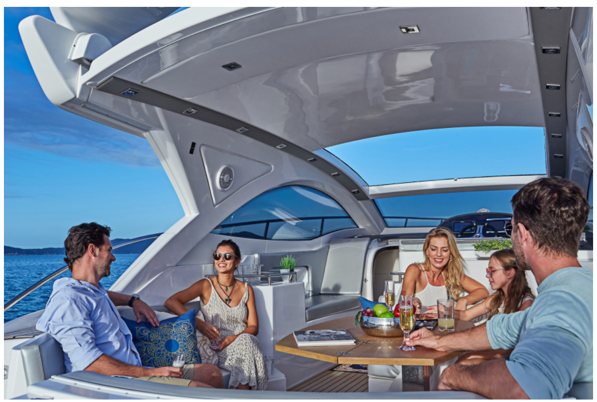
Spacious and comfortable Guest capacity is 14