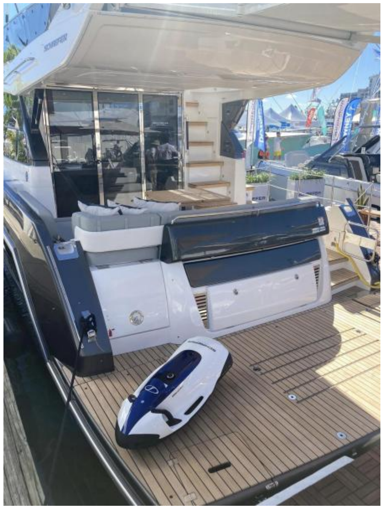
FLIBS 2022 Schaefer 450 on Display at the 2022 Fort Lauderdale International Boat Show