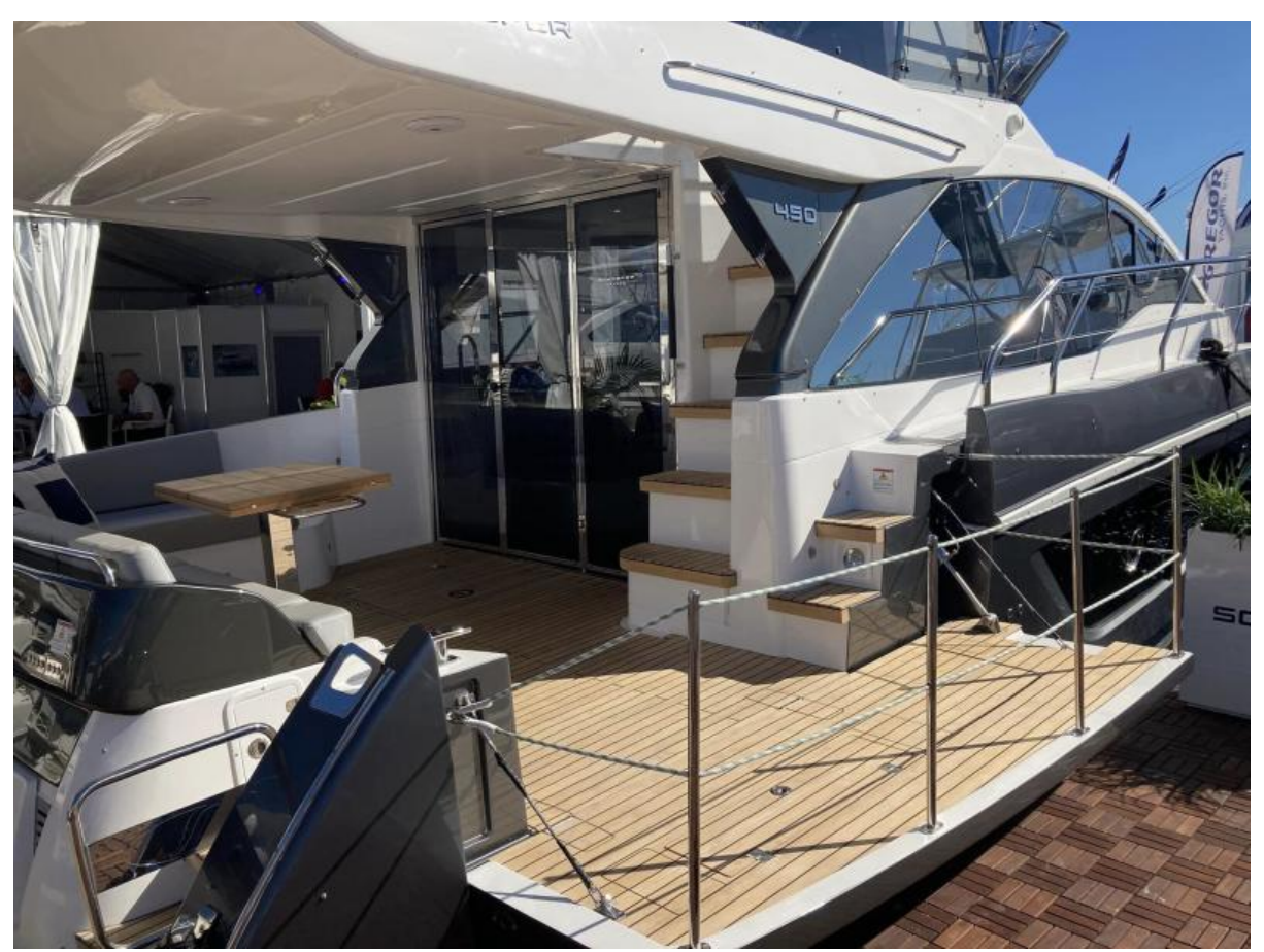
FLIBS 2022 Schaefer 450 on Display at the 2022 Fort Lauderdale International Boat Show