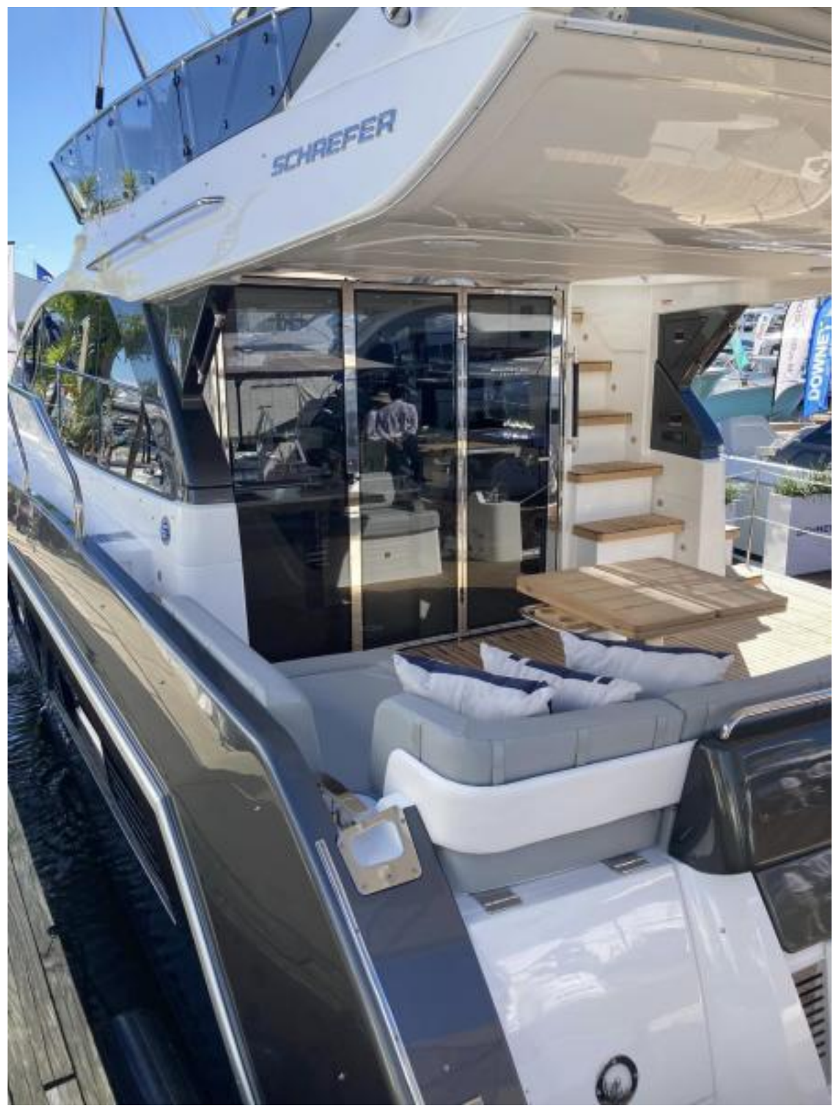
FLIBS 2022 Schaefer 450 on Display at the 2022 Fort Lauderdale International Boat Show