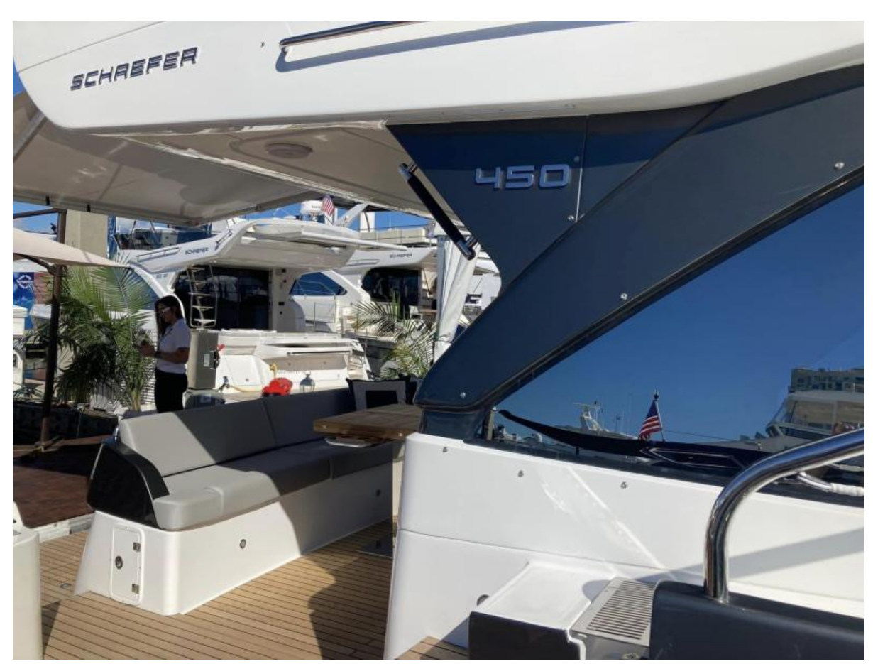
FLIBS 2022 Schaefer 450 on Display at the 2022 Fort Lauderdale International Boat Show