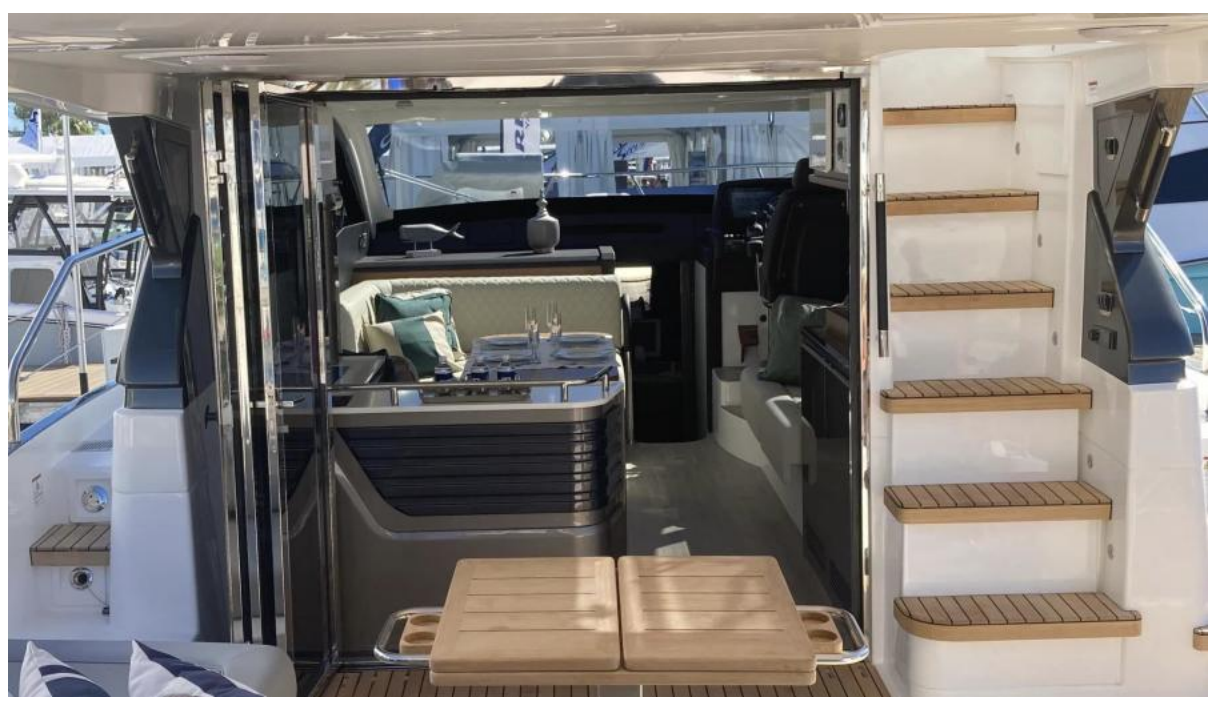
FLIBS 2022 Schaefer 450 on Display at the 2022 Fort Lauderdale International Boat Show