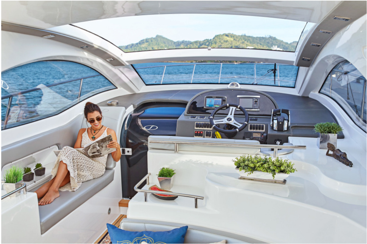
Relax in Comfort