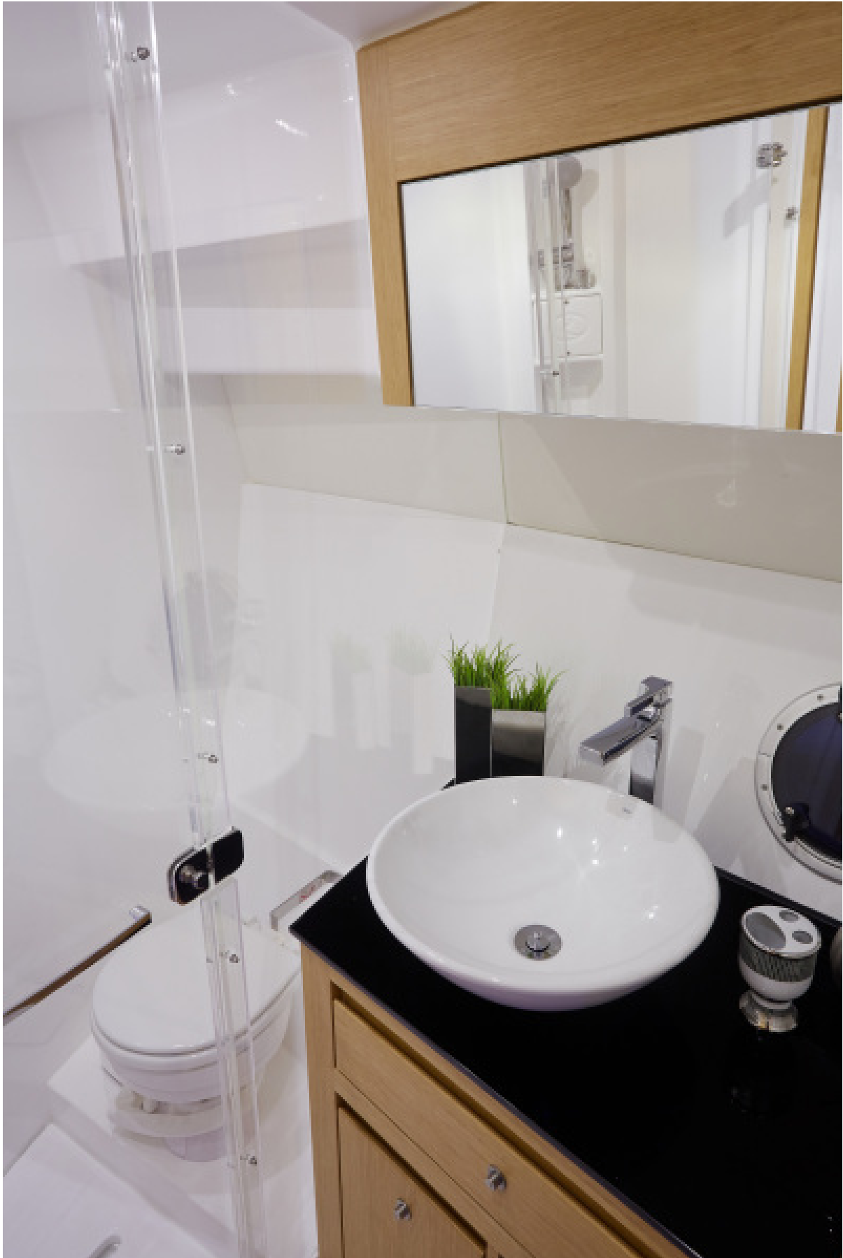
Ensuite bath Enclosed shower and quality fittings throughout