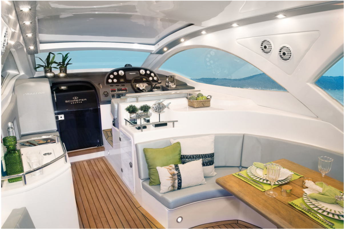
Schaefer 400 cockpit Advanced Raymarine GPS, plotter, sonar, VHF electronics