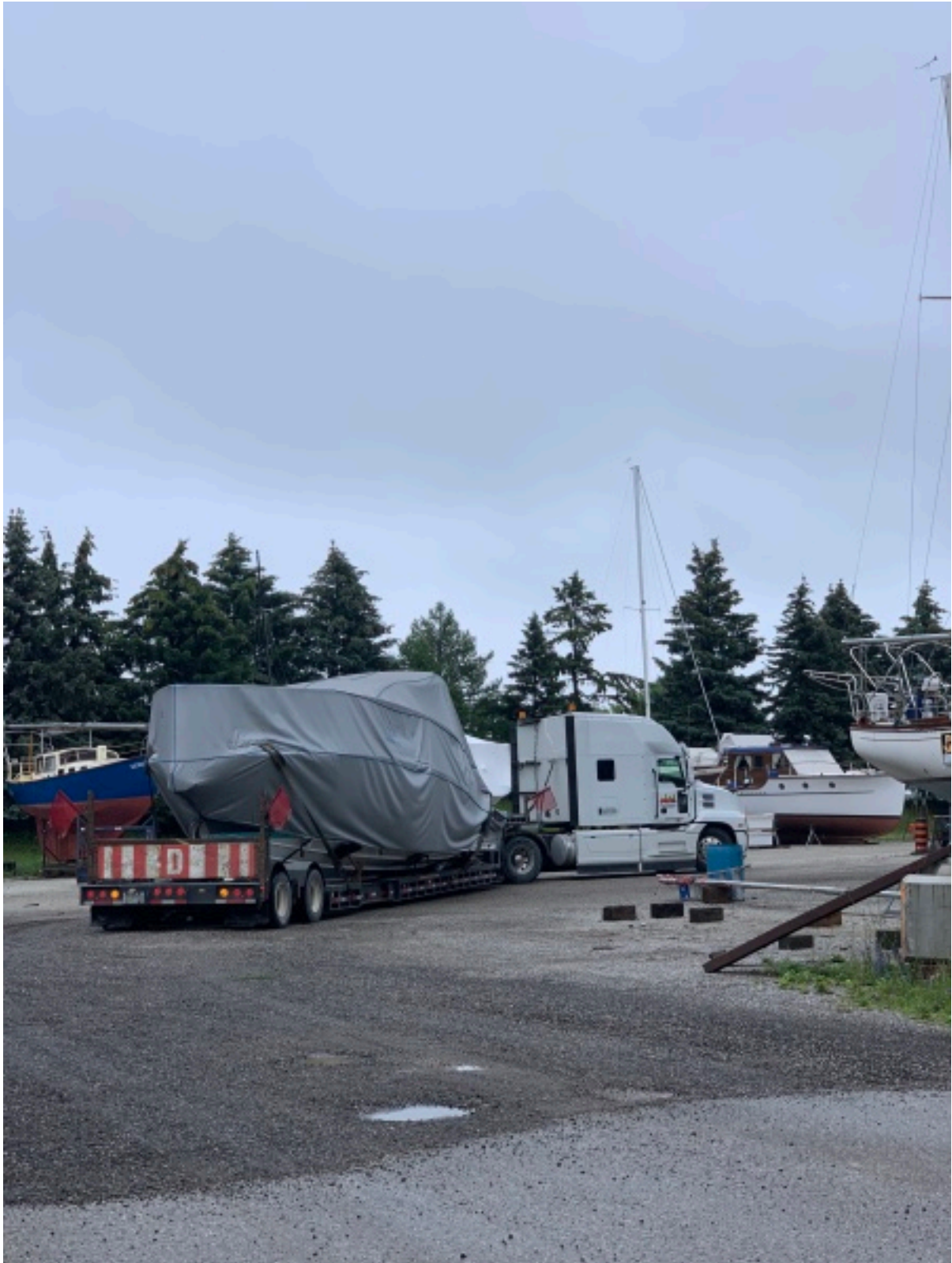
Winter Cover and Cradle Winter Cover and Cradle