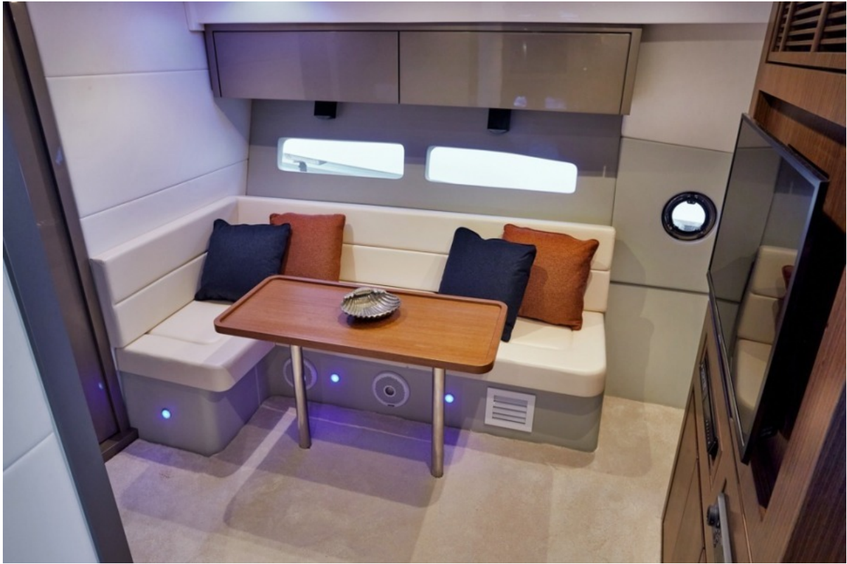
Salon seating More fabric, wall and floor finishes for 2021