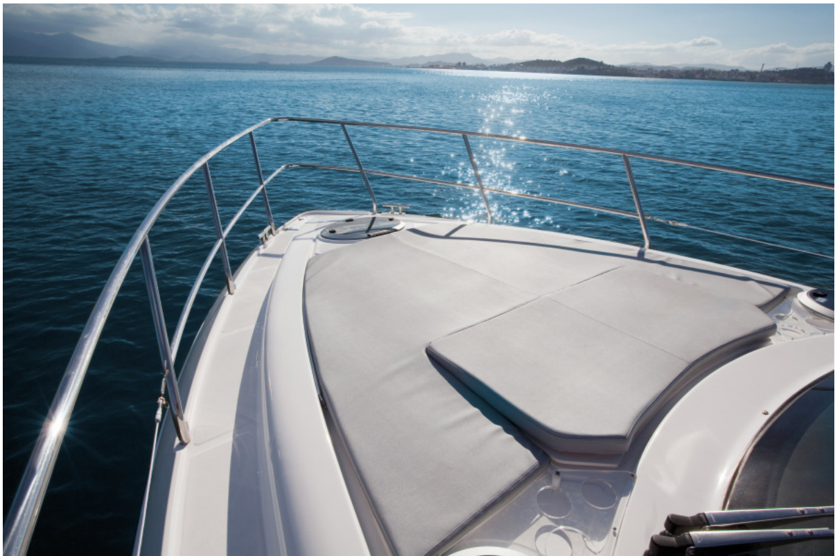
Front Deck 400 Sport Outboard