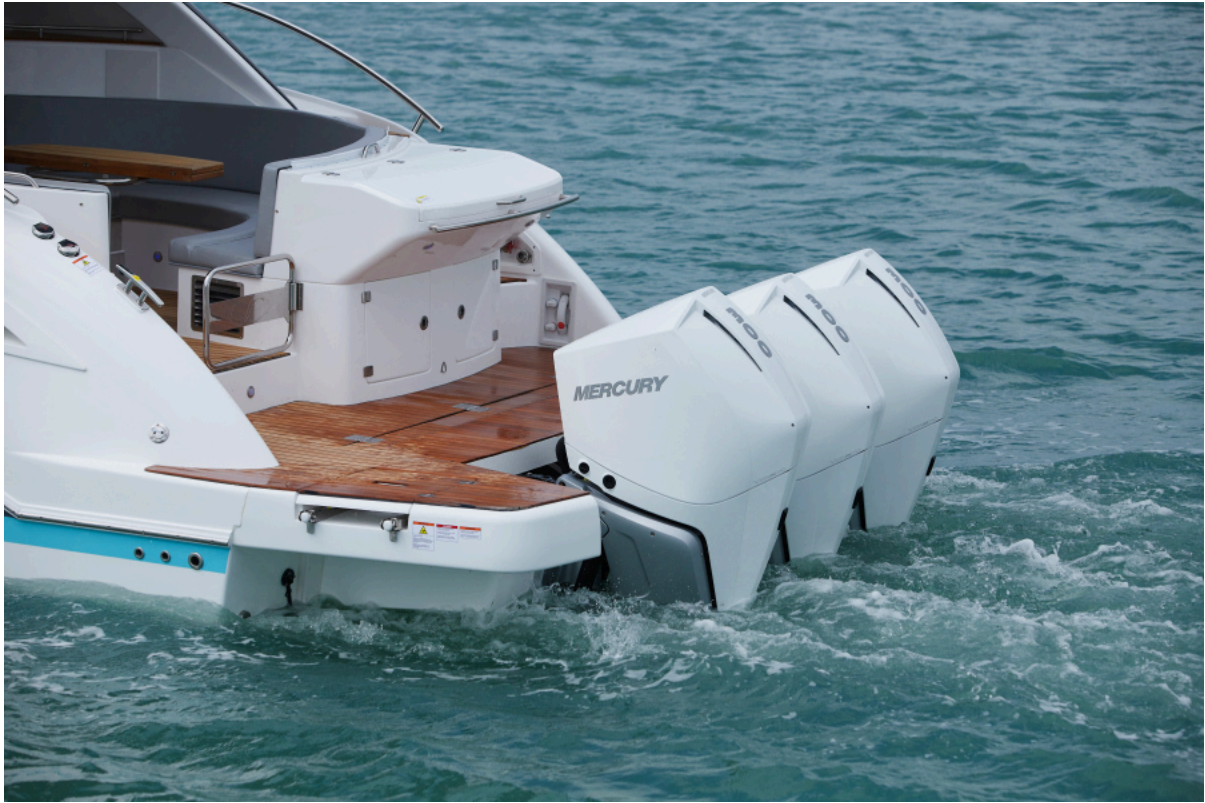
Schaefer Yachts 400 Sport Outboard