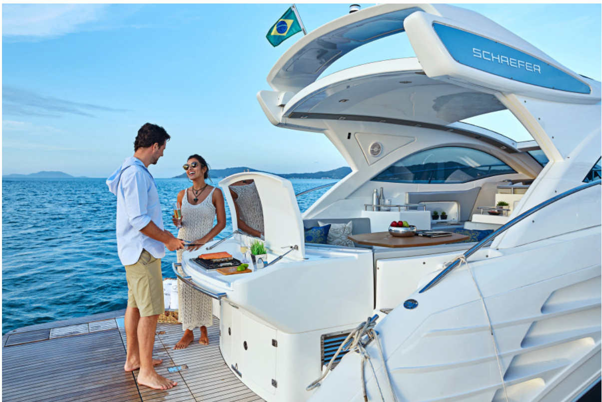
Great for entertaining the aft BBQ and wet bar are easy access