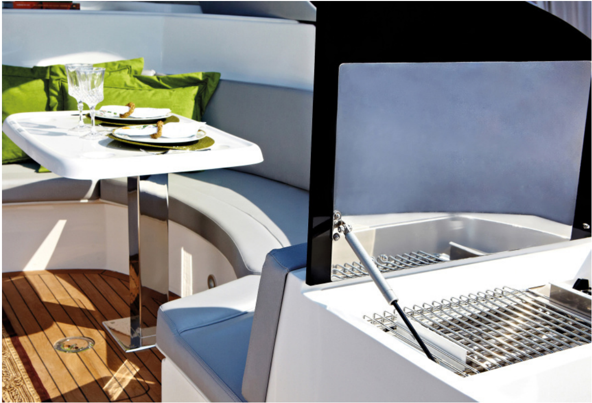
Electric BBQ Your gourmet prep centre off the swim platform