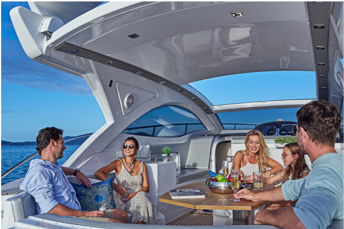
Spacious and comfortable Guest capacity is 14