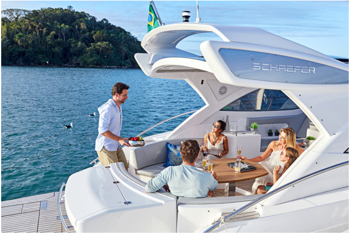
Swim Platform Large hydraulic swim platform is available with disappearing steps