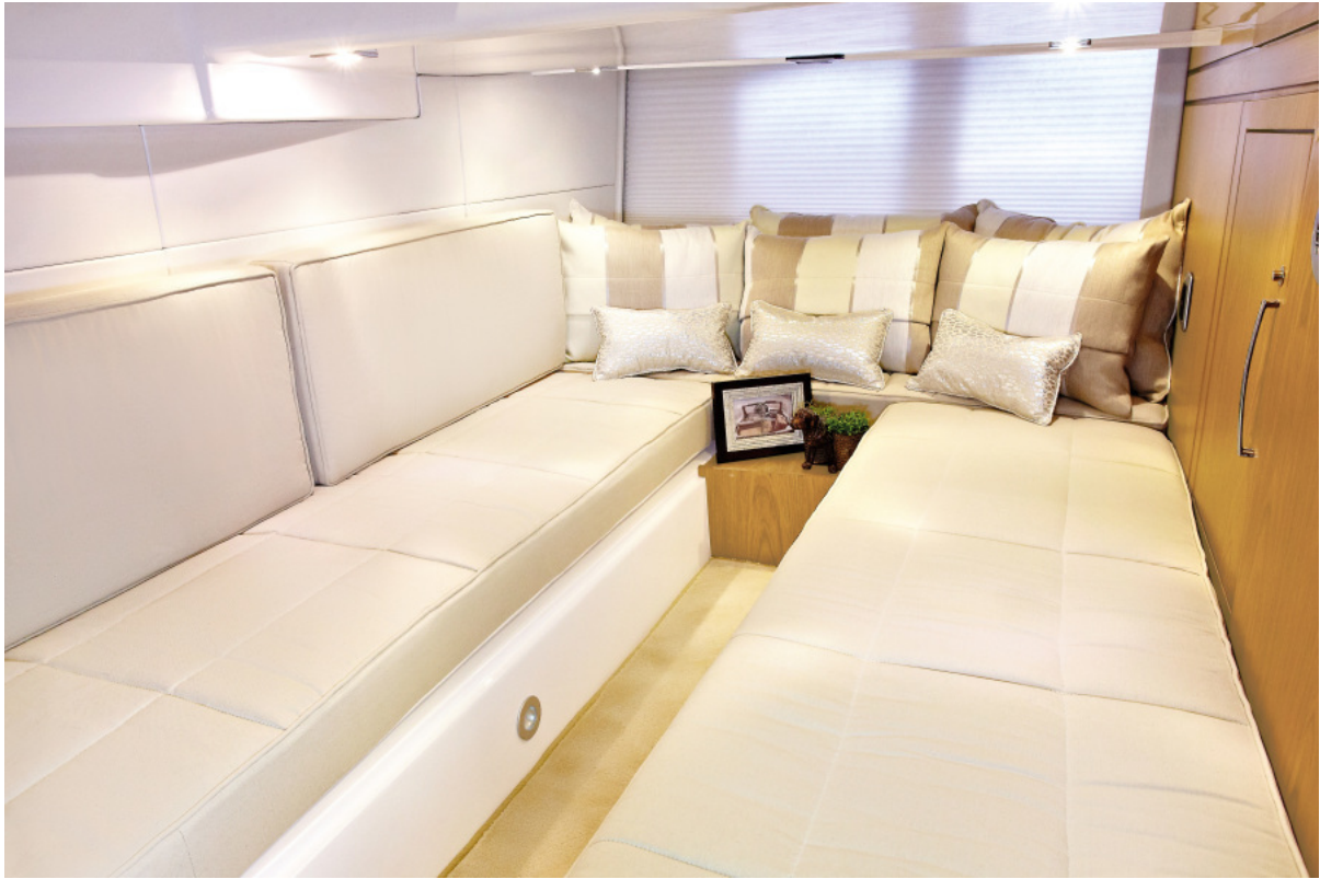
VIP cabin Full beam width with windows. Has private ensuite shower / toilet .