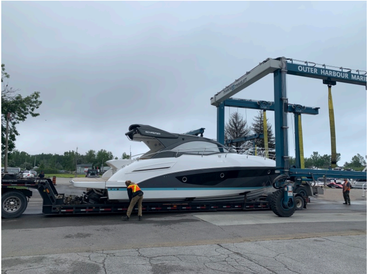
Ready for Launch