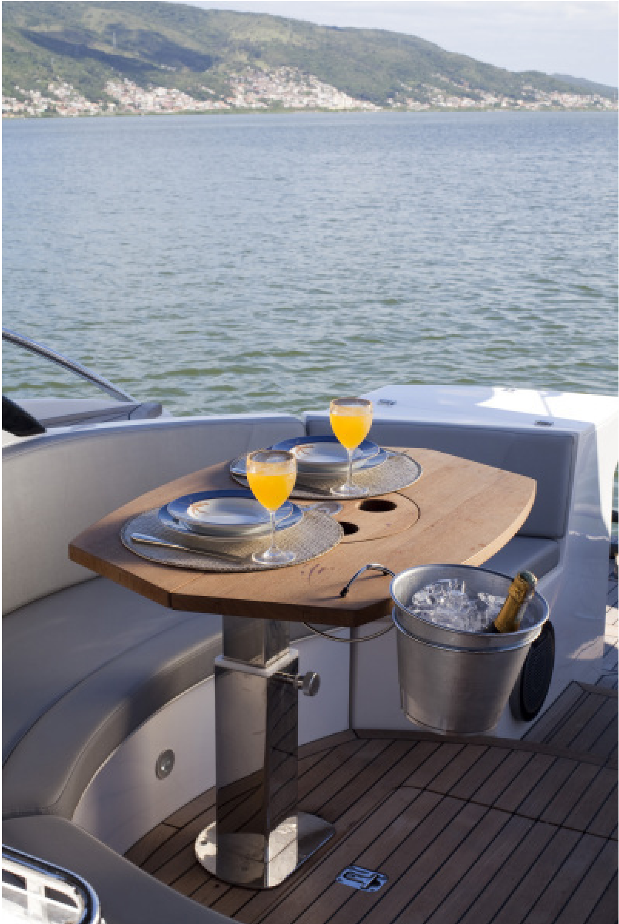
Luxurious Finishes Folding teak cockpit table is convertible.