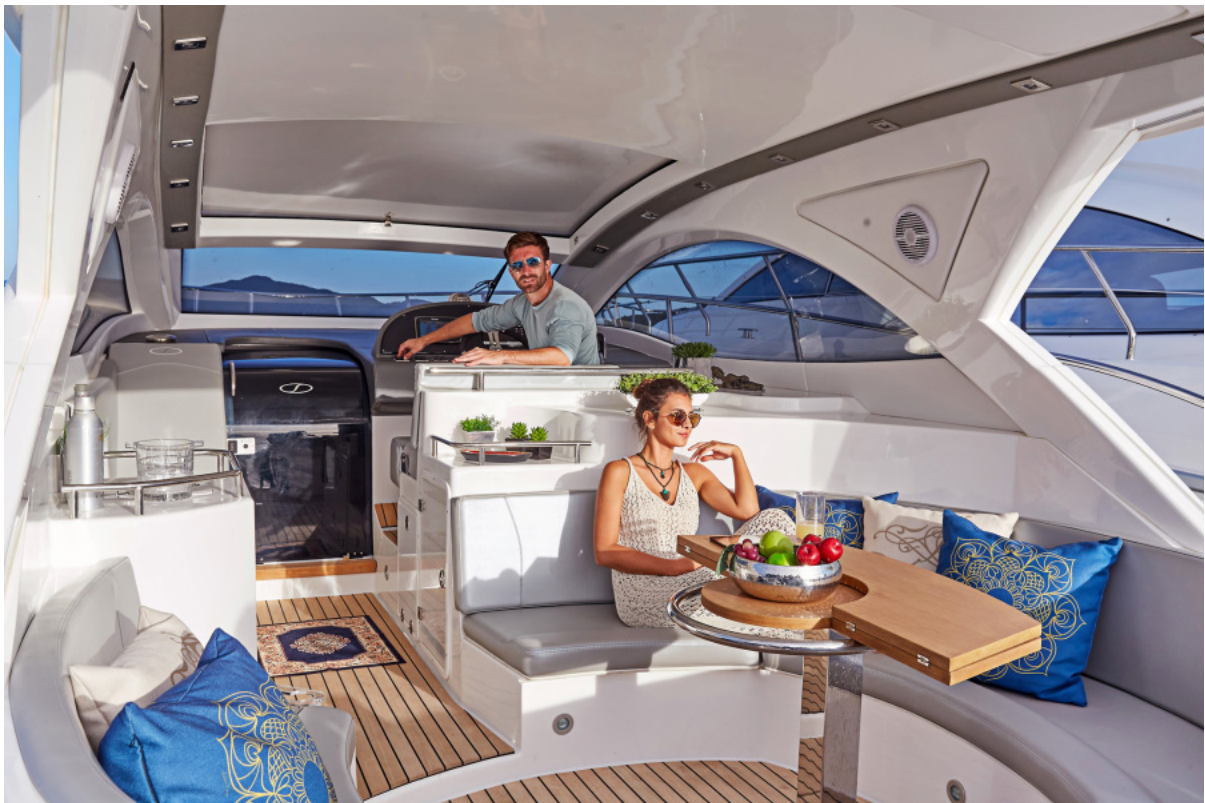
Luxurious Cockpit Fusion AV Entertainment system