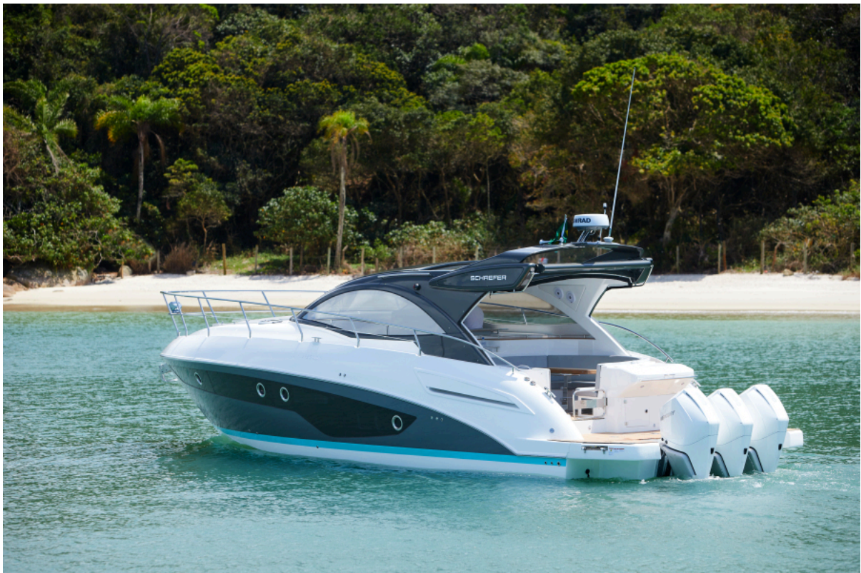
Schaefer Yachts 400 Sport Outboard