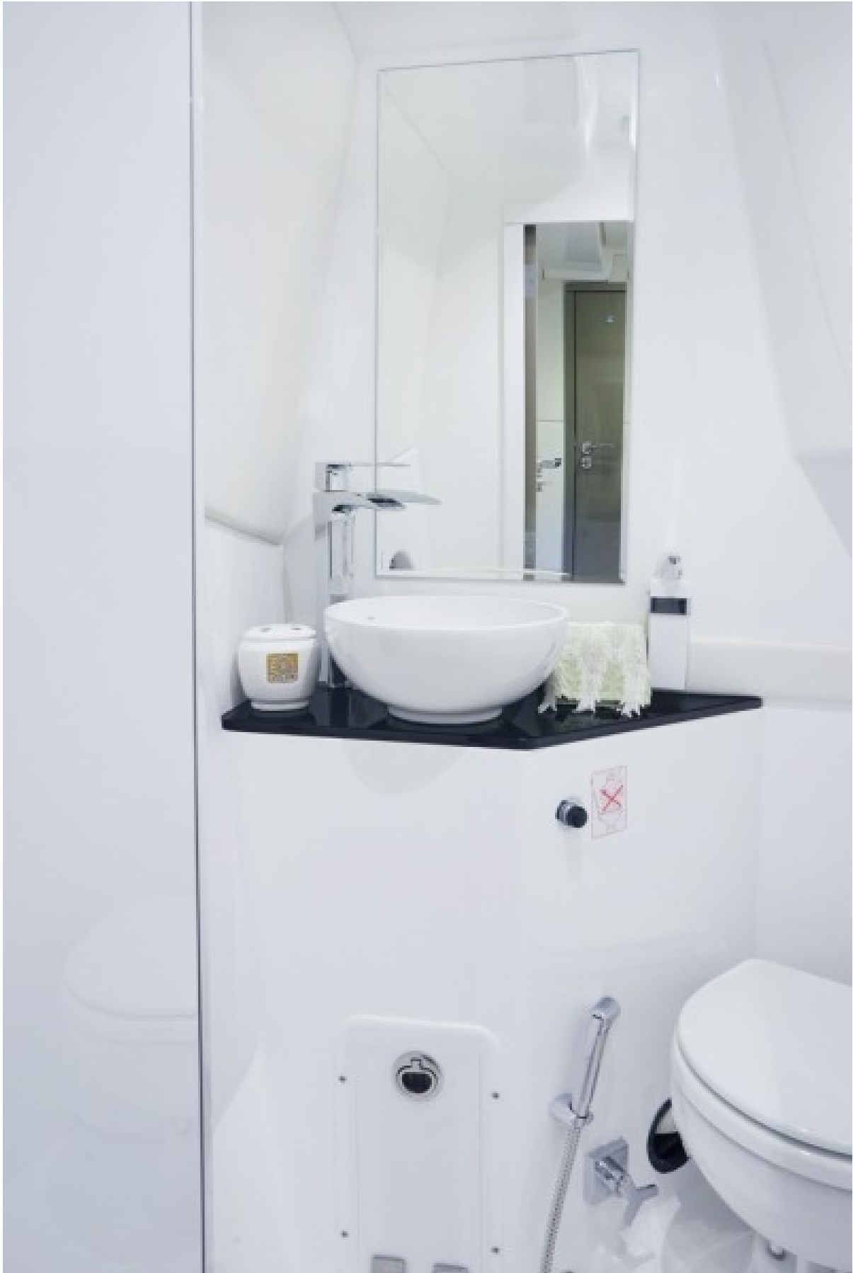
Ensuite bath Enclosed shower and quality fittings throughout