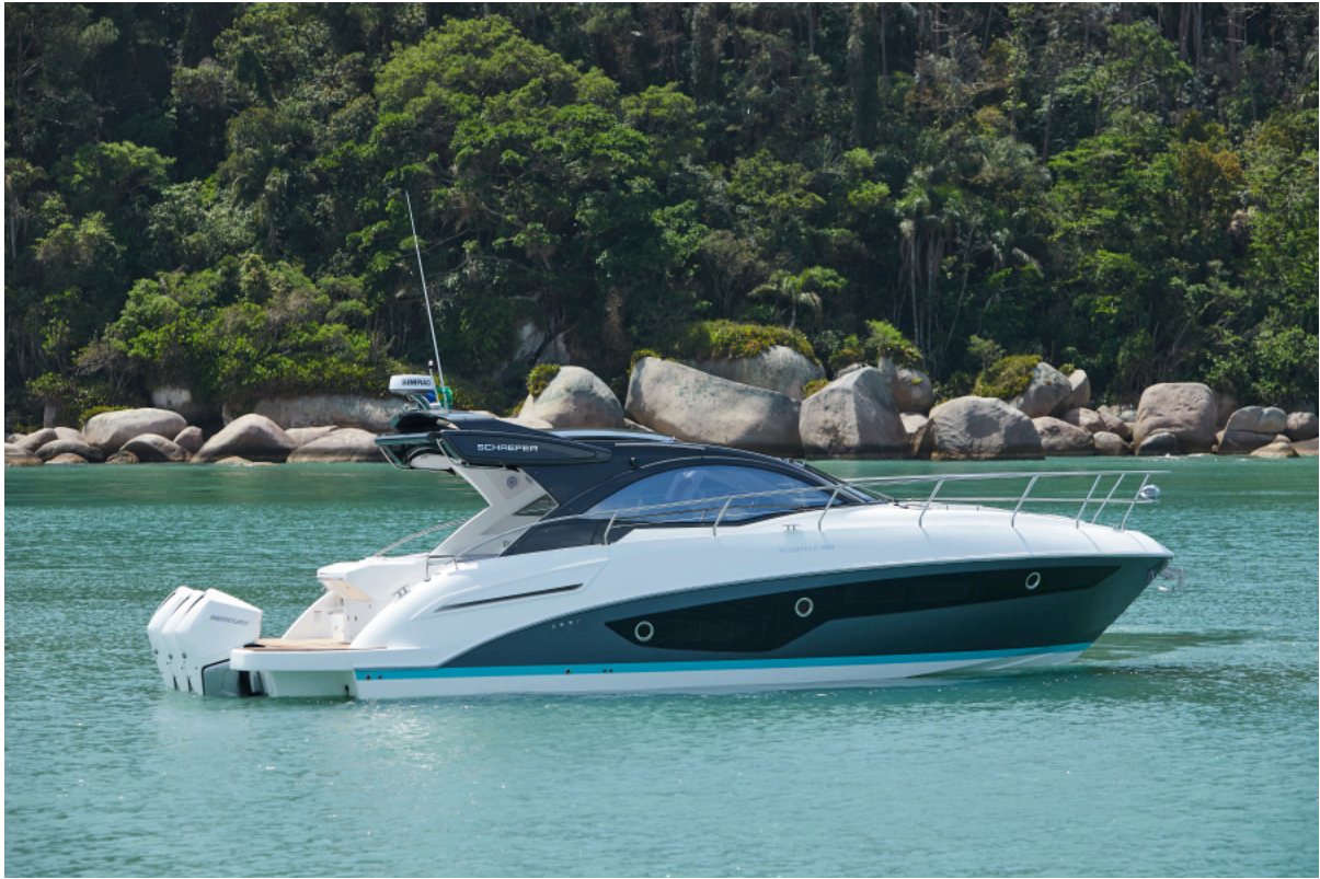
Schaefer Yachts 400 Sport Outboard