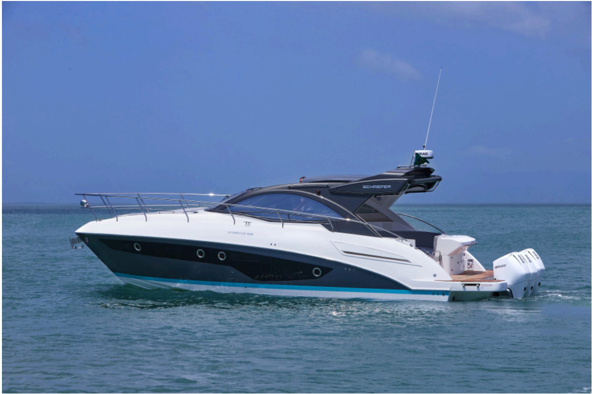
Schaefer Yachts 400 Sport Outboard