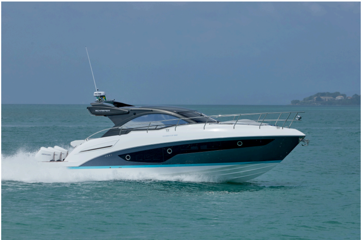
Schaefer Yachts 400 Sport Outboard