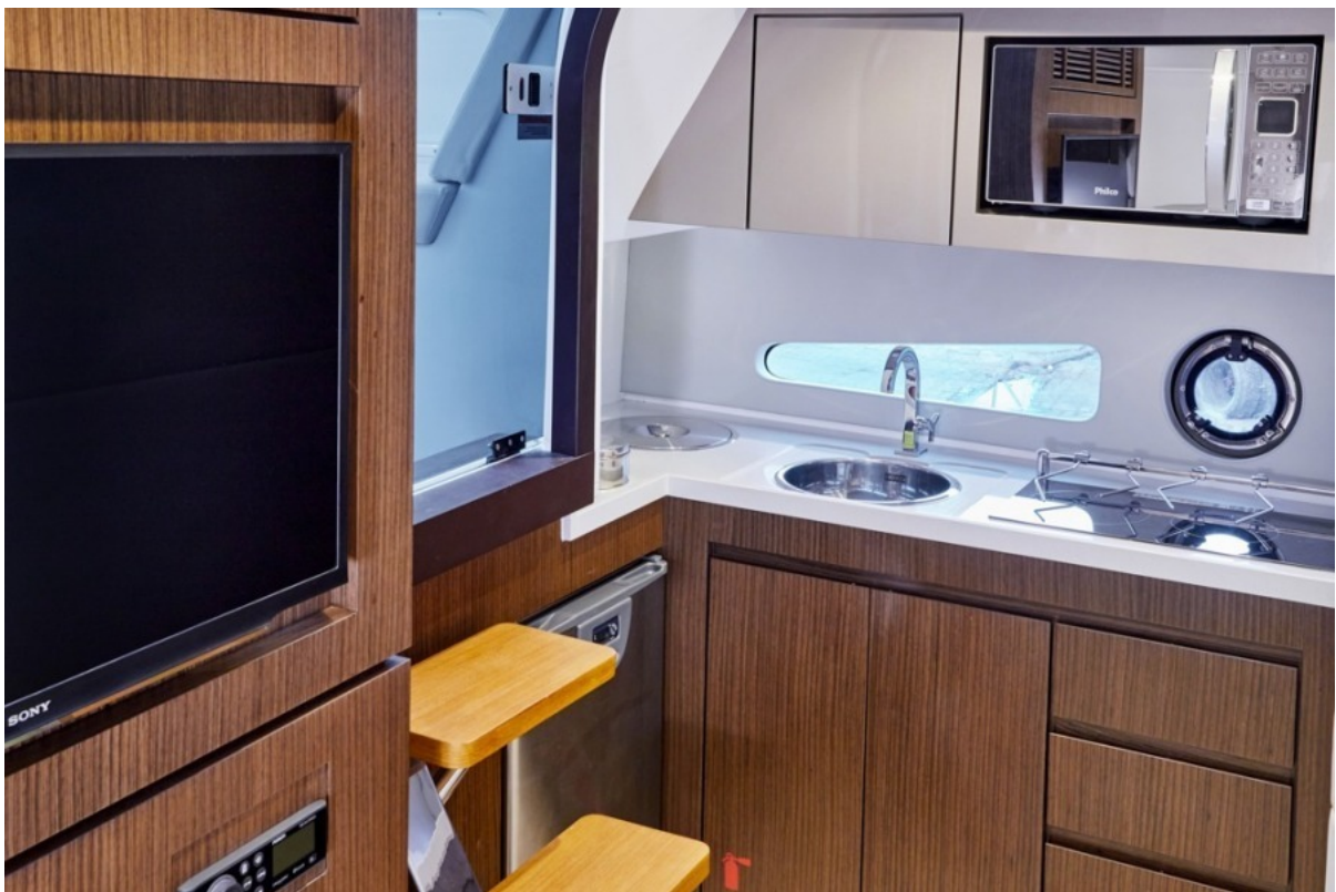
Full Galley Several finishes available as well as some custom selections are available