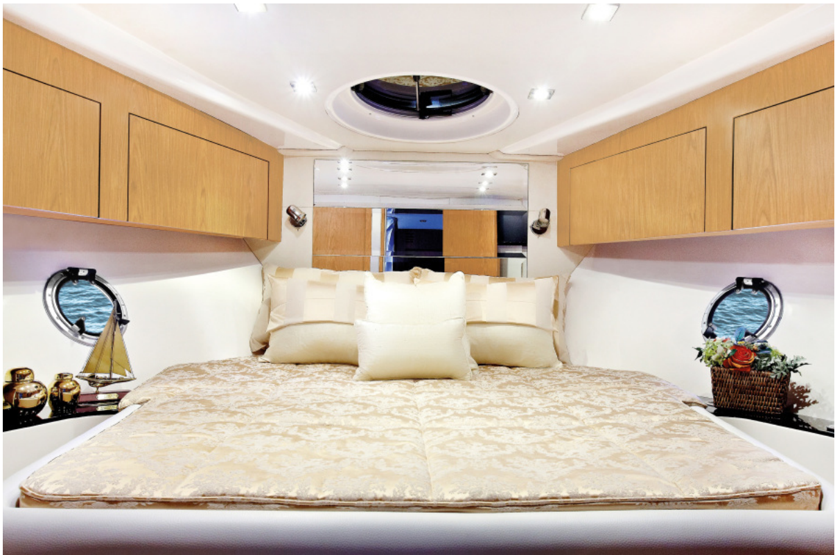
Master Stateroom Full beam width with private ensuite toilet shower