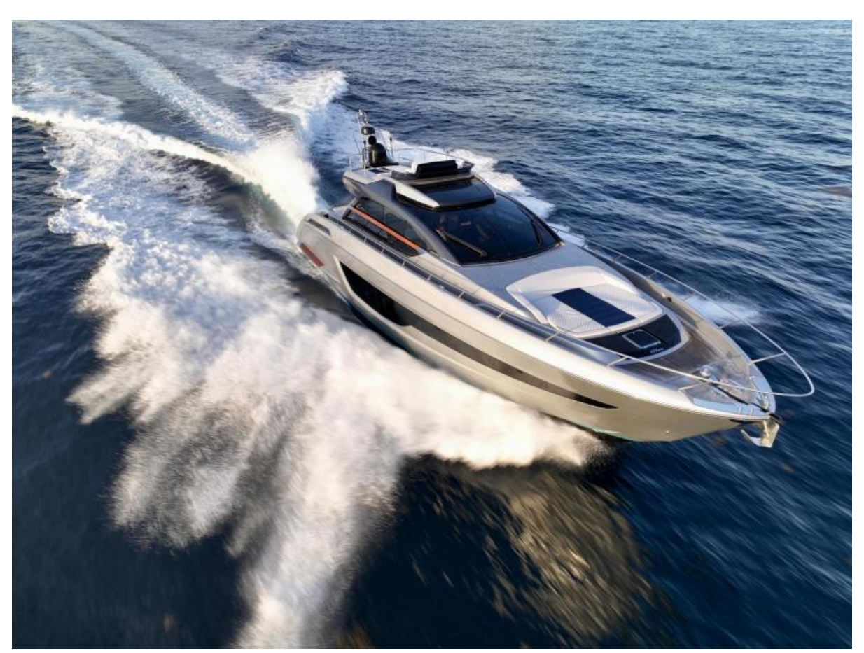
Riva Ribelle Profile