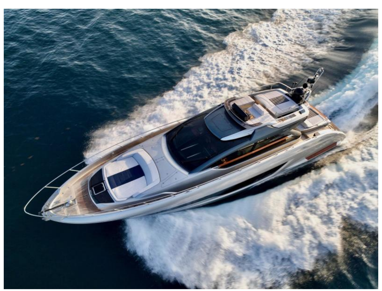
Riva Ribelle Profile