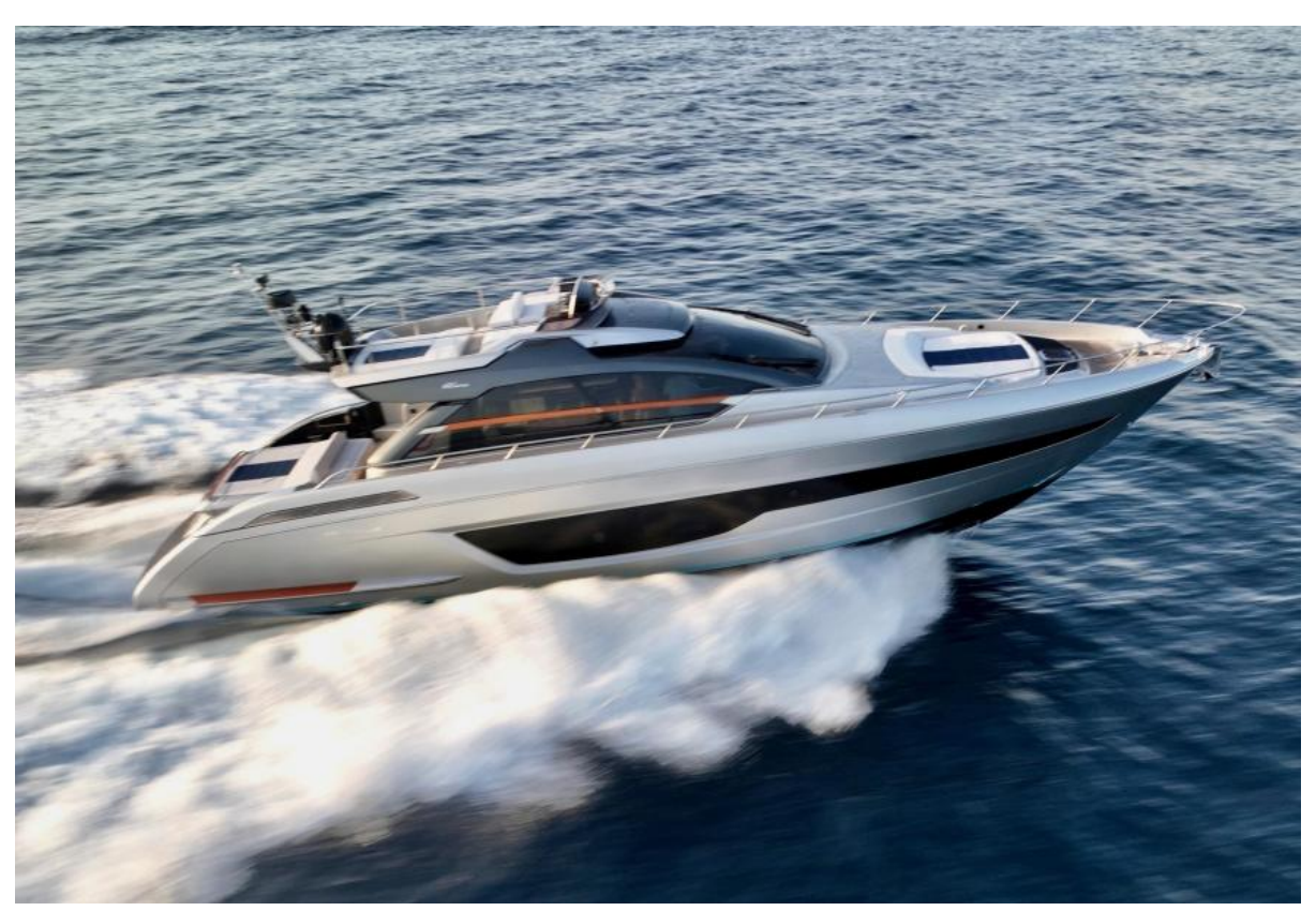
Riva Ribelle Profile