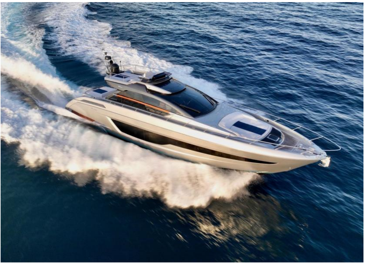
Riva Ribelle Profile