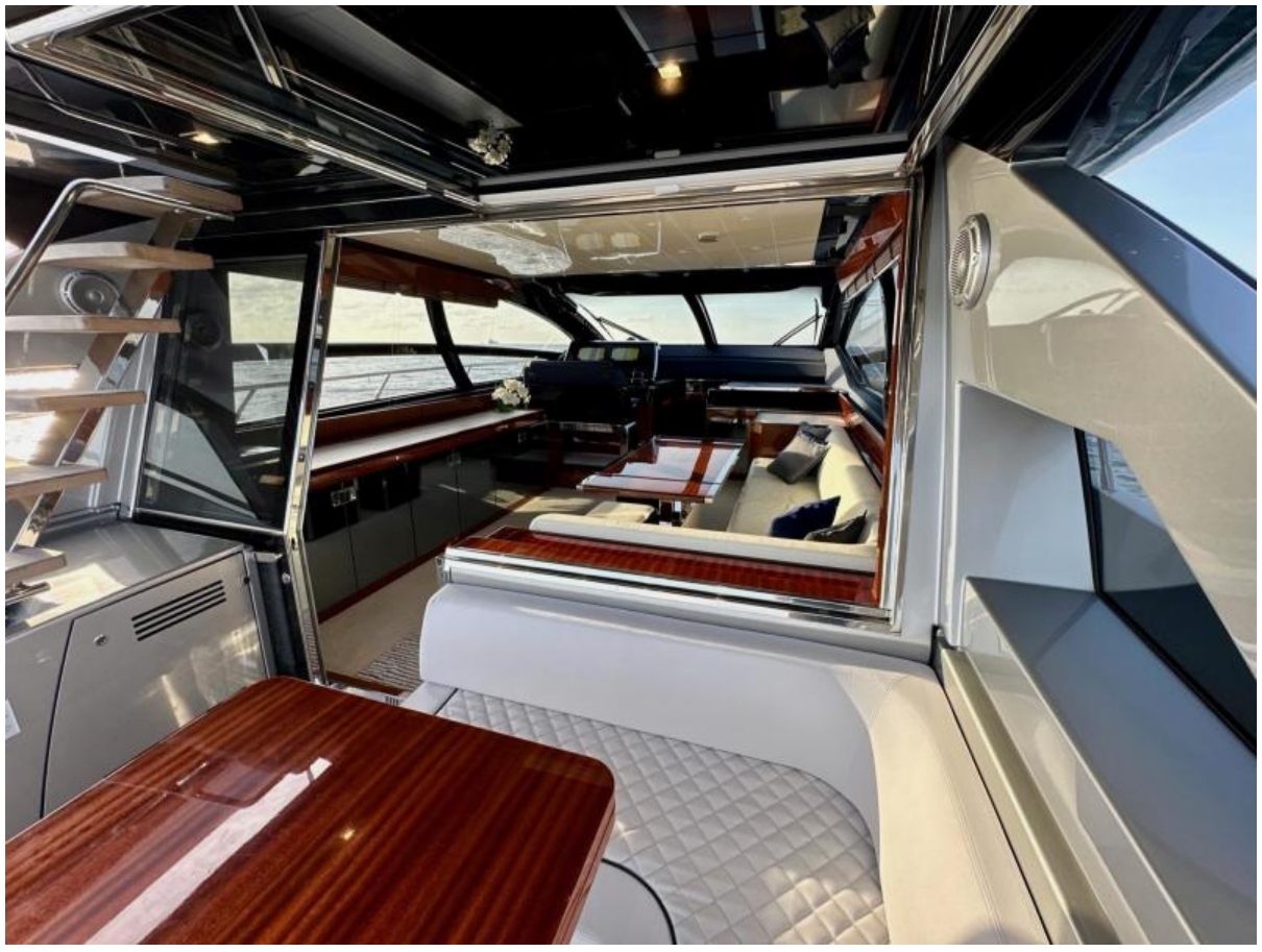
View from aft deck into Main salon