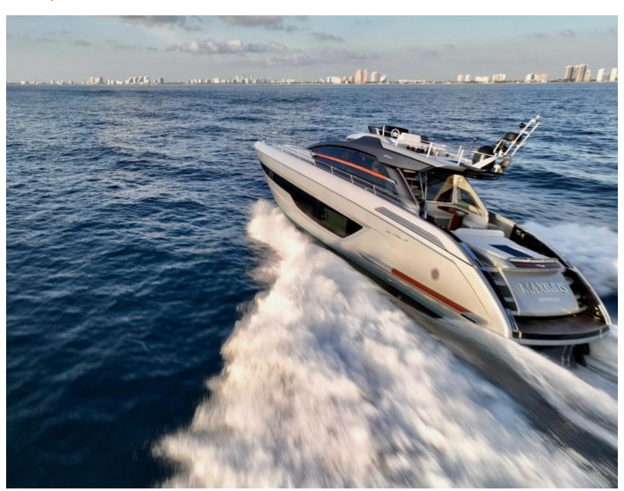
Riva Ribelle Profile