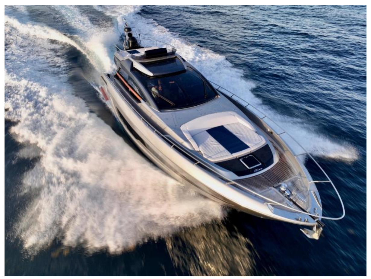
Riva Ribelle Profile