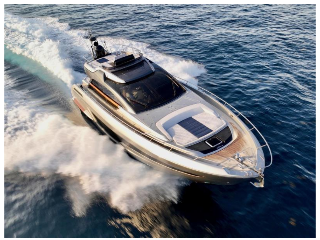
Riva Ribelle Profile