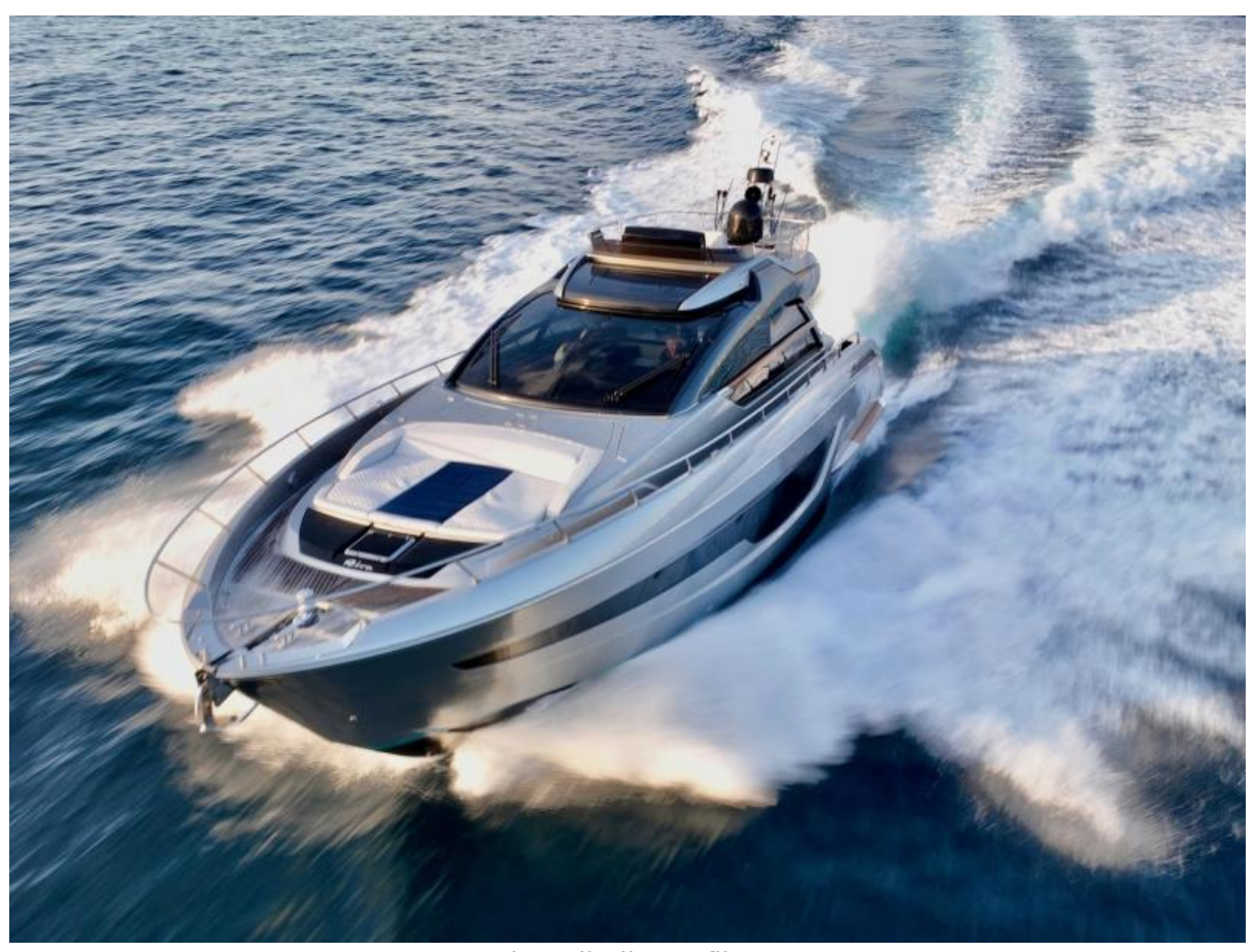
Riva Ribelle Profile