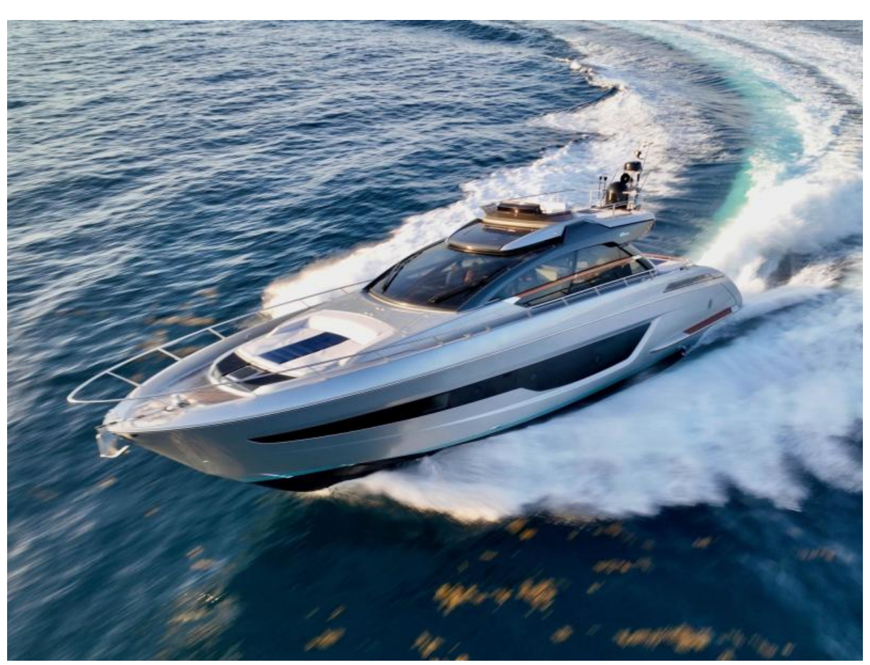
Riva Ribelle Profile