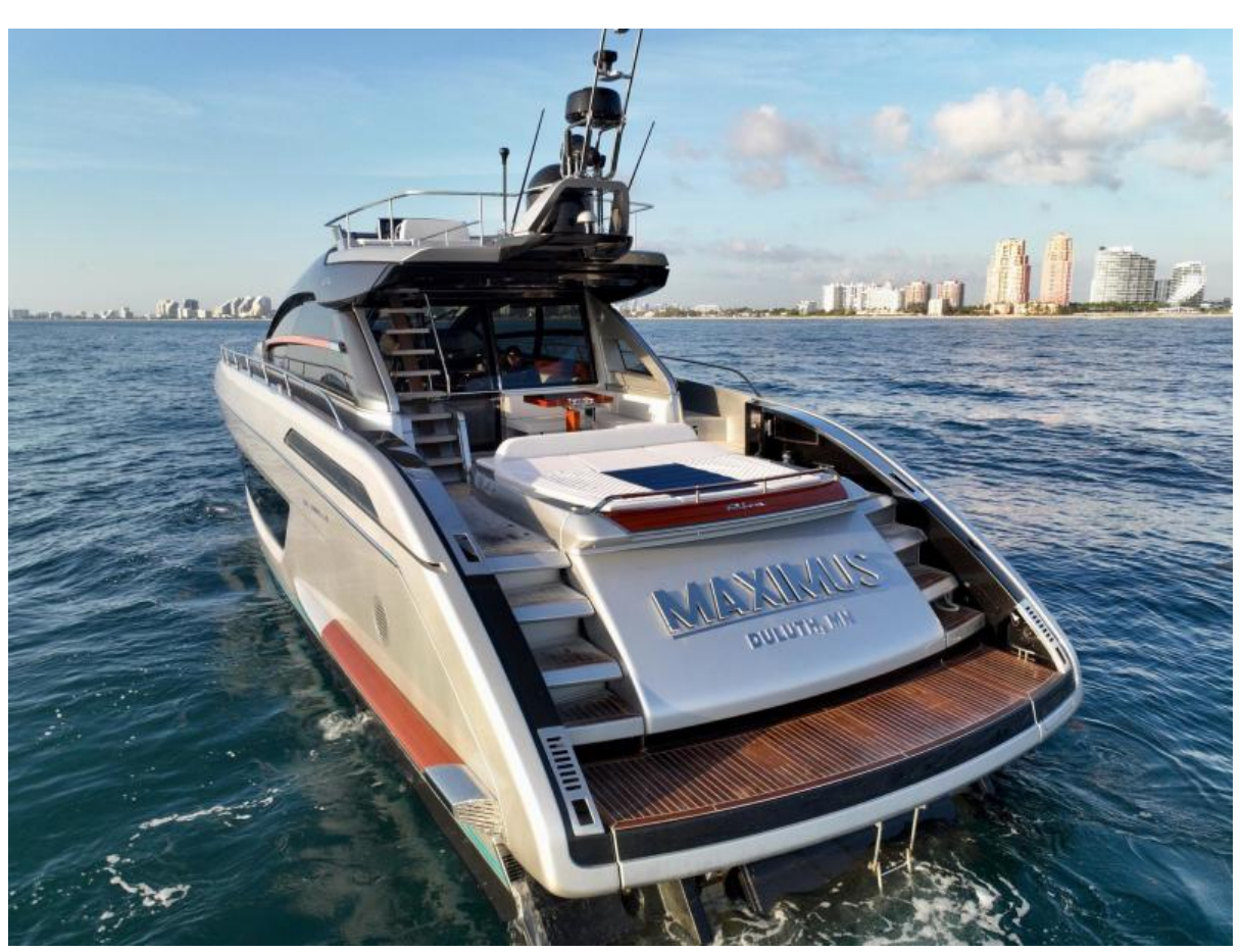
Riva Ribelle Profile