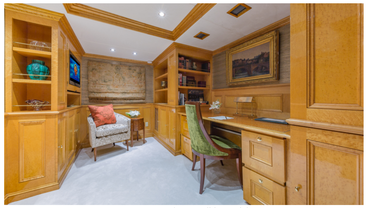
VIP Stateroom (Convertible Study)