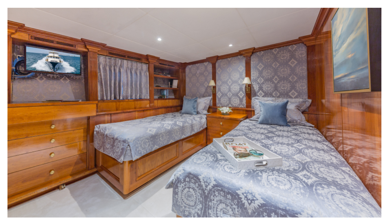
Guest Twin Stateroom (Convertible Beds)