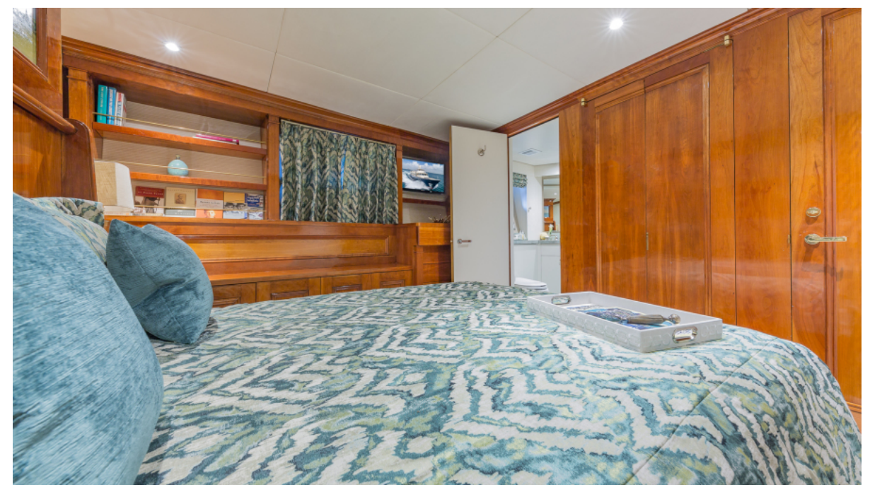
Guest Queen Stateroom