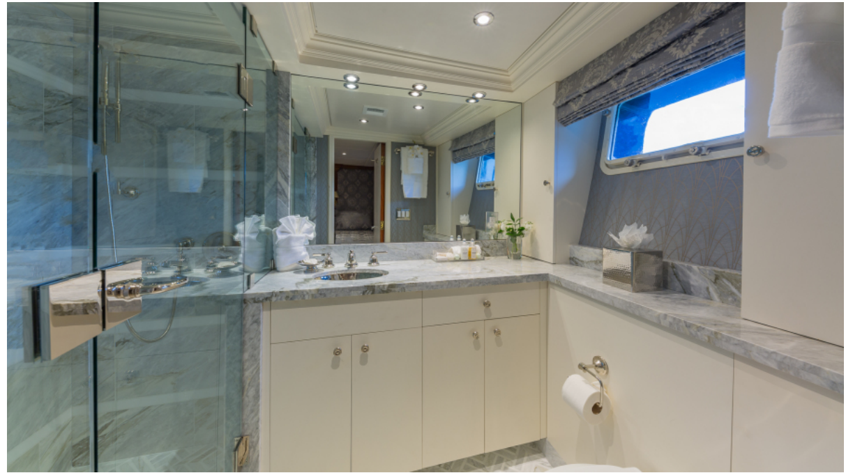
Guest Twin Stateroom Bath