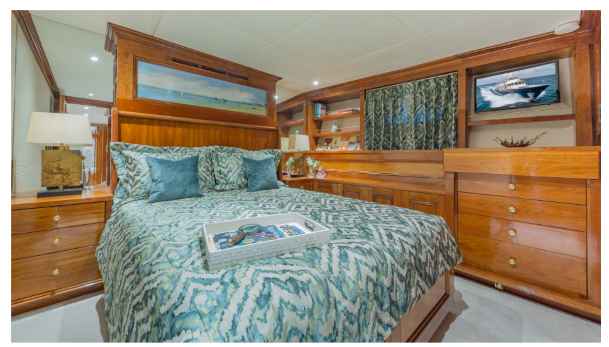
Guest Queen Stateroom