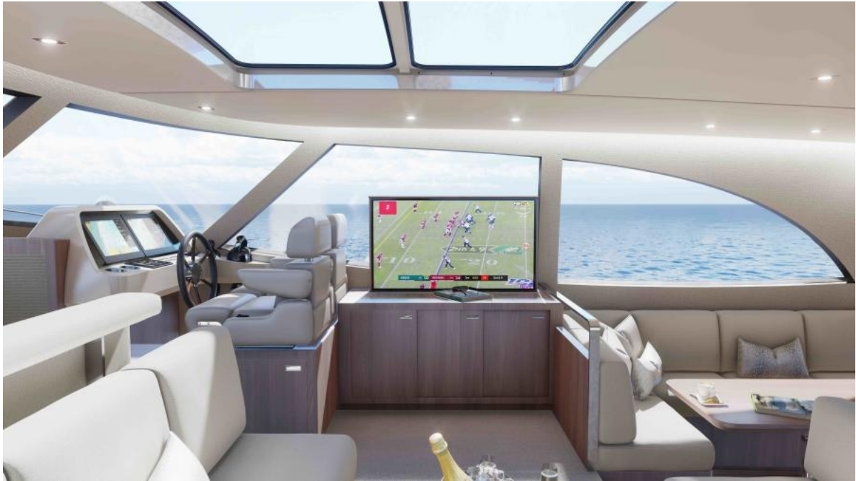
605 Interior Salon TV