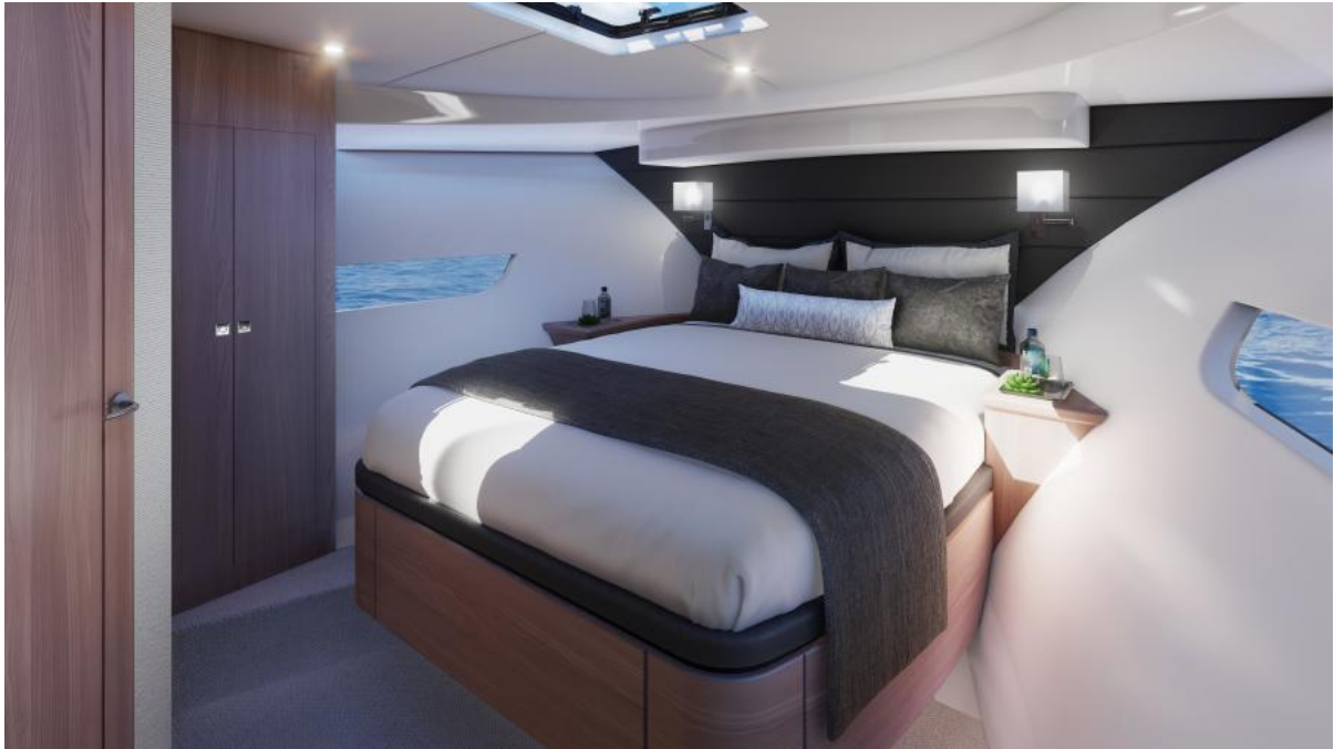
605 Interior Master Forward