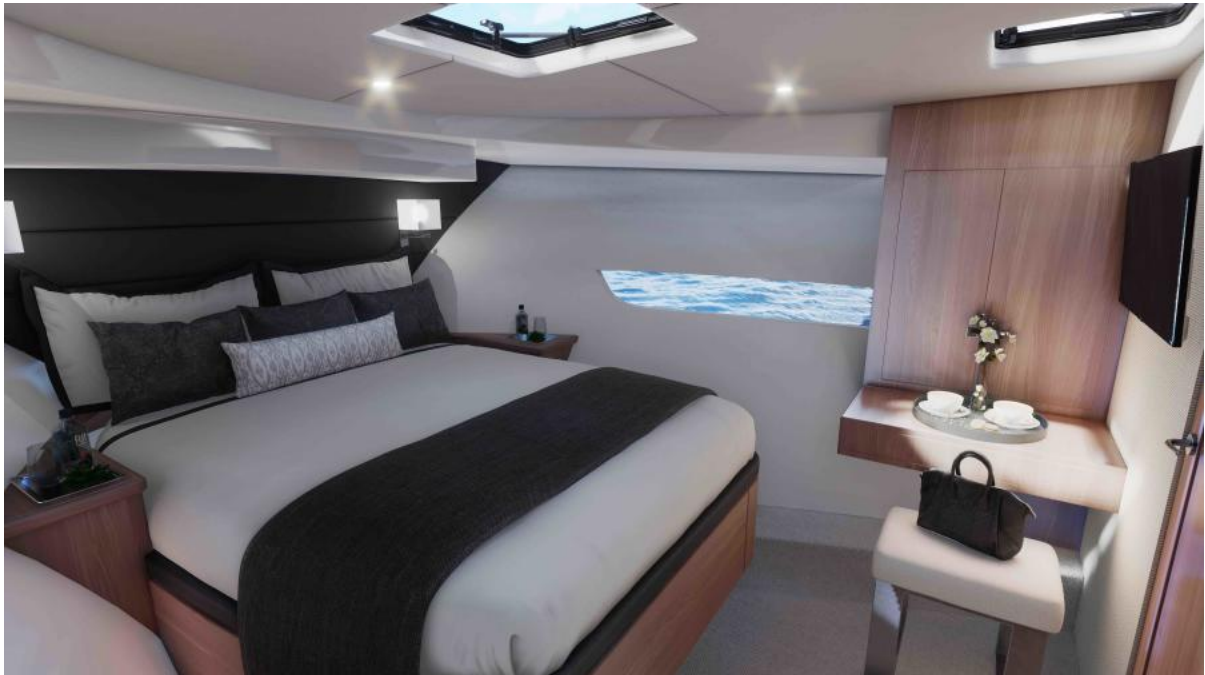
605 Interior Master Forward