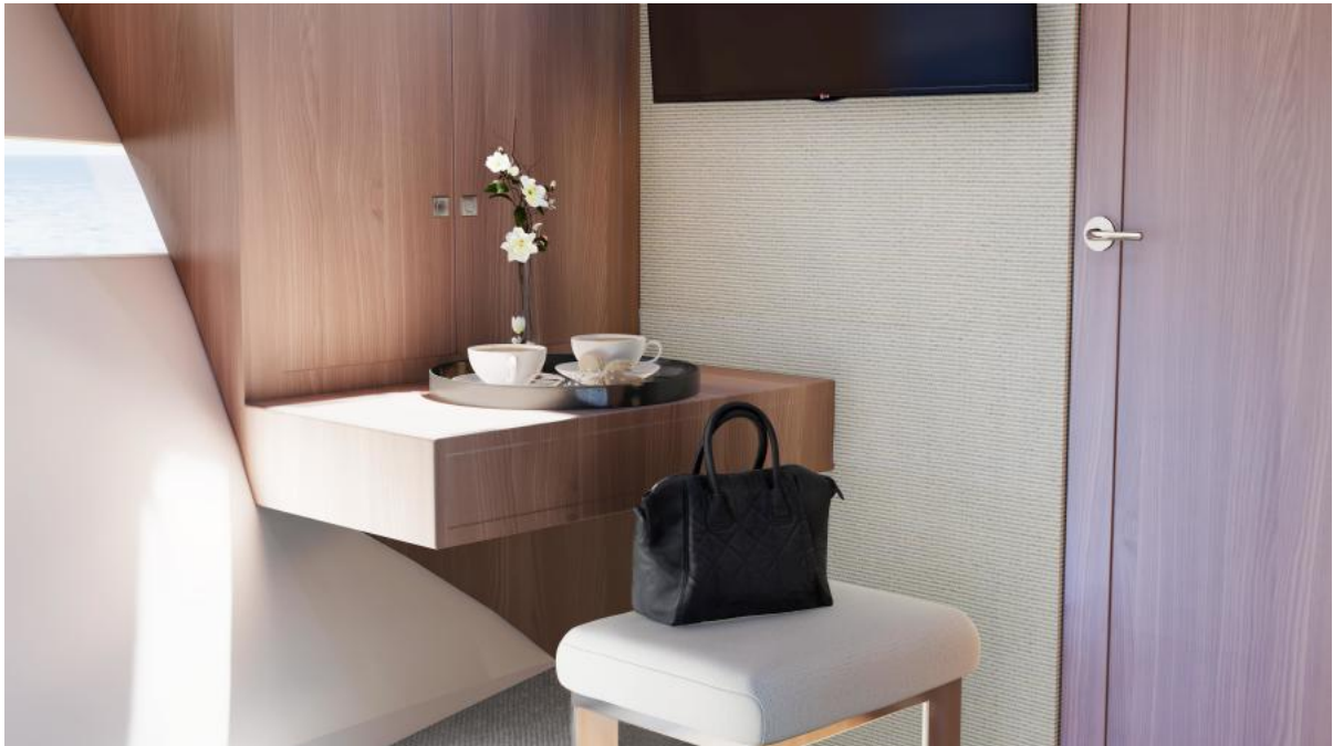
605 Interior Master Forward