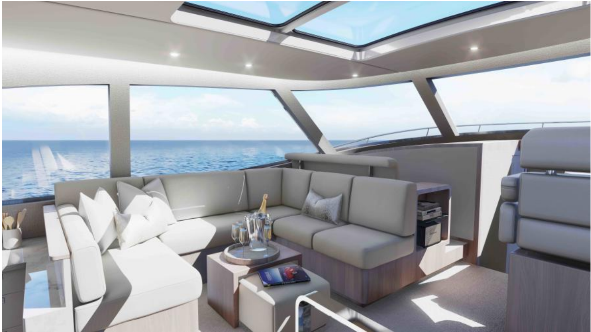
605 Interior Salon