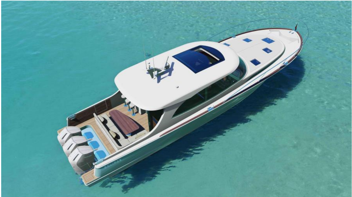
605 Exterior Overview