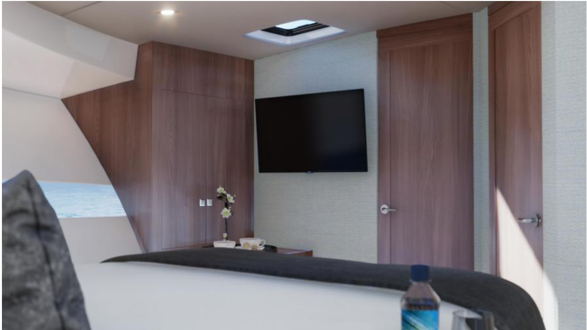
605 Interior Master Forward