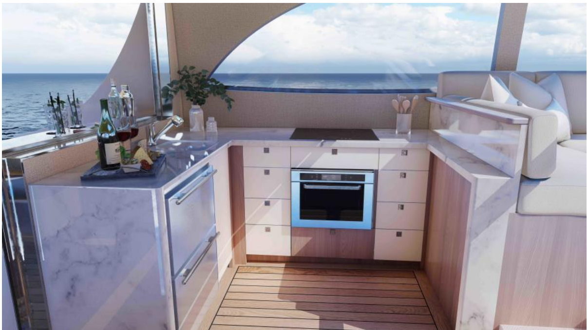
605 Interior Galley