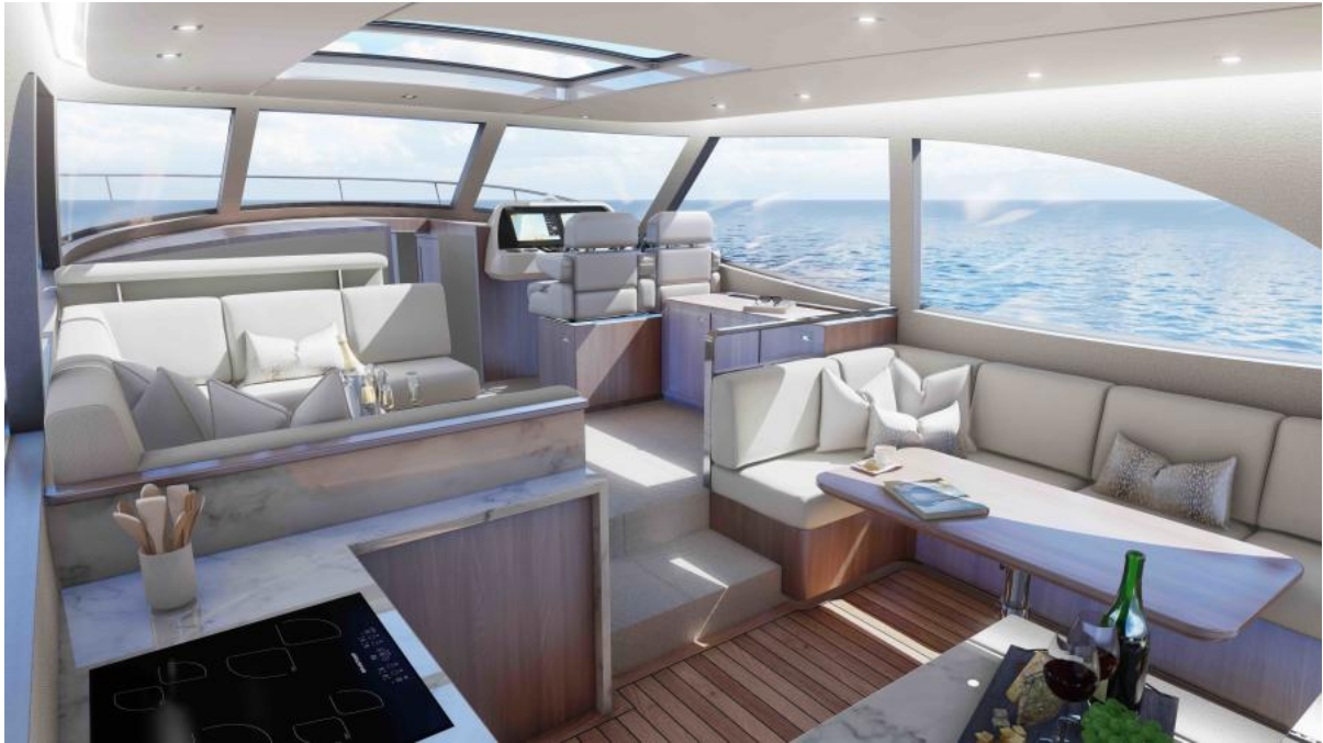
605 Interior Galley