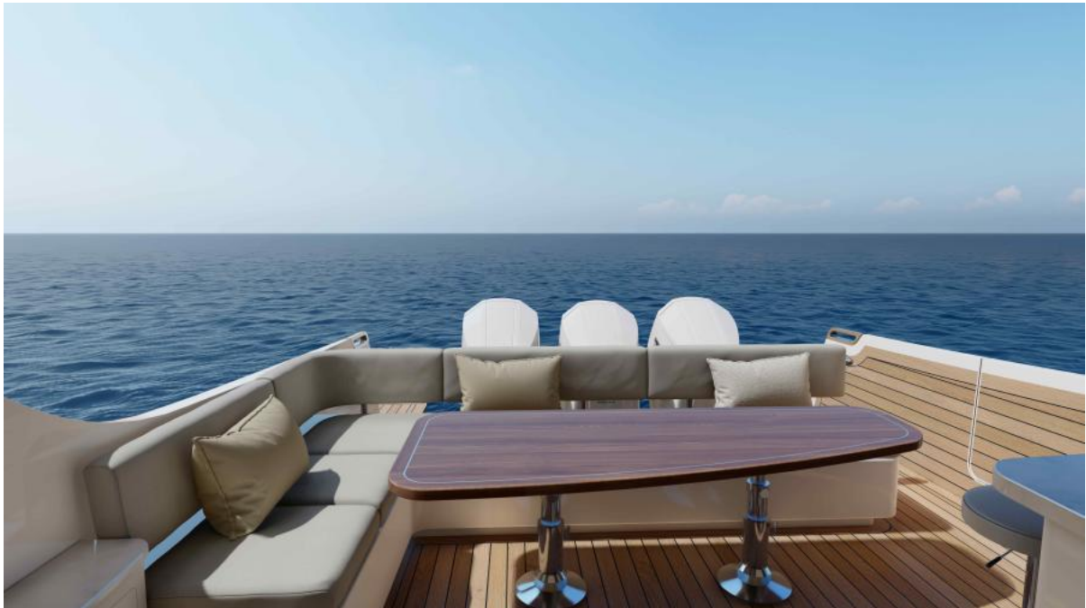
605 Exterior Aft Cockpit