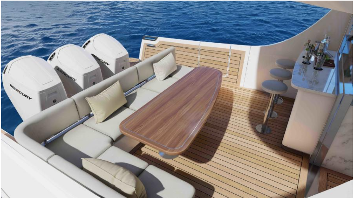
605 Exterior Aft Cockpit