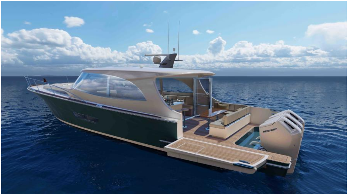
605 Exterior Port Folding Balcony