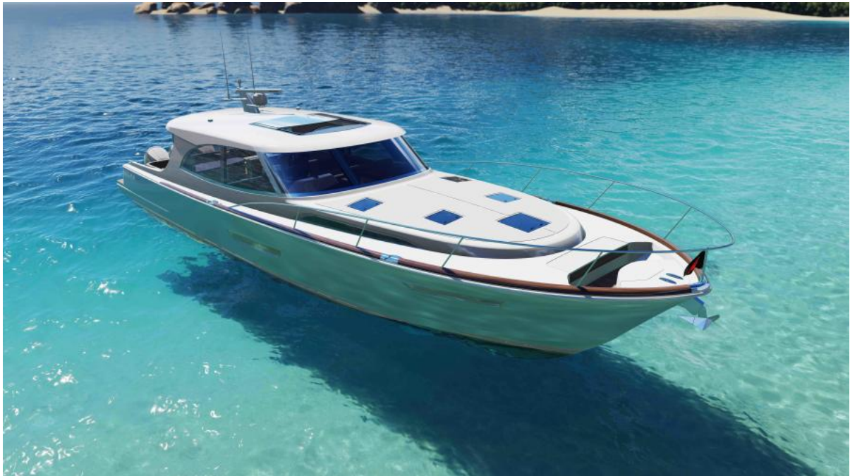
605 Exterior Starboard Bow