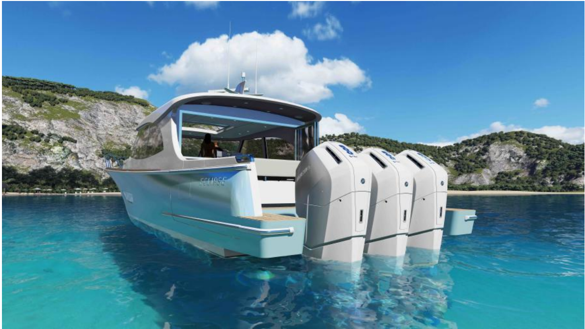
605 Exterior Motors