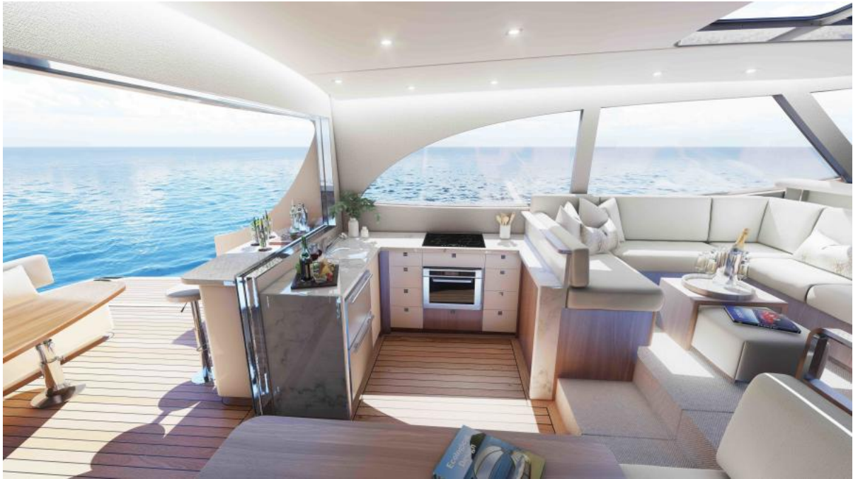
605 Interior Galley