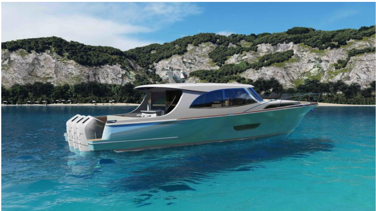
605 Exterior Starboard