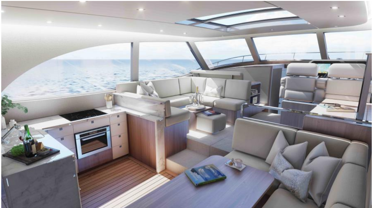
605 Interior Galley