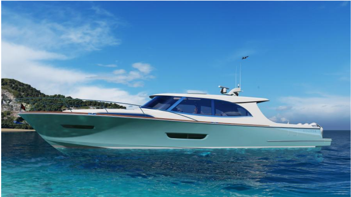
605 Exterior Profile Port