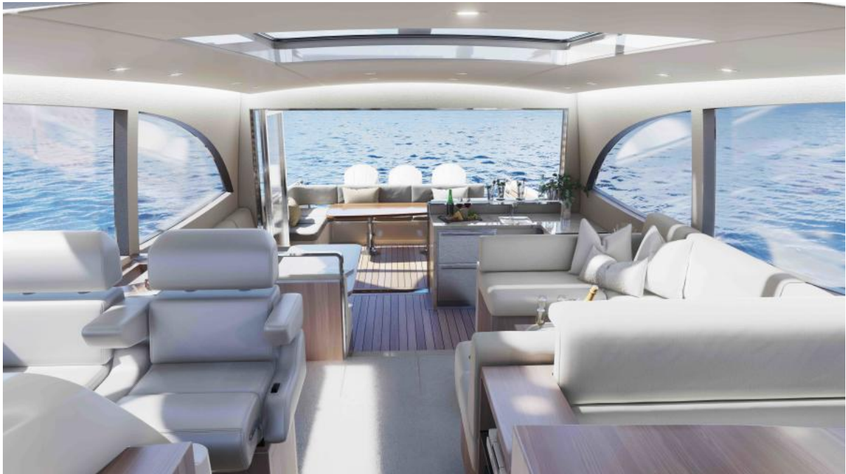
605 Interior Salon and Helm