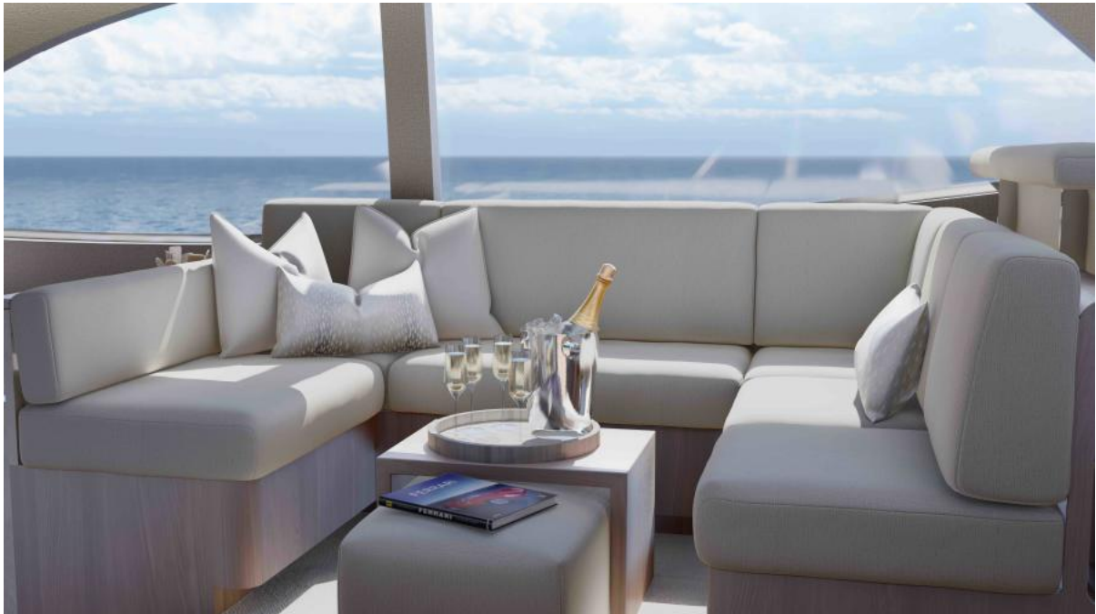
605 Interior Salon