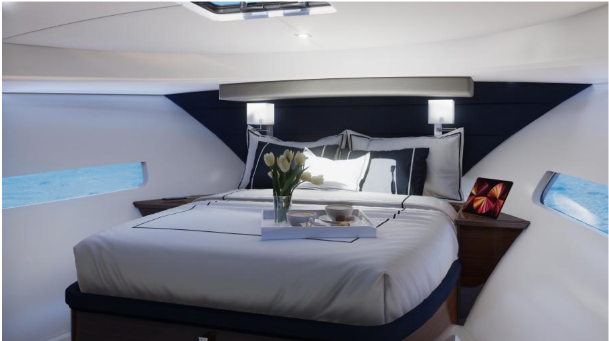
505 Interior Master Forward