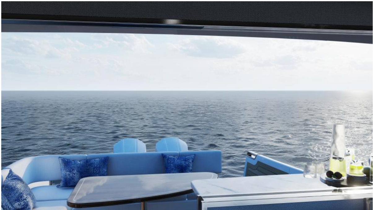
505 Aft Cockpit