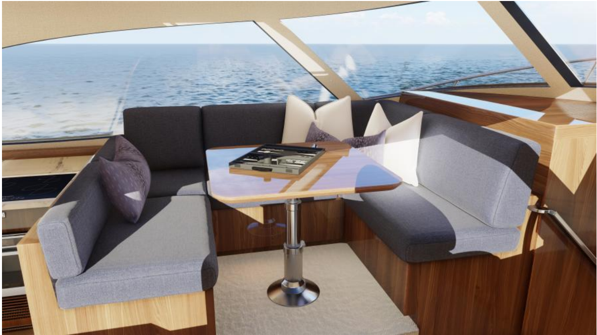
505 Interior Salon