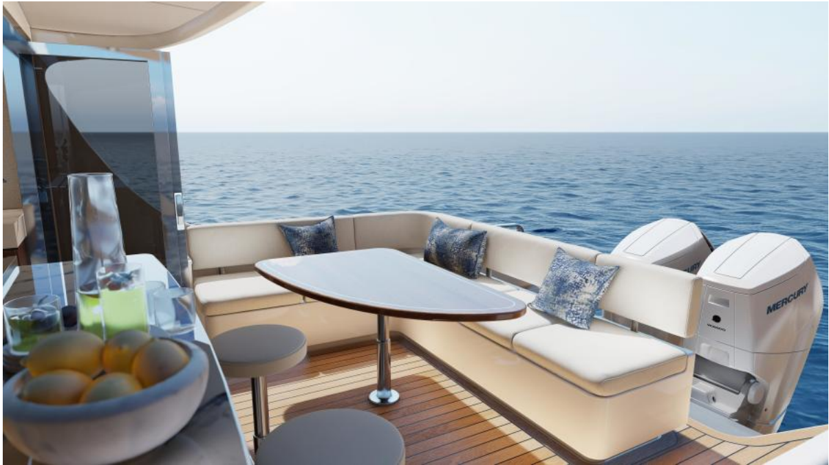
505 Aft Cockpit