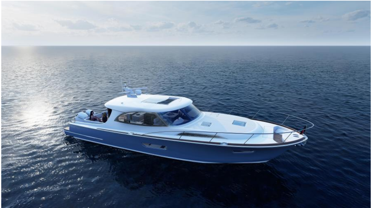
505 Exterior Starboard