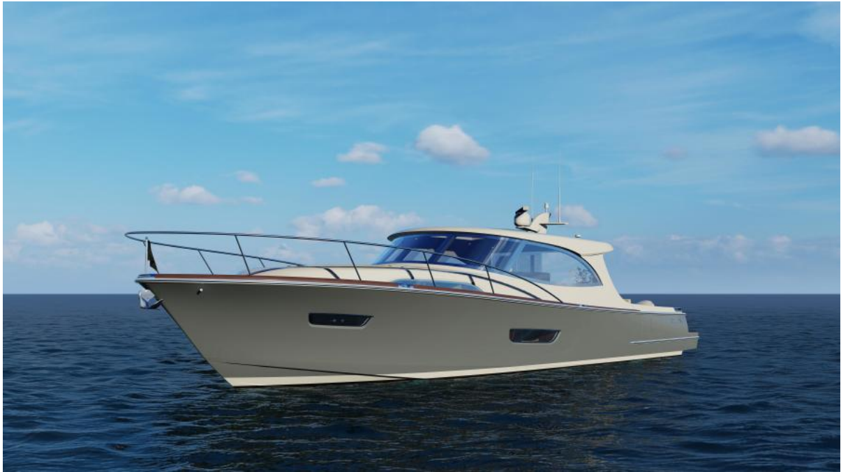
505 Exterior Port