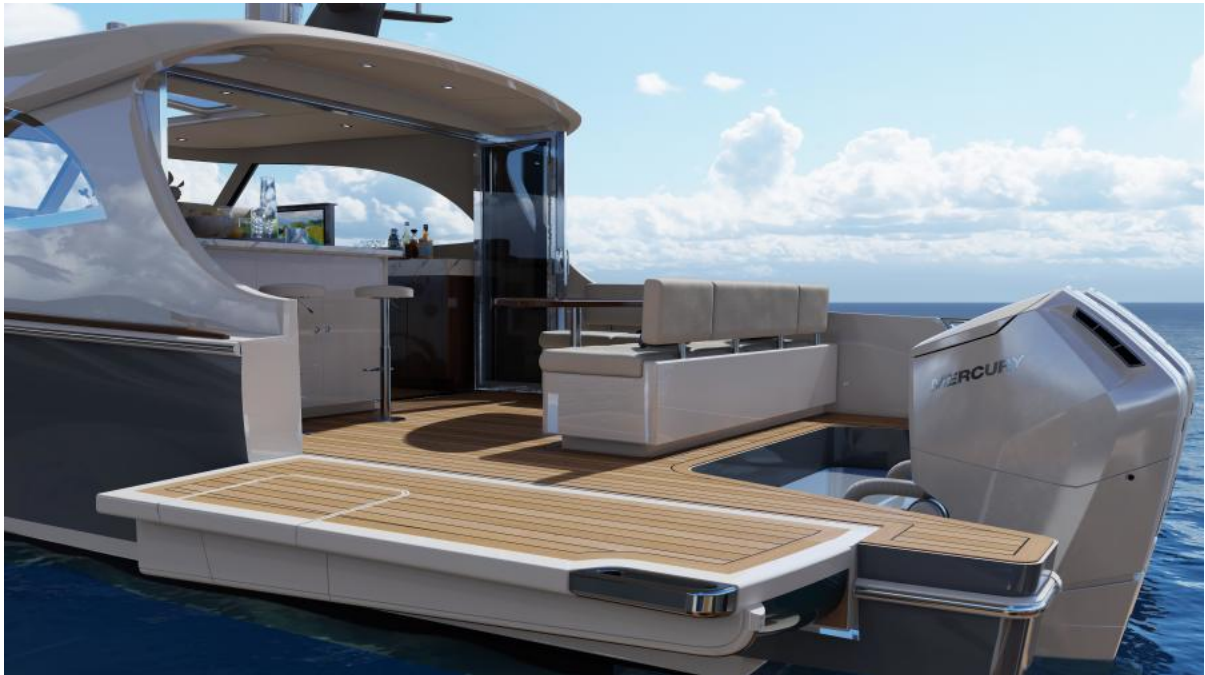
505 Exterior Folding Balcony Port