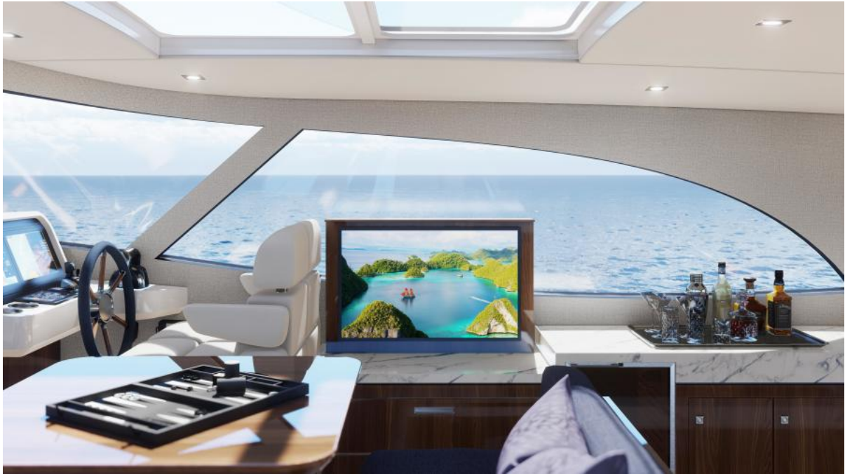
505 Interior Salon