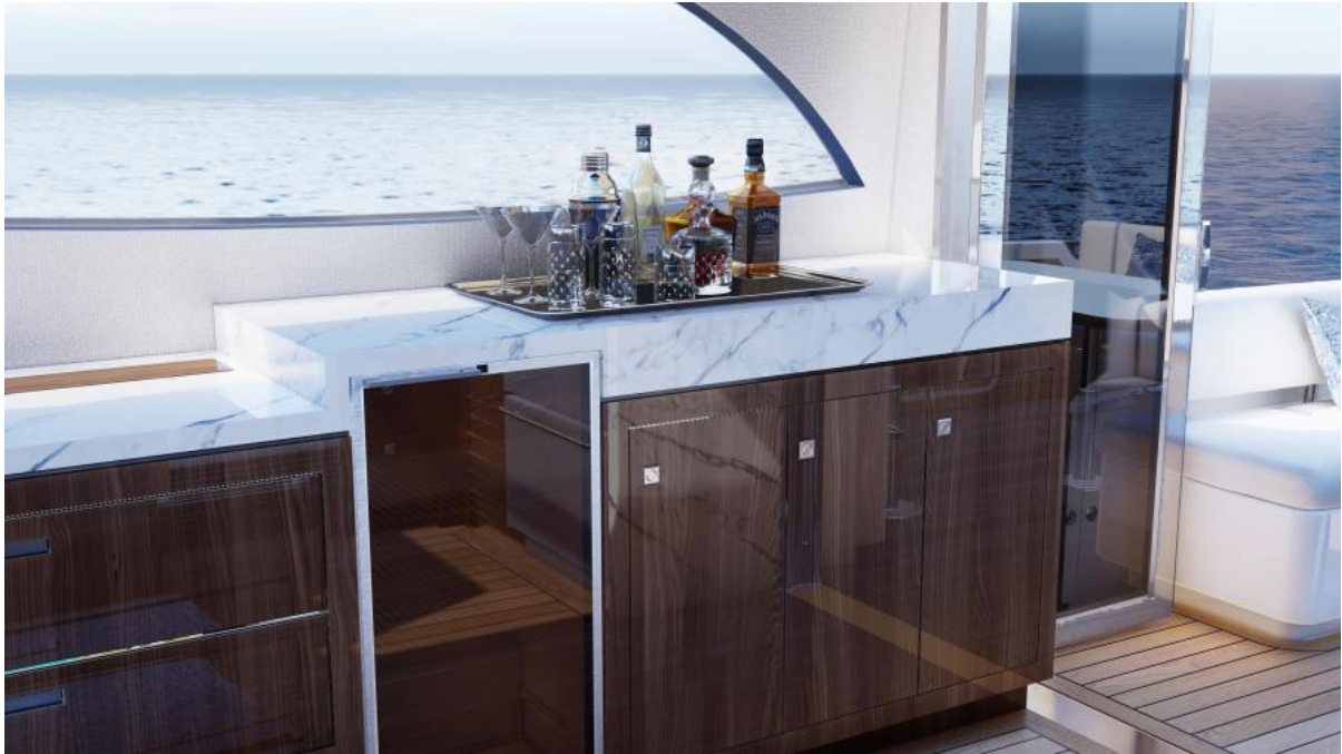
505 Interior Galley Bar