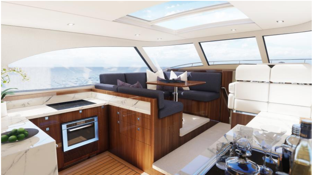
505 Interior Salon