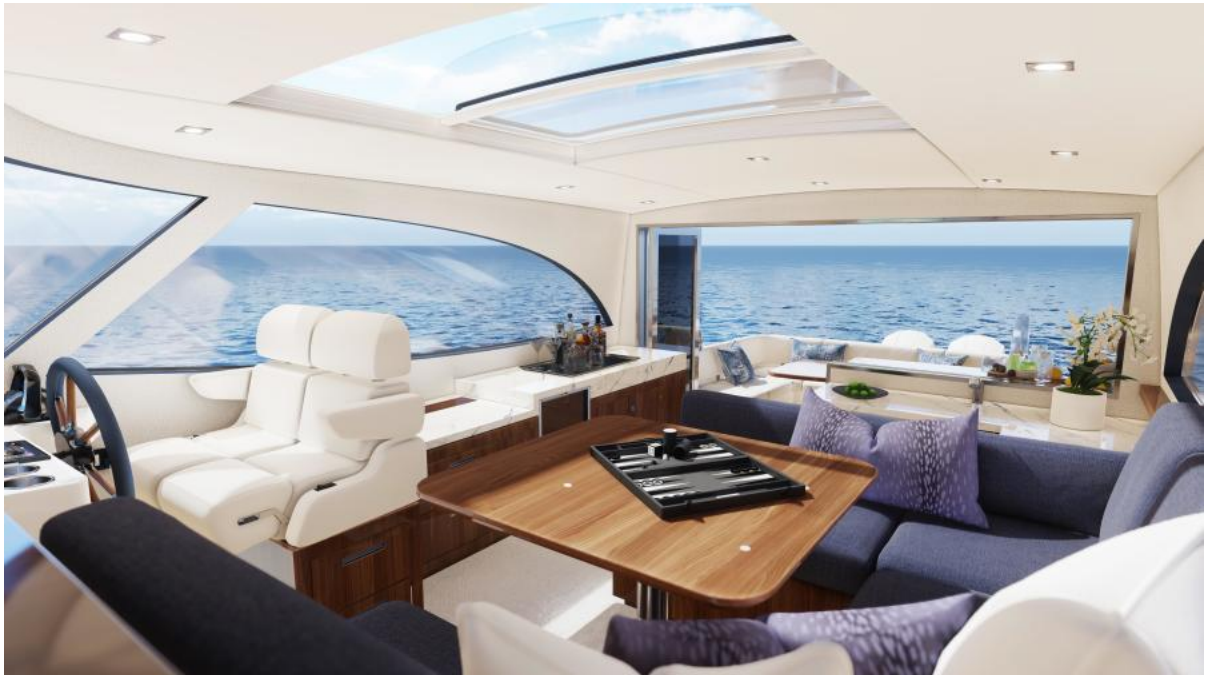
505 Interior Salon and Helm