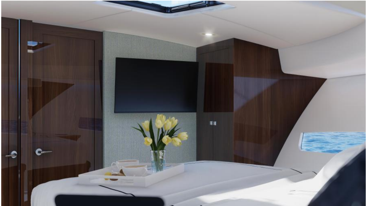
505 Interior Master Forward