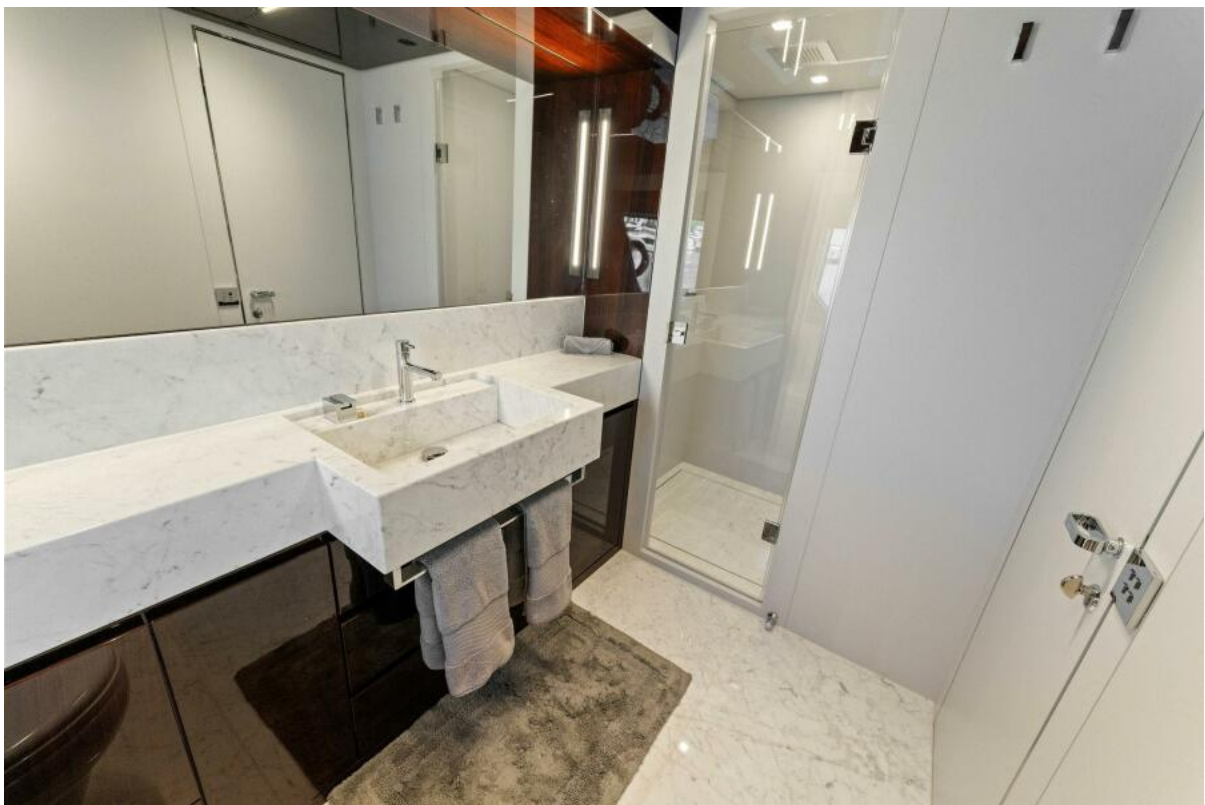
Riva Dolcevita 110 - Master Head 2024 Riva Dolcevita 110