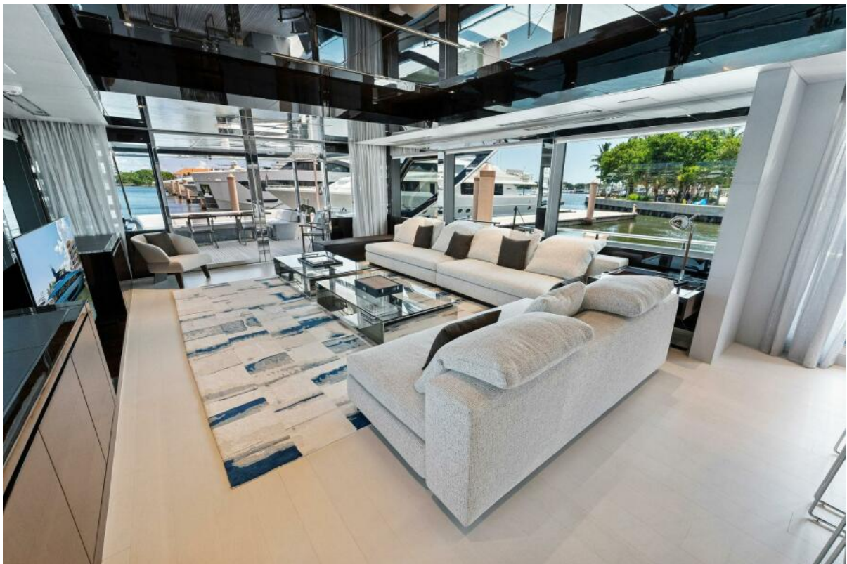
Riva Dolcevita 110 - Salon 2024 Riva Dolcevita 110