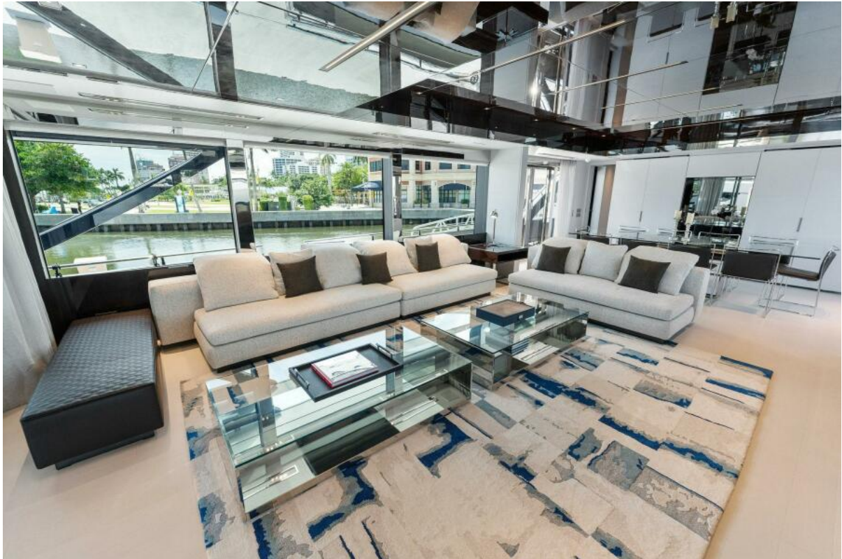
Riva Dolcevita 110 - Salon 2024 Riva Dolcevita 110