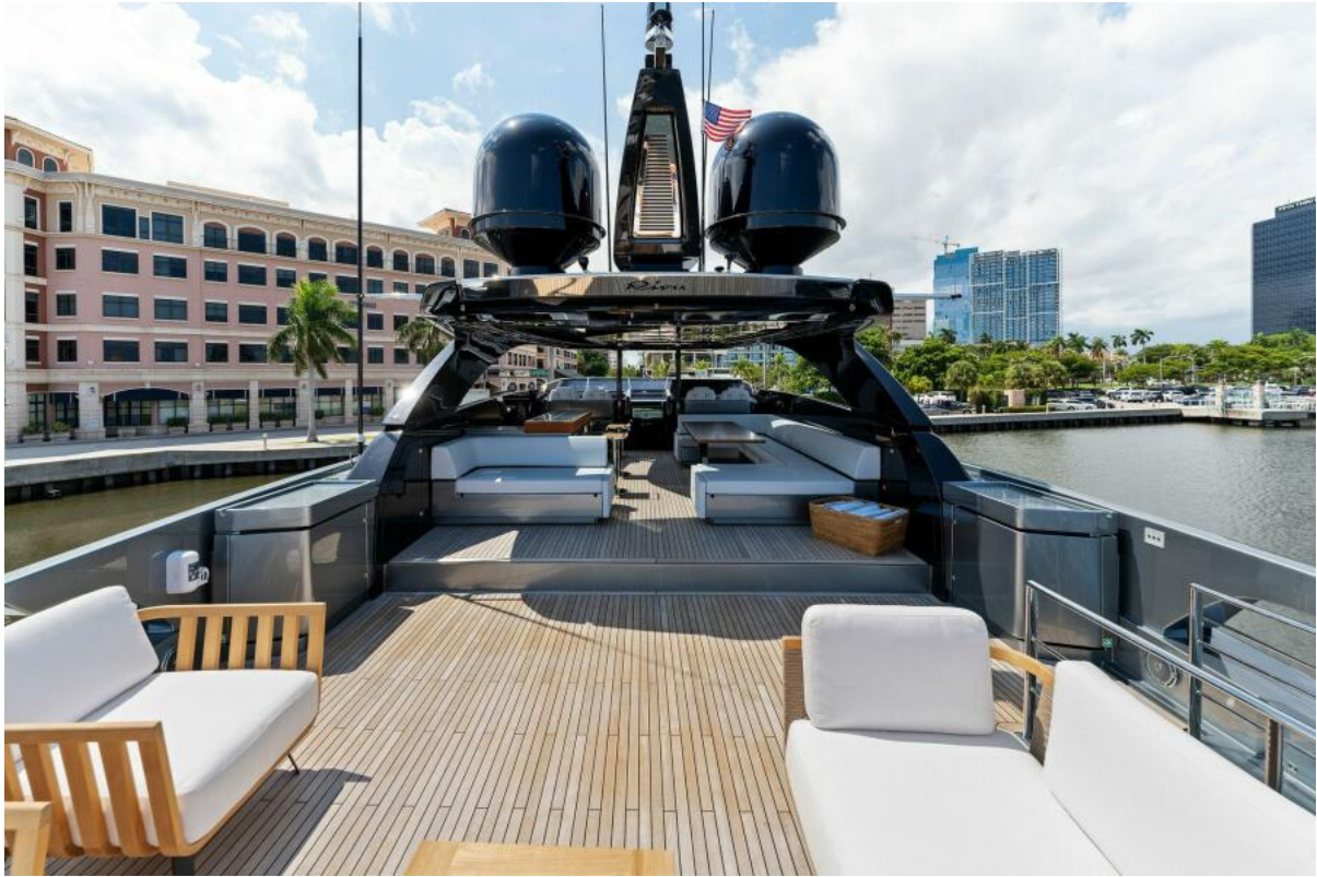
Riva Dolcevida 110 - Bridge 2024 Riva Dolcevida 110