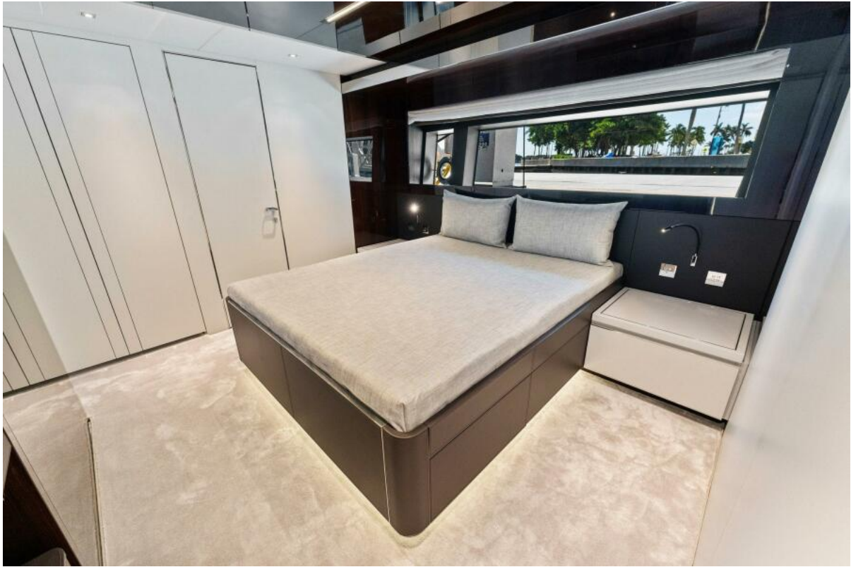
Riva Dolcevit 110 - Port Forward Guest Stateroom 2024 Riva Dolcevit 110