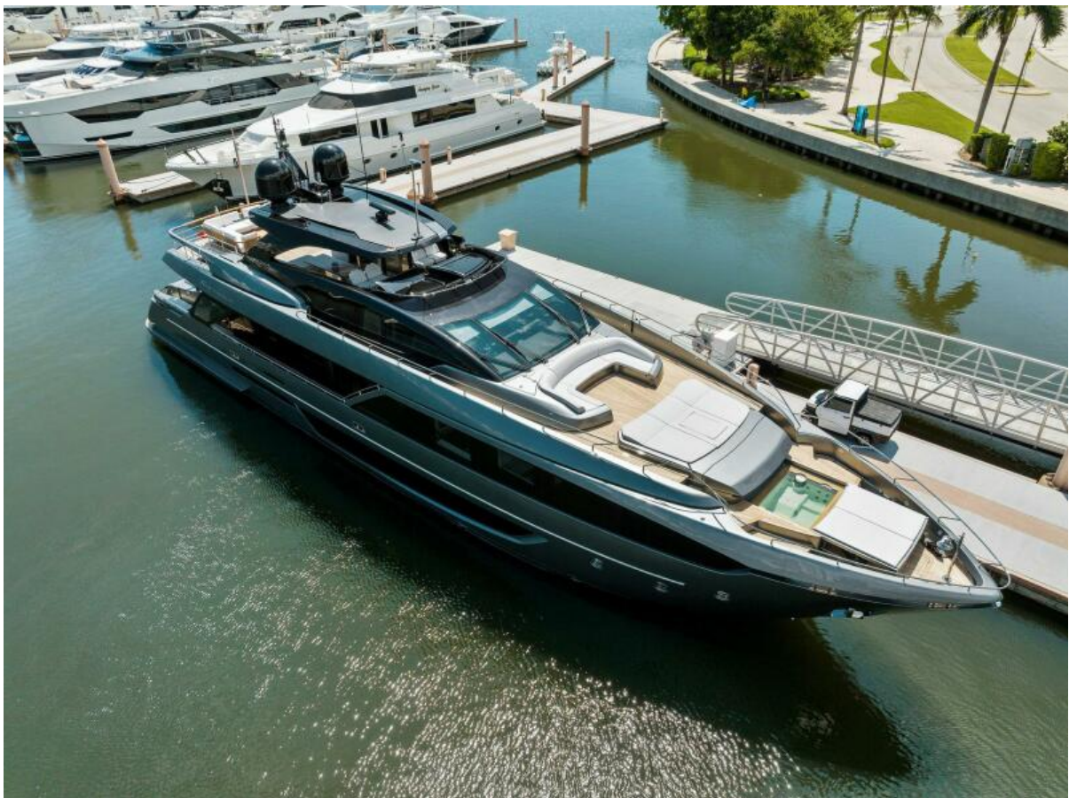
Riva Dolce Vita 110 - Aerial 2024 Riva Dolce Vita 110