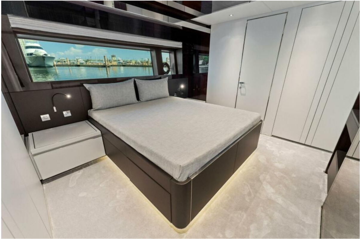
Riva Dolcevida 110 - VIP Starboard Aft Guest Stateroom 2024 Riva Dolcevida 110