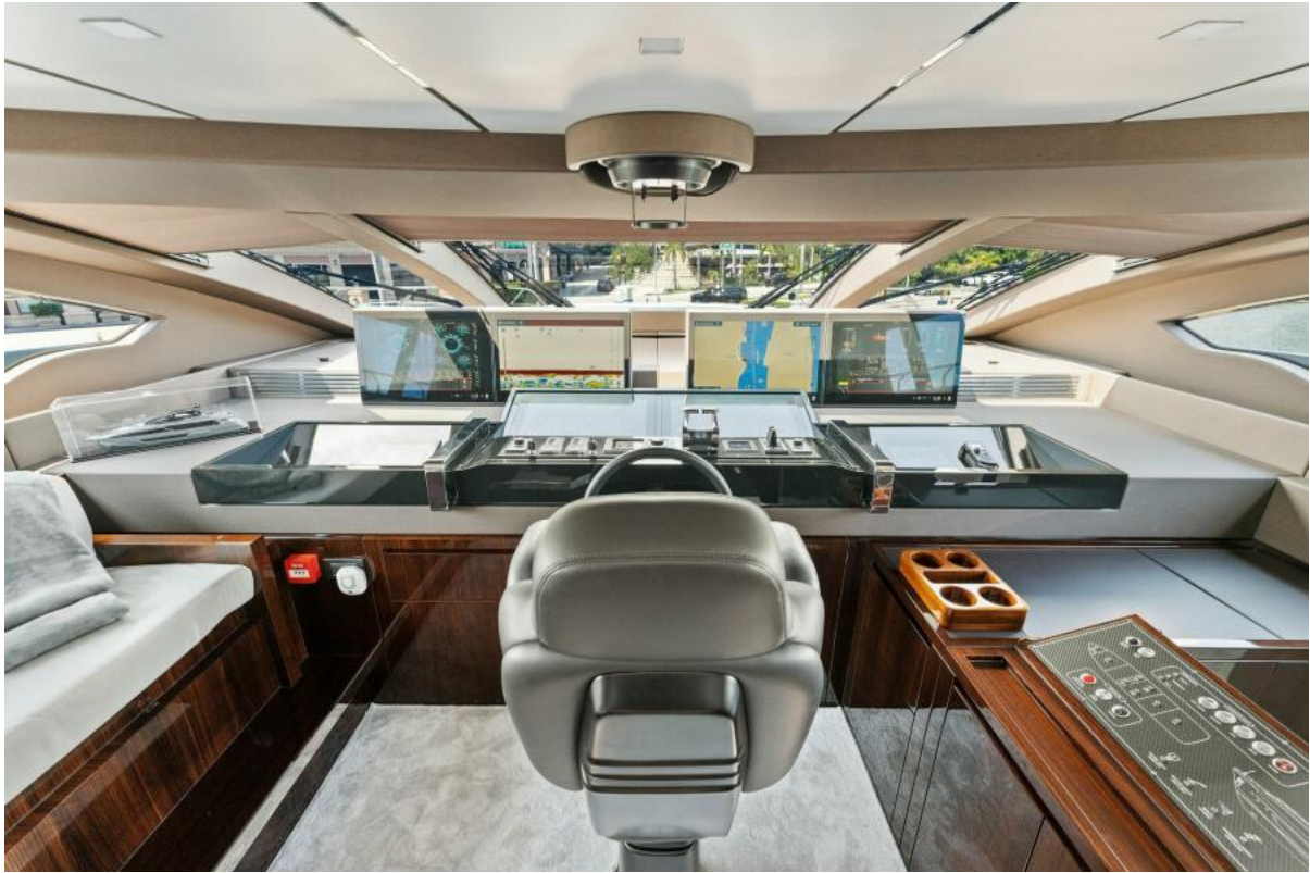
Riva Dolcevita 110 - Bridge Helm 2024 Riva Dolcevita 110