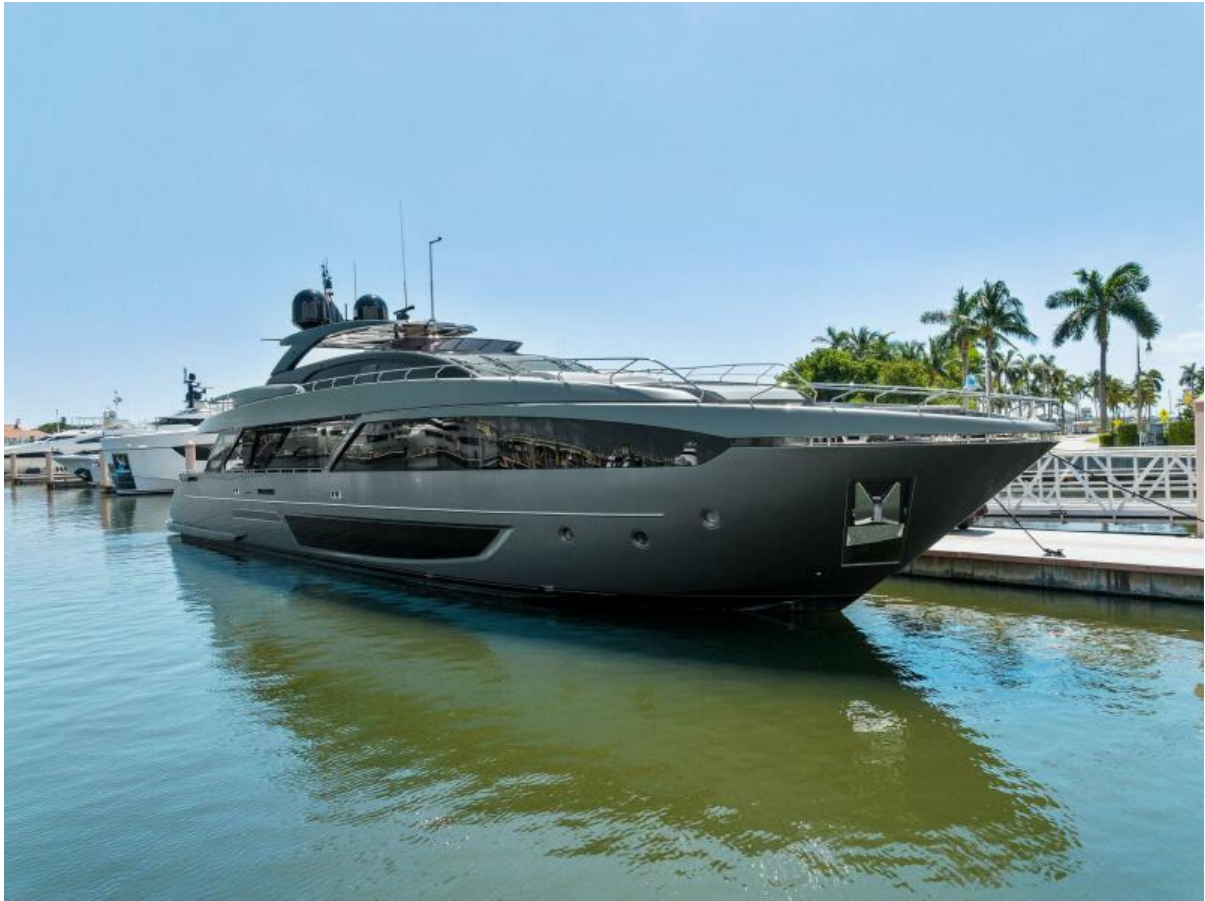
Riva Dolcevita 110 - Profile 2024 Riva Dolcevita 110