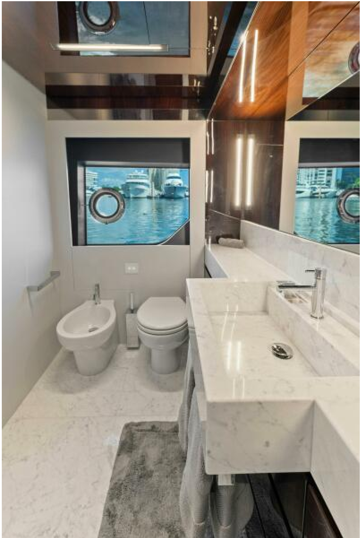
Riva Dolce Vita 110 - VIP Ensuite 2024 Riva Dolce Vita 110