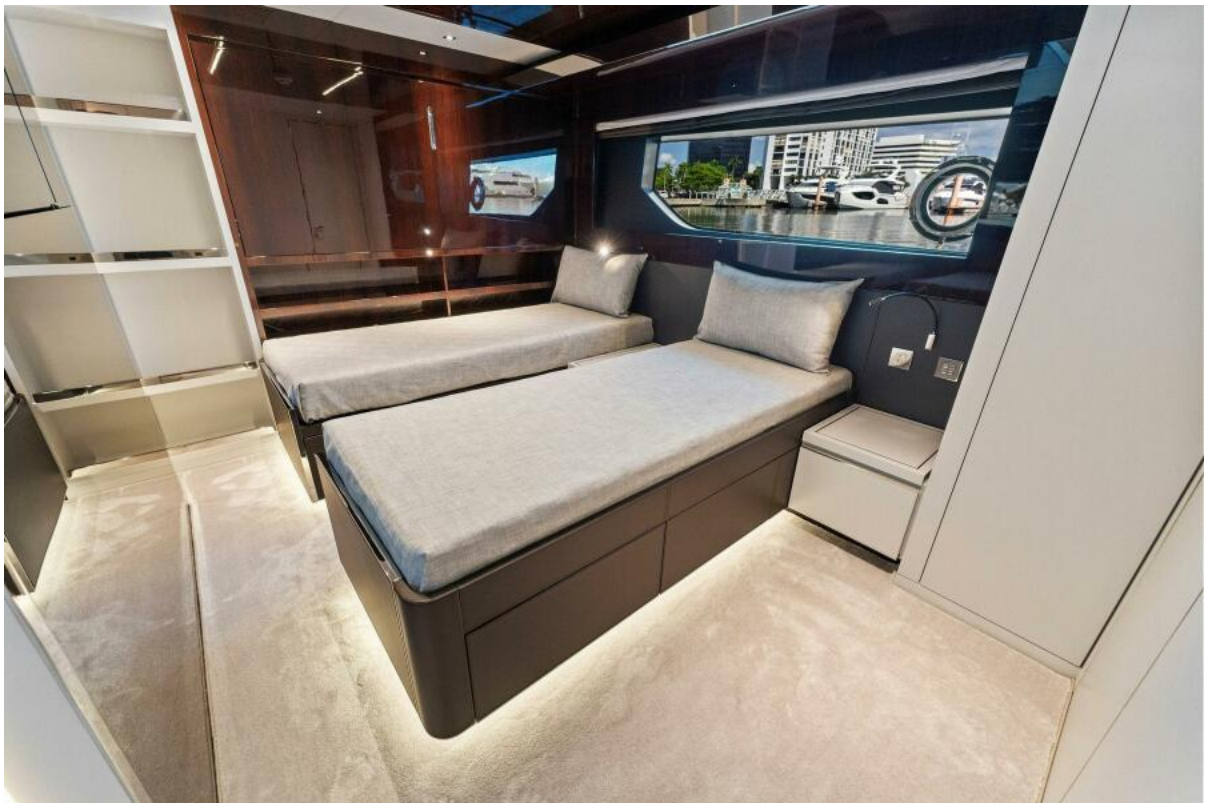
Riva Dolcevita 110 - Starboard Forward Guest Stateroom 2024 Riva Dolcevita 110