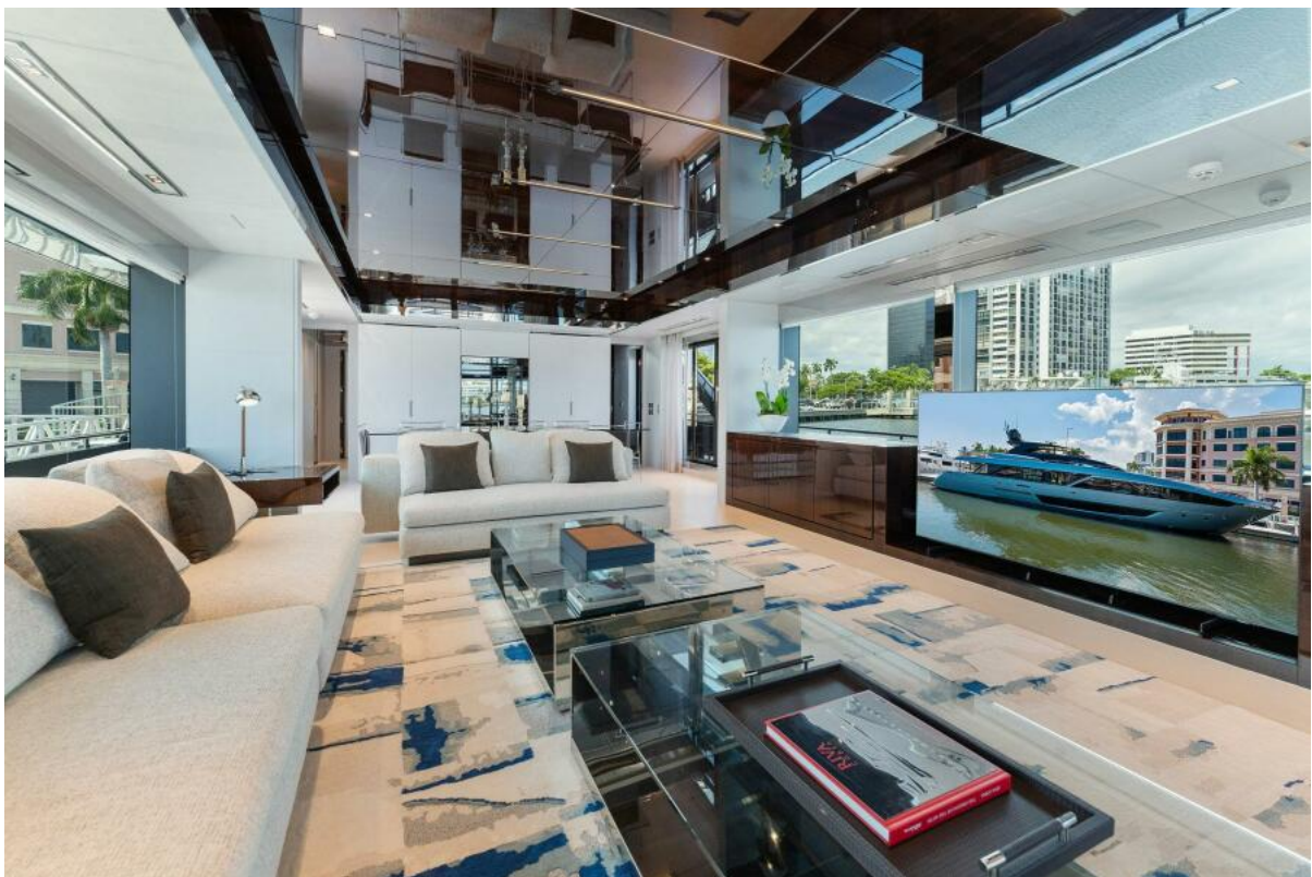
Riva Dolcevita 110 - Salon 2024 Riva Dolcevita 110