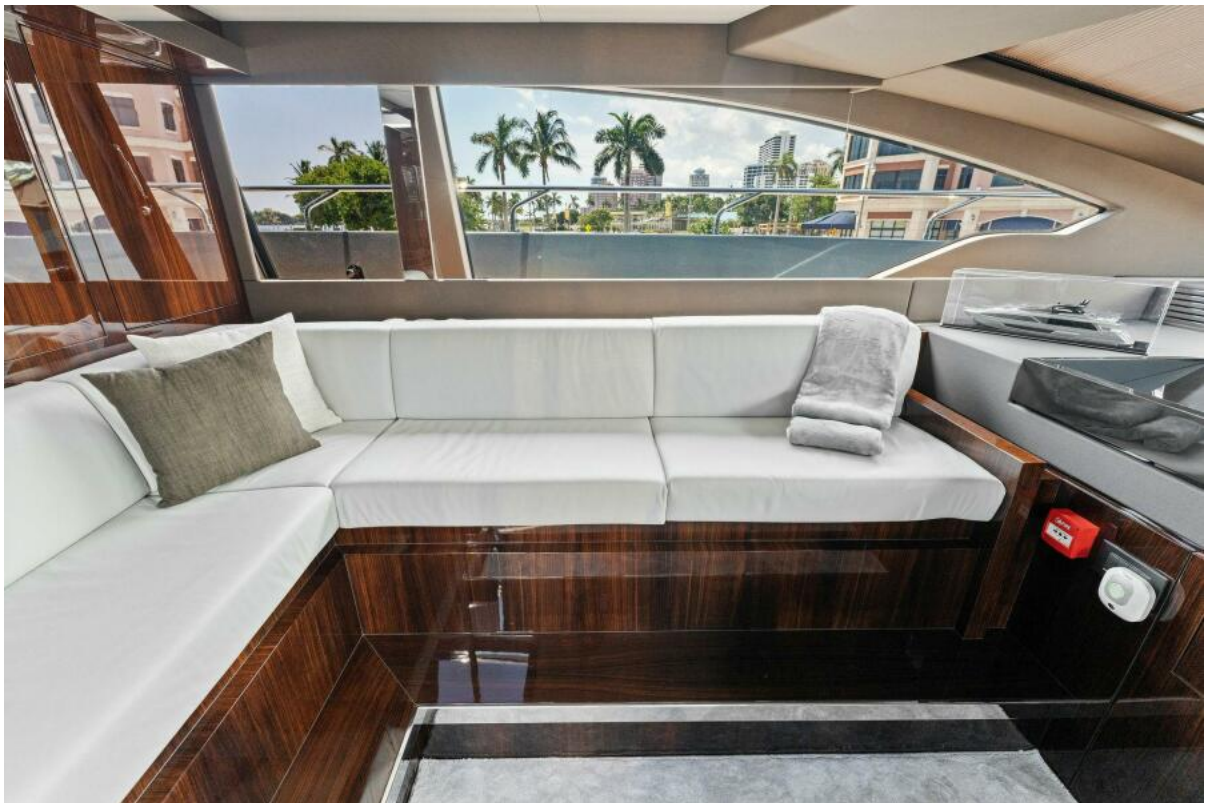
Riva Dolcevita 110 - Bridge 2024 Riva Dolcevita 110