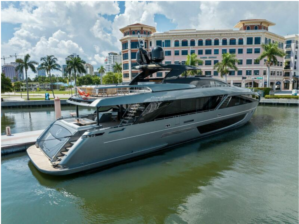
Riva Dolcevita 110 - Profile 2024 Riva Dolcevita 110