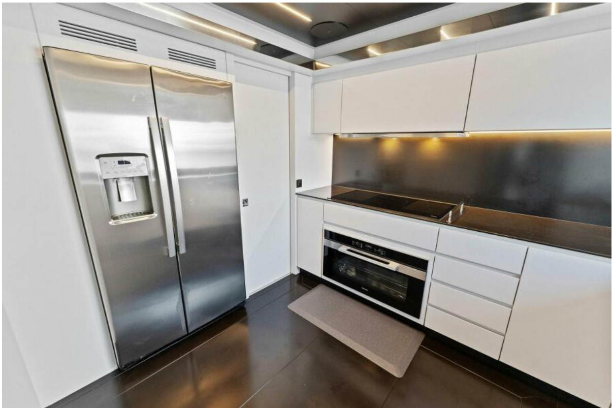
Riva Dolcevit 110 - Galley 2024 Riva Dolcevit 110