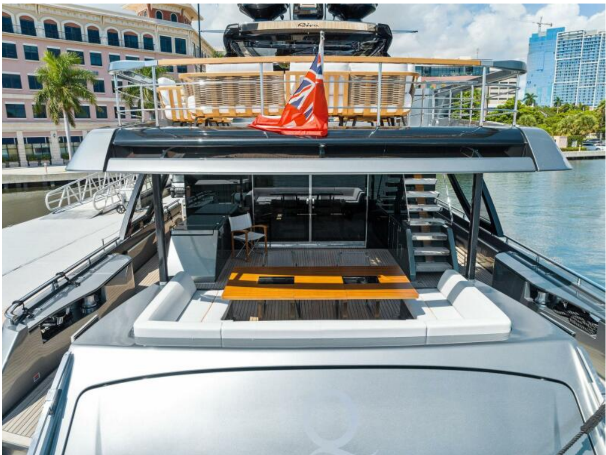
Riva Dolcevit 110 - Aerial Stern 2024 Riva Dolcevit 110