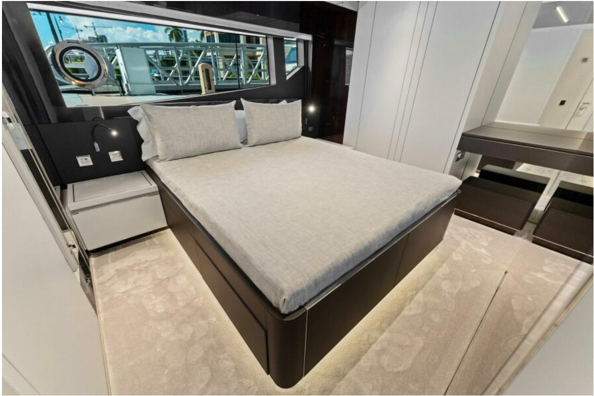
Riva Dolcevita 110 - VIP Ensuite 2024 Riva Dolcevita 110