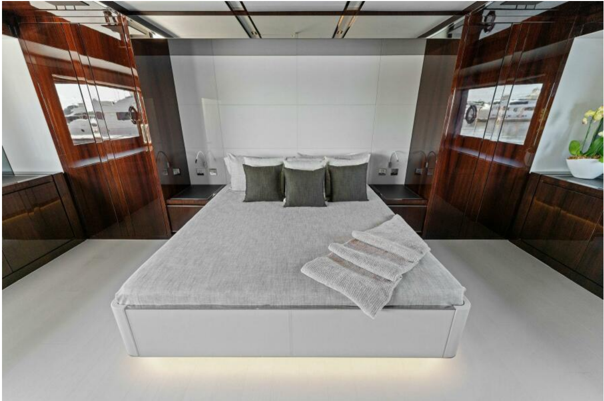
Riva Dolcevita 110 - Master Stateroom 2024 Riva Dolcevita 110