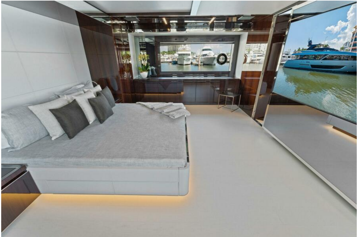
Riva Dolcevita 110 - Master Stateroom 2024 Riva Dolcevita 110