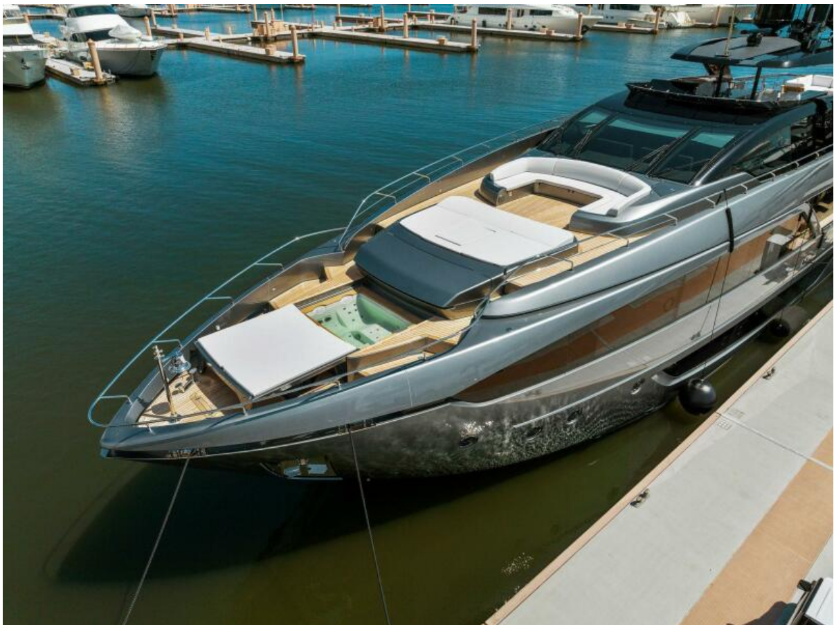
Riva Dolcevita 110 - Aerial 2024 Riva Dolcevita 110