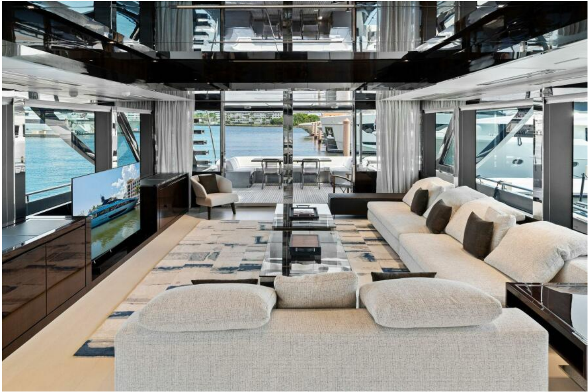
Riva Dolcevita 110 - Salon 2024 Riva Dolcevita 110