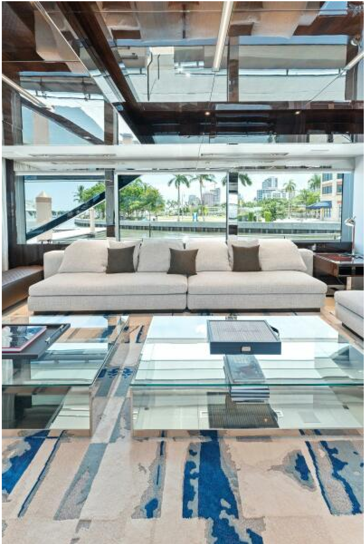
Riva Dolcevita 110 - Salon 2024 Riva Dolcevita 110