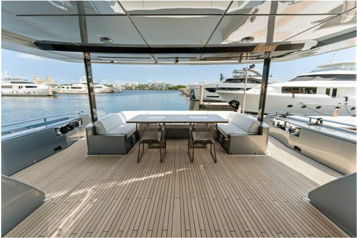
Riva Dolcevita 110 - Maindeck 2024 Riva Dolcevita 110