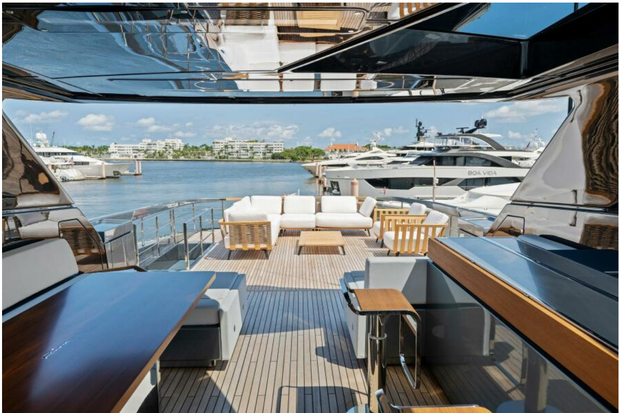
Riva Dolcevida 110 - Bridge 2024 Riva Dolcevida 110