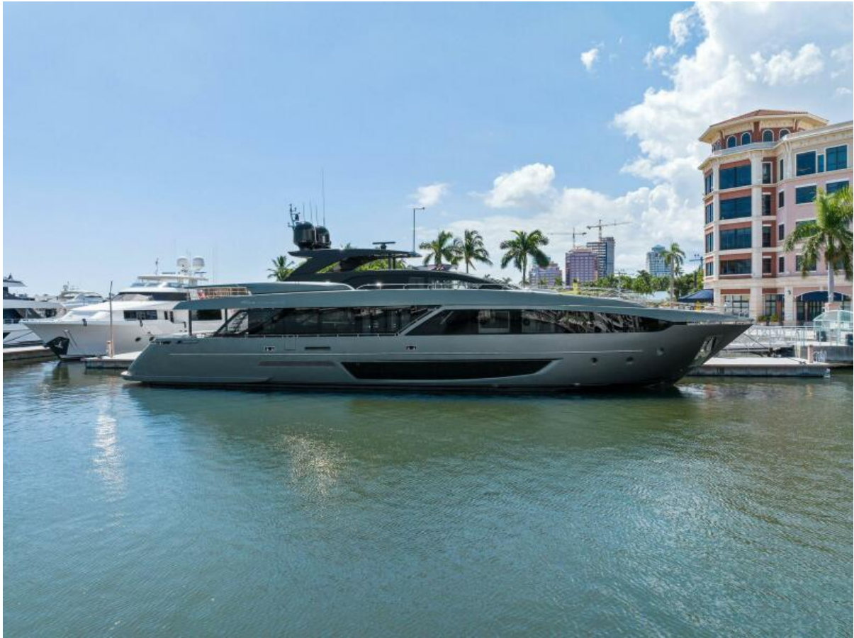
Riva Dolcevita 110 - Profile 2024 Riva Dolcevita 110