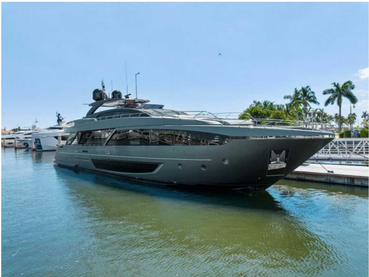
Riva Dolcevita 110 - Profile 2024 Riva Dolcevita 110