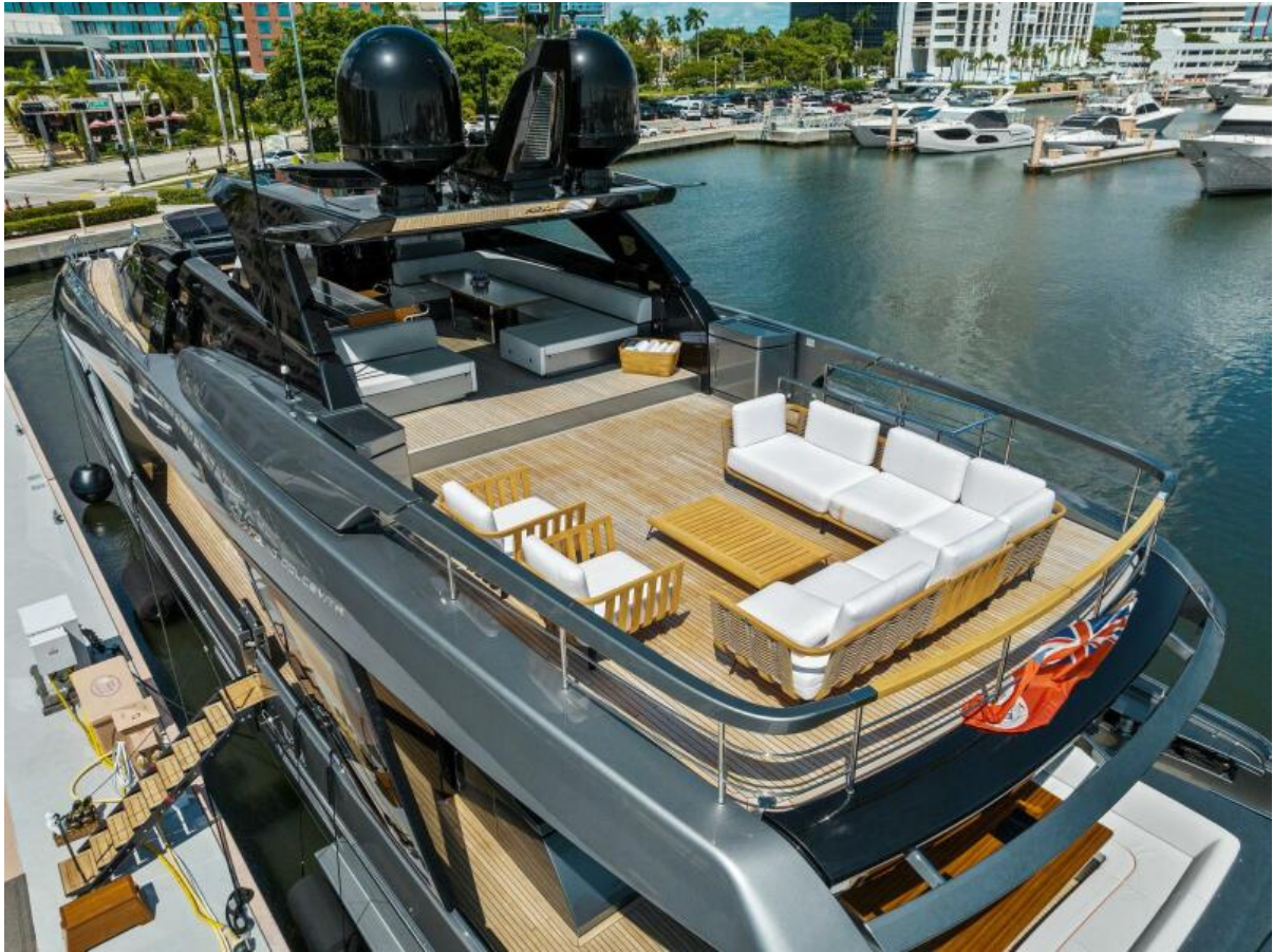
Riva Dolce Vita 110 - Aerial 2024 Riva Dolce Vita 110