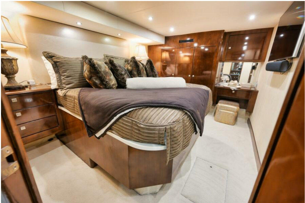
Ocean Yachts 73 Unconquered - Master Stateroom