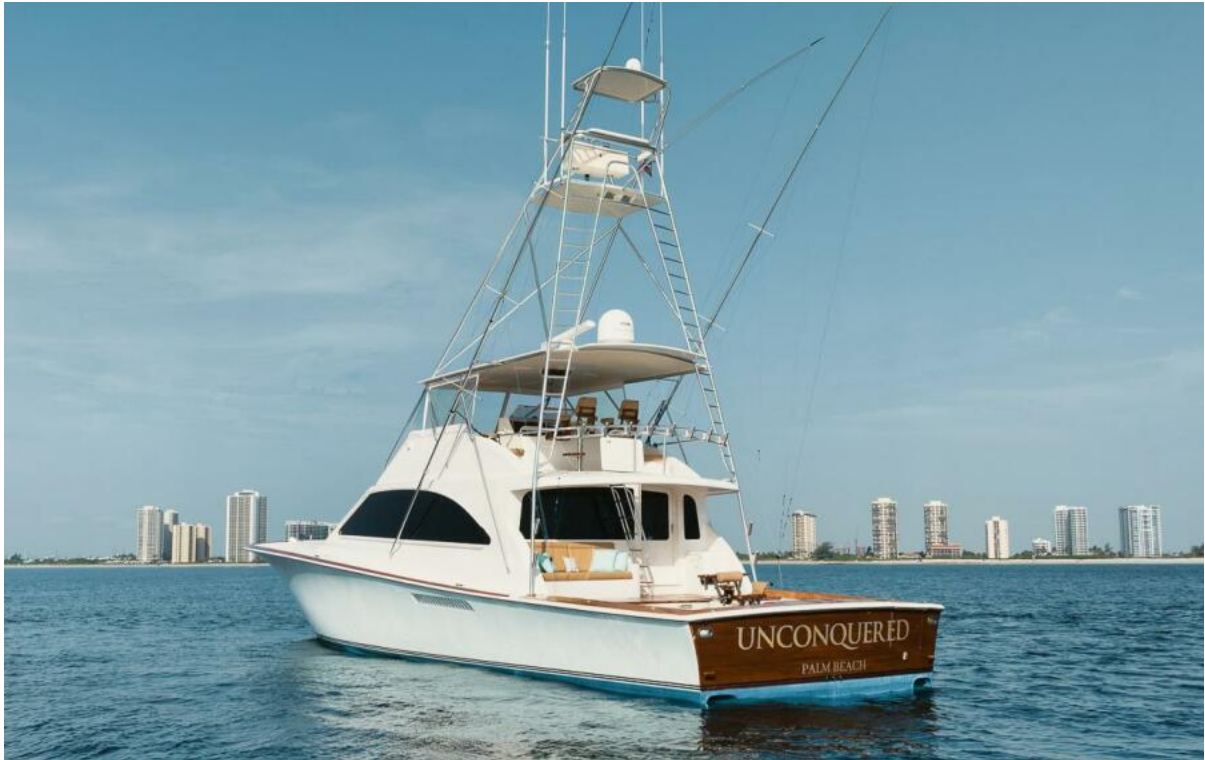
Ocean Yachts 73 Unconquered - Profile 2005 Ocean Yachts 73 Super Sport - Unconquered