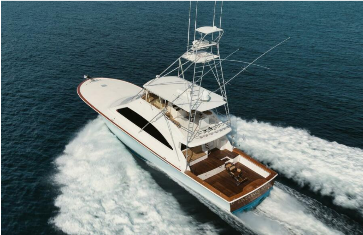
Ocean Yachts 73 Unconquered - Running Shot 2005 Ocean Yachts 73 Super Sport - Unconquered