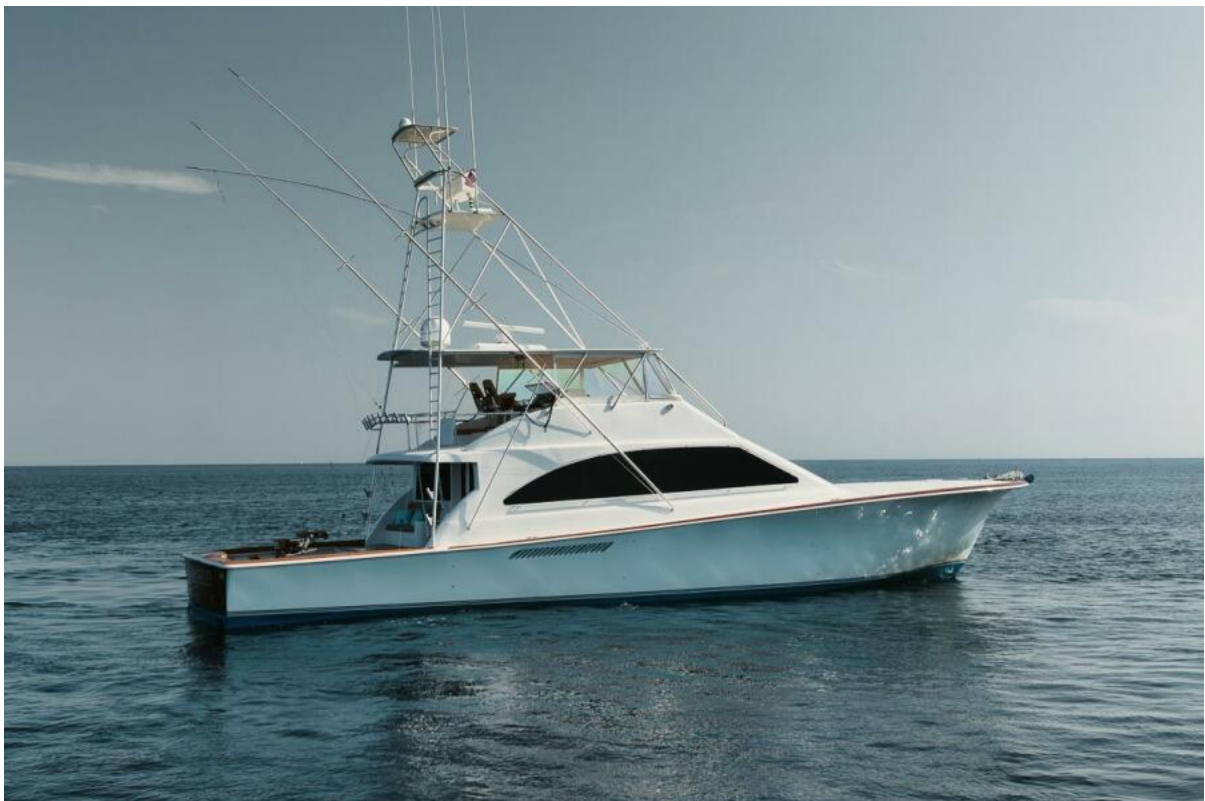
Ocean Yachts 73 Unconquered - Profile 2005 Ocean Yachts 73 Super Sport - Unconquered