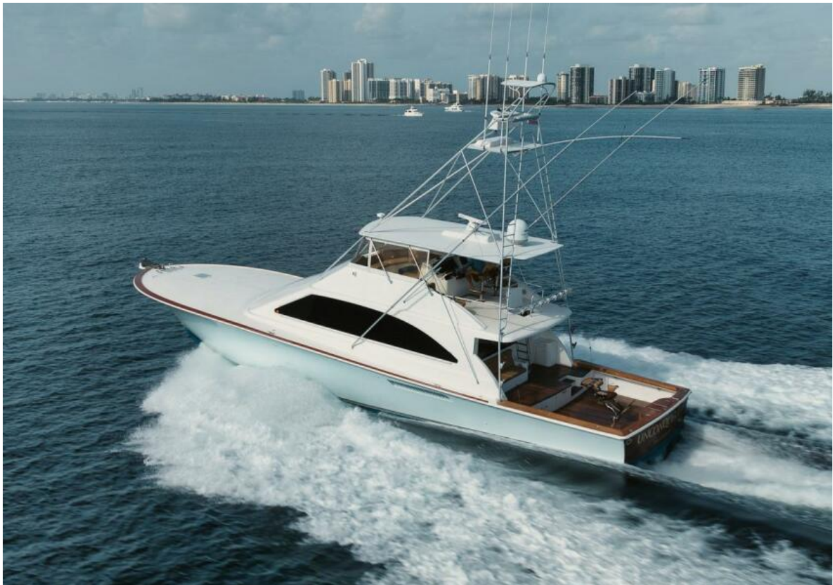
Ocean Yachts 73 Unconquered - Running Shot 2005 Ocean Yachts 73 Super Sport - Unconquered