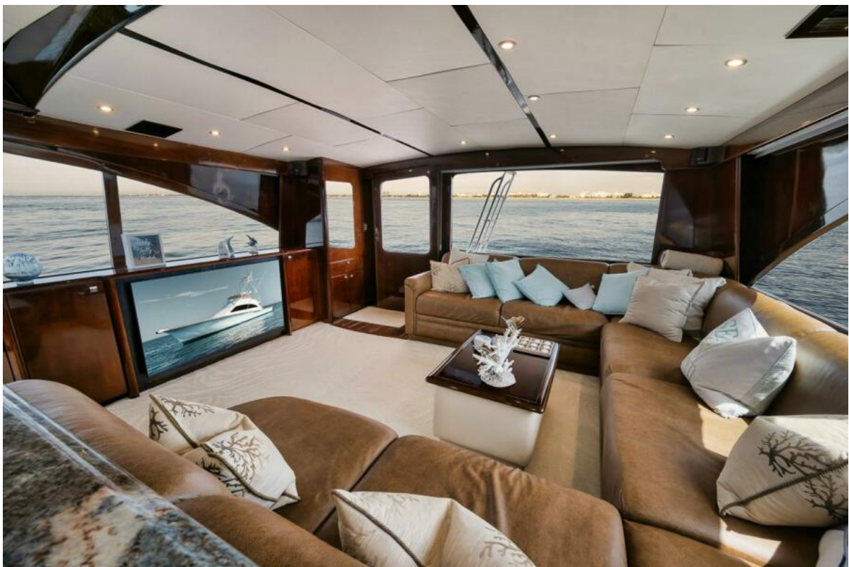
Ocean Yachts 73 Unconquered - Salon