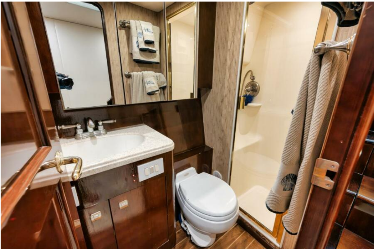
Ocean Yachts 73 Unconquered - VIP Head 2005 Ocean Yachts 73 Super Sport - Unconquered