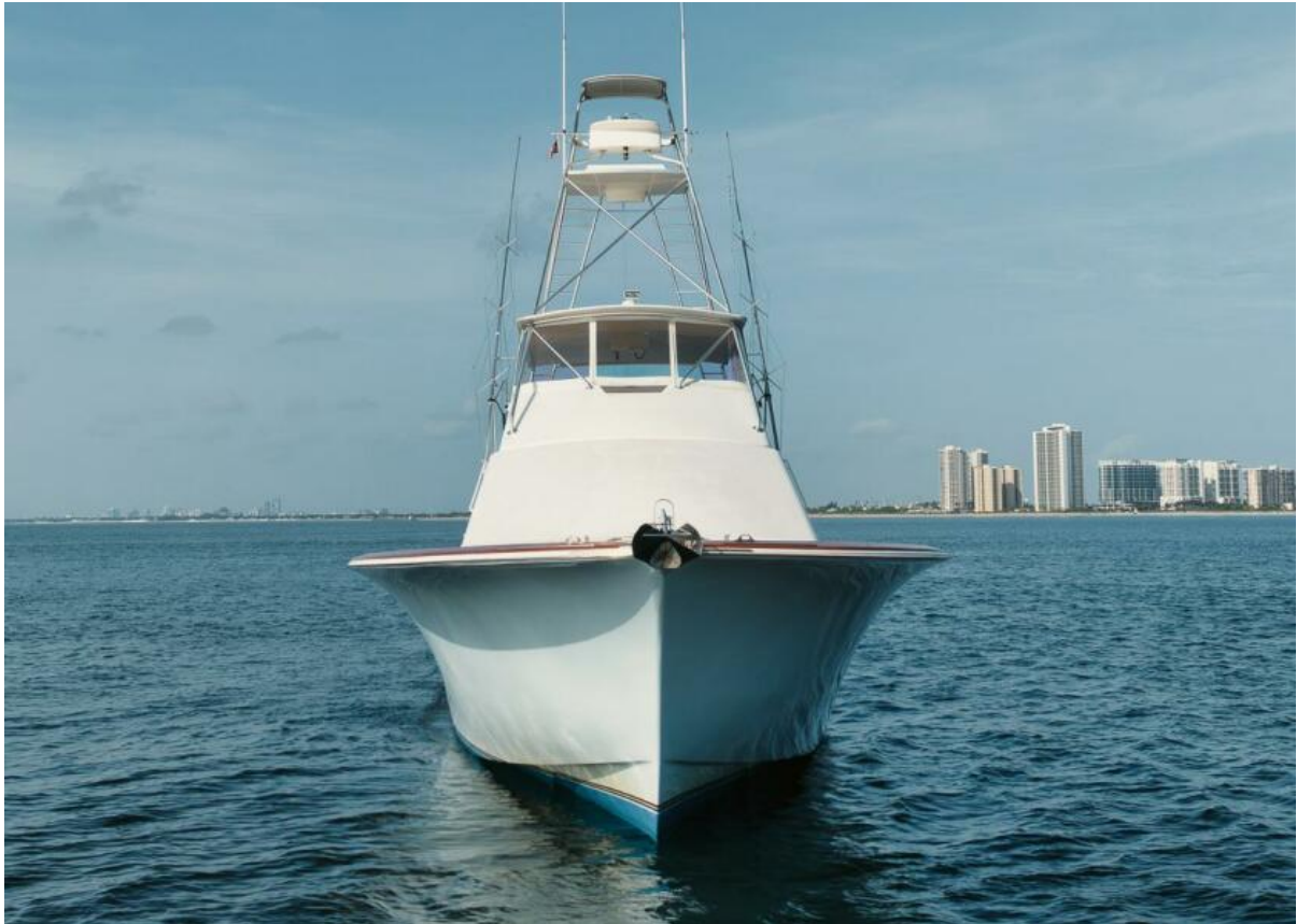
Ocean Yachts 73 Unconquered - Profile 2005 Ocean Yachts 73 Super Sport - Unconquered