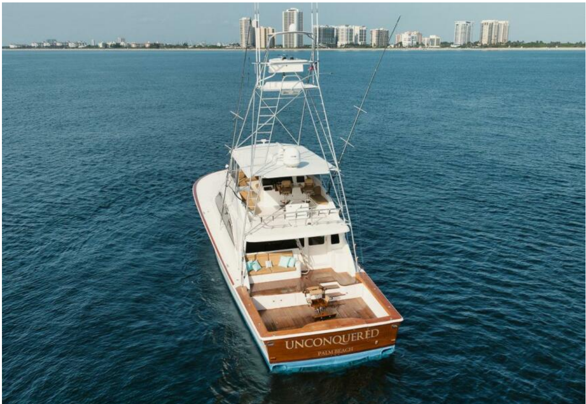
Ocean Yachts 73 Unconquered - Profile 2005 Ocean Yachts 73 Super Sport - Unconquered