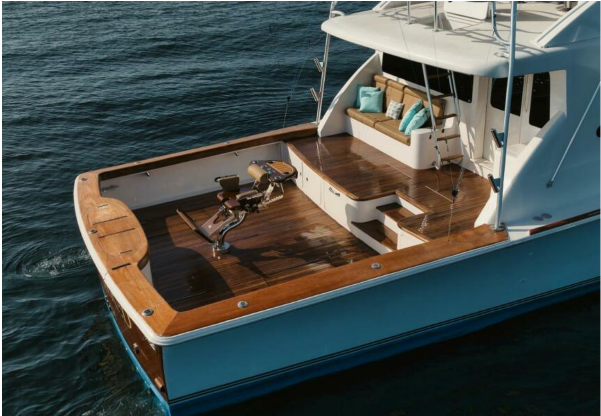
Ocean Yachts 73 Unconquered - Cockpit Arial 2005 Ocean Yachts 73 Super Sport - Unconquered