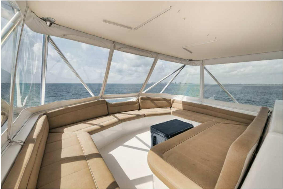
Ocean Yachts 73 Unconquered - Flybridge 2005 Ocean Yachts 73 Super Sport - Unconquered