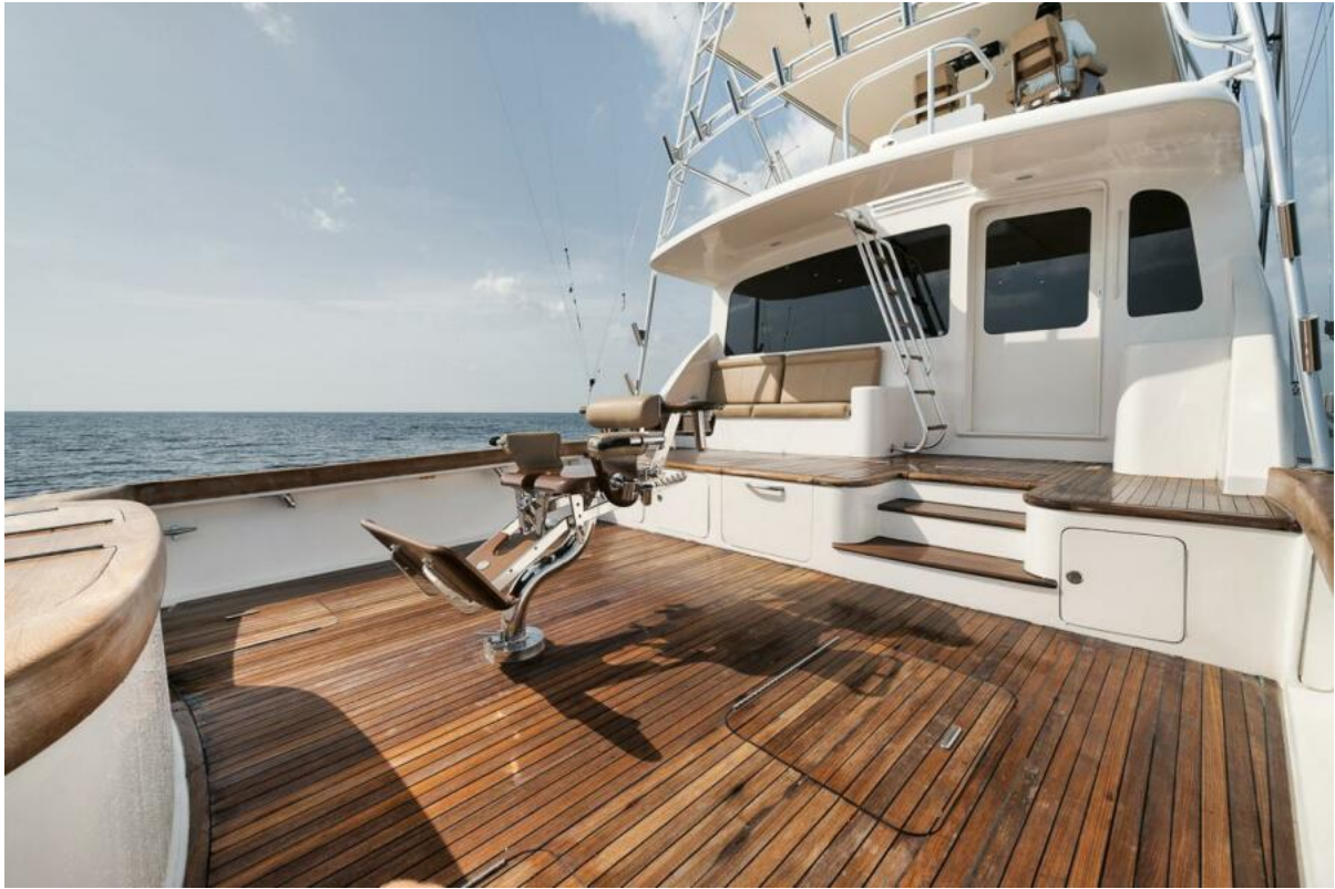
Ocean Yachts 73 Unconquered - Cockpit 2005 Ocean Yachts 73 Super Sport - Unconquered