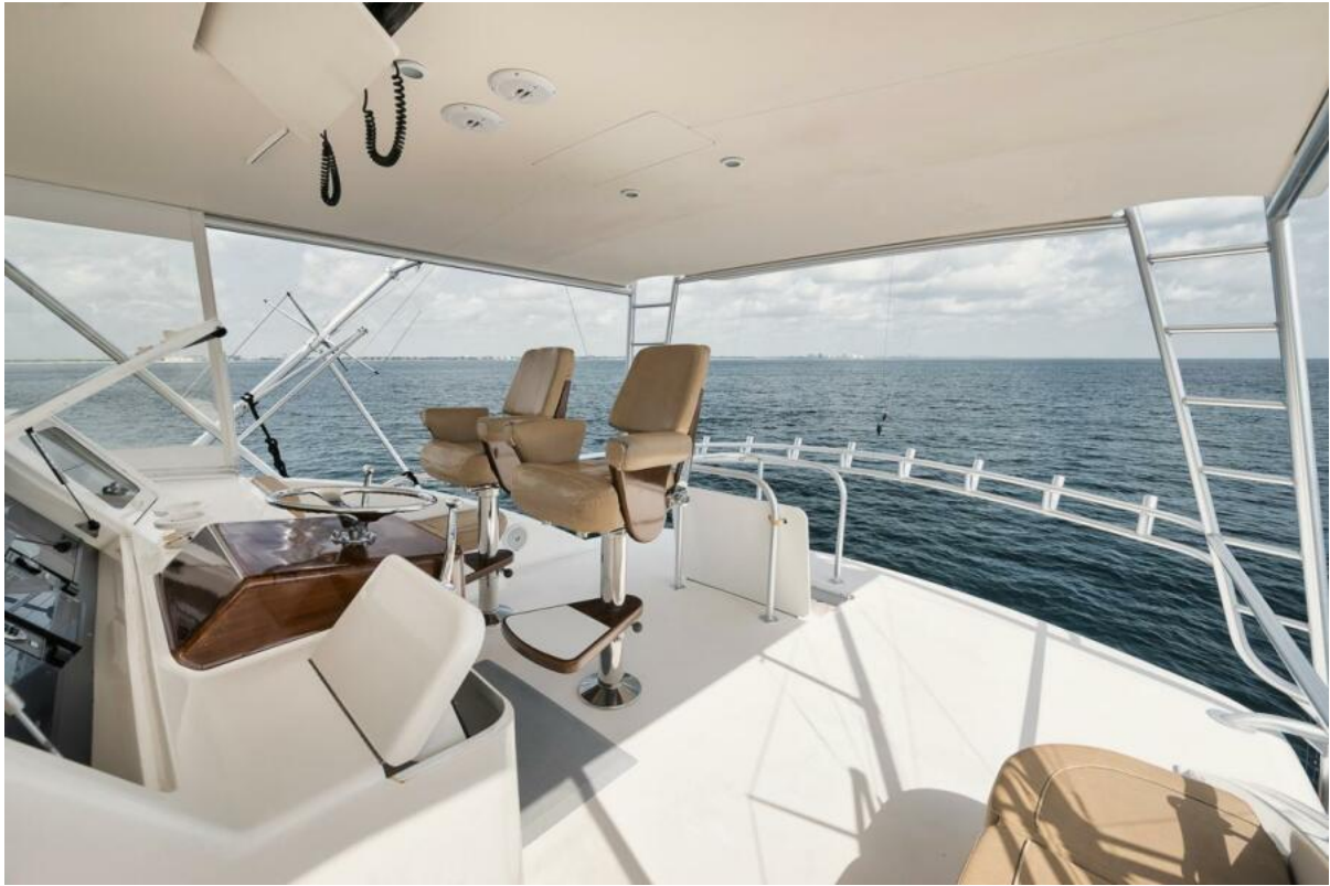
Ocean Yachts 73 Unconquered - Flybridge 2005 Ocean Yachts 73 Super Sport - Unconquered