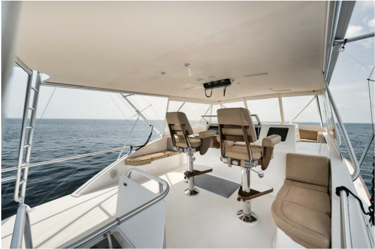
Ocean Yachts 73 Unconquered - Flybridge 2005 Ocean Yachts 73 Super Sport - Unconquered