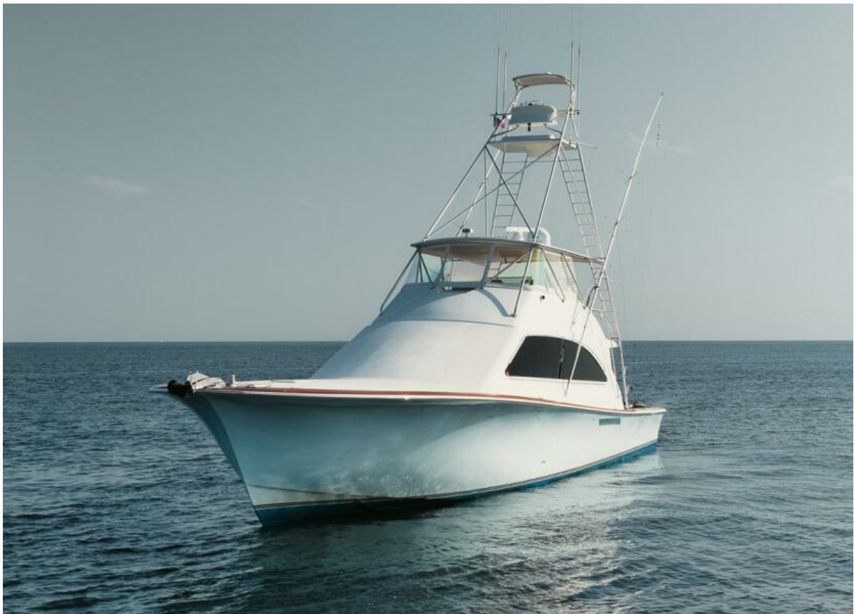
Ocean Yachts 73 Unconquered - Profile 2005 Ocean Yachts 73 Super Sport - Unconquered