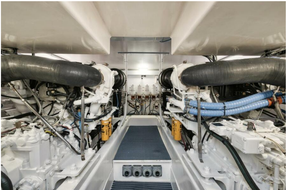
Ocean Yachts 73 Unconquered - Engine Room 2005 Ocean Yachts 73 Super Sport - Unconquered