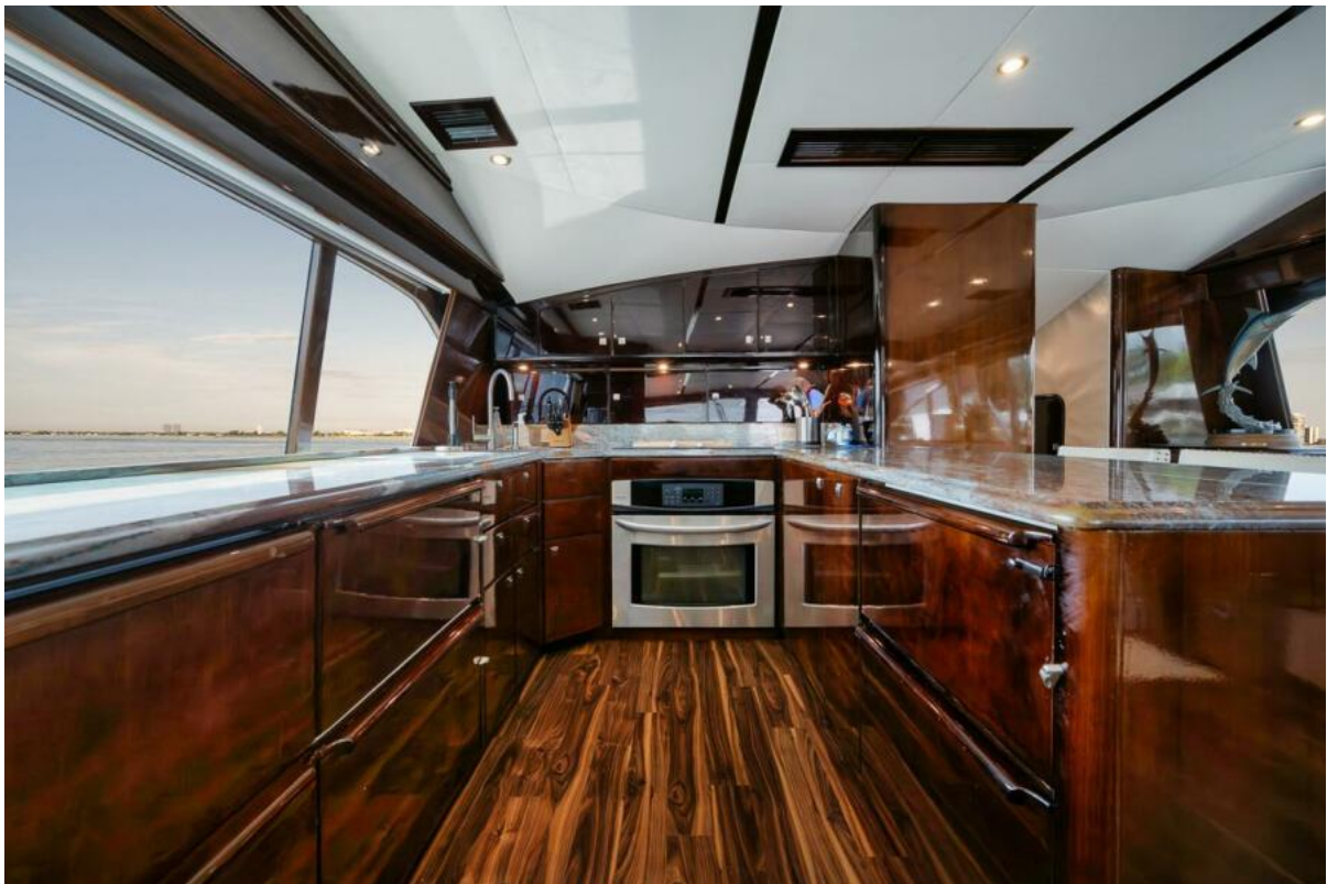
Ocean Yachts 73 Unconquered - Galley