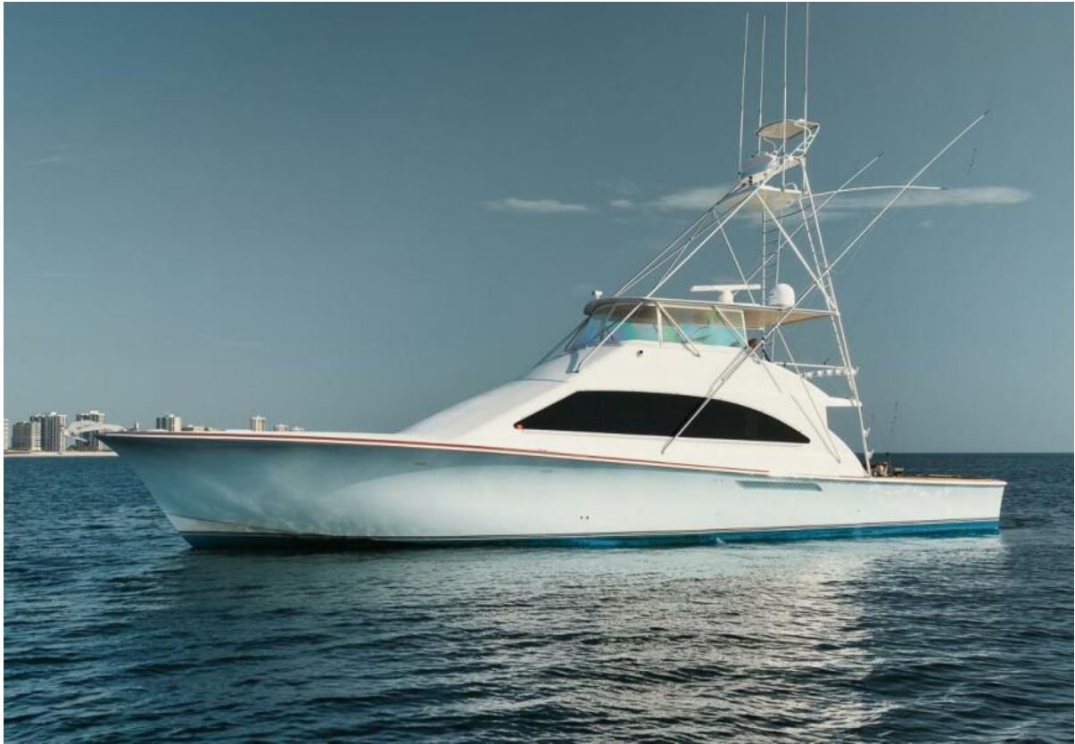
Ocean Yachts 73 Unconquered - Profile 2005 Ocean Yachts 73 Super Sport - Unconquered