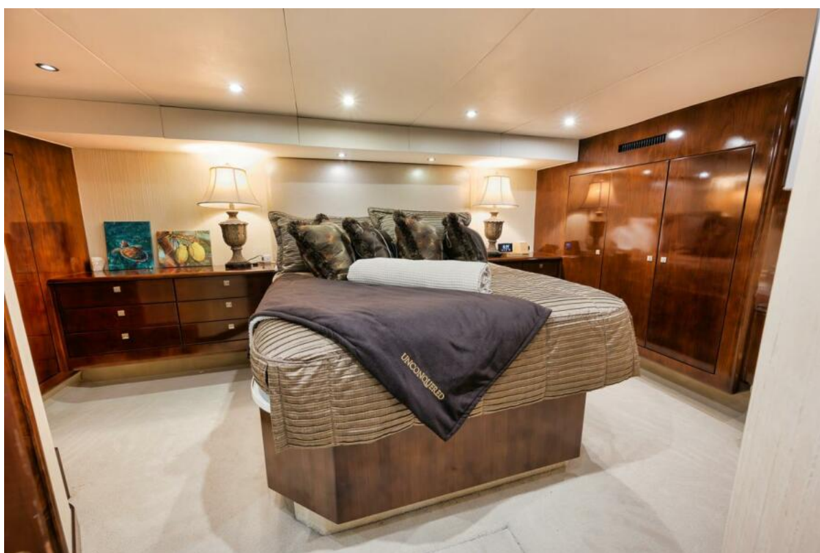
Ocean Yachts 73 Unconquered - Master Stateroom