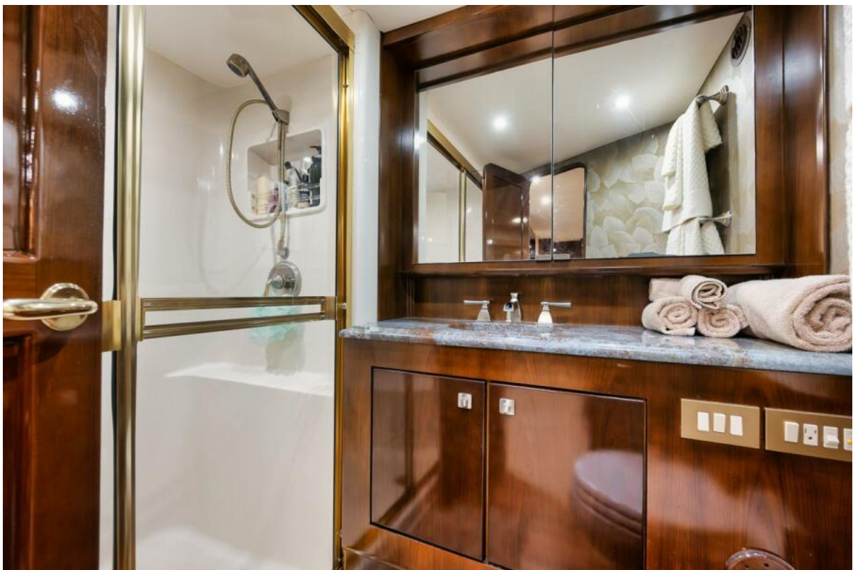
Ocean Yachts 73 Unconquered - Master Head 2005 Ocean Yachts 73 Super Sport - Unconquered