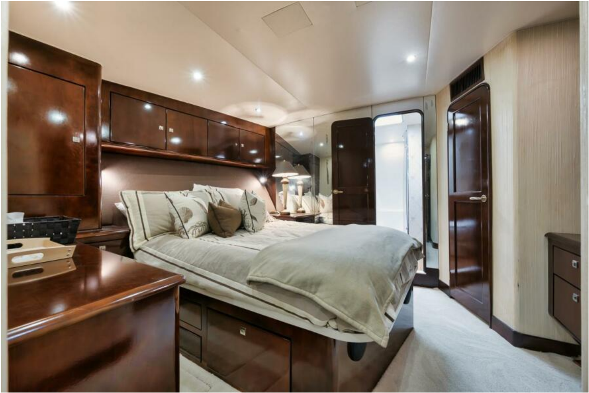
Ocean Yachts 73 Unconquered - VIP Stateroom 2005 Ocean Yachts 73 Super Sport - Unconquered