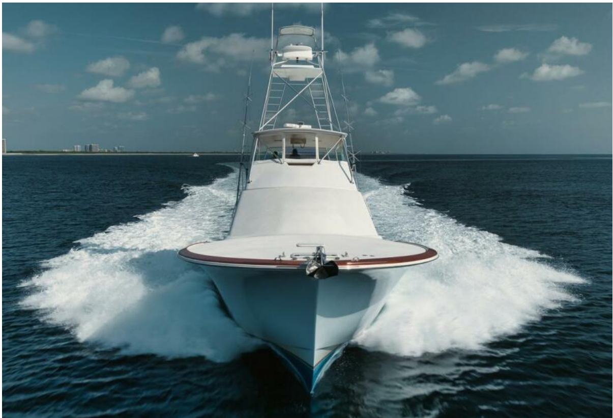
Ocean Yachts 73 Unconquered - Running Shot 2005 Ocean Yachts 73 Super Sport - Unconquered