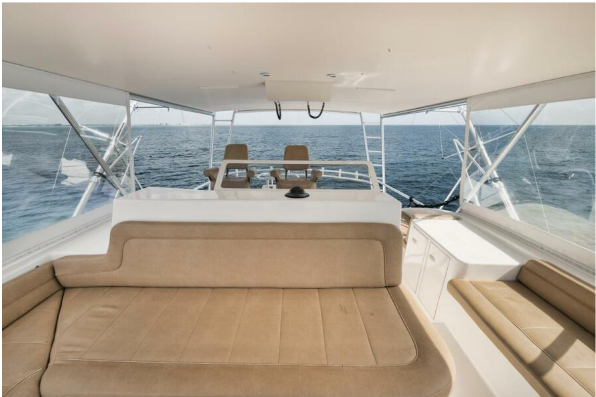
Ocean Yachts 73 Unconquered - Flybridge 2005 Ocean Yachts 73 Super Sport - Unconquered