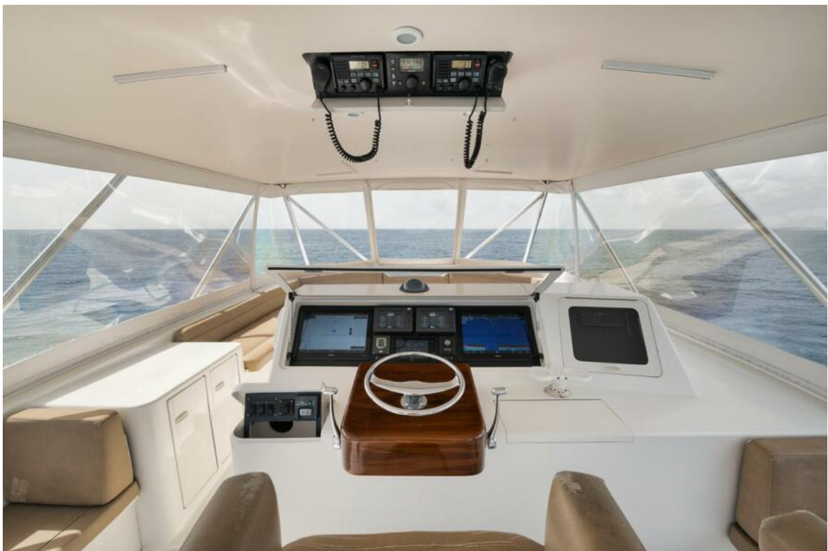
Ocean Yachts 73 Unconquered - Flybridge 2005 Ocean Yachts 73 Super Sport - Unconquered