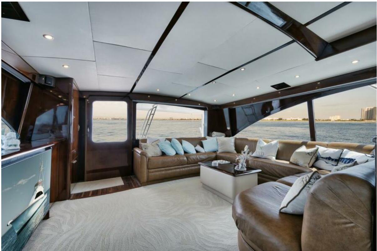
Ocean Yachts 73 Unconquered - Salon