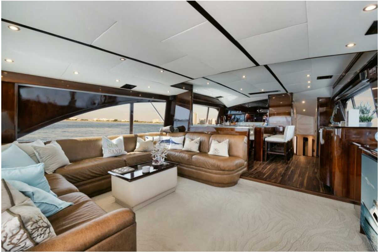
Ocean Yachts 73 Unconquered - Salon