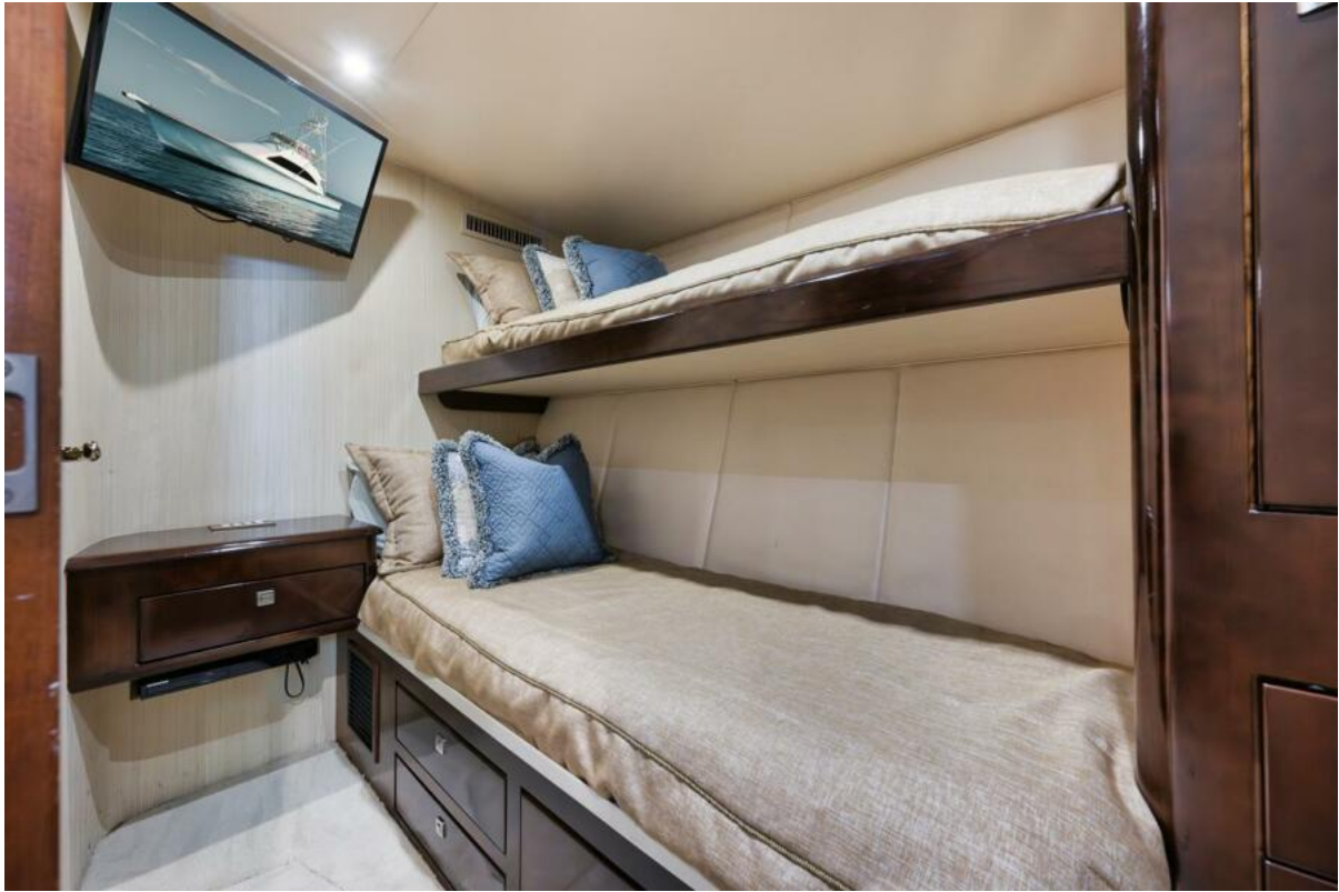
Ocean Yachts 73 Unconquered - Starboard Guest Stateroom 2005 Ocean Yachts 73 Super Sport - Unconquered