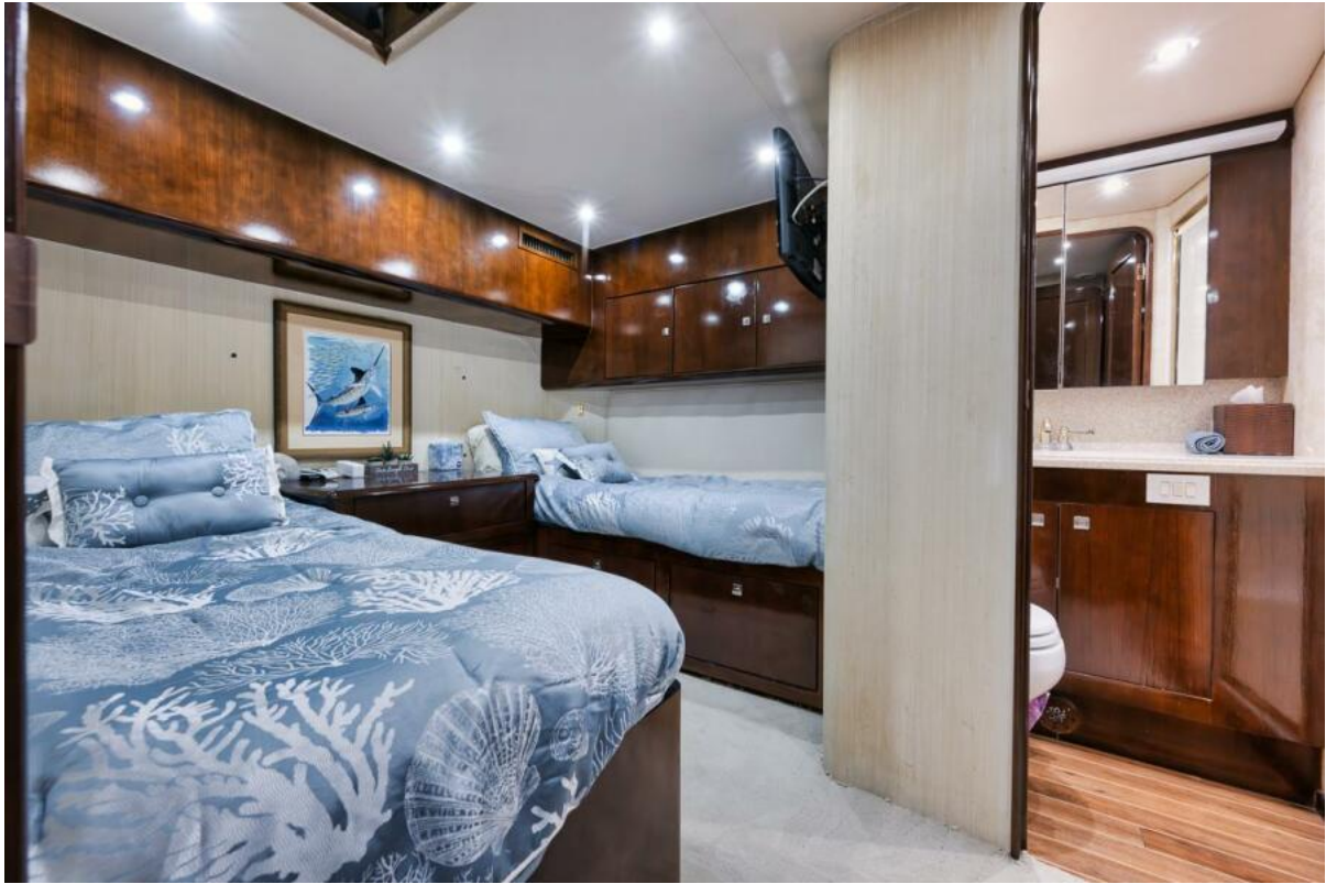
Ocean Yachts 73 Unconquered - Port Guest Stateroom 2005 Ocean Yachts 73 Super Sport - Unconquered