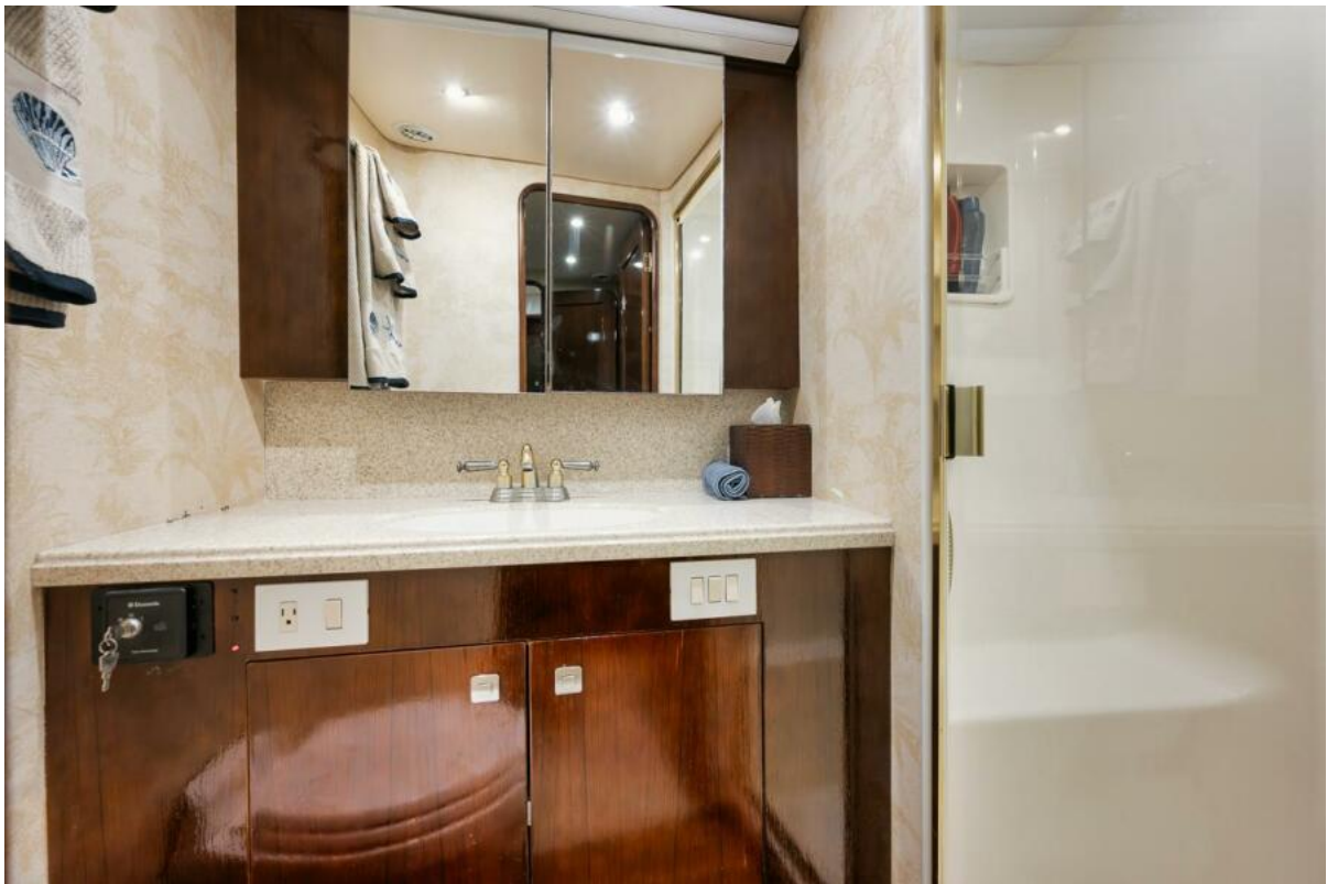
Ocean Yachts 73 Unconquered - Guest Head 2005 Ocean Yachts 73 Super Sport - Unconquered