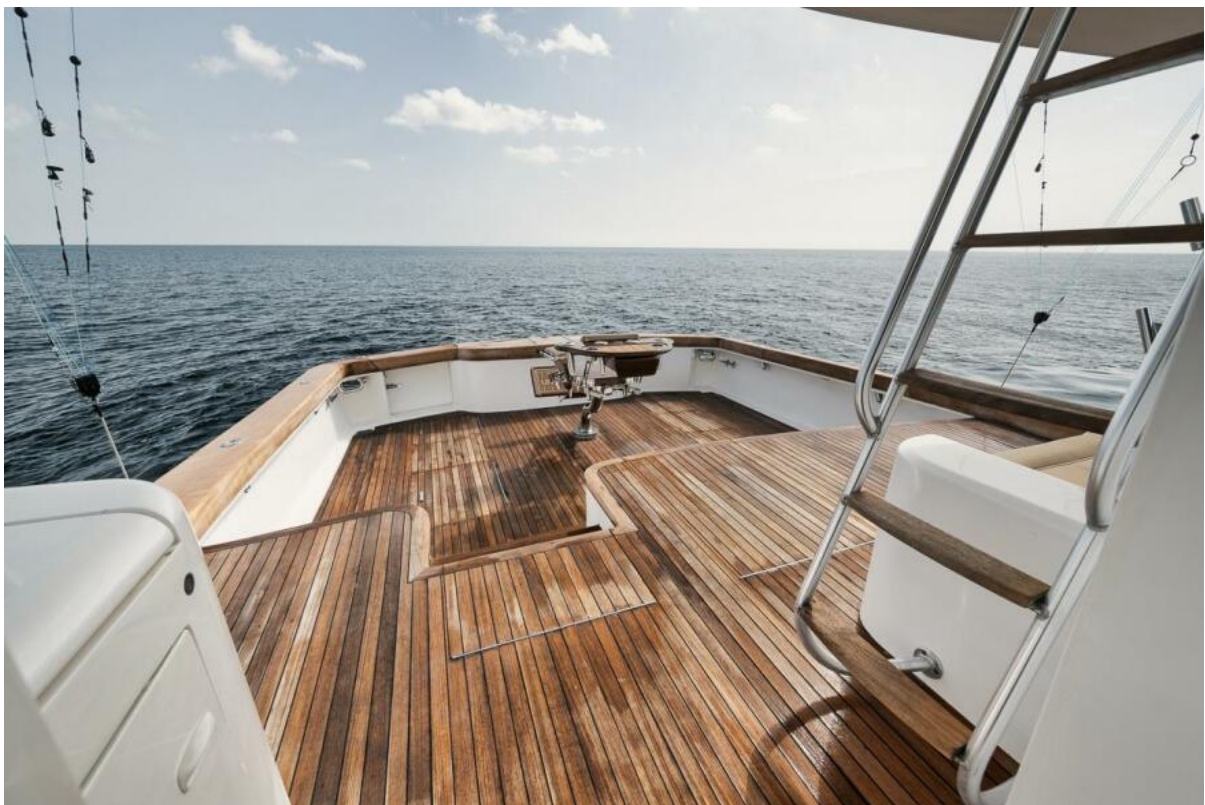
Ocean Yachts 73 Unconquered - Cockpit 2005 Ocean Yachts 73 Super Sport - Unconquered