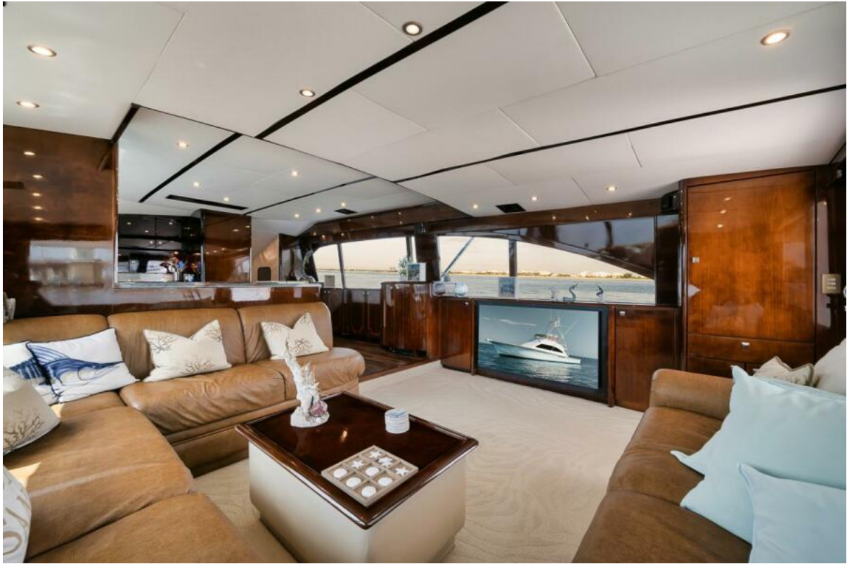
Ocean Yachts 73 Unconquered - Salon