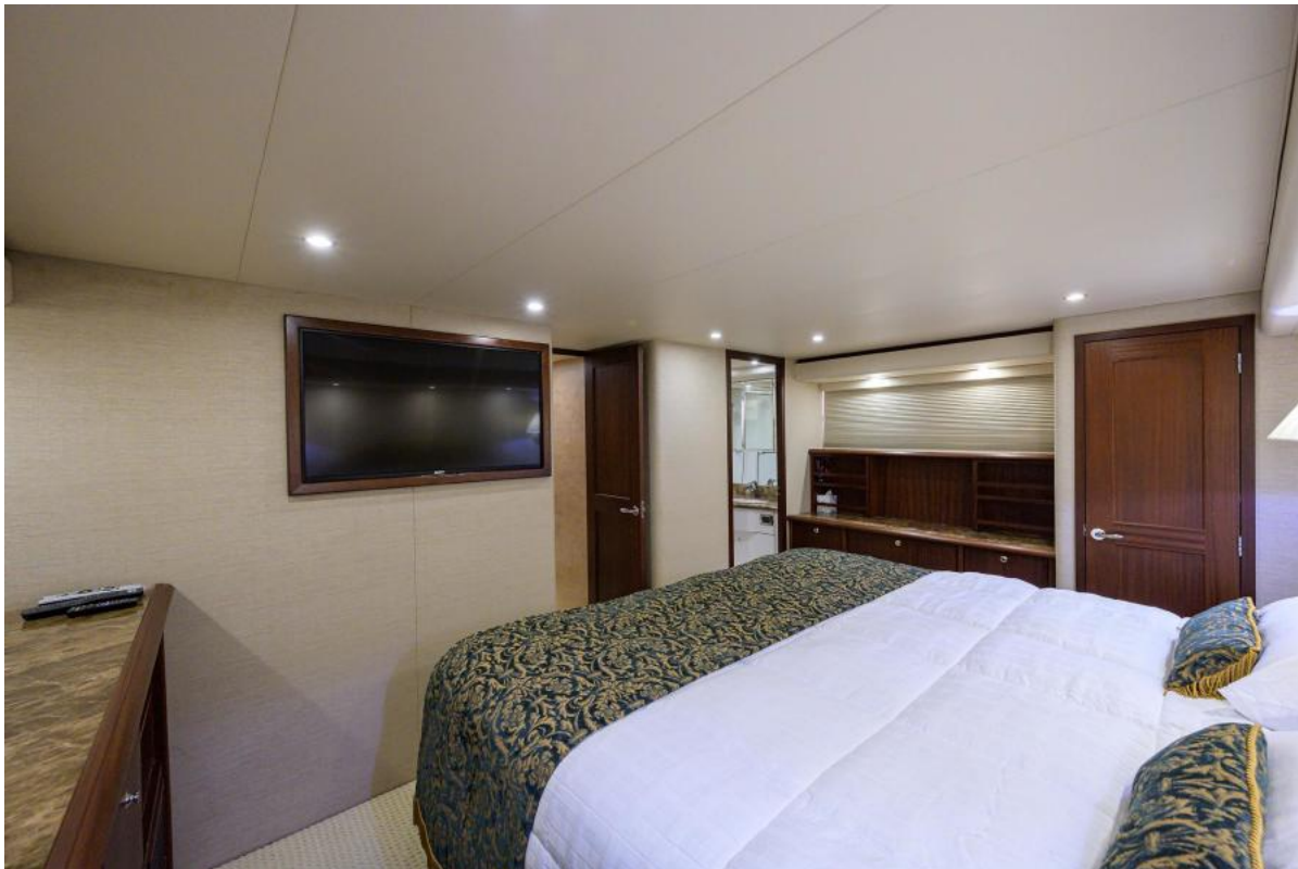
Pacific Mariner 65 Last Call - VIP Stateroom 2009 Pacific Mariner 65 - Last Call