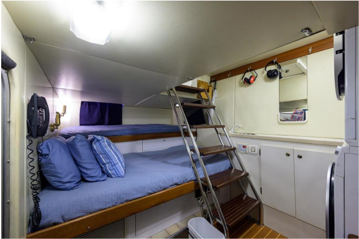
Pacific Mariner 65 Last Call - Crew Cabin 2009 Pacific Mariner 65 - Last Call