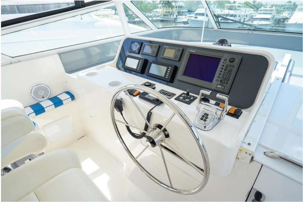
Pacific Mariner 65 Last Call - Flybridge 2009 Pacific Mariner 65 - Last Call