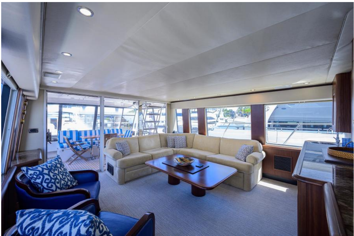
Pacific Mariner 65 Last Call - Salon 2009 Pacific Mariner 65 - Last Call