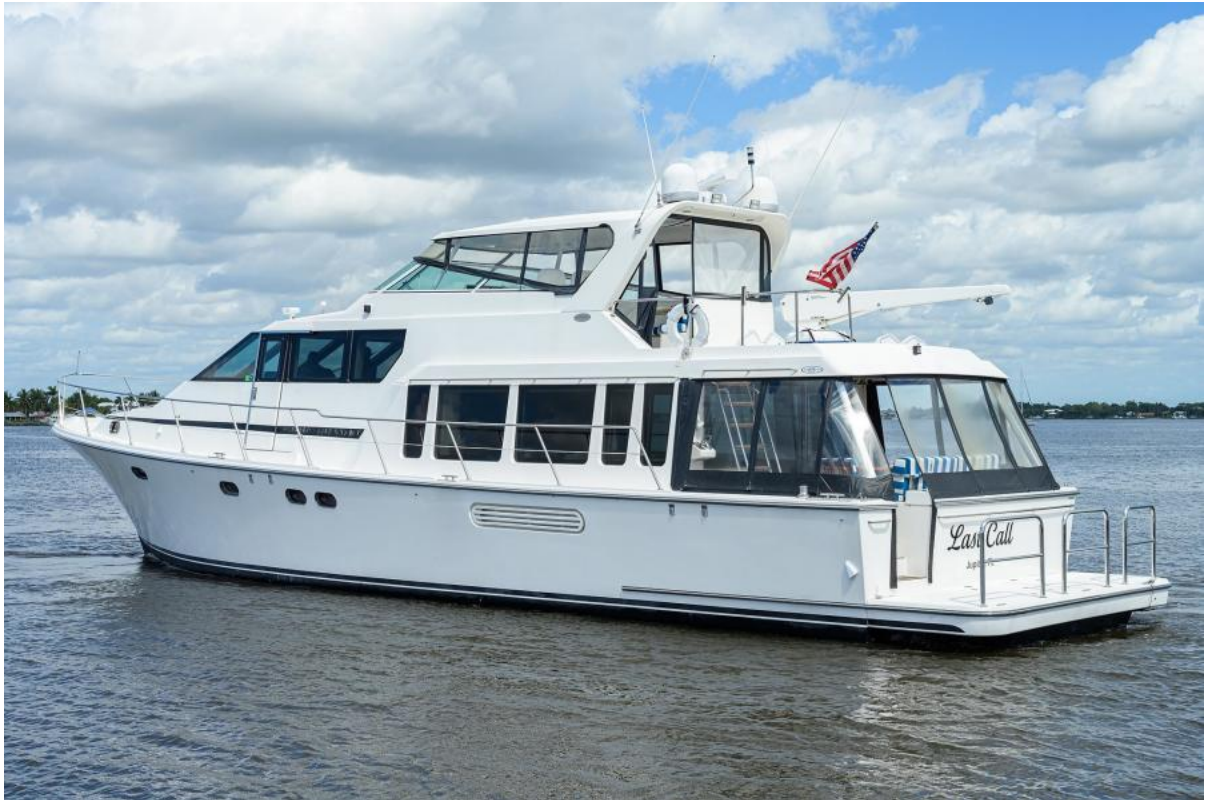
Pacific Mariner 65 Last Call - Profile 2009 Pacific Mariner 65 - Last Call