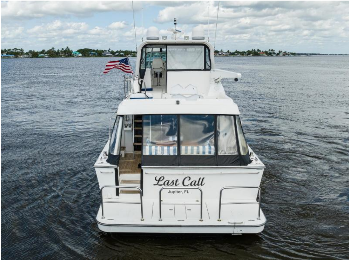
2009 PPacific Mariner 65 Last Call - Sternacific Mariner 65 - Last Call