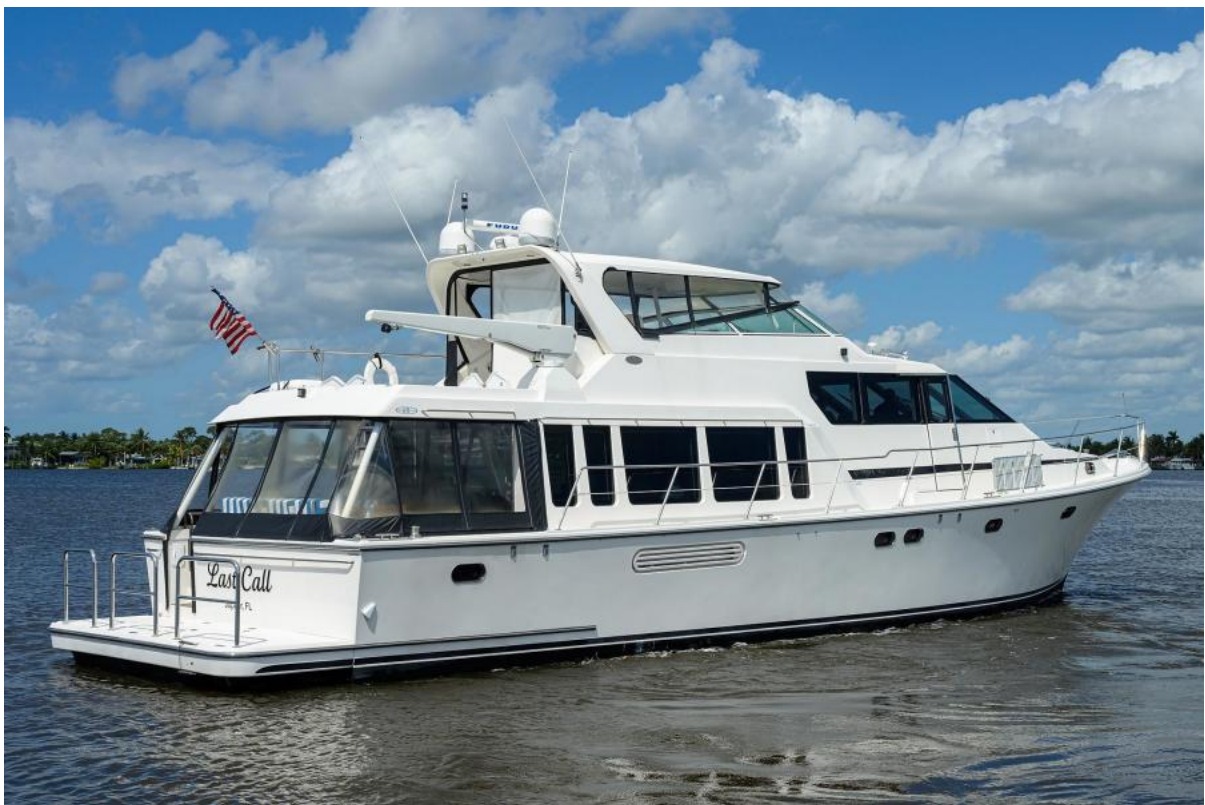
Pacific Mariner 65 Last Call - Profile 2009 Pacific Mariner 65 - Last Call