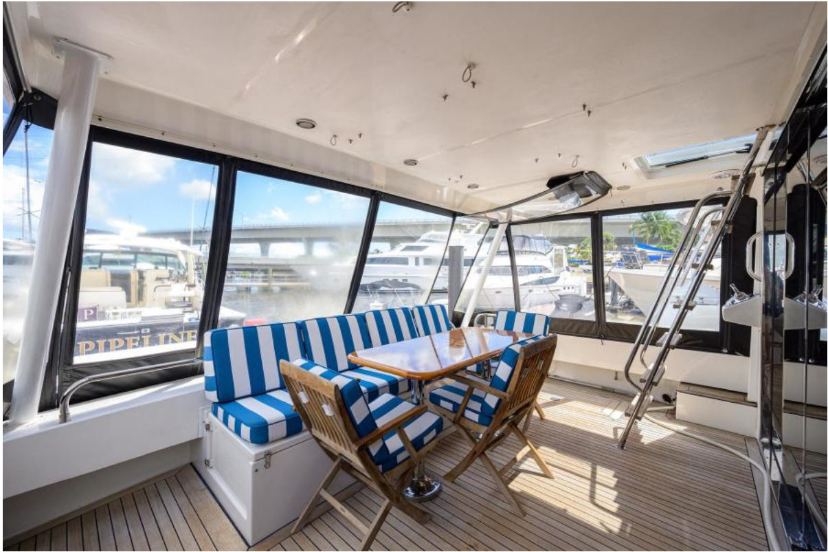
Pacific Mariner 65 Last Call - Aft Deck 2009 Pacific Mariner 65 - Last Call