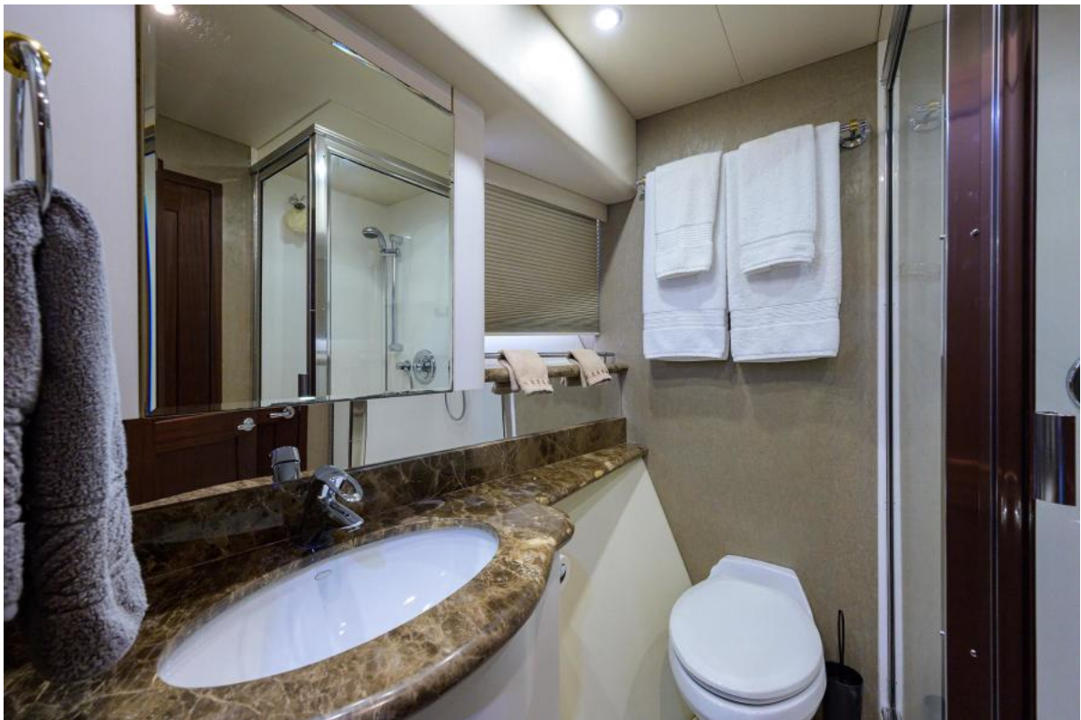
Pacific Mariner 65 Last Call - Port Guest Head 2009 Pacific Mariner 65 - Last Call