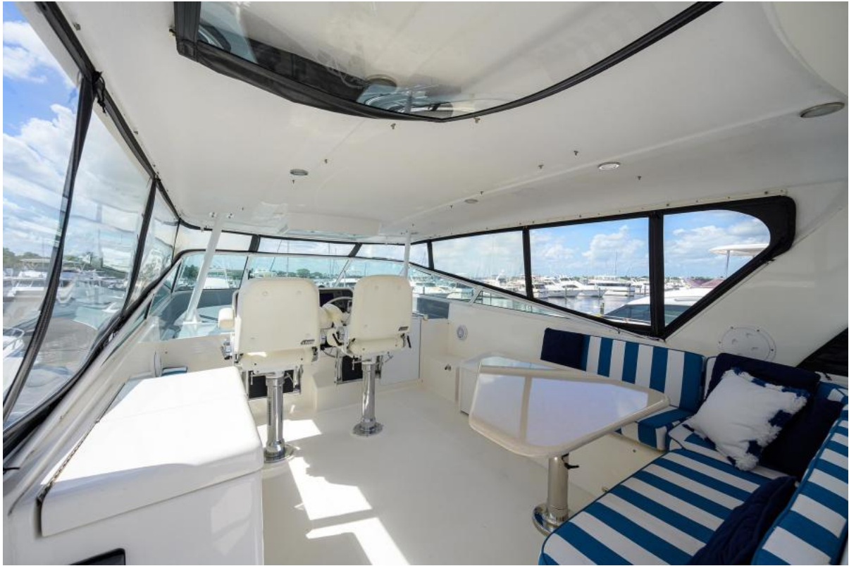
Pacific Mariner 65 Last Call - Flybridge 2009 Pacific Mariner 65 - Last Call