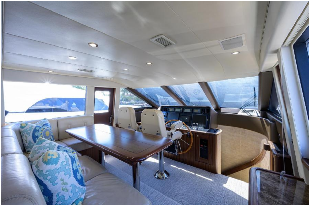
Pacific Mariner 65 Last Call - Pilothouse 2009 Pacific Mariner 65 - Last Call