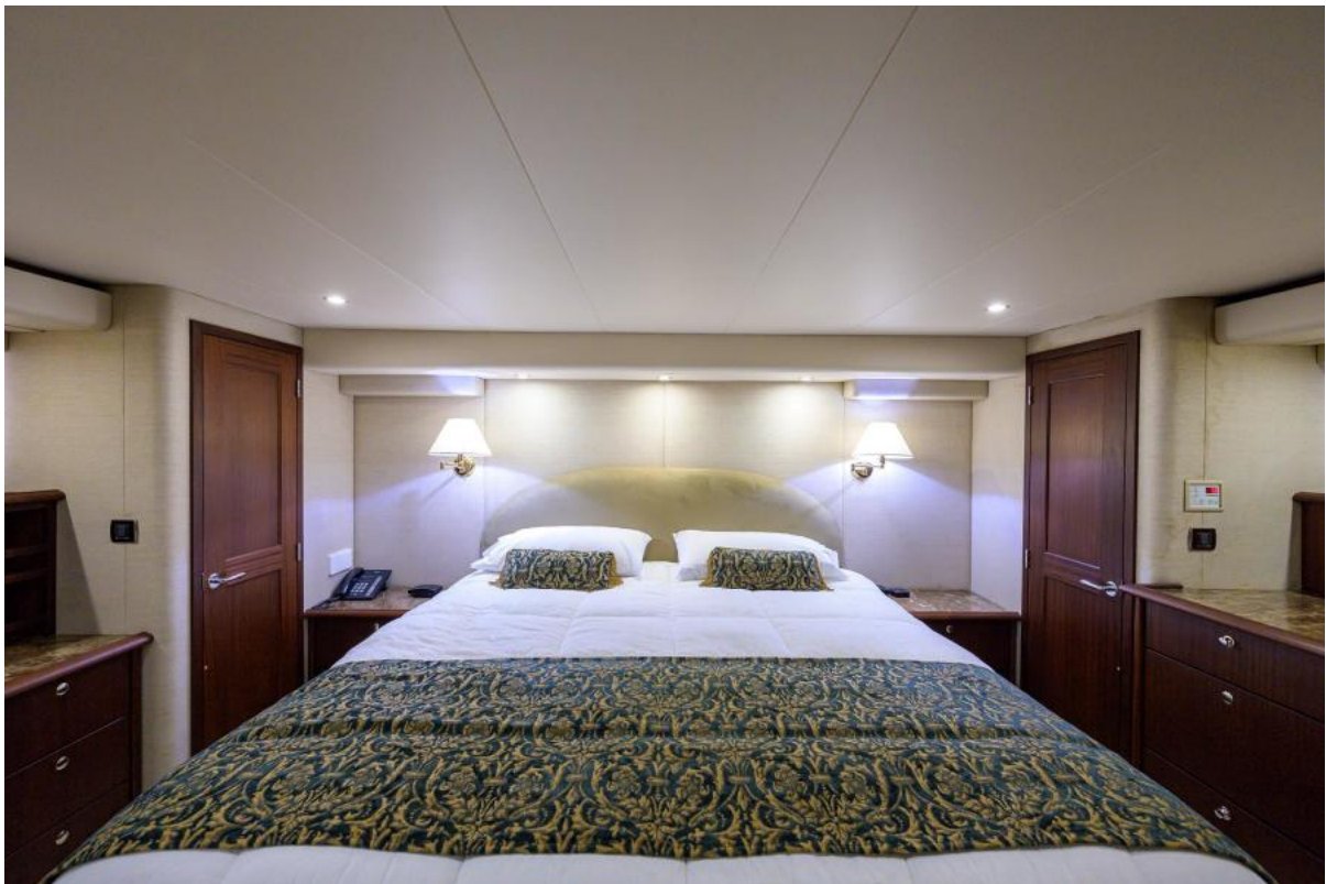
Pacific Mariner 65 Last Call - VIP Stateroom 2009 Pacific Mariner 65 - Last Call