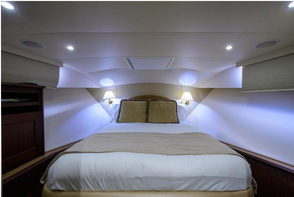
Pacific Mariner 65 Last Call - Master Stateroom 2009 Pacific Mariner 65 - Last Call