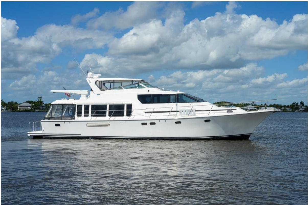
Pacific Mariner 65 Last Call - Profile 2009 Pacific Mariner 65 - Last Call