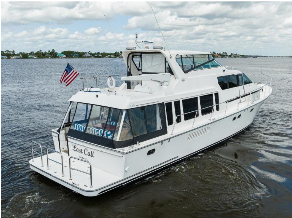
Pacific Mariner 65 Last Call - Profile 2009 Pacific Mariner 65 - Last Call