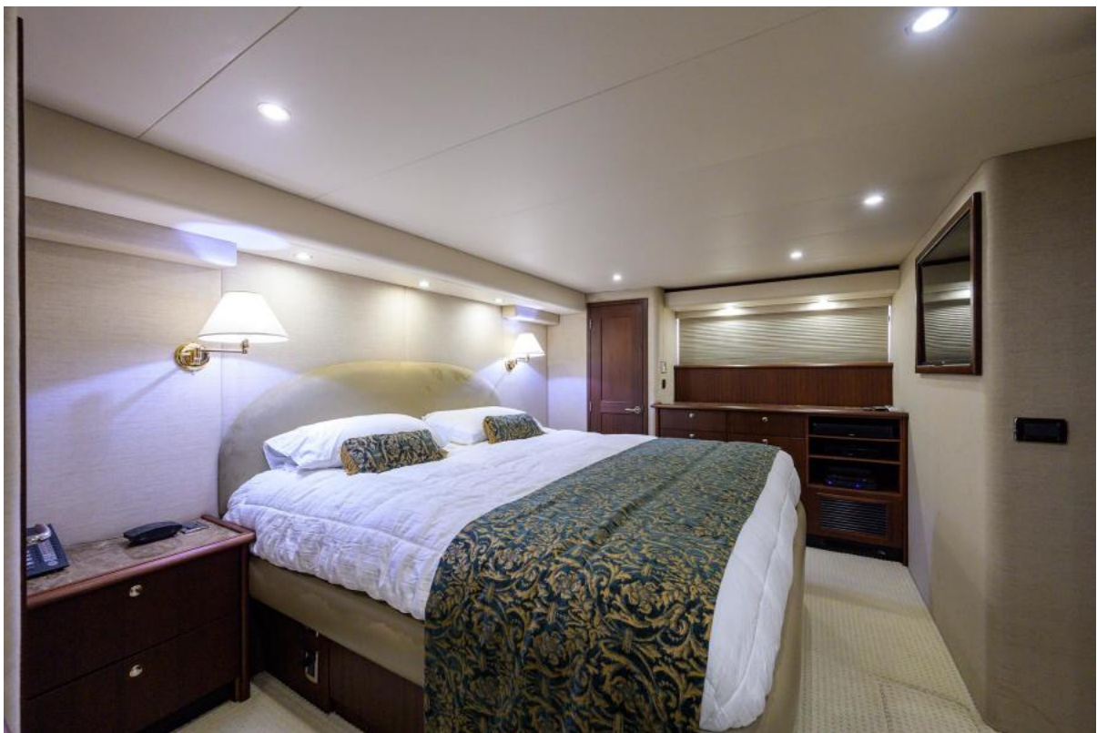
Pacific Mariner 65 Last Call - VIP Stateroom 2009 Pacific Mariner 65 - Last Call