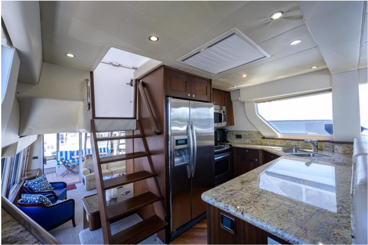
Pacific Mariner 65 Last Call - Galley 2009 Pacific Mariner 65 - Last Call