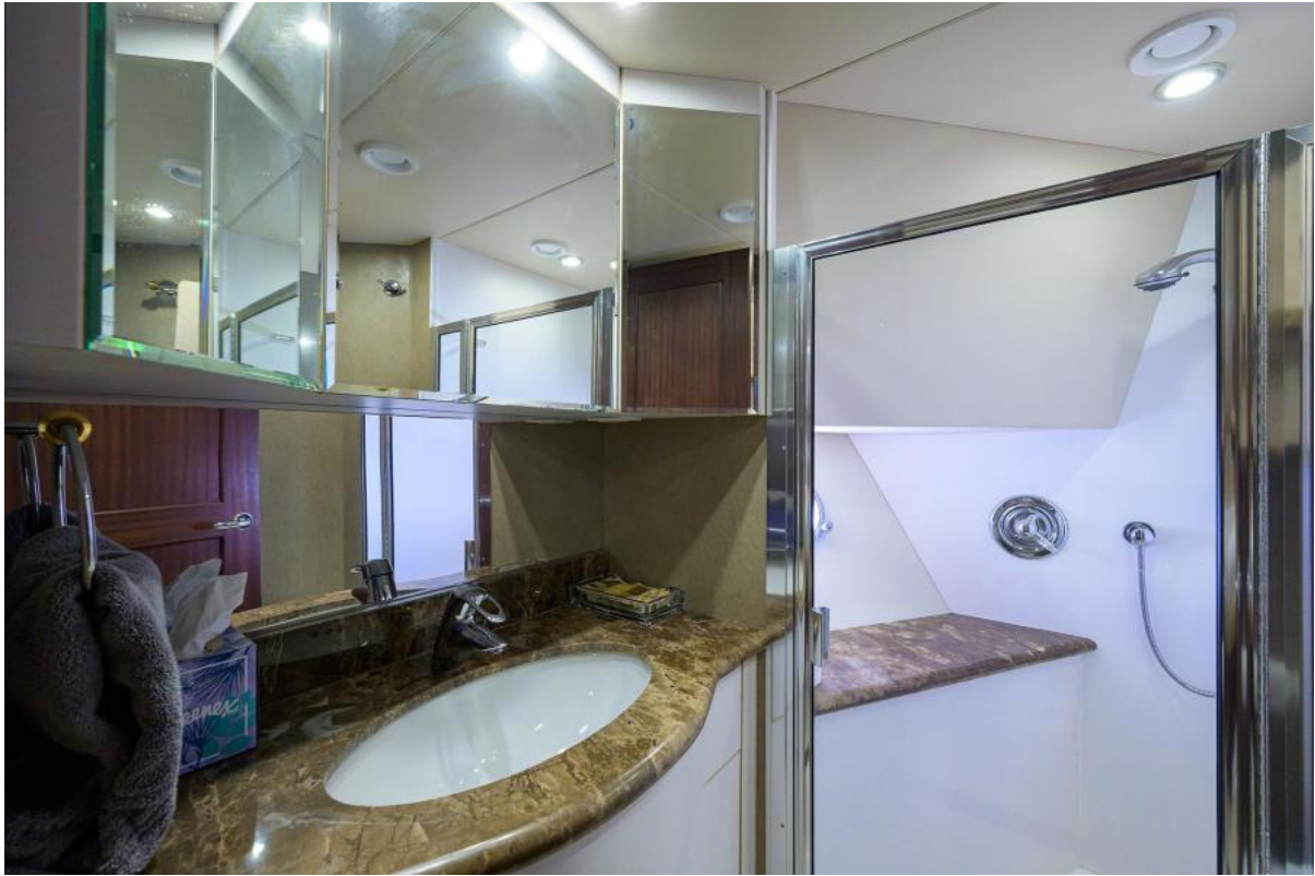
Pacific Mariner 65 Last Call - Master Head 2009 Pacific Mariner 65 - Last Call