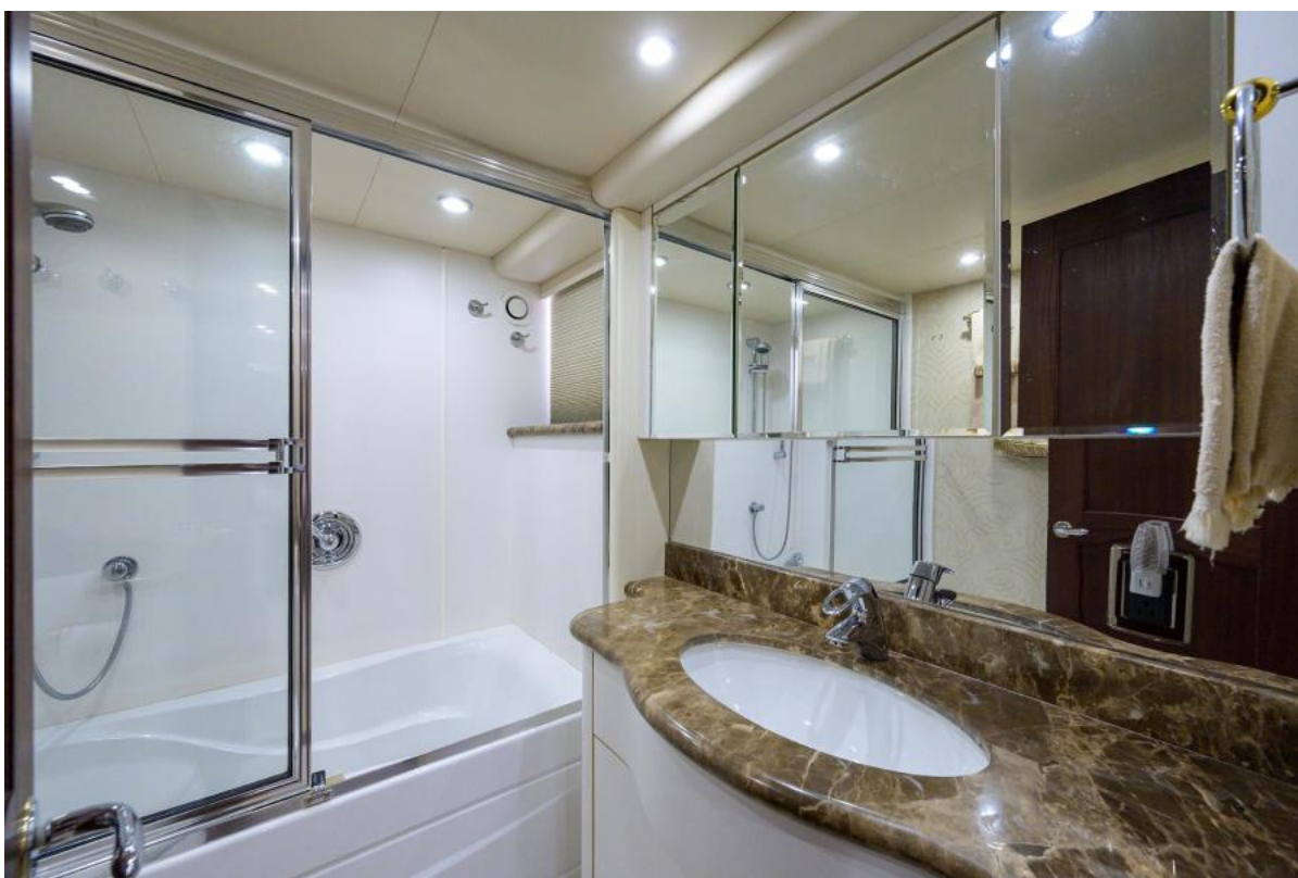
Pacific Mariner 65 Last Call - VIP Head 2009 Pacific Mariner 65 - Last Call