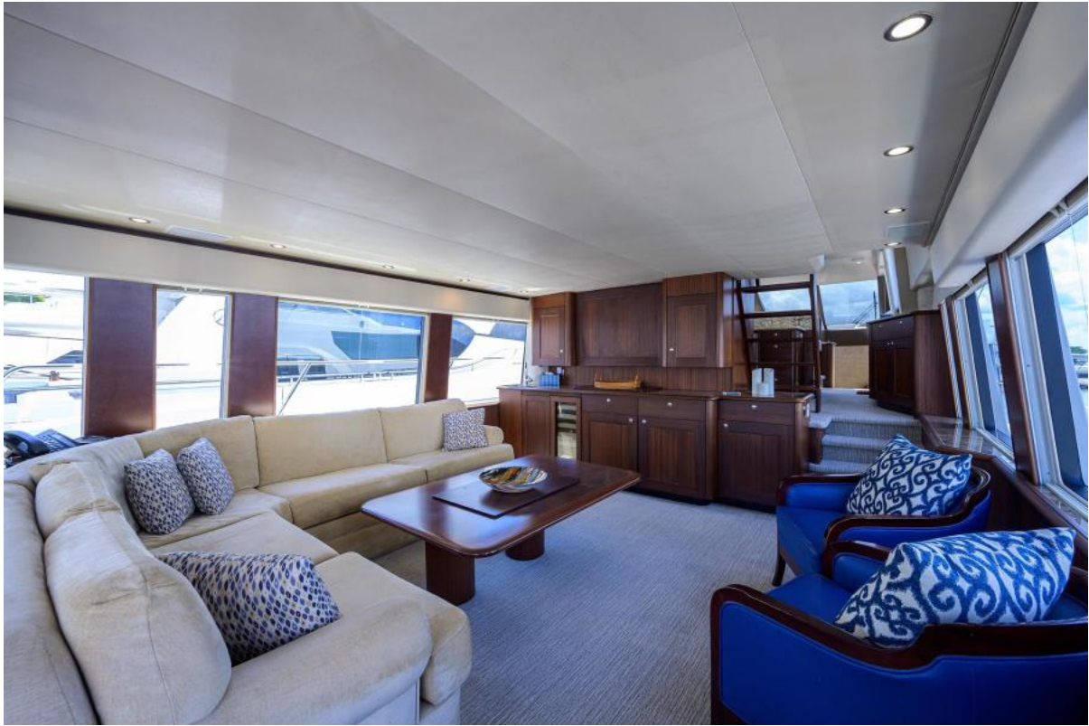
Pacific Mariner 65 Last Call - Salon 2009 Pacific Mariner 65 - Last Call