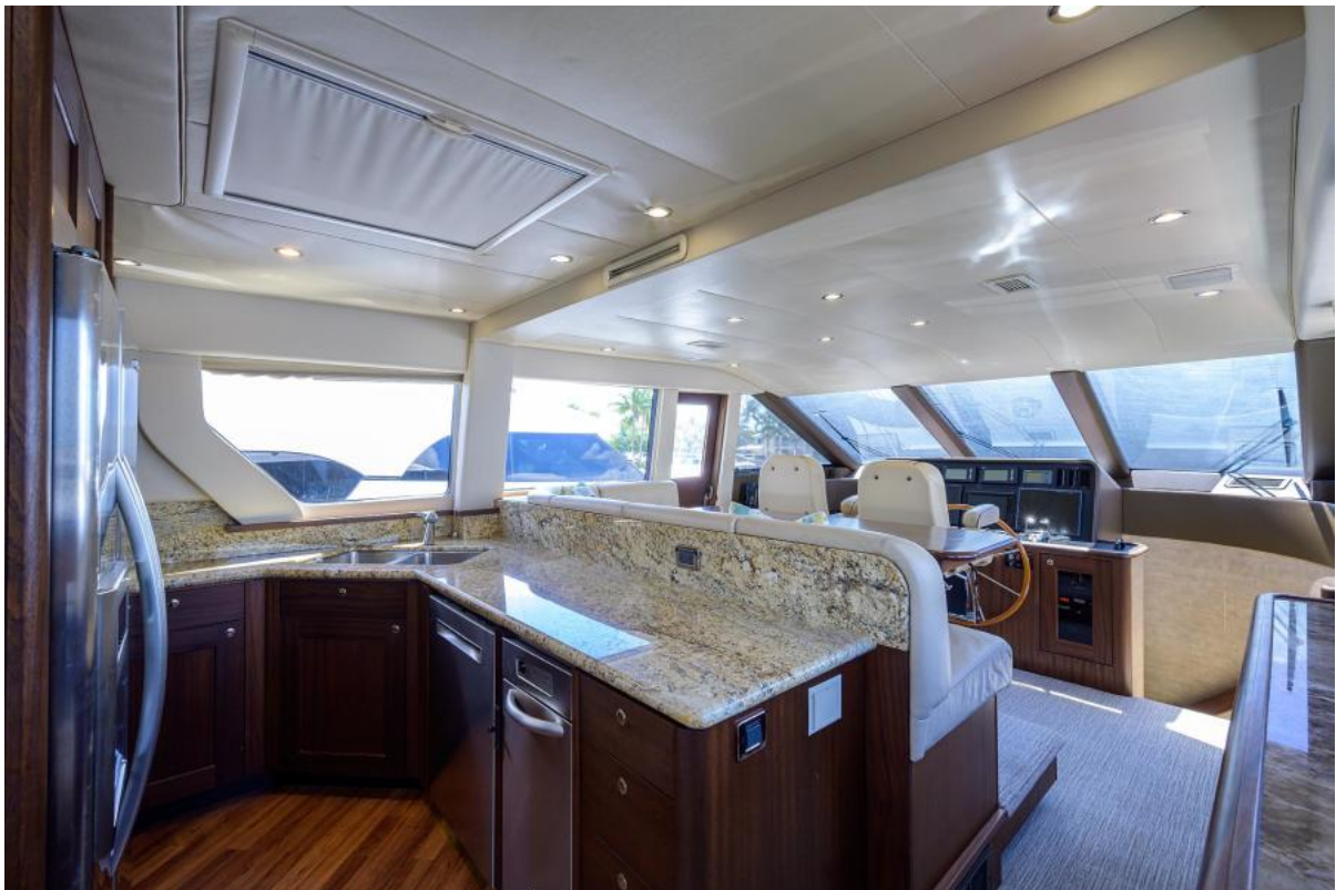
Pacific Mariner 65 Last Call - Galley 2009 Pacific Mariner 65 - Last Call