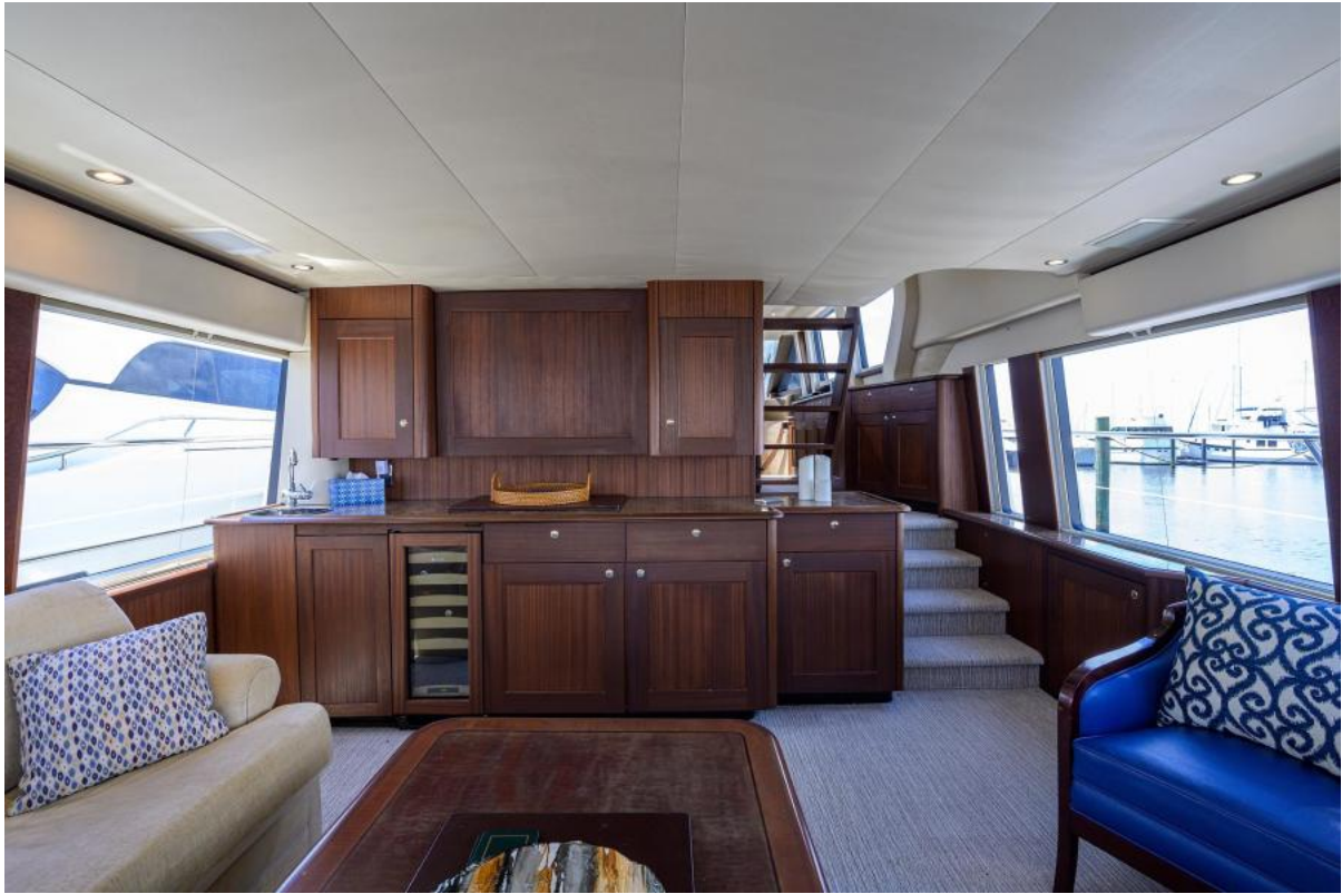
Pacific Mariner 65 Last Call - Salon 2009 Pacific Mariner 65 - Last Call