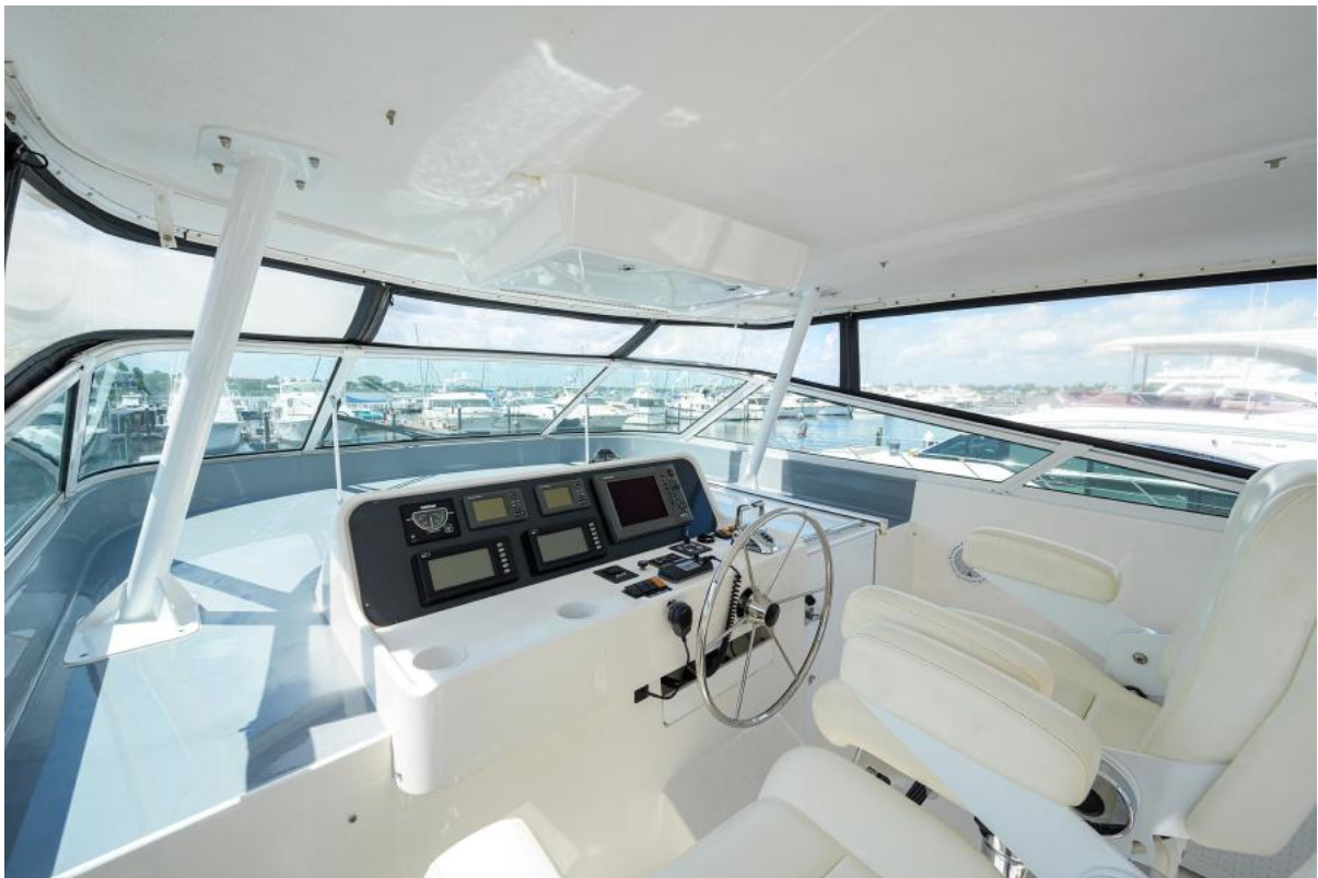
Pacific Mariner 65 Last Call - Flybridge 2009 Pacific Mariner 65 - Last Call