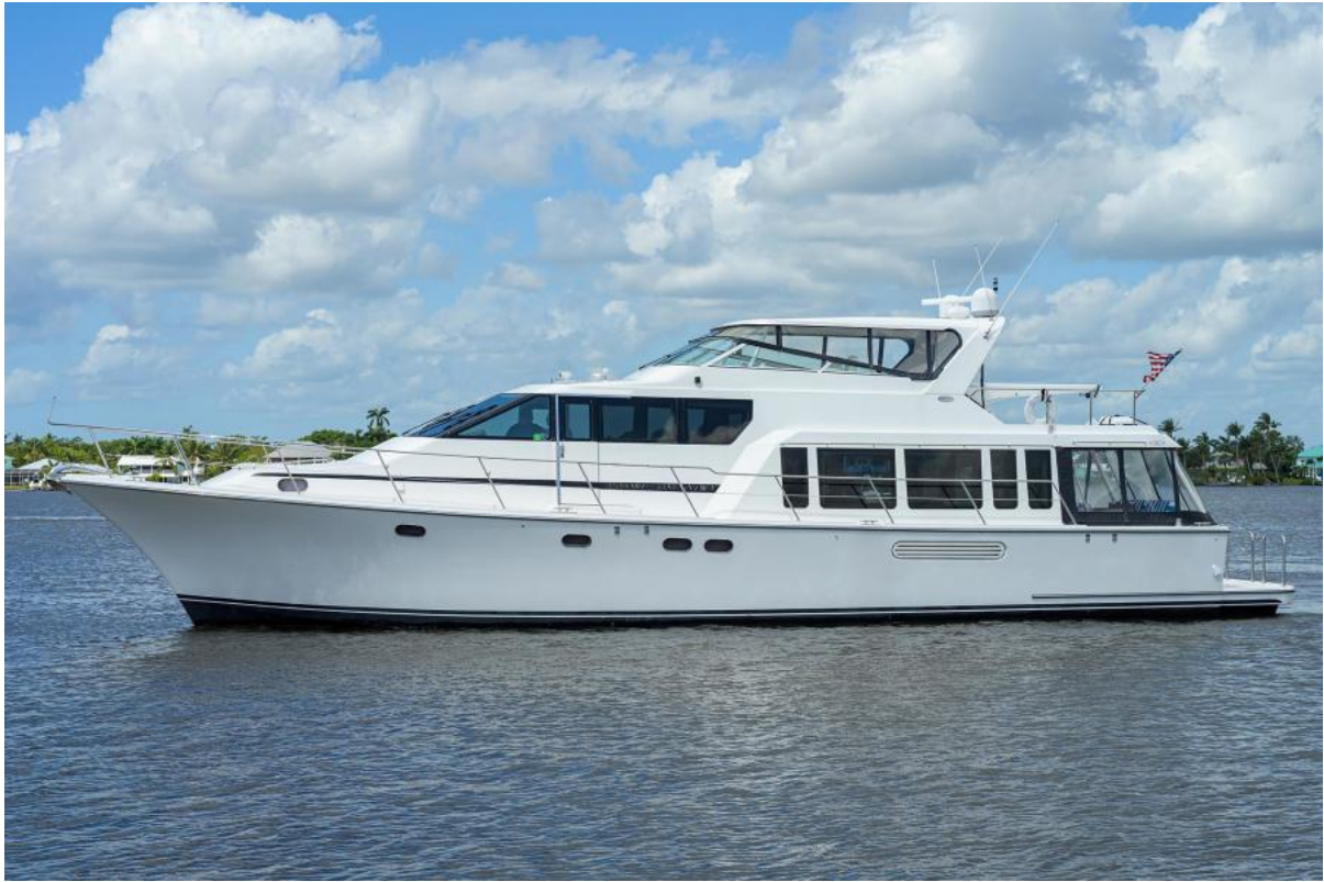
Pacific Mariner 65 Last Call - Profile 2009 Pacific Mariner 65 - Last Call