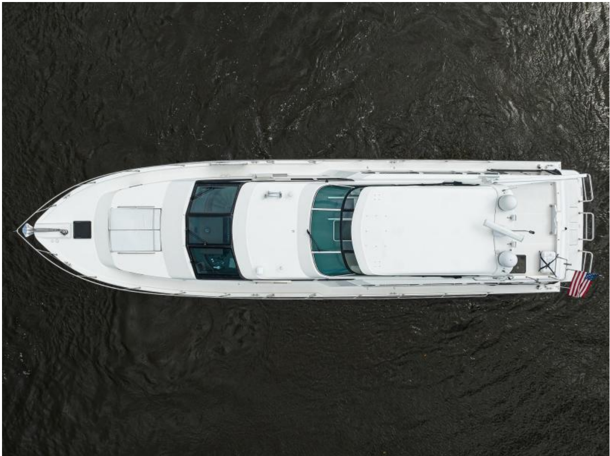
Pacific Mariner 65 Last Call - Arial 2009 Pacific Mariner 65 - Last Call