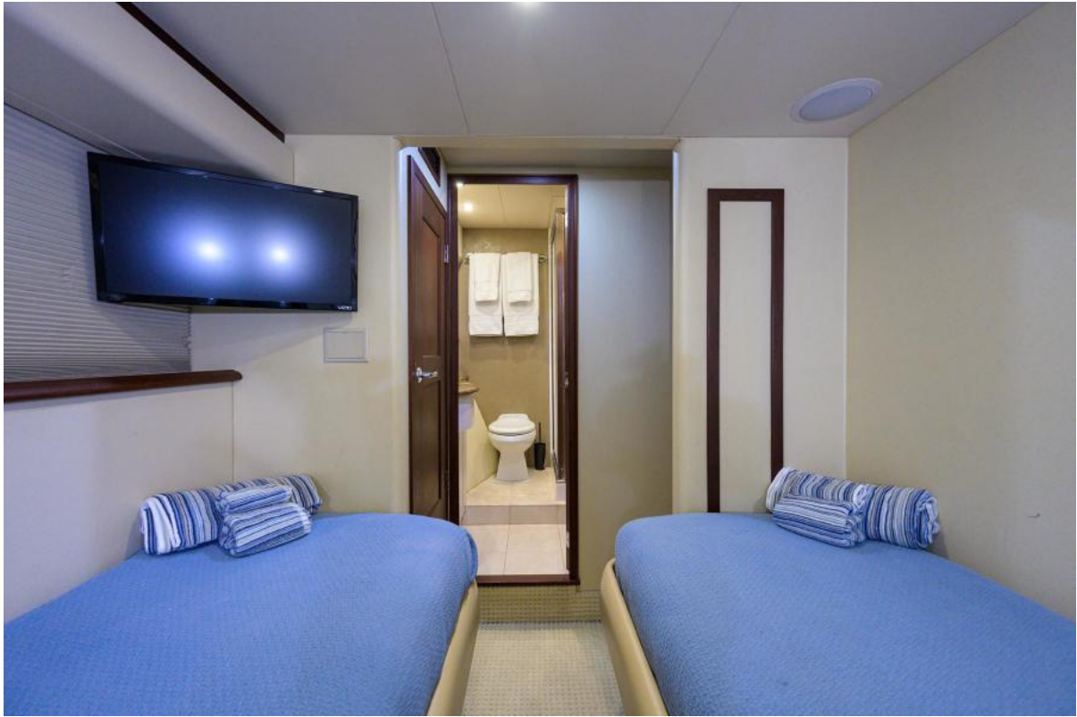
Pacific Mariner 65 Last Call - Port Twin Guest Stateroom 2009 Pacific Mariner 65 - Last Call