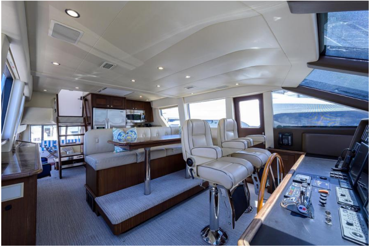
Pacific Mariner 65 Last Call - Pilothouse 2009 Pacific Mariner 65 - Last Call