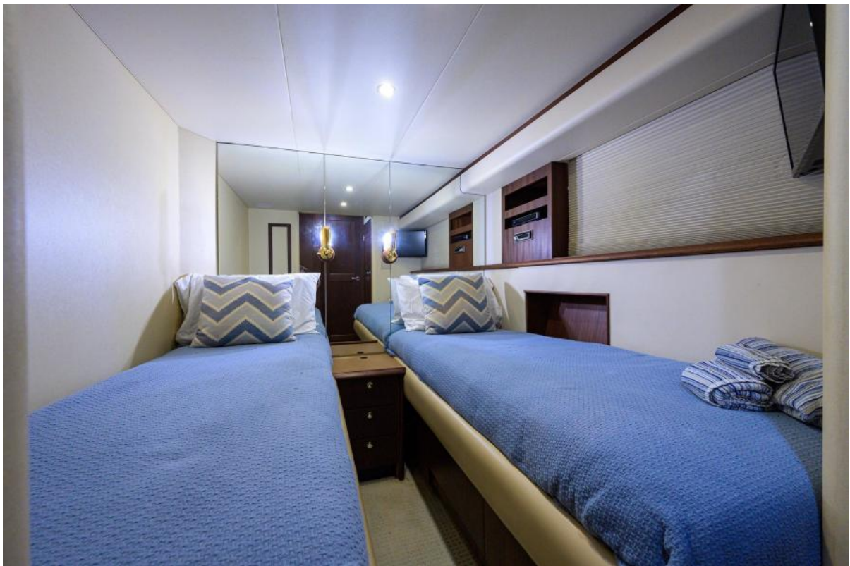
Pacific Mariner 65 Last Call - Port Twin Guest Stateroom 2009 Pacific Mariner 65 - Last Call