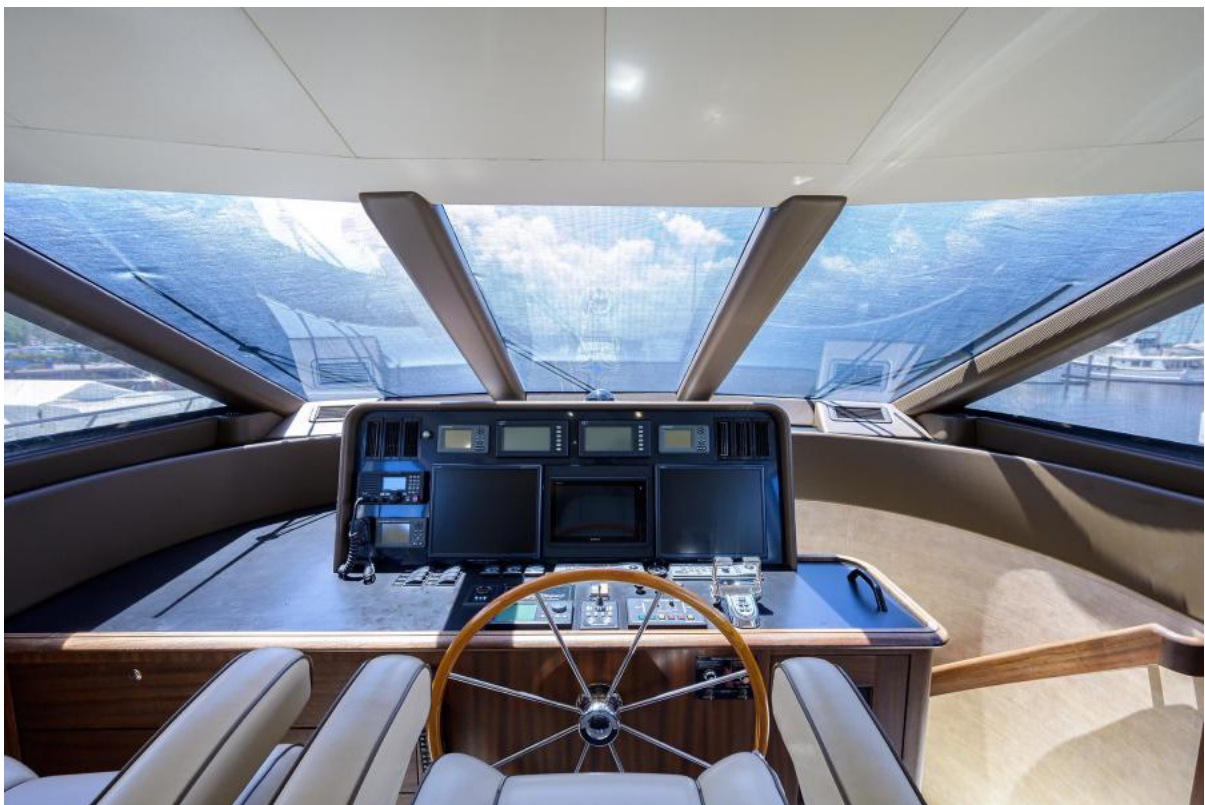
Pacific Mariner 65 Last Call - Pilothouse 2009 Pacific Mariner 65 - Last Call