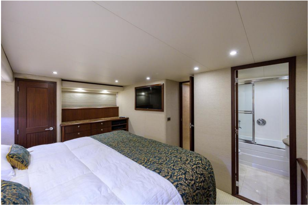
Pacific Mariner 65 Last Call - VIP Stateroom 2009 Pacific Mariner 65 - Last Call