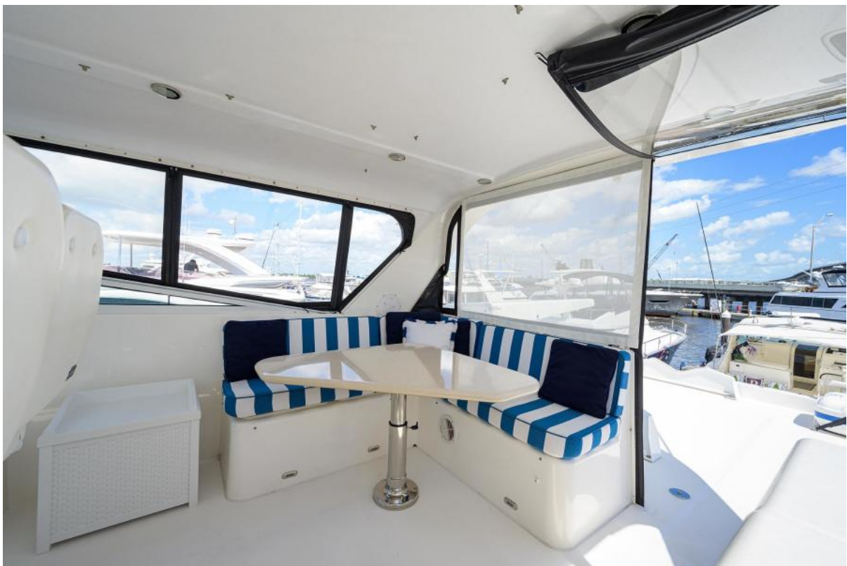
Pacific Mariner 65 Last Call - Flybridge 2009 Pacific Mariner 65 - Last Call