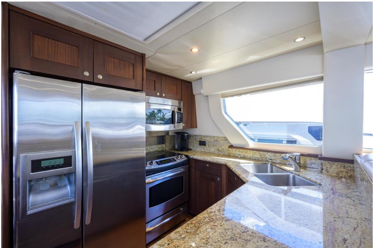
Pacific Mariner 65 Last Call - Galley 2009 Pacific Mariner 65 - Last Call