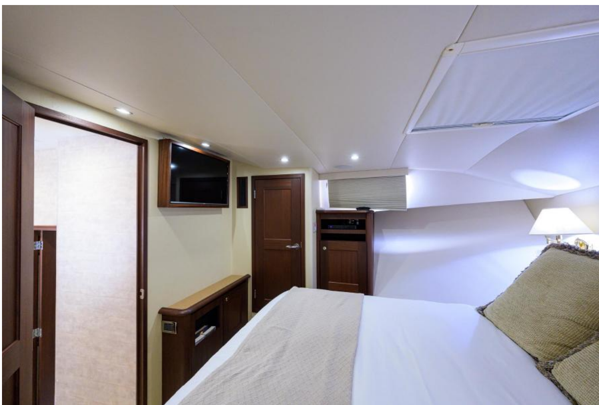
Pacific Mariner 65 Last Call - Master Stateroom 2009 Pacific Mariner 65 - Last Call