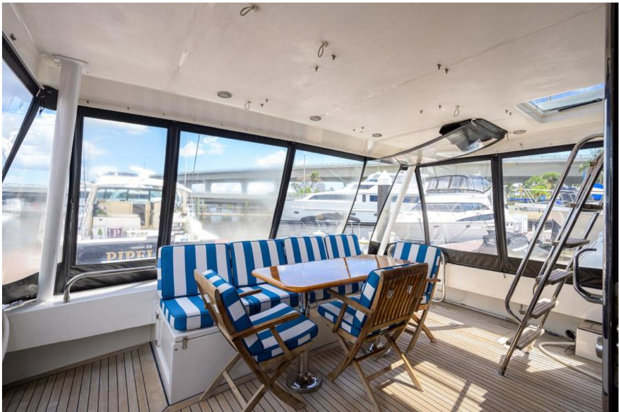
Pacific Mariner 65 Last Call - Aft Deck 2009 Pacific Mariner 65 - Last Call