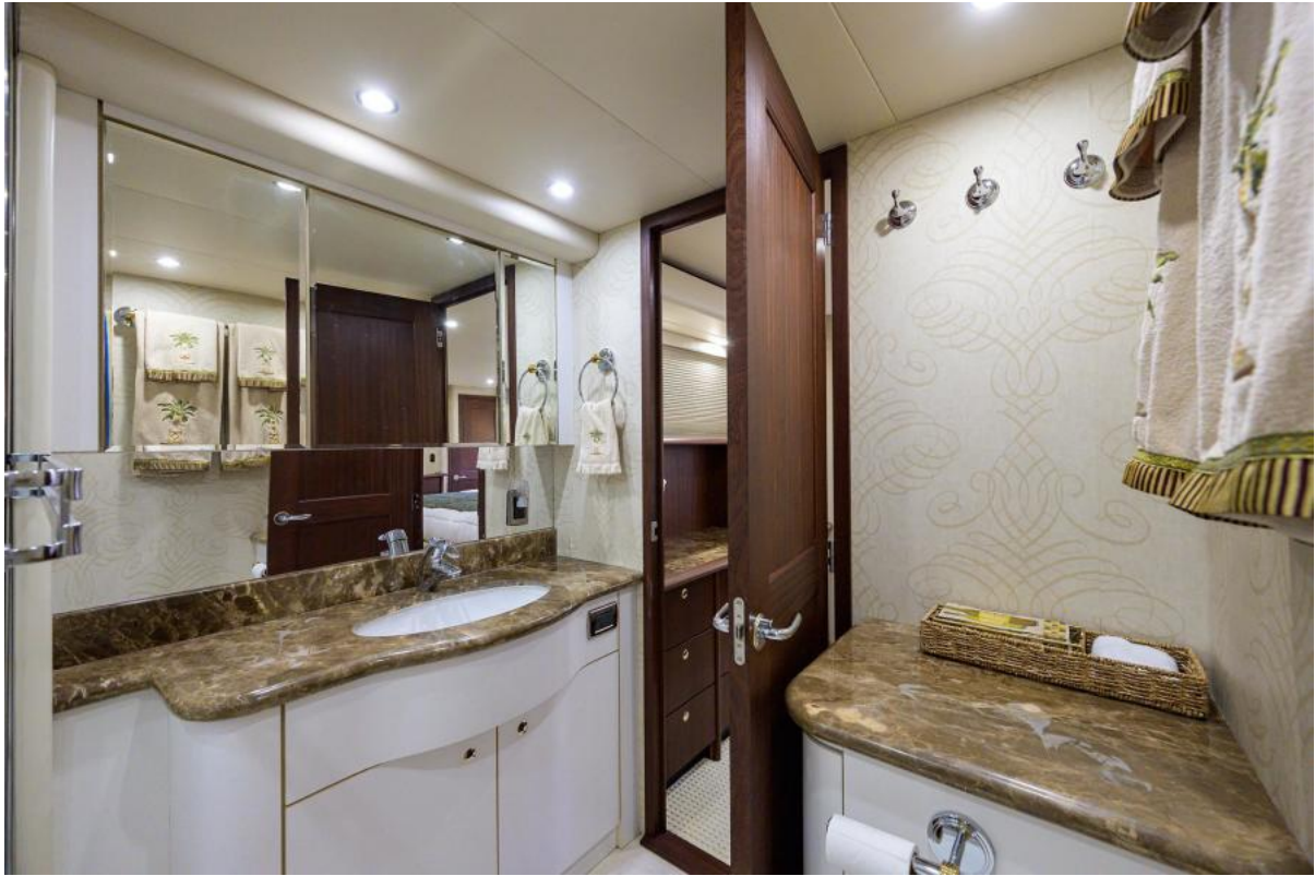
Pacific Mariner 65 Last Call - VIP Head 2009 Pacific Mariner 65 - Last Call