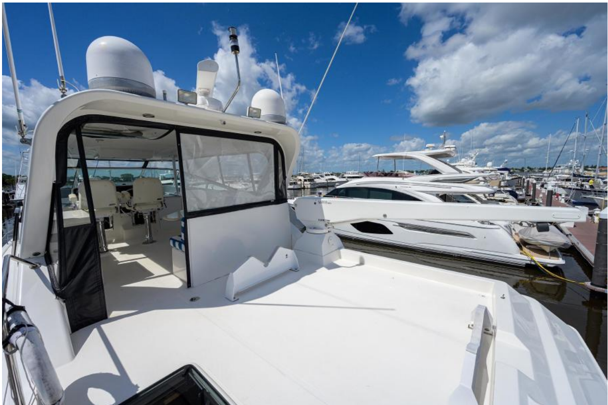
Pacific Mariner 65 Last Call - Flybridge 2009 Pacific Mariner 65 - Last Call