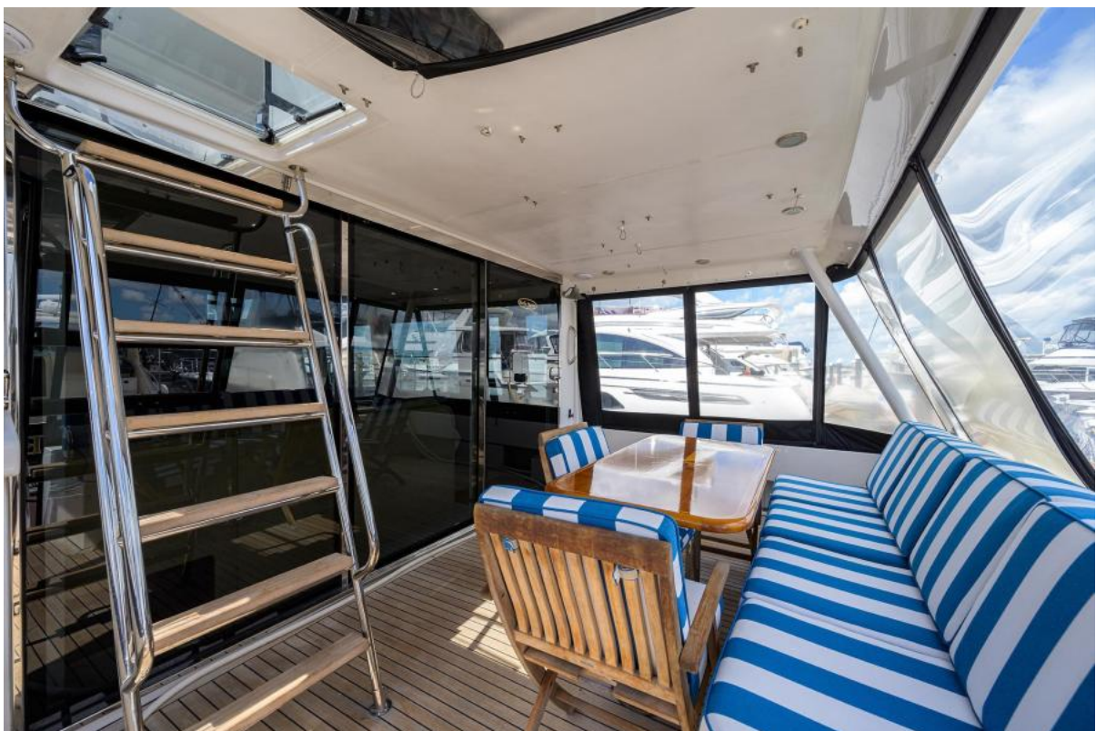
Pacific Mariner 65 Last Call - Aft Deck 2009 Pacific Mariner 65 - Last Call