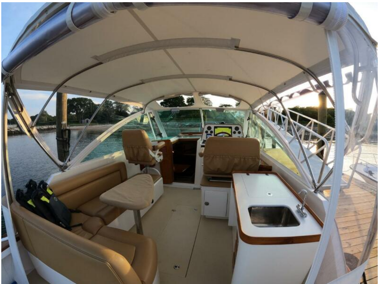
Bridgedeck Looking Forward