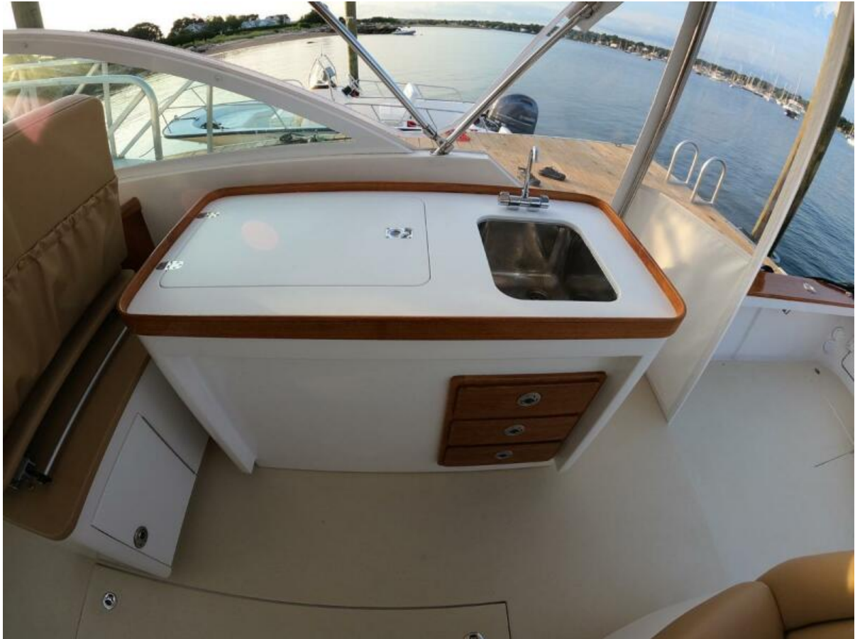
Bridge Deck Bar