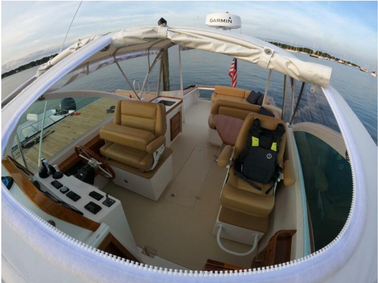
Helm Bridge From Above