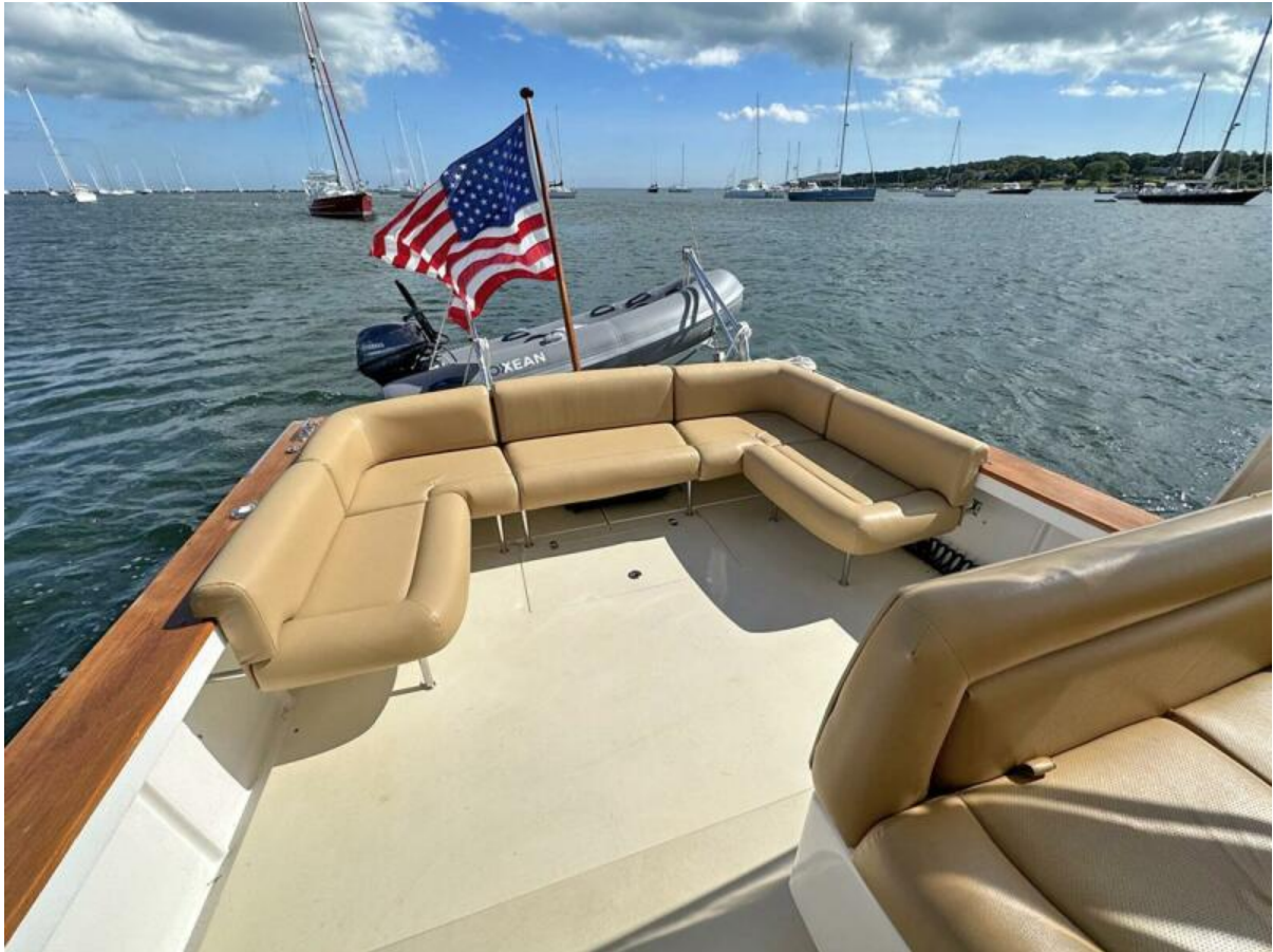
Cockpit U Settee