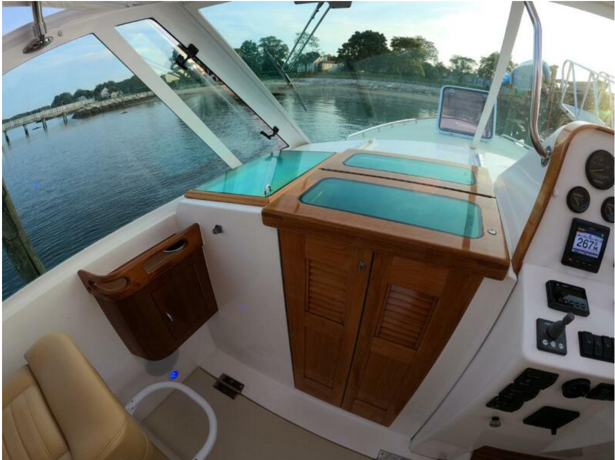
Companionway Hatch And Doors