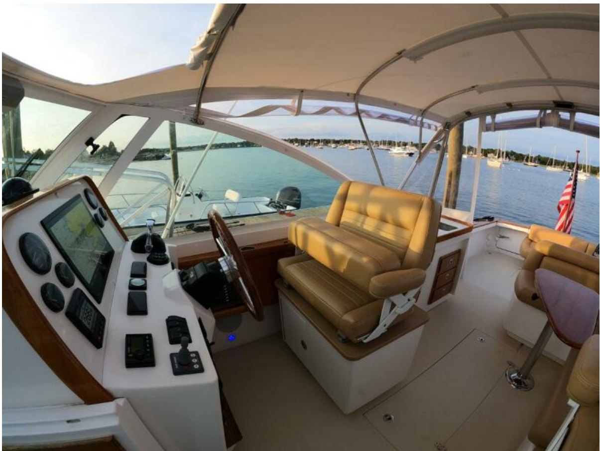
Helm Side View