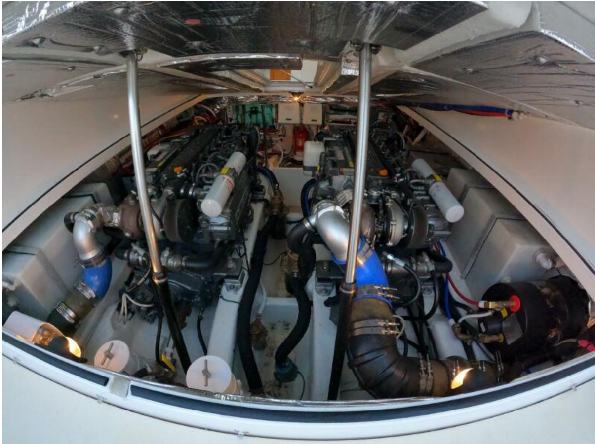
Engine Room W Twin 440's