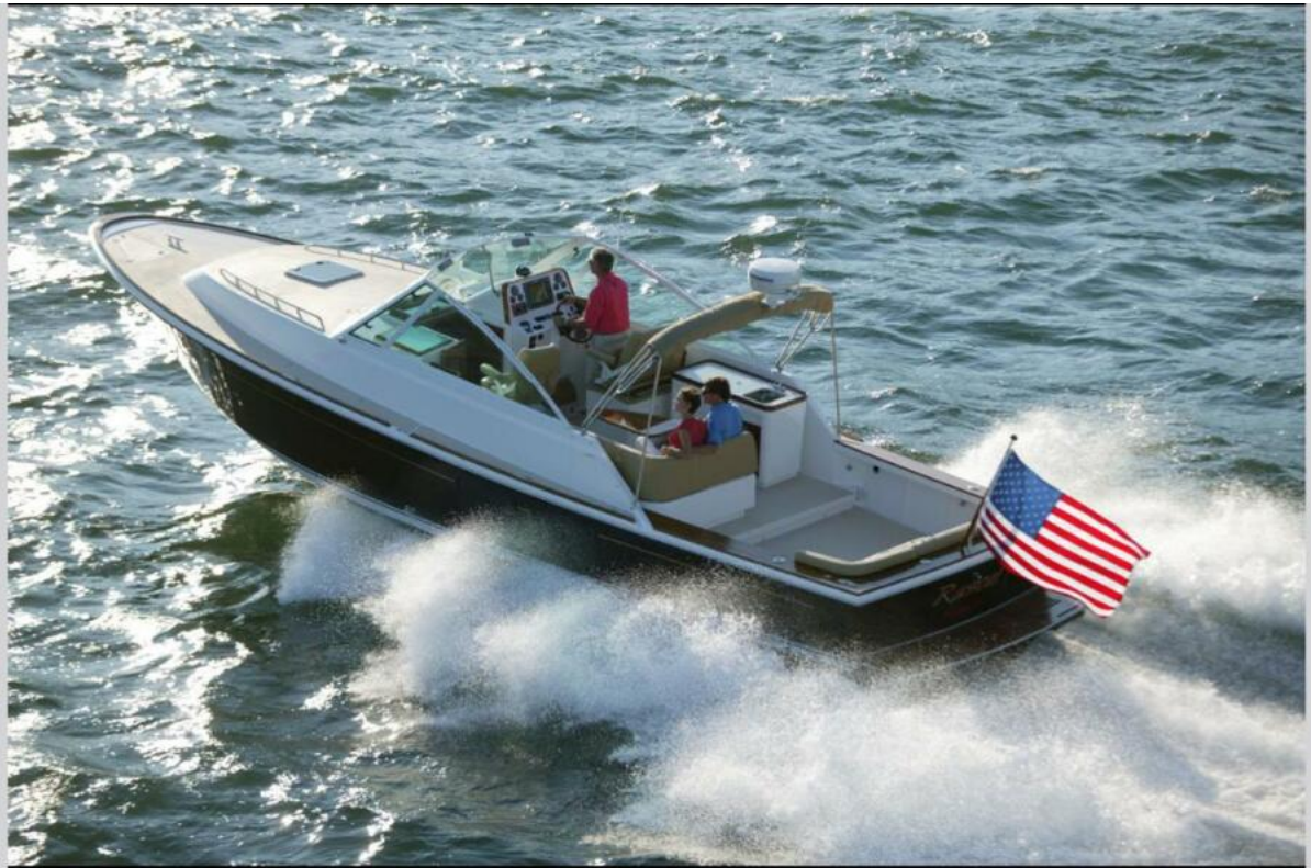
Port Quarter From Helicopter