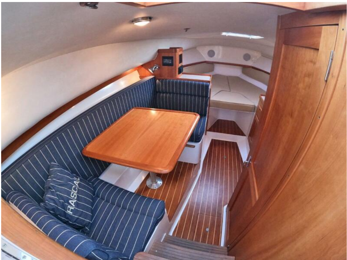
Interior Looking Forward