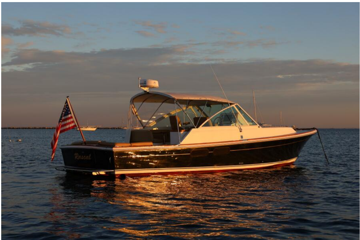
Starboard Quarter Sunset Glow