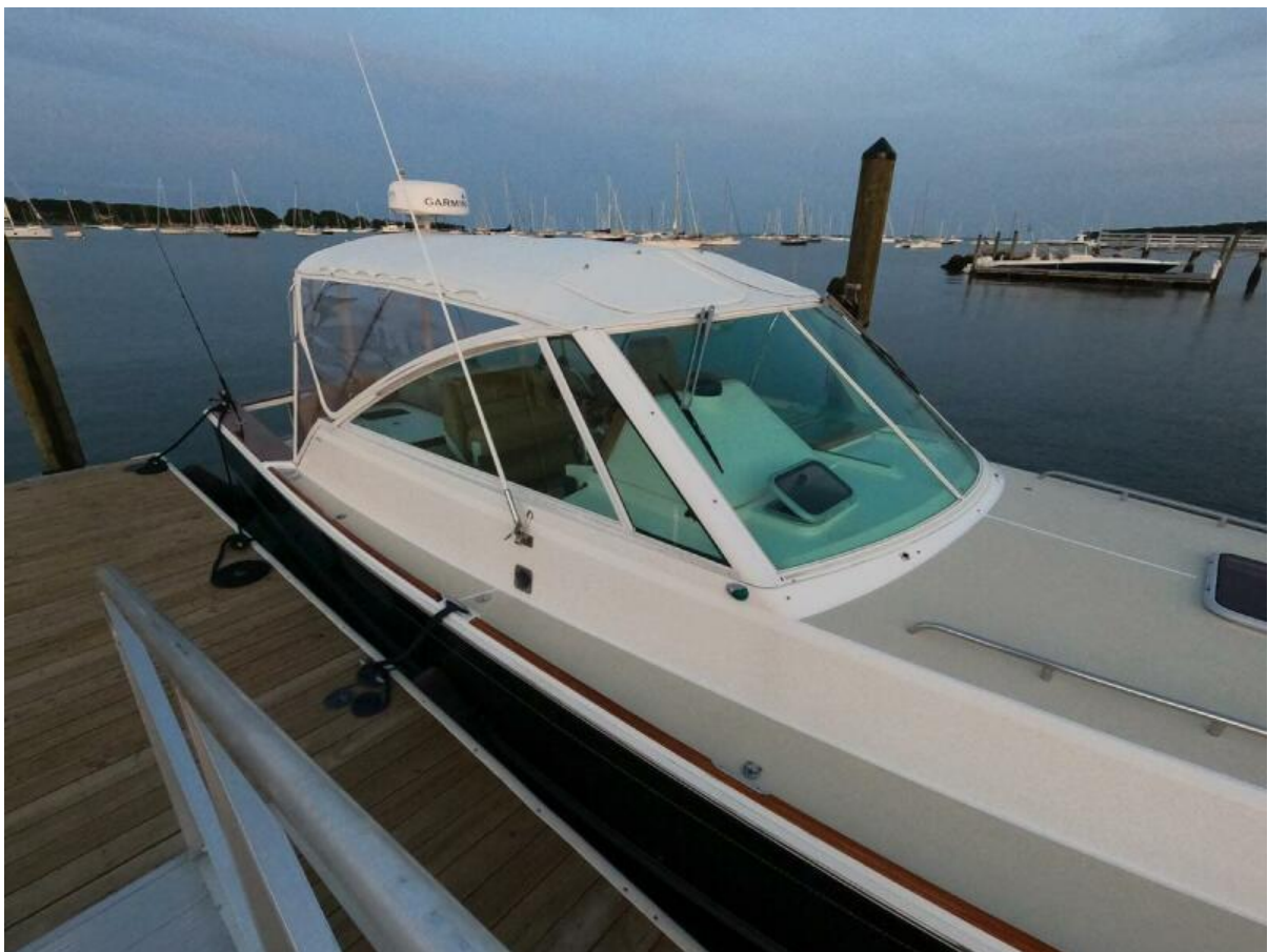
Windshield And Bimini