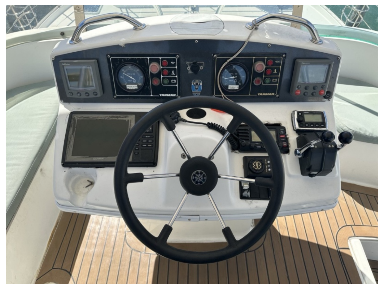
Used Power Catamaran for sale 2003 Lagoon 43 Power - RENDEZVOUS