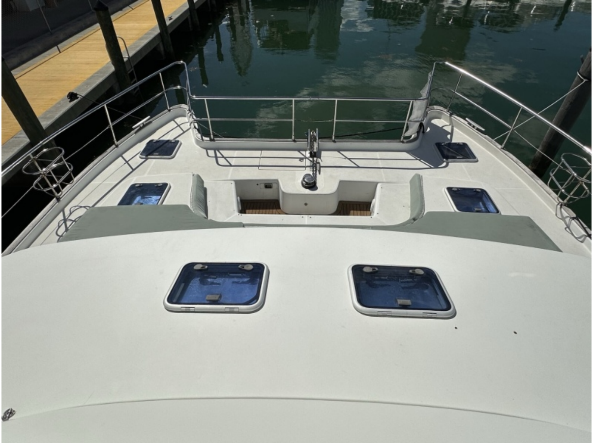
Used Power Catamaran for sale 2003 Lagoon 43 Power - RENDEZVOUS