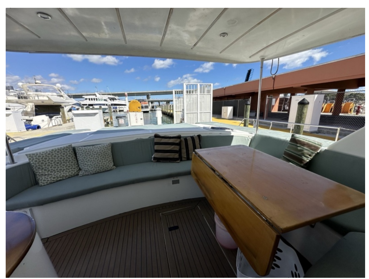
Used Power Catamaran for sale 2003 Lagoon 43 Power - RENDEZVOUS