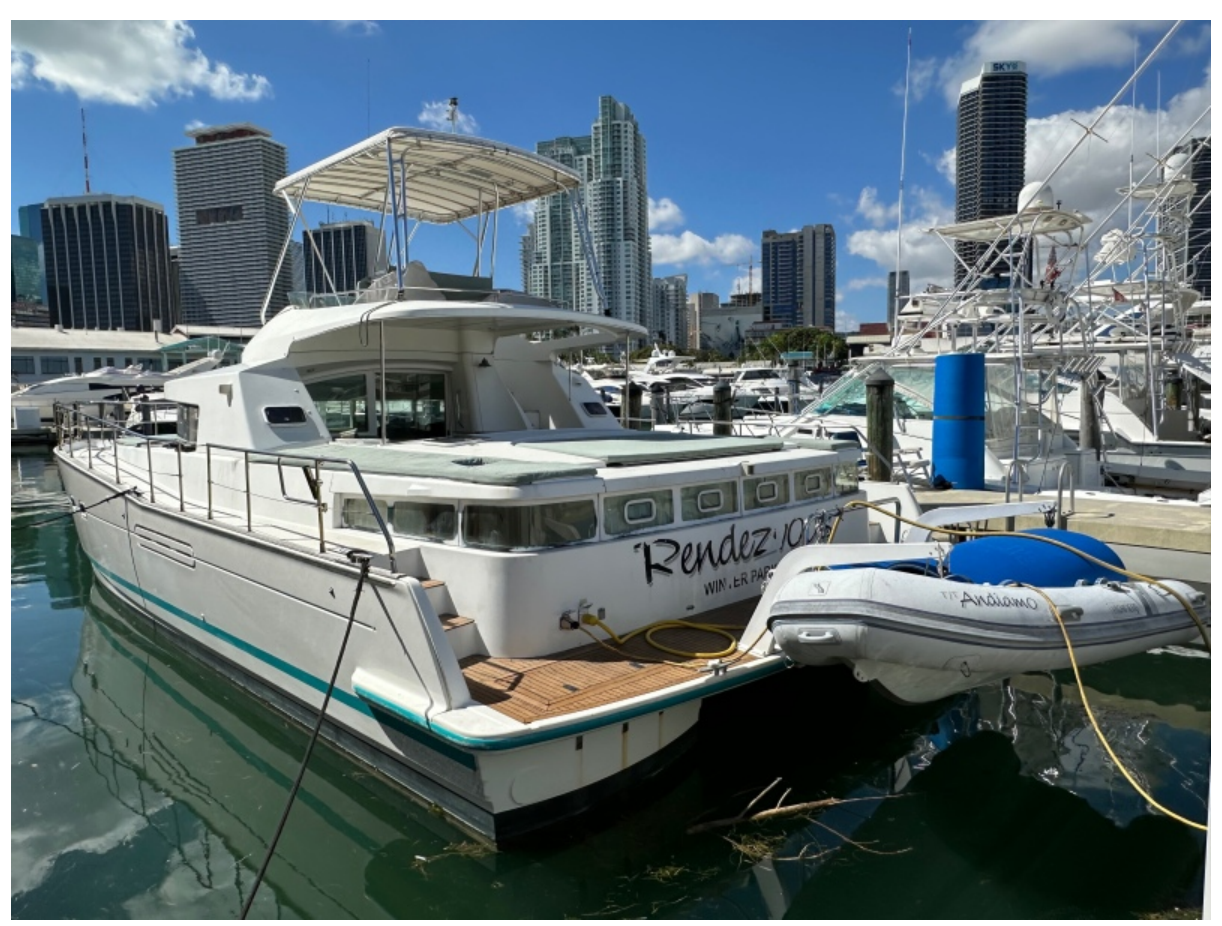
Used Power Catamaran for sale 2003 Lagoon 43 Power - RENDEZVOUS