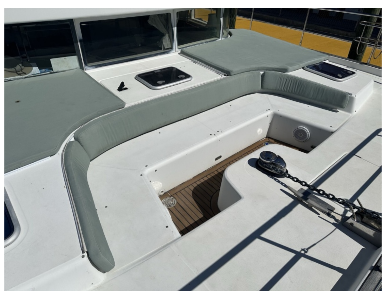
Used Power Catamaran for sale 2003 Lagoon 43 Power - RENDEZVOUS