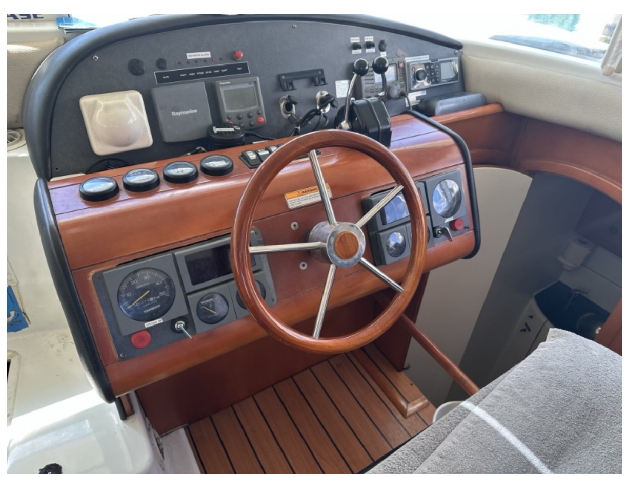
Used Power Catamaran for sale 2003 Lagoon 43 Power - RENDEZVOUS