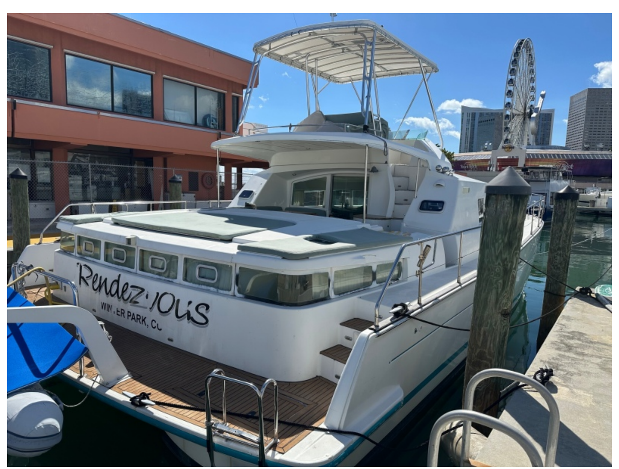
Used Power Catamaran for sale 2003 Lagoon 43 Power - RENDEZVOUS