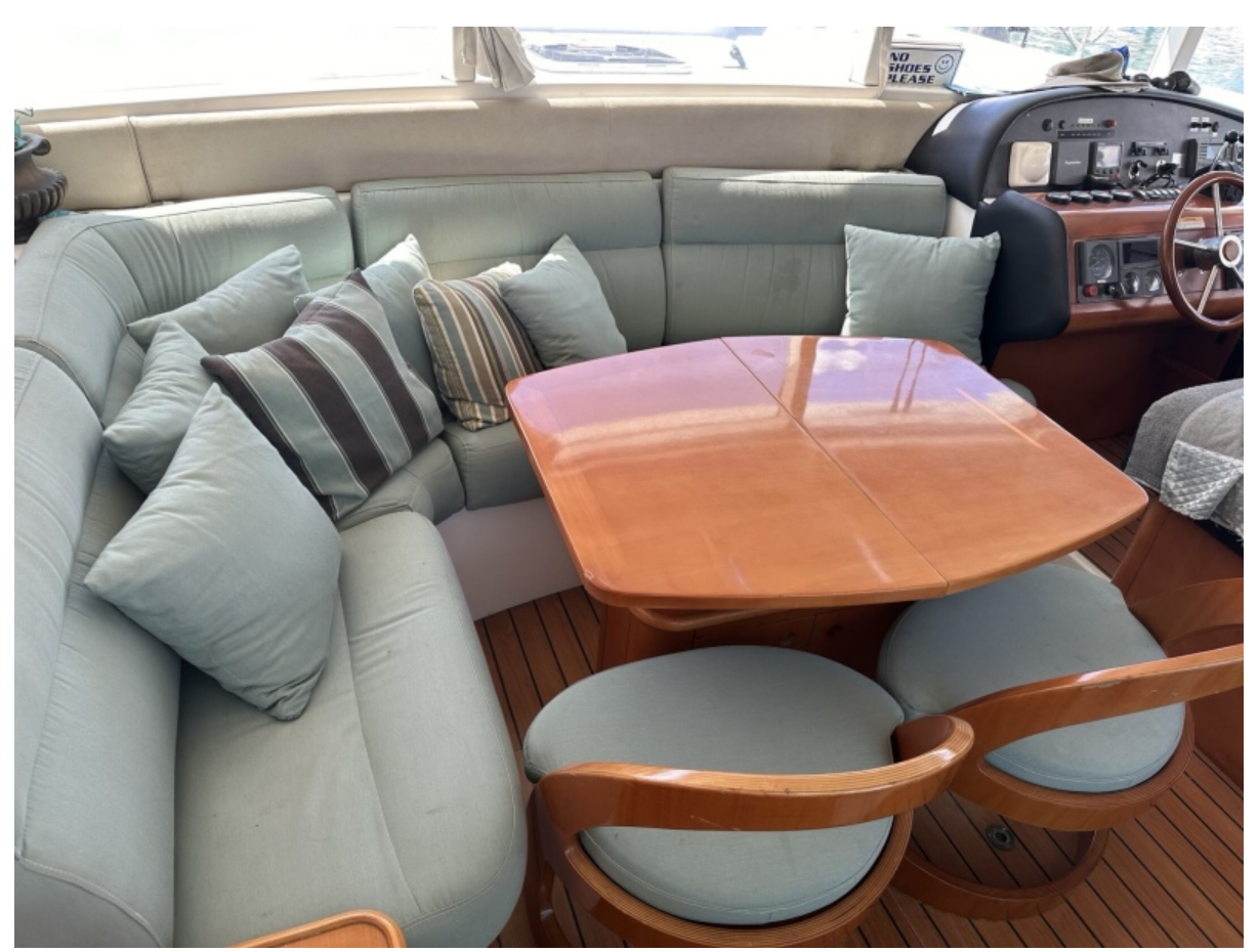
Used Power Catamaran for sale 2003 Lagoon 43 Power - RENDEZVOUS