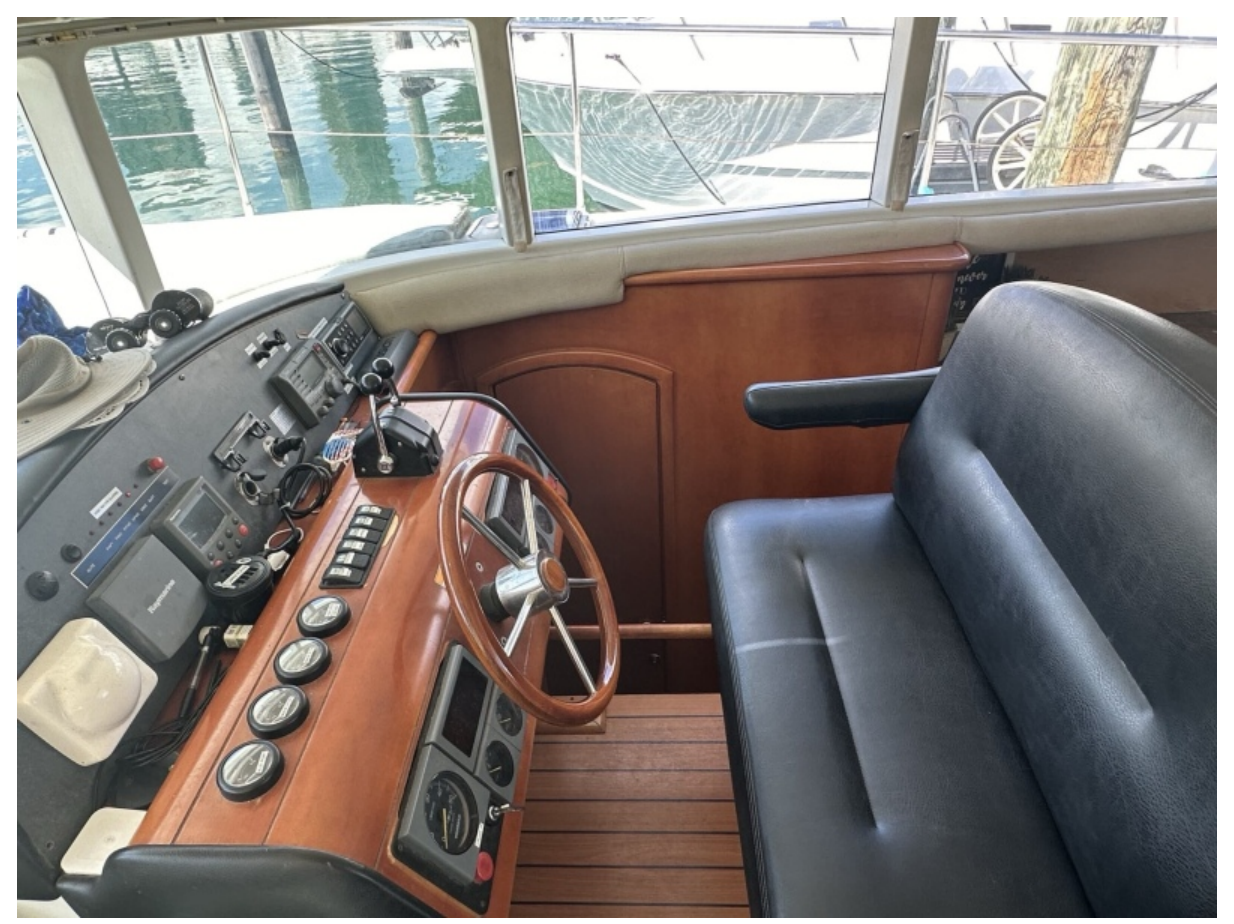
Used Power Catamaran for sale 2003 Lagoon 43 Power - RENDEZVOUS