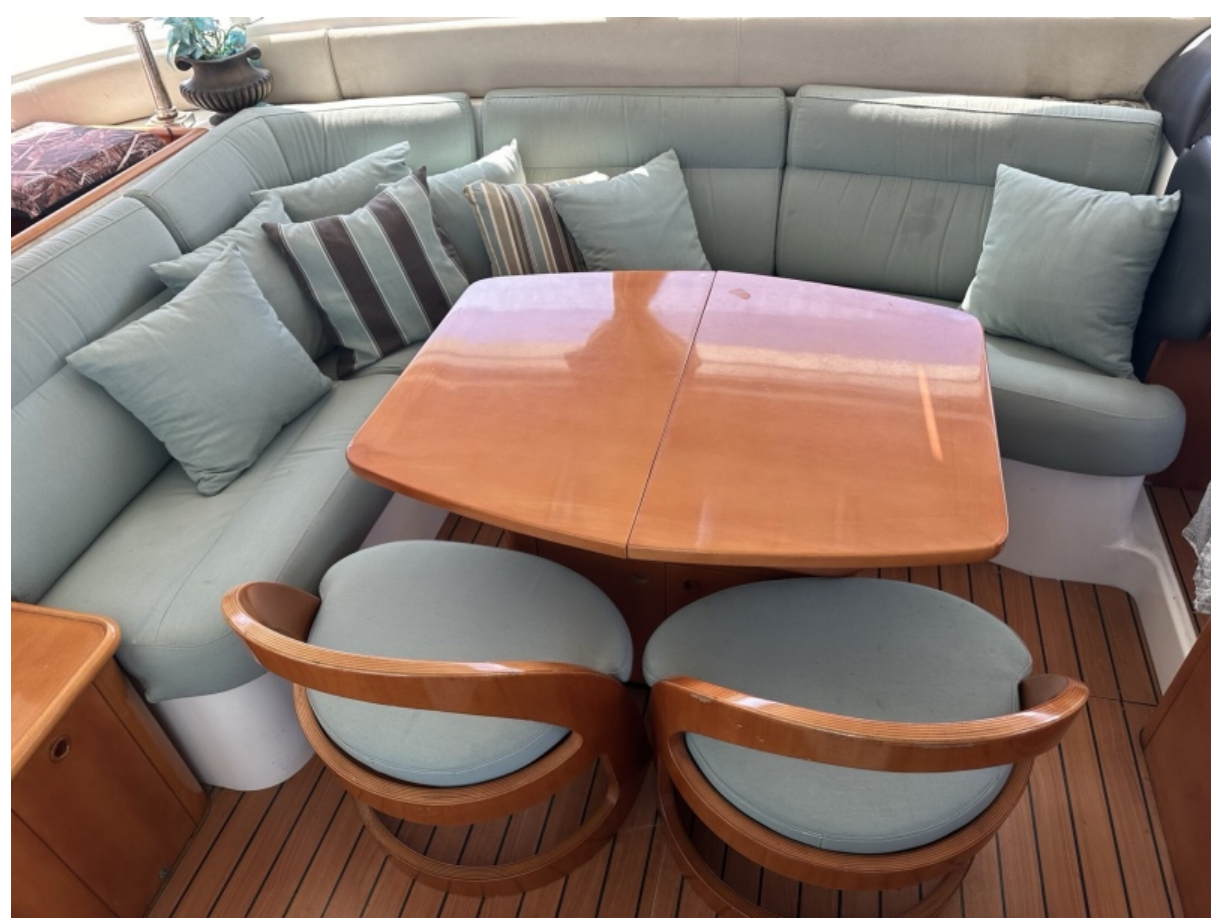
Used Power Catamaran for sale 2003 Lagoon 43 Power - RENDEZVOUS