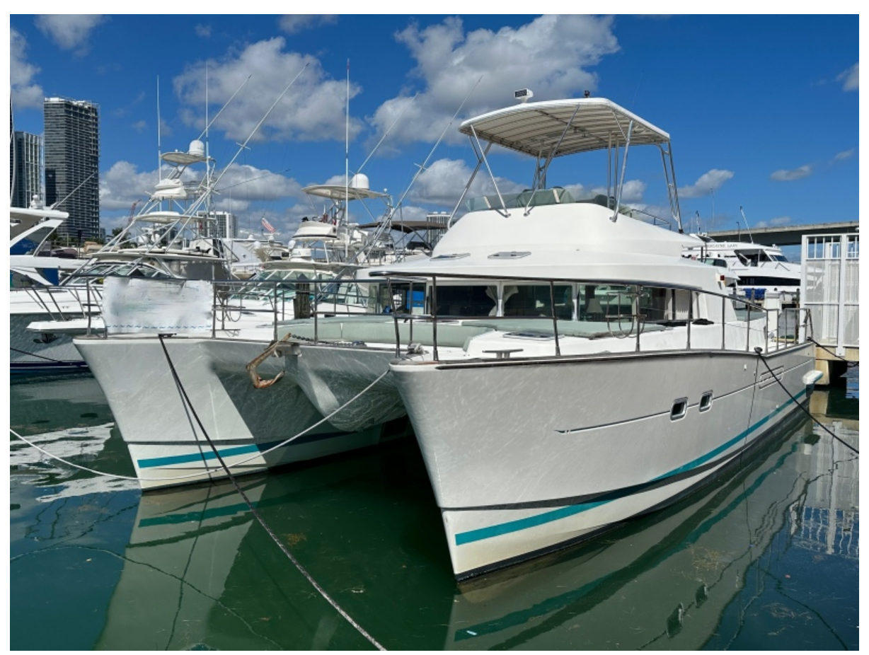
Used Power Catamaran for sale 2003 Lagoon 43 Power - RENDEZVOUS