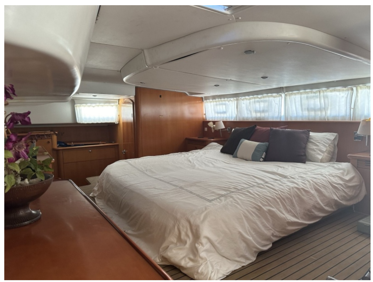
Used Power Catamaran for sale 2003 Lagoon 43 Power - RENDEZVOUS