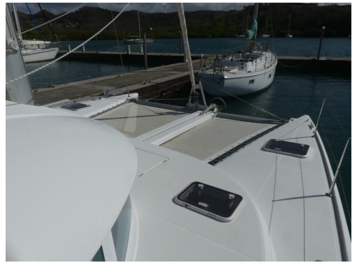
Used Sail Catamaran for sale 2004 Lagoon 380 - BLUE MOON OF AMBLE