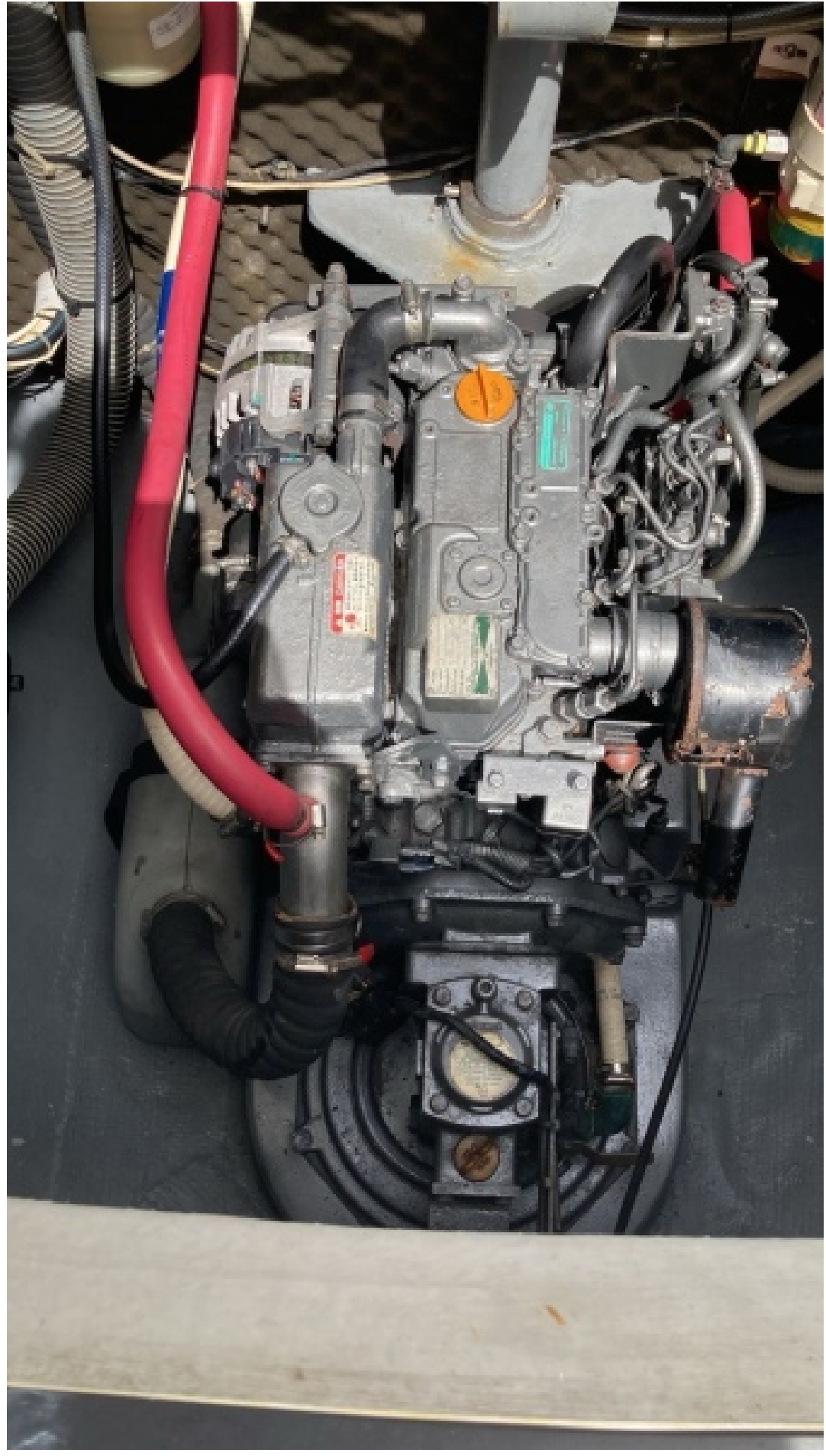
Used Sail Catamaran for sale 2004 Lagoon 380 - BLUE MOON OF AMBLE