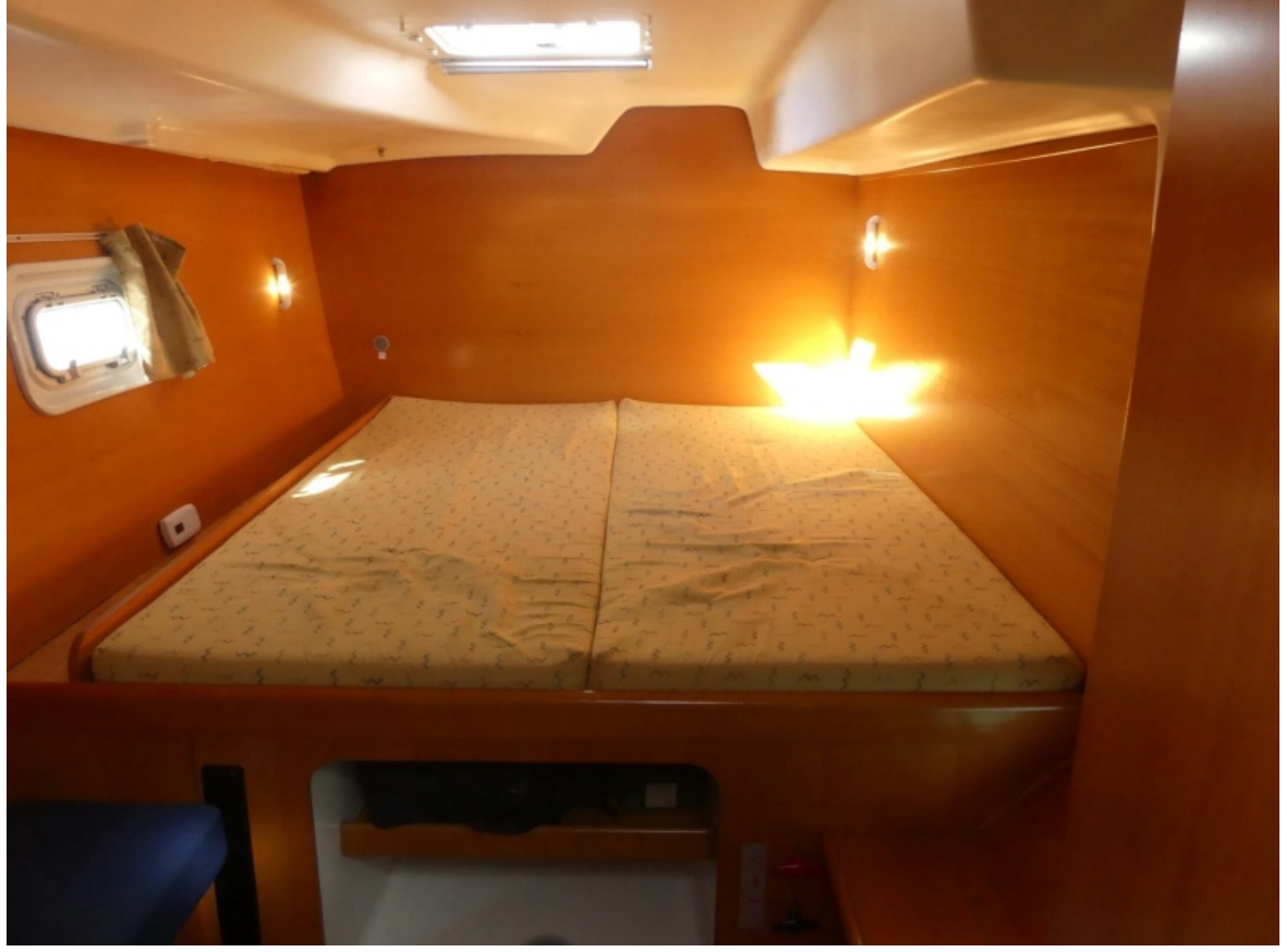
Used Sail Catamaran for sale 2004 Lagoon 380 - BLUE MOON OF AMBLE