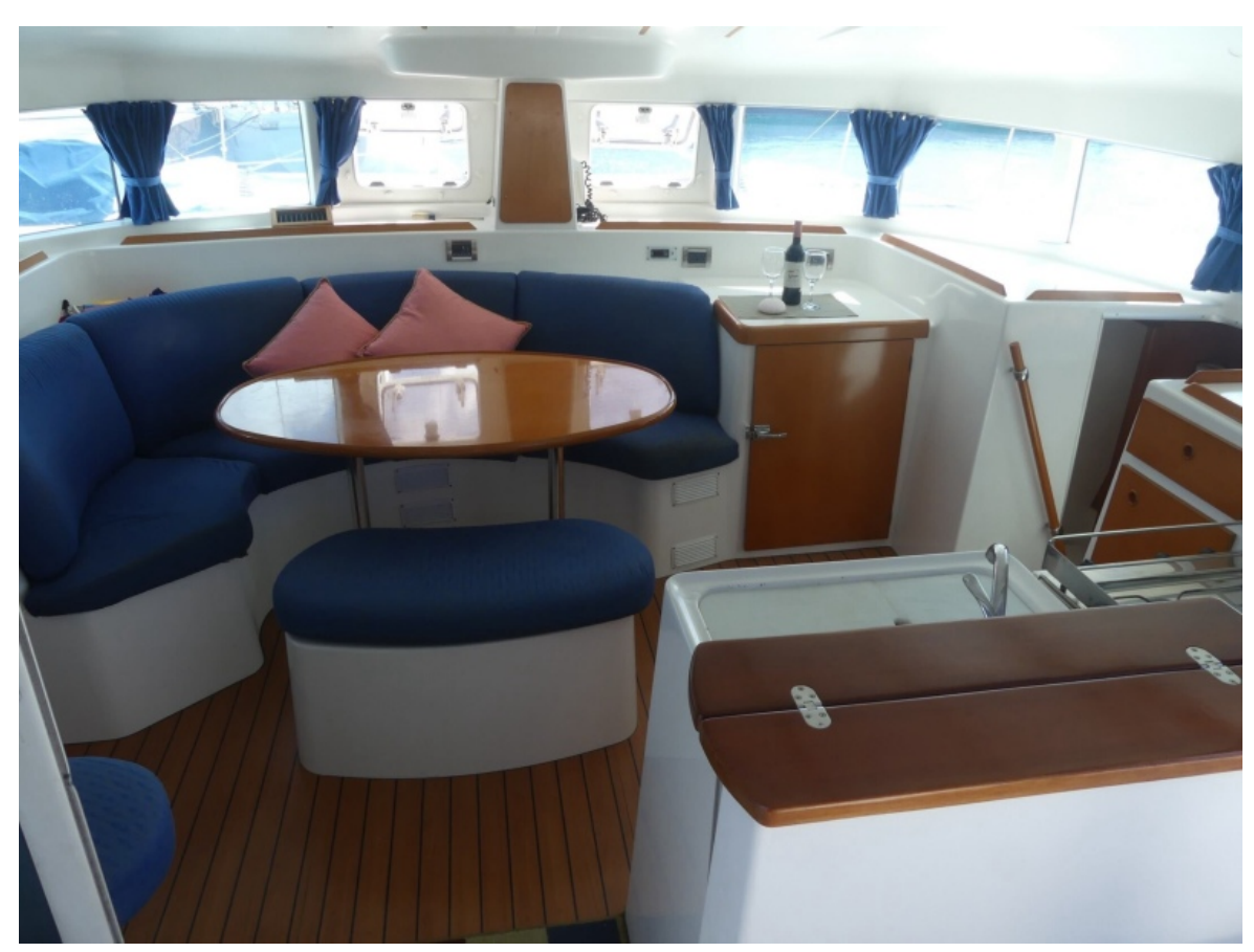
Used Sail Catamaran for sale 2004 Lagoon 380 - BLUE MOON OF AMBLE