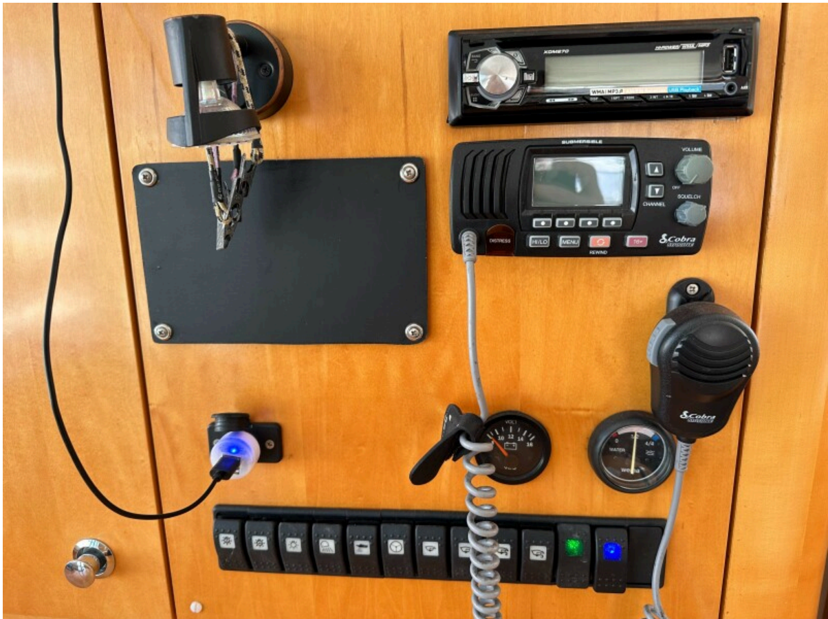
Used Sail Catamaran for sale 2007 FOUNTAINE PAJOT Mahe 36 - SAIL LA VIE