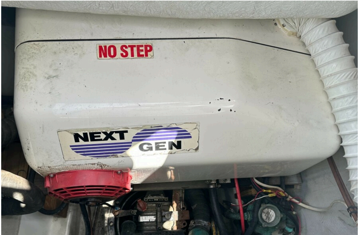
Used Sail Catamaran for sale 2007 FOUNTAINE PAJOT Mahe 36 - SAIL LA VIE