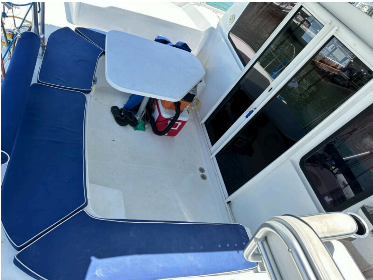
Used Sail Catamaran for sale 2007 FOUNTAINE PAJOT Mahe 36 - SAIL LA VIE