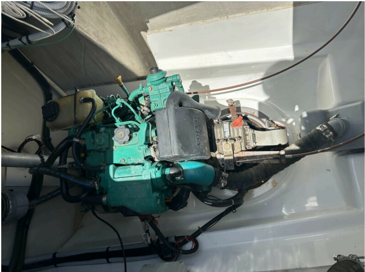
Used Sail Catamaran for sale 2007 FOUNTAINE PAJOT Mahe 36 - SAIL LA VIE