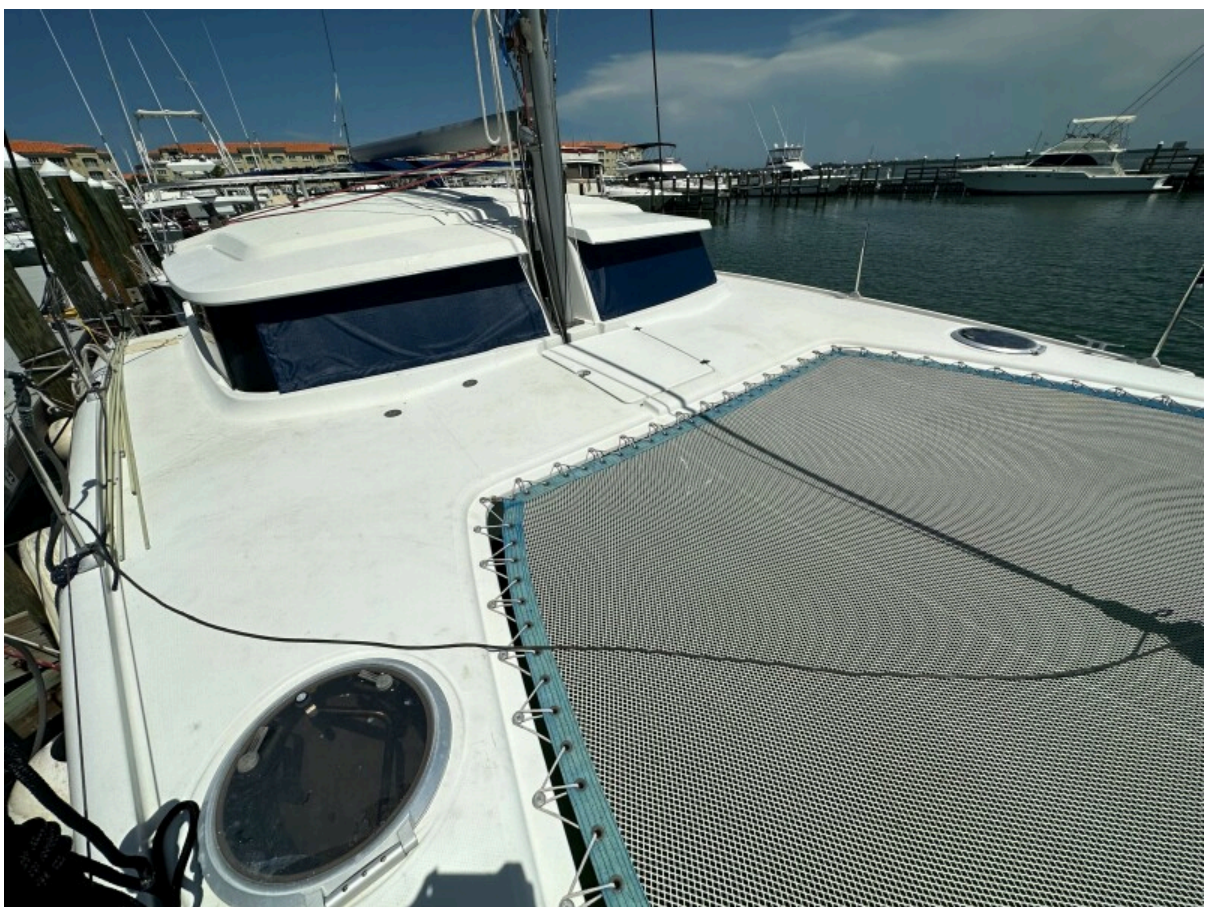
Used Sail Catamaran for sale 2007 FOUNTAINE PAJOT Mahe 36 - SAIL LA VIE