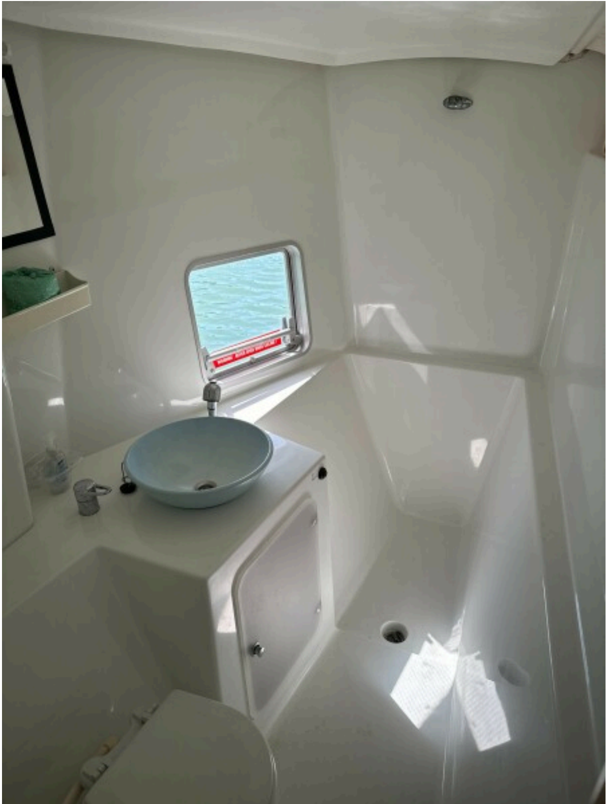
Used Sail Catamaran for sale 2007 FOUNTAINE PAJOT Mahe 36 - SAIL LA VIE