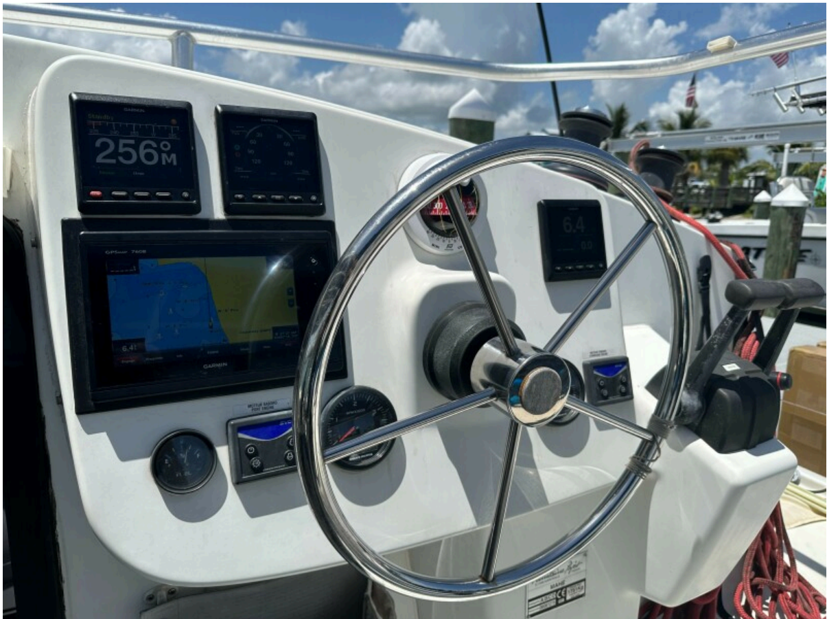
Used Sail Catamaran for sale 2007 FOUNTAINE PAJOT Mahe 36 - SAIL LA VIE