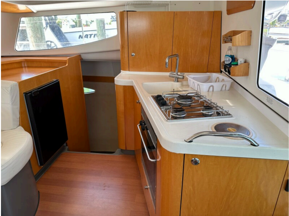
Used Sail Catamaran for sale 2007 FOUNTAINE PAJOT Mahe 36 - SAIL LA VIE