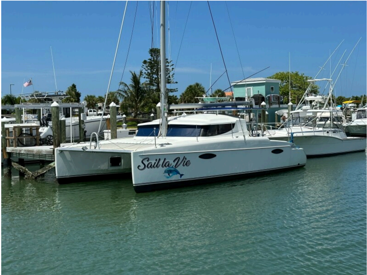
Used Sail Catamaran for sale 2007 FOUNTAINE PAJOT Mahe 36 - SAIL LA VIE