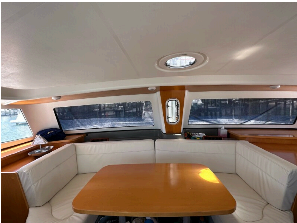
Used Sail Catamaran for sale 2007 FOUNTAINE PAJOT Mahe 36 - SAIL LA VIE