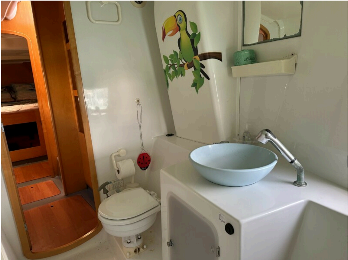
Used Sail Catamaran for sale 2007 FOUNTAINE PAJOT Mahe 36 - SAIL LA VIE