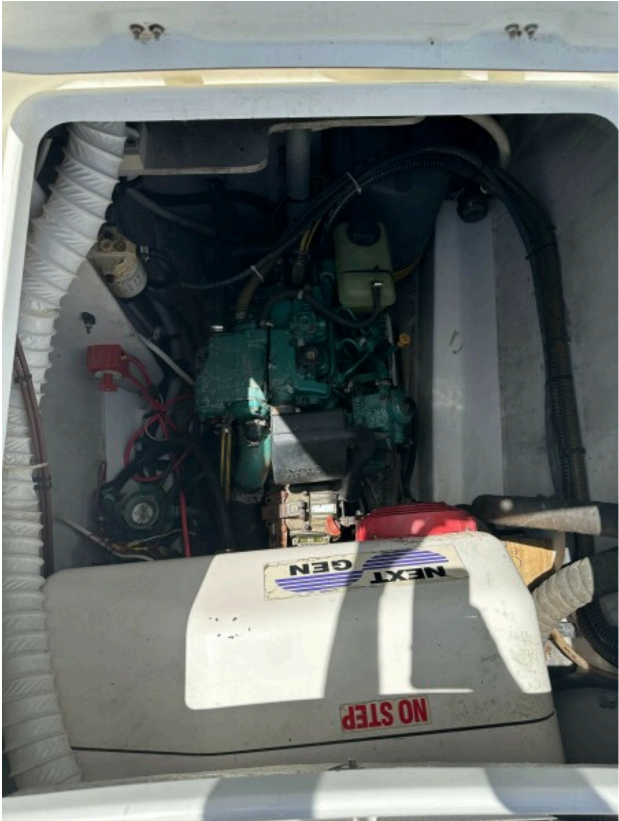
Used Sail Catamaran for sale 2007 FOUNTAINE PAJOT Mahe 36 - SAIL LA VIE