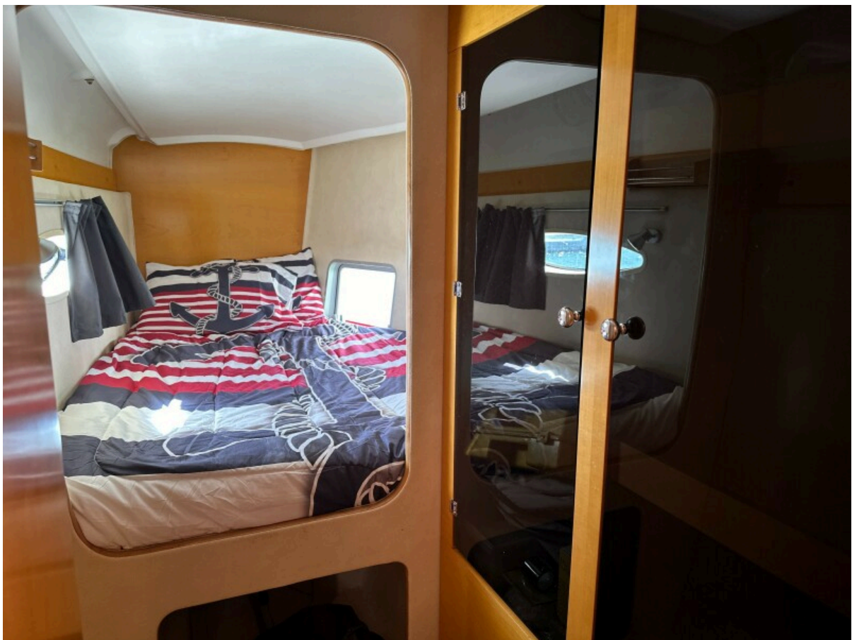
Used Sail Catamaran for sale 2007 FOUNTAINE PAJOT Mahe 36 - SAIL LA VIE