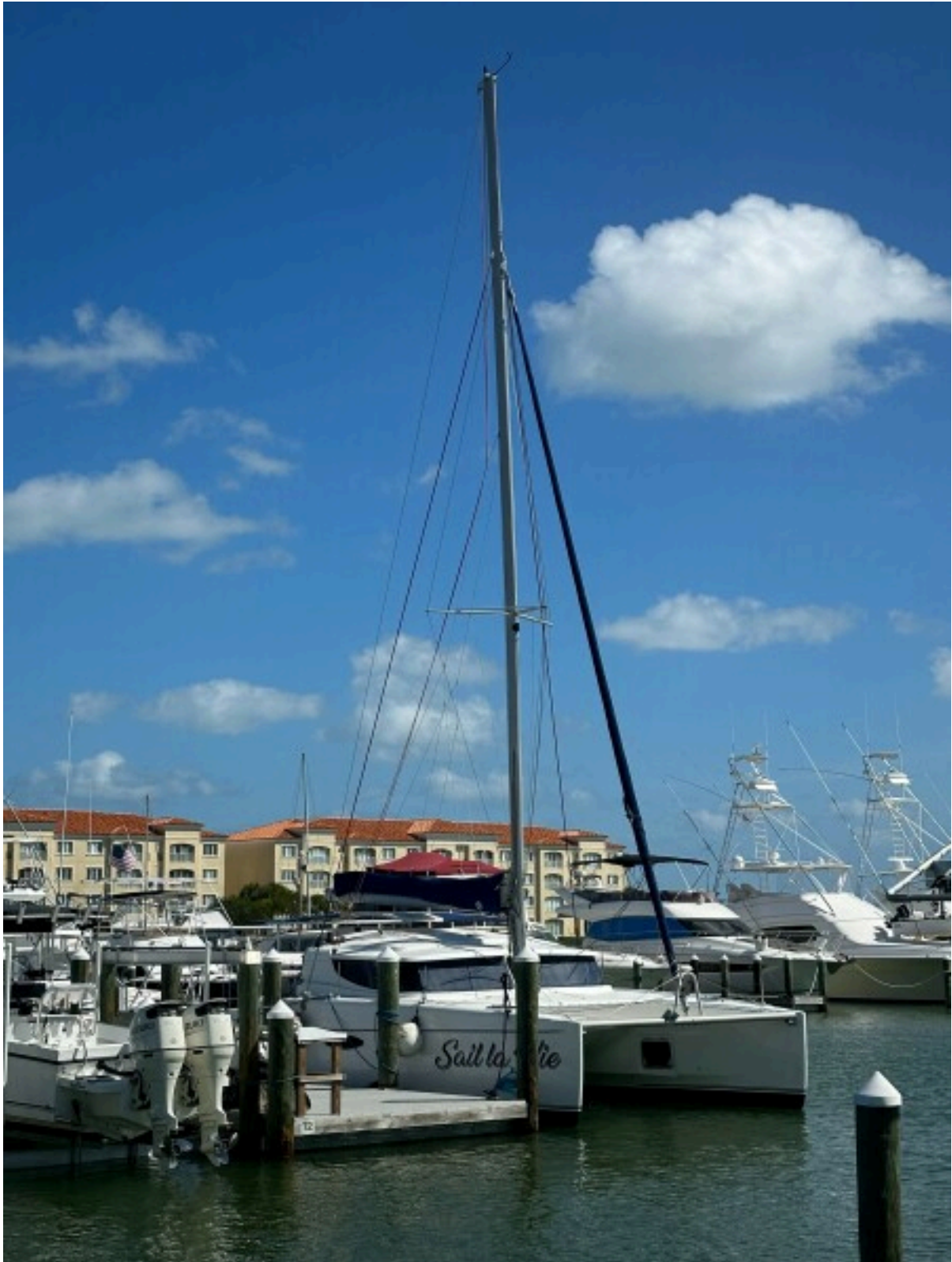
Used Sail Catamaran for sale 2007 FOUNTAINE PAJOT Mahe 36 - SAIL LA VIE