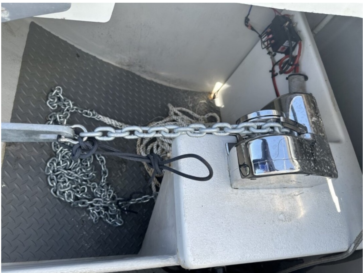
Used Sail Catamaran for sale 2007 FOUNTAINE PAJOT Mahe 36 - SAIL LA VIE