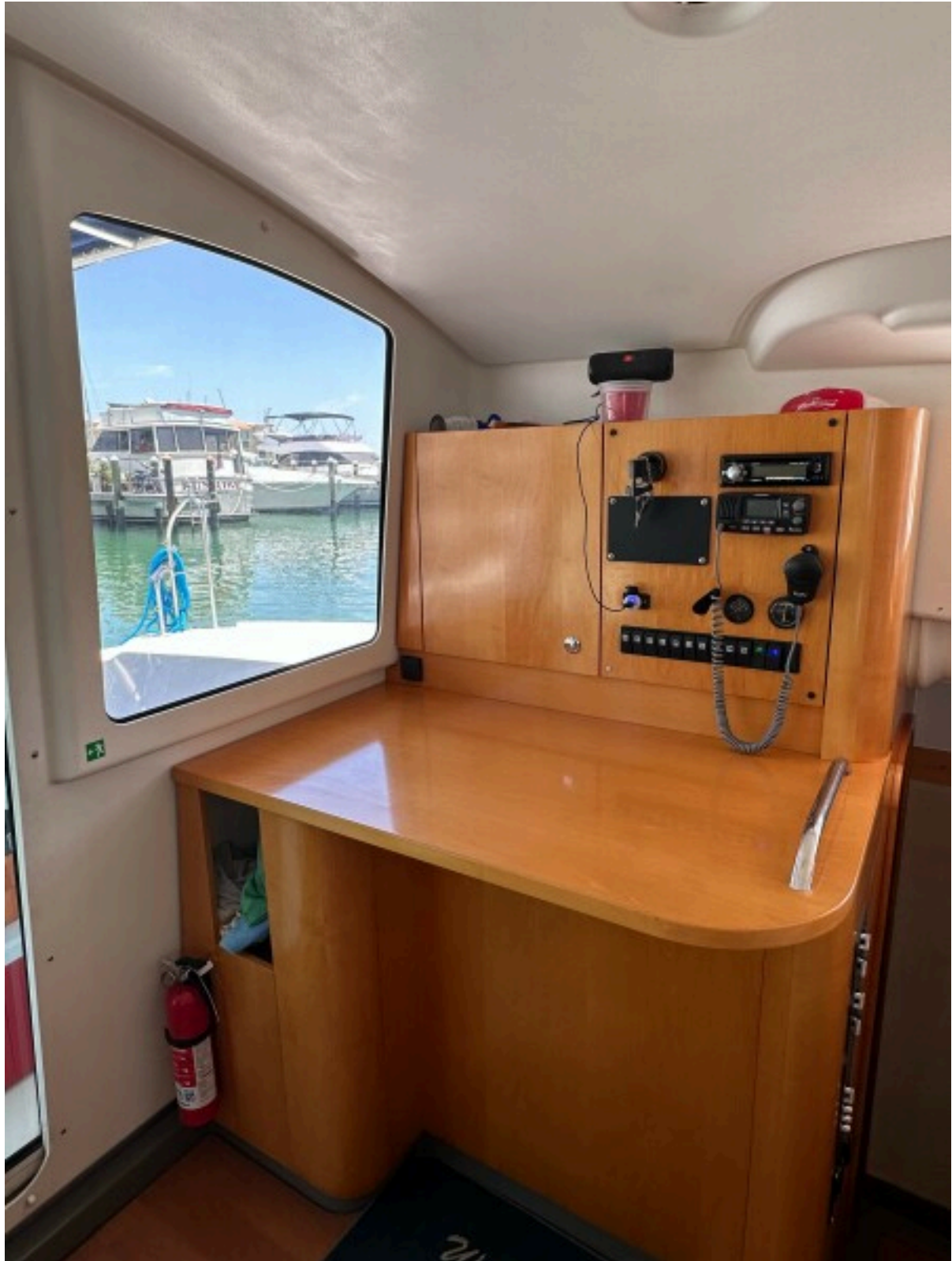
Used Sail Catamaran for sale 2007 FOUNTAINE PAJOT Mahe 36 - SAIL LA VIE