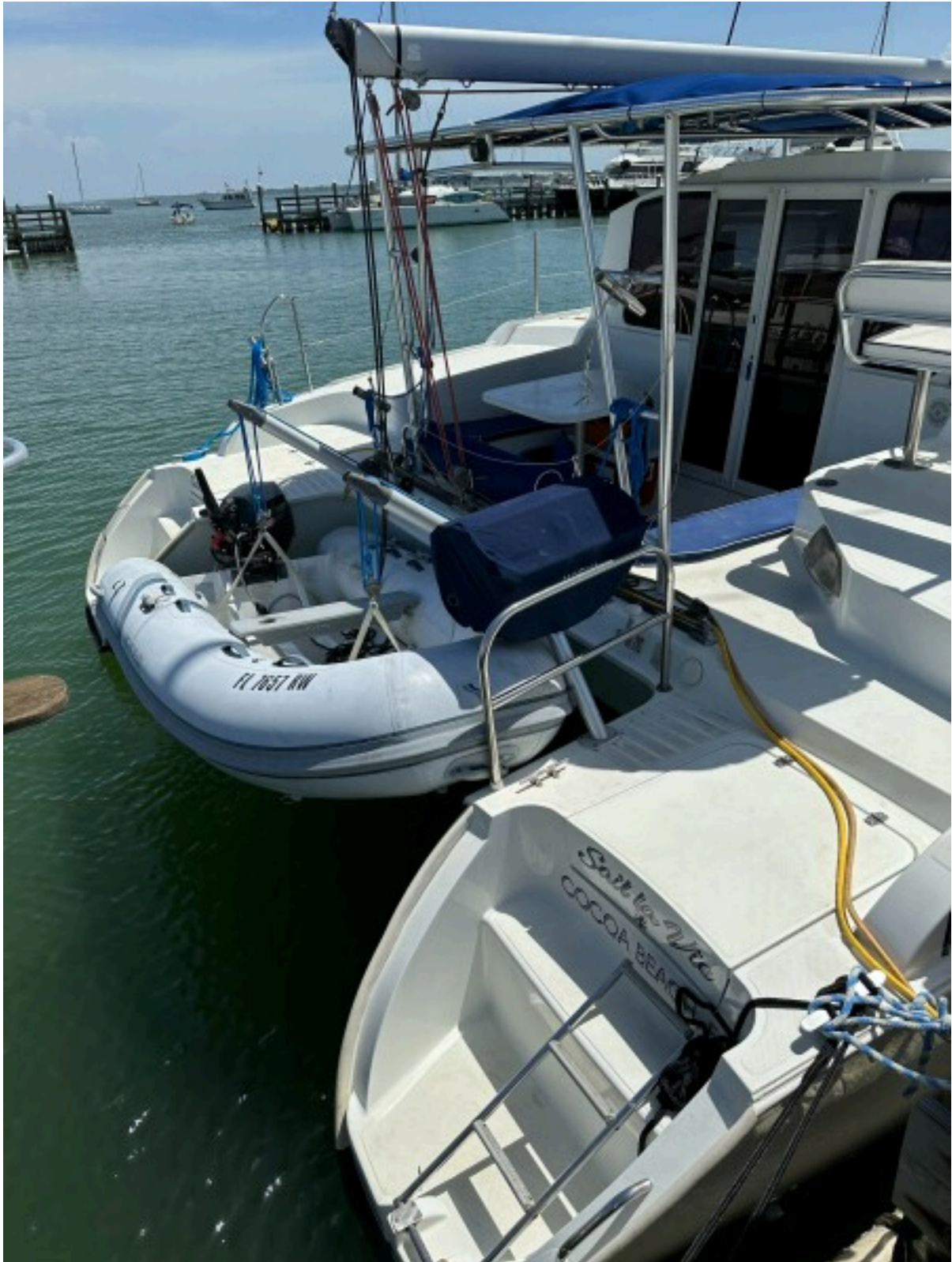
Used Sail Catamaran for sale 2007 FOUNTAINE PAJOT Mahe 36 - SAIL LA VIE