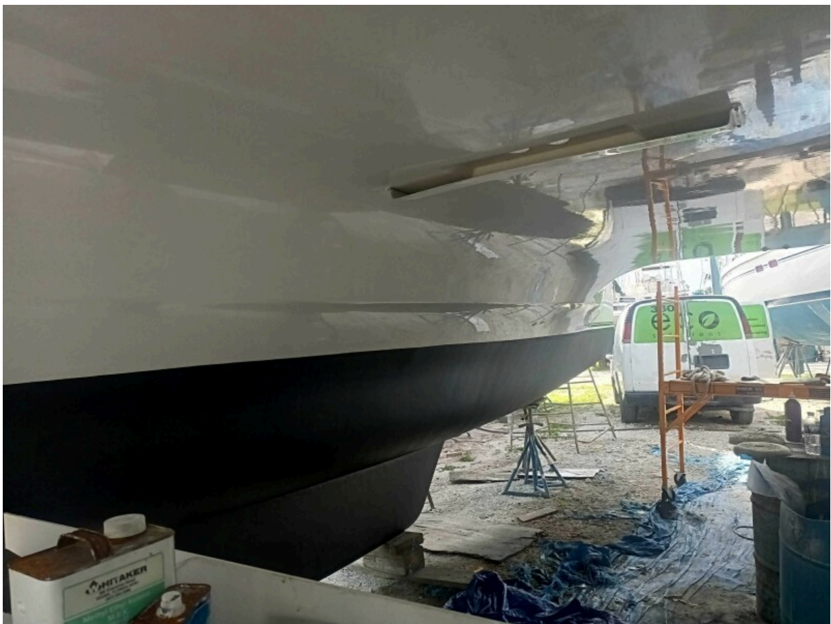
Used Sail Catamaran for sale 2007 FOUNTAINE PAJOT Mahe 36 - SAIL LA VIE