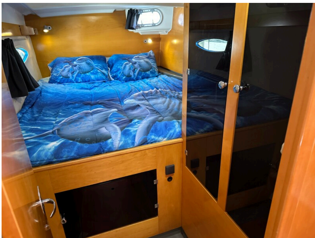
Used Sail Catamaran for sale 2007 FOUNTAINE PAJOT Mahe 36 - SAIL LA VIE