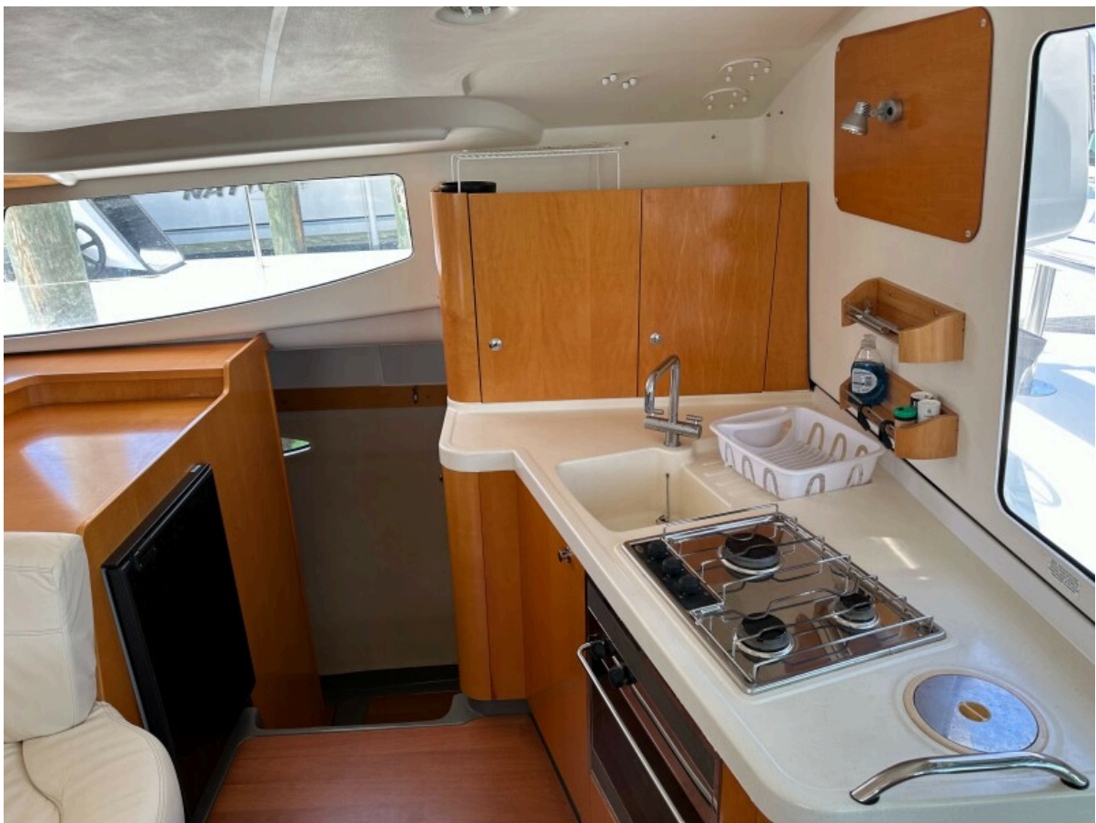
Used Sail Catamaran for sale 2007 FOUNTAINE PAJOT Mahe 36 - SAIL LA VIE