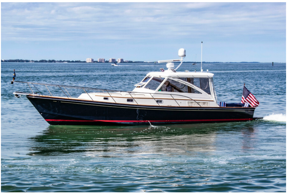
This 2003 40' Hinckley Little Harbor WhisperJet for sale - SYS Yacht Sales