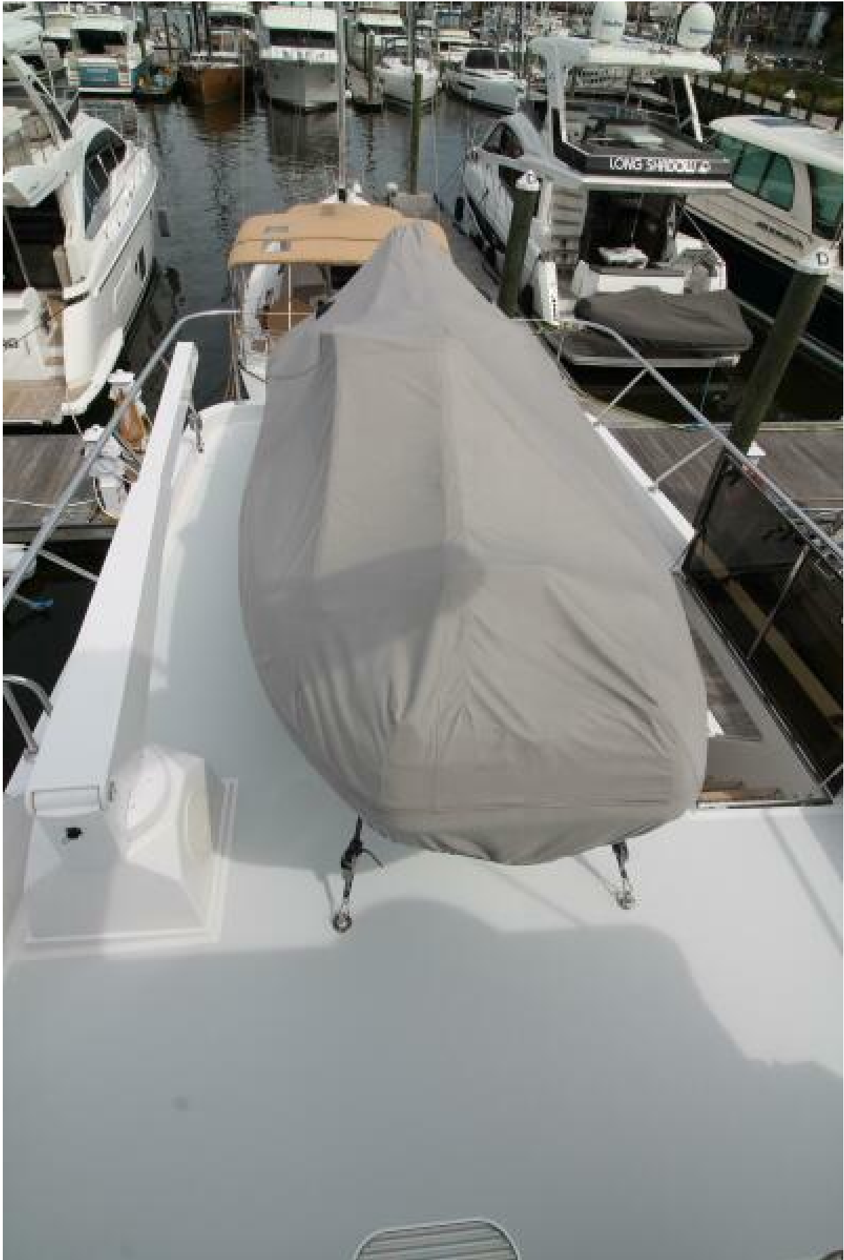
2023 Walker Bay cover