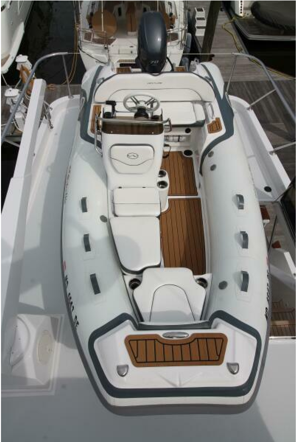
2023 Walker Bay 14