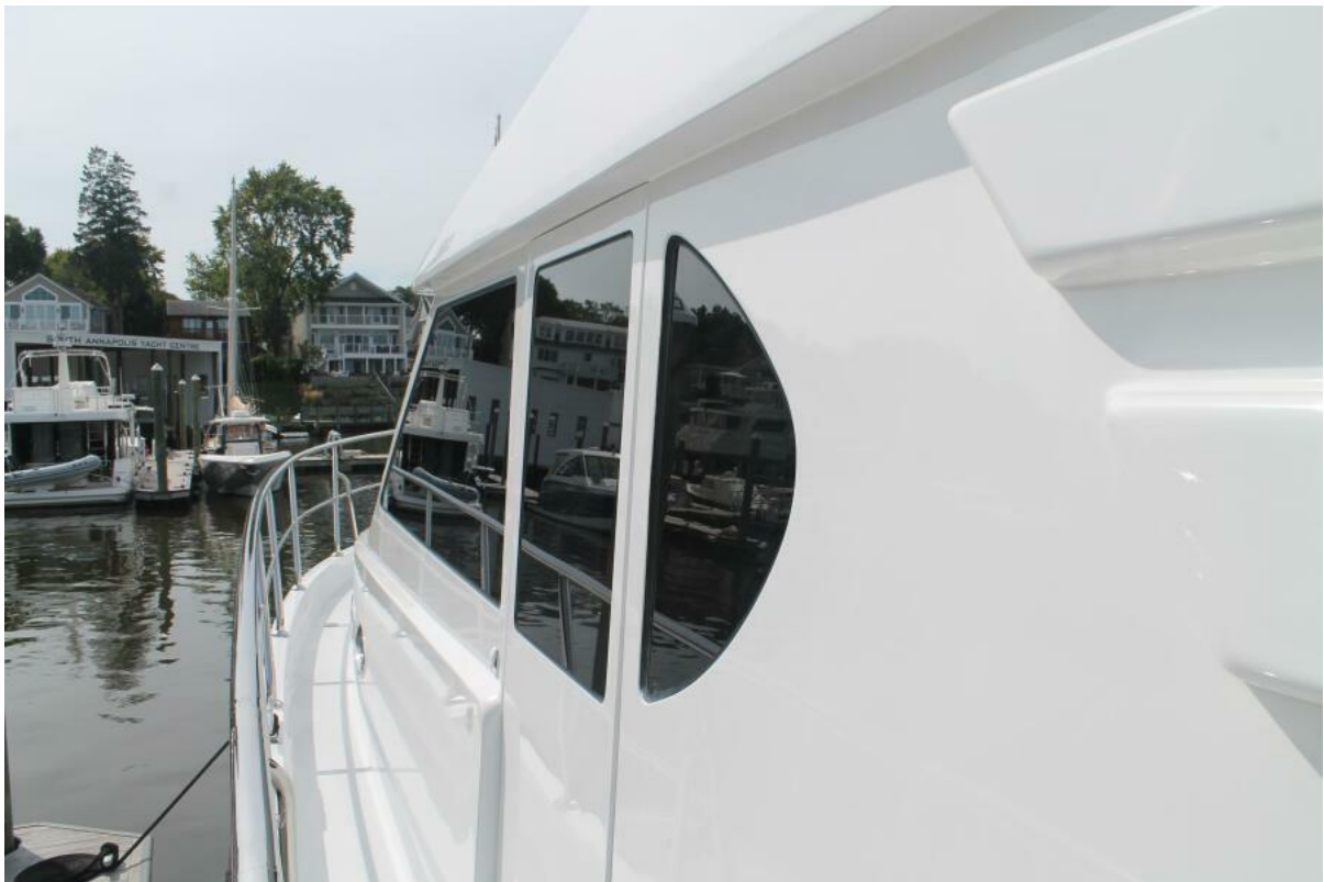
Fresh paint 2022