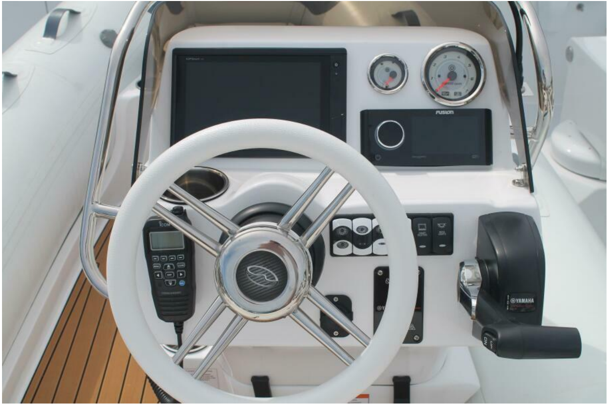
2023 Walker Bay helm