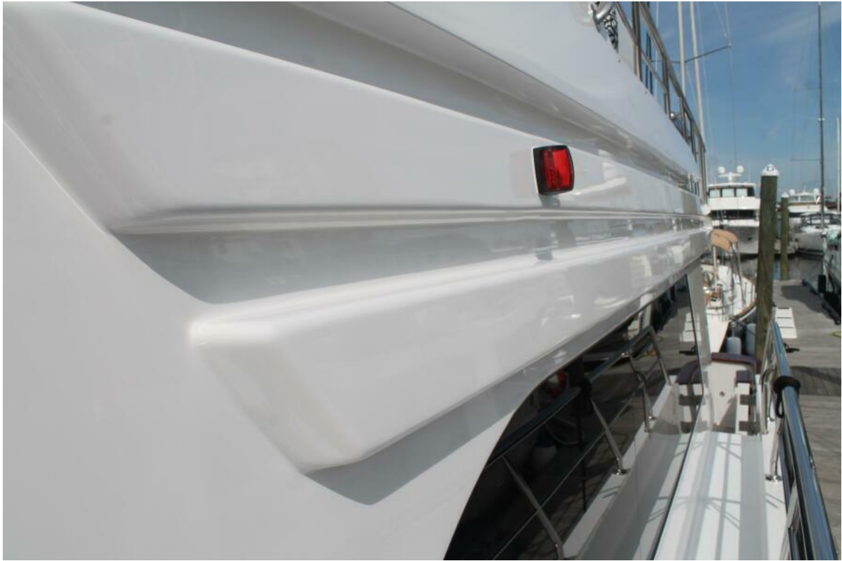
Fresh paint 2022