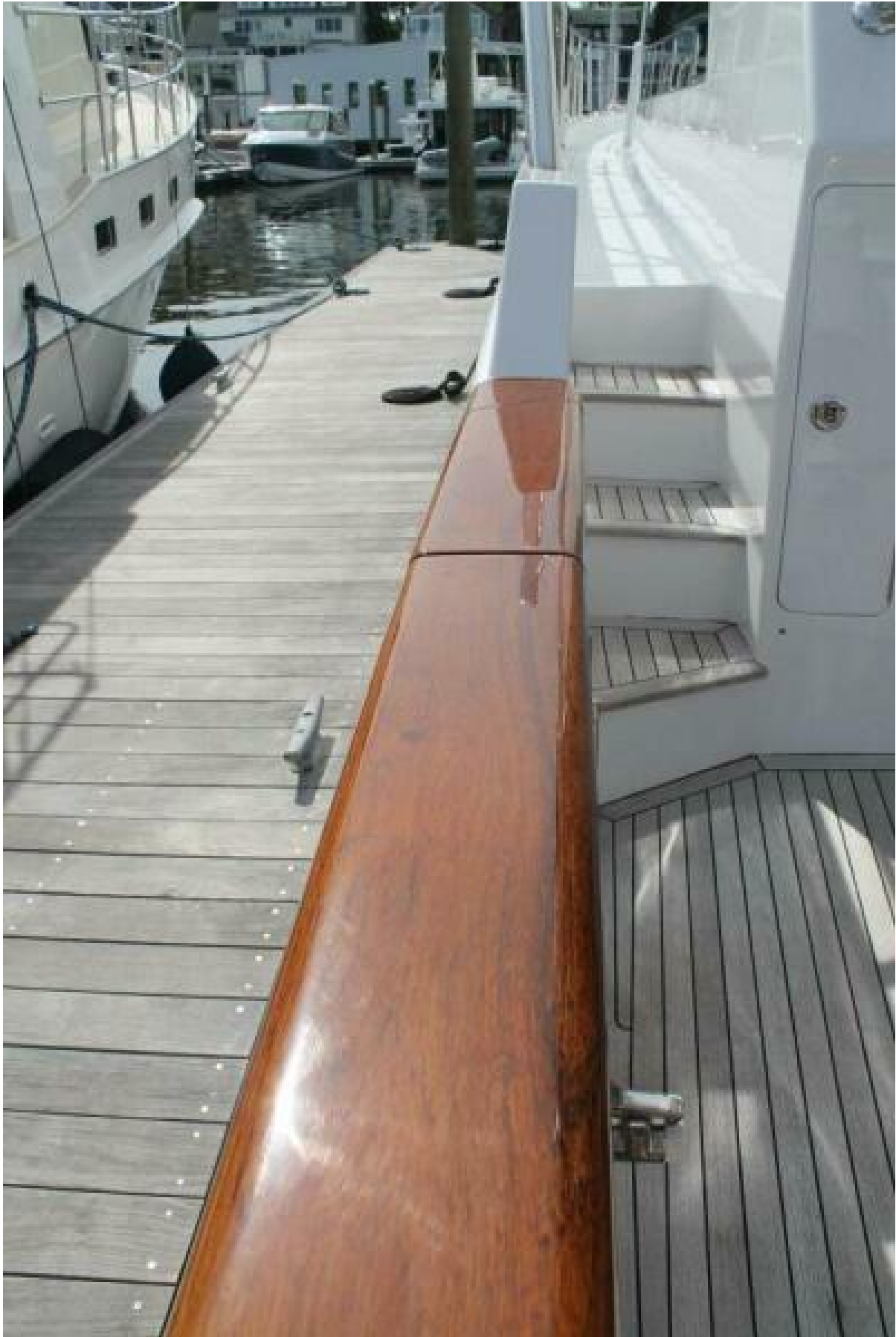
Aft deck cap rail