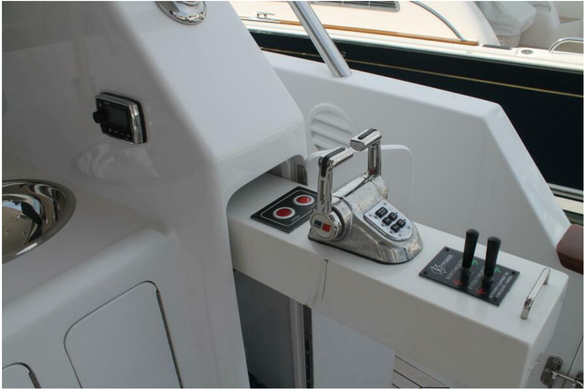
Aft deck station