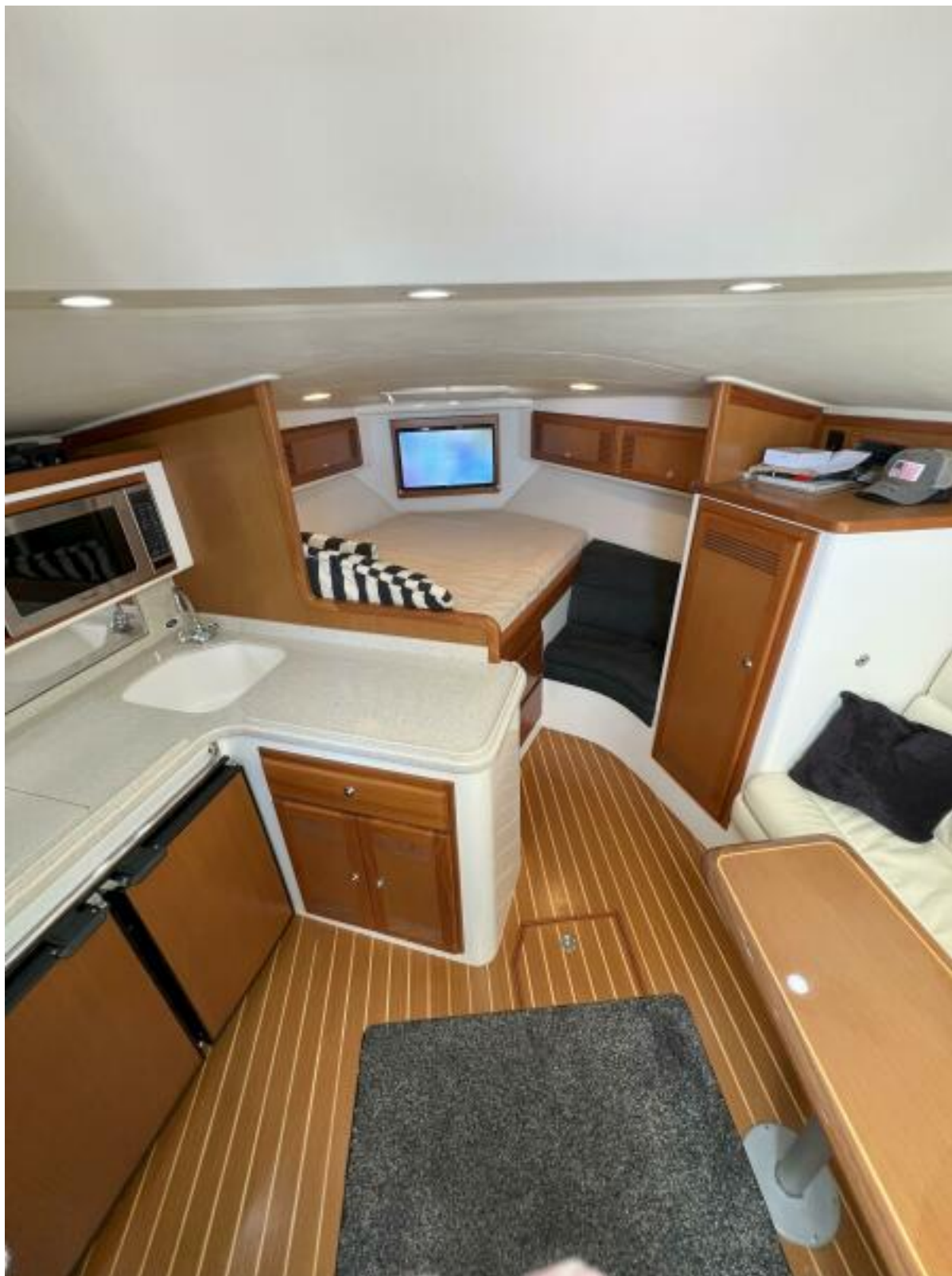
2004 Cabo 35 Express - MANTINICUS