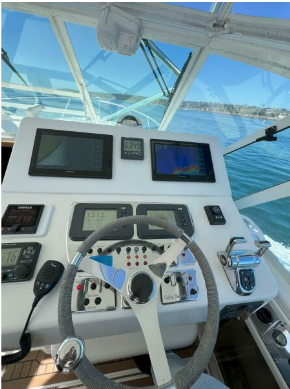
2004 Cabo 35 Express - MANTINICUS