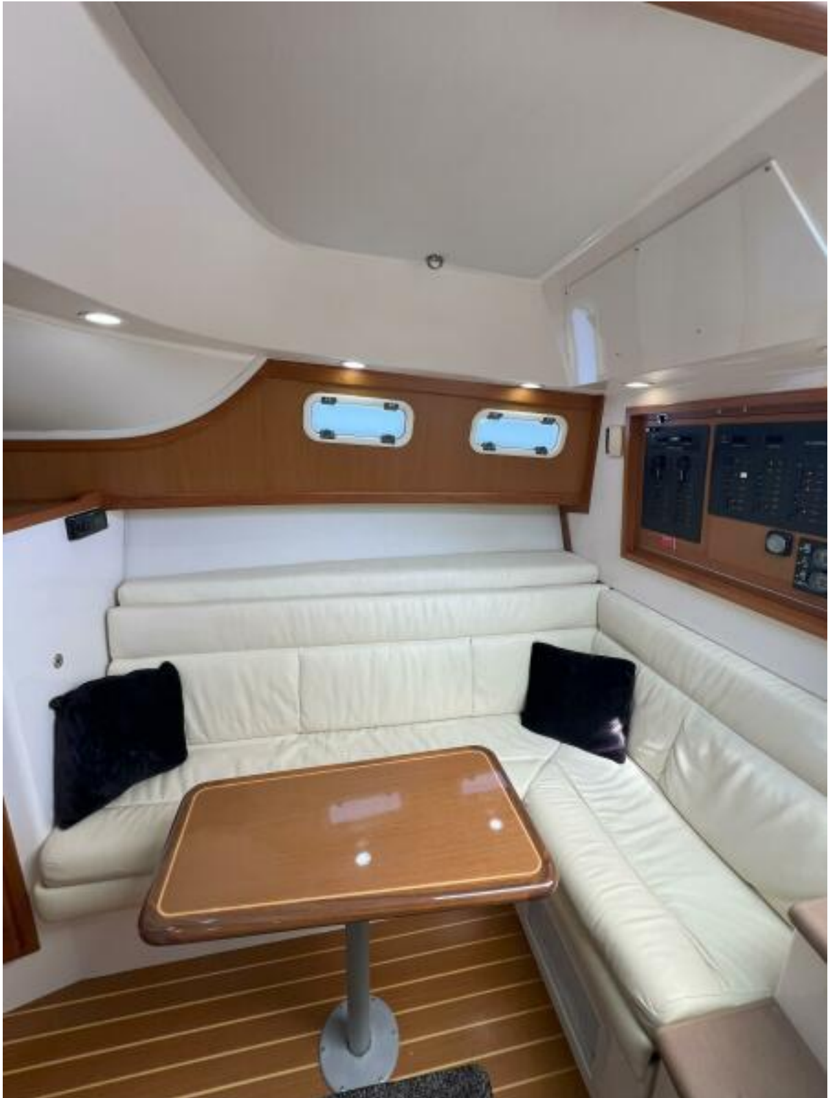
2004 Cabo 35 Express - MANTINICUS