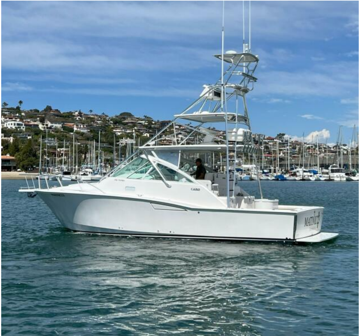
2004 Cabo 35 Express MANTINICUS