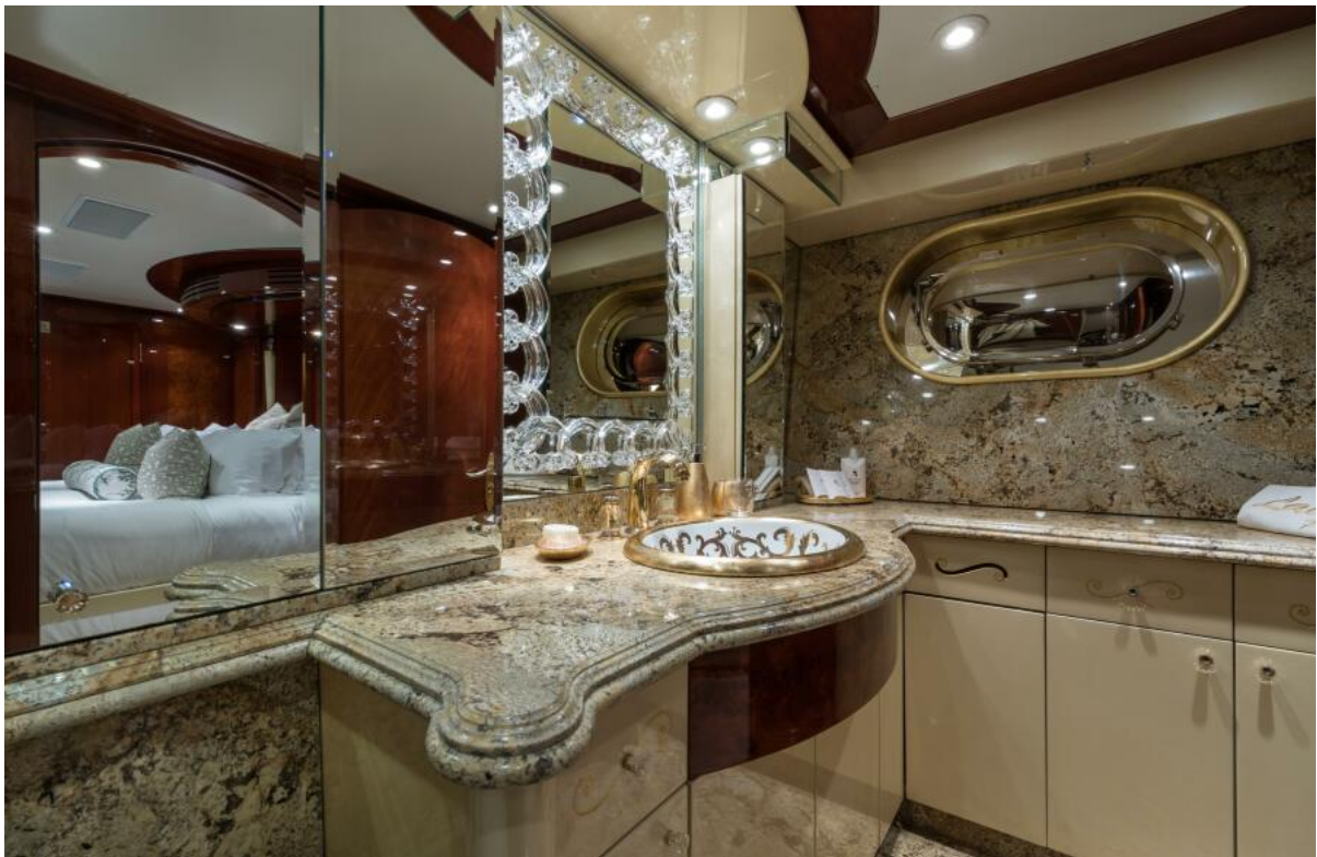
Guest 2 Bath