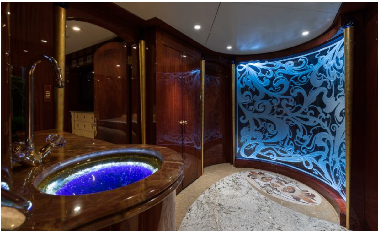
Lower Deck Foyer