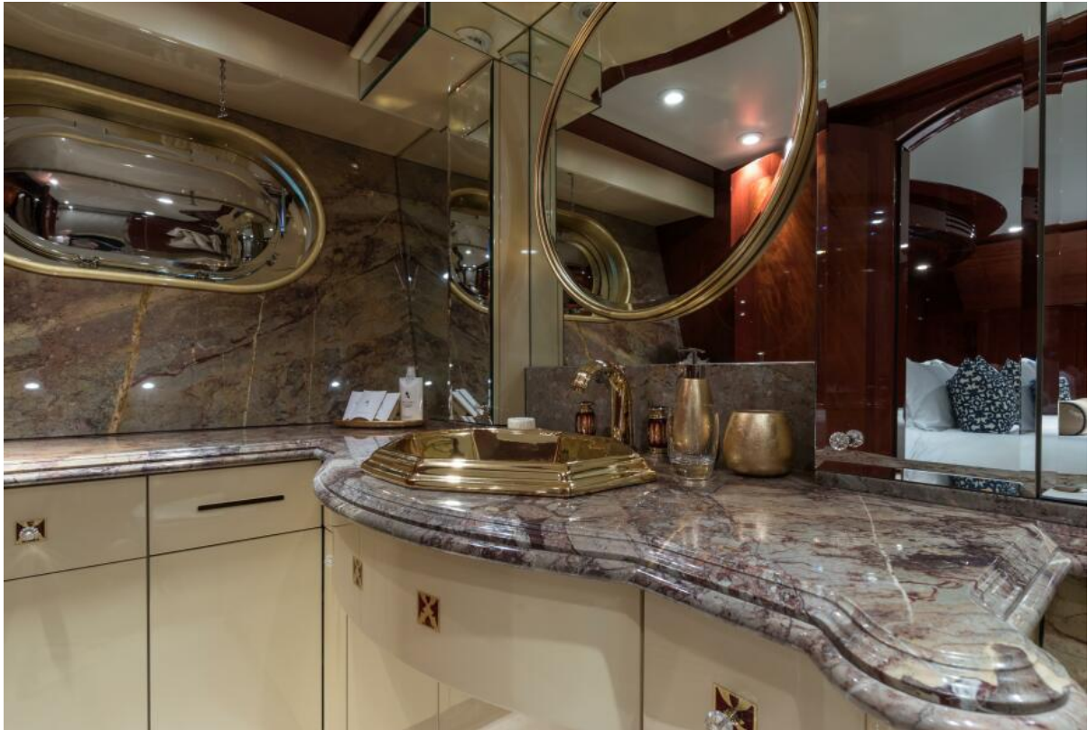
Guest 1 Bath