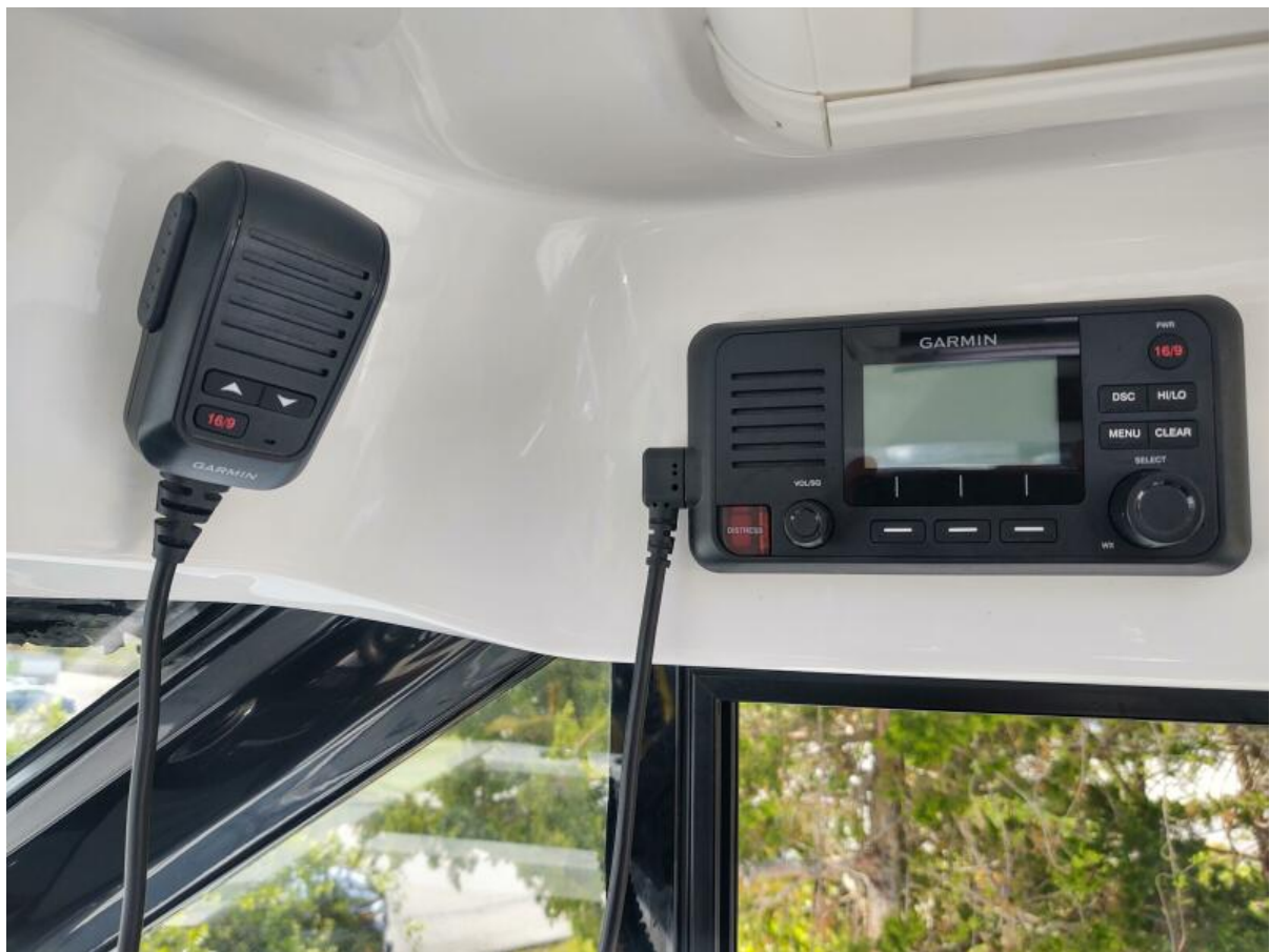
Knot Shore VHF radio