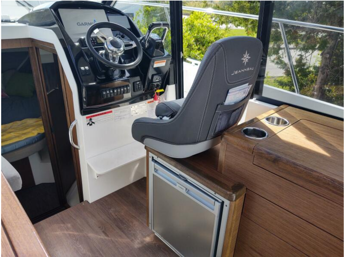
Knot Shore helm area