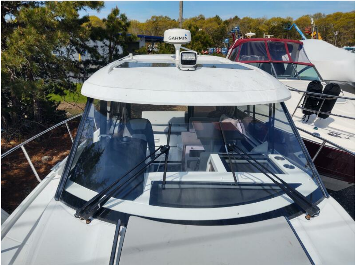
Knot Shore windshield