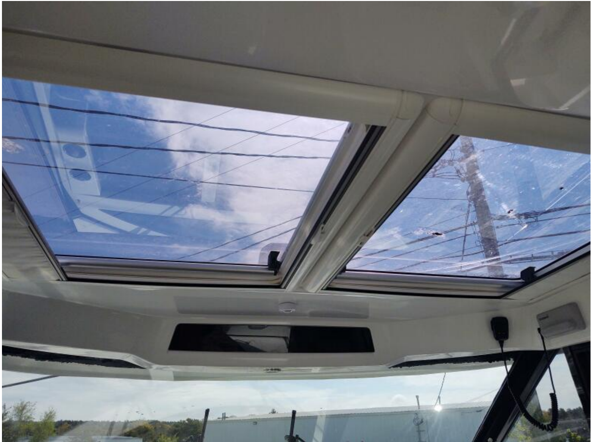
Knot Shore opening hatches