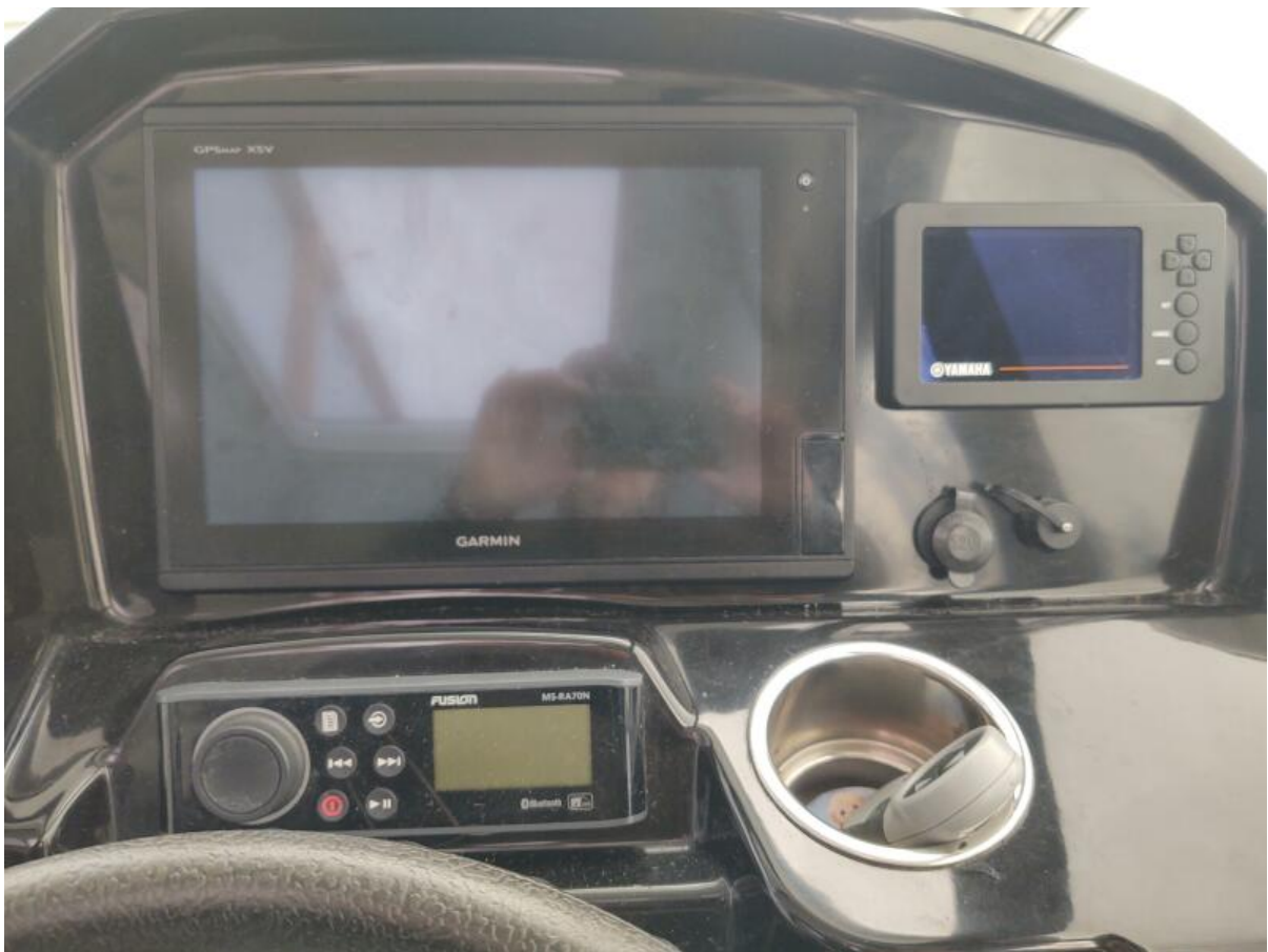
Knot Shore Chartplotter