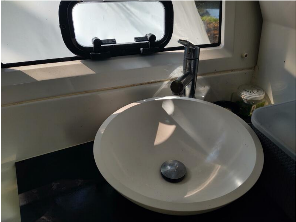
Knot Shore Head sink