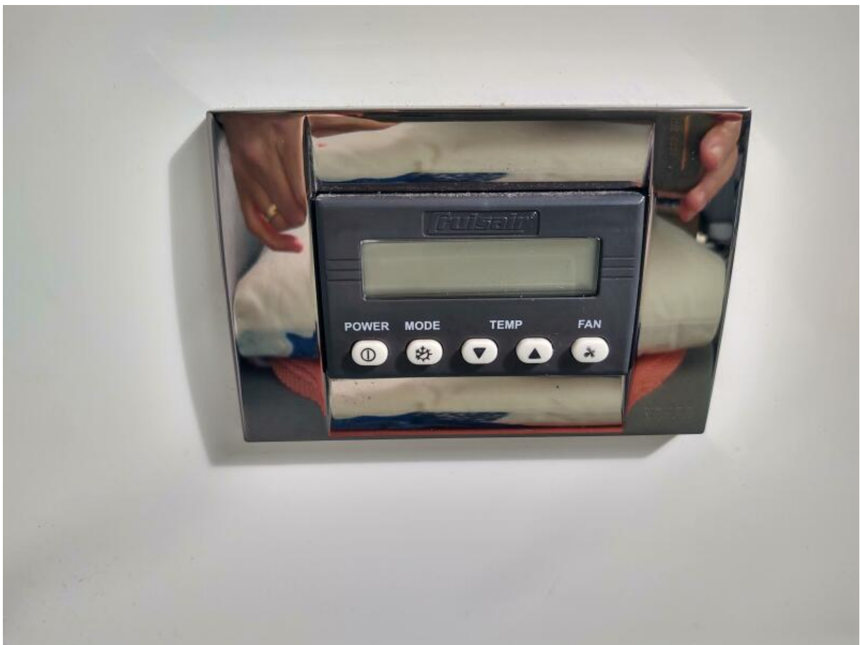
Knot Shore Air conditioning control