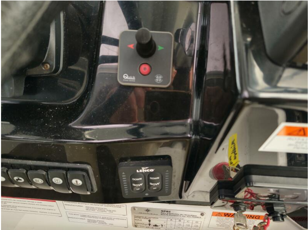
Knot Shore bow thruster and trim tabs