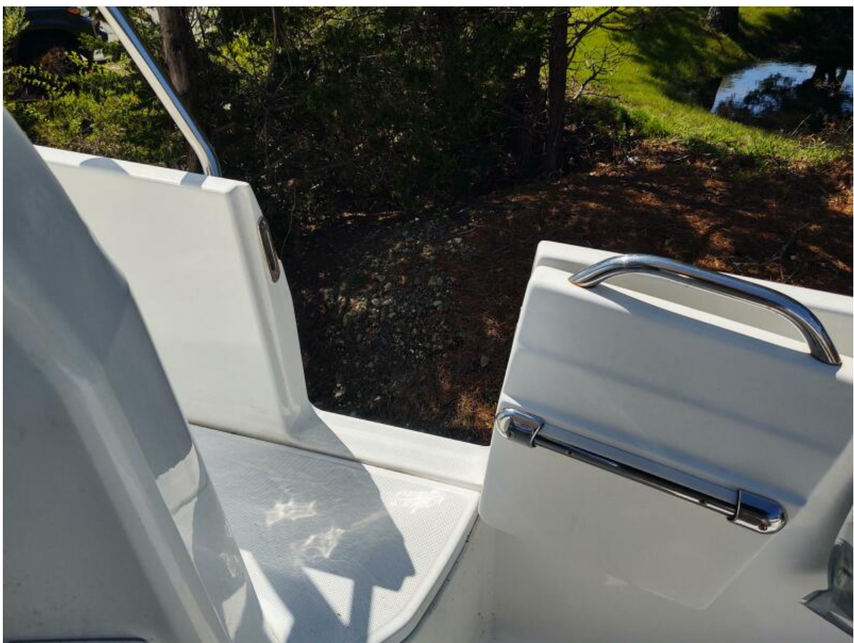
Knot Shore Cockpit side door open