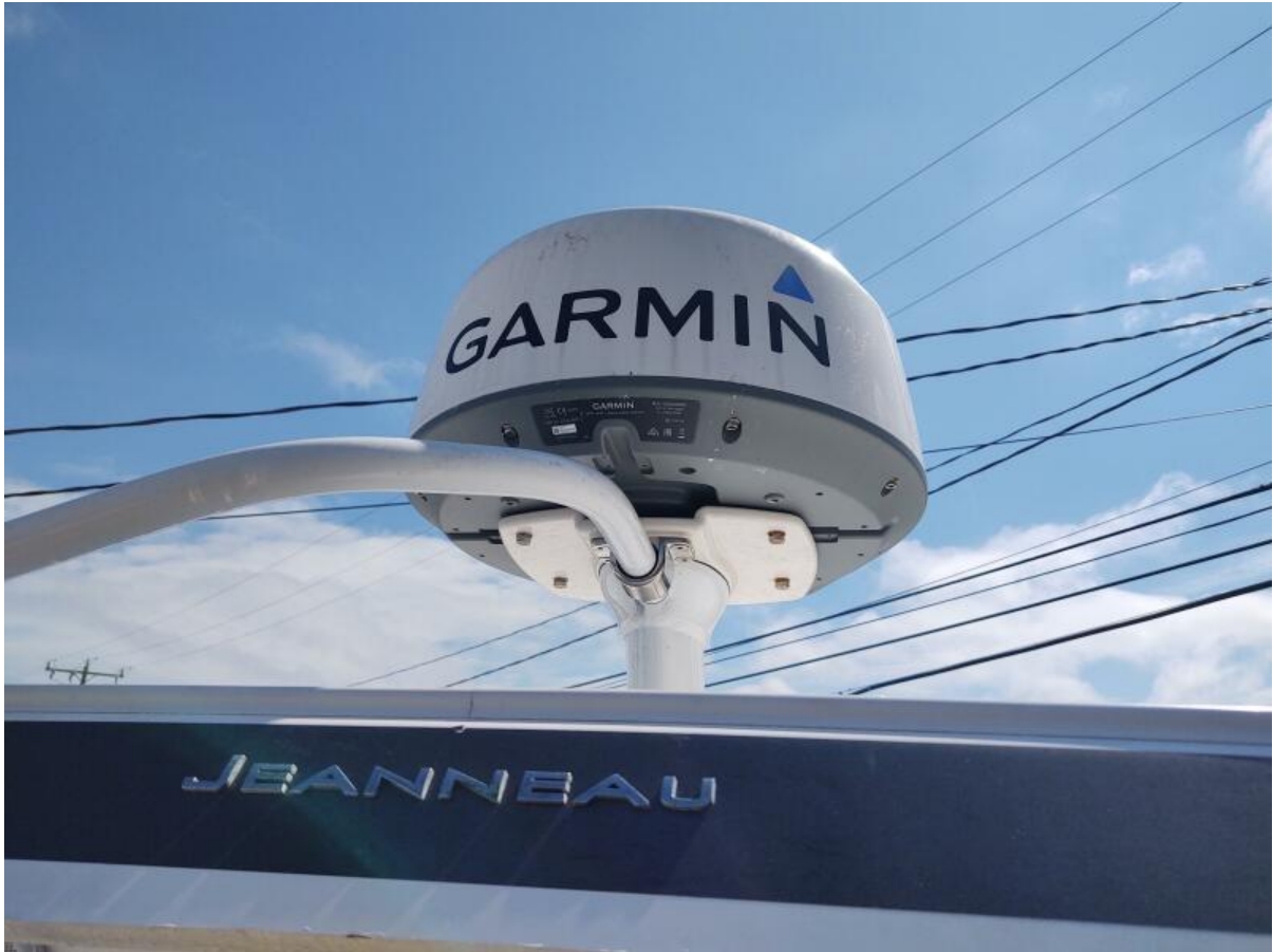
Knot Shore Garmin Radar