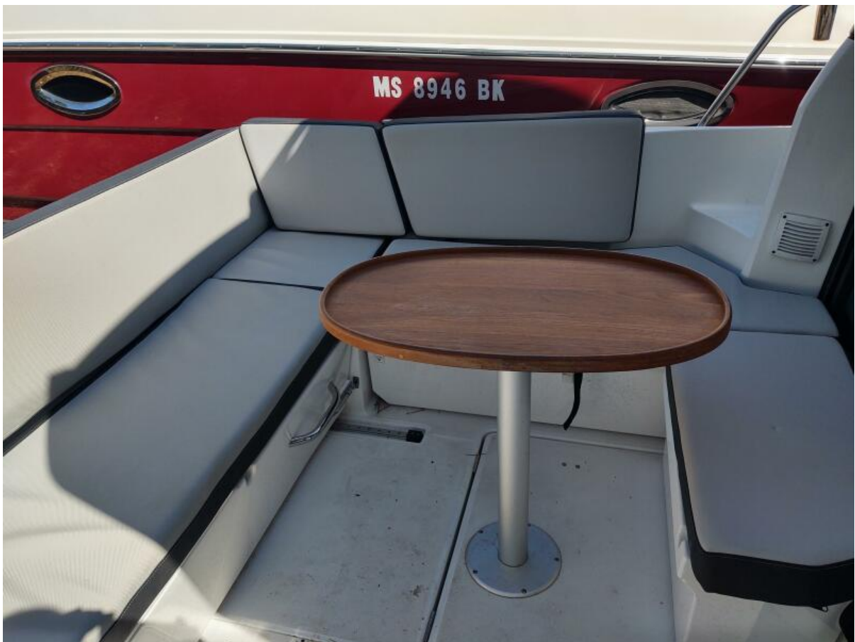
Knot Shore cockpit seating with table