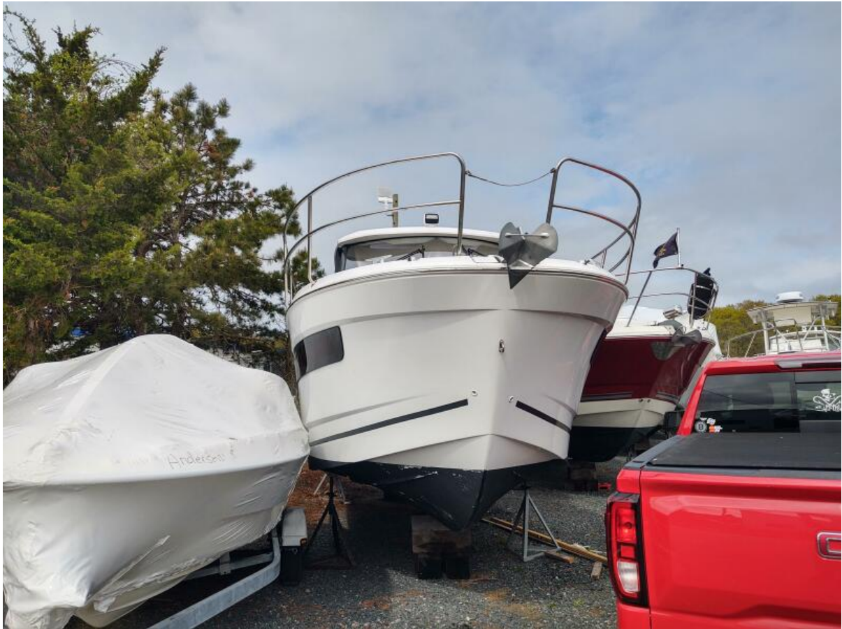
Knot Shore from bow