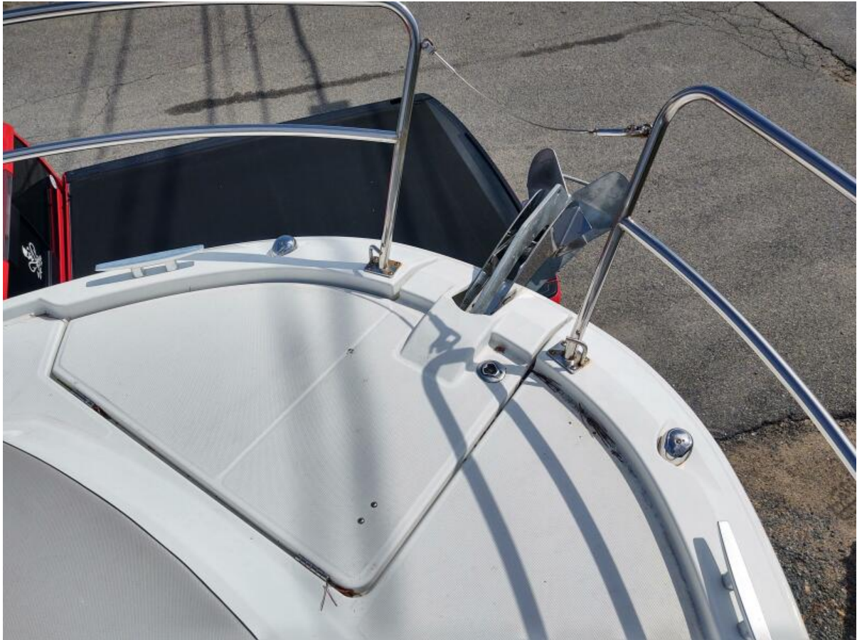
Knot Shore Foredeck