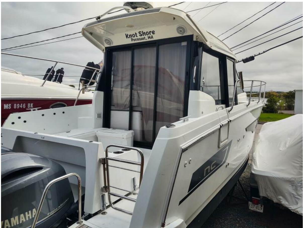
Knot Shore from stern