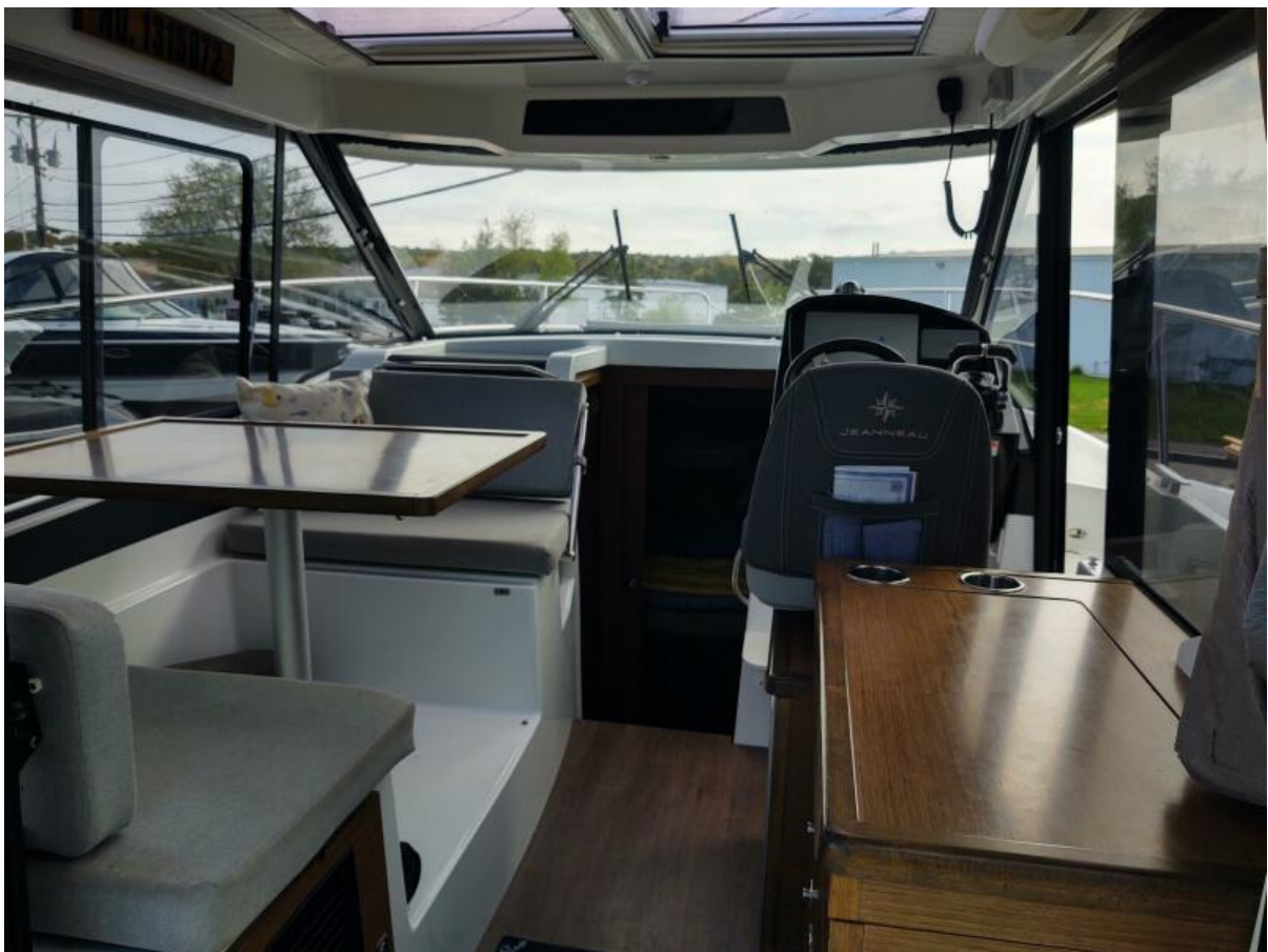
Knot Shore Interior