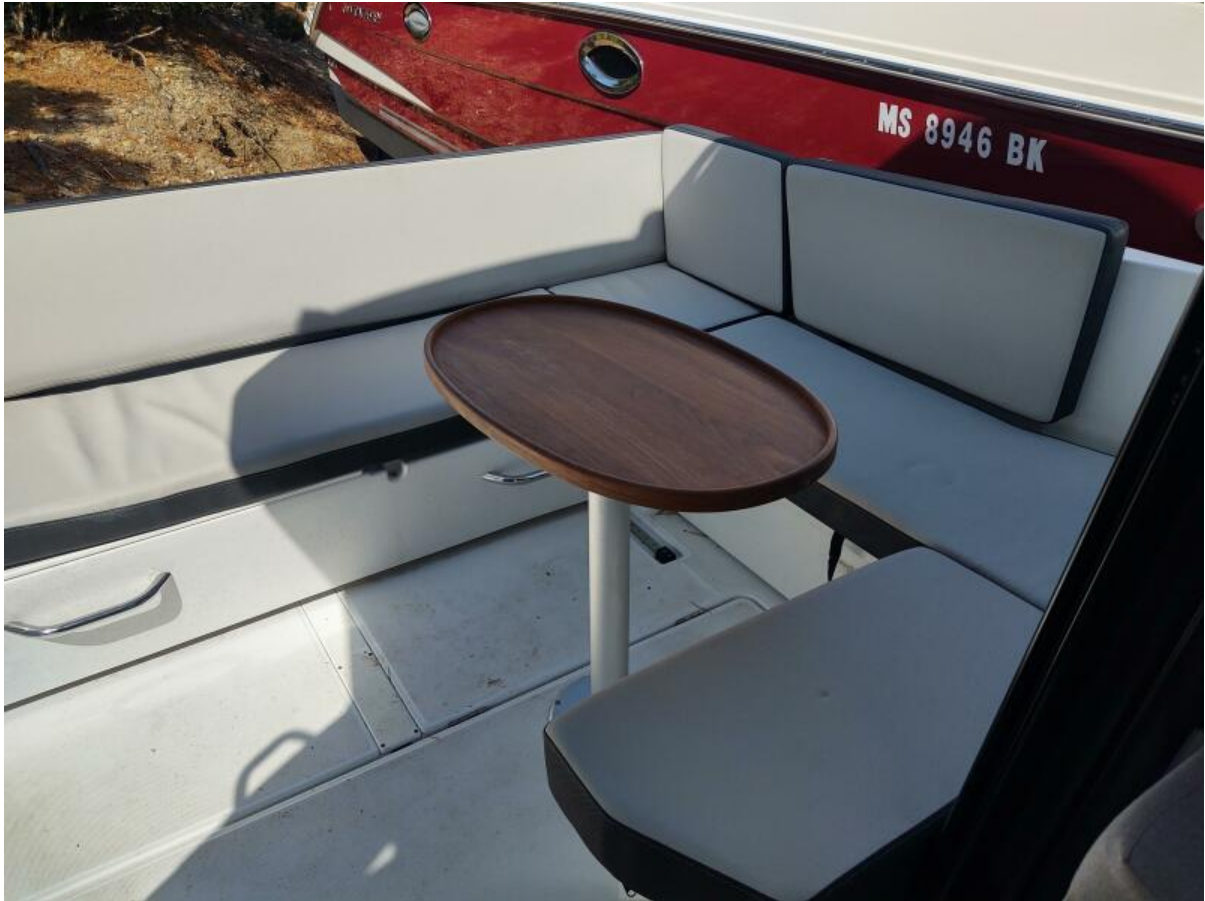
Knot Shore Cockpit seating with table