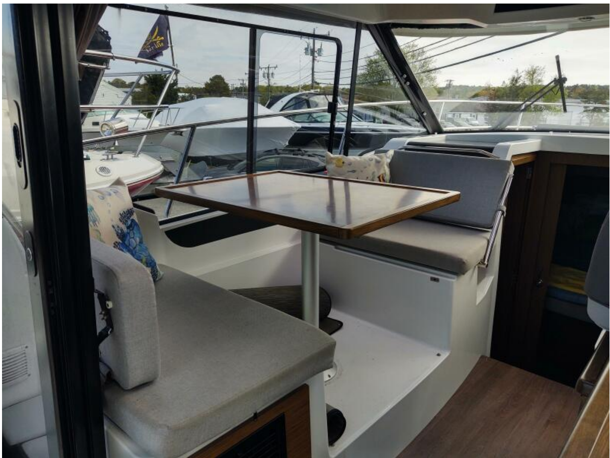
Knot Shore port settee