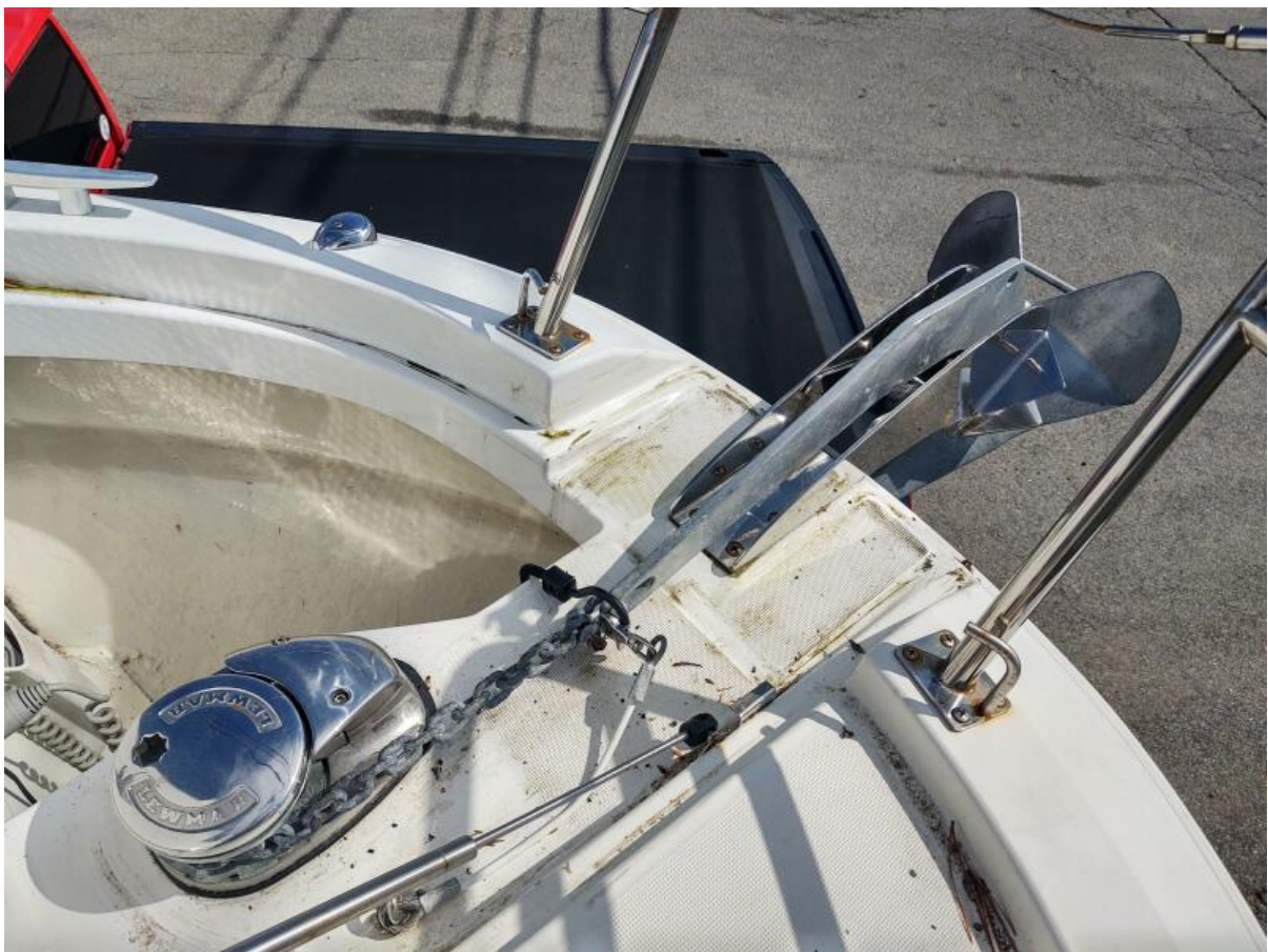
Knot Shore Anchor windlass