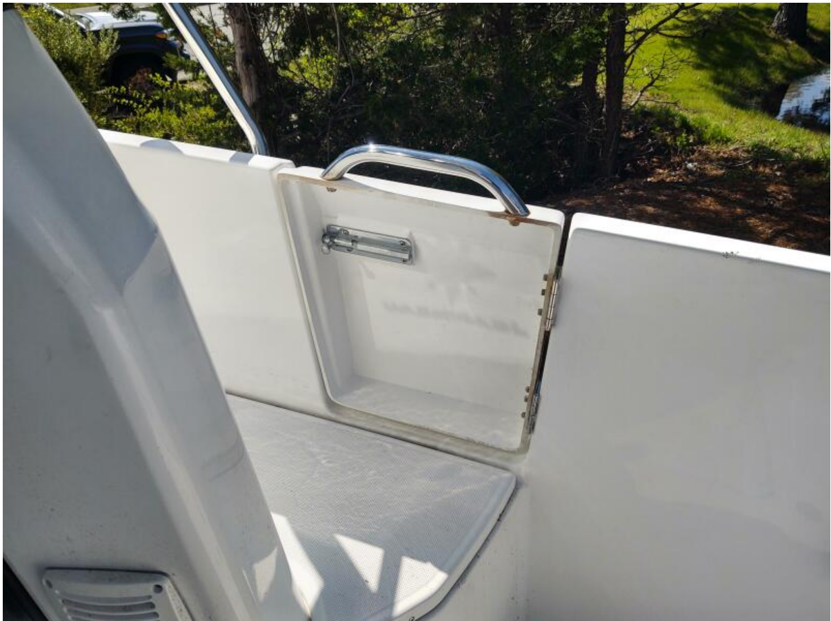
Knot Shore cockpit side door