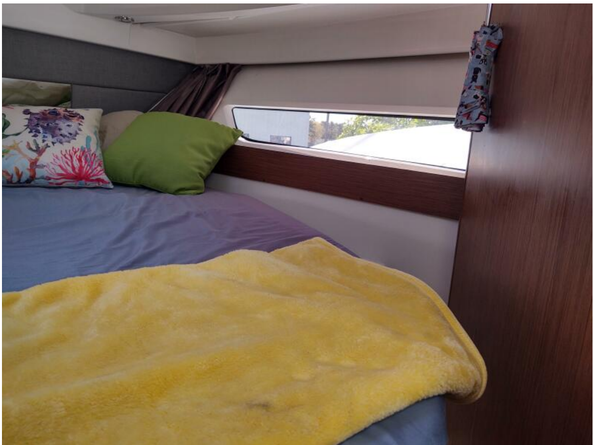
Knot Shore fwd berth