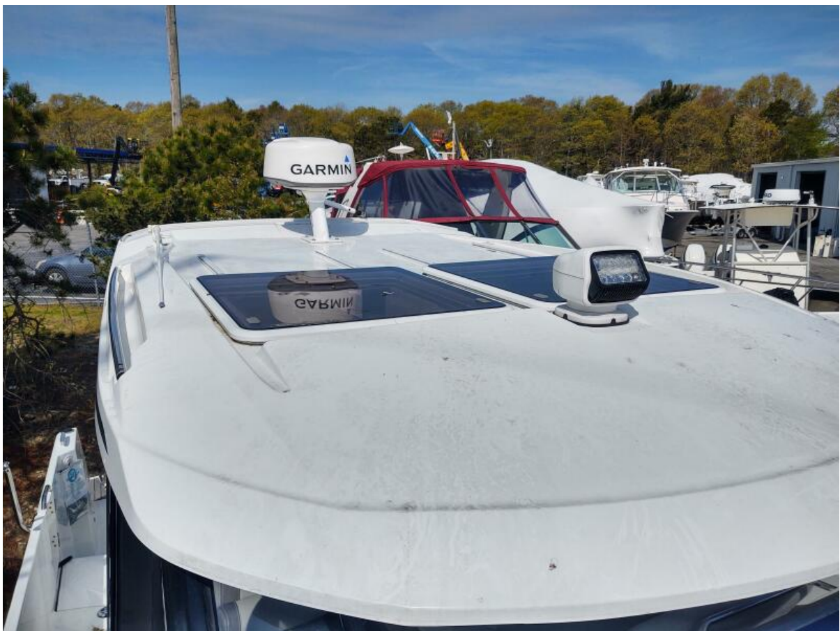
Knot Shore Cabin roof