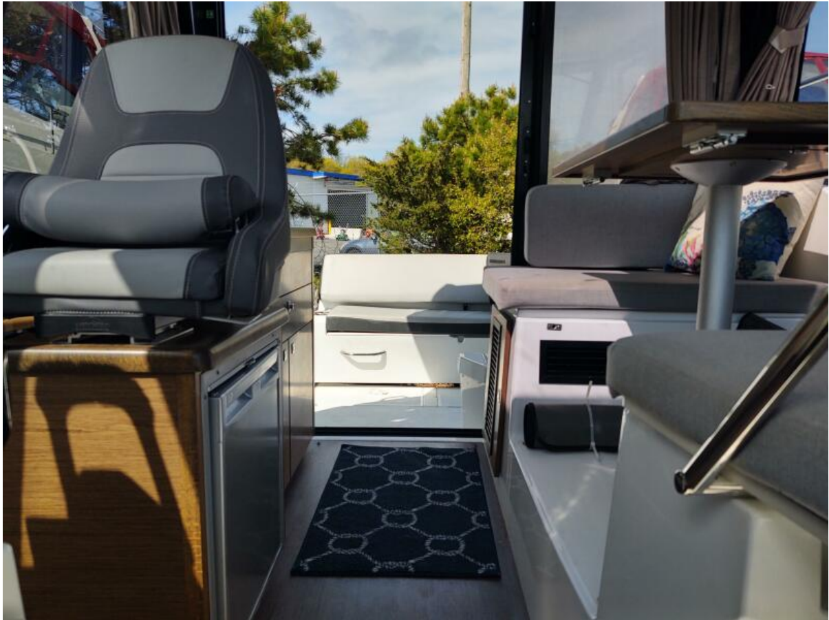
Knot Shore Interior aft