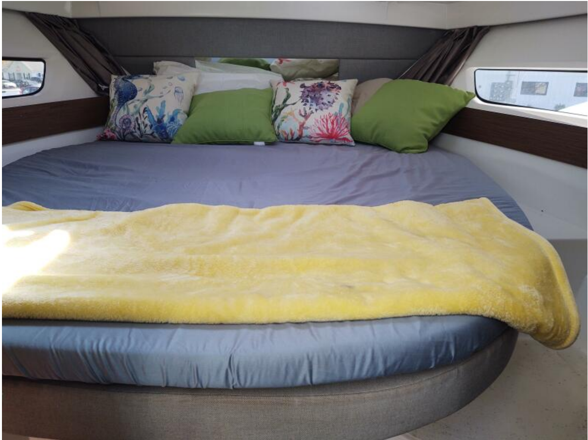
Knot Shore fwd berth