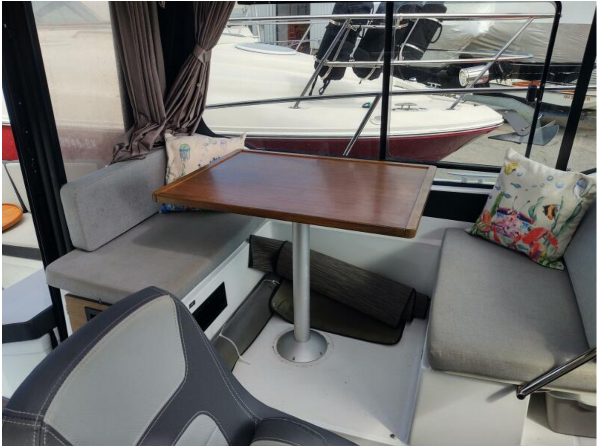
Knot Shore table