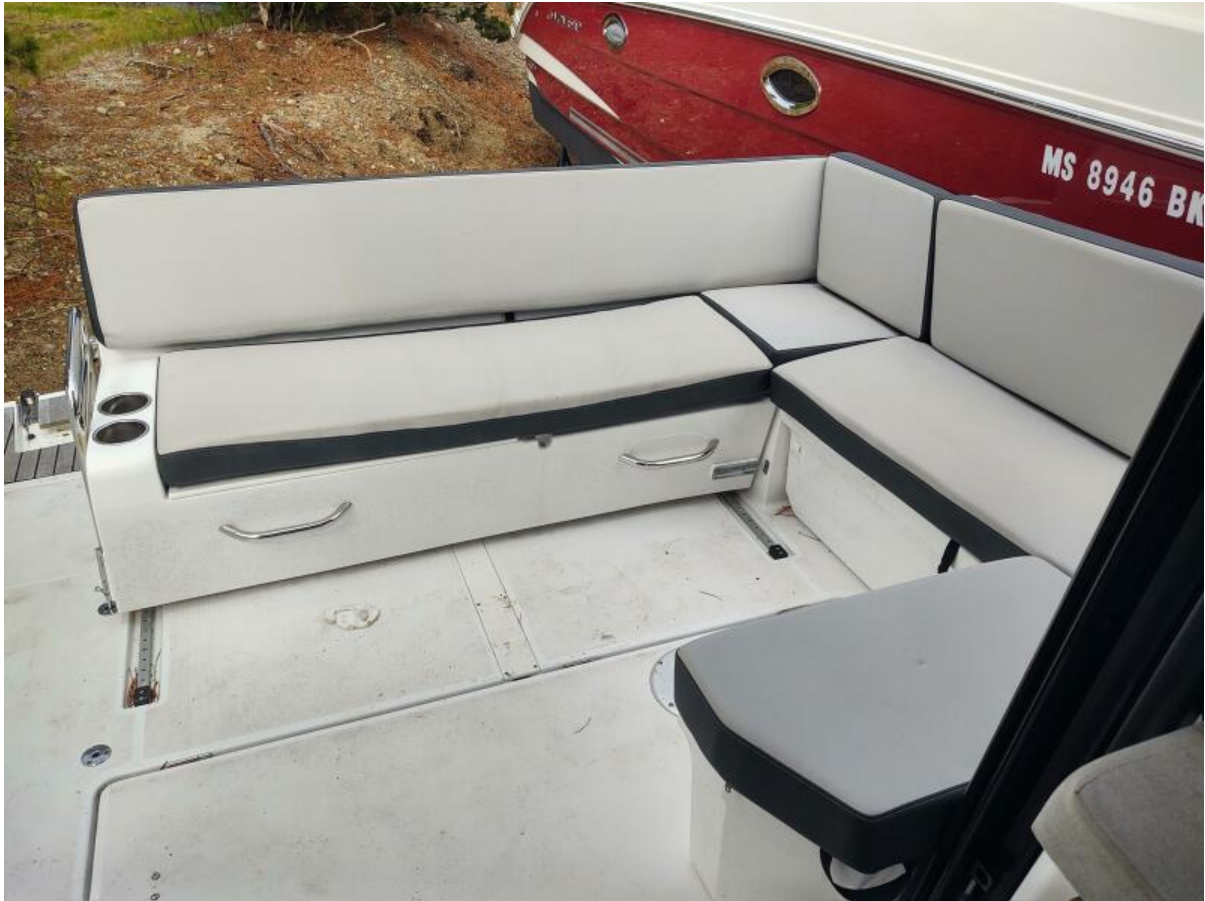
Knot Shore cockpit seating