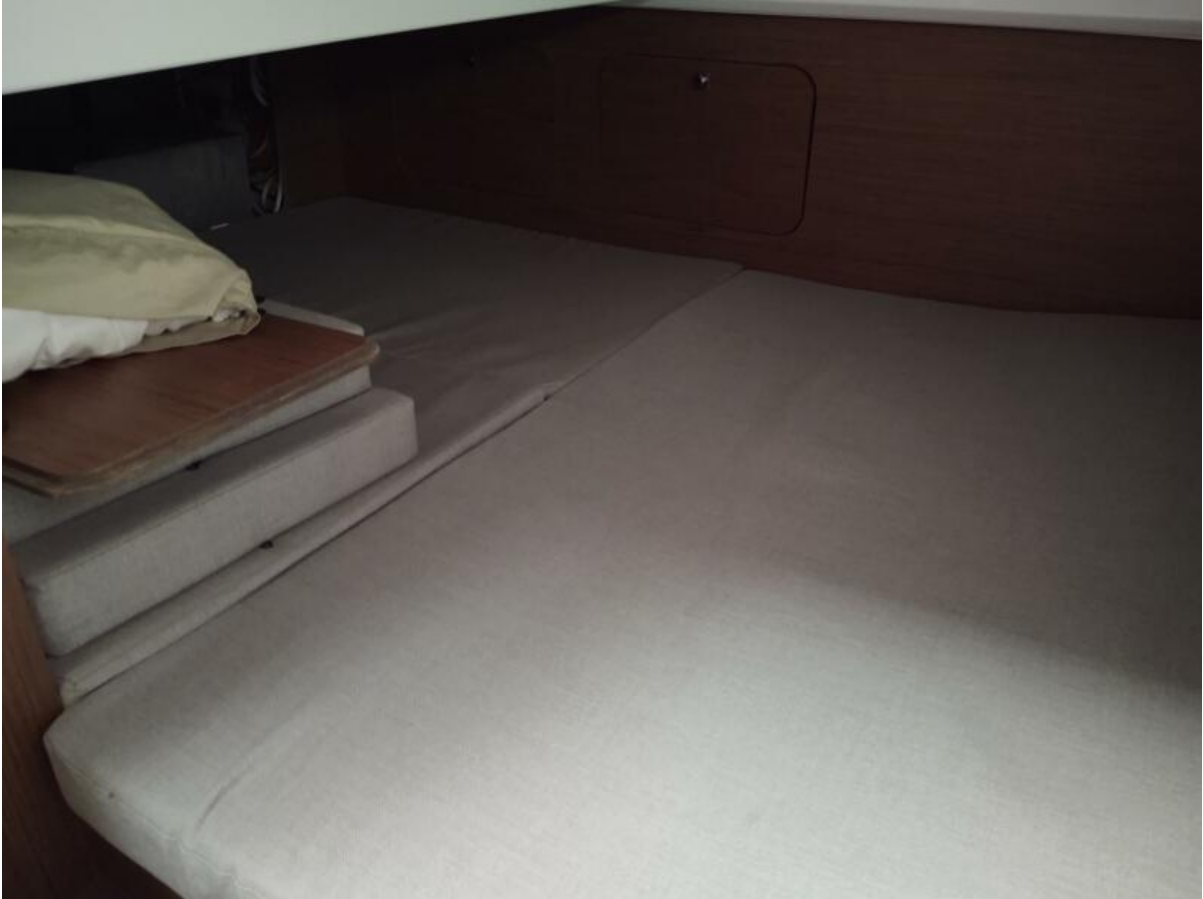
Knot Shore Aft berth