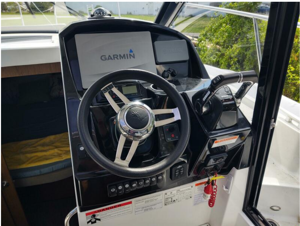
Knot Shore helm console