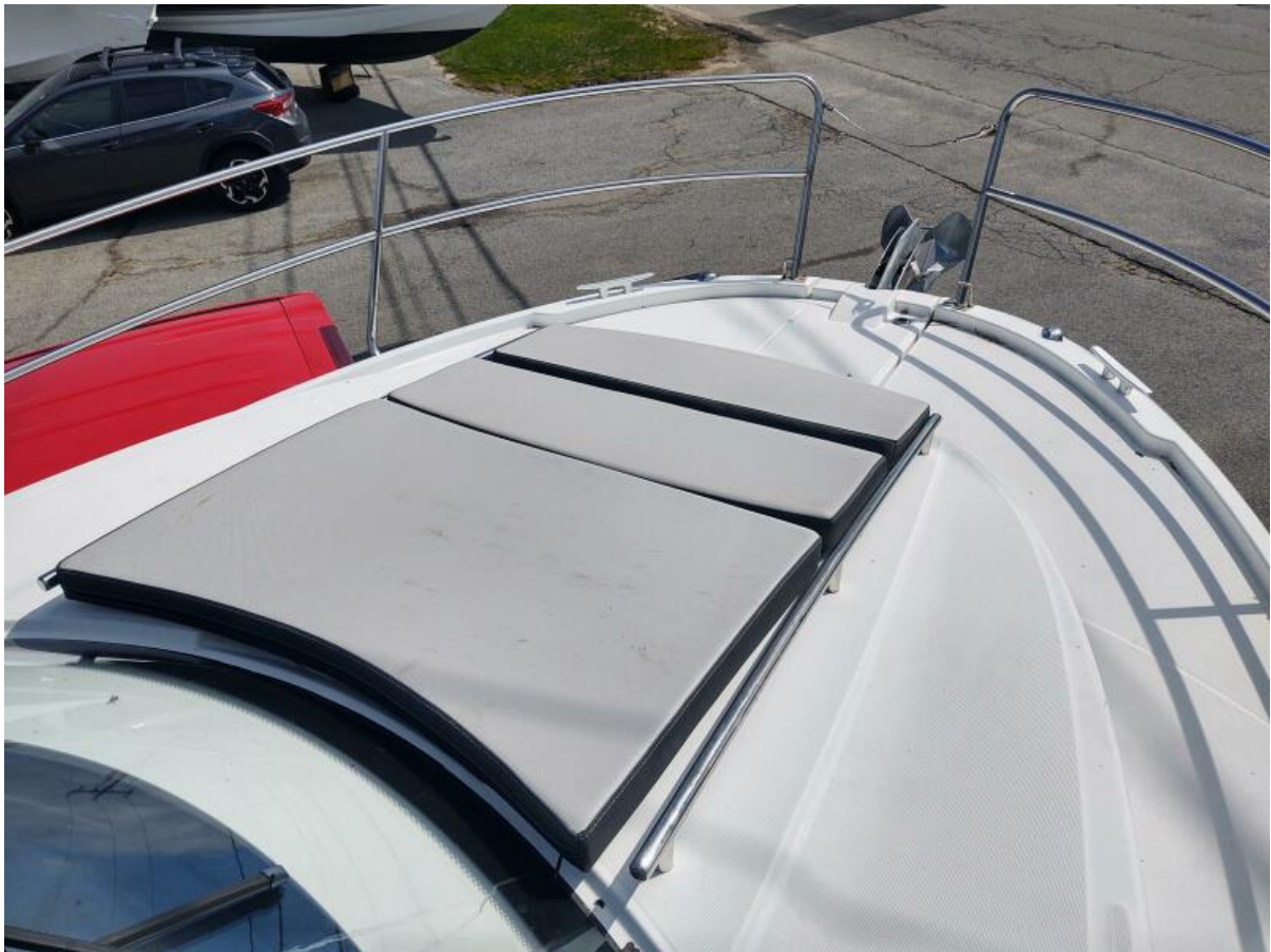
Knot Shore Fwd sunpad