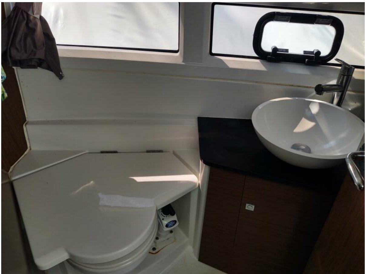
Knot Shore head