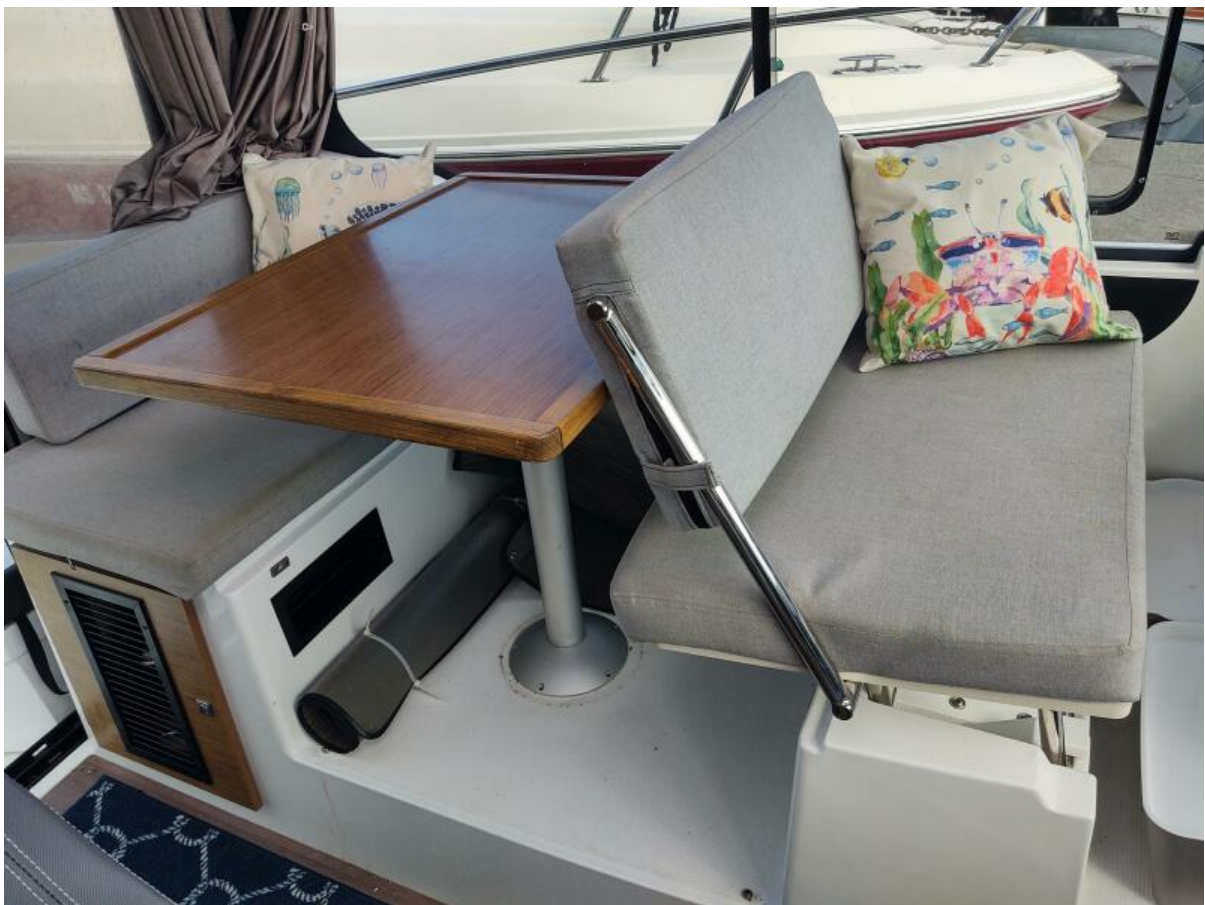
Knot Shore companion seat