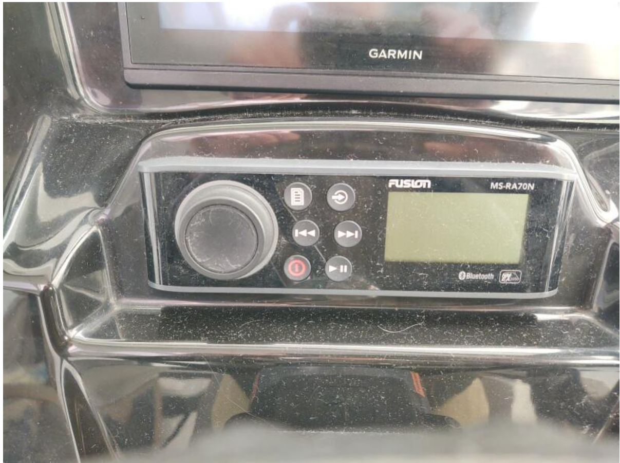
Knot Shoreo Fursion stereo