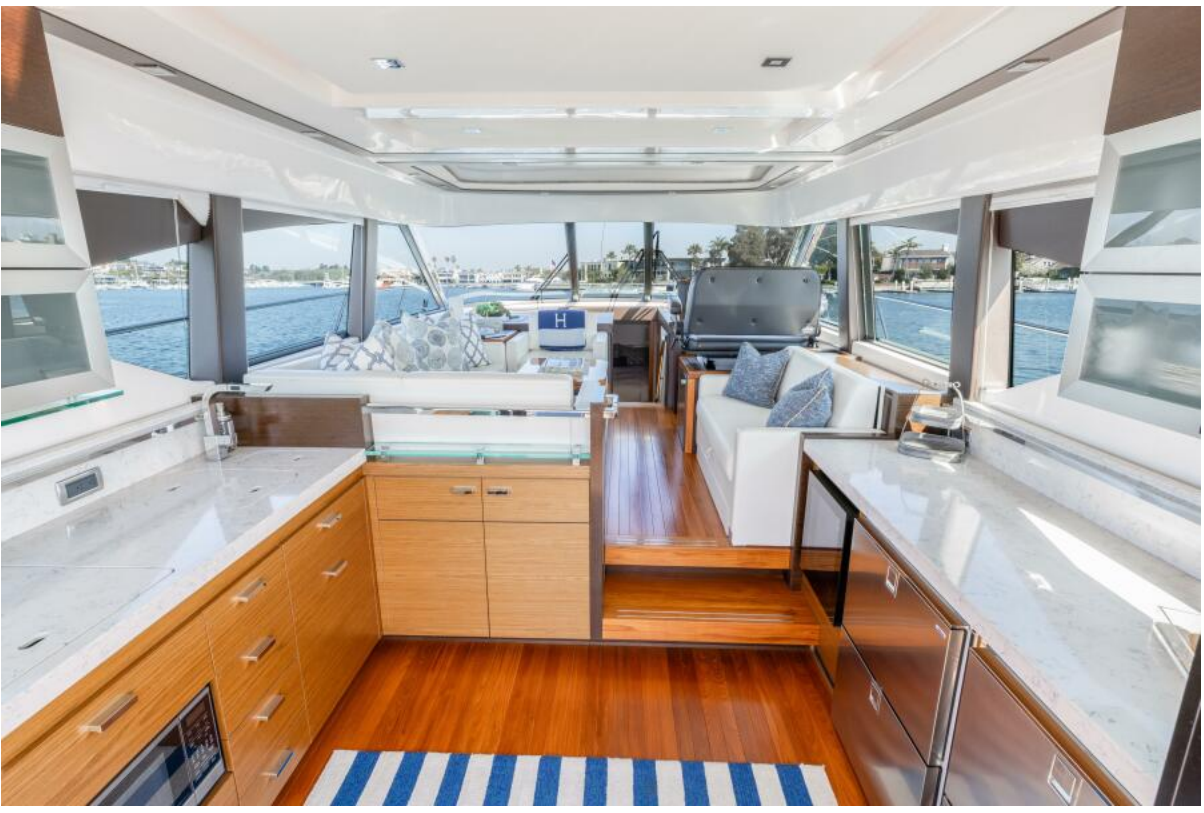
2017 Tiara 53 Coupe - SAY ANYTHING