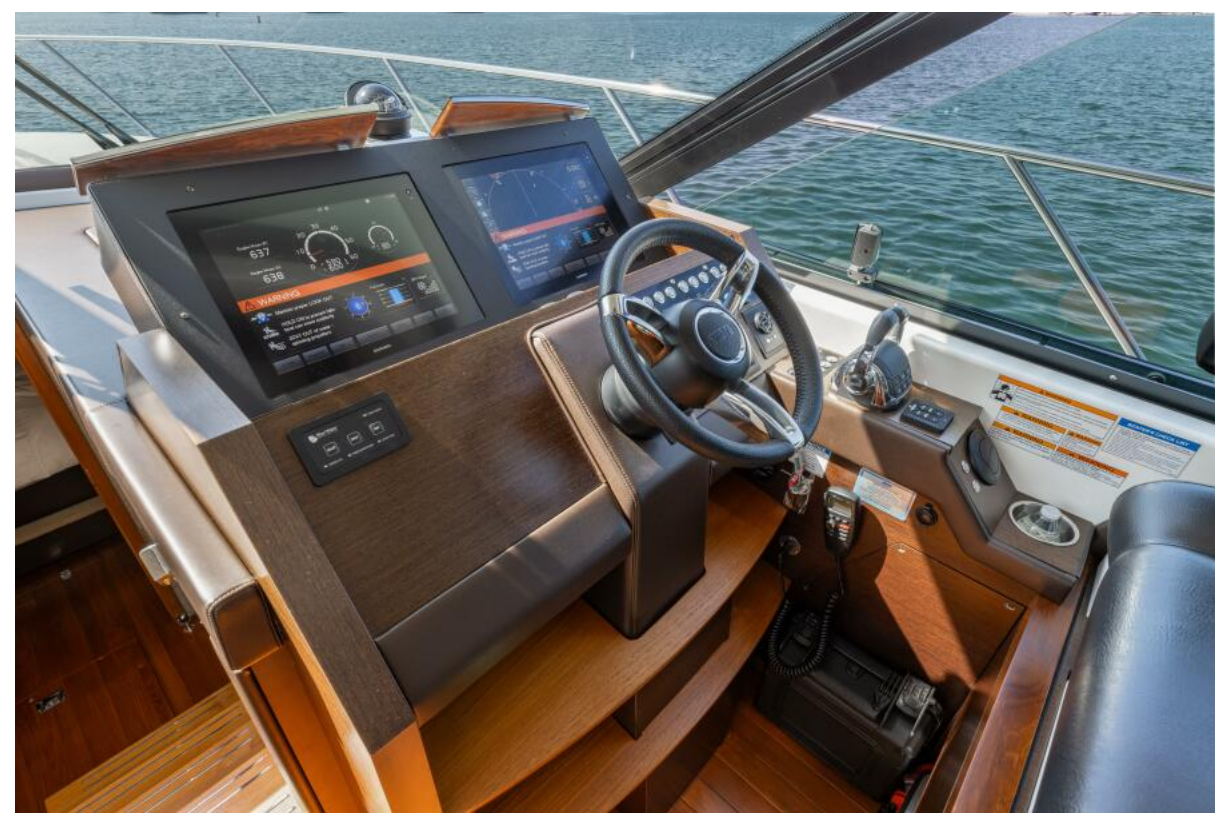
2017 Tiara 53 Coupe - SAY ANYTHING