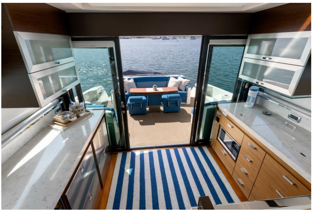
2017 Tiara 53 Coupe - SAY ANYTHING