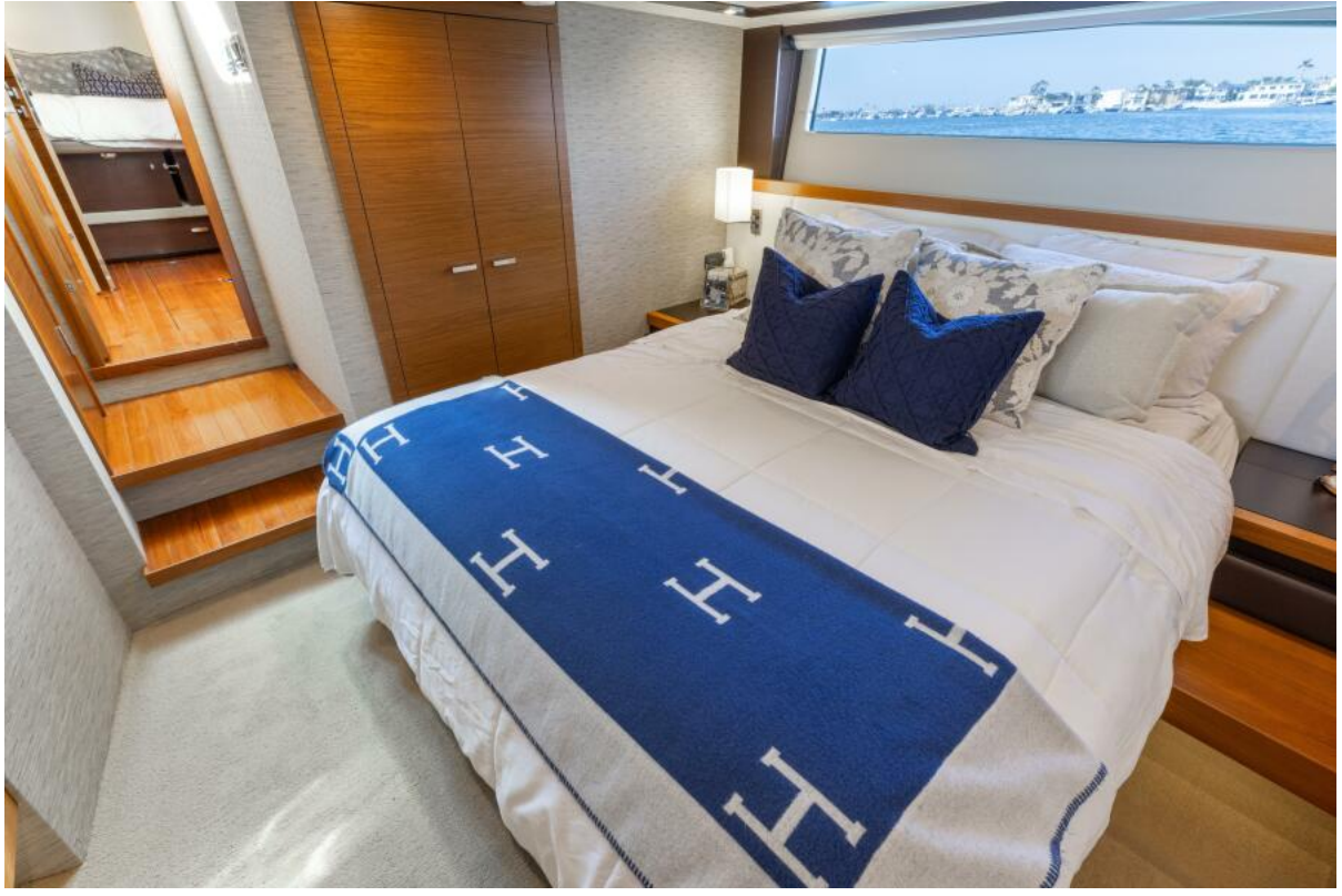
2017 Tiara 53 Coupe - SAY ANYTHING