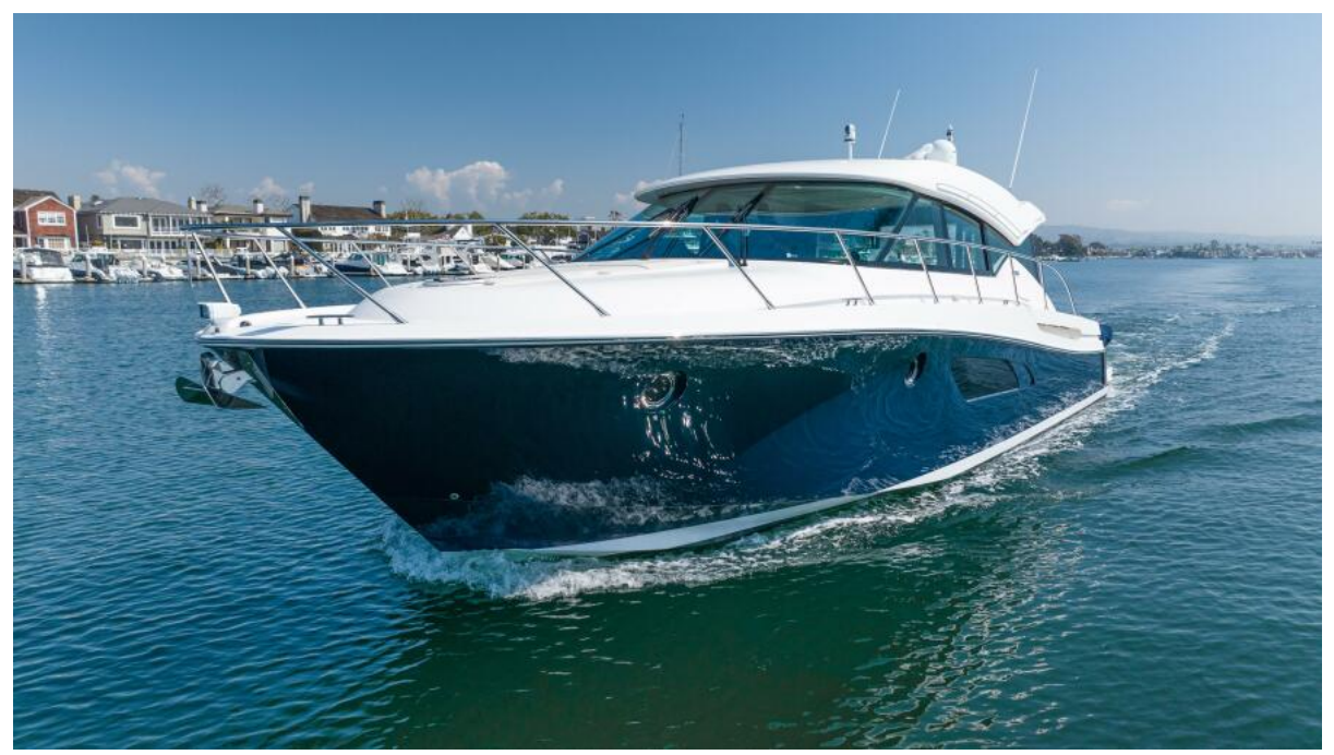
2017 Tiara 53 Coupe - SAY ANYTHING