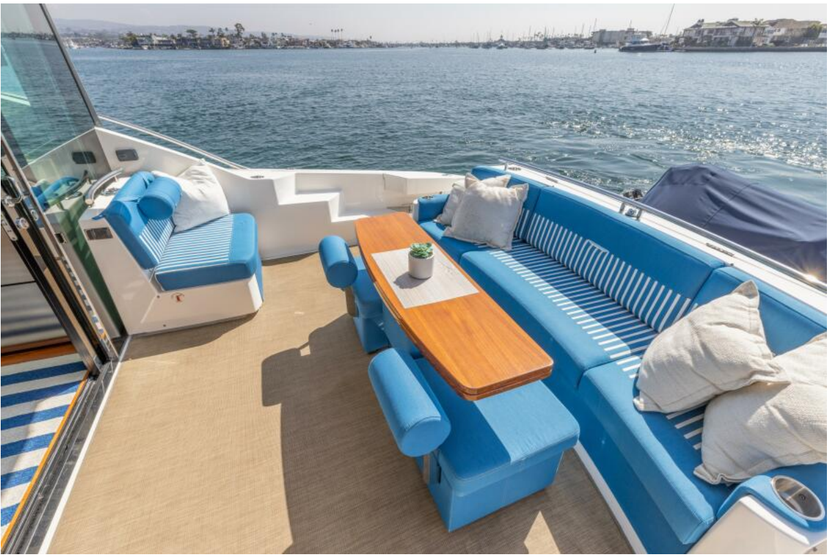
2017 Tiara 53 Coupe - SAY ANYTHING