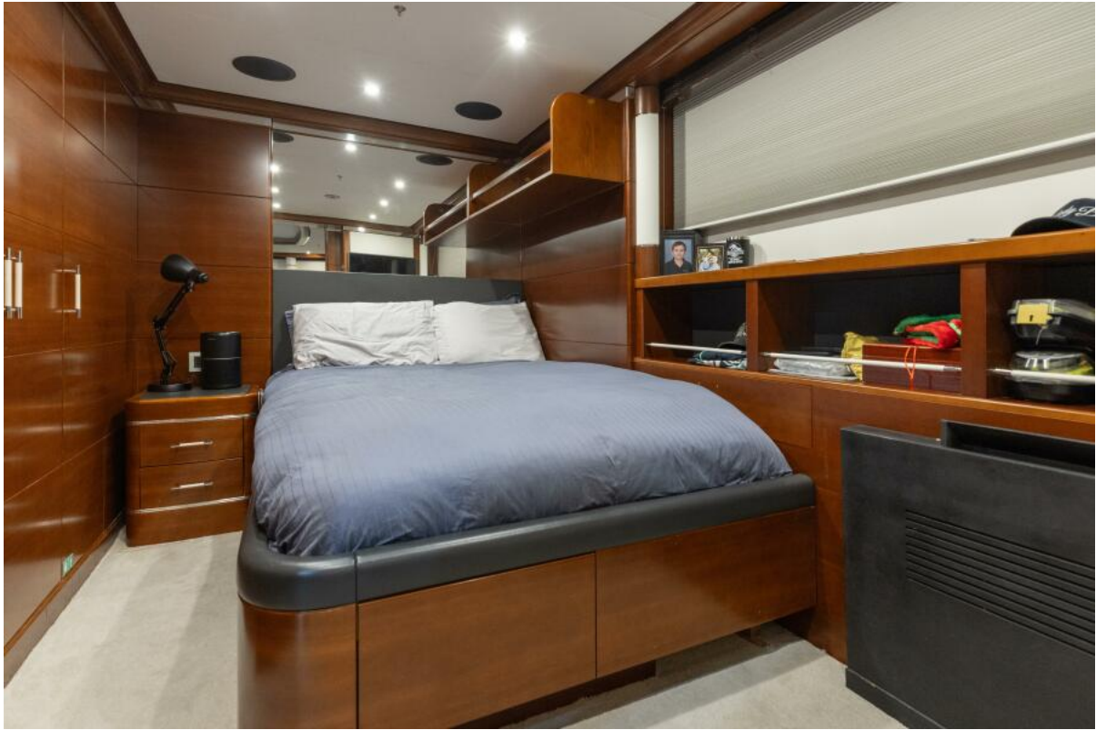
Captain's Crew Quarter