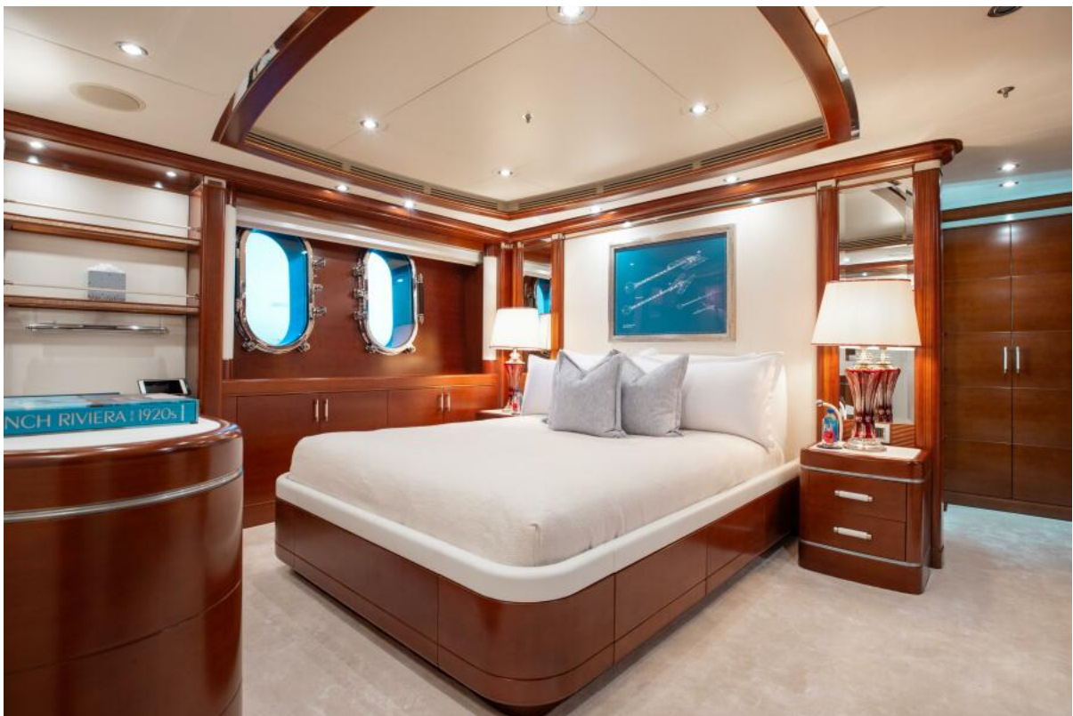
Guest Stateroom 1 Stbd