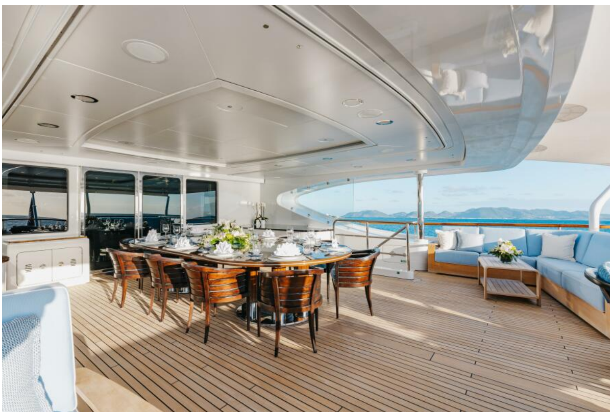
Bridge Aft Deck