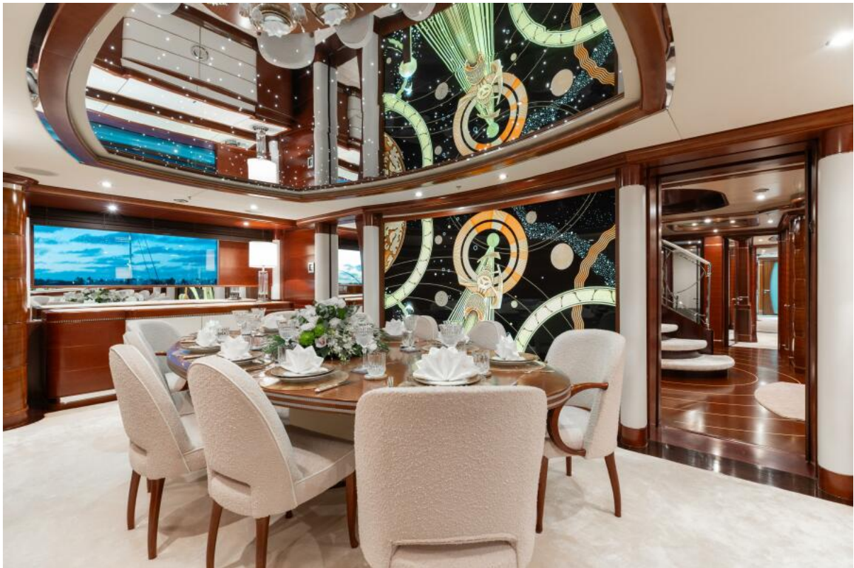
Main Salon Dining