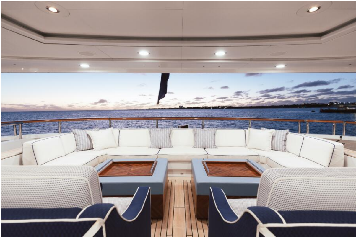
Main Aft Deck