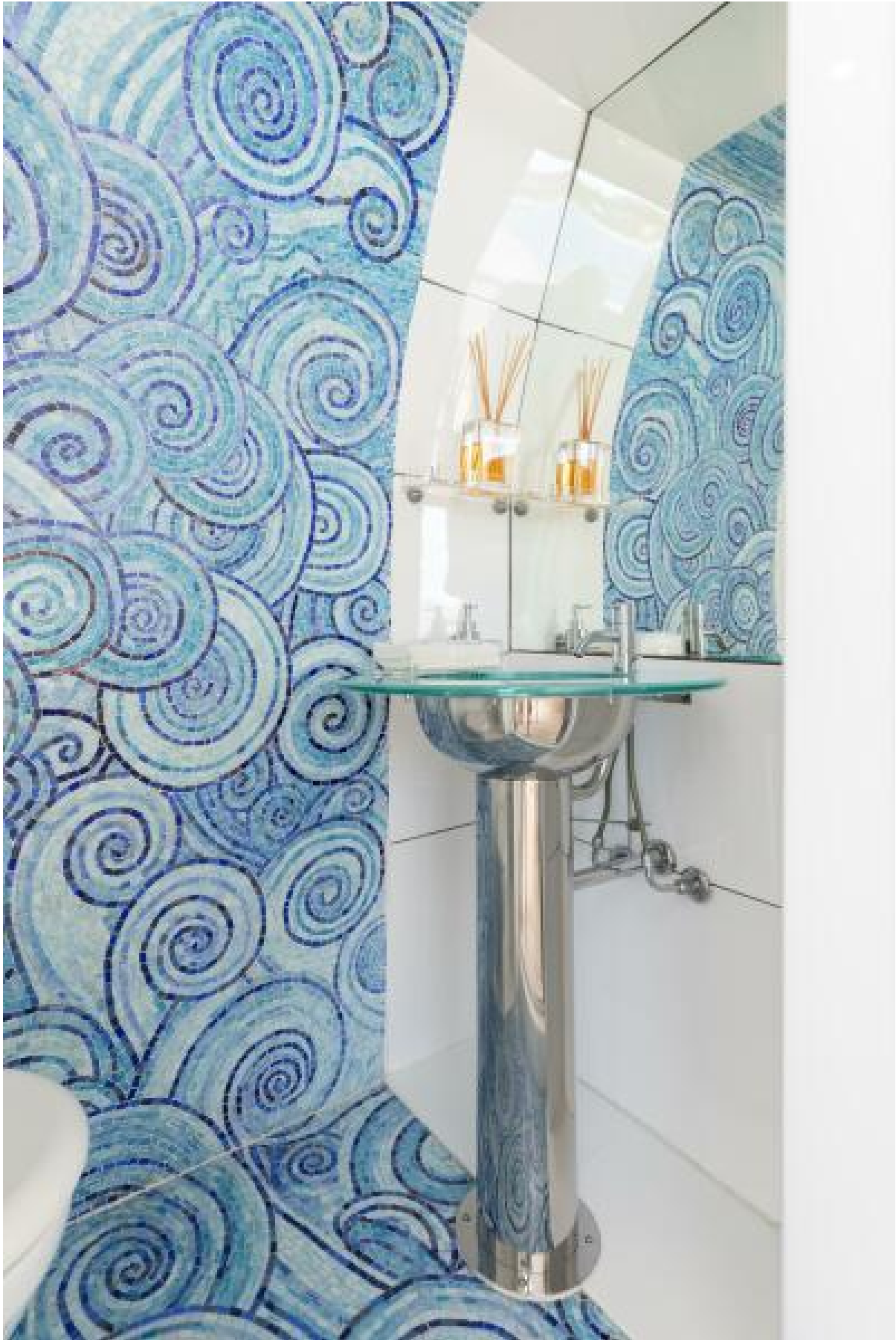
Day Heads Sun Deck