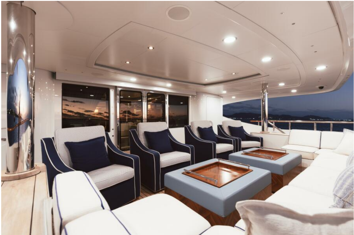
Main Aft Deck