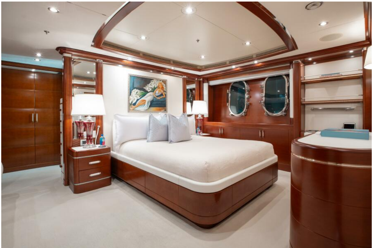
Guest Stateroom 2 Stbd