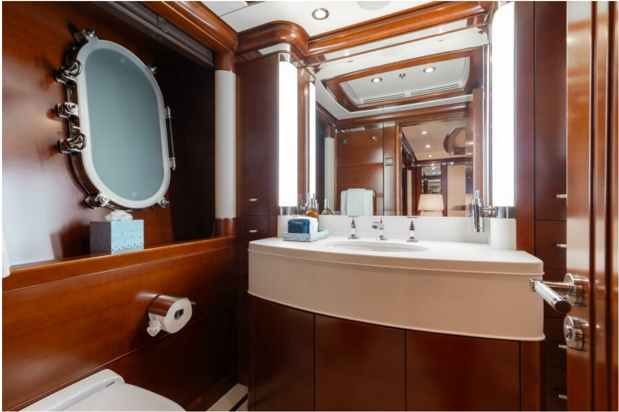
Guest Head 2 Stbd