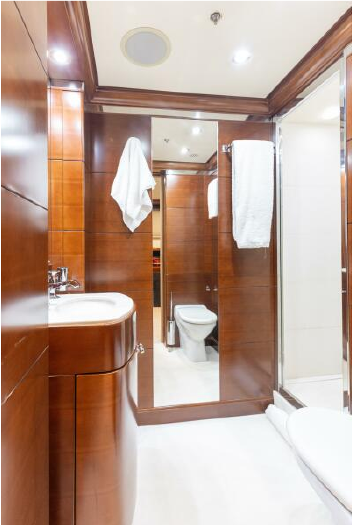
Captain's Crew Quarter