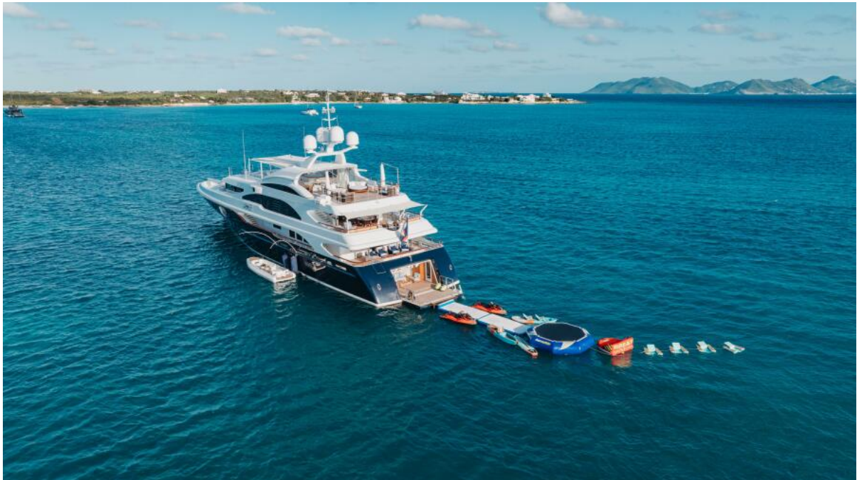
Stern With Toys Aerials