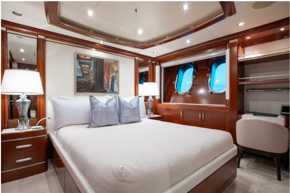
Guest Stateroom 3 Port