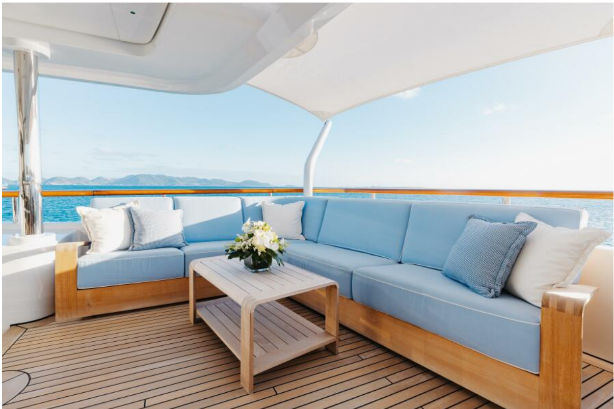
Bridge Aft Deck Seating Area