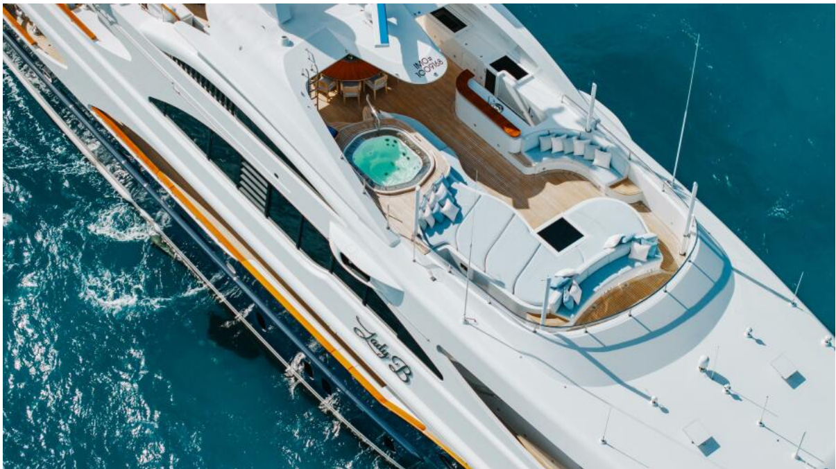
Aerials Sun Deck