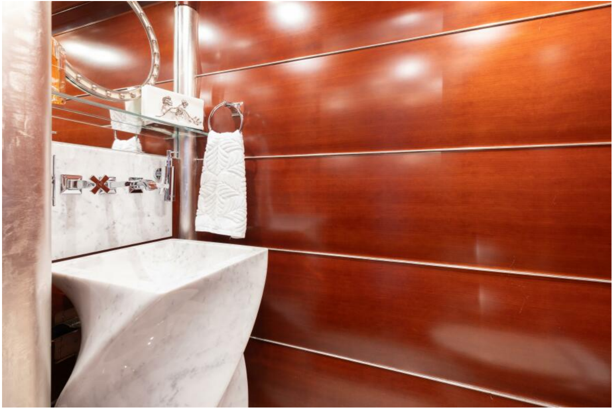
Day Heads Main Deck