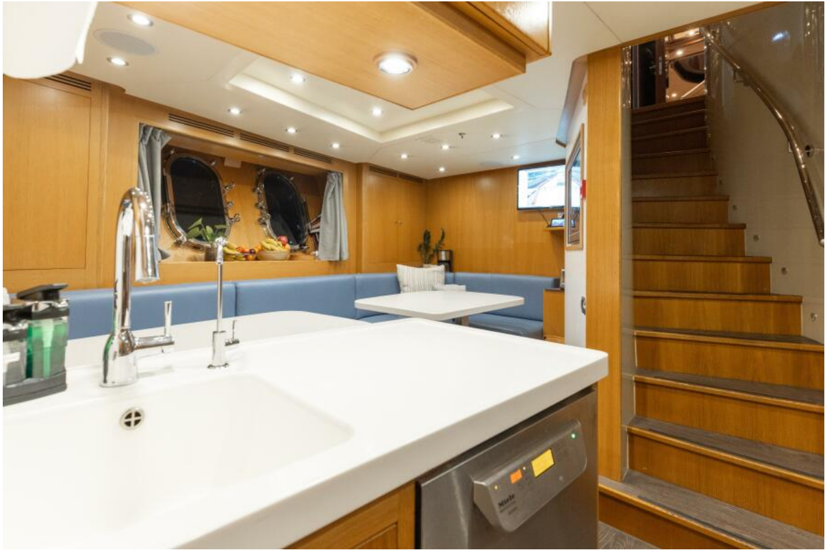
Crew Quarter Galley Dinette