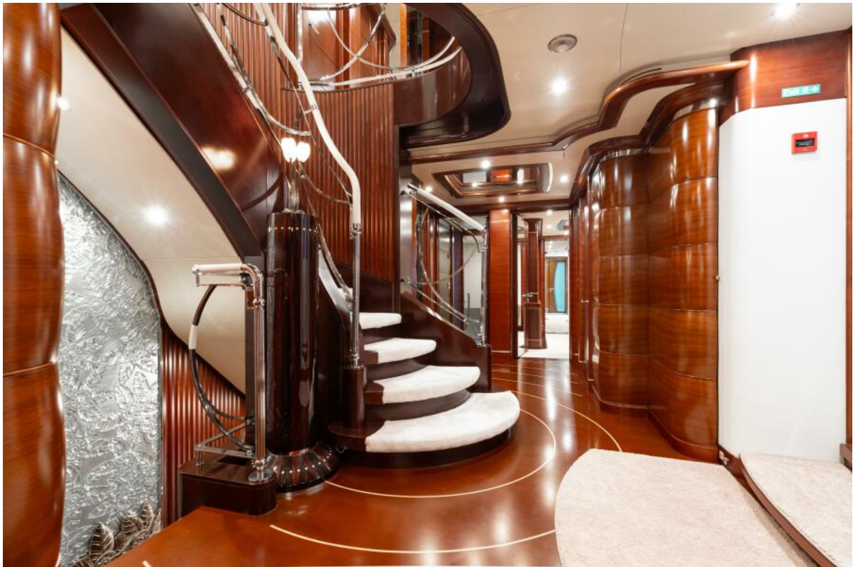
Main Salon Staircase