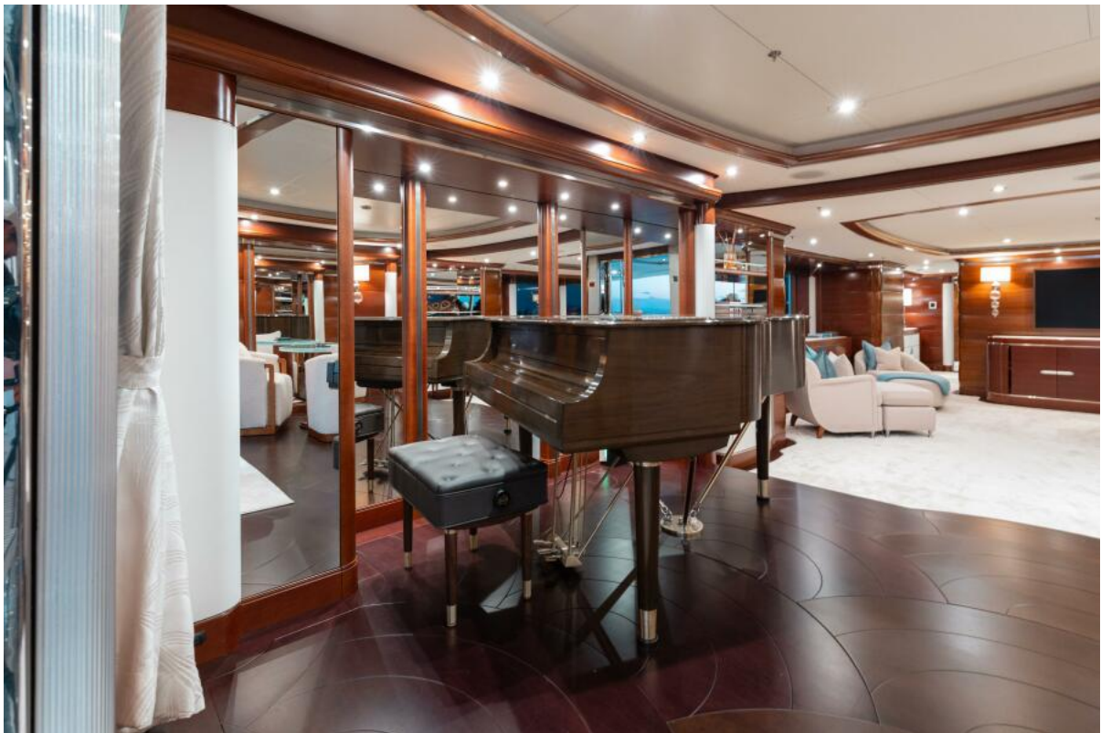
Main Salon Piano