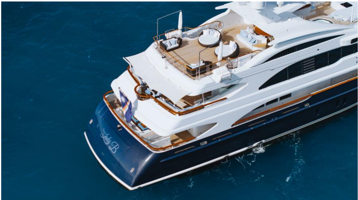
Aerials Sun Deck