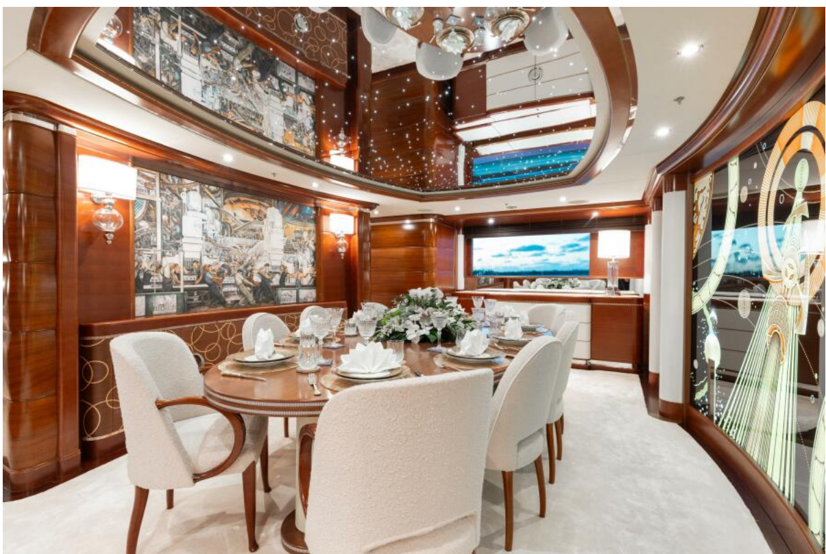
Main Salon Dining