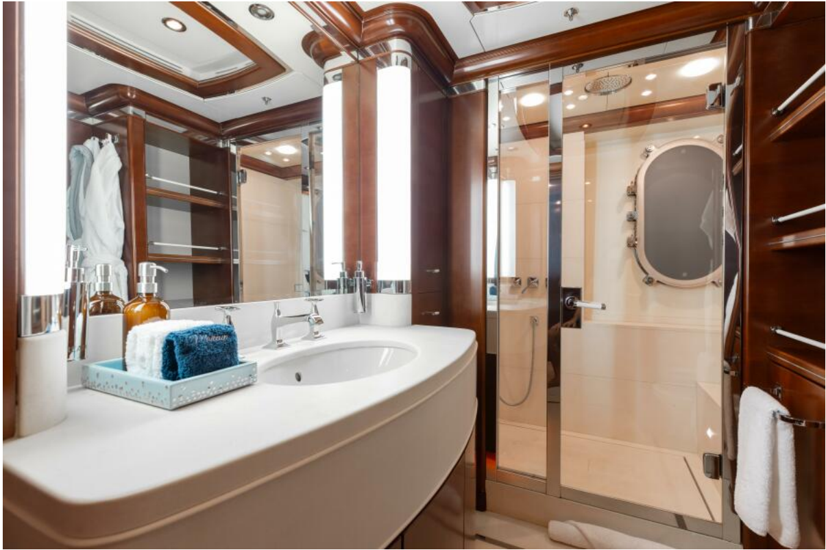
Guest Head 1 Stbd