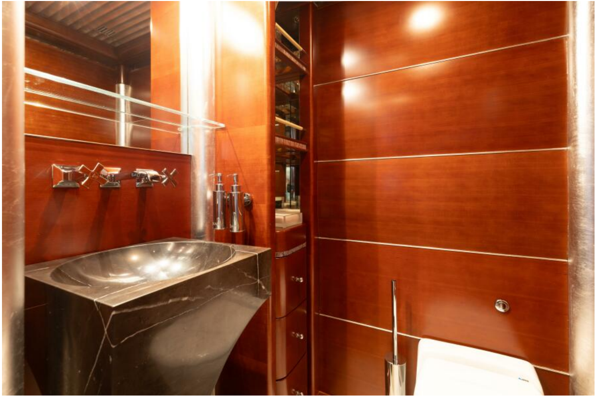
Day Heads Bridge Deck