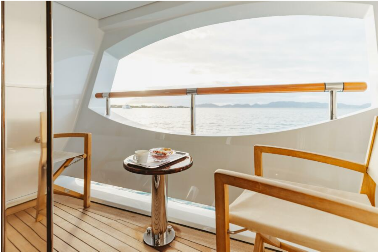
Master Stateroom Balcony