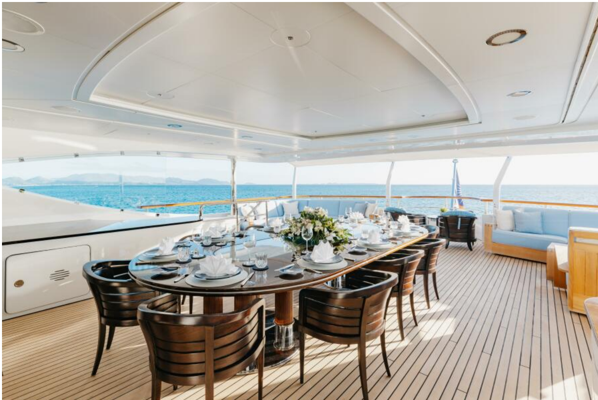
Bridge Aft Deck