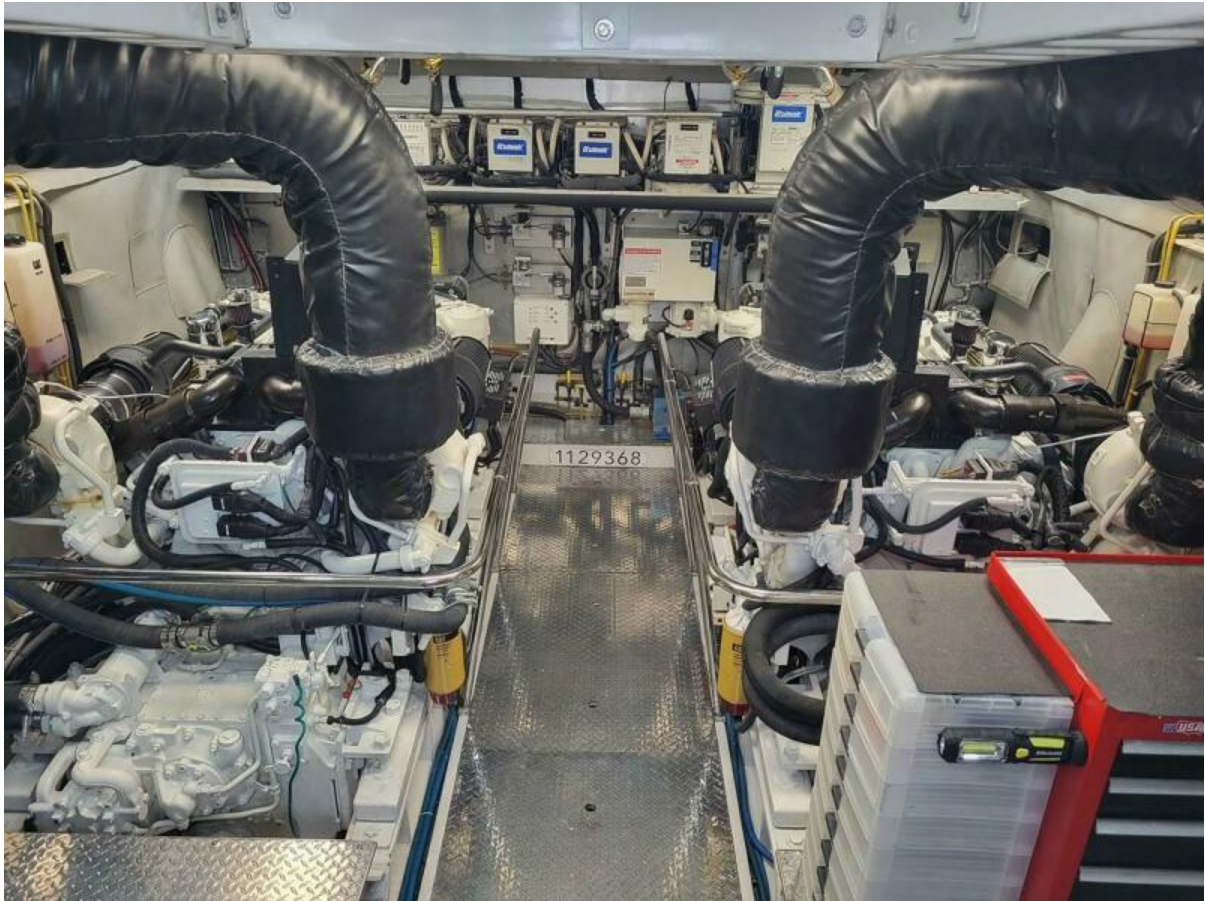
Engine room 2