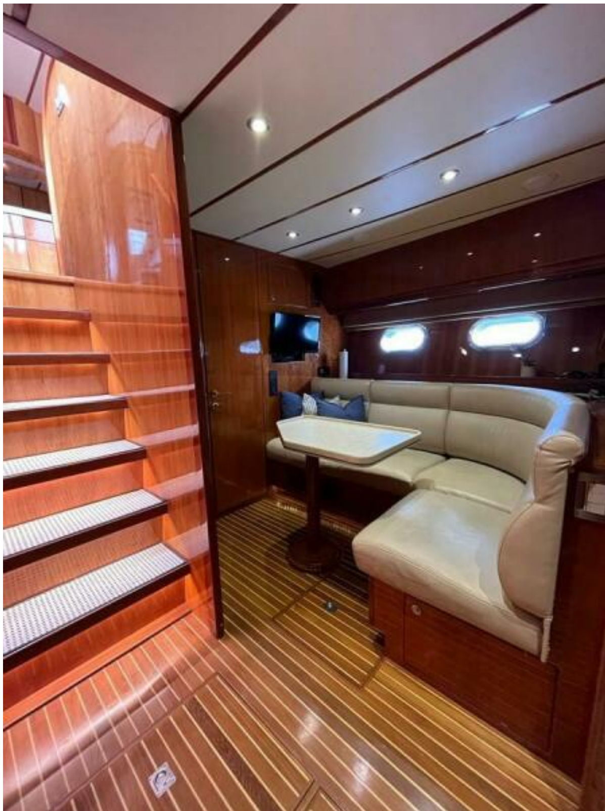
Crew Area Stairs 1