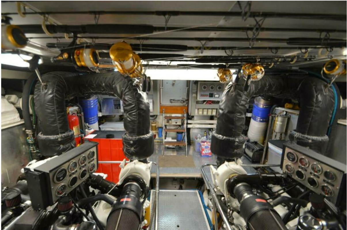
Engine room 4