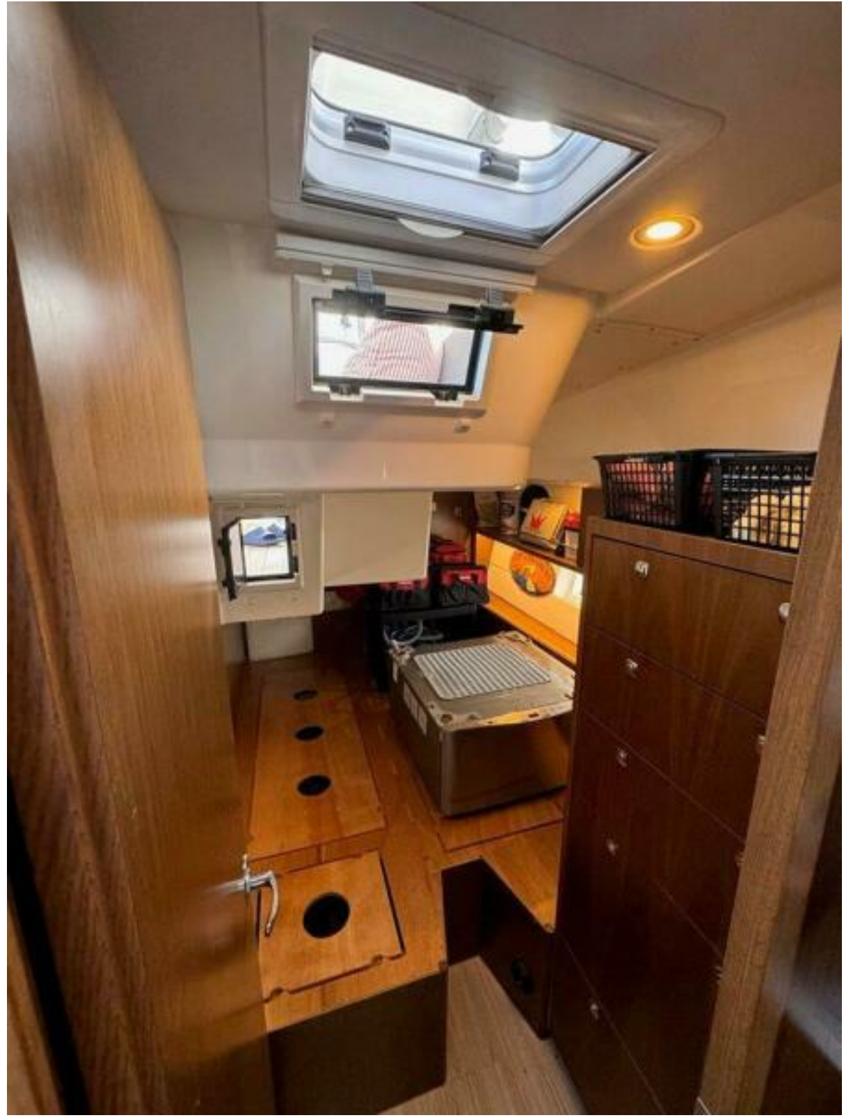
Aft port cabin