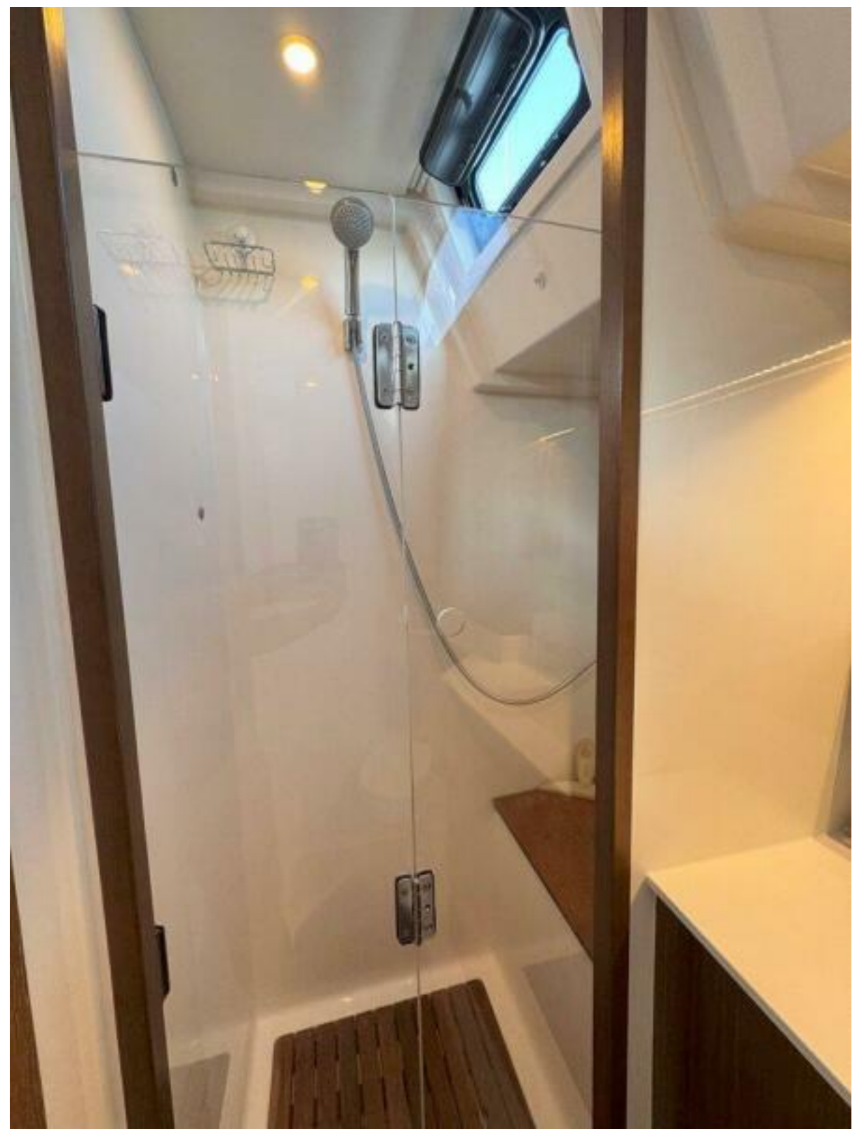
Aft head shower