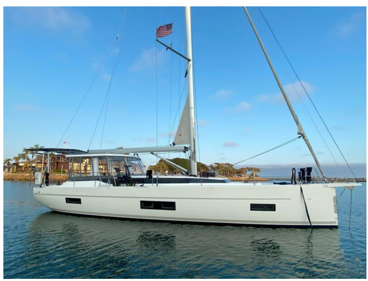
2019 Bavaria C45 Style with custom hard top