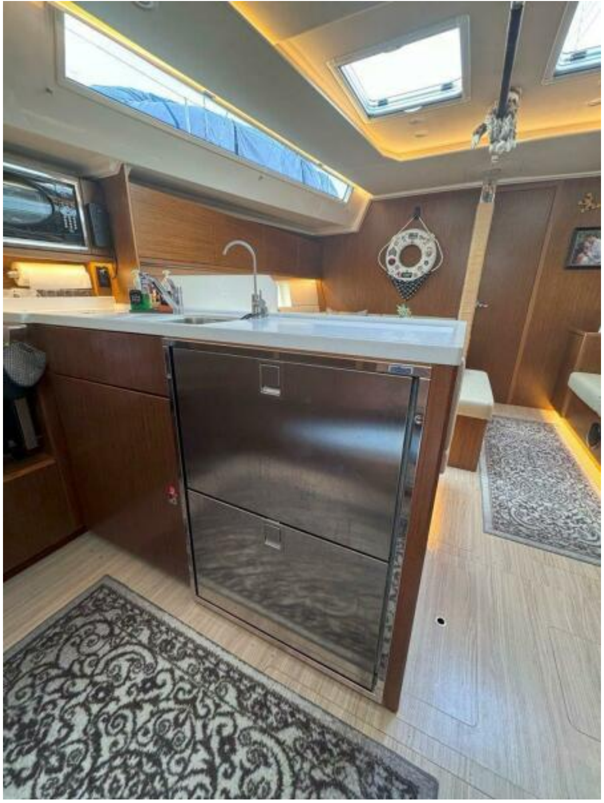
Refrigerator and freezer