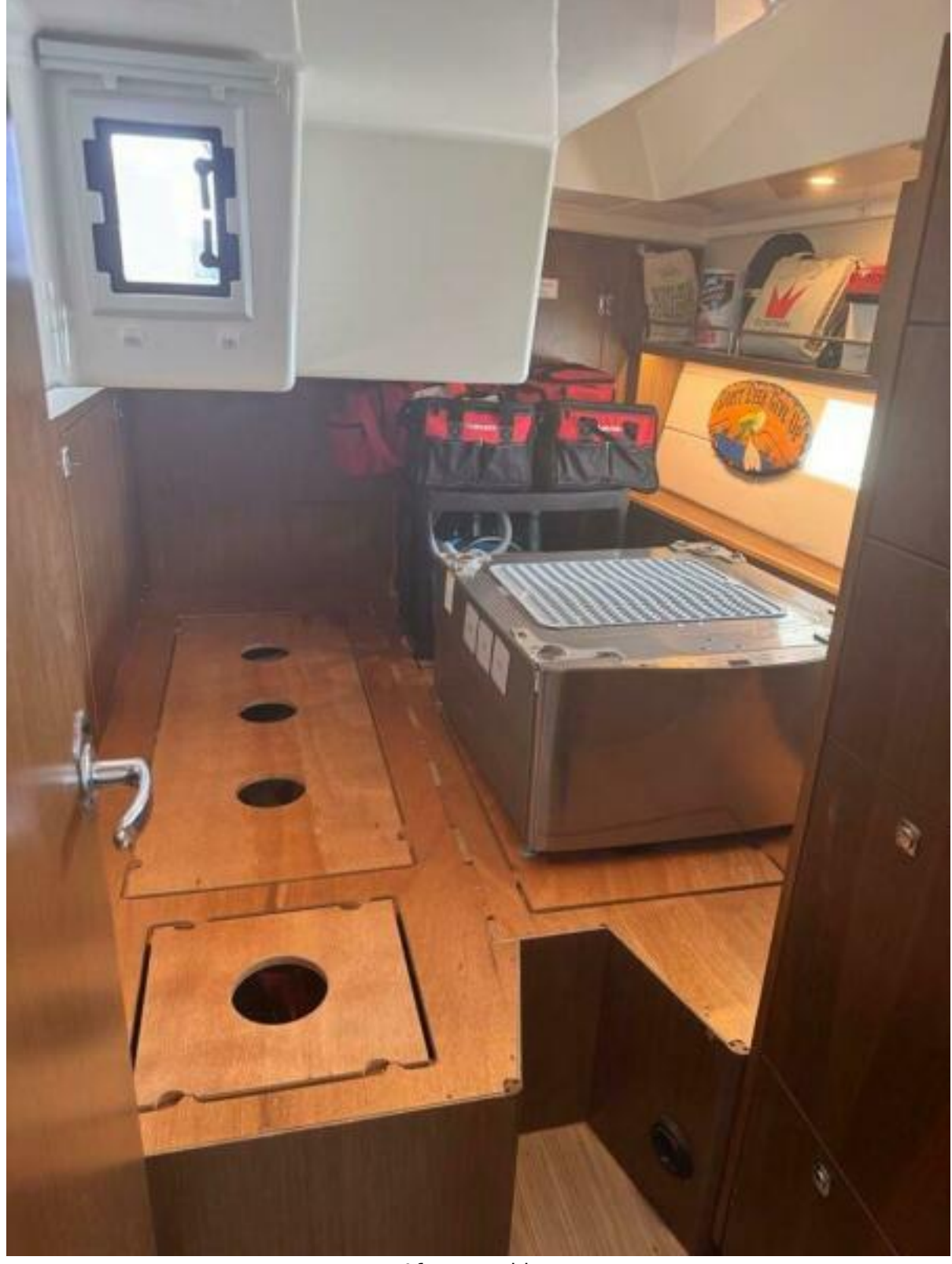
Aft port cabin