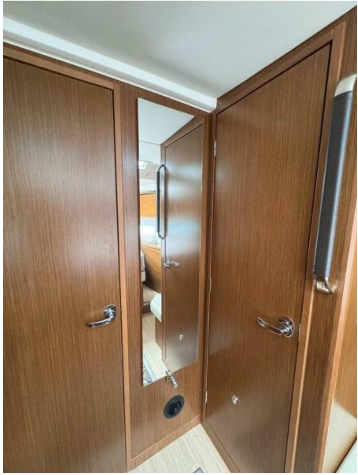
Forward Cabin, Mirror Behind Shower Door