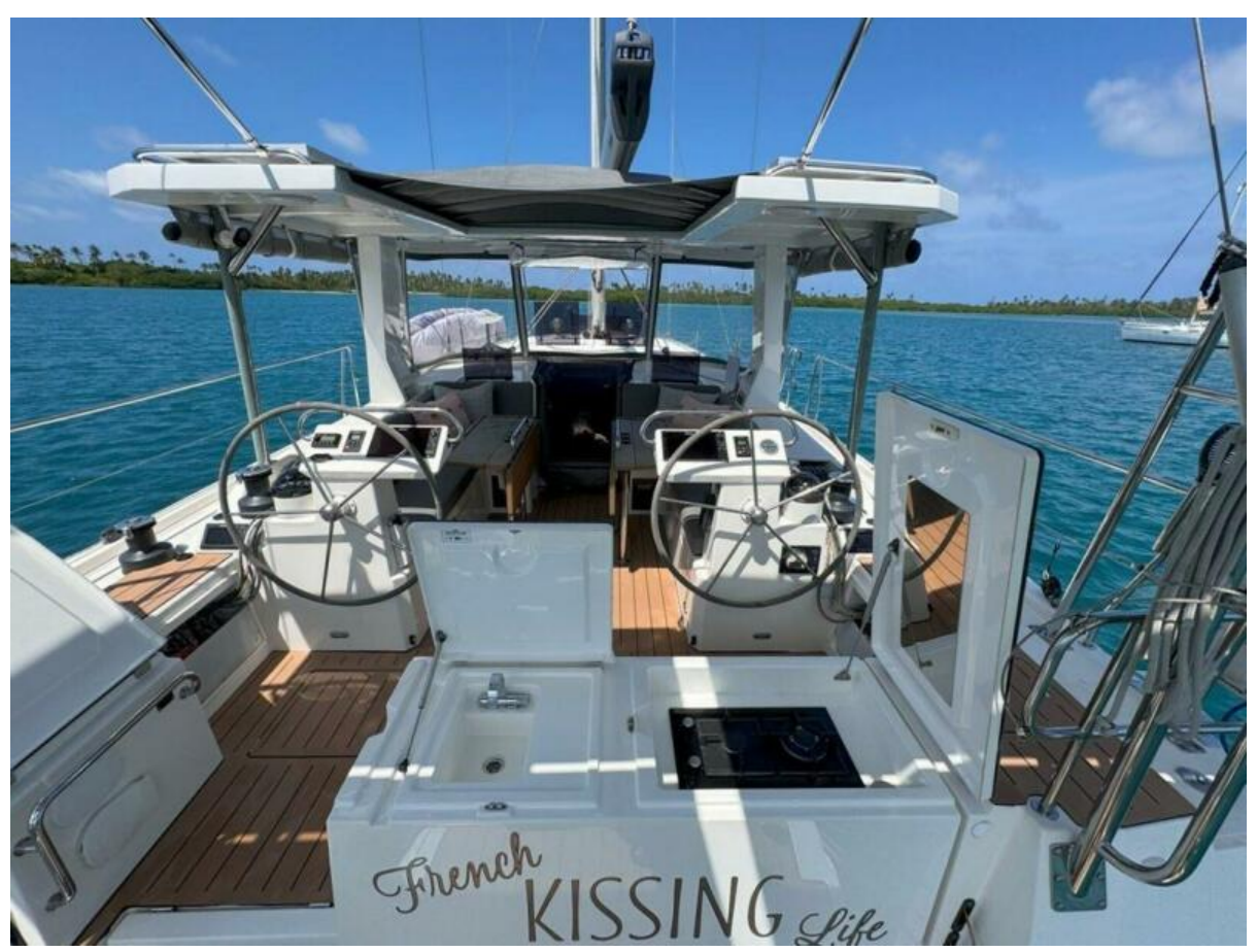
Sink and stove