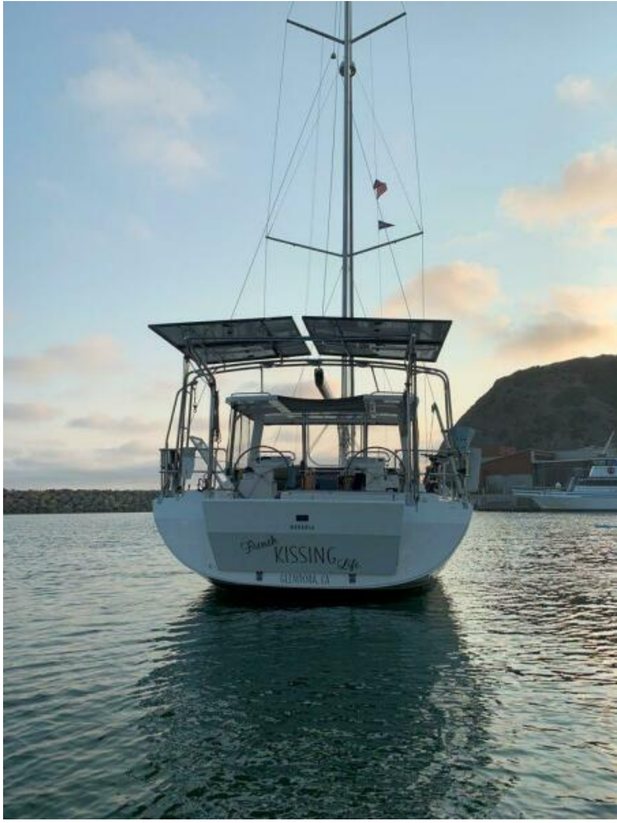
Stainless steel arch and davits