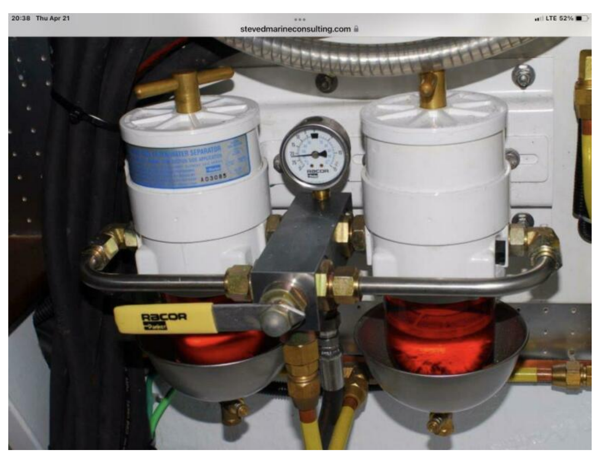
Dual Racor Fuel Filters