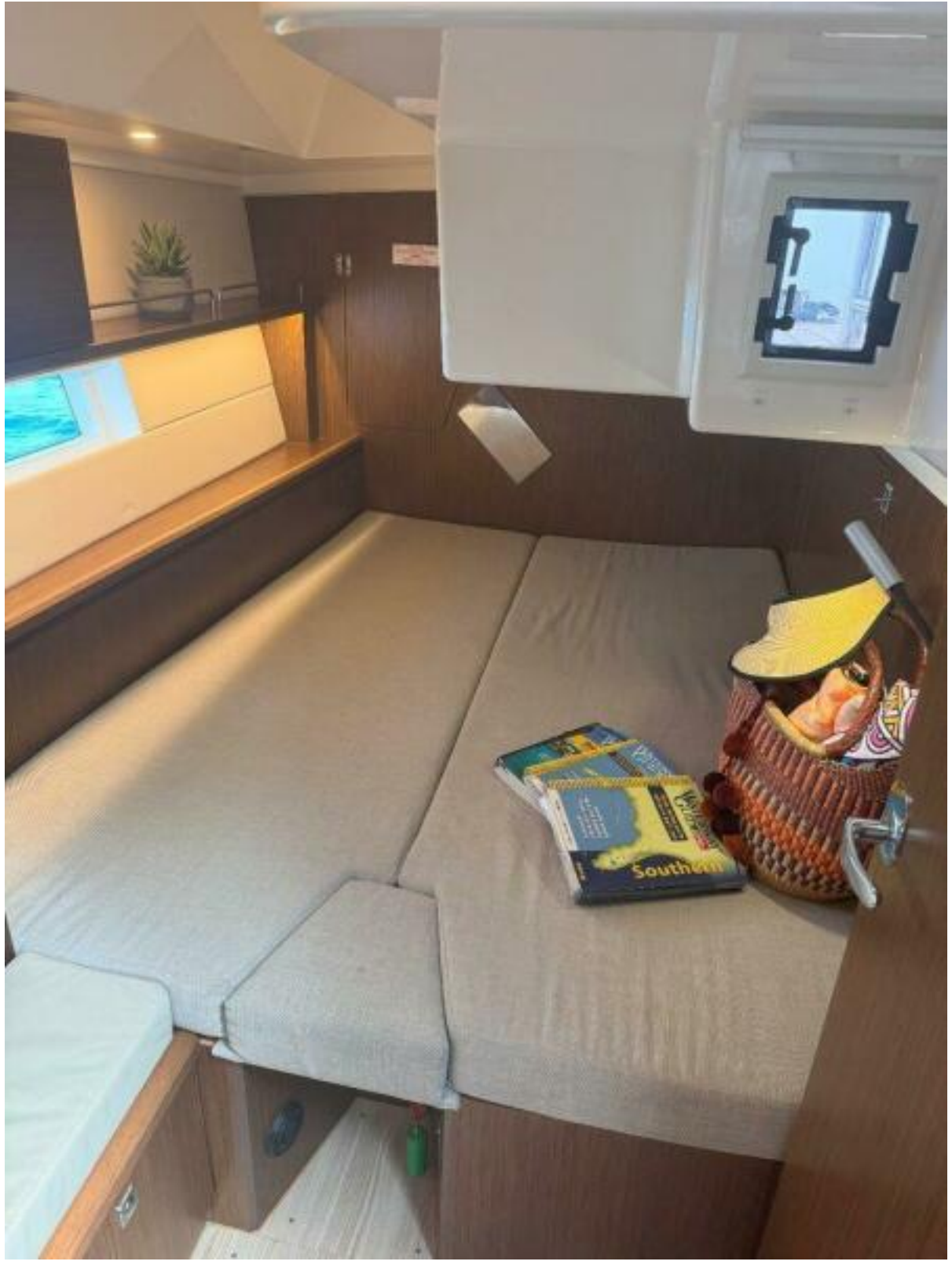
Aft starboard cabin