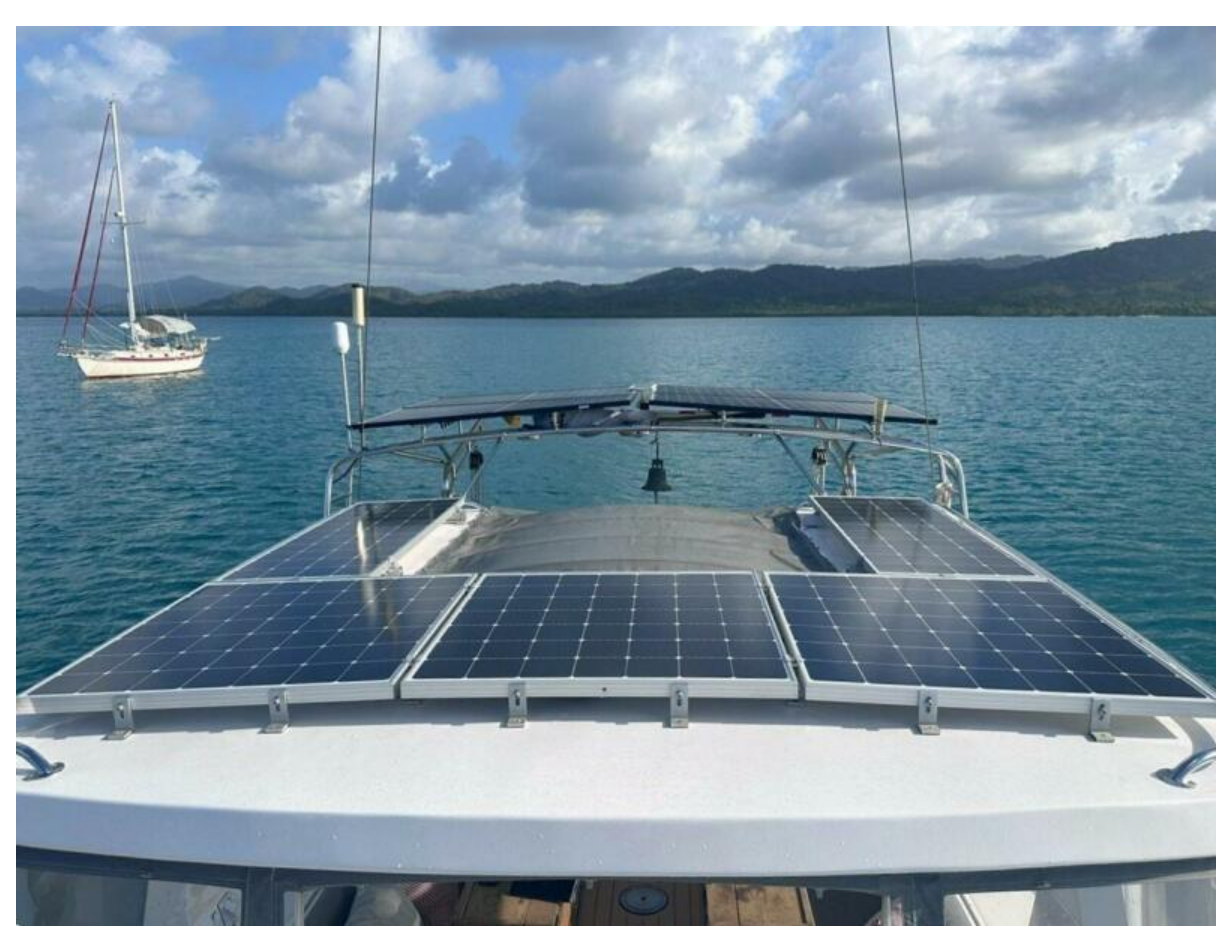
Nine solar panels