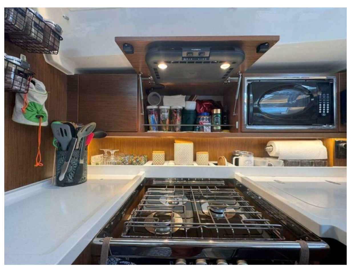
Stove and fan