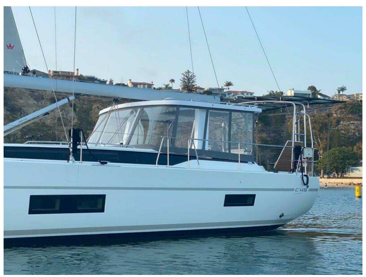
Custom hard top