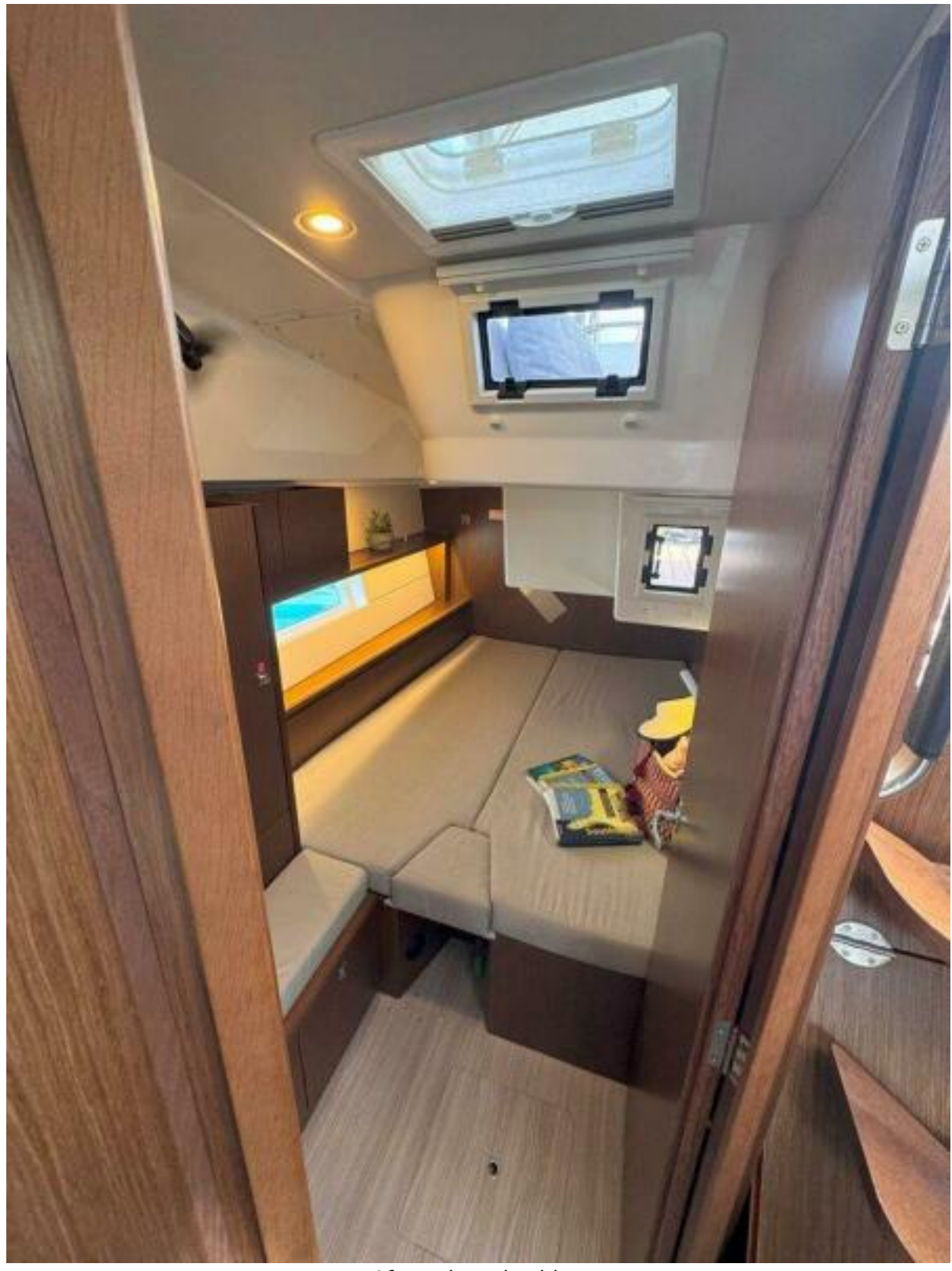
Aft starboard cabin