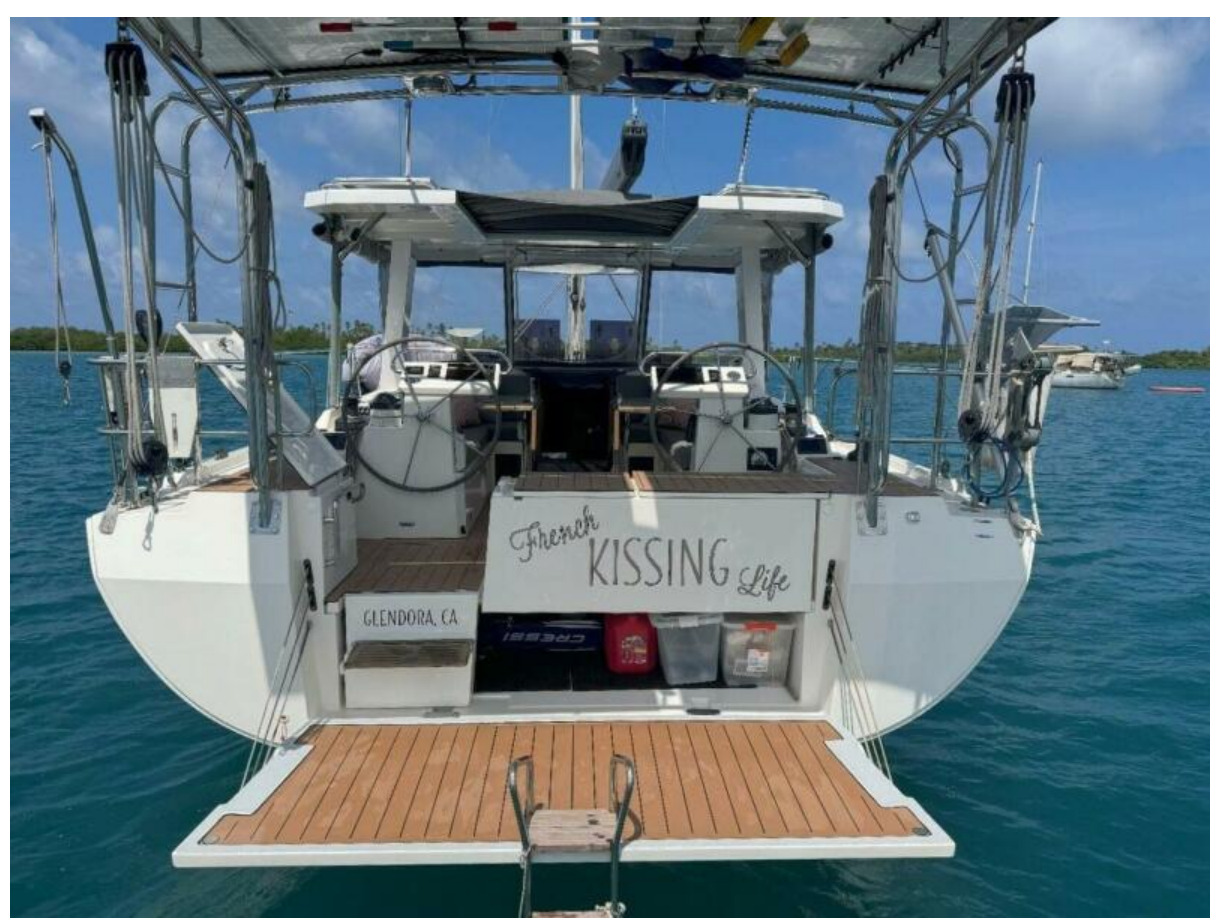
Electric swim platform