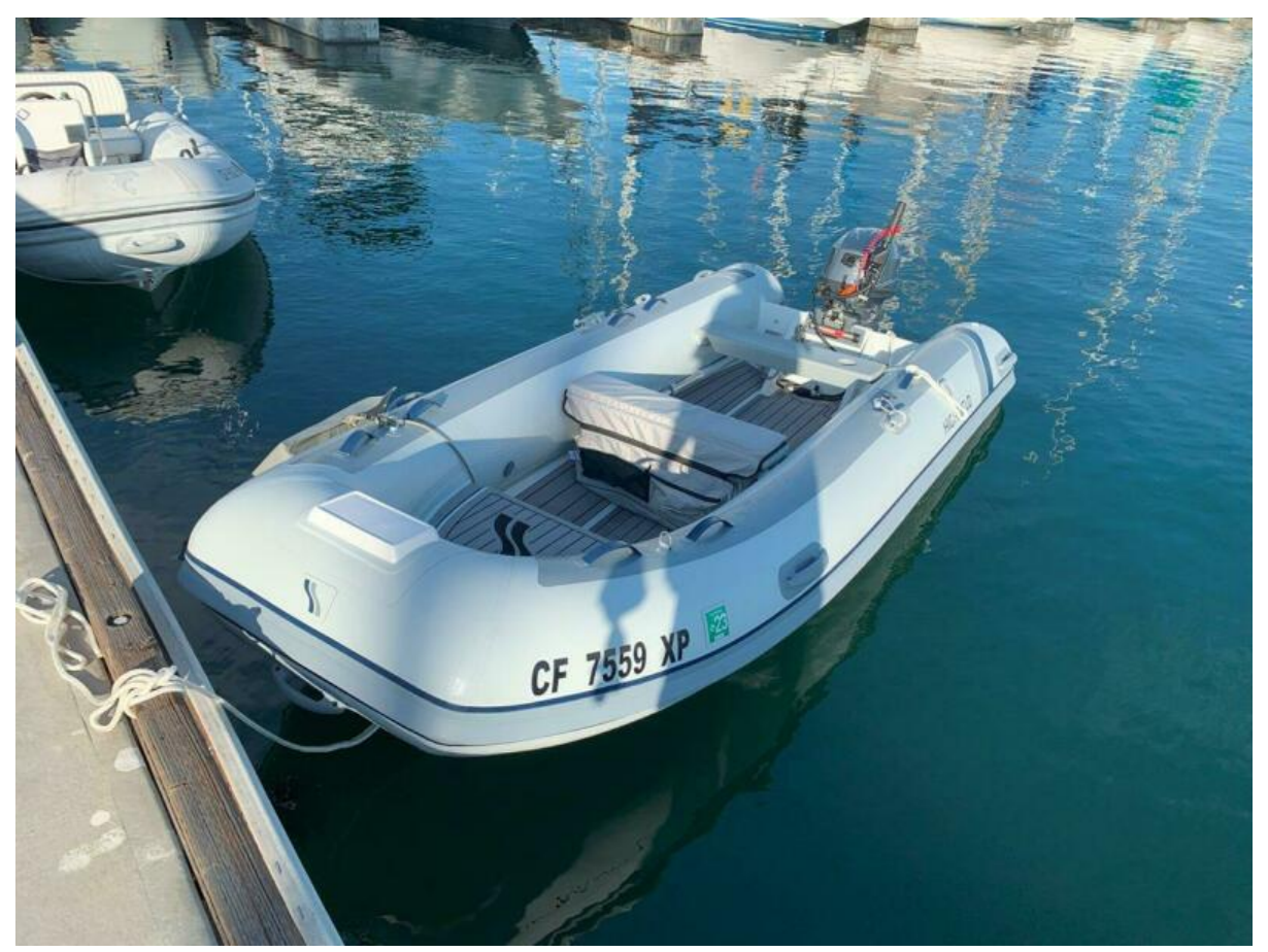
Dinghy without chaps