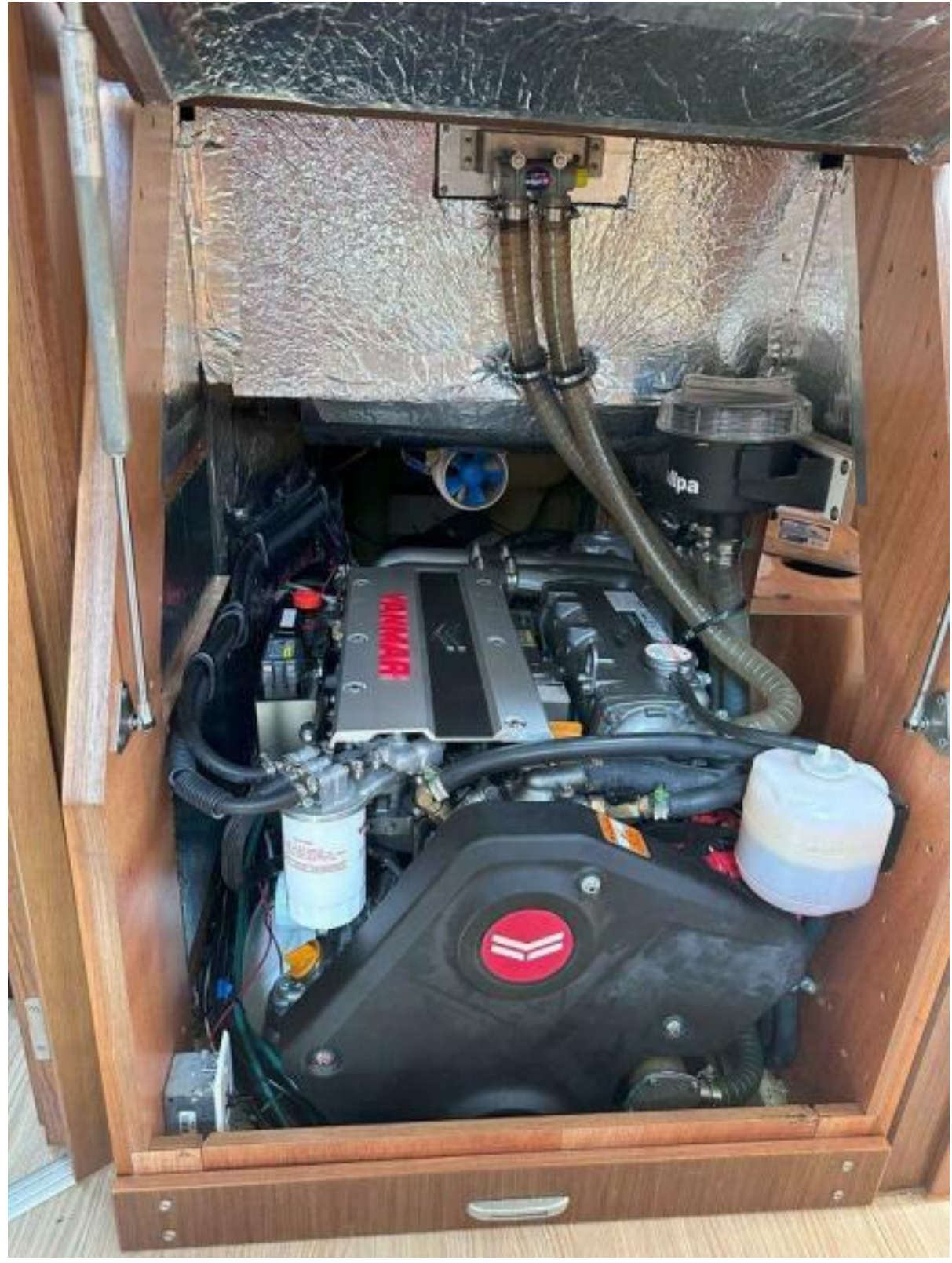
Engine, 80 HP Yanmar