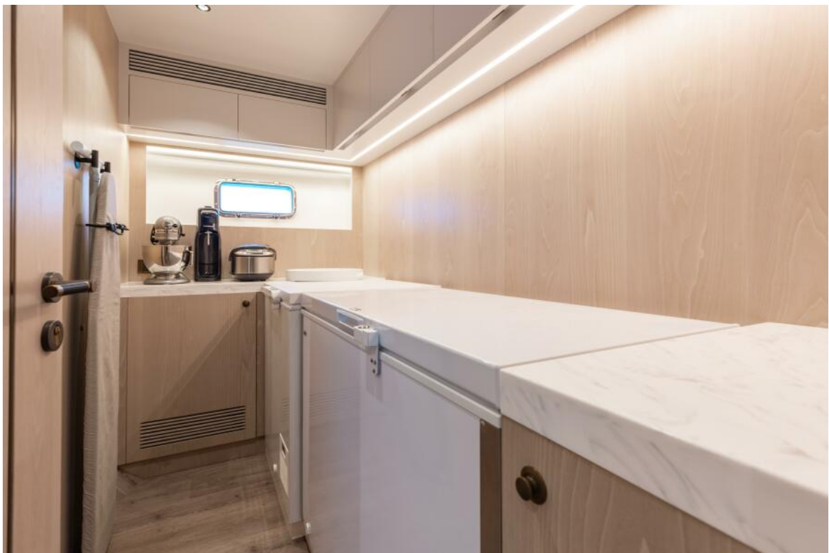
2021 Horizon FD110 (UNTETHERED) Utility Room