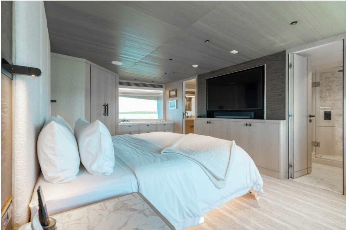
2021 Horizon FD110 (UNTETHERED) Owner's Suite_2