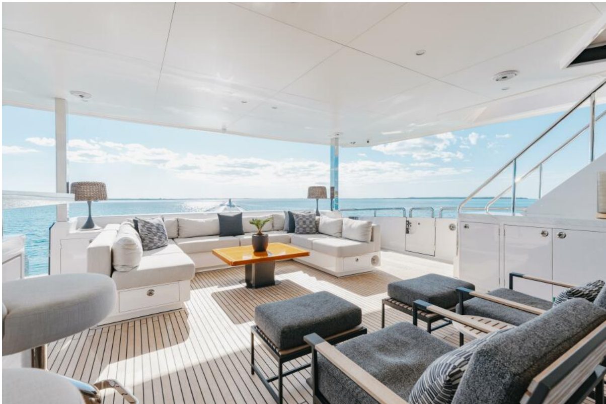
2021 Horizon FD110 (UNTETHERED) Main Deck Aft