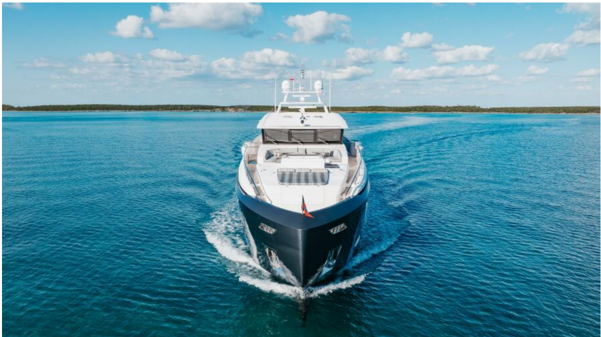
2021 Horizon FD110 (UNTETHERED) Profile_2