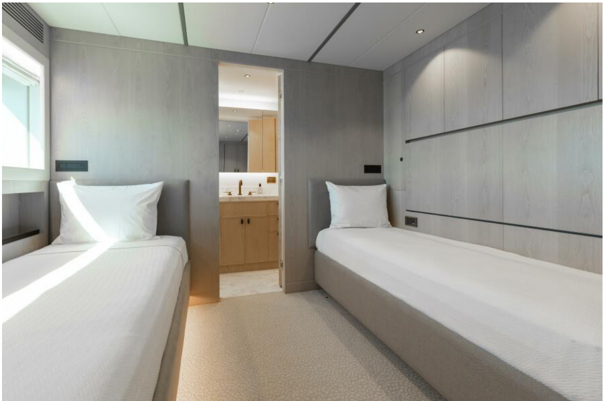
2021 Horizon FD110 (UNTETHERED) Guest Suite, Convertible Twin/Office