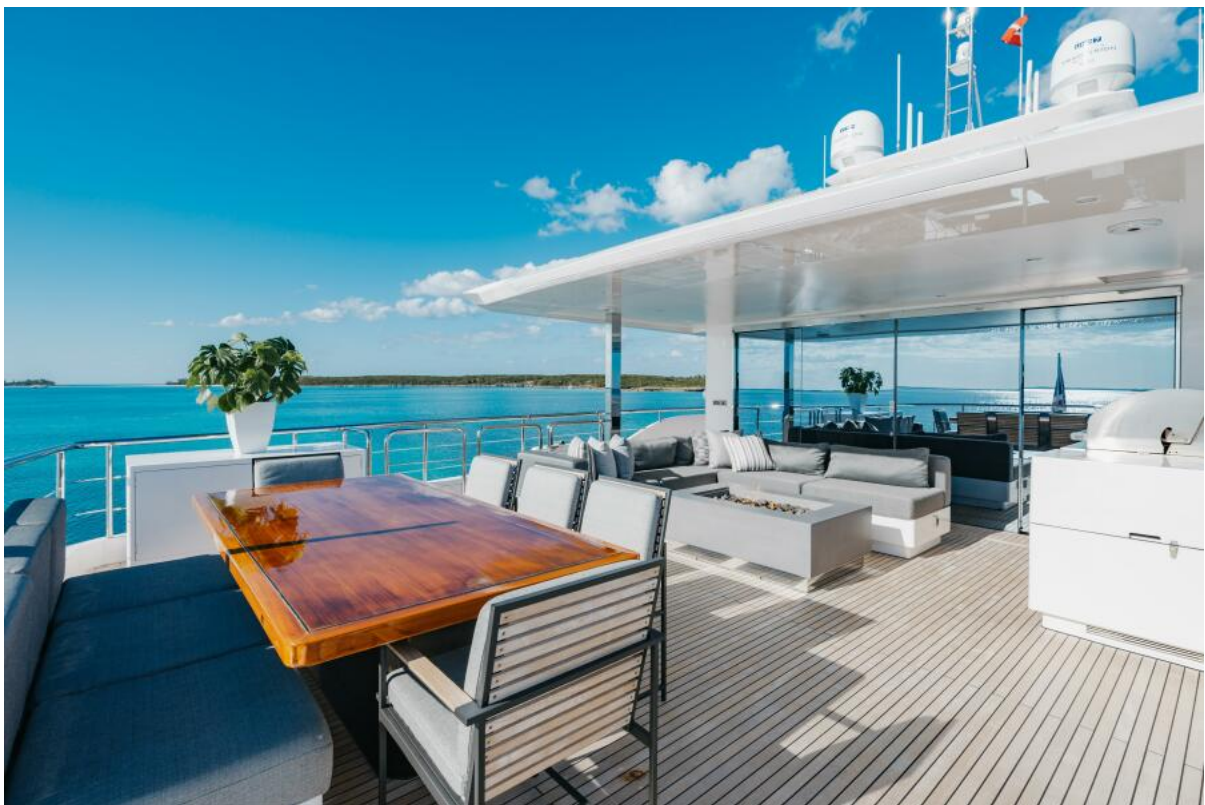
2021 Horizon FD110 (UNTETHERED) Boat Deck_2