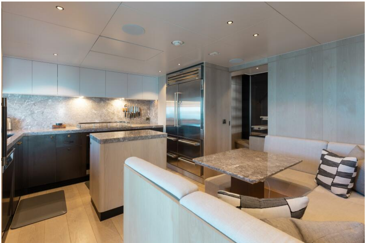
2021 Horizon FD110 (UNTETHERED) Galley