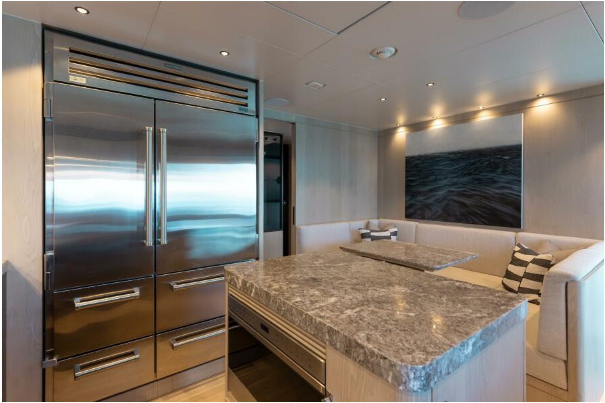
2021 Horizon FD110 (UNTETHERED) Dinette