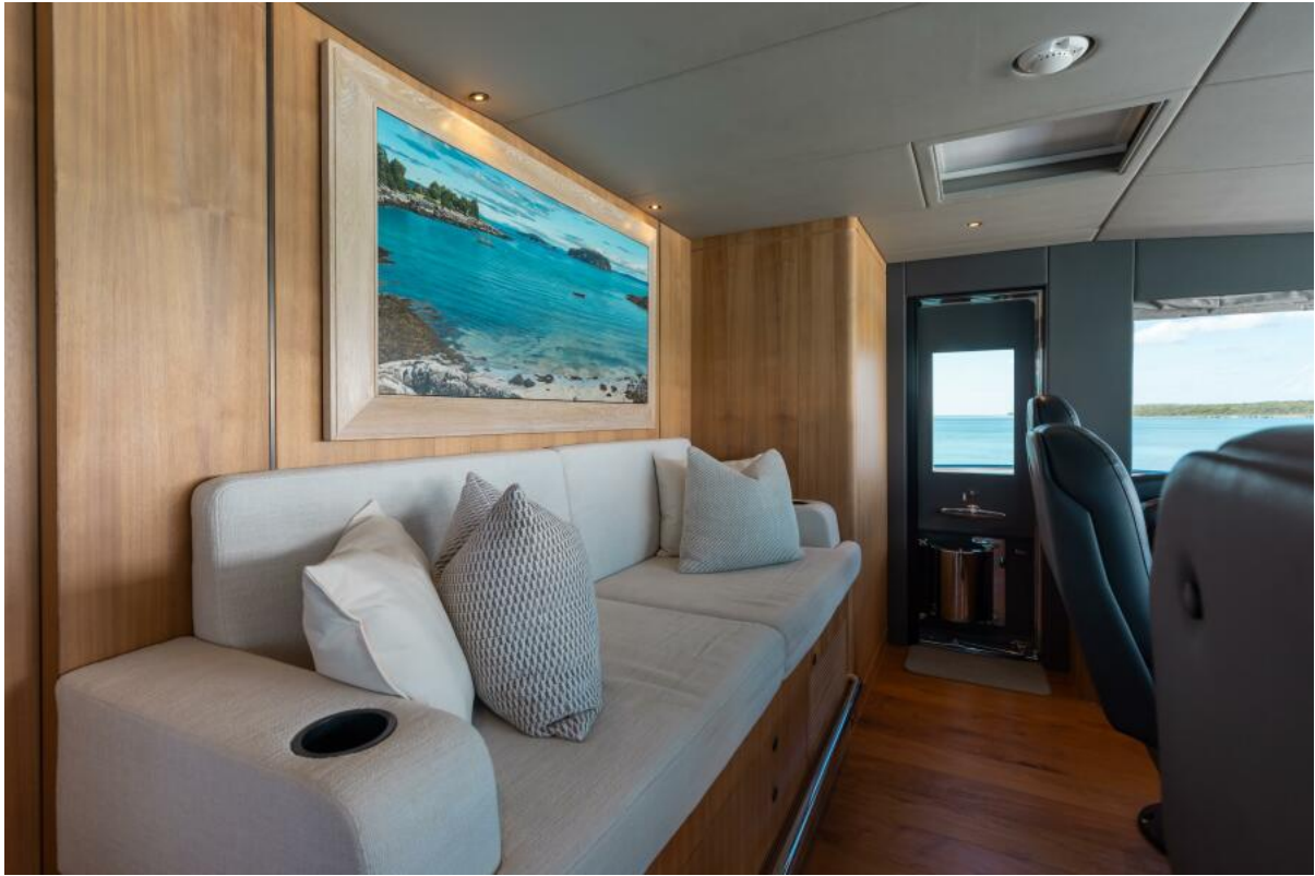
2021 Horizon FD110 (UNTETHERED) Pilothouse_2