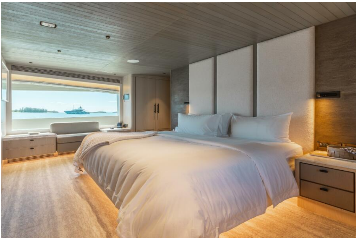
2021 Horizon FD110 (UNTETHERED) Owner's Suite