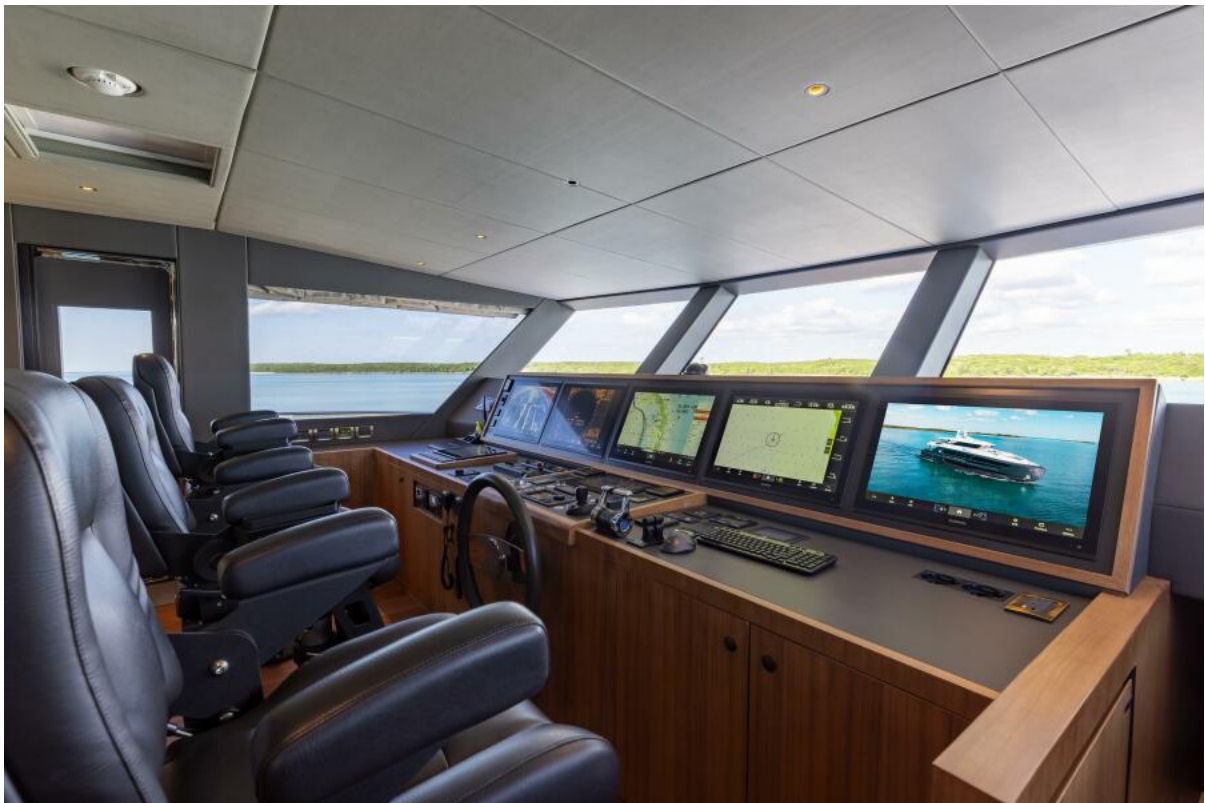
2021 Horizon FD110 (UNTETHERED) Pilothouse