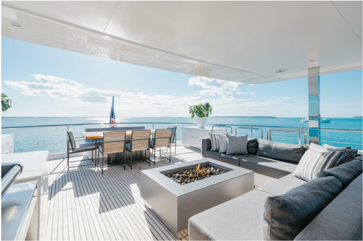
2021 Horizon FD110 (UNTETHERED) Boat Deck