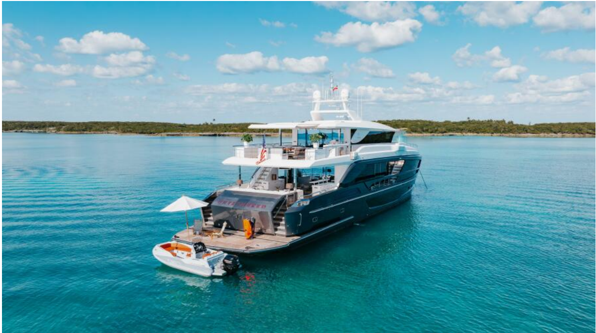
2021 Horizon FD110 (UNTETHERED) Stern