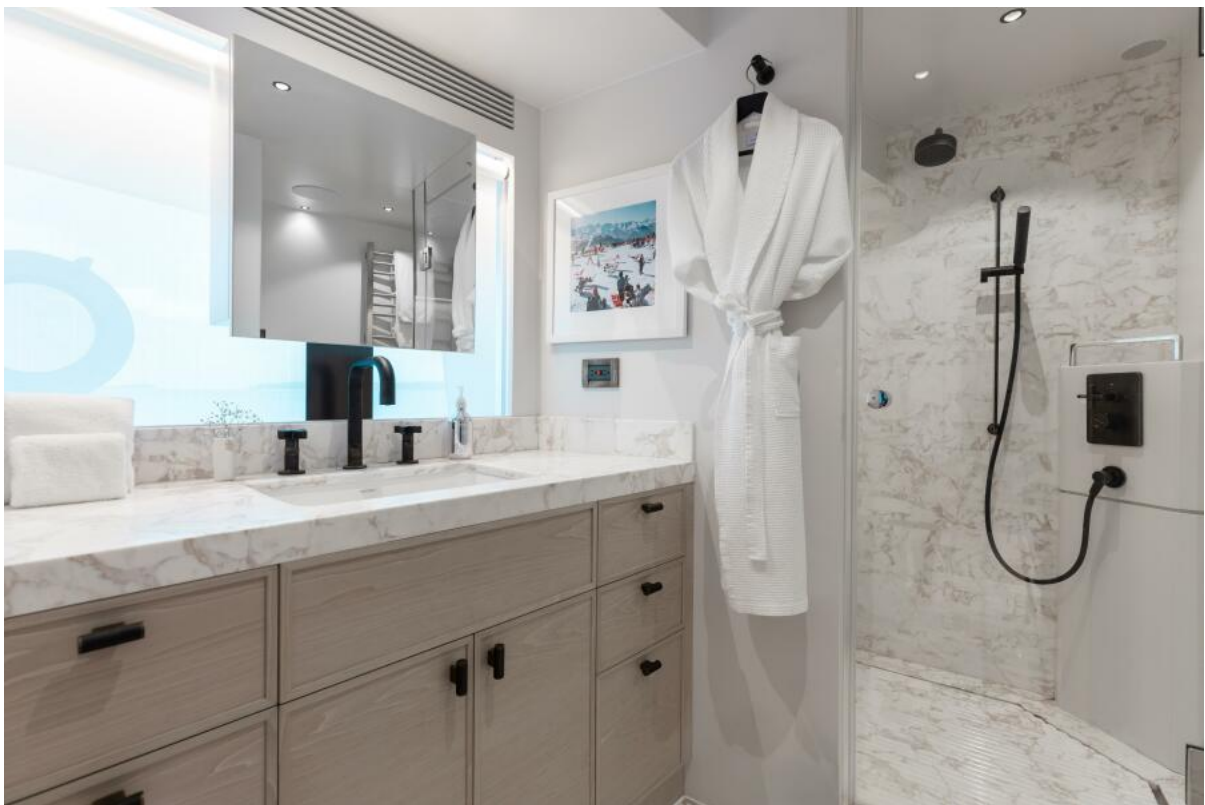
2021 Horizon FD110 (UNTETHERED) Owner's Suite_3