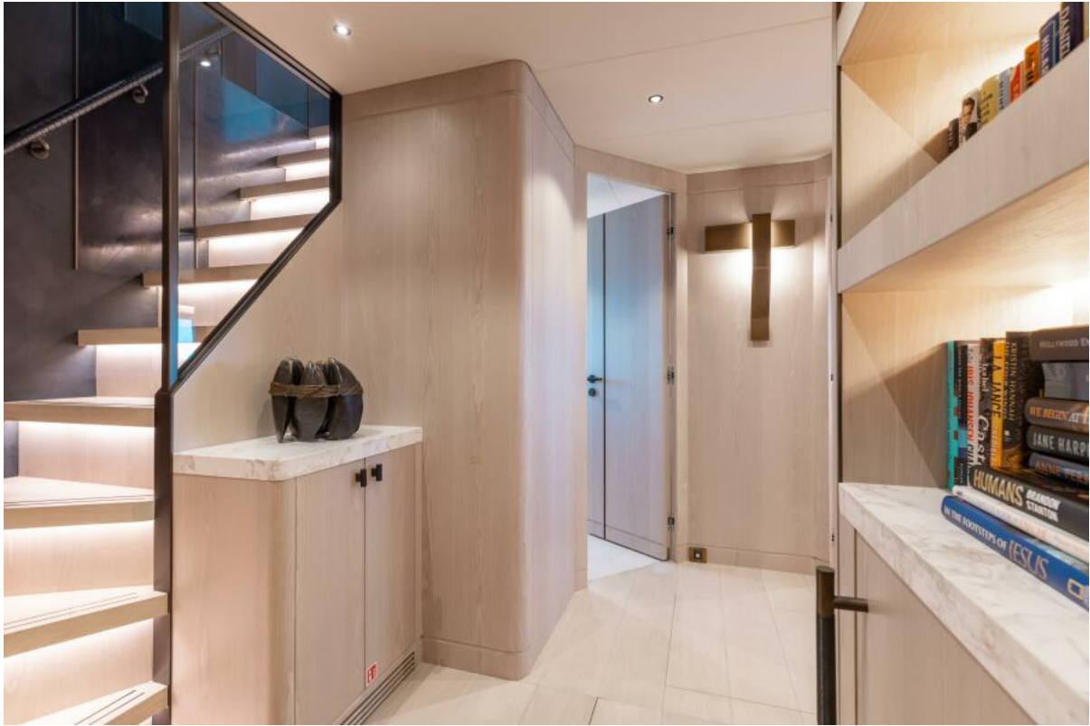
2021 Horizon FD110 (UNTETHERED) Lower Foyer