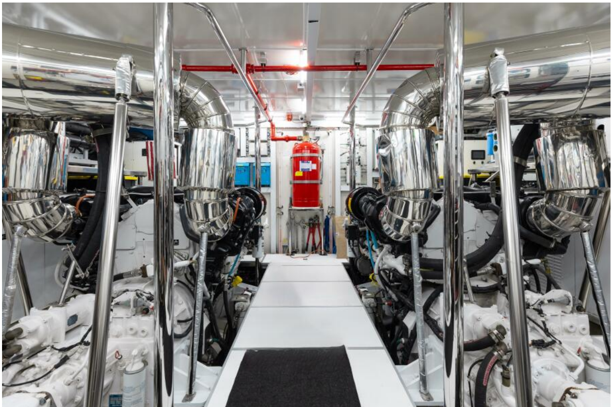
2021 Horizon FD110 (UNTETHERED) Engine Room