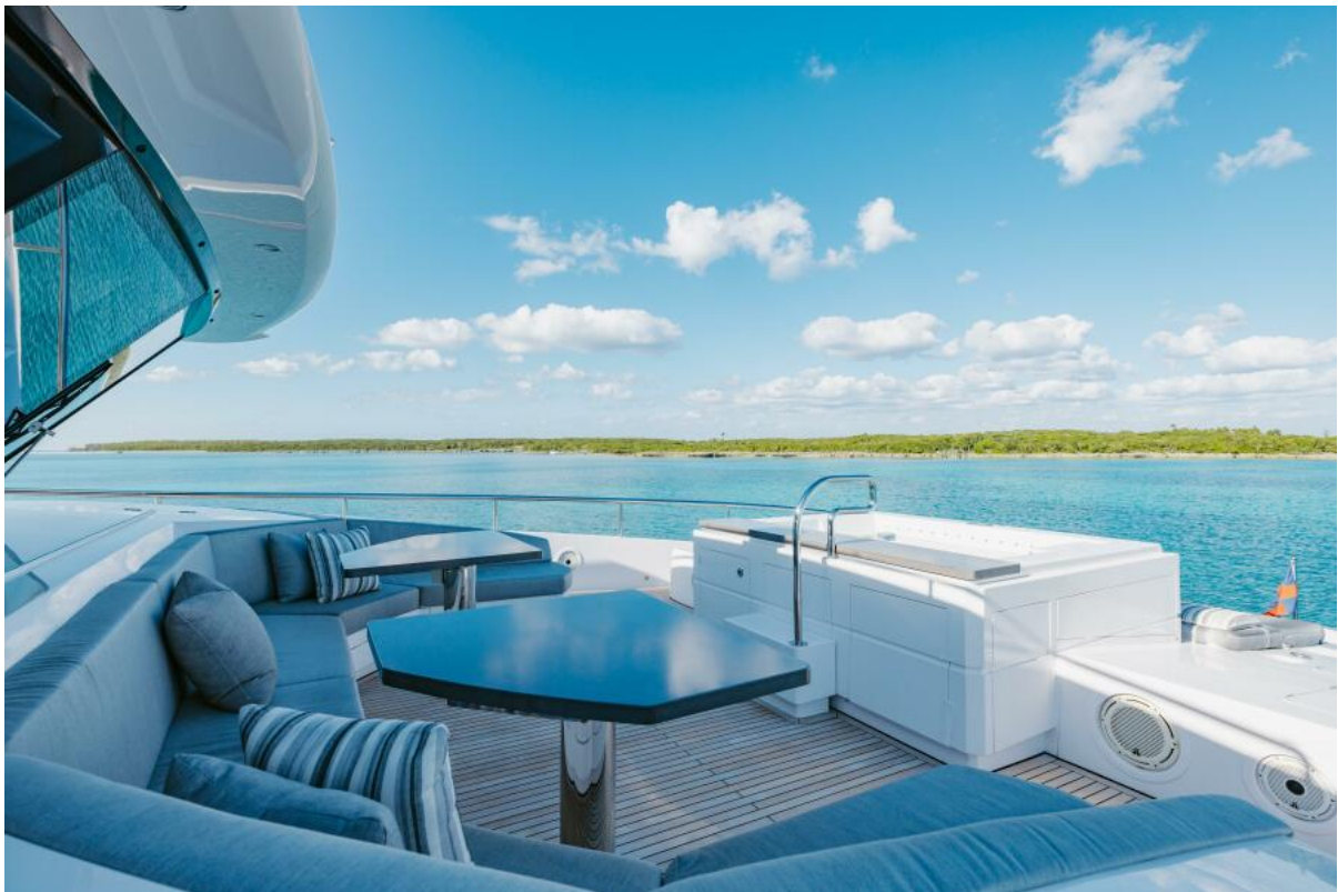
2021 Horizon FD110 (UNTETHERED) Foredeck