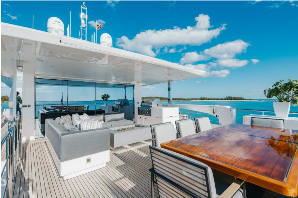
2021 Horizon FD110 (UNTETHERED) Boat Deck_3