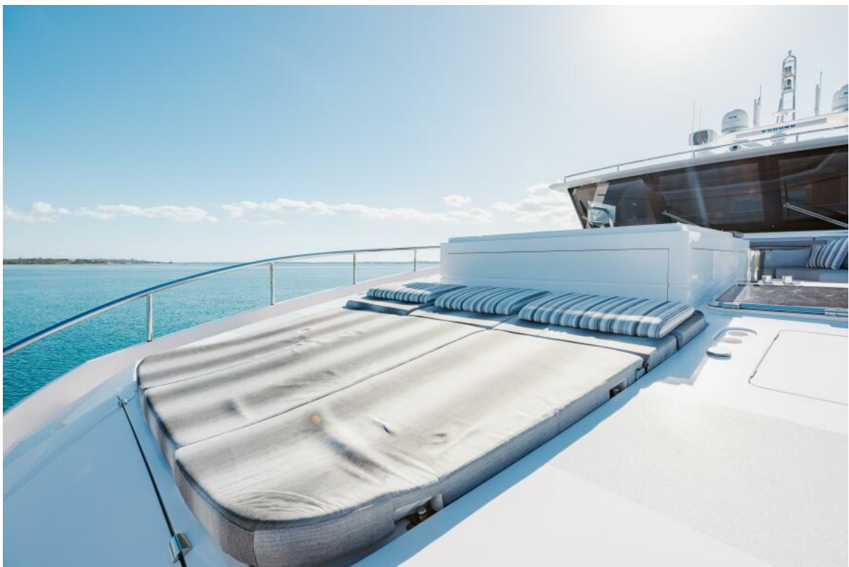
2021 Horizon FD110 (UNTETHERED) Foredeck_3