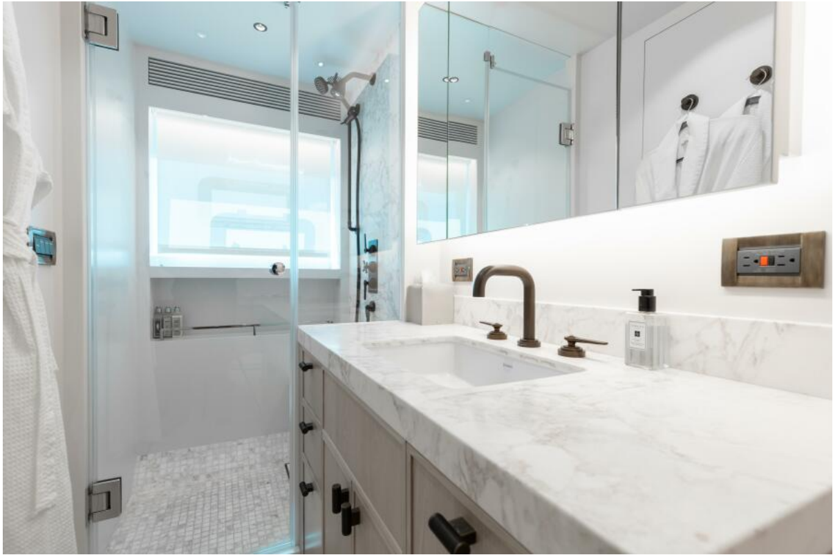
2021 Horizon FD110 (UNTETHERED) Guest Ensuite