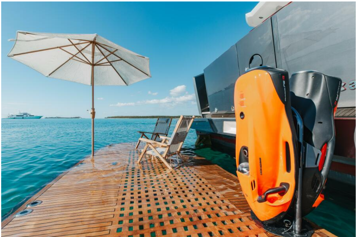
2021 Horizon FD110 (UNTETHERED) Swim Platform_2