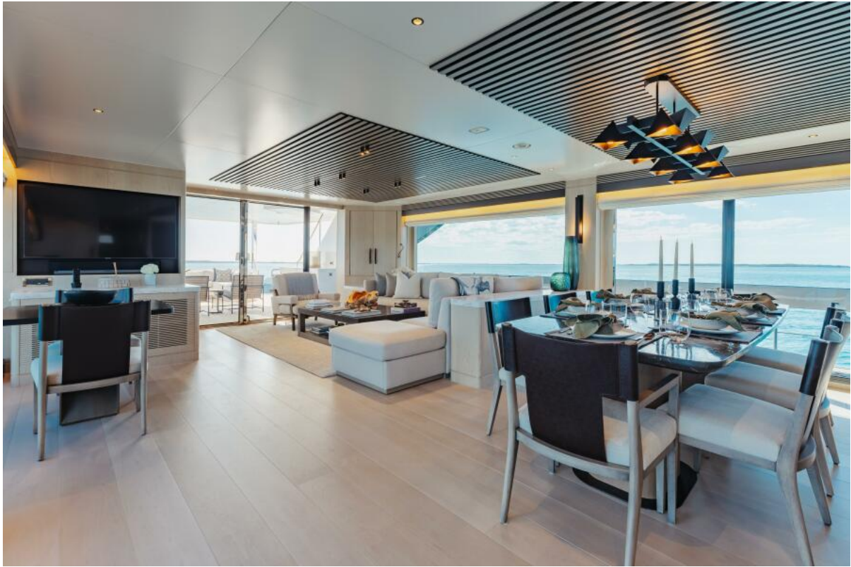
2021 Horizon FD110 (UNTETHERED) Main Saloon, Dining