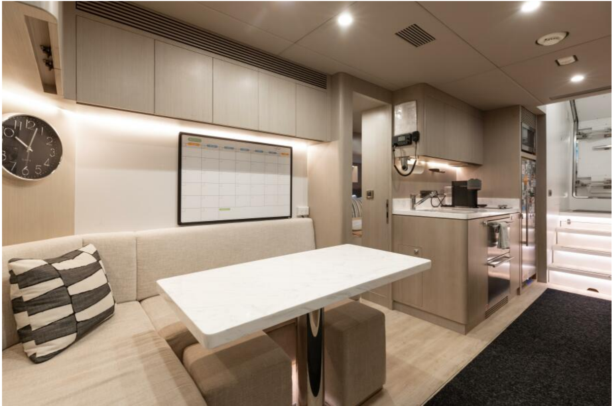
2021 Horizon FD110 (UNTETHERED) Crew Mess