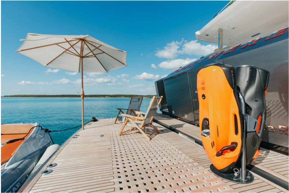
2021 Horizon FD110 (UNTETHERED) Swim Platform