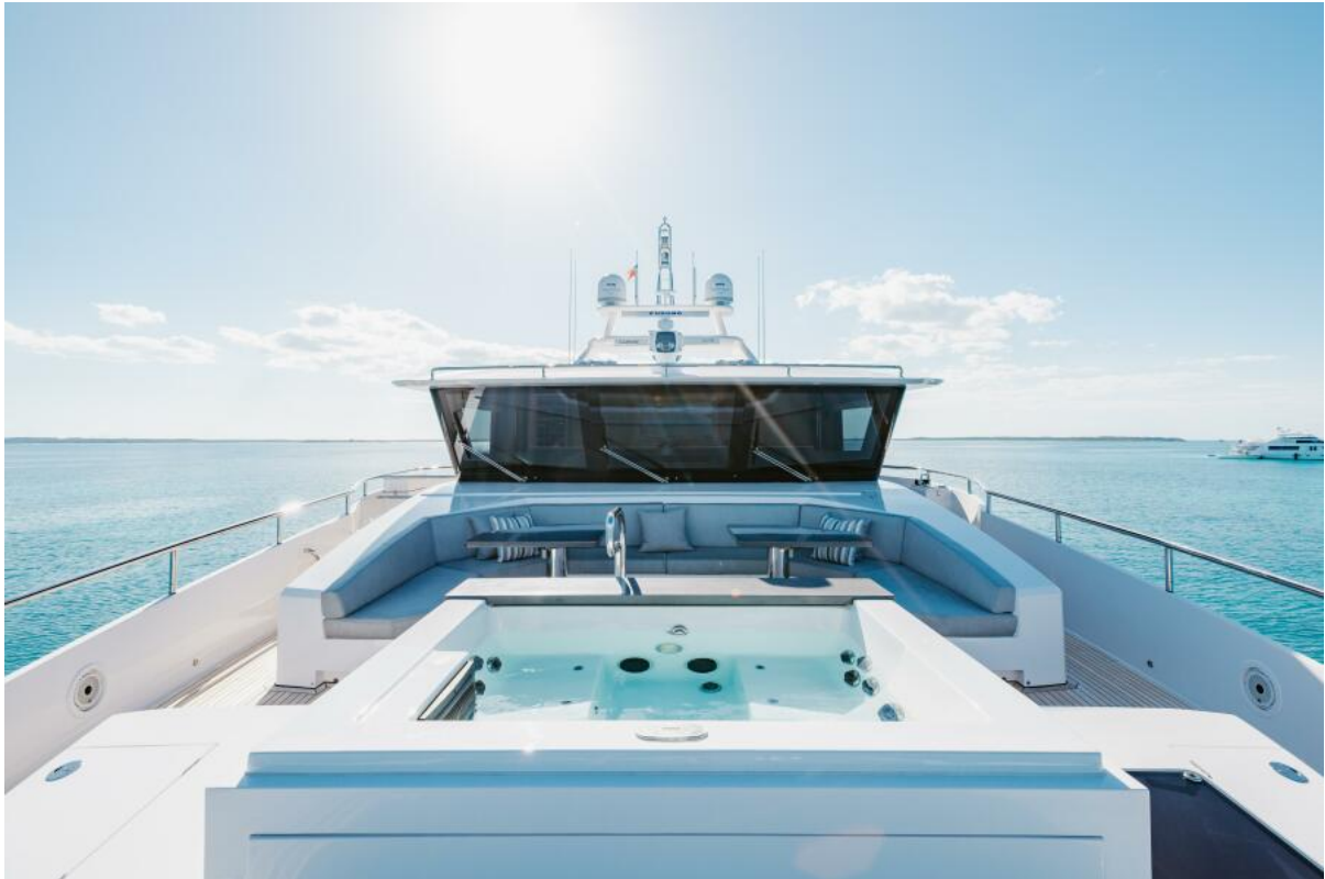
2021 Horizon FD110 (UNTETHERED) Foredeck_2