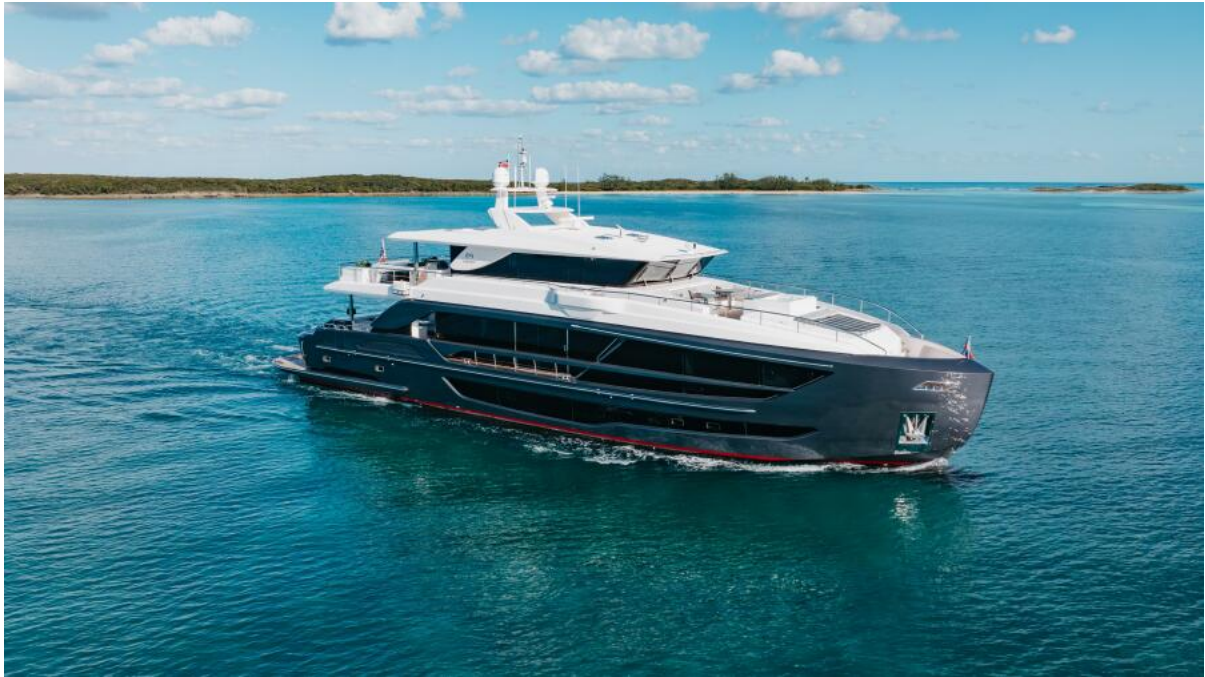
2021 Horizon FD110 (UNTETHERED) Profile