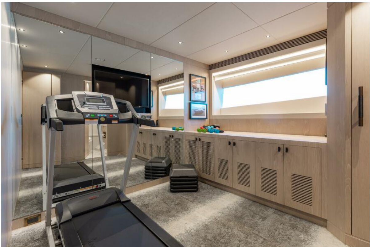
2021 Horizon FD110 (UNTETHERED) Gym