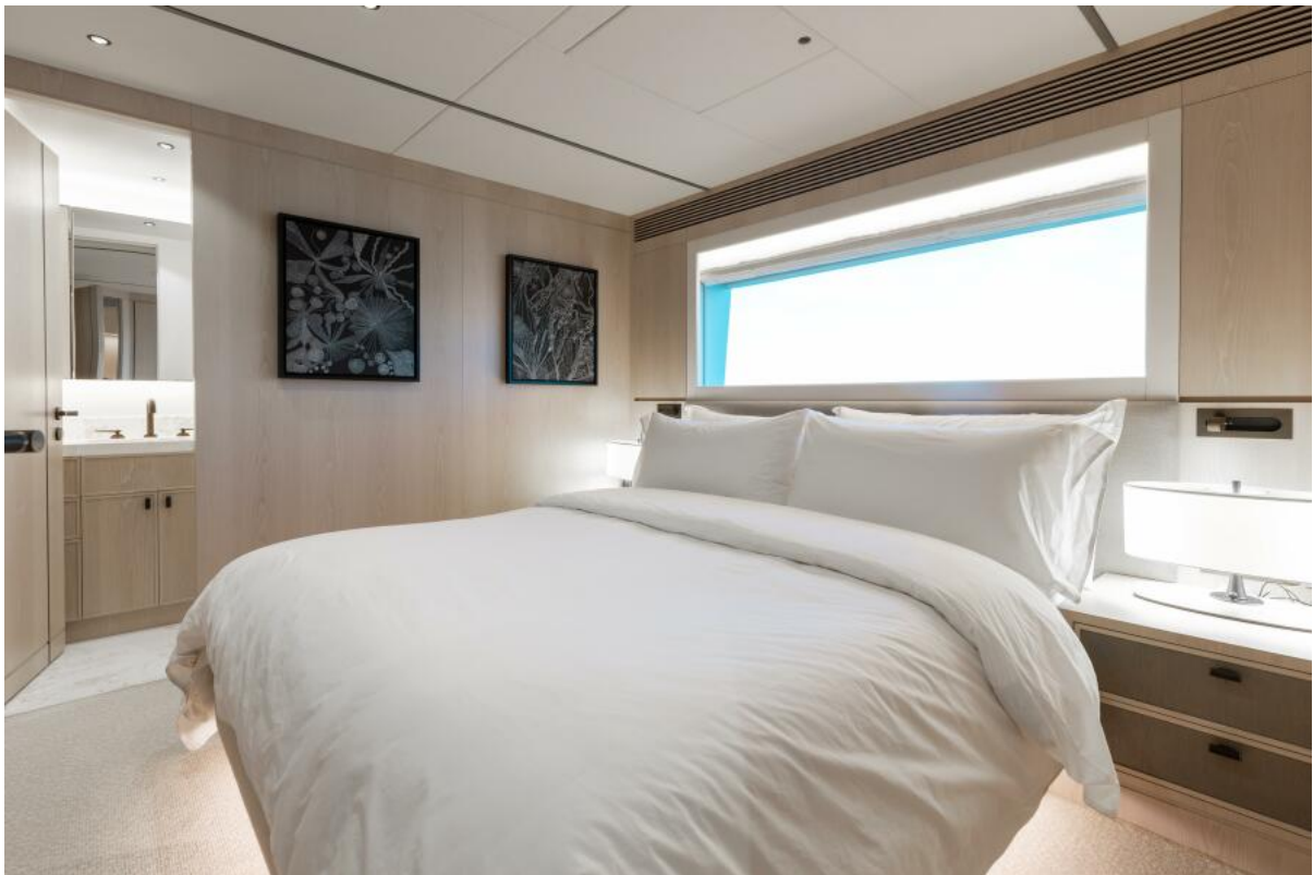
2021 Horizon FD110 (UNTETHERED) Guest Suite