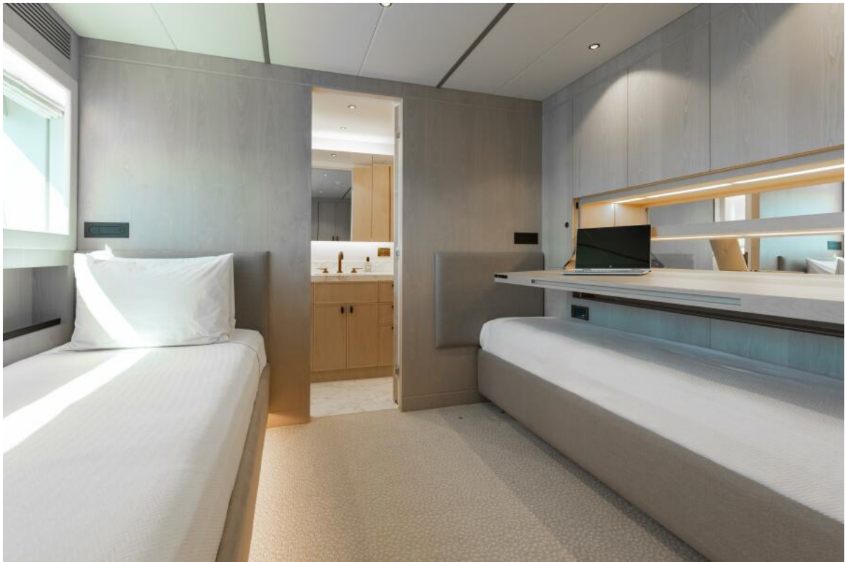
2021 Horizon FD110 (UNTETHERED) Guest Suite, Convertible Twin/Office_2