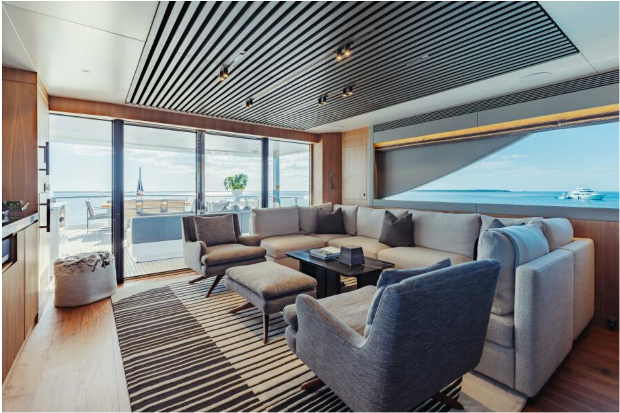
2021 Horizon FD110 (UNTETHERED) Sky Lounge_2