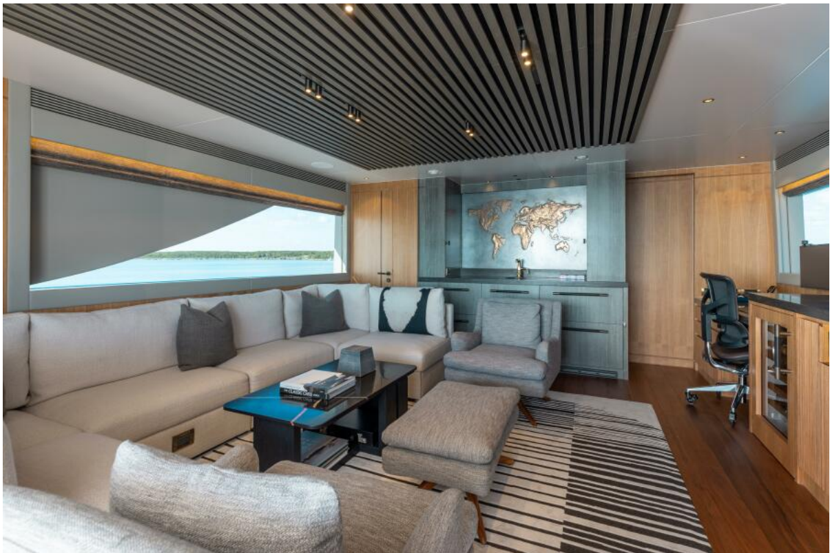
2021 Horizon FD110 (UNTETHERED) Sky Lounge