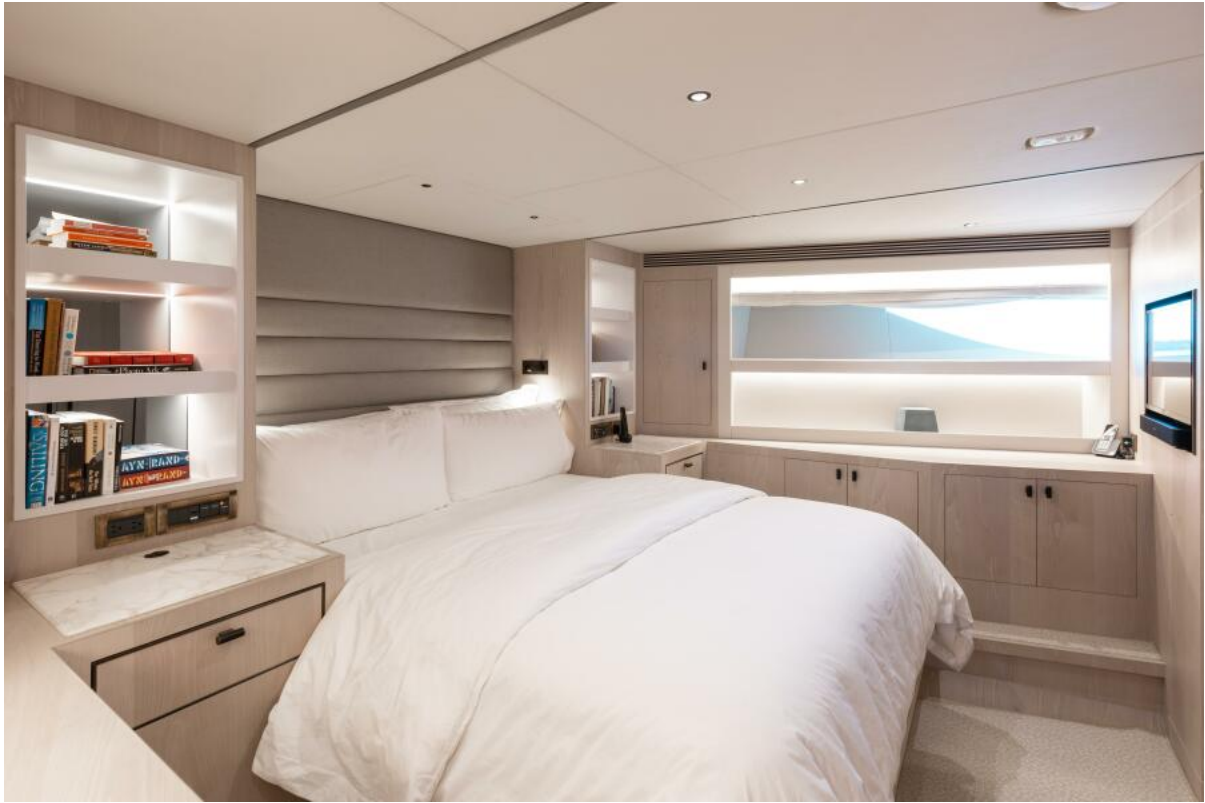
2021 Horizon FD110 (UNTETHERED) Guest Suite