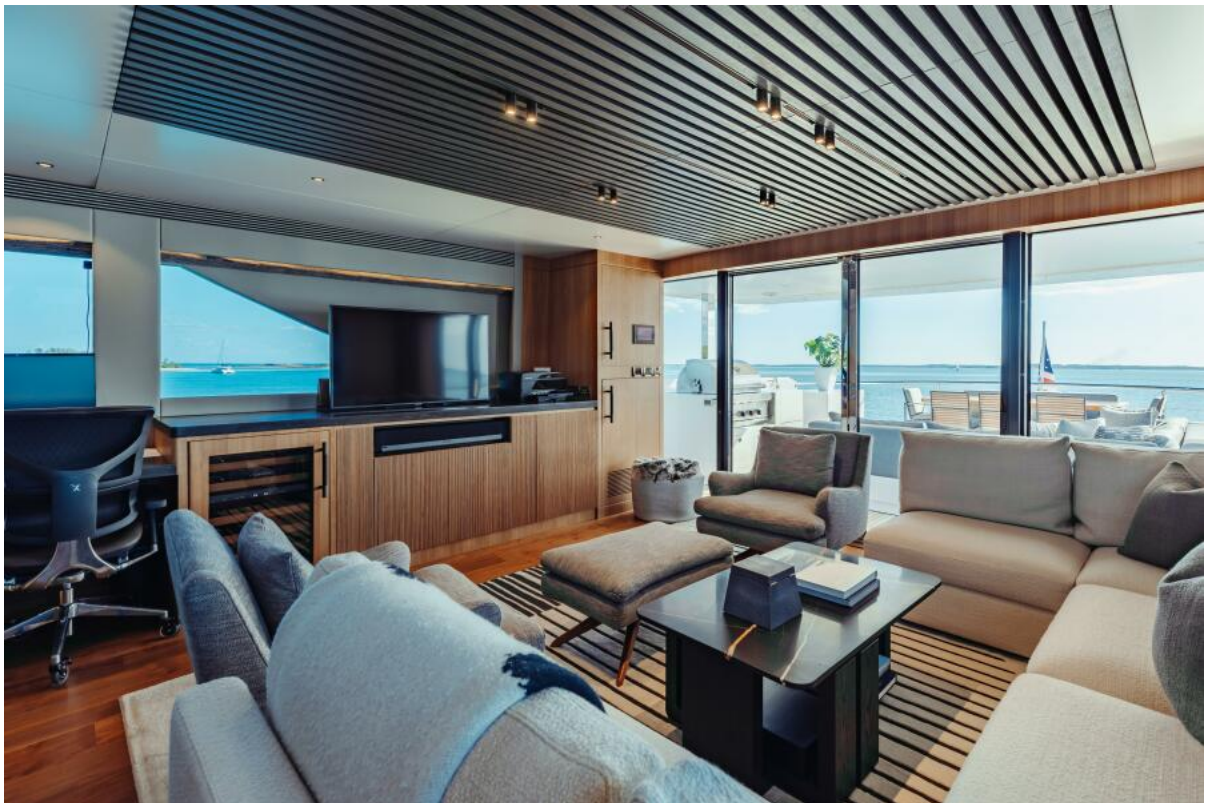
2021 Horizon FD110 (UNTETHERED) Sky Lounge_3