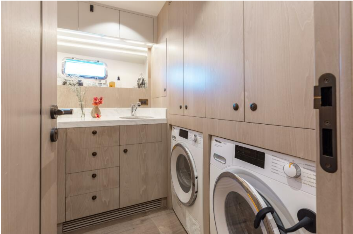
2021 Horizon FD110 (UNTETHERED) Laundry Room