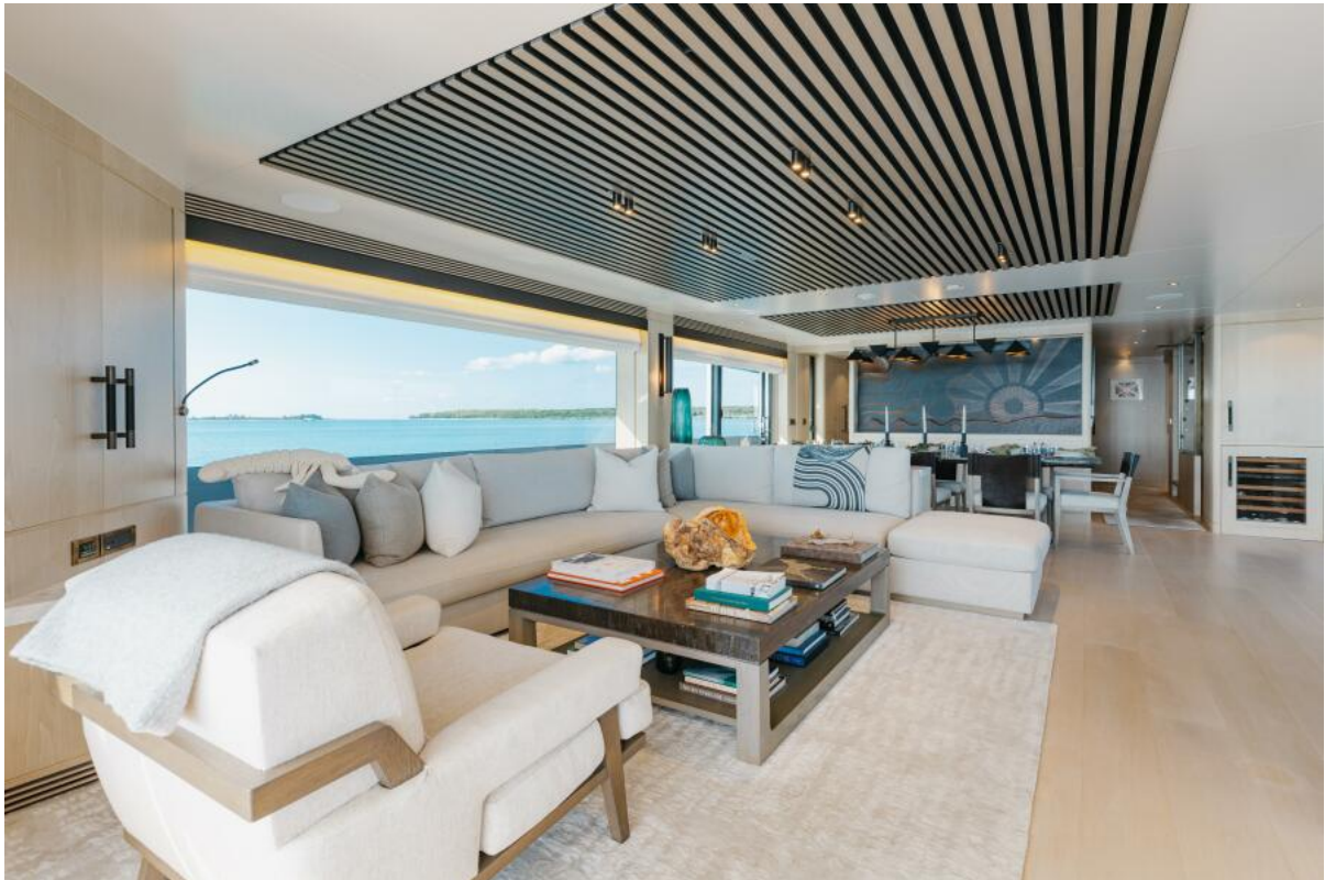
2021 Horizon FD110 (UNTETHERED) Main Saloon