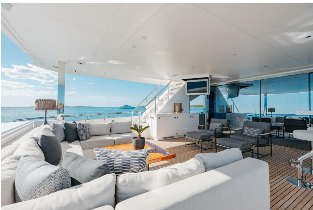
2021 Horizon FD110 (UNTETHERED) Main Deck Aft_2