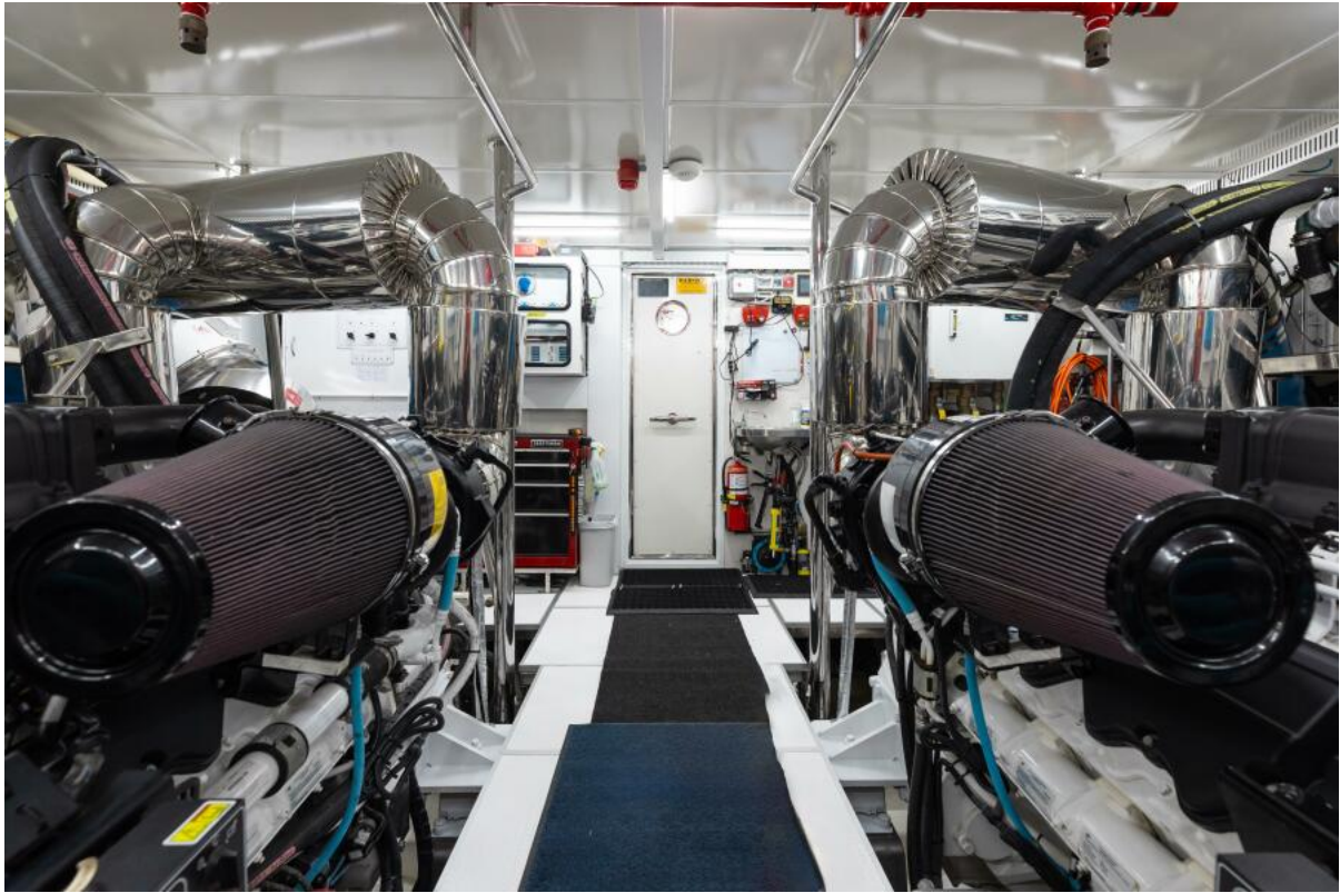
2021 Horizon FD110 (UNTETHERED) Engine Room_2