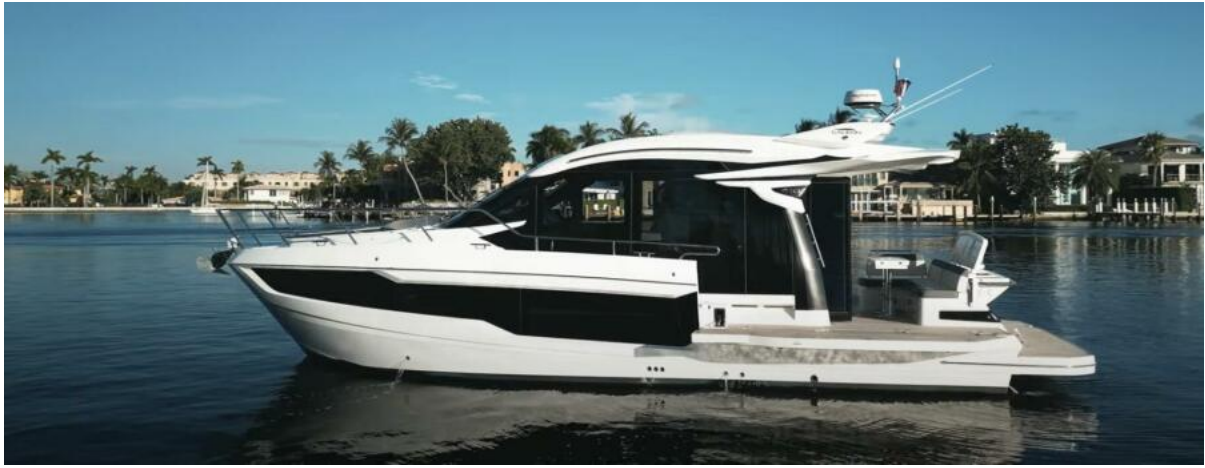
2022 Galeon 410HTC