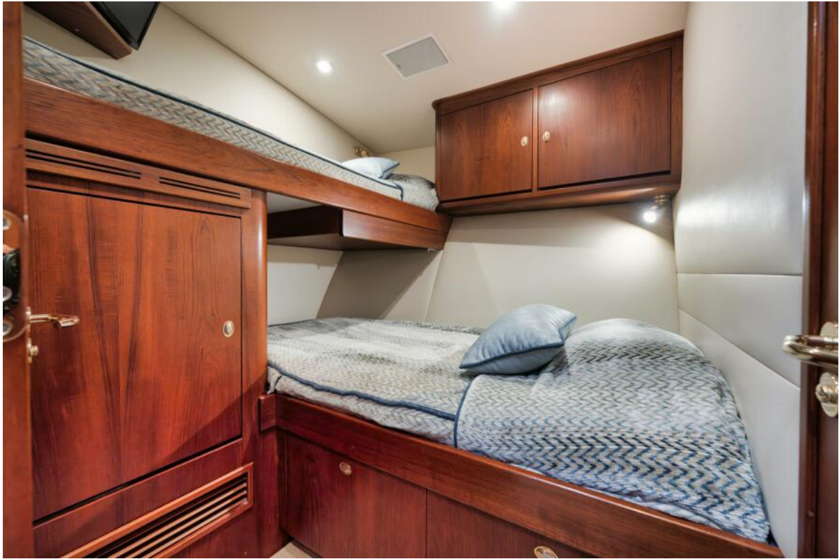
Forward Guest Bunk Room