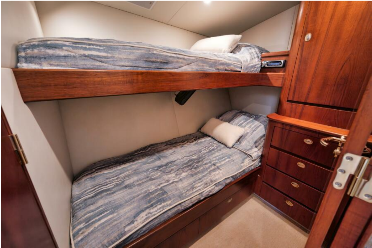
Aft Guest Bunk Room