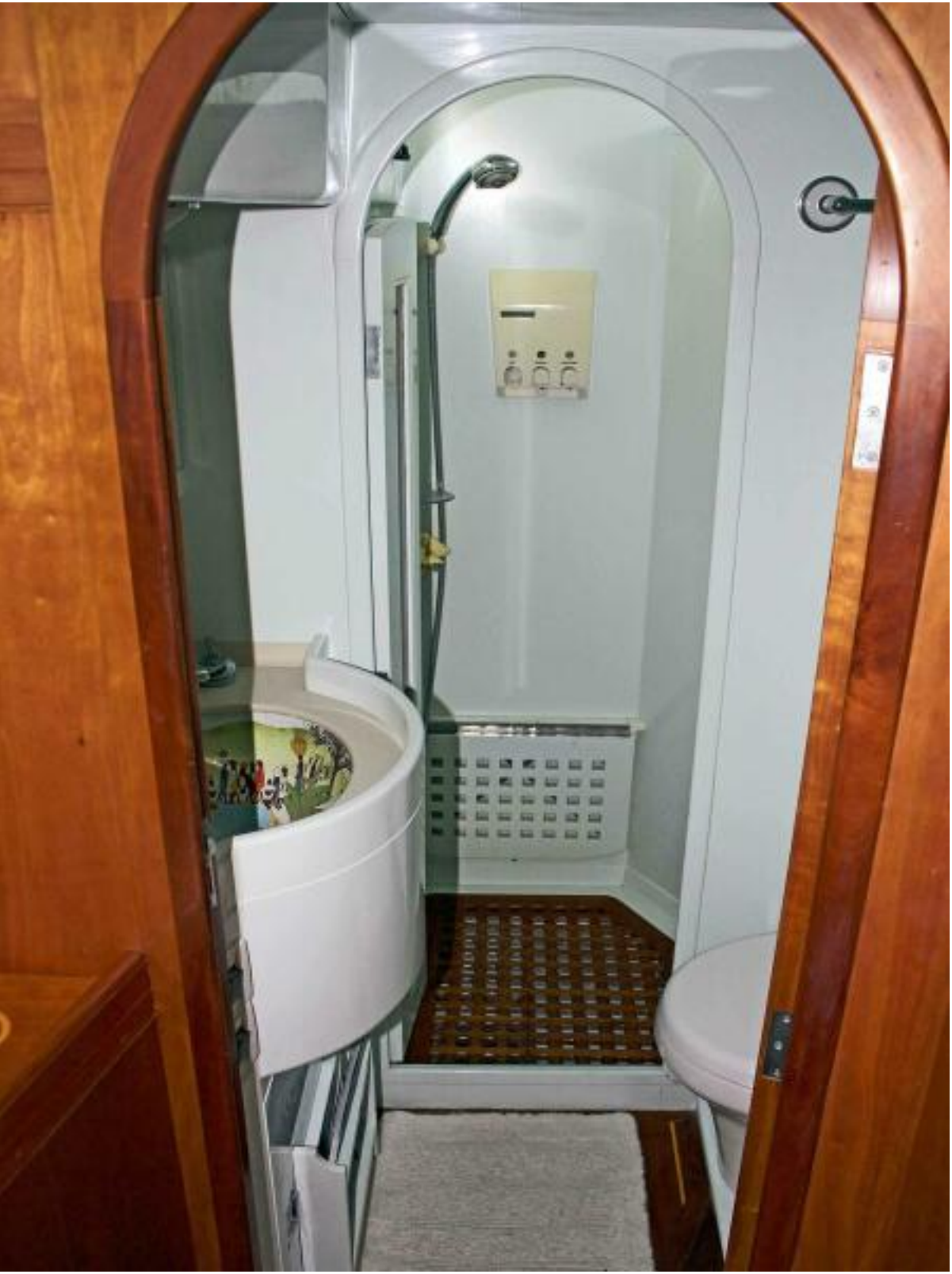
Owner Stateroom Head and Shower