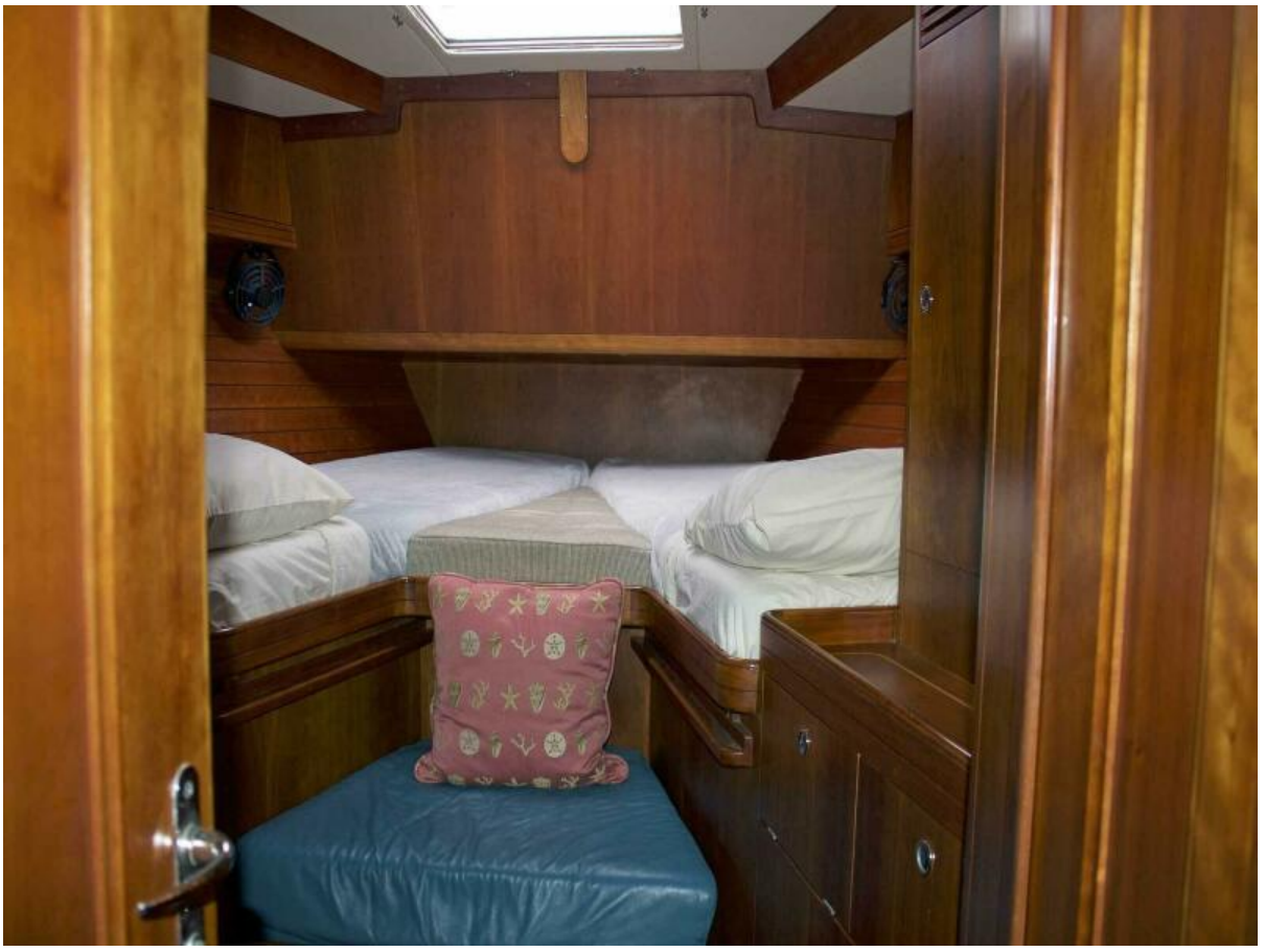
Fwd Guest Stateroom V-berth