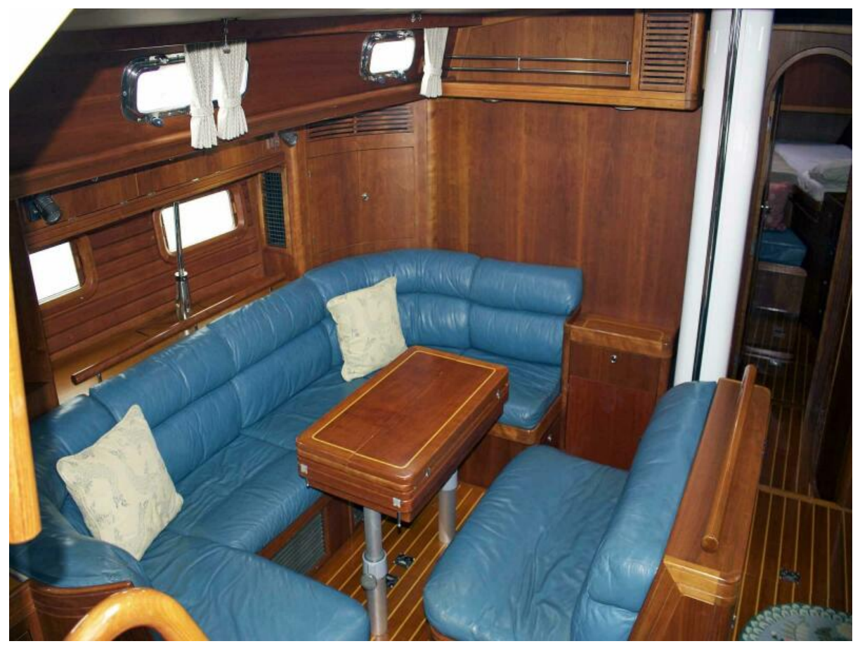
Salon Table Folded