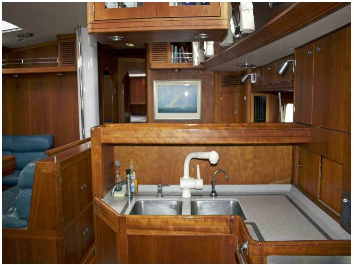
Galley Looking Fwd