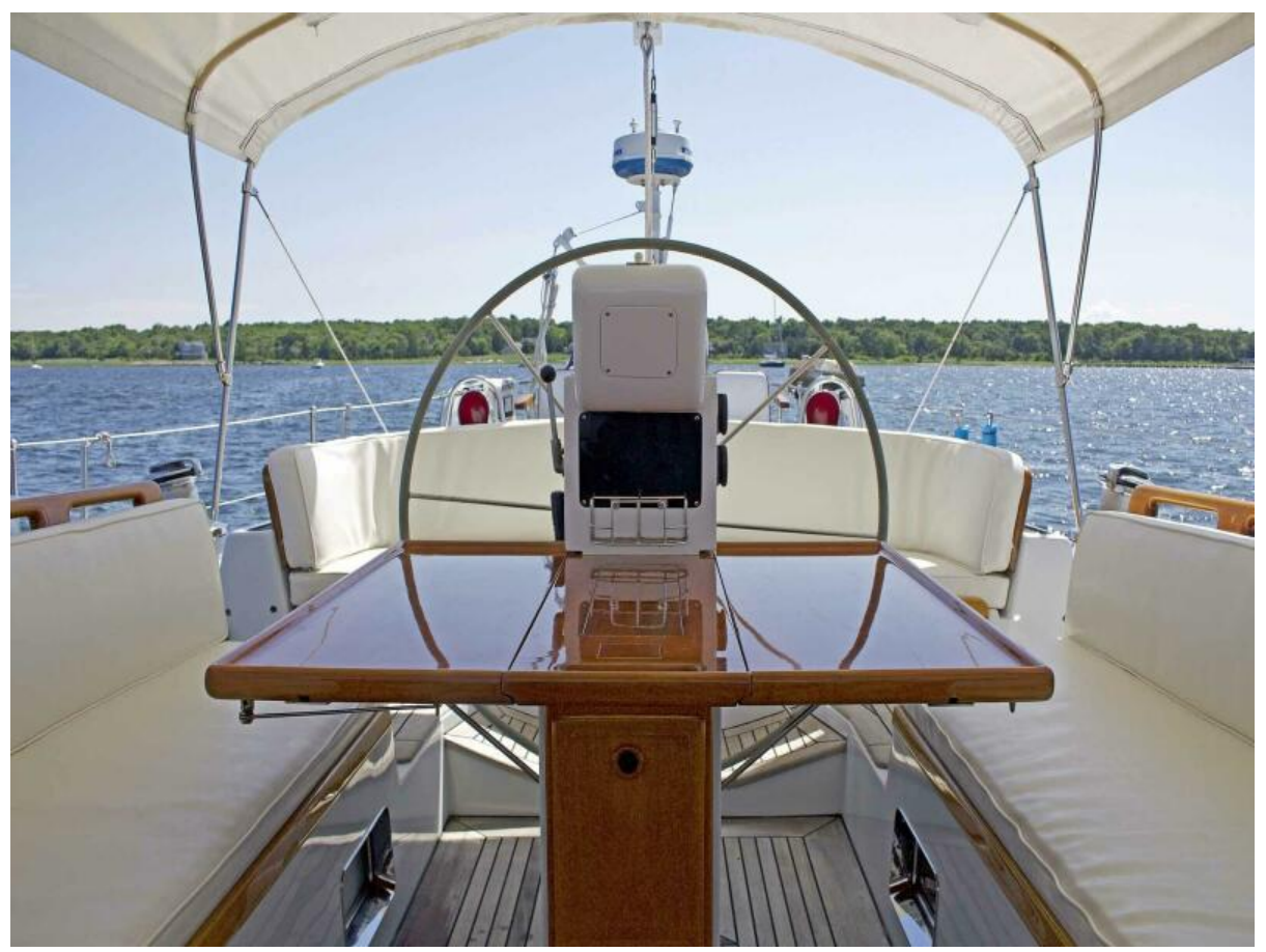
Cockpit Looking Aft Table Extended