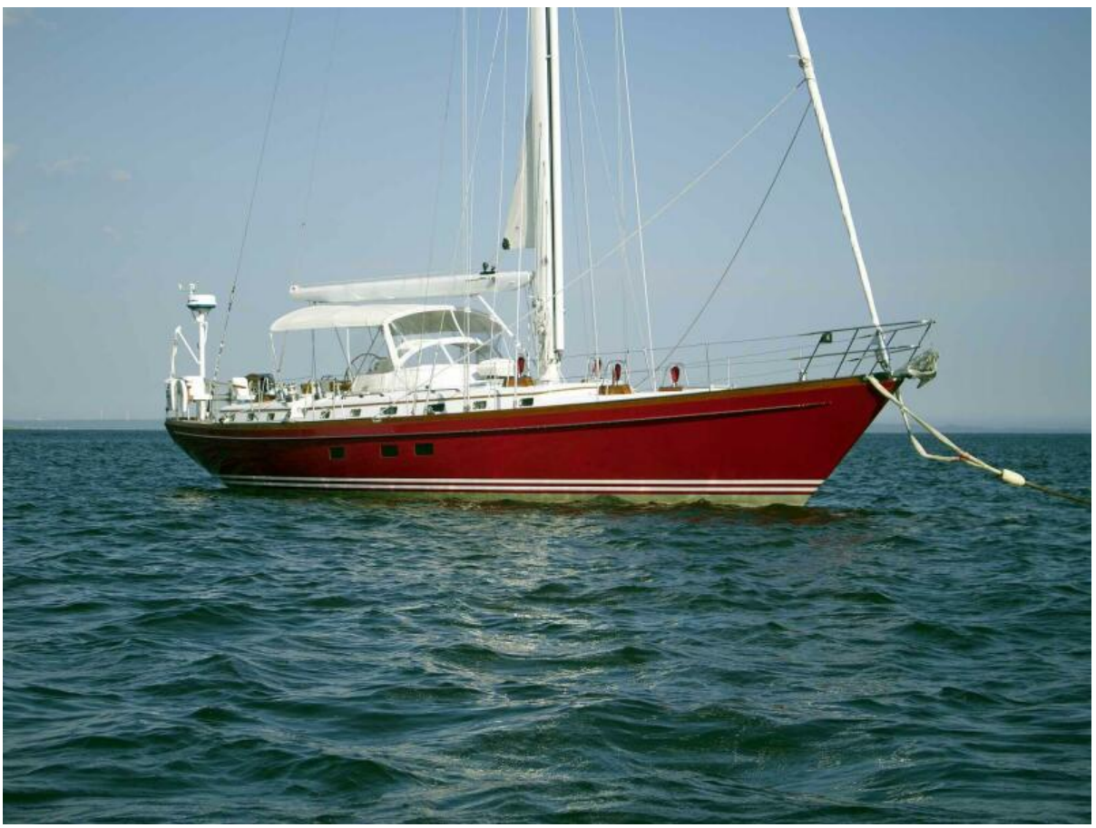
Stbd Profile Fwd