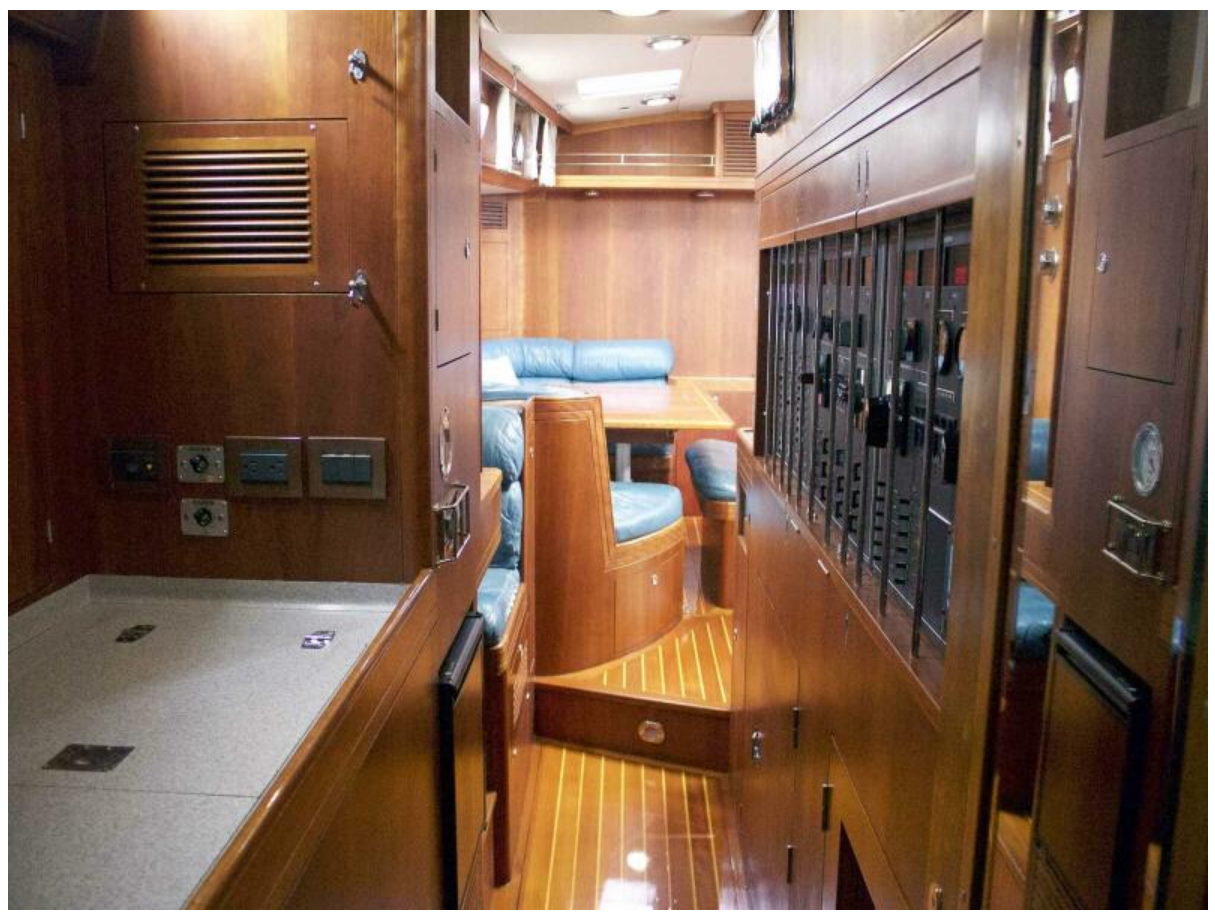
Port Passageway Fwd