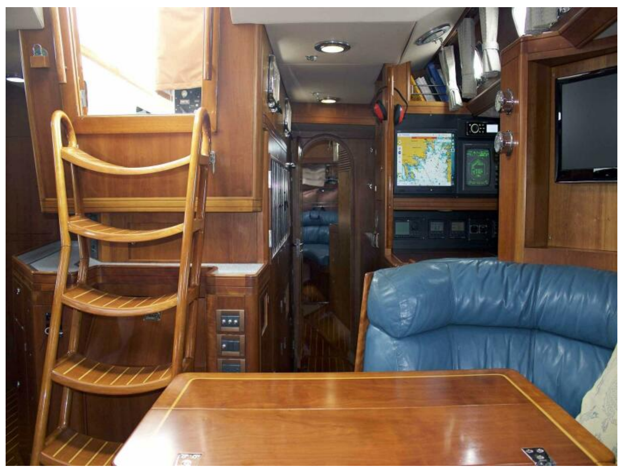
Port Passageway Aft