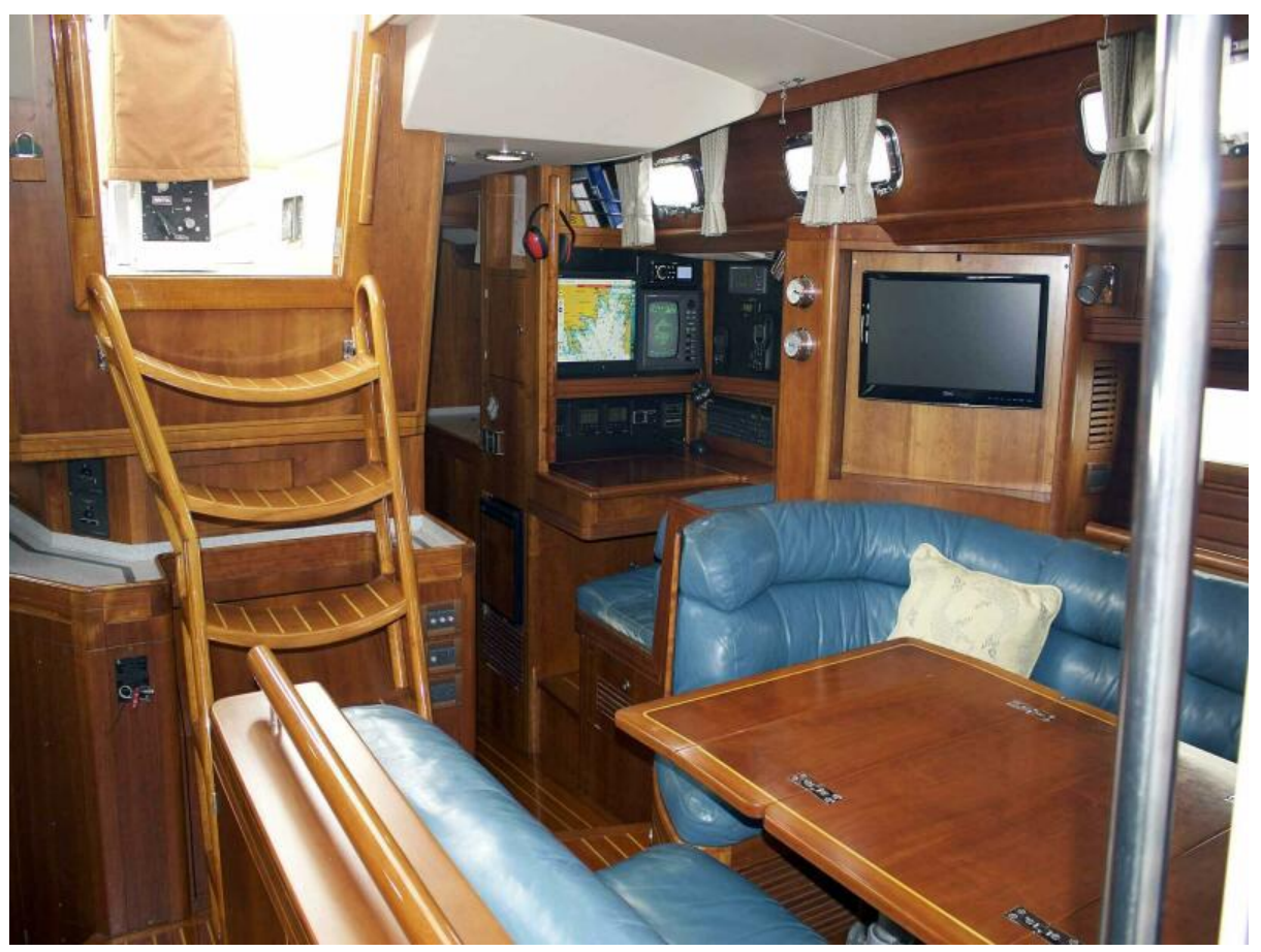
Salon Aft Nav Area