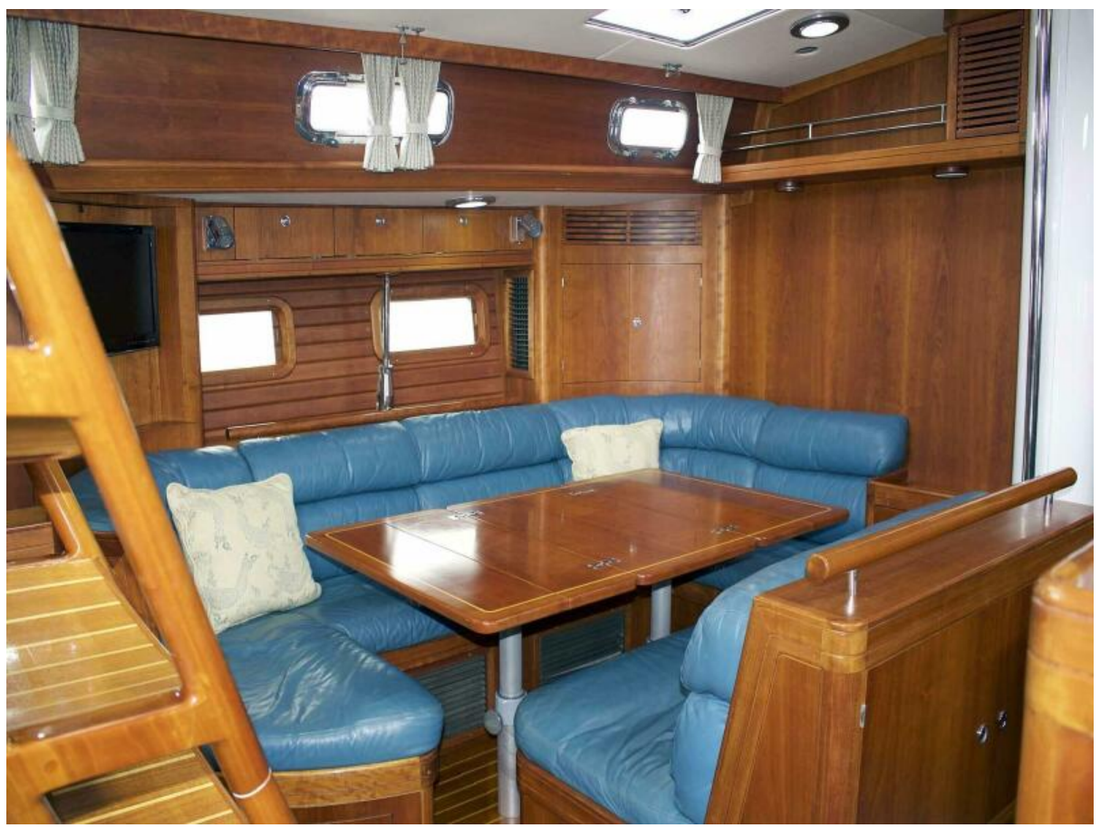
Salon Table Extended