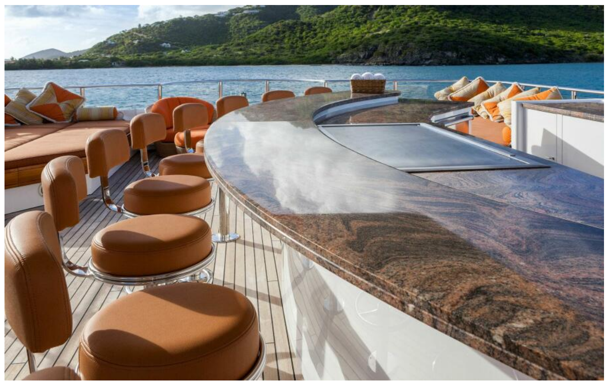
124' Hakvoort 2007 PERLE BLEUE Sundeck_3