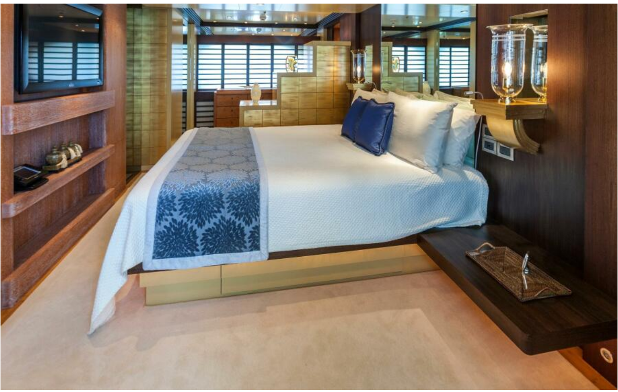
124' Hakvoort 2007 PERLE BLEUE Owner's Suite_1