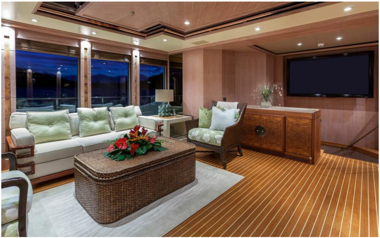
124' Hakvoort 2007 PERLE BLEUE Sky Lounge_1