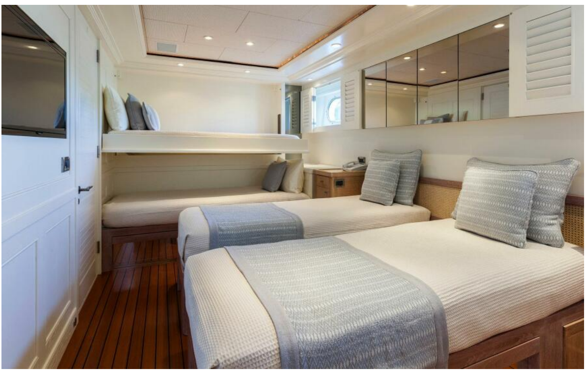
124' Hakvoort 2007 PERLE BLEUE Guest Suite - Twin