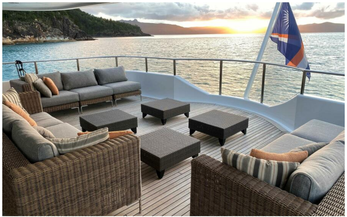
124' Hakvoort 2007 PERLE BLEUE Bridge Deck Aft_2