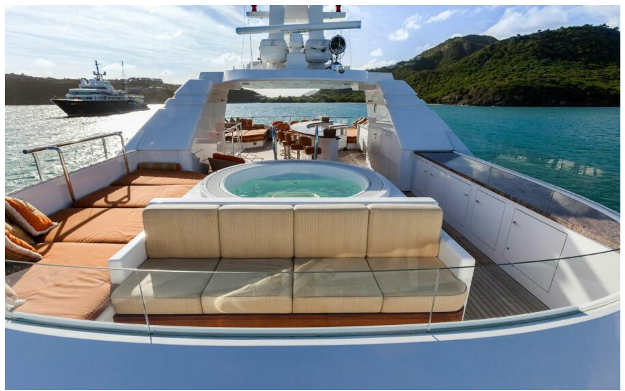
124' Hakvoort 2007 PERLE BLEUE Sundeck_1