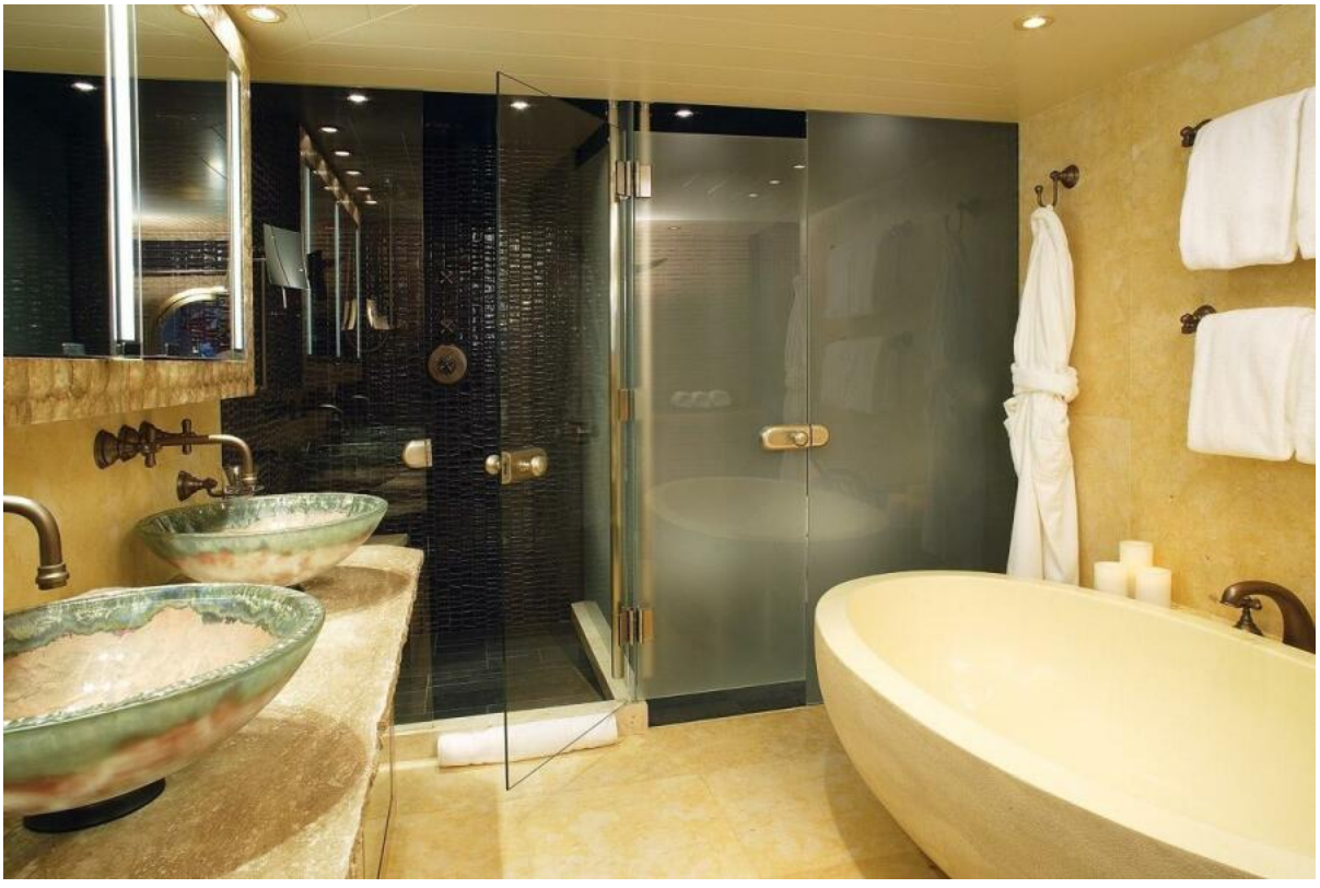
124' Hakvoort 2007 PERLE BLEUE Owner's Suite_3