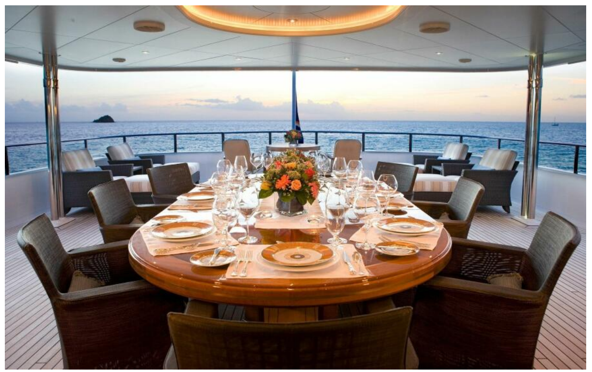
124' Hakvoort 2007 PERLE BLEUE Bridge Deck Aft_1