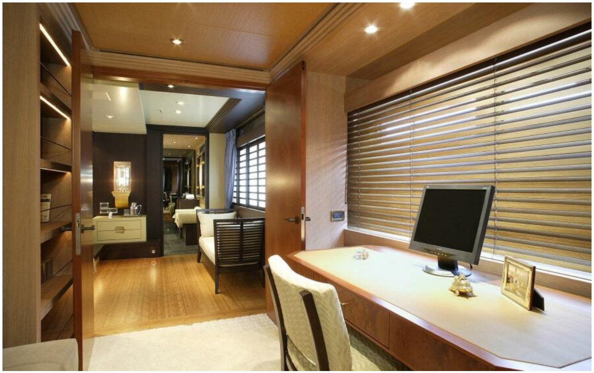
124' Hakvoort 2007 PERLE BLEUE Owner's Suite_2