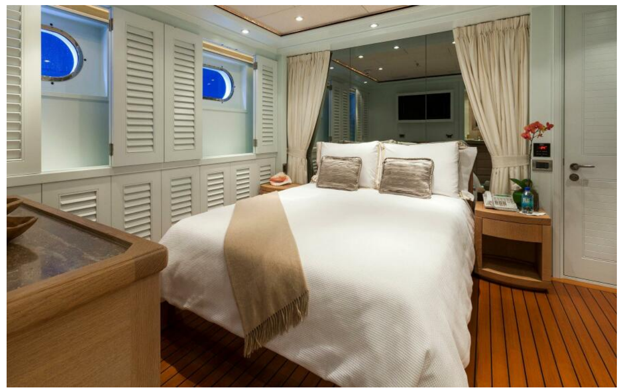
.124' Hakvoort 2007 PERLE BLEUE Guest Suite