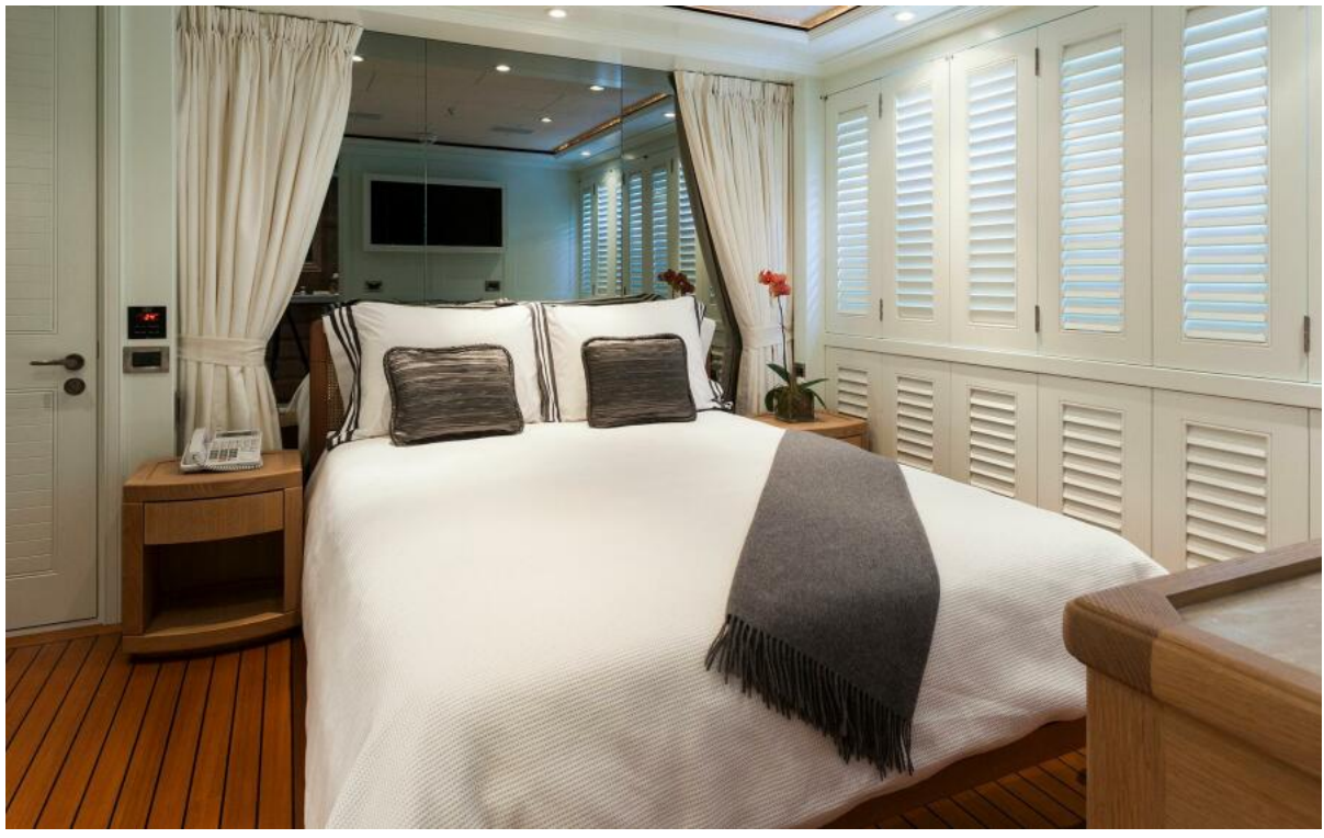
.124' Hakvoort 2007 PERLE BLEUE Guest Suite