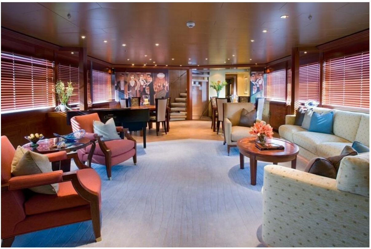
124' Hakvoort 2007 PERLE BLEUE Main Salon