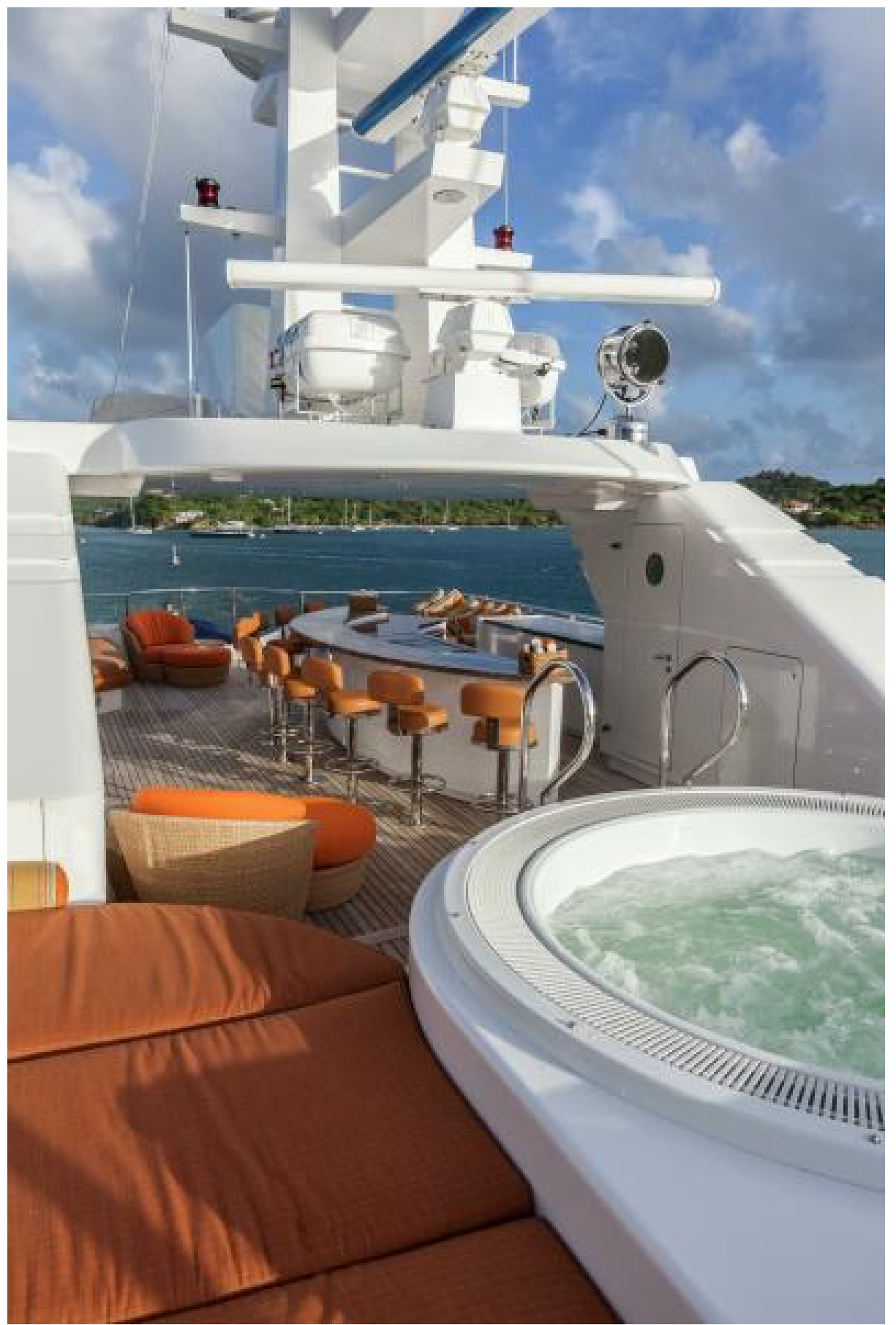
124' Hakvoort 2007 PERLE BLEUE Sundeck_2