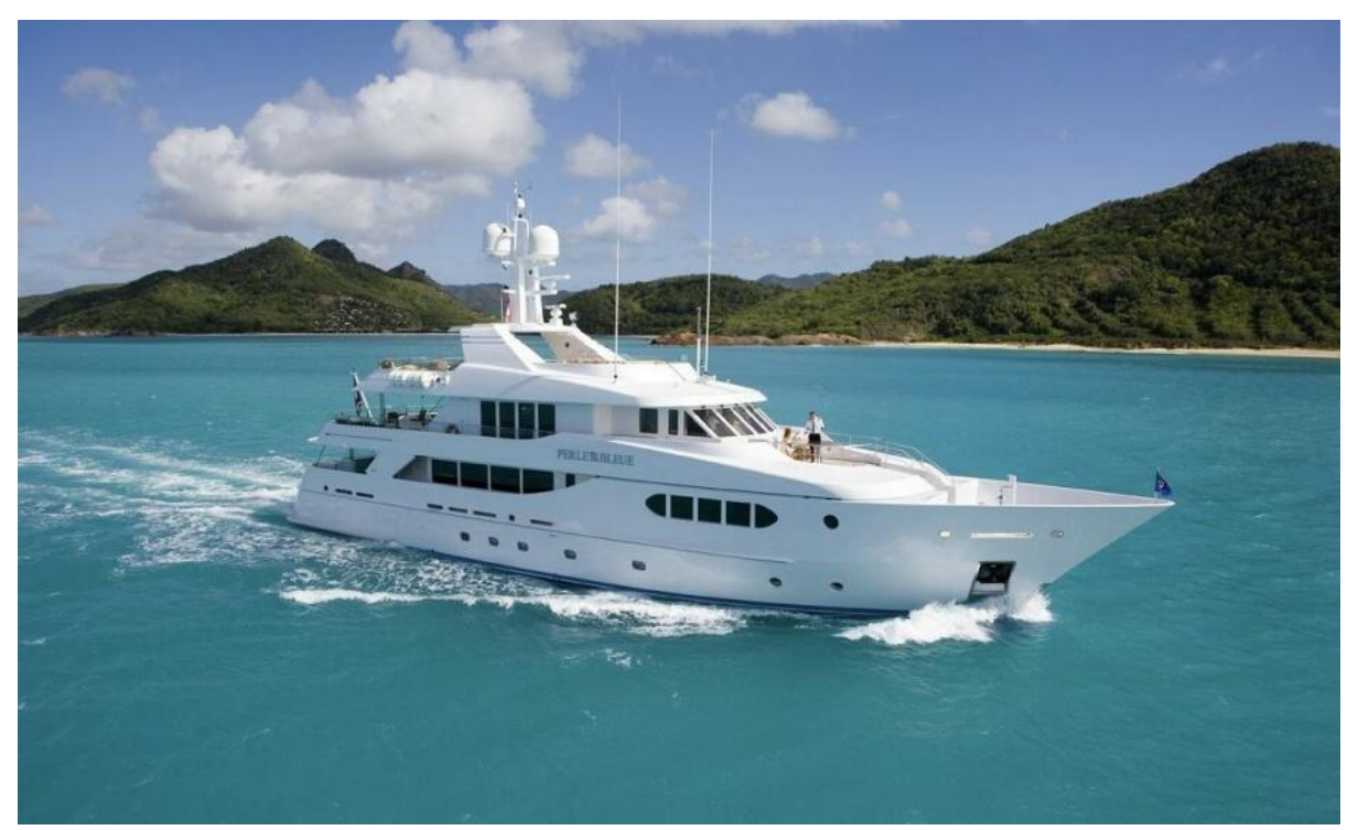
124' Hakvoort 2007 PERLE BLEUE Profile