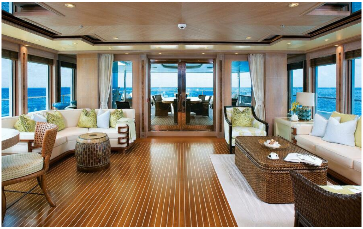
124' Hakvoort 2007 PERLE BLEUE Sky Lounge_2