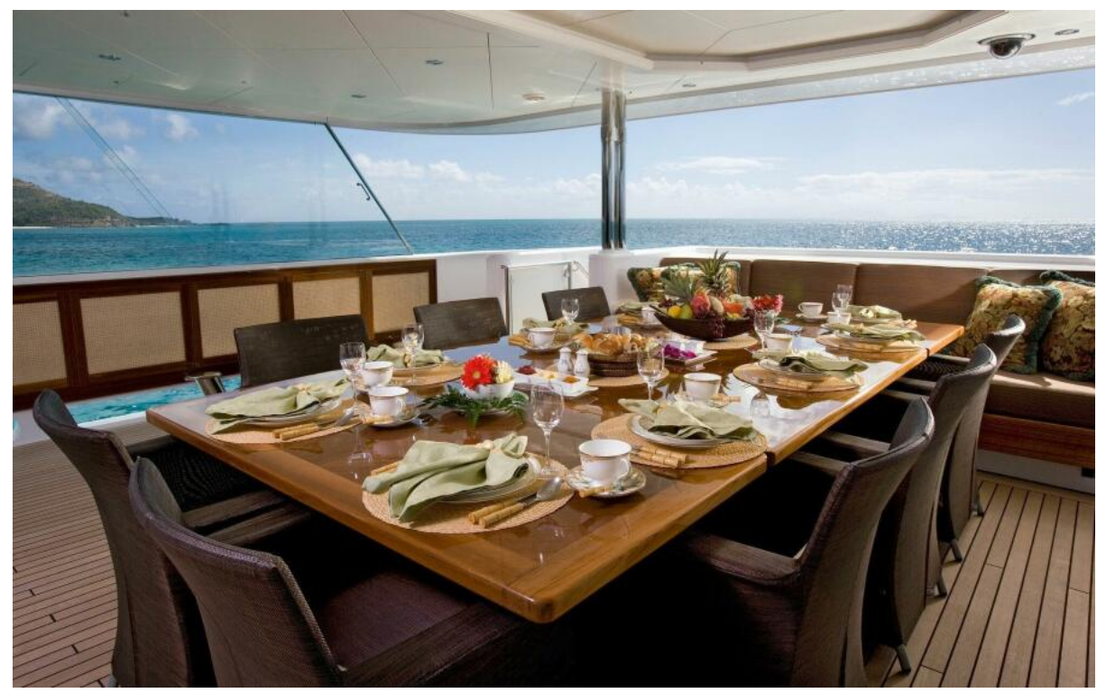
124' Hakvoort 2007 PERLE BLEUE Main Deck Aft