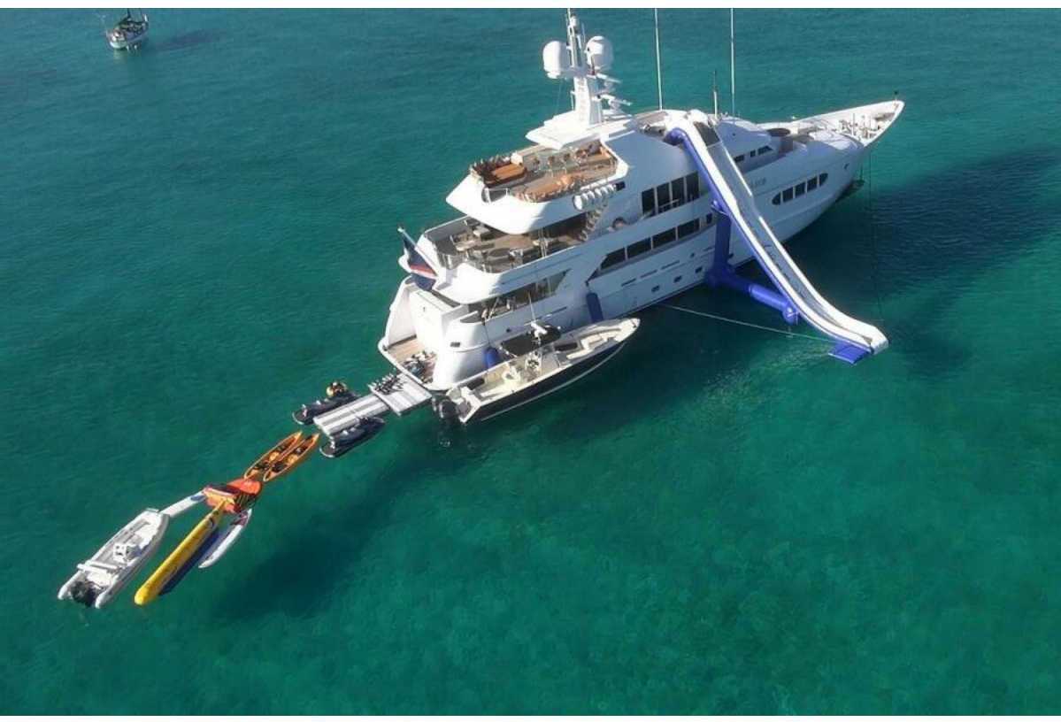
124' Hakvoort 2007 PERLE BLEUE Aerial