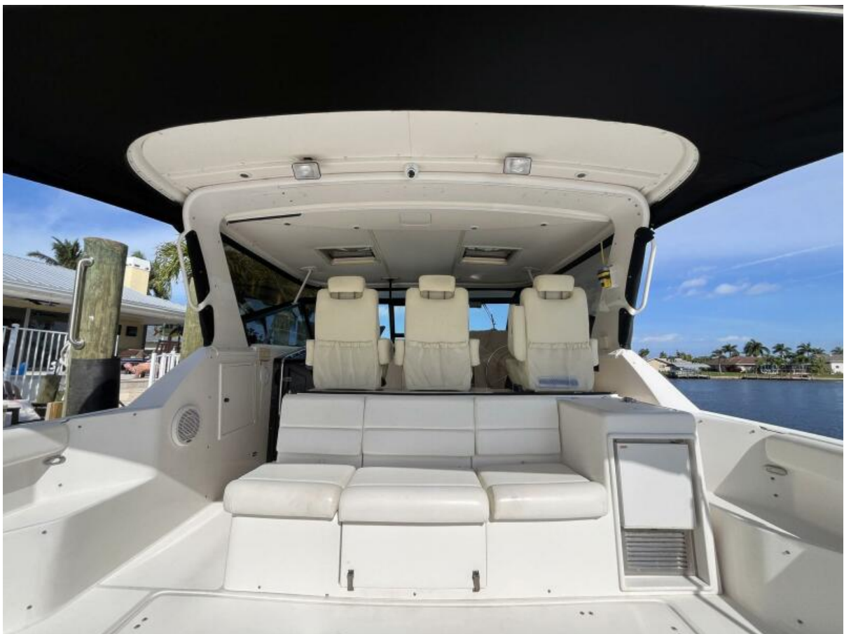
Aft Facing Seats