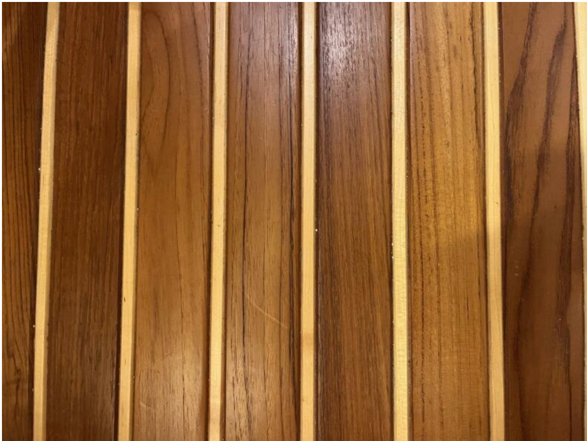
Solid Teak And Holy Sole