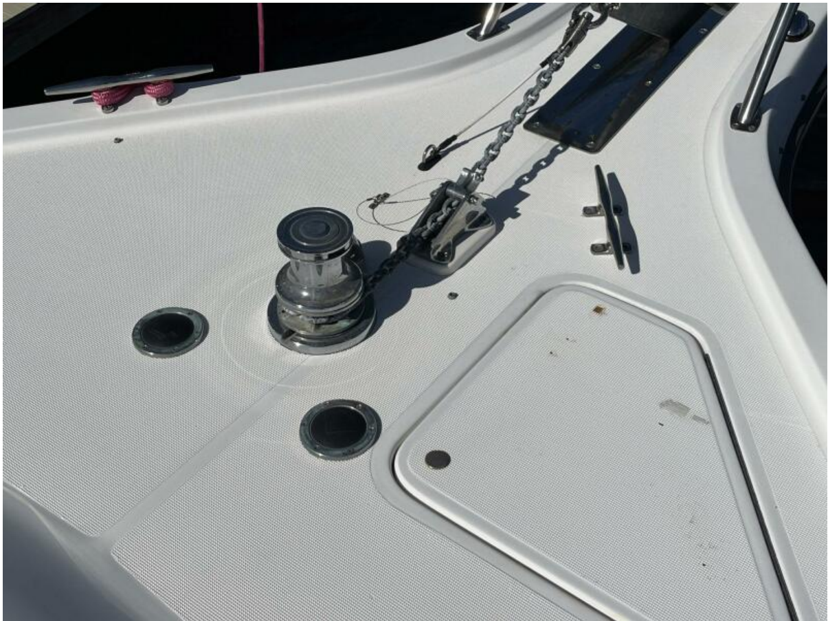
Windlass And Foot Controls