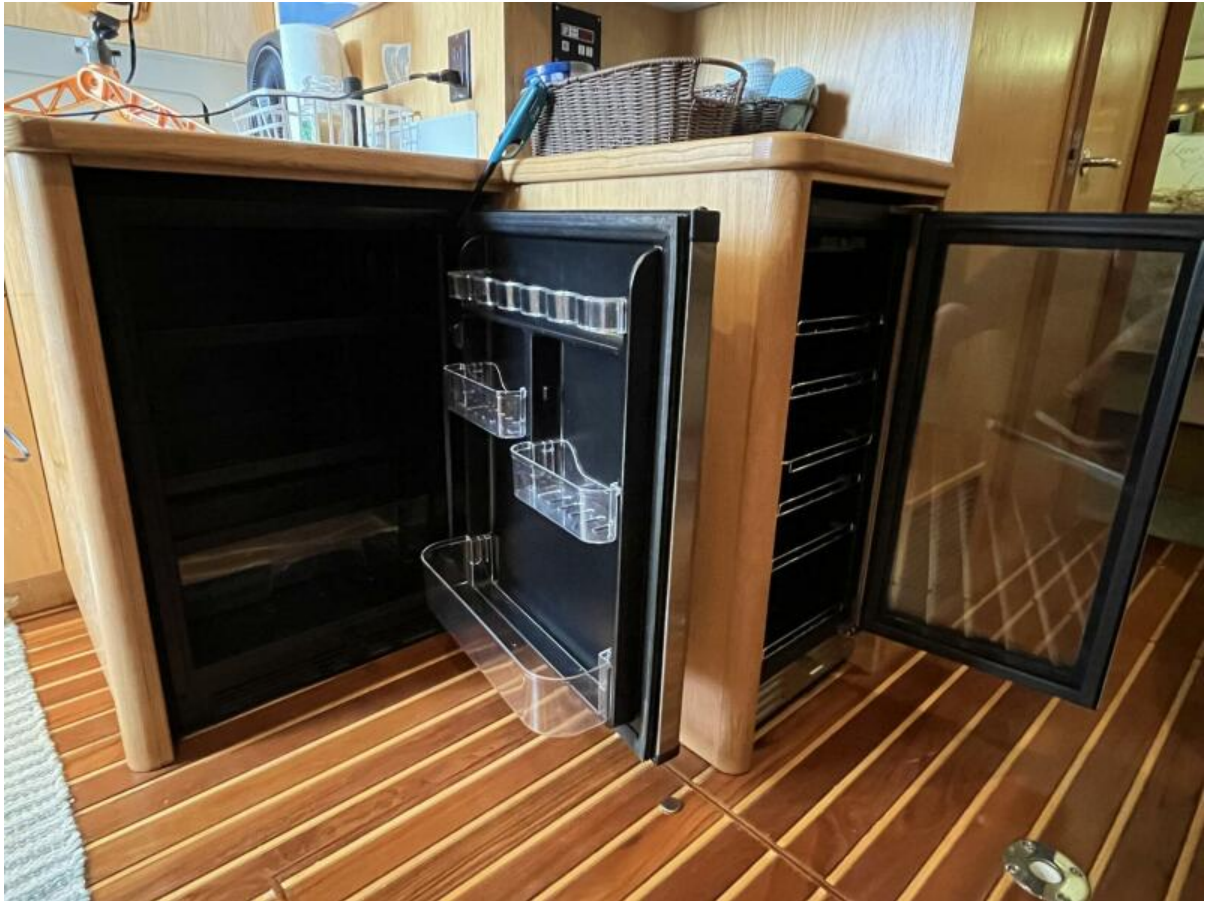
Fridge And Wine Cooler