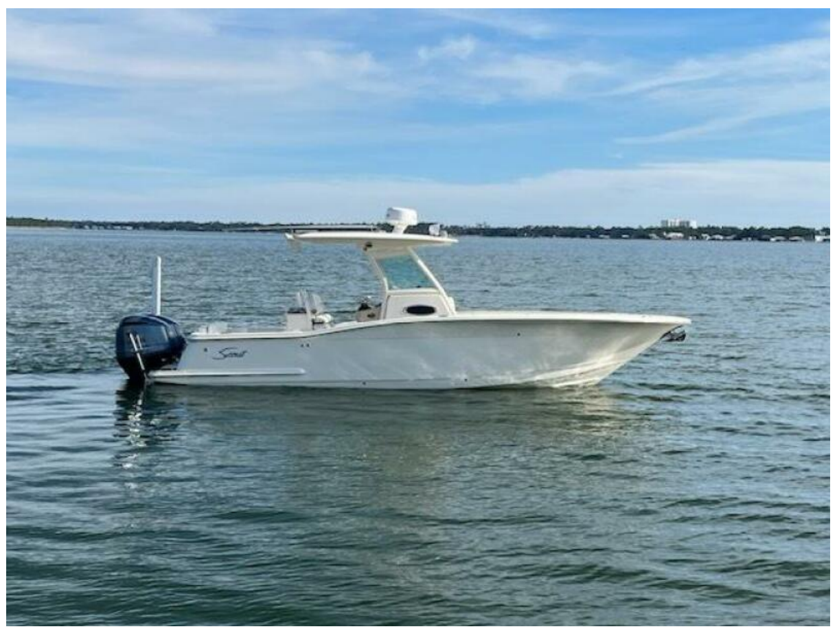
2012 Scout 275 XSF STBD Profile