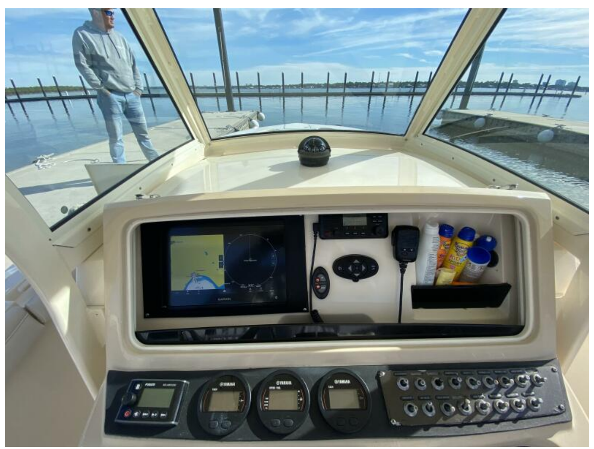
2012 Scout 275 XSF Helm 1