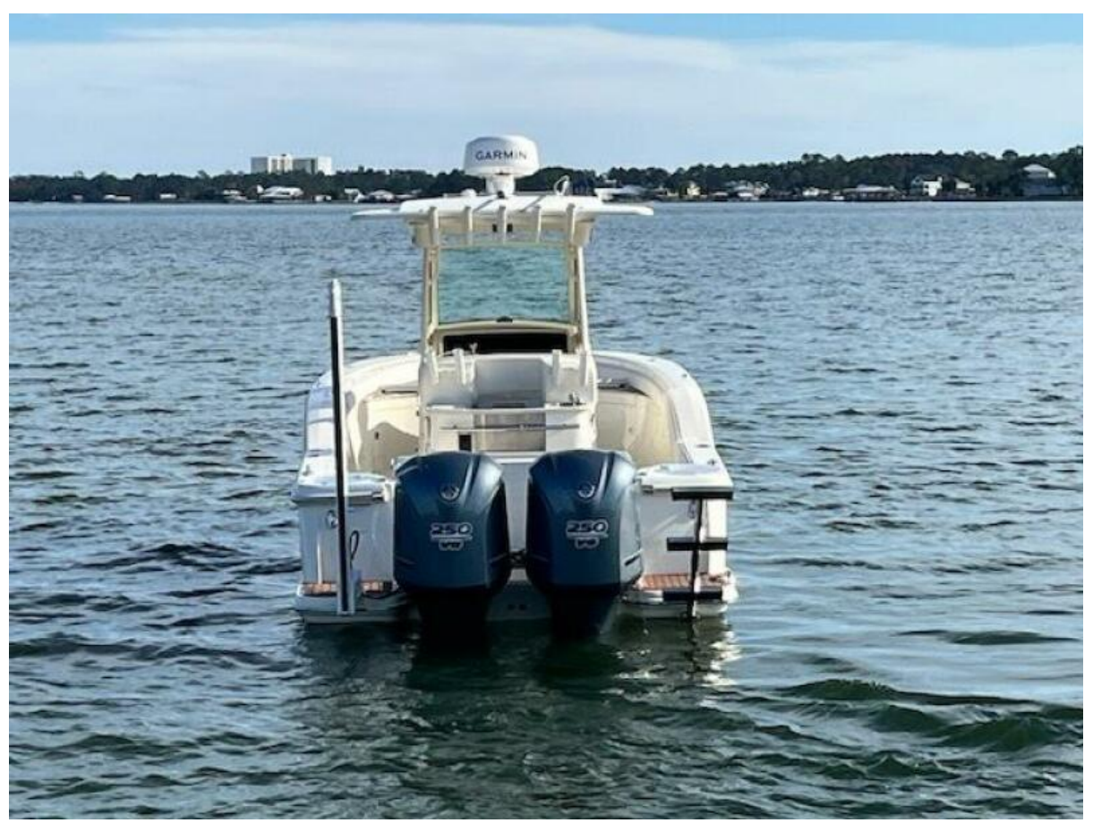
2012 Scout 275 XSF Transom 2