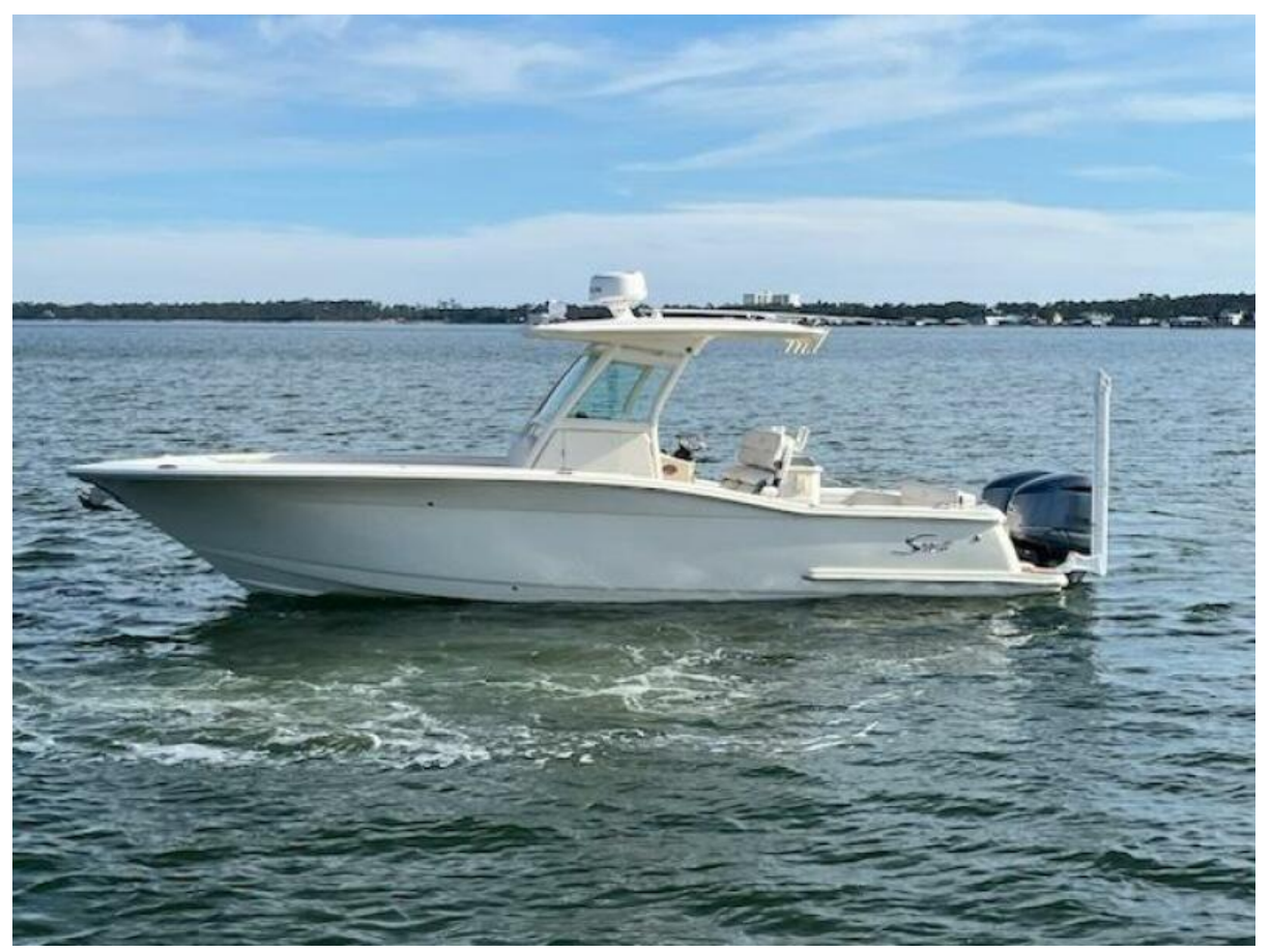
2012 Scout 275 XSF Port