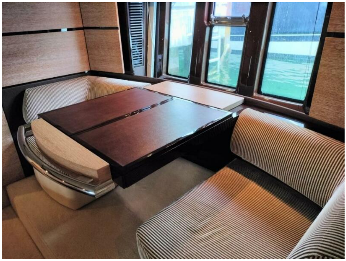
Master Stateroom Settee