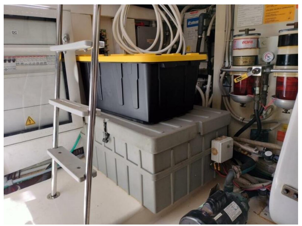
Engine Room Storage