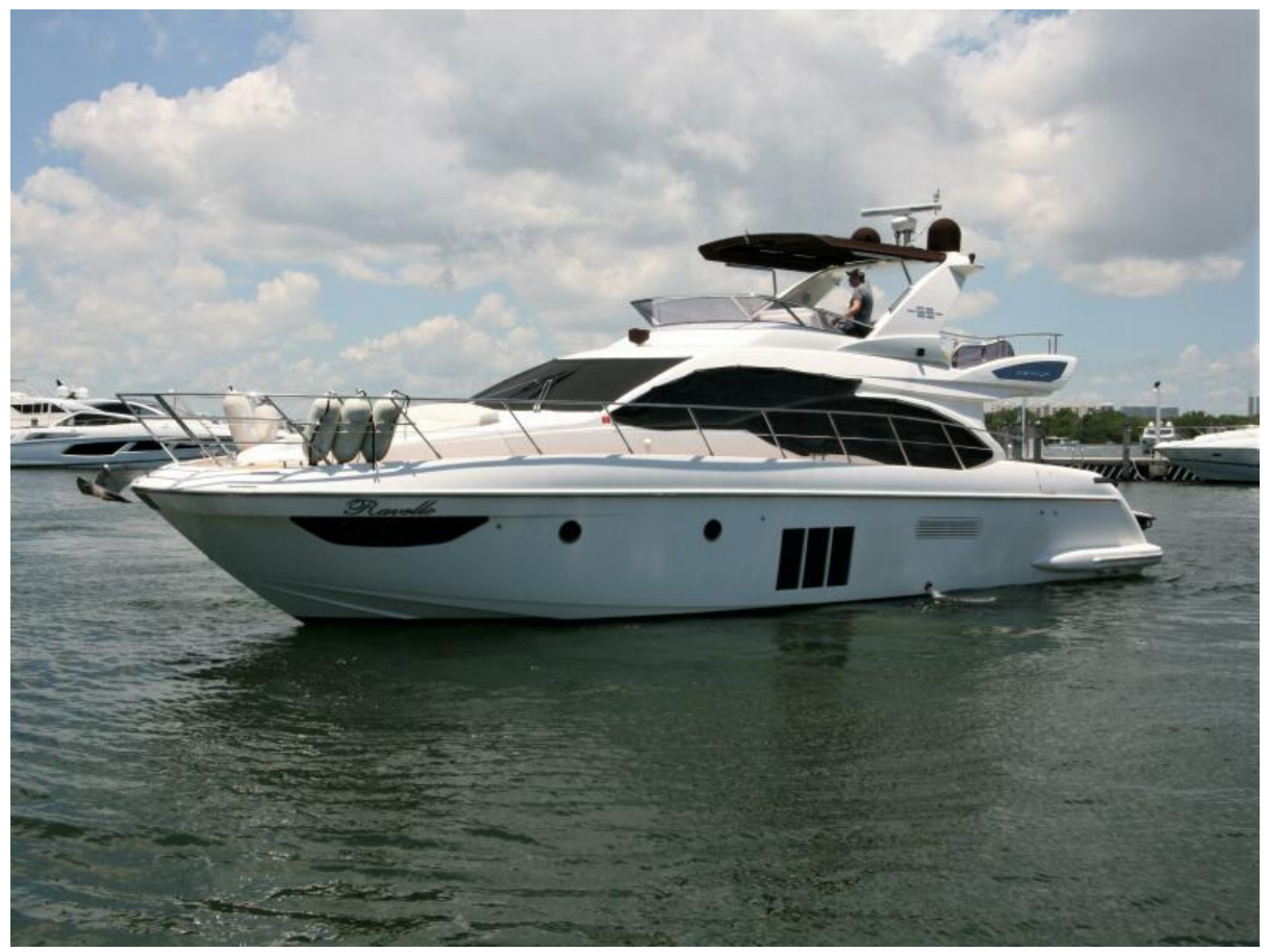
Ravello 2011 53' Azimut