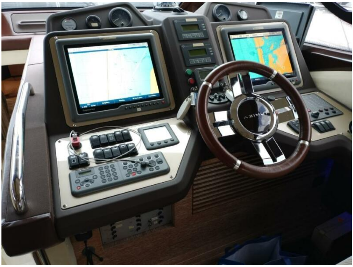
Ravello Lower Helm 2