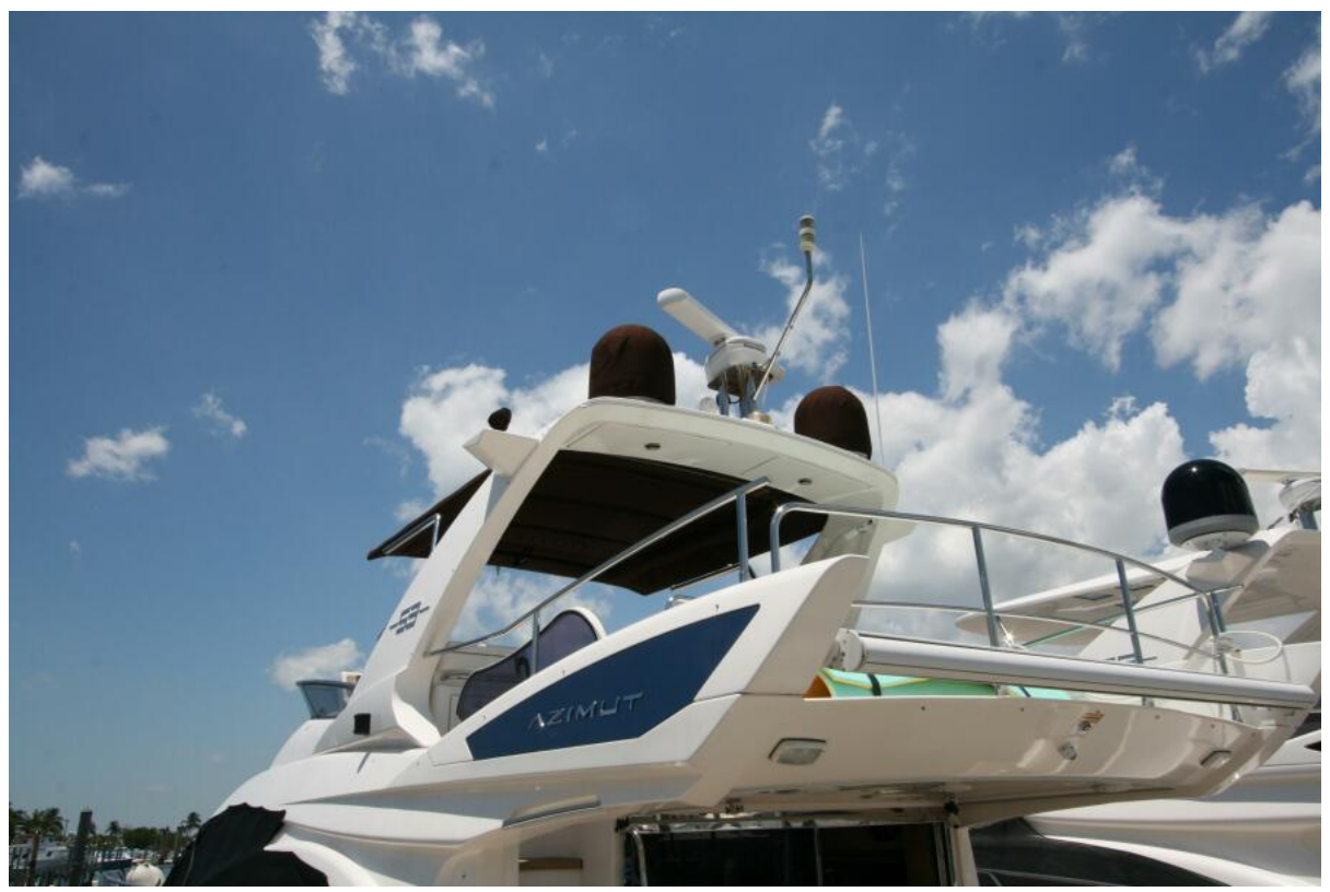
Flybridge Aft View