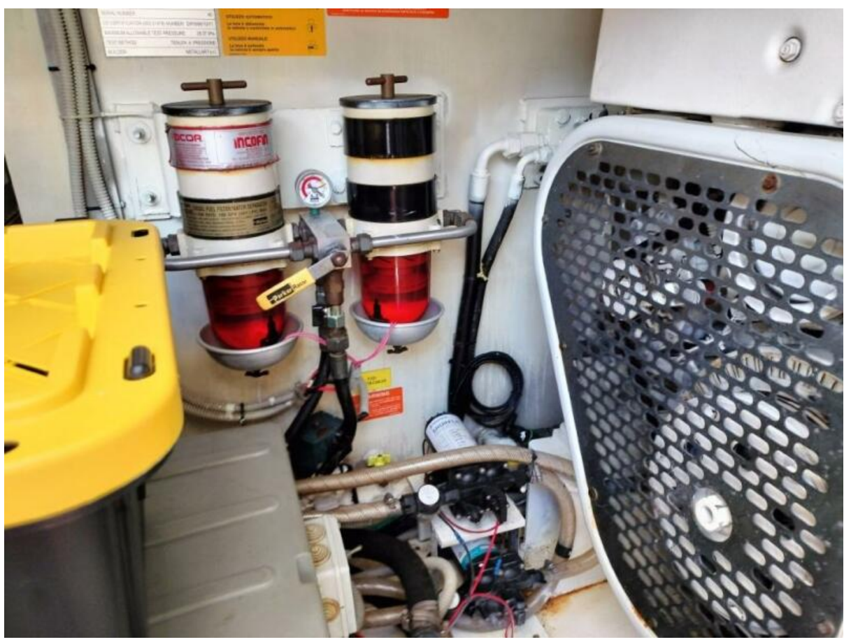
Engine Room Filters