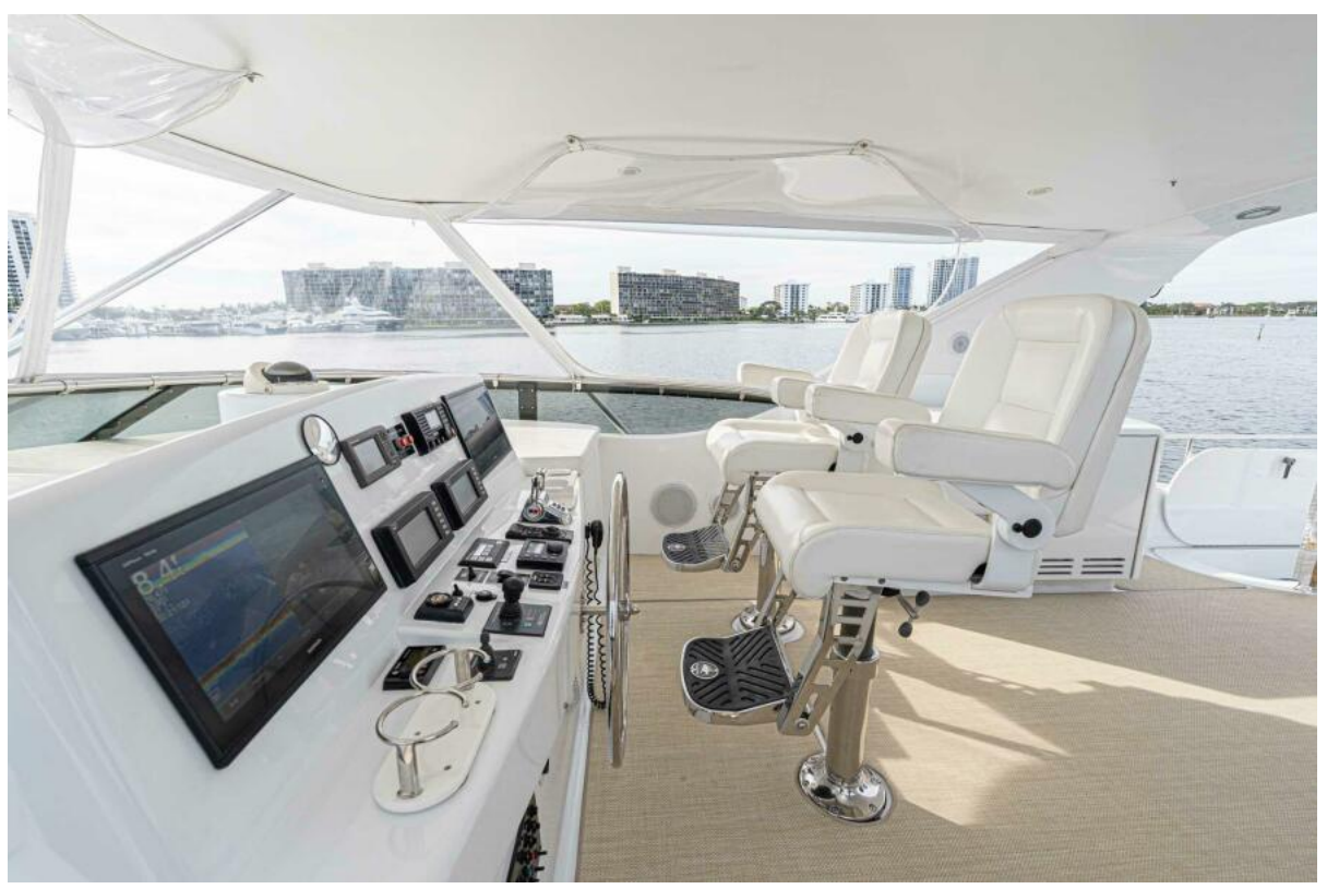
Flybridge Helm Station