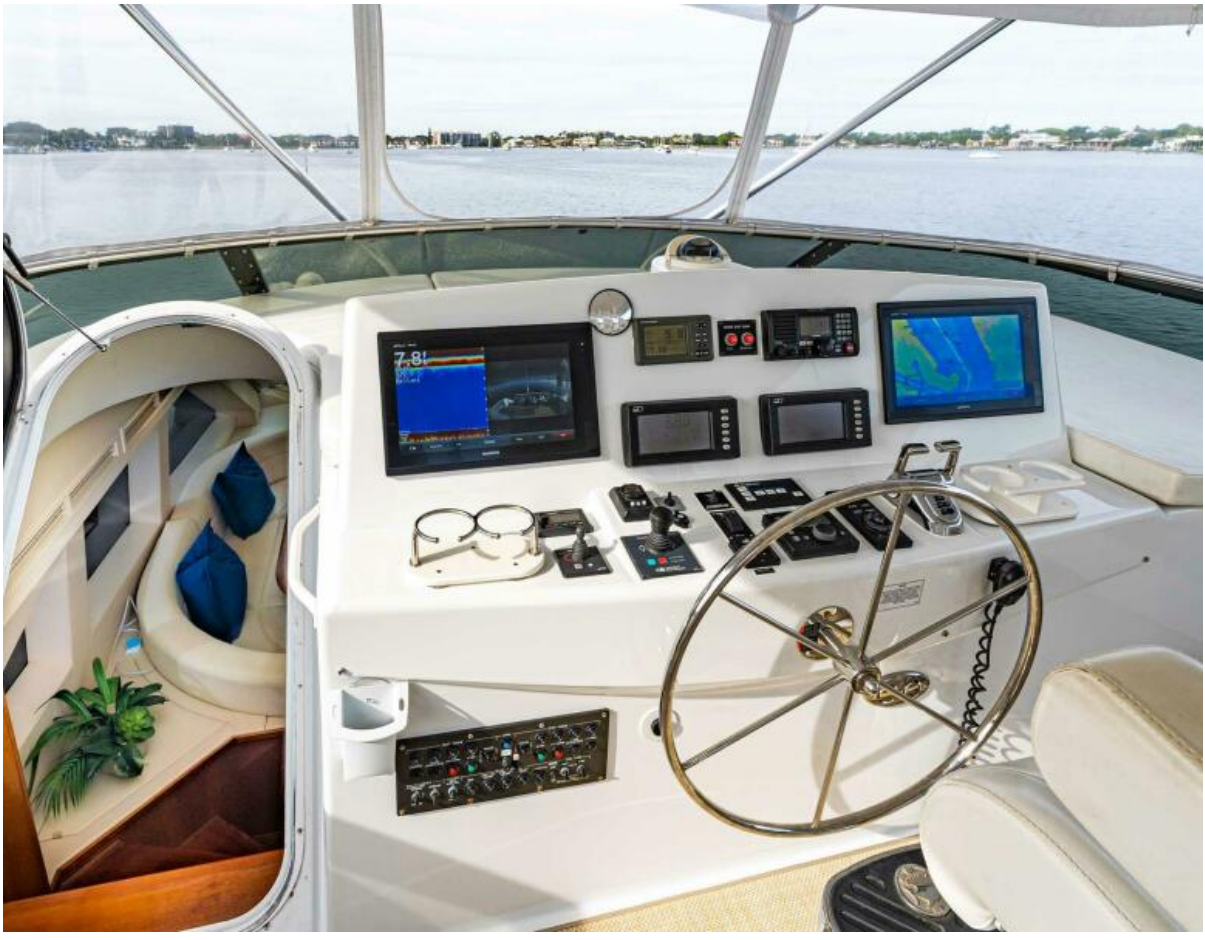
Flybridge Helm Station