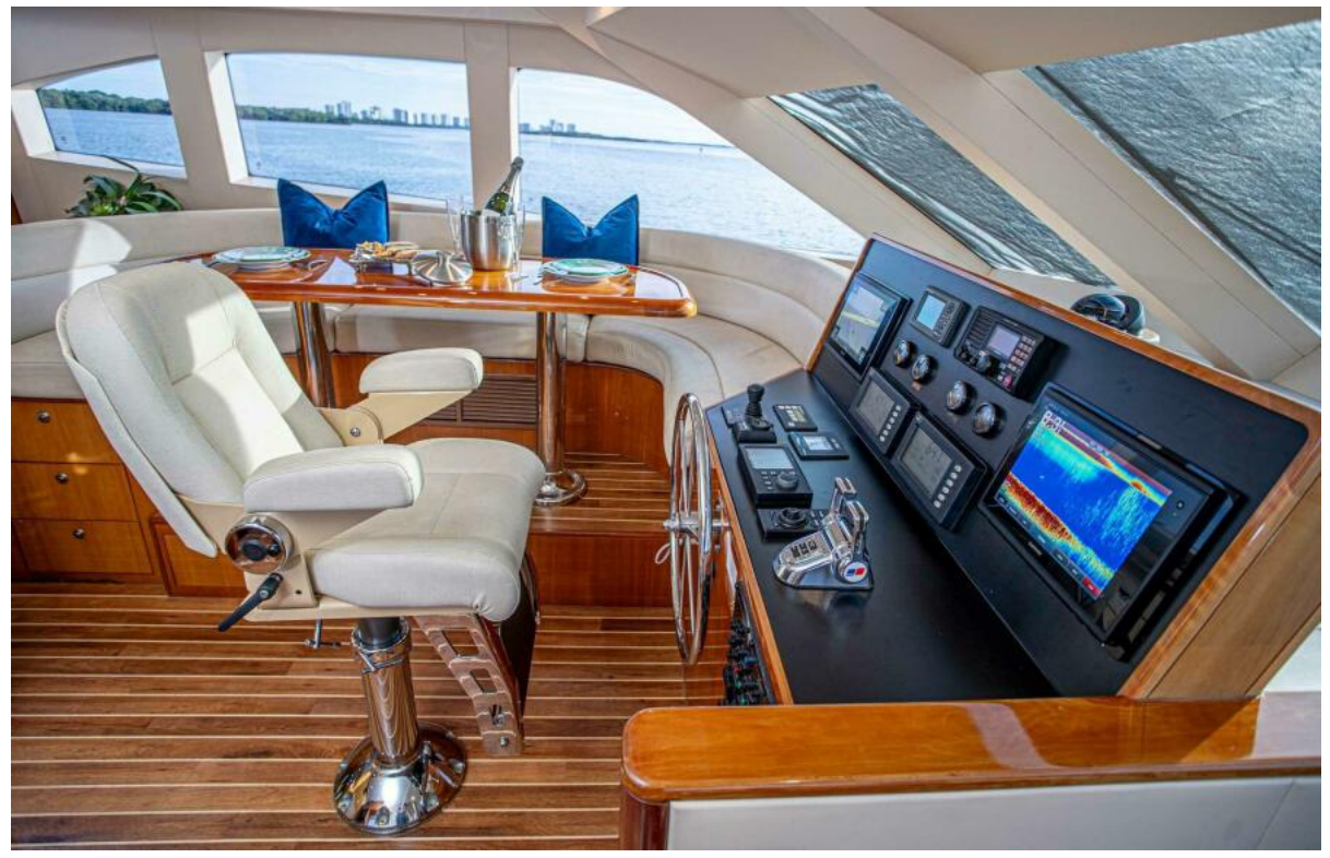
Lower Helm and Dinette