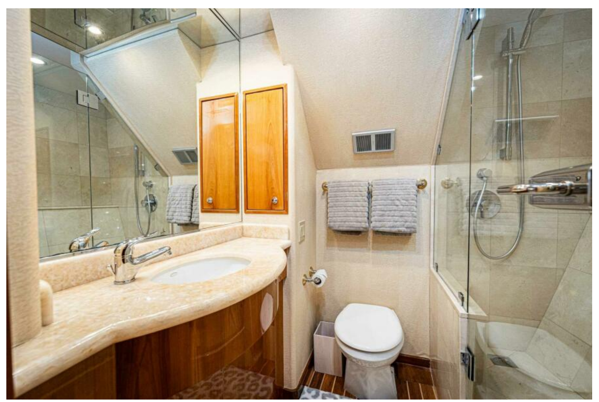
Owner's Ensuite Head