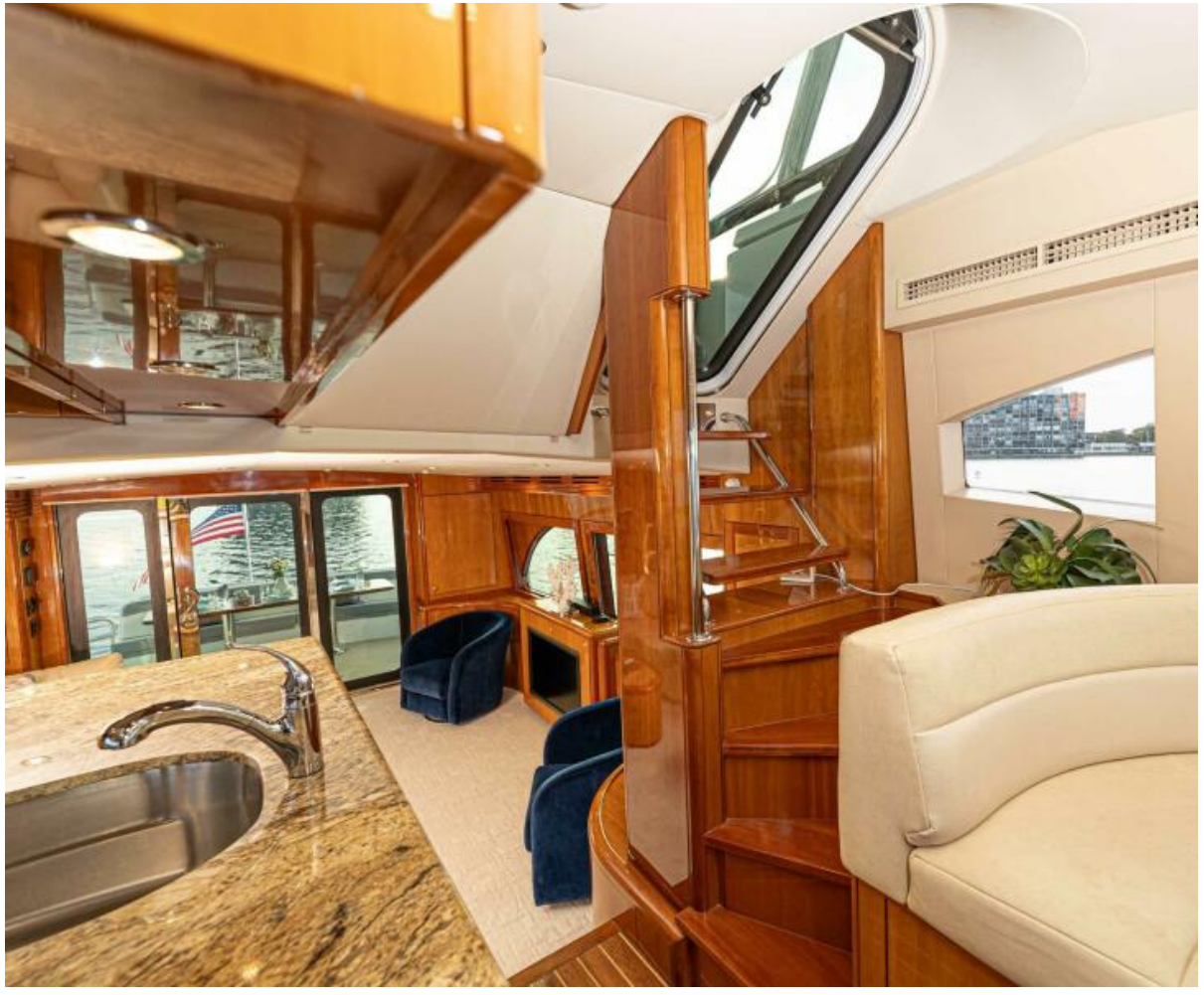
Galley and Dinette