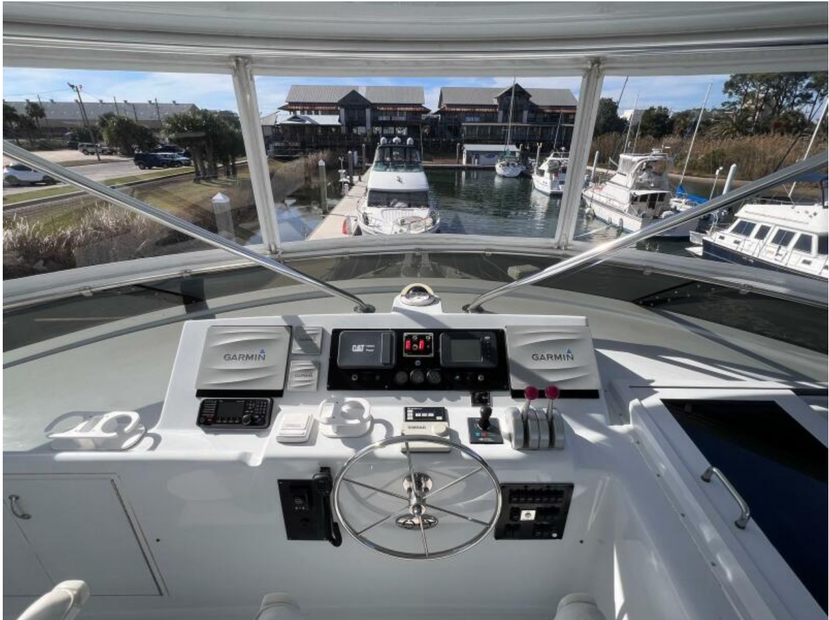
63. FB 2