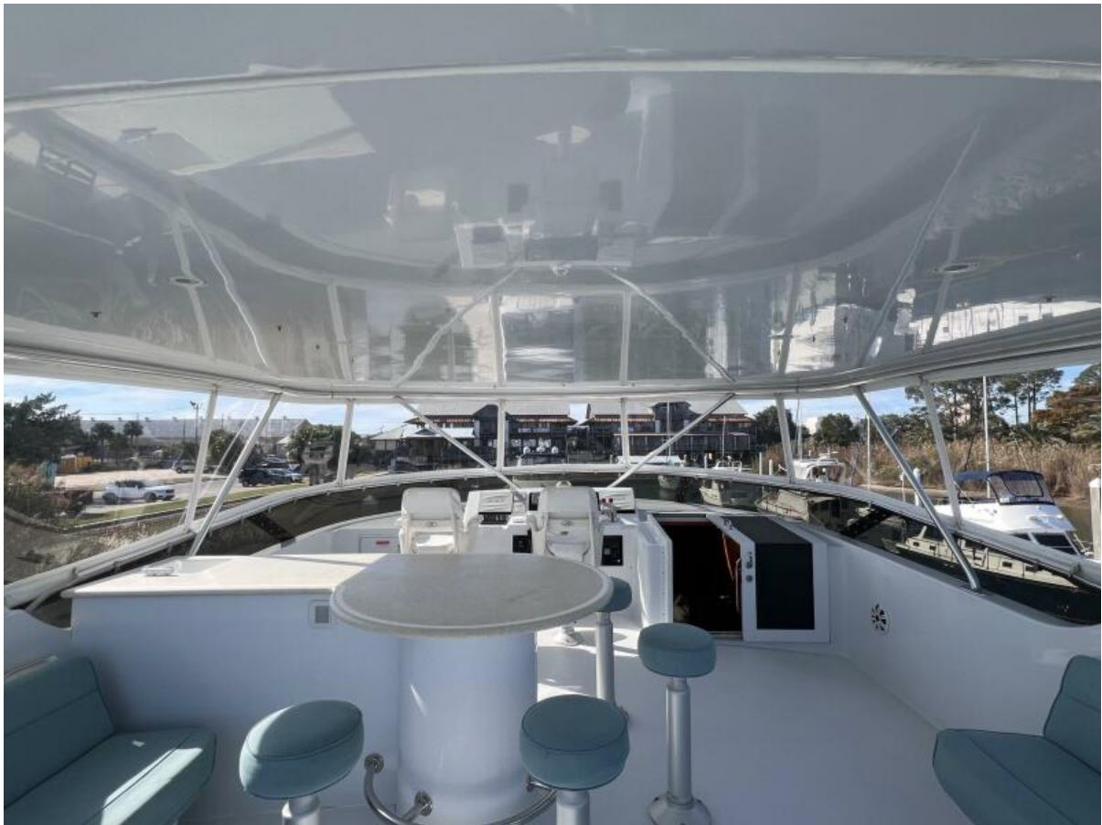
64. FB 8