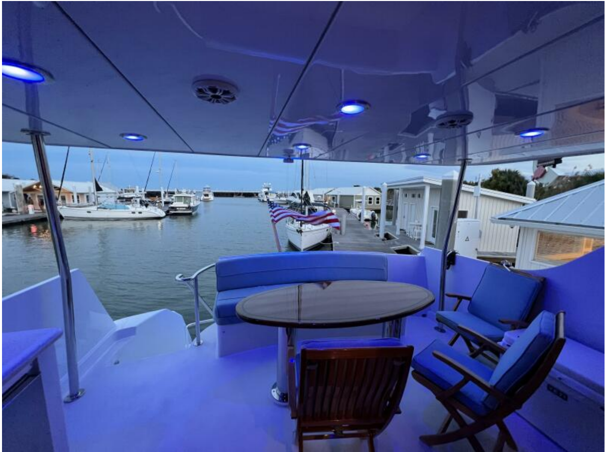
14. Aft Deck Lights