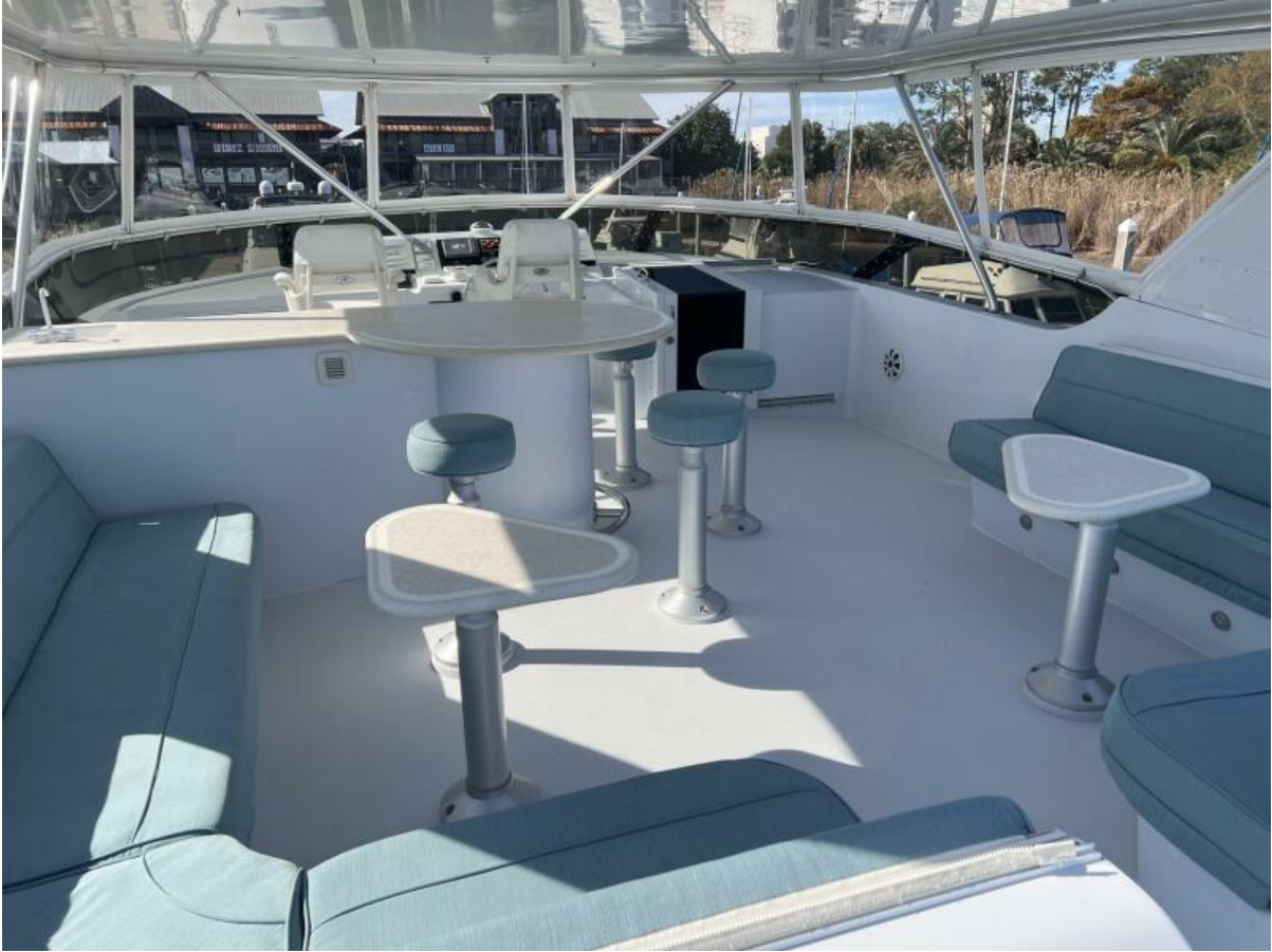
60. FB 1