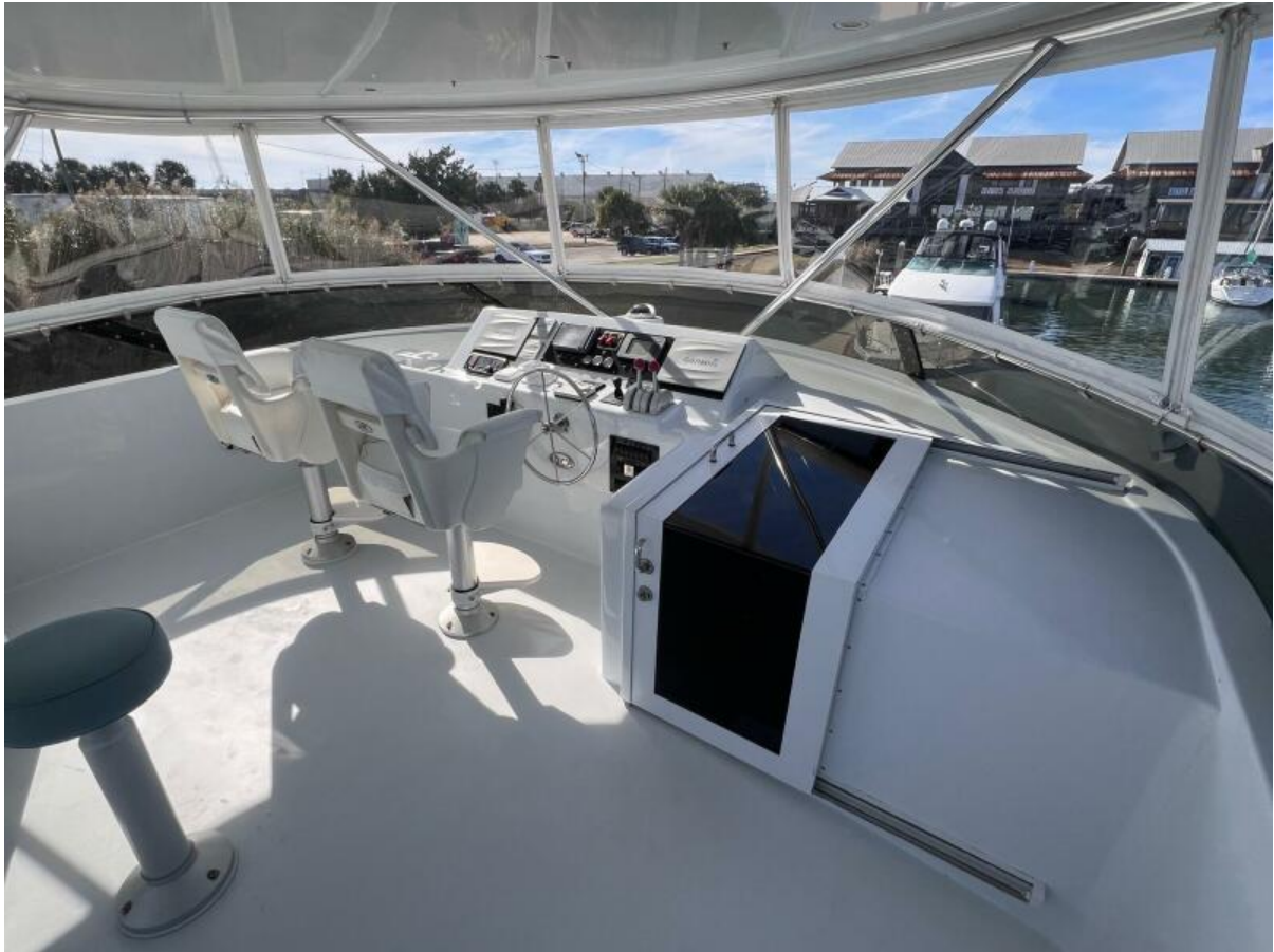
64. FB 5