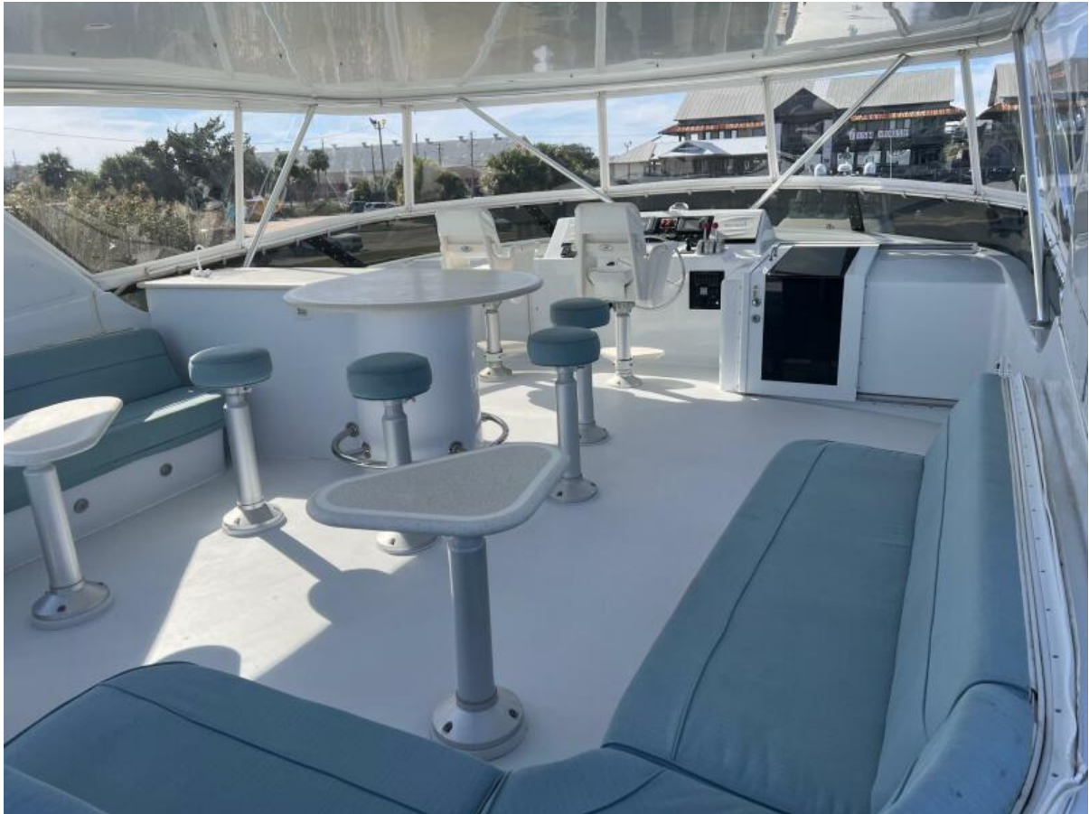
60 FB 1