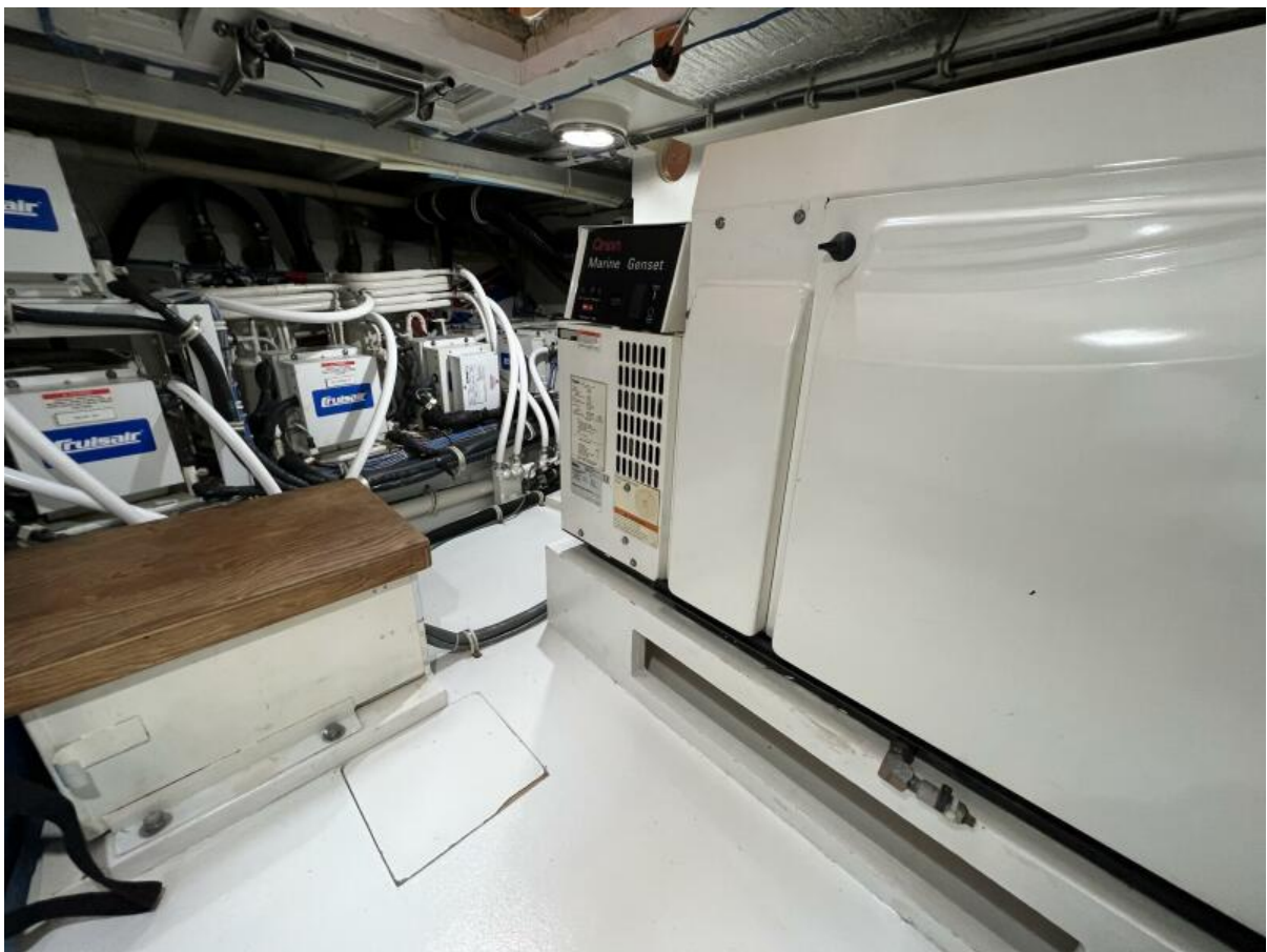
98. Gen Room