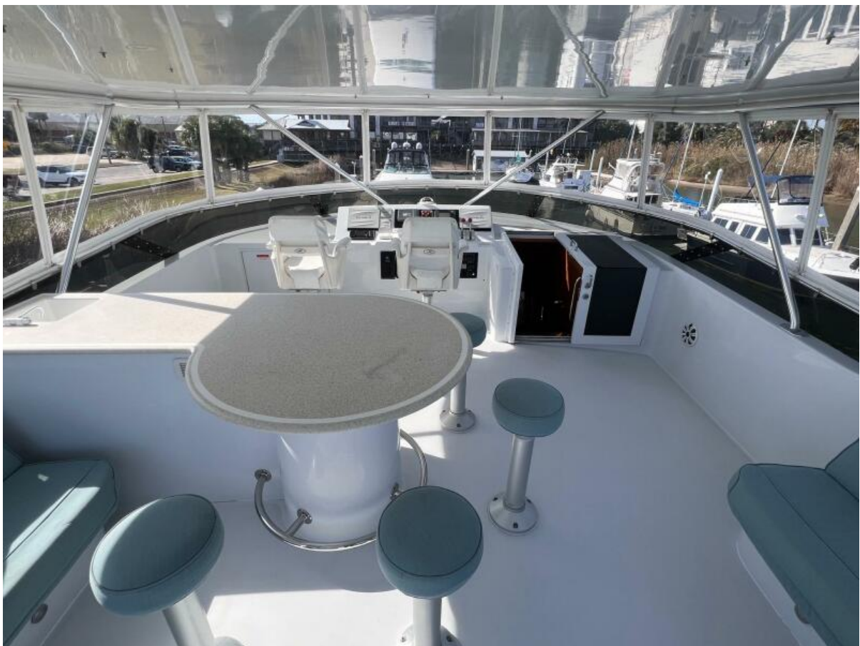
64. FB 7