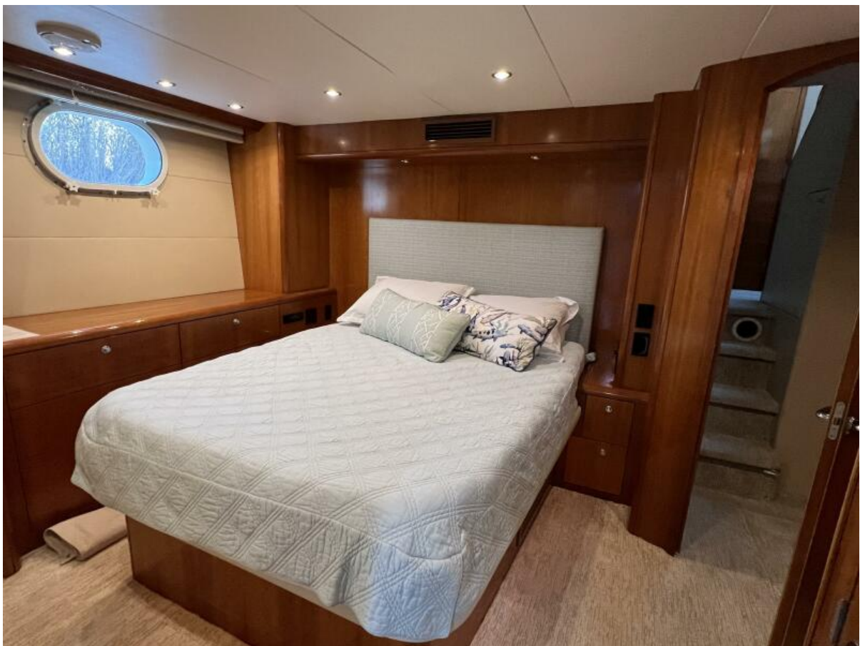
52. Mid VIP