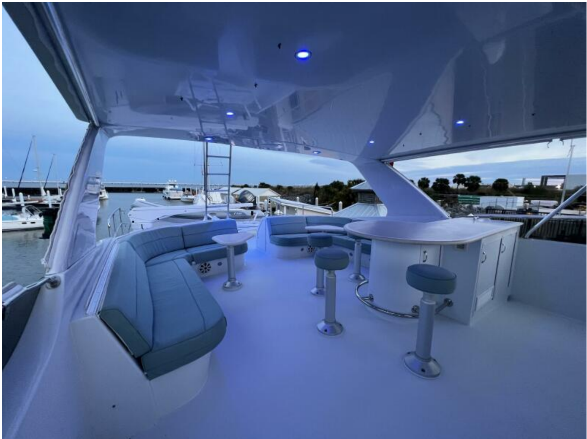
67. FB Lights