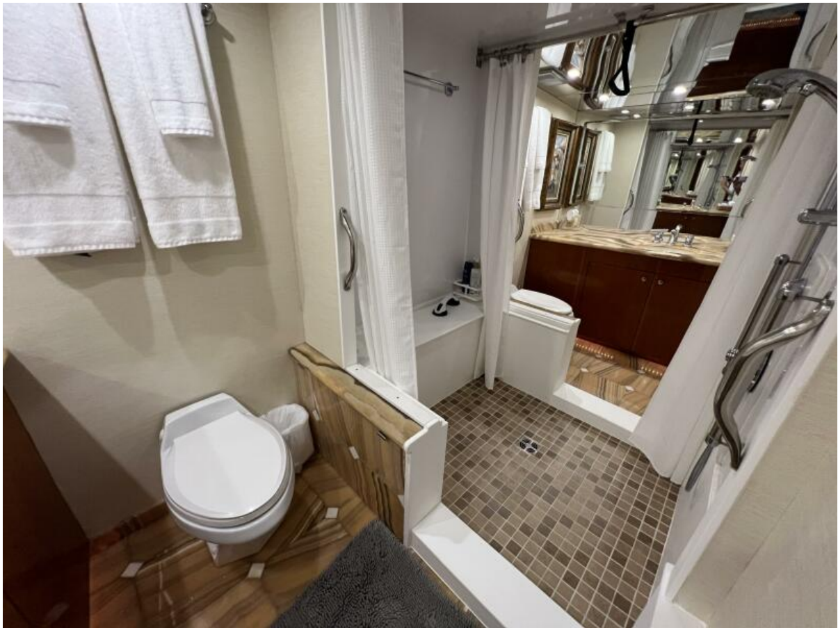
49. Master Head