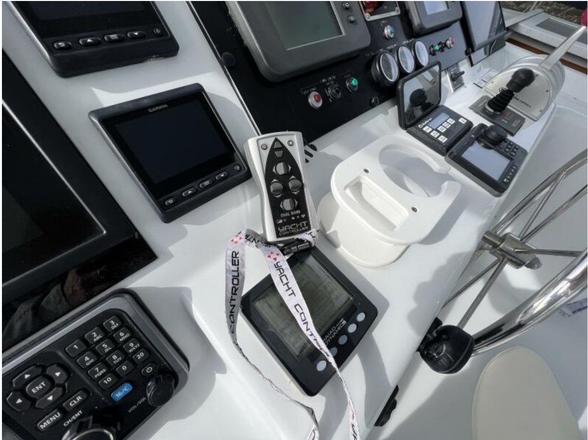
113 Yacht Controller