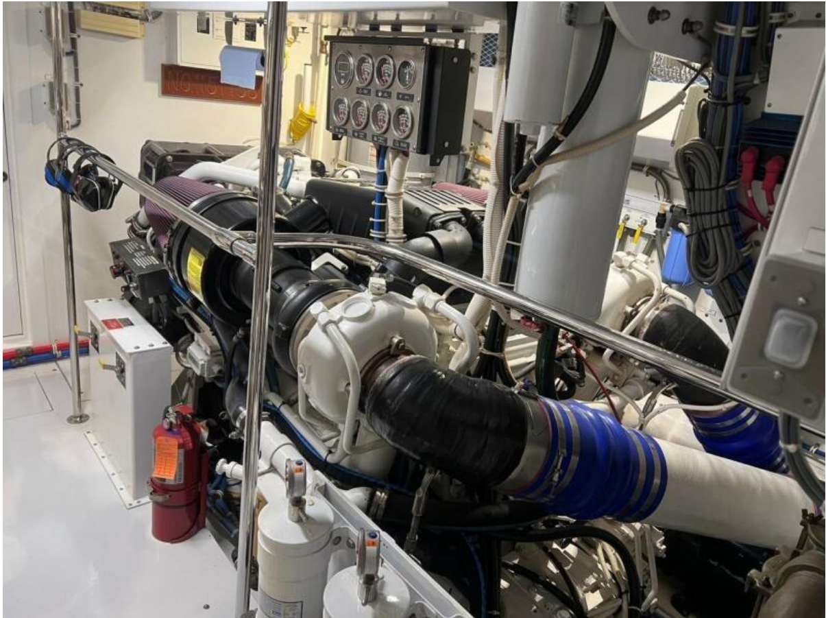
94. Starb Engine Aft