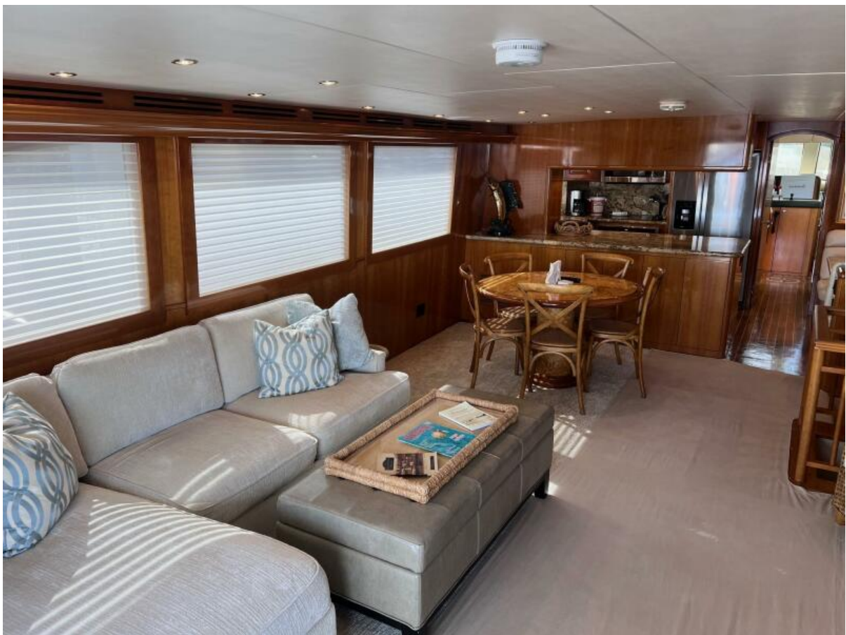
24. Salon 2