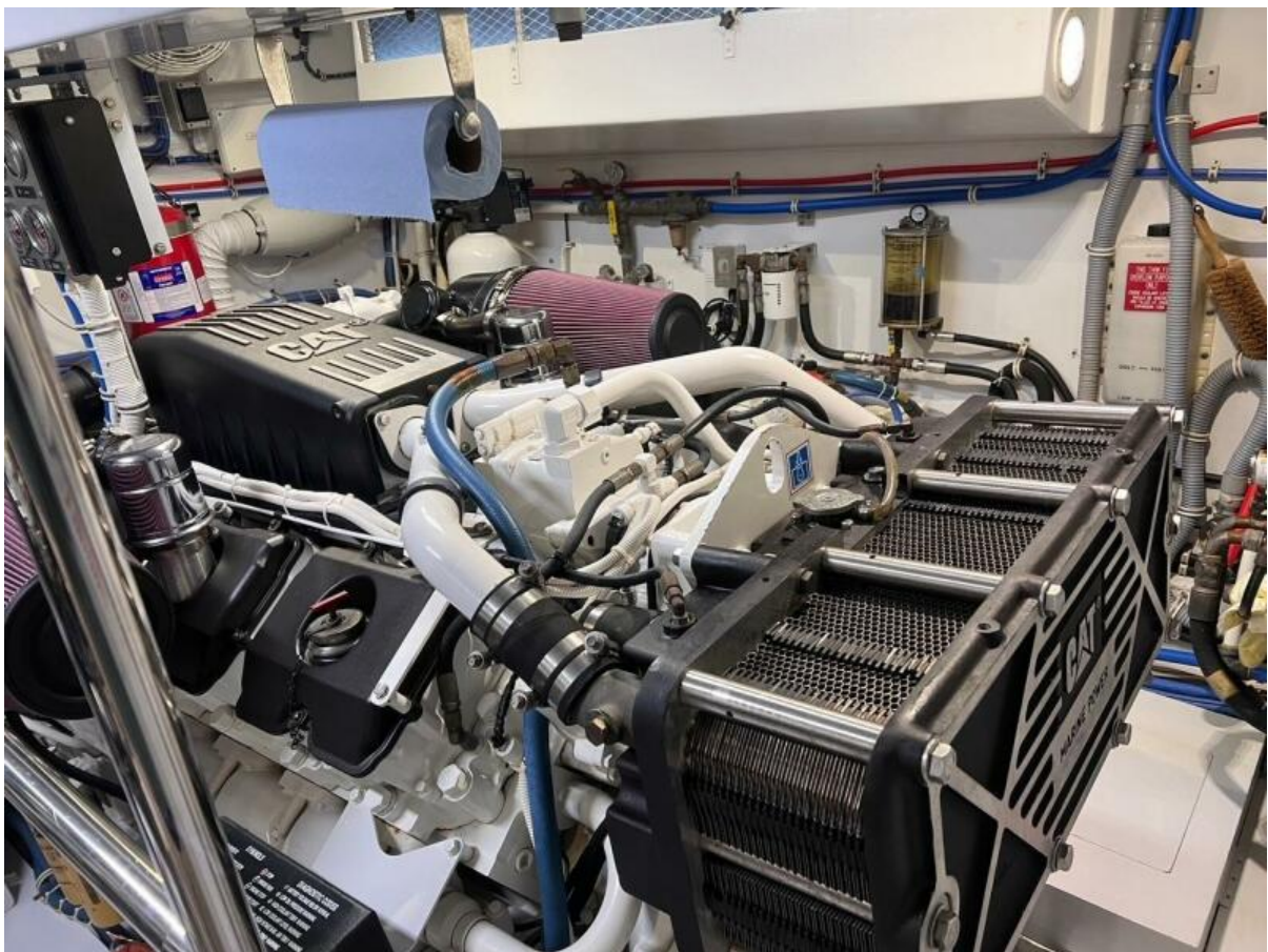
95. Port Eng Fwd