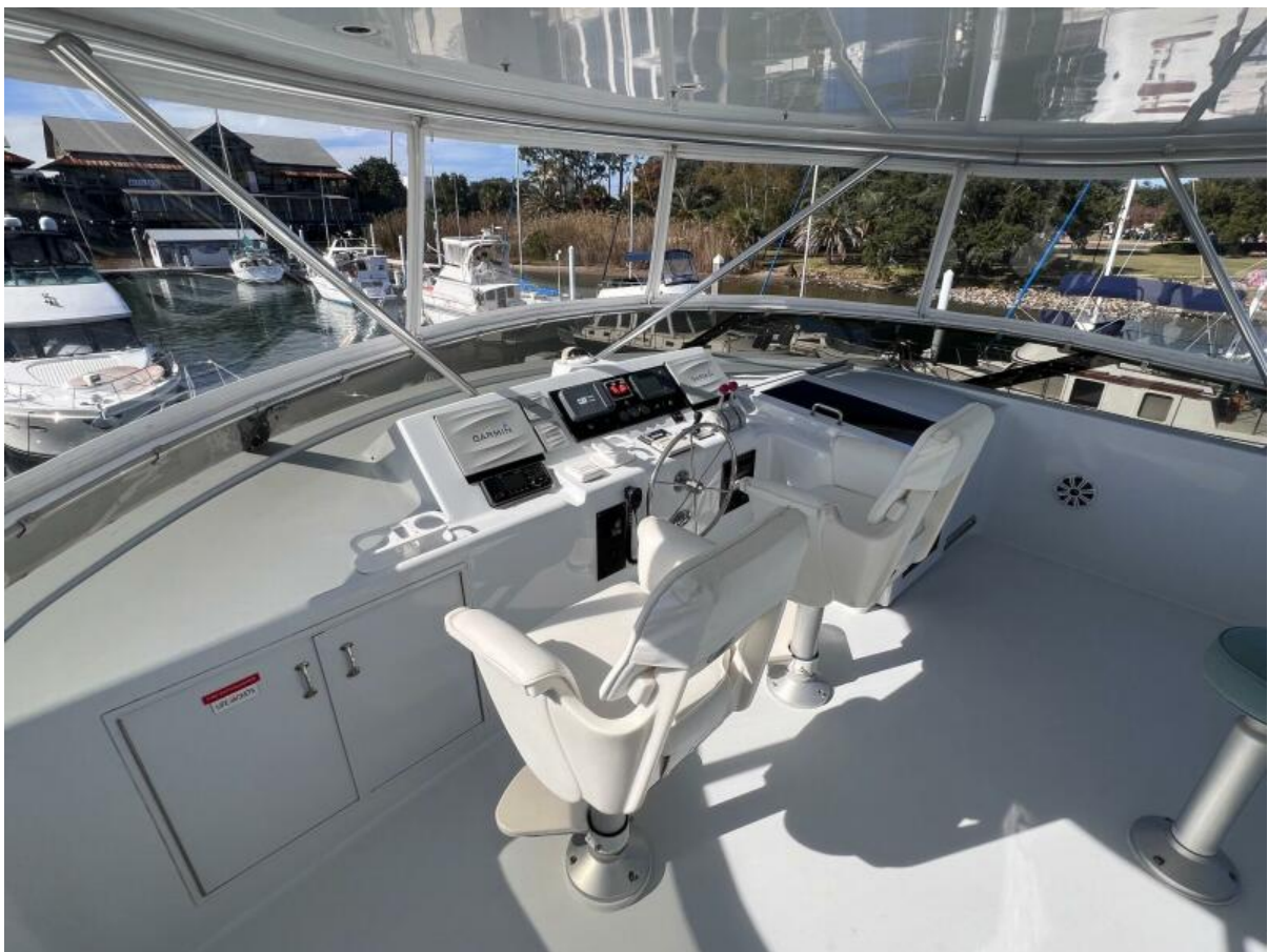
64. FB 3