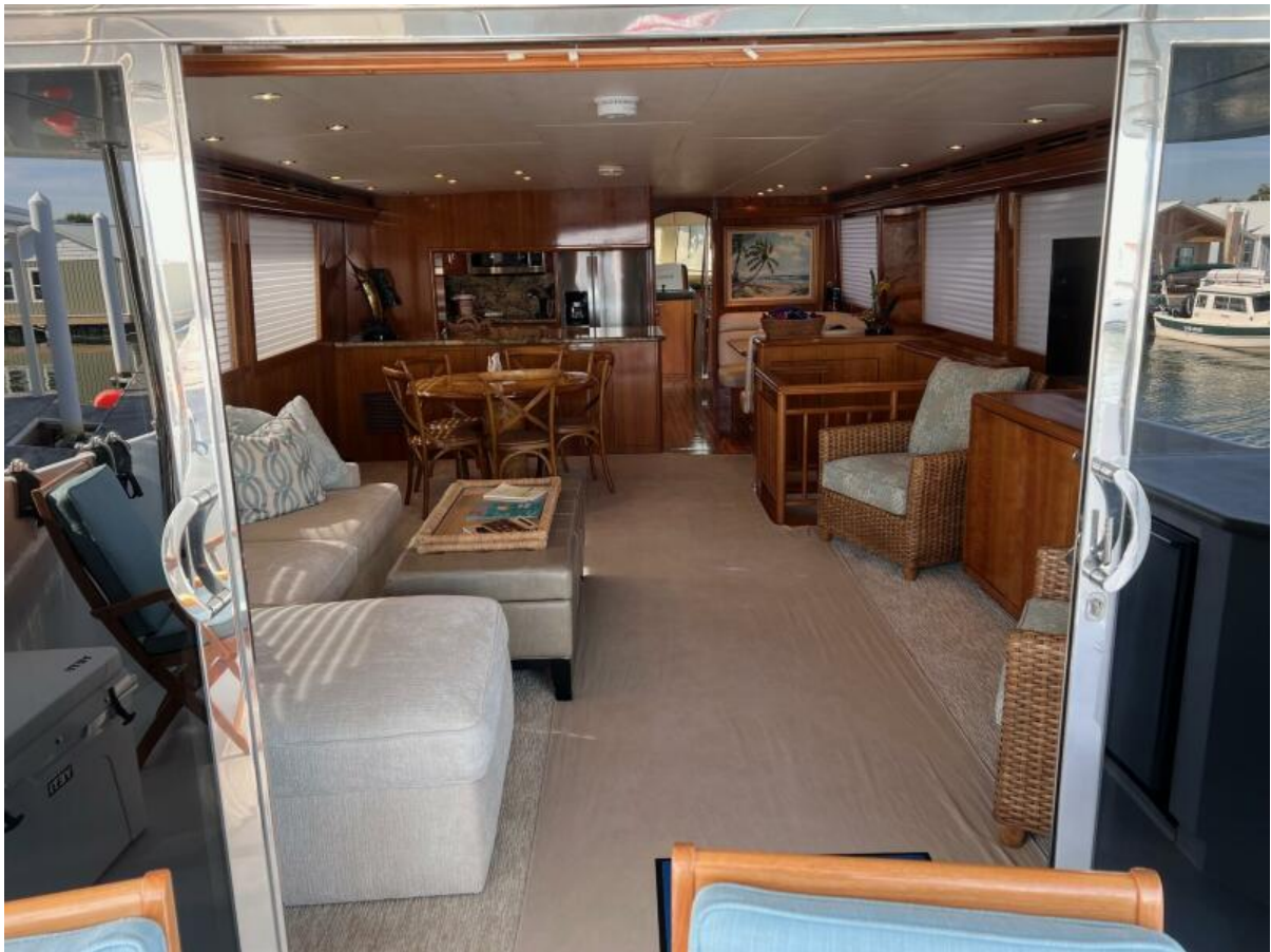
24. Salon From Aft Deck