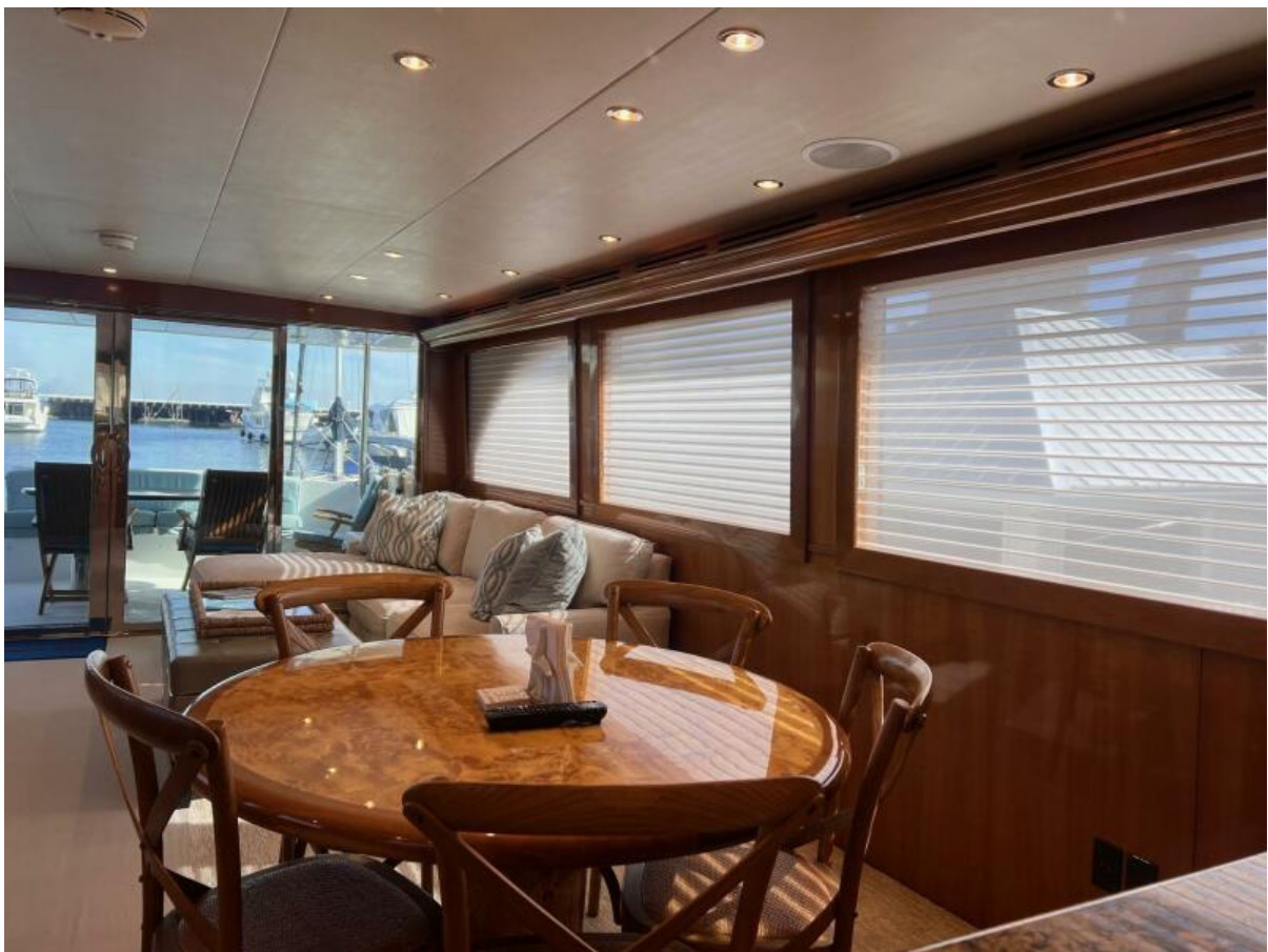
23 Dining Table