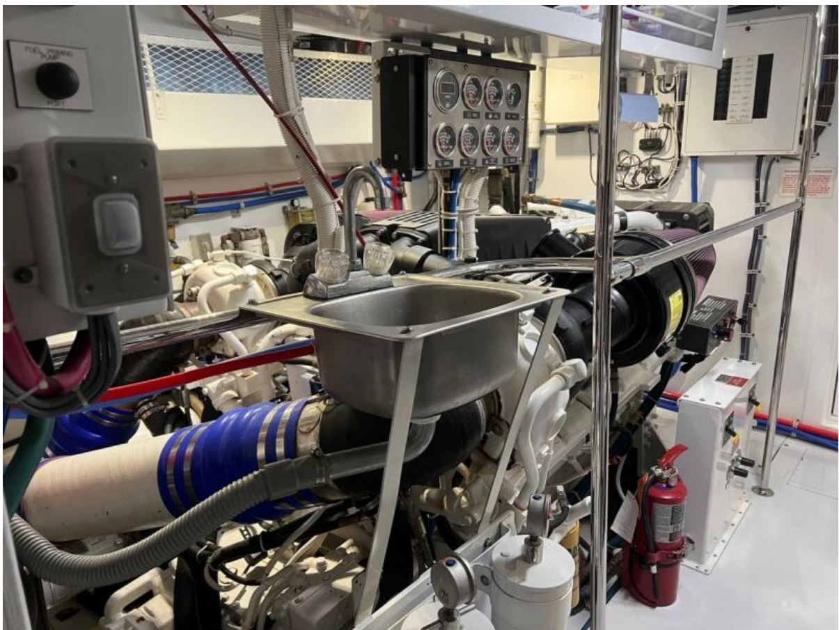
93. Port Engine