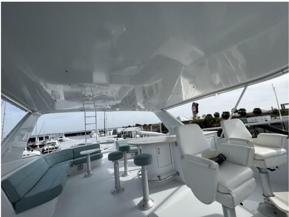
63 Fly Bridge