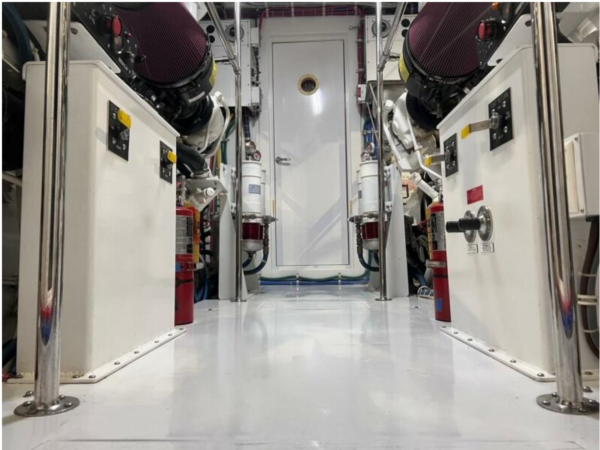
99. Engine Room Floor