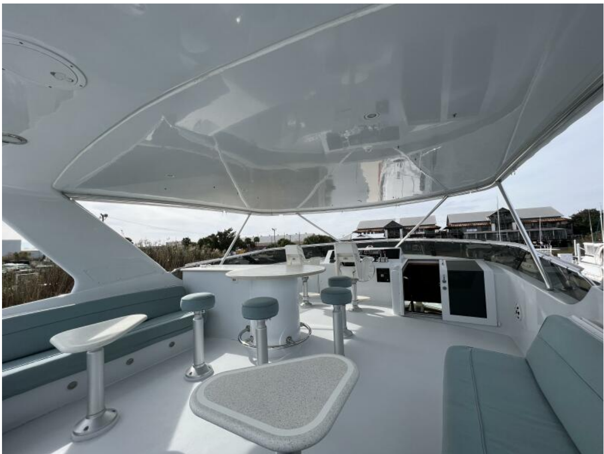
66. Fly Bridge