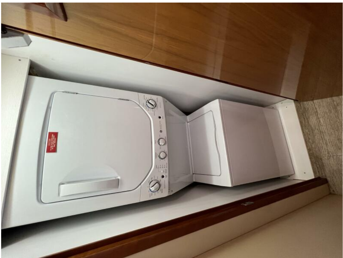
95. New Washer