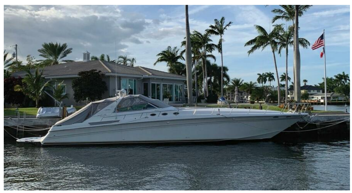
LUCHY, 63' Sea Ray 1995