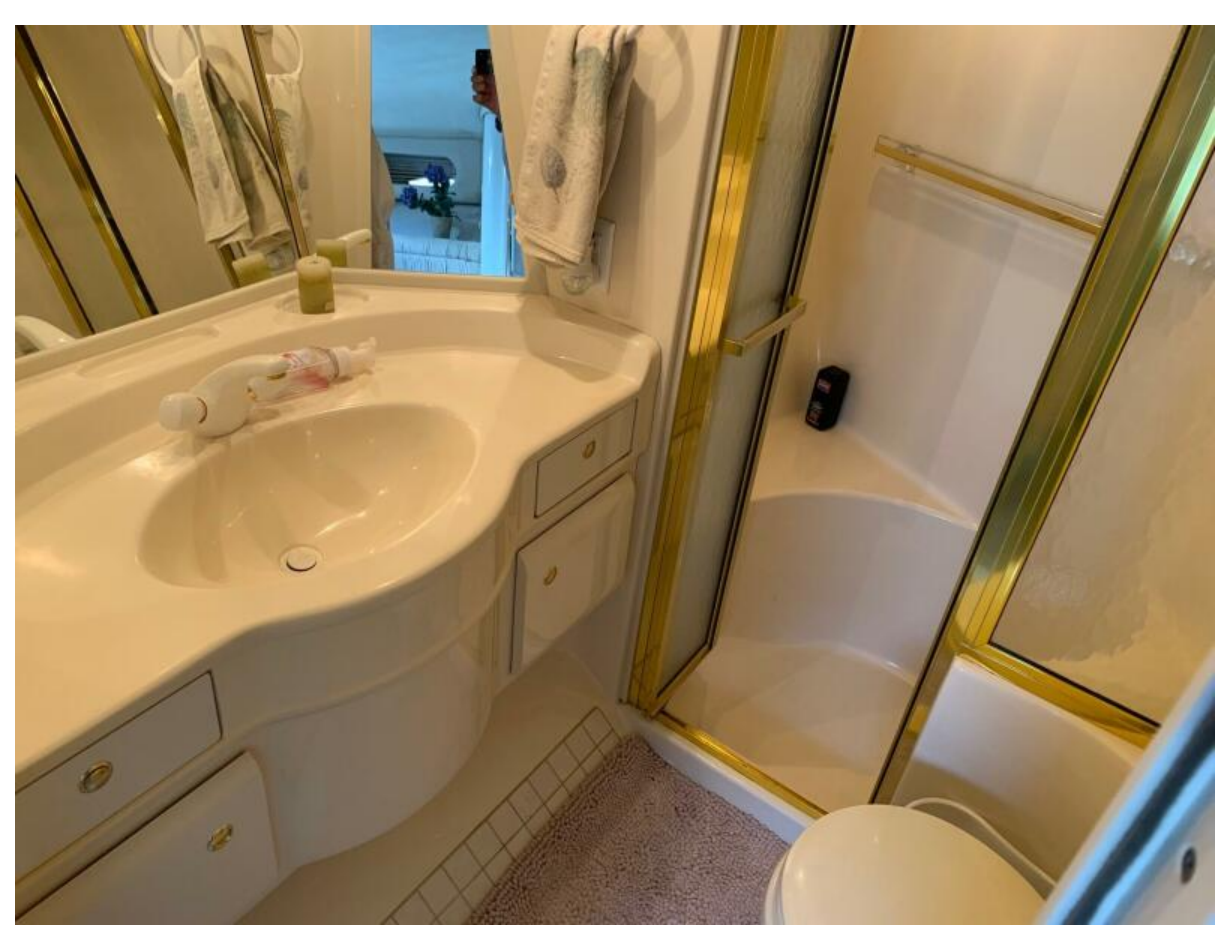
Master Ensuite Headt