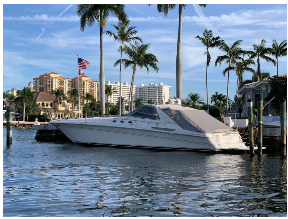
Port side profile