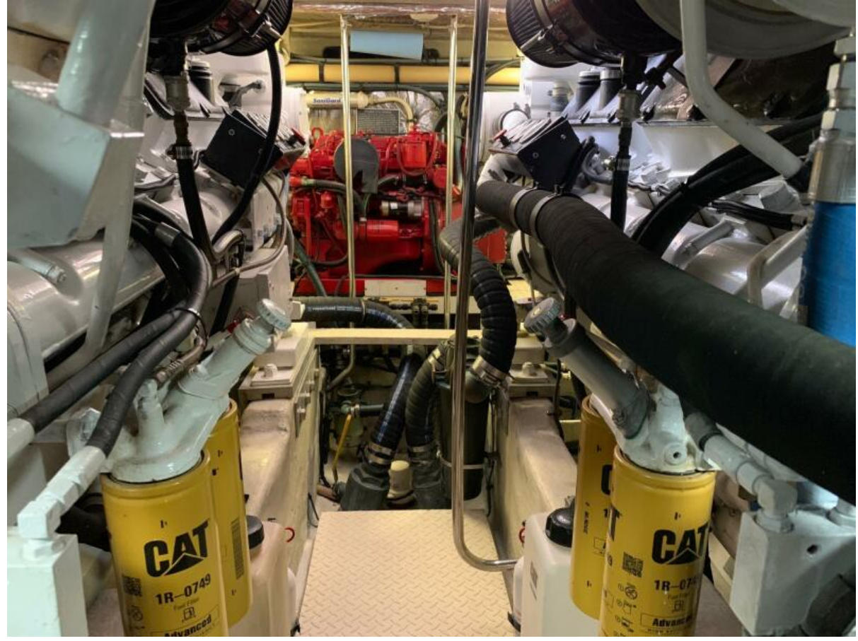
Engine Room CAT 3412's