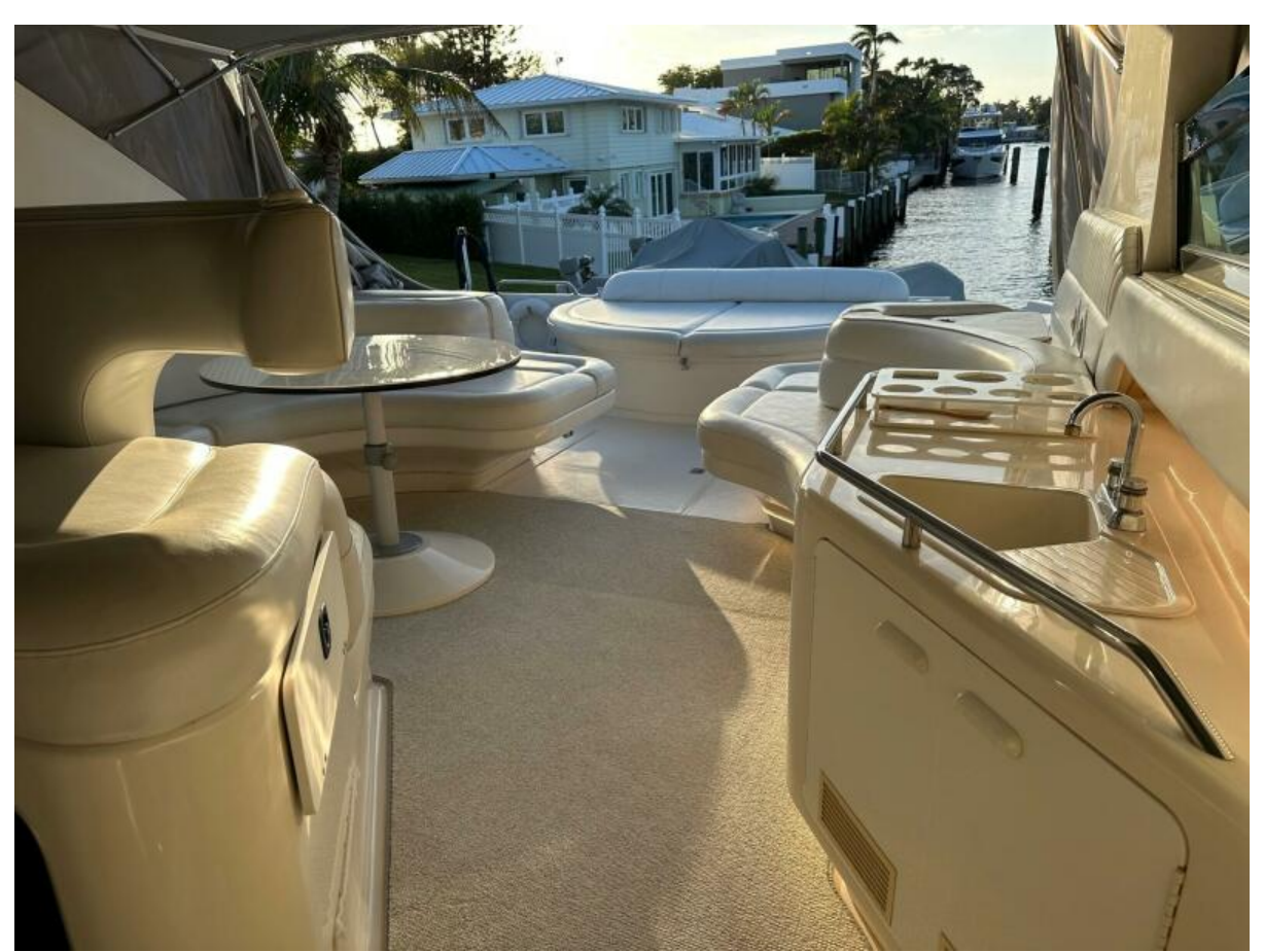
Looking Aft To Cockpit Deck