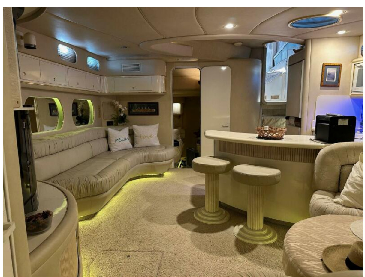
Salon Looking Aft To Guest SR And Stairs Up To Helm Deck