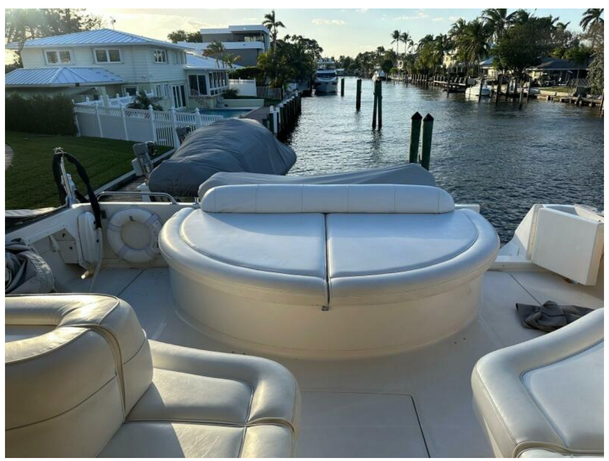
Cockpit Area Sunpad And Transom Door To Swim Platform