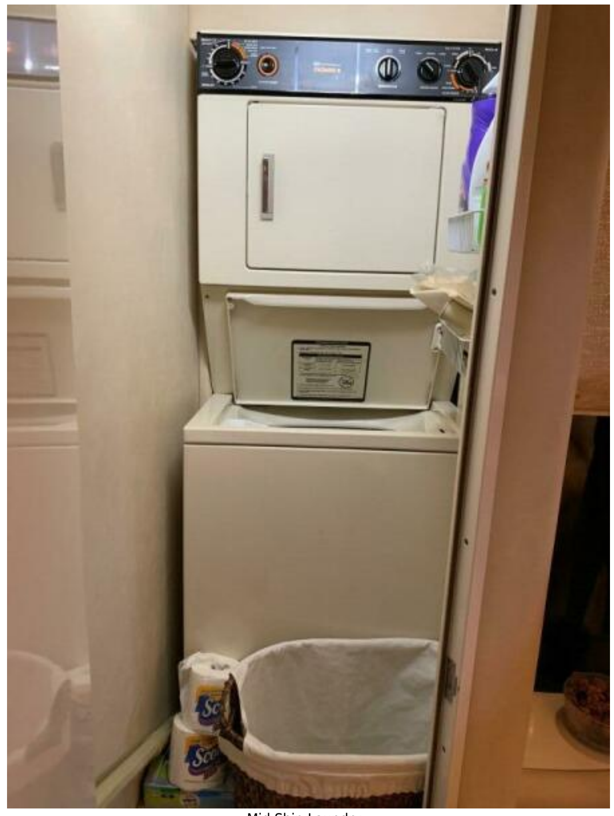
Mid Ship Laundry