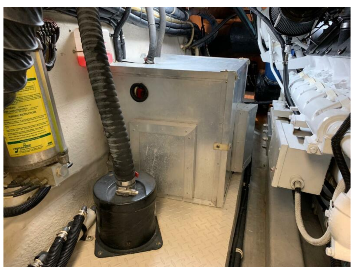
2nd Gen Set Engine Room