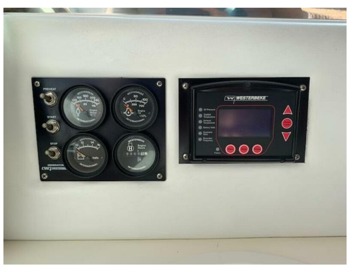
2nd Gen Control Panel