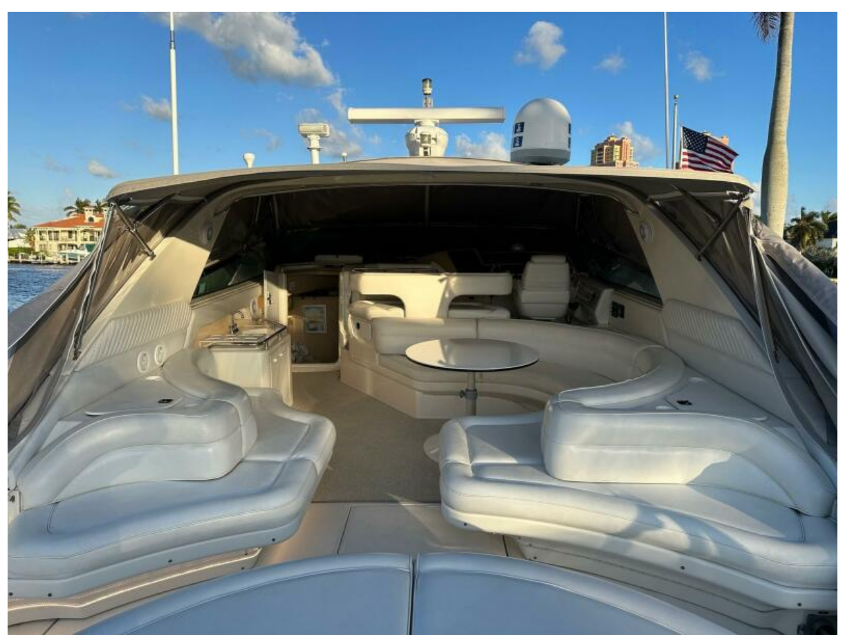
Cockpit Deck Looking Fwd To Helm Area