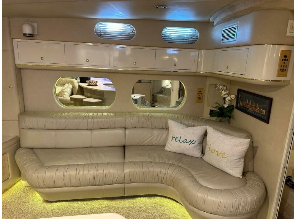
Salon Couch To Starboard