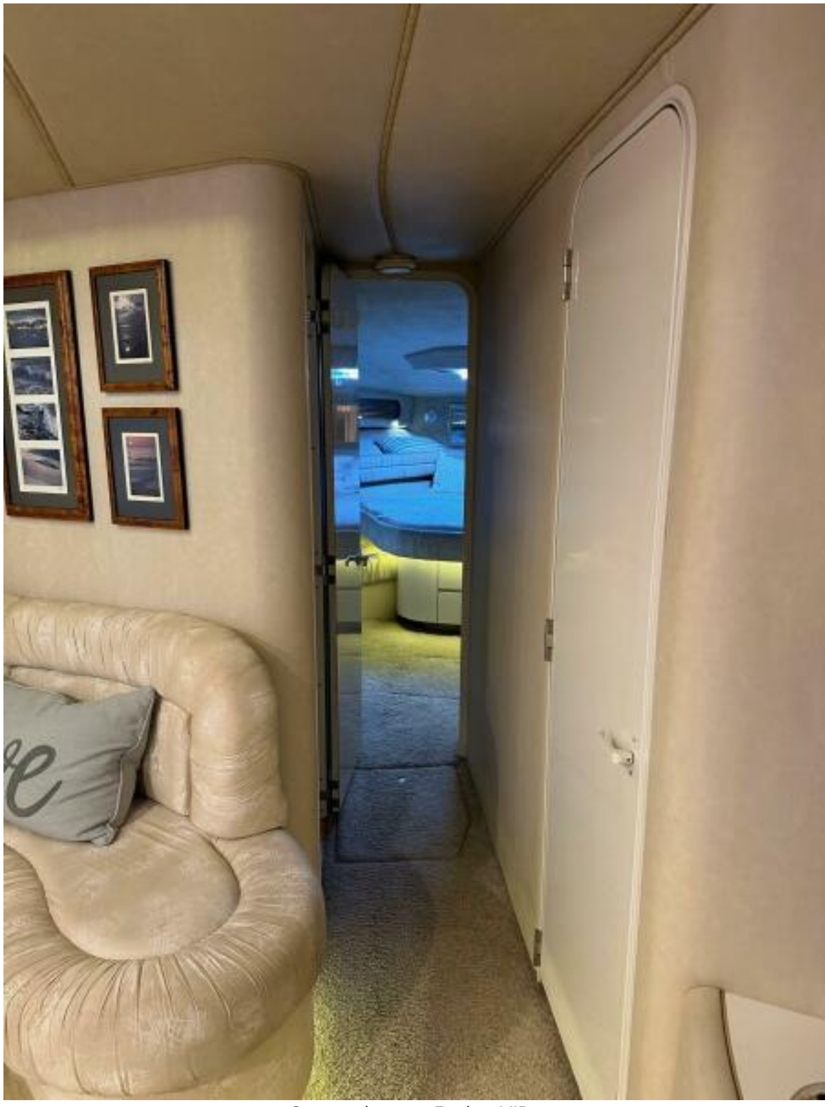
Companionway Fwd to VIP