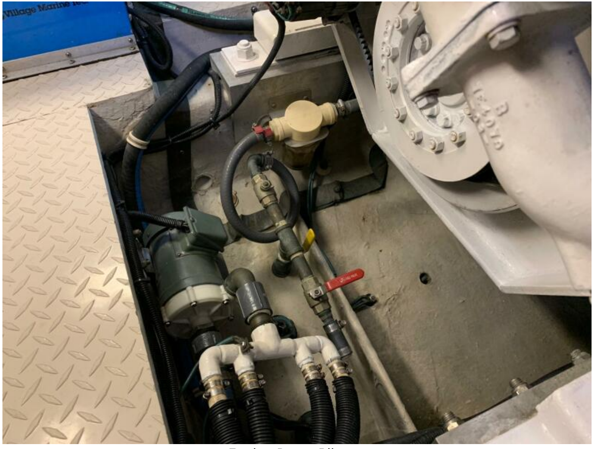
Engine Room Bilges