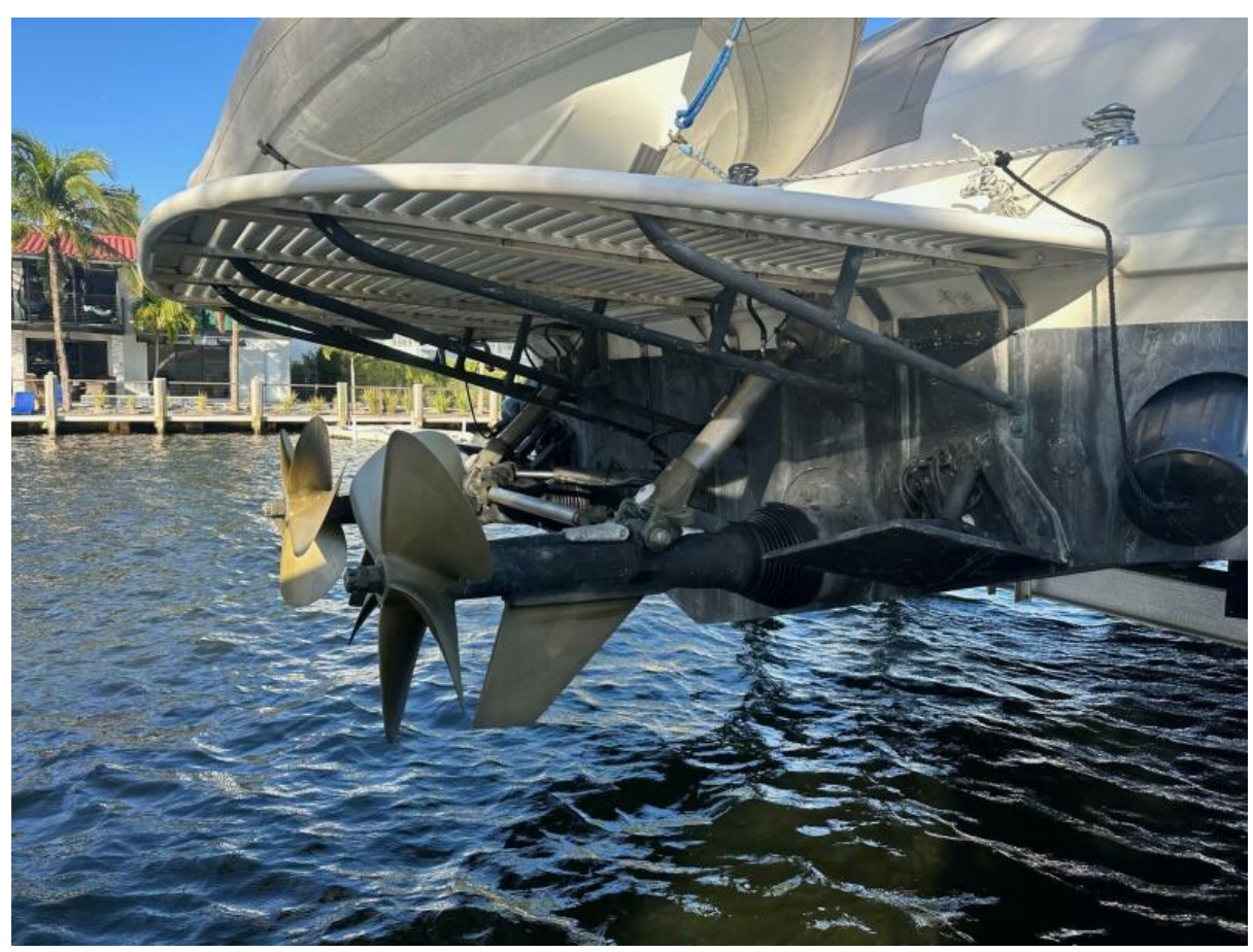
Arneson Surface Drives