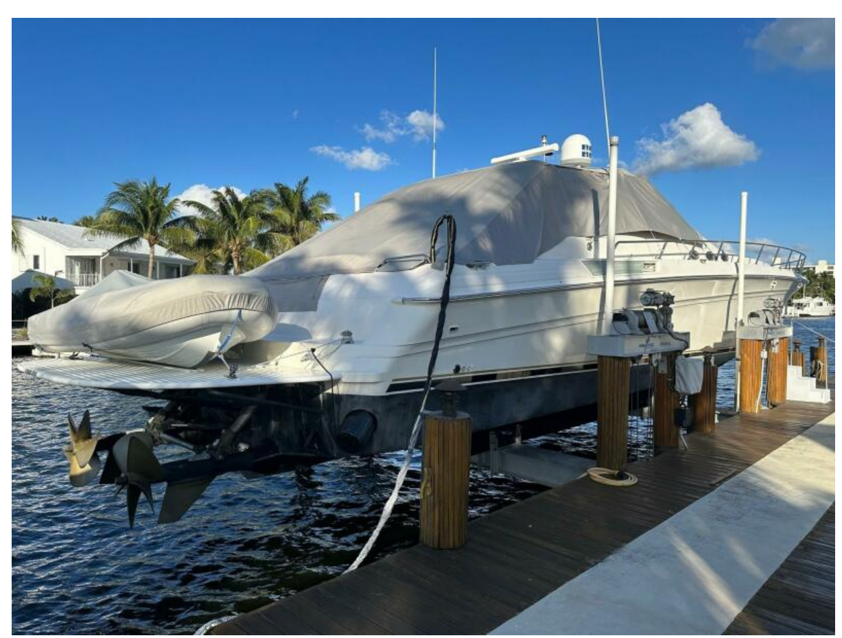
Stbd Side On Lift