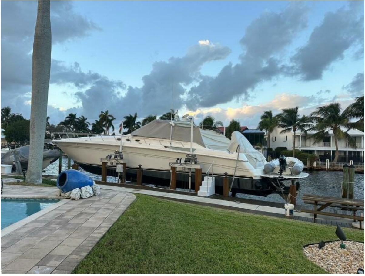
Port Side On Lift