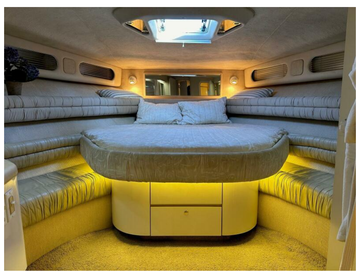
Master Stateroom Forward