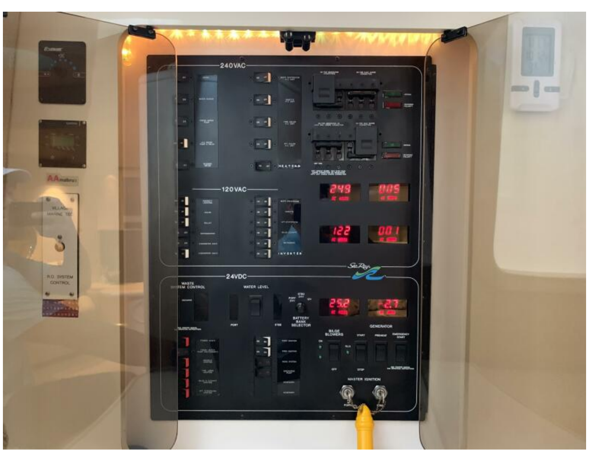
Breaker Panel at Entry to Below