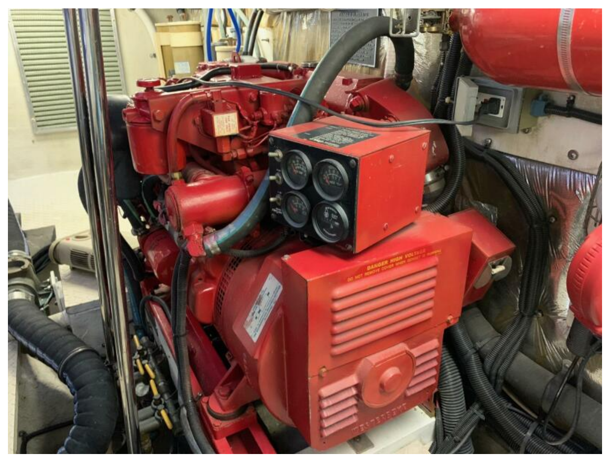
Main Gen Set Engine Room