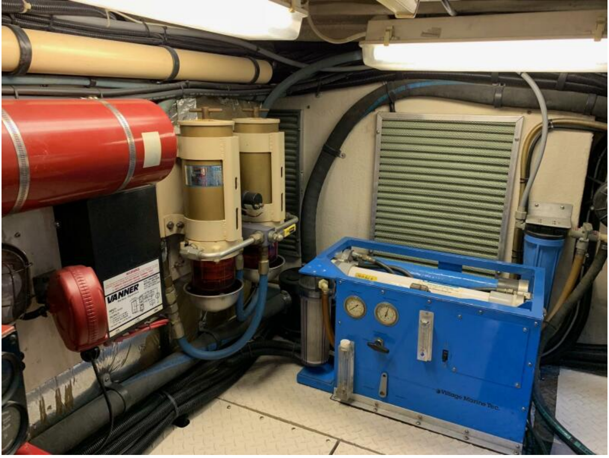
Engine Room Water Maker, Halon System, Racor