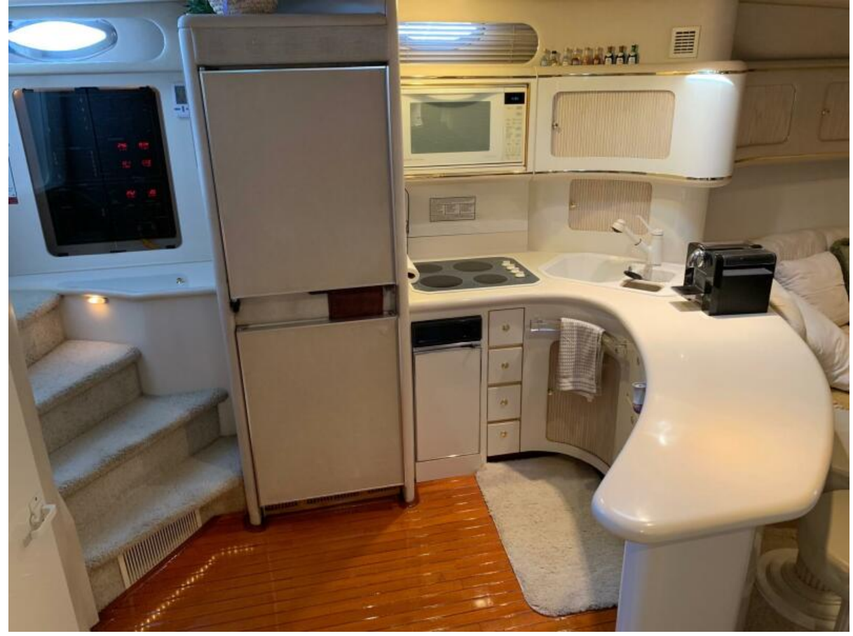
Down to Galley