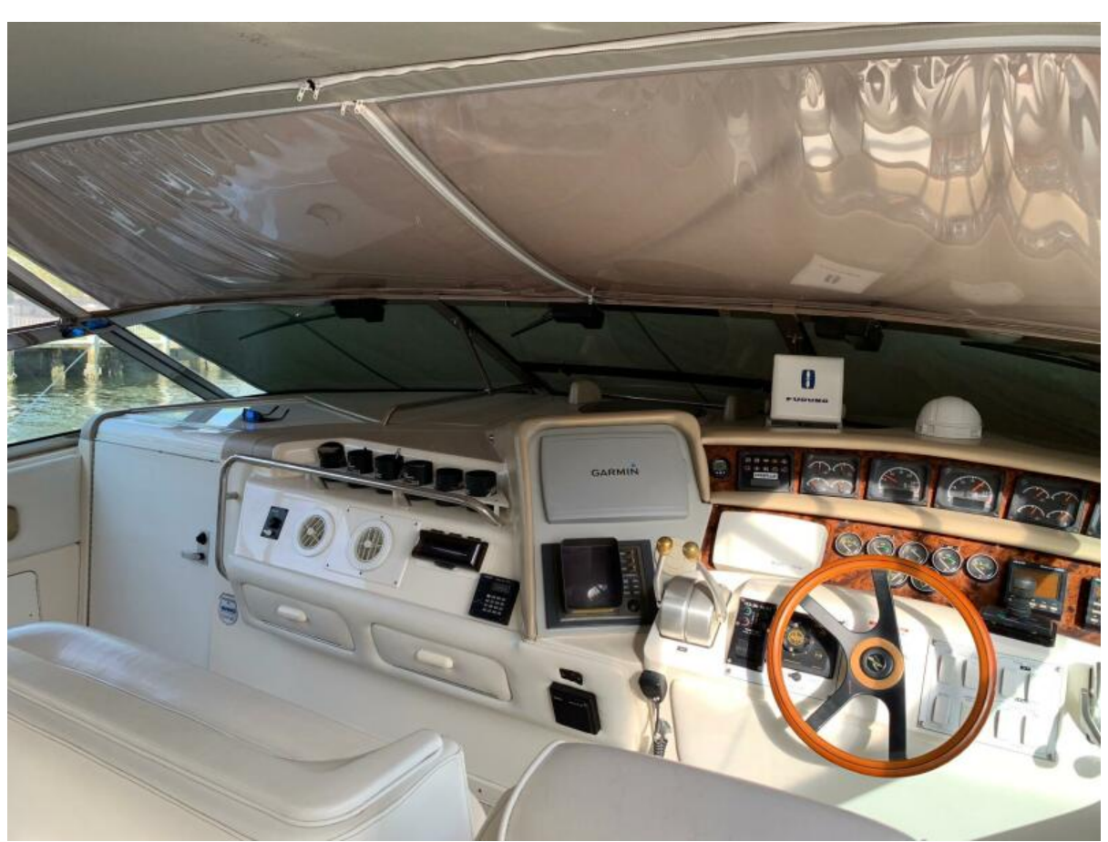
Helm and entry way to below