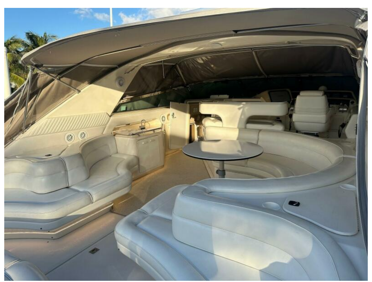
Cockpit Deck View Port