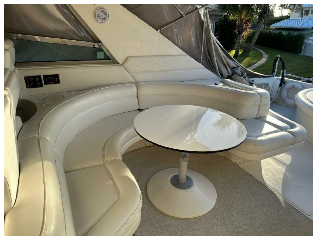
Cockpit Deck Seating Behind Helm