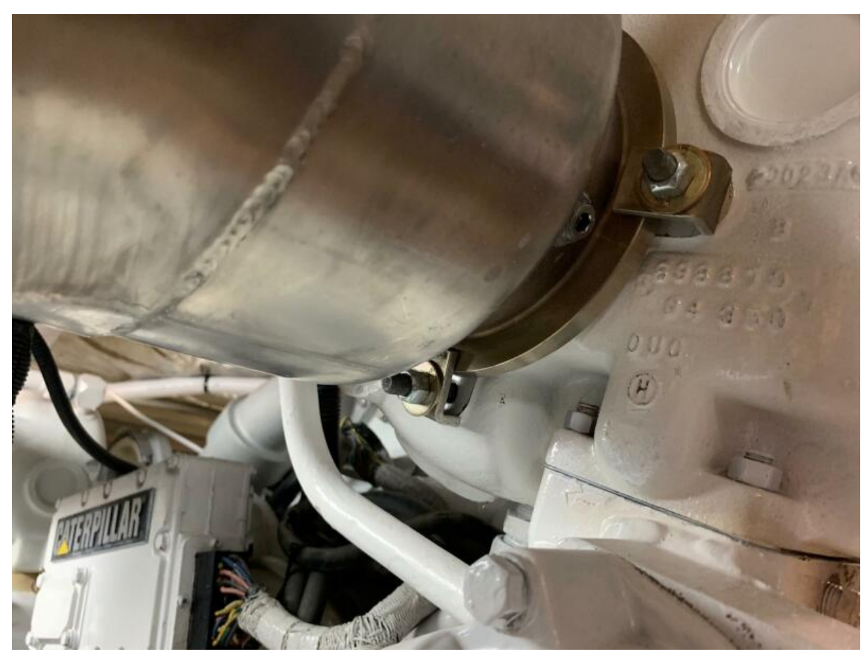
Engine Room Exhaust