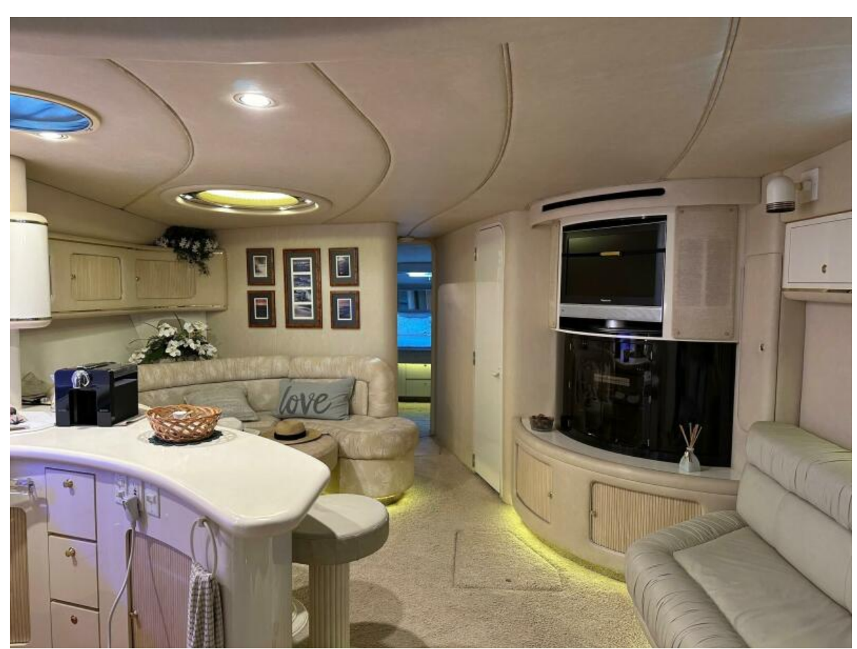
Salon Looking Fwd