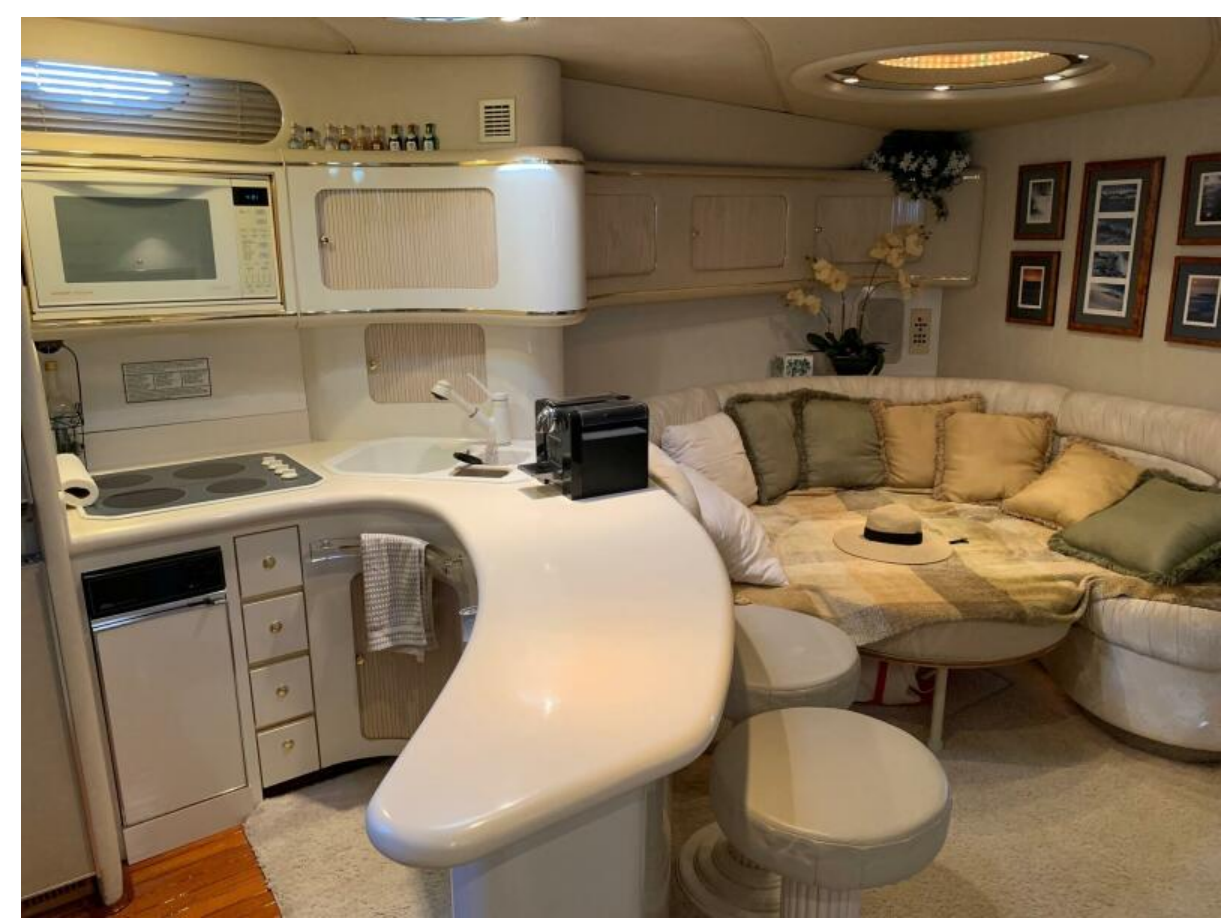
Galley and port side salon