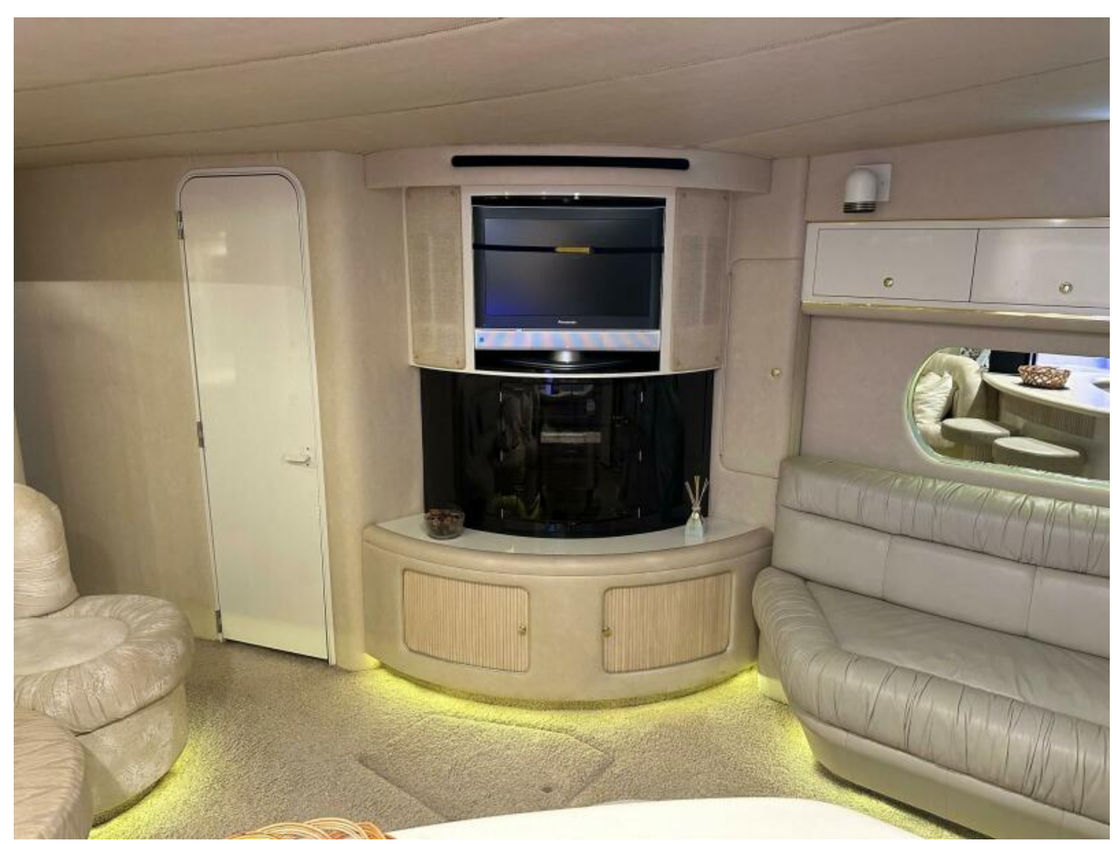
Salon Entertainment Center