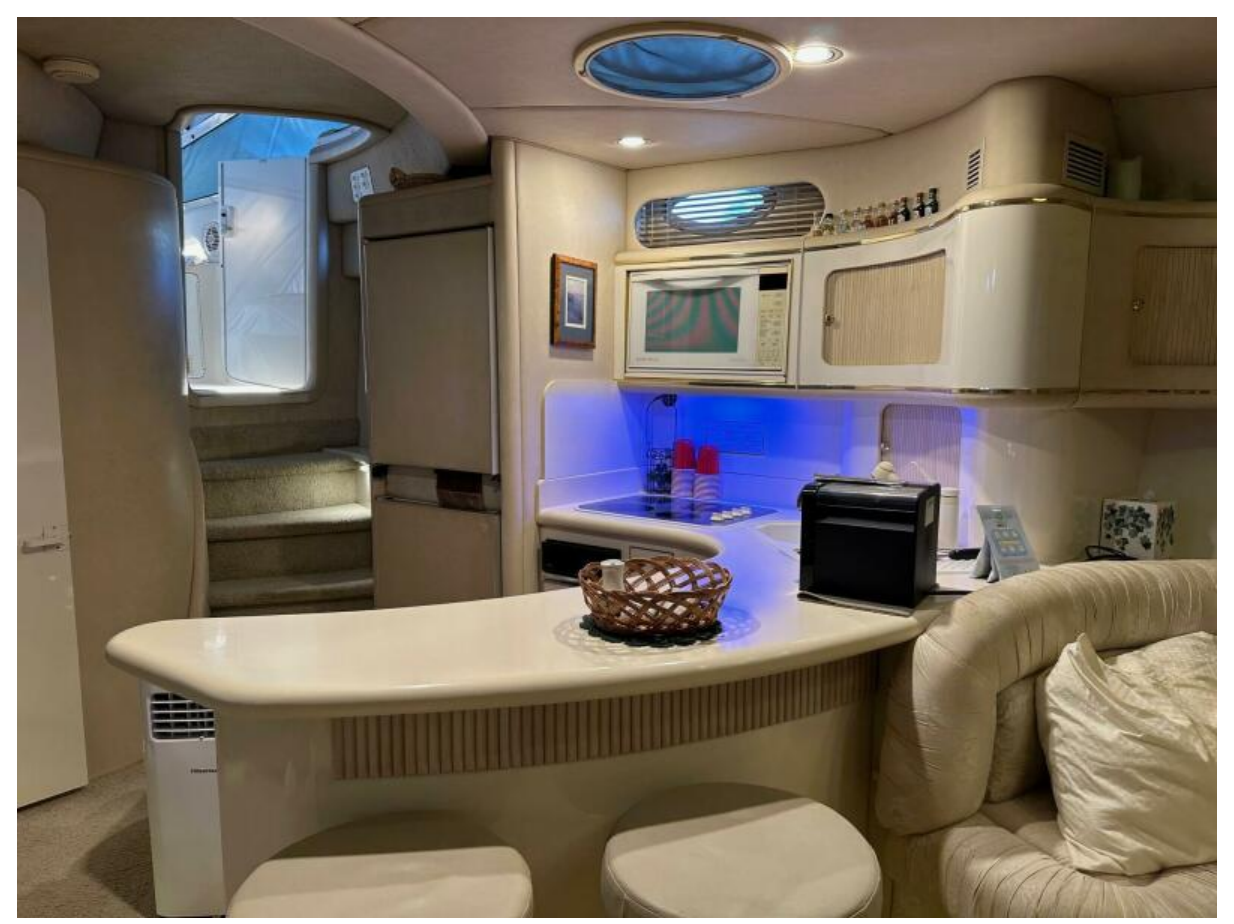
Galley Looking Aft To Stairs Up To Cockpit Deck