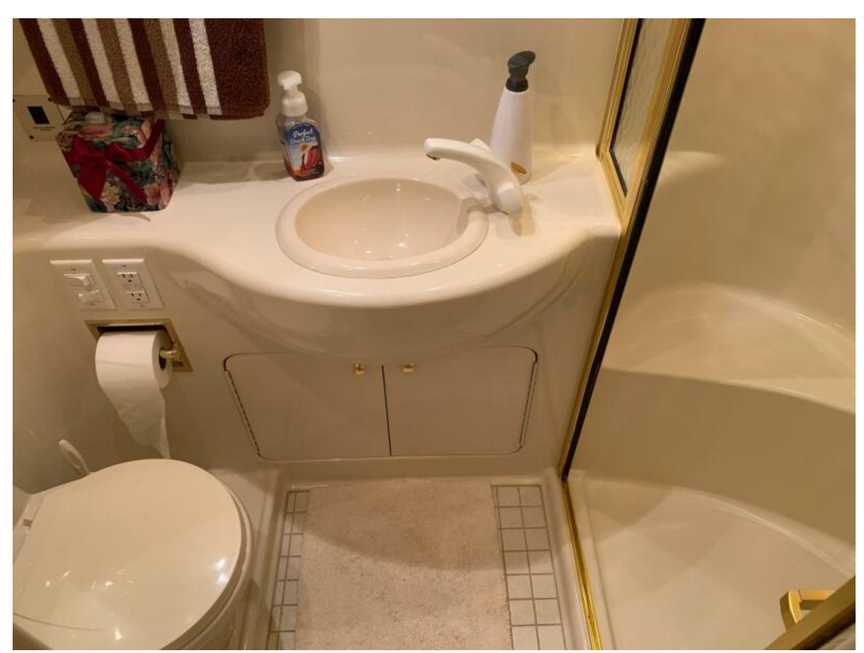
VIP Head Aft