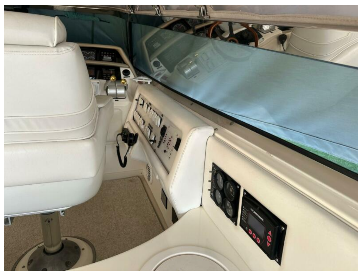
Helm Area Control Panel