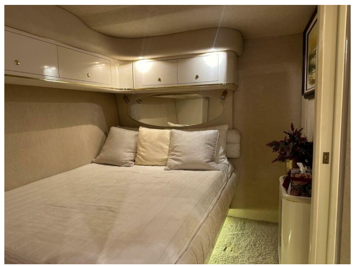
VIP Stateroom Aft