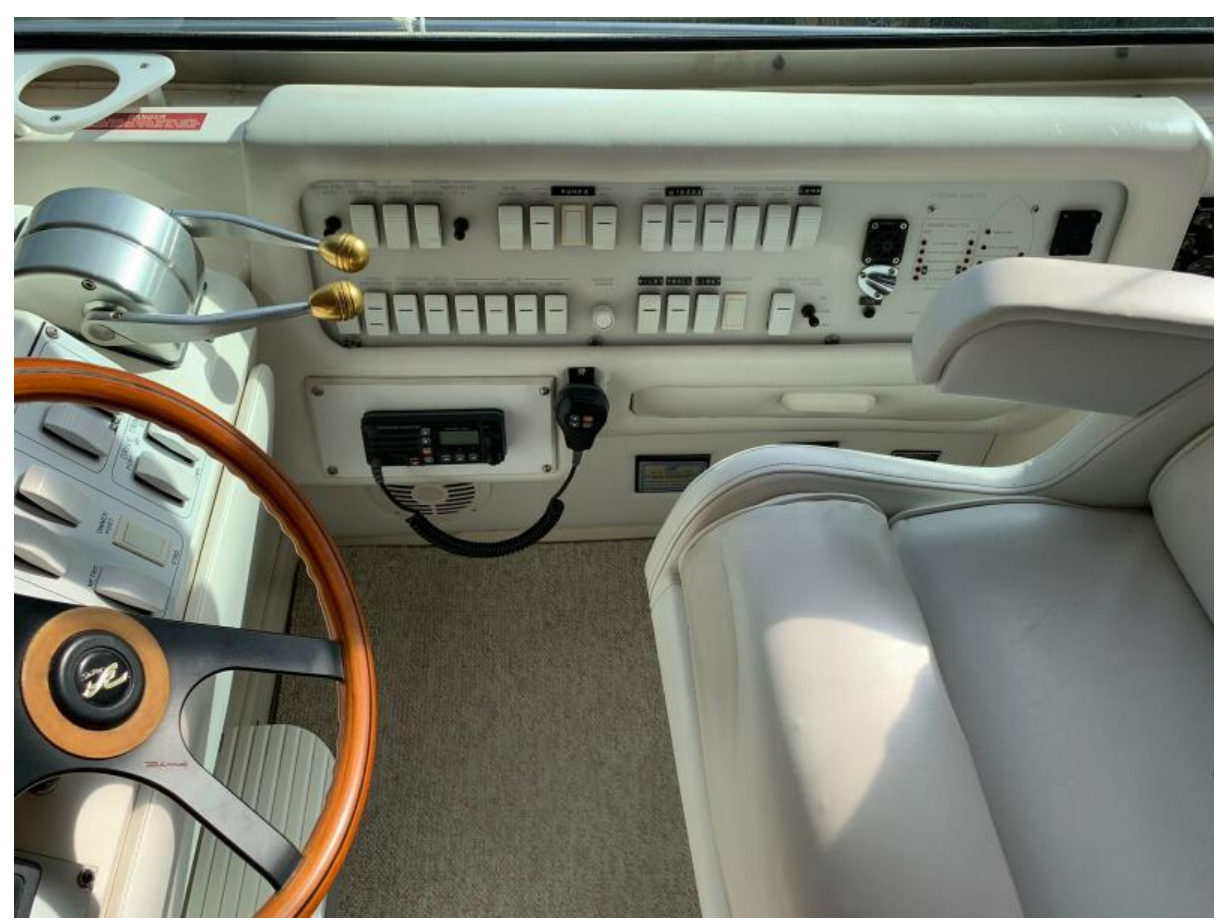
Control Panel starboard of Helm