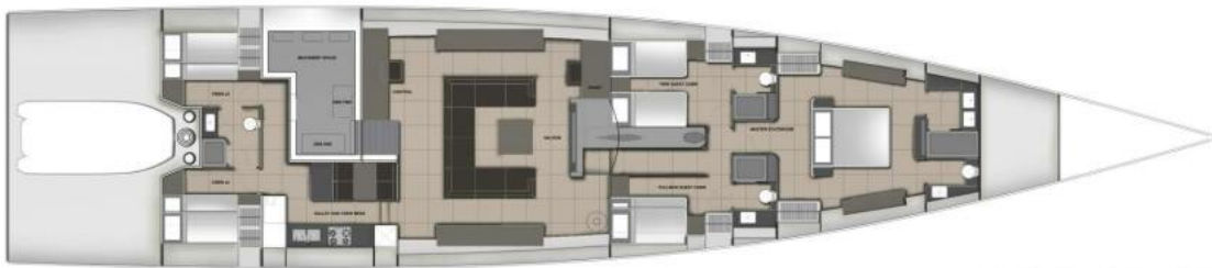
LAYOUT A - GALLEY AFT