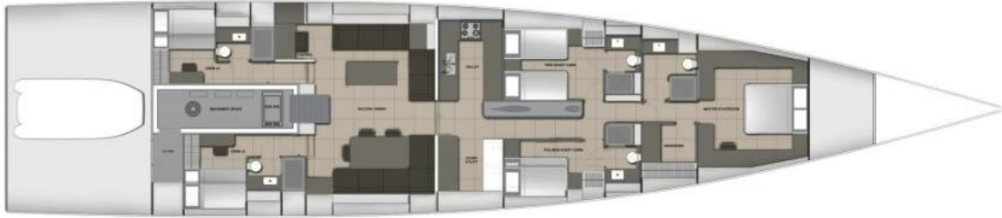
LAYOUT B - GALLEY FWD